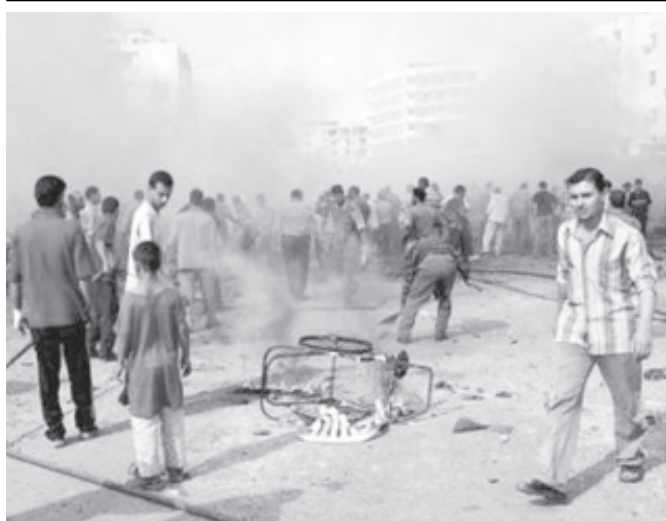
Iraqis gather at the scene of a huge explosion that hit the heart of Baghdad, Iraq, on Thursday, 11 Nov, 2004, sending up plumes of thick black smoke above the central part of the capital. A police officer said the blast was caused by a car bomb that hit Nasser Square on Saadoun Street, a densely populated commercial area with major hotels housing foreigners.