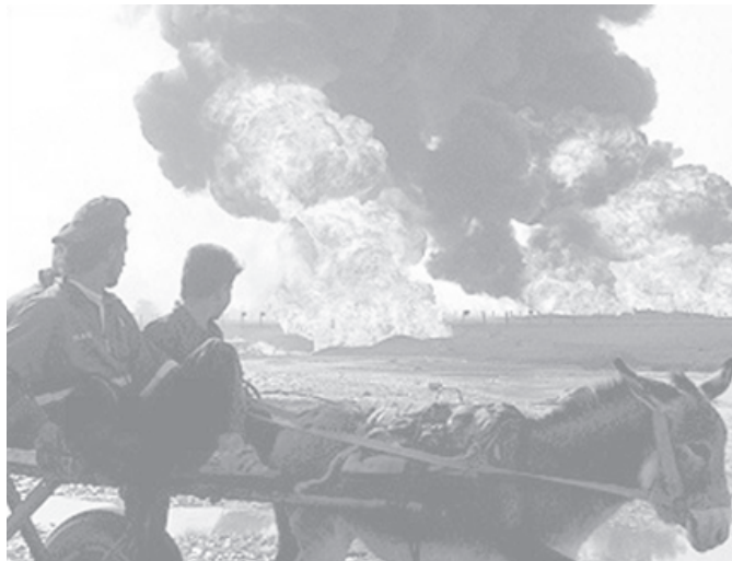
A donkey cart moves along a road as thick black smoke and flames rise from a burning oil pipeline south of the restive city of Fallujah, 50 kms west of Baghdad. —INTERNET

The assault has provoked an upsurge in violence elsewhere, as happened in April during an earlier failed US attempt to subdue Iraq's most rebellious city.—Internet