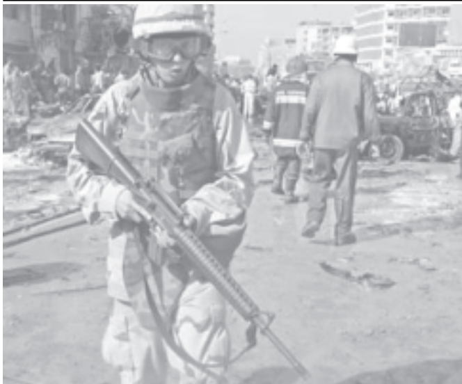
A US soldier arrives at the scene of a car bomb attack in central Baghdad November 11, 2004. US troops hunted guerillas in the battered Iraqi city of Falluja on Thursday.

The deadly attacks came as the US Marines backed by Iraqi forces were punching into the restive city of Fallujah, 50 kilometres west of Baghdad.