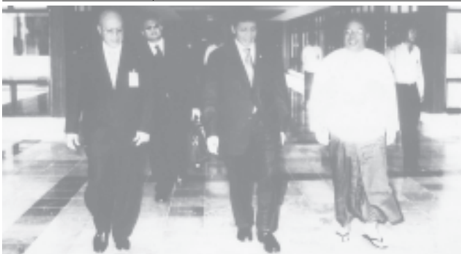
Indonesian Foreign Minister Dr Hassan Wirajuda being bidden farewell at the airport. (News on page 16)

YANGON, 12 Nov— Old students of Government Technical Institute in Kalaw will pay respects to their teachers for the 15th time at Wizitayon Monastery on 68th Street between 32nd and 33rd streets in Mandalay on December 12 (Sunday). Interested persons may contact U Thein Win (01-539877), U Aung Soe (01-534152), U Tun Aung (02-63036), and U Moe Tun (02-33818). — MNA