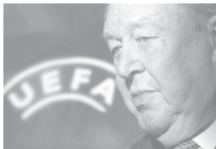
UEFA president Lennart Johansson.

The captain signed his previous deal in July last year and helped Chelsea to second place in the Premier League and a semi-final slot in the Champions League. "I have been here since I was 14 and I would love to stay at Chelsea for the rest of my career and hopefully I'll do that because I love playing for the club," he told the club's official web site. — MNA/Reuters