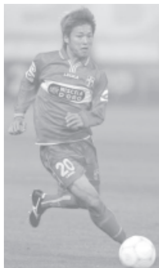
Messina's Japanese player Atsushi Yanagisawa controls the ball during their Serie A match against Palermo at the San Filippo Stadium in Messina on 11 Nov, 2004.