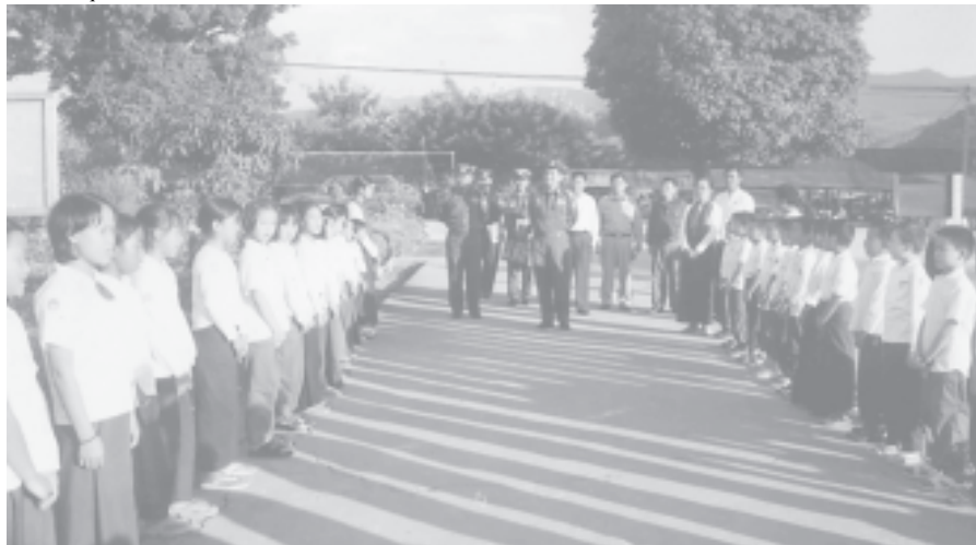
Minister Col Thein Nyunt inspects Mongla Basic Education High School. — MNA