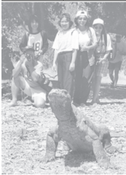
Tourists watch a Komodo Dragon at the Komodo National Park, Indonesia. The legendary monster lizard is proving an unlikely ally in Indonesia's efforts to revive a tourism industry shattered by the October 2002 Bali bombing.

The ACIA report was funded by Arctic nations the United States, Canada, Russia, Iceland, Norway, Sweden, Denmark and Finland and is the biggest survey to date of the Arctic climate, by 250 scientists. —MNA/Reuters