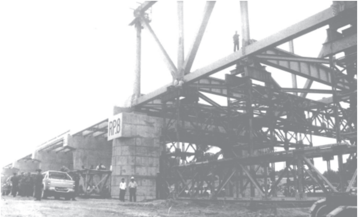
Construction site of approach bridge of Ayeyawady Bridge (Yadanabon) on Sagaing bank.— MNA