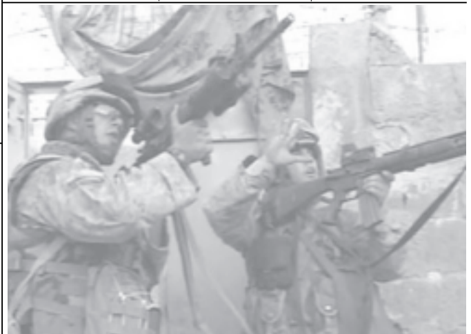
A video grab image shows US soldiers on the streets of Fallujah in Iraq, during fighting as US and Iraqi troops battled through much of Fallujah, on 10 Nov 2004.

He will also go to South Africa for the meeting of the Council of the Socialist International (SI) due for November 15-16 as guest of SI. —MNA/Xinhua