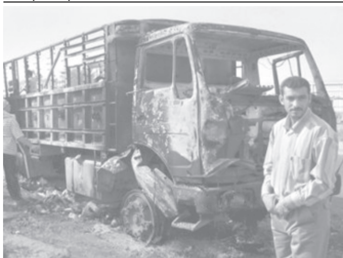
Iraqis gather around a burned truck following air strikes in Tikrit, Iraq, on 10 Nov, 2004.