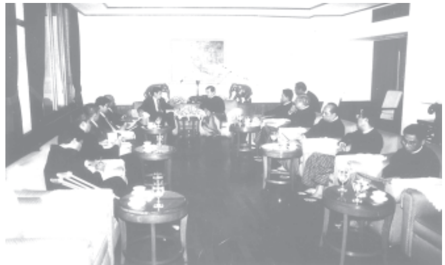
Minister U Nyan Win receives his Indonesian counterpart Dr Hassan Wirajuda and party. — MNA

Next, Minister U Nyan Win hosted a dinner in honour of the visiting Indonesian Foreign Minister and party at Dusit Inya Lake Hotel. On 11th November afternoon, the visiting Indonesian Foreign