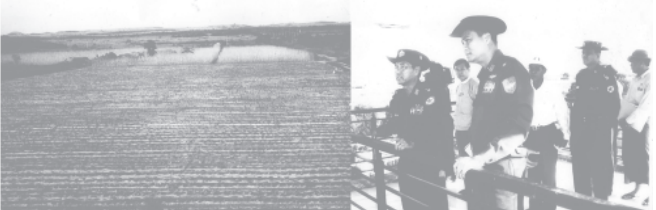
Commander Maj-Gen Myint Swe inspects vegetable plantations of Special Zone-2 in Nyaunhnapin Village, Hmawby Township, Yangon North District.

YANGON, 12 Nov—Chairman of Yangon Division Peace and Development Council Commander of Yangon Command Maj-Gen Myint Swe this afternoon inspected arrangements for supply of water for cultivation of summer paddy in Yangon North District.