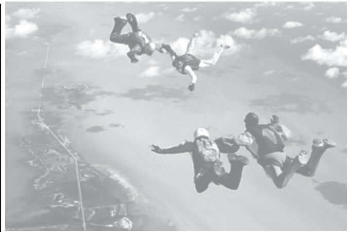
In this photo released by the Florida Keys News Bureau, skydivers free fall some 13,000 feet over the Florida Keys above Marathon, Fla, on 11 Nov, 2004, during the opening day of the Sebastian/Keys Boogie, an annual parachuting event set to continue through Sunday at the Florida Keys Marathon Airport. The event is providing skydiving opportunities for those experienced and those wishing to learn the sport.