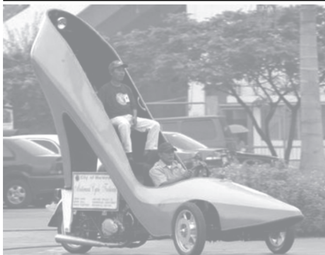
A Filipino man makes a turn while testing a 1,000cc Japanese motorcycle made into a giant ladies shoe at a busy street of Marikina city, east of Manila, on 11 Nov, 2004.