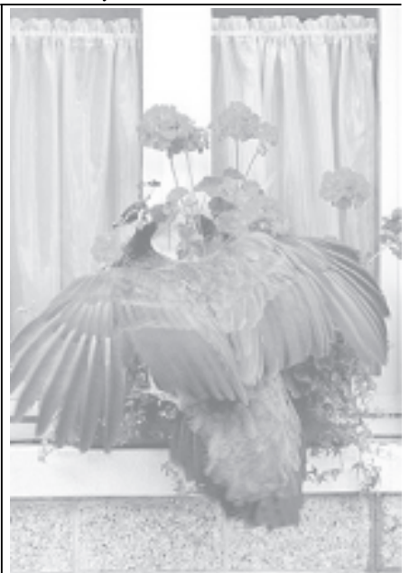
Francoise, one of the United Nations' few female peacocks, sits at an apartment window in Geneva. After more than three months on the run, Francoise finally succumbed to a Spanish street sweeper in Geneva who imitated the cry of a male peacock to perfection.