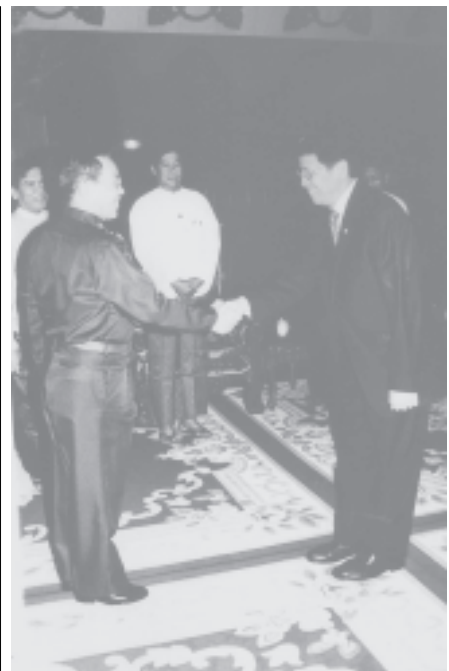
Prime Minister Lt-Gen Soe Win greets Indonesian Minister for Foreign Affairs Dr Hassan Wirajuda. (News on page 1)