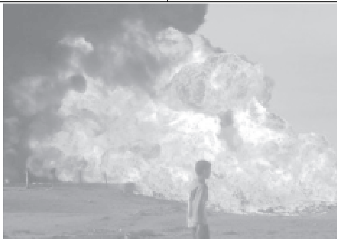
An Iraqi boy walks near a burning oil pipeline on the outskirts of Fallujah, Iraq, Wednesday, 10 Nov, 2004. Guerilla set off the fire using rocket-propelled grenades Tuesday night.