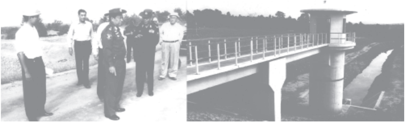
Lt-Gen Ye Myint inspects Kyauktaga Dam Project.