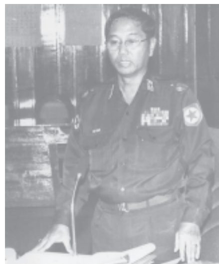
Commander Maj-Gen Myint Swe gives an account of matters for observing Independence Day.