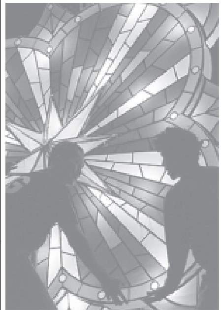
Christmas at the corner... : Filipino workers set up colourful giant star-shaped lanterns in downtown Manila in preparation for the Christmas season. —INTERNET

A smaller group of six companies accounting for roughly 35 per cent of Chinese furniture imports will face penalty tariffs ranging from 2.22 per cent to 16.7 per cent. However, the new ruling will not become final until the US International Trade Commission upholds its preliminary ruling that US companies are being harmed by imports of Chinese furniture. MNA/Xinhua