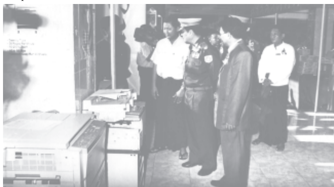
Minister Brig-Gen Tin Naing Thein inspects booths at Myanmar Products Expo-2004. — MNA

The Expo will be kept open daily until 15th November. — MNA