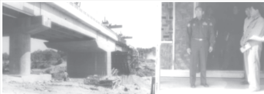
Minister Maj-Gen Saw Tun inspecting the Sinkhan Bridge Project. — CONSTRUCTION