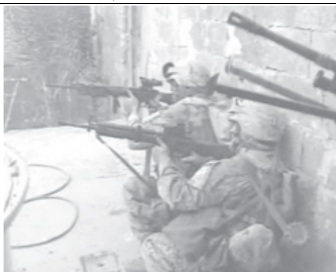
A video image shows US soldiers on the streets of Fallujah in Iraq, during fighting as US and Iraqi troops battled through much of Fallujah, on 10 Nov, 2004.