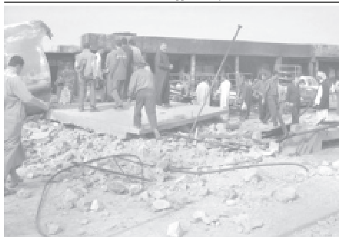
Iraqis survey battle damage following air strikes in Tikrit, Iraq, on Wednesday, 10 Nov, 2004.