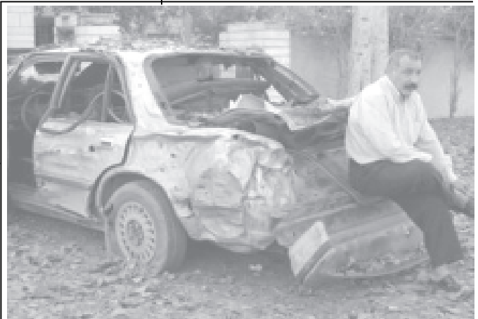
An Iraqi man sits on the wreckage of his damaged car following an overnight car bomb attack, which struck al-Zayoon district in Baghdad, on 11 Nov, 2004. The car bomb went off near an Iraqi security checkpoint killing at least seven people, residents of the area said.

At the weekend, gunmen lined up and shot dead more than a dozen Iraqi police in a carefully planned attack in Haditha, northwest of Baghdad. More than 30 police and guards died in a separate coordinated strikes in the town of Samarra. —MNA/Reuters