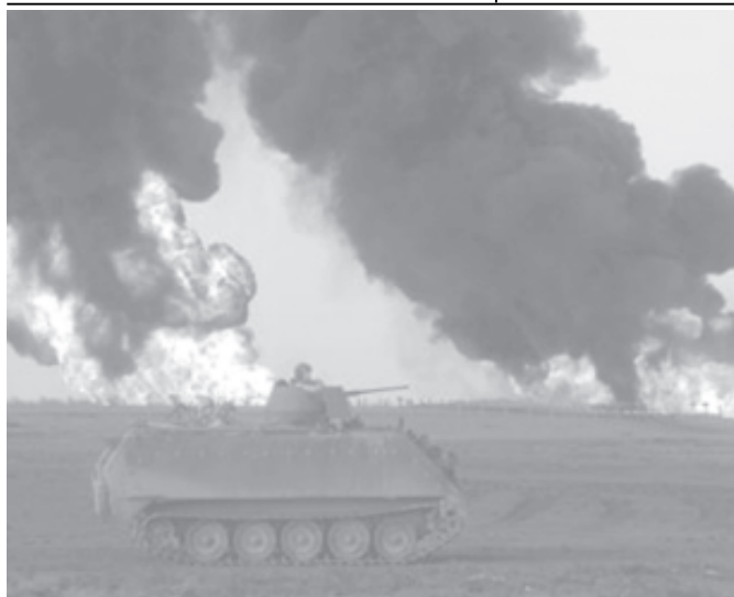
An armoured US military vehicle passes near a burning oil pipeline on the outskirts of Fallujah, Iraq, on 10 Nov, 2004.