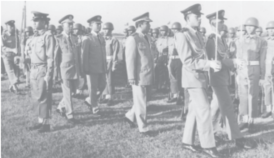
Commander-in-Chief (Air) Lt-Gen Myat Hein inspects companies at the graduation parade of the Pilot Course No 66.

“only when the Tatmadaw is strong will the nation (See page 9)