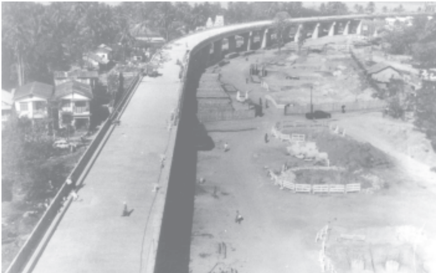
Approach road of the Thanlwin Bridge (Mawlamyine) on Mawlamyine Bank.—MYANMA ALIN

Thanlwin Bridge (Mawlamyine) linking Mawlamyine and Mottama in Mon state is built across Thanlwin River. It is the longest, largest and most valuable rail-cum-road bridge in Myanmar. It is situated on Yangon-Mawlamyine-Myeik-Kawthoung Road.