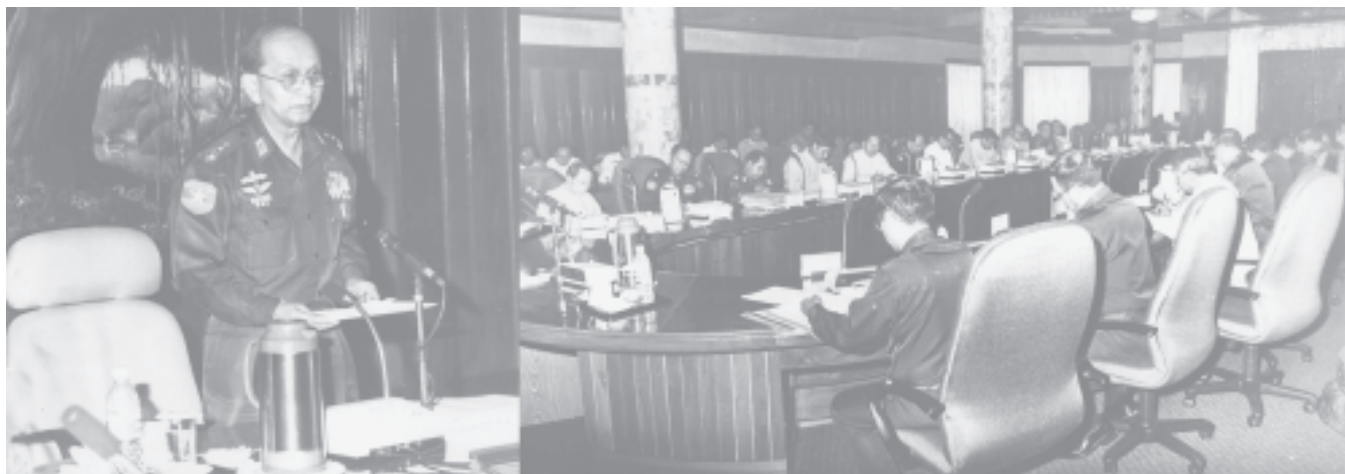
Secretary-1 Lt-Gen Thein Sein addressing Meeting of Central Committee for Observing 57th Anniversary of Independence Day (2005).