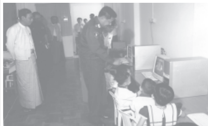
Minister Maj-Gen Sein Htwa views computer room of No 2 Pre-primary School in Hline Township. — SOCIAL WELFARE