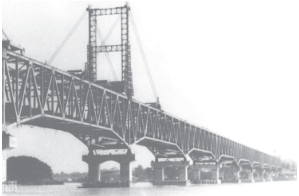
Iron beams installed at Thanlwin Bridge (Mawlamyine) which is constructed by the Public Works of the Ministry of Construction.—MYANMA ALIN

The construction of the bridge started on 18-3-2000. It is 11,575 feet long including 1,624-foot-long approach bridge on Mawlamyine bank and 2,252-foot-long approach bridge on Mottama bank. It can withstand 60-tons loads.