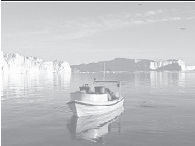
A fishing boat cruises in the Ilulissat fjord, 250 kms north of the Arctic circle. The melting of the Arctic ice cap could in the future open a new northern waterway, creating a shorter route for ships sailing between Europe and Asia and providing a safe haven from piracy and terrorism.

Dingoes roam wild around much of the World Heritage-listed island about 150 kilometres north of Queensland state capital Brisbane, but authorities have tried to keep them away from areas visited by tourists since the 2001 death of Clinton Gage.