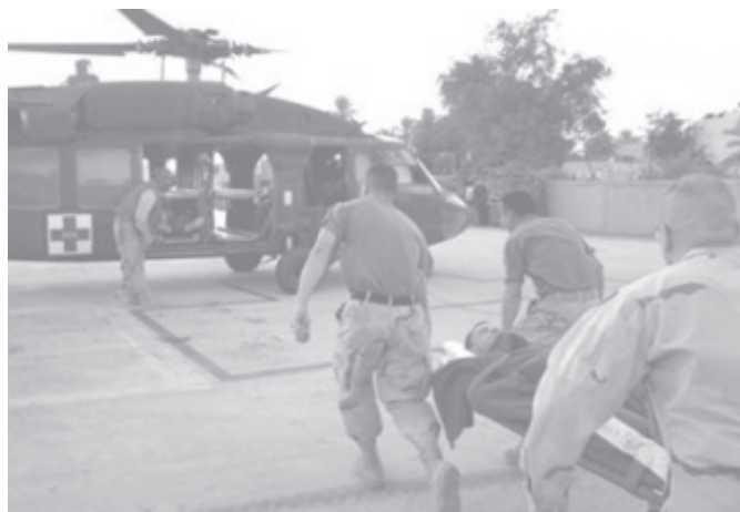
A US Marine wounded in Fallujah is rushed to a helicopter from a military hospital in Baghdad, Iraq, to transfer for evacuation to Landstuhl Regional Medical Centre in Germany, on 10 Nov, 2004