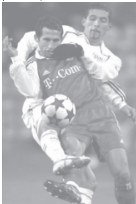
Bayern Munich's Bosnian midfielder Hasan Salihamidzic (front) is tackled by Kevin Kuranyi of VfB Stuttgart during their German Cup, third round match at the Olympic Stadium in Munich, on 10 Nov, 2004.