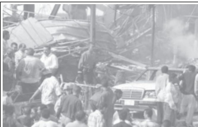
Rescuers comb the wreckage after a bomb attack in central Baghdad on 11 Nov, 2004. A suspected car bomb exploded near a central Baghdad square, setting several vehicles ablaze and causing serious structural damage to buildings.

မြန်မာ့နိုင်ငံတော် သမ္မတမြန်မာနိုင်ငံတော်