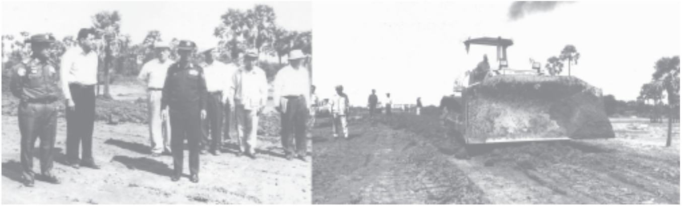
Lt-Gen Ye Myint inspects groundwork for Nyaunggon Dam Project in Meiktila Township.