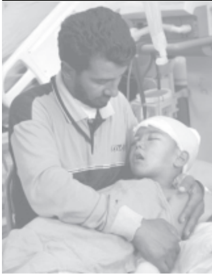
A Fallujah man cradles his four-year-old son recovering from a head wound in the ICU unit of the 31st Combat Support Hospital in Baghdad, Iraq on Wednesday, 10 Nov, 2004. The child was wounded in Fallujah on Monday by shrapnel from an explosion.

The 850-strong British battlegroup was controversially deployed to Camp Dogwood, 15 miles south of Baghdad.—Internet