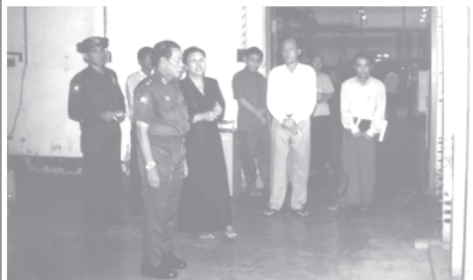
Minister Maj-Gen Saw Lwin inspects production process of fluorescent lamps. INDUSTRY-2