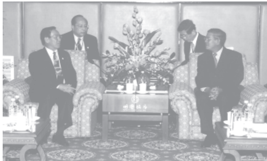
Prime Minister Lt-Gen Soe Win meets Cambodian counterpart Mr Sandech Hun Sen at the Ming Yan Hotel in Nanning.