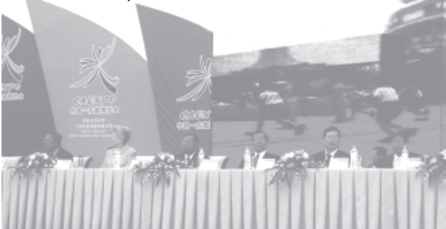
Prime Minister Lt-Gen Soe Win attends the opening of first China-ASEAN Expo-2004.

Promotion of International Trade (CCPIT) of the Ministry of Commerce of PRC, and local government of Guangxi Zhuang Autonomous Region at the Li Yuan Hotel.