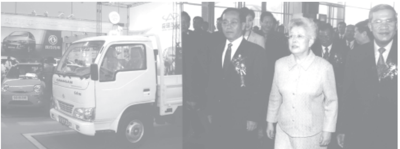
Prime Minister Lt-Gen Soe Win visits booths of first China-ASEAN Expo-2004.

Prime Minister Lt-Gen Soe Win attended the opening ceremony of the first China-ASEAN Expo 2004 at Li Yuan International Convention and Exhibition Centre in Nanning, the People's Republic