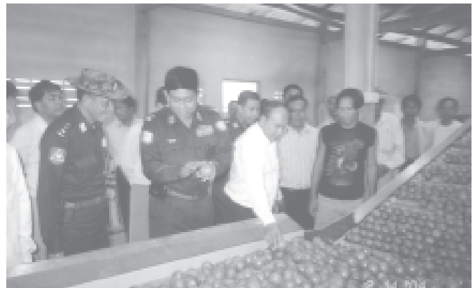
Minister Maj-Gen Htay Oo views classifying of fruits.

YANGON, 5 Nov — Minister for Agriculture and Irrigation Maj-Gen Htay Oo inspected the fruit garden at Wanpon Village-tract in Tachilek Township on 2 November morning. Next, the Minister inspected thriving paddy fields and orange plantations in the region. Next, the Minister inspected classifying of fruits that were to be distributed to markets and instructed the officials concerned to seek better ways and means to penetrate the market.—MNA