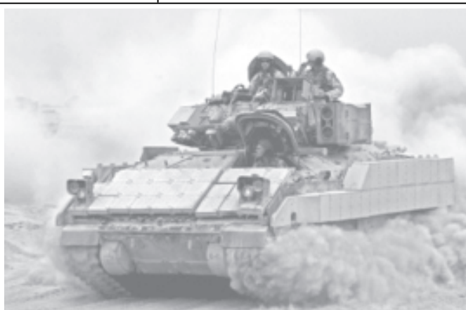
Picture released by the Multi National Force-Iraq (MNF-I) shows a Bradley Fighting Vehicle departing for a mission from Forward Operating Base MacKenzie, at an undisclosed location in Iraq on 4 Nov 2004.—INTERNET