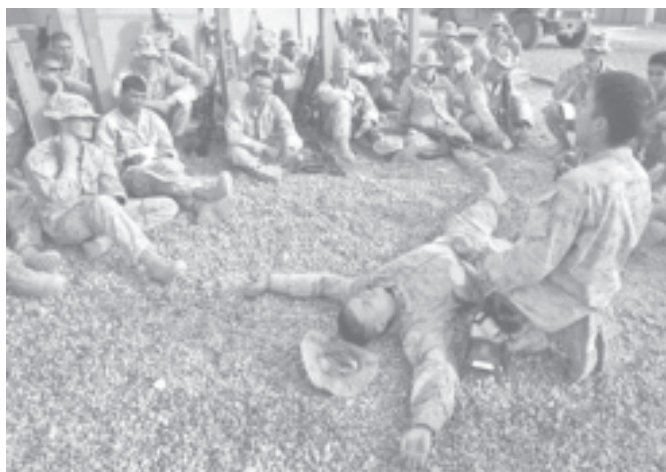
US Marines of the 1st Division get first aid lessons at their base outside Fallujah, Iraq, on 3 Nov, 2004. US forces are preparing for a possible attack on the rebel stronghold of Fallujah. —INTERNET

Observers have noticed that the temporary closure of American Embassy in Syria happened on the occasion of the 25th anniversary of the start of the hostage siege in Iran. — MNA/Xinhua