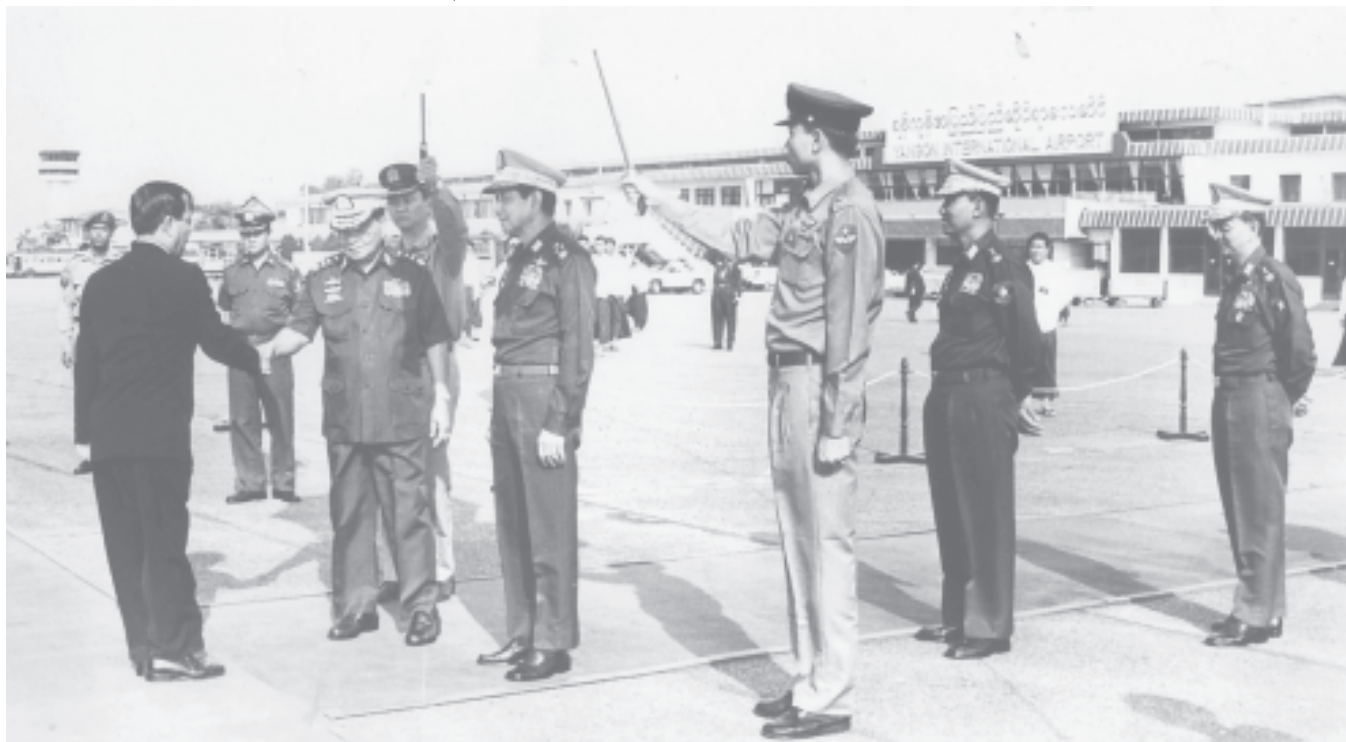
Senior General Than Shwe and party welcome back Prime Minister Lt-Gen Soe Win at Yangon International Airport.—MNA

and Development Council Office Lt-Col Pe Nyein, Director-General at Prime Minister's Office U Soe Tint, Director-General of Protocol Department Thura U Aung Htet, Director-General of Political Department U Thaug Tun, heads of departments and officials.—MNA