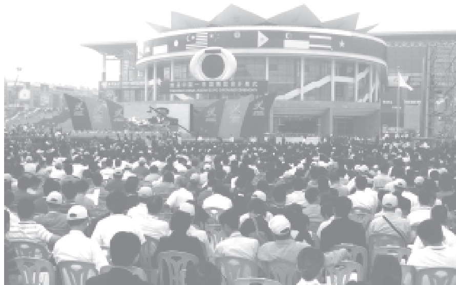
The opening of the first China-ASEAN Expo in progress at Li Yuan International Convention and Exhibition Centre in Nanning, China.

YANGON, 5 Nov—Minister for Industry-1 U Aung Thaung inspected Factory No 1 in North Okkalapa Township this morning. The Minister provided assistance to run Win Thuzar shop in the factory compound. The Minister observed the production process at the factory and gave instructions the quality control of the products and innovative measures. Next, he inspected the production of bicycles, trishaws and trailers at the Bicycle Factory (Yangon), and arrival of machines for extension of the factory.