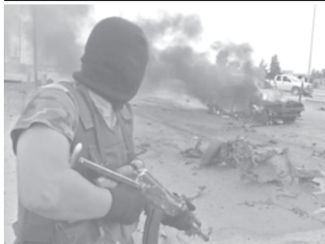
A member of Iraq's rapid reaction force patrols the site of a car bomb attack in Mosul on 2 Nov, 2004. Witnesses said a car bomb exploded as a convoy carrying the commander of Iraq's specially trained rapid reaction force was passing, wounding seven soldiers.