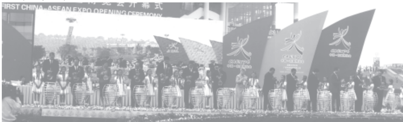
Prime Minister Lt-Gen Soe Win, prime ministers of ASEAN nations, deputy prime ministers and ministers and the Chinese Vice-Premier pour water on the ASEAN Flower Bed.

with Cambodia in regional as well as international affairs. The Four-Country Summit on Ayeyawady-Kyaukphaya-Mekong Economic Cooperation Strategies held in Bagan of Myanmar brought about not only the interests of individual countries but also regional benefits. In addition to Myanmar, Thailand, Cambodia and Laos, Vietnam has now joined the