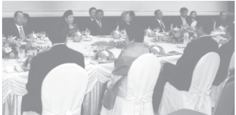
Prime Minister Lt-Gen Soe Win attends the dinner jointly hosted by China Council for the Promotion of International Trade (CCPIT) and Guangxi Zhuang Autonomous Region.

At 6.30 pm, the Myanmar Prime Minister attended the dinner co-hosted by China Council for the