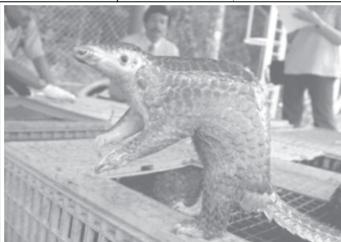
A pangolin is seized by Malay wildlife authorities before it is smuggled out of the country on 4 November. Police in Vietnam have seized 120 protected pangolins, also known as scaly anteaters, which were well known for their rumoured aphrodisiac meat.—INTERNET

He and colleagues from Britain, Armenia, France, Ireland, Namibia, South Africa and the Czech Republic studied the remnant of a supernova that exploded about 1,000 years ago and left a shell of debris.—MNA/Reuters