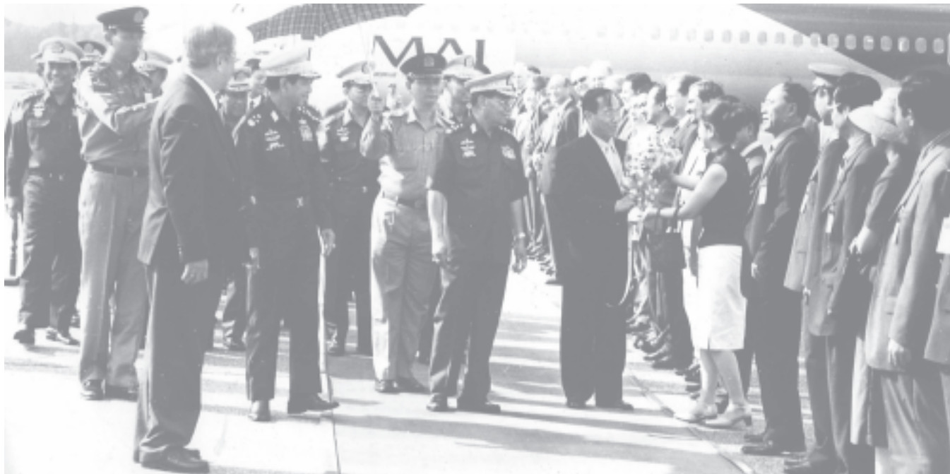
Prime Minister Lt-Gen Soe Win being welcomed home at the airport by Acting Dean of Diplomatic Corps Chinese Ambassador Mr Li Jinjun and diplomats.