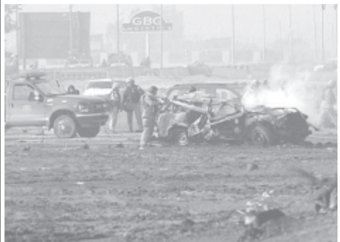
Fire-fighters extinguish a car set ablaze following an attack on the road leading to Baghdad airport on 3 Nov, 2004. At least six foreign workers were reported kidnapped in Iraq as a roadside bombing claimed the life of a US soldier and fires were raging near oil wells after a string of sabotage attacks.