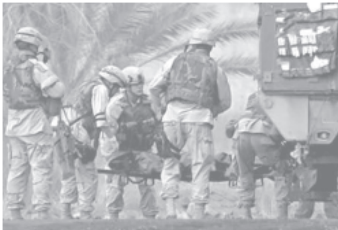
US soldiers lift a covered body into a military medical evacuation vehicle at the scene of a car bomb attack in western Baghdad, on 3 Nov, 2004.