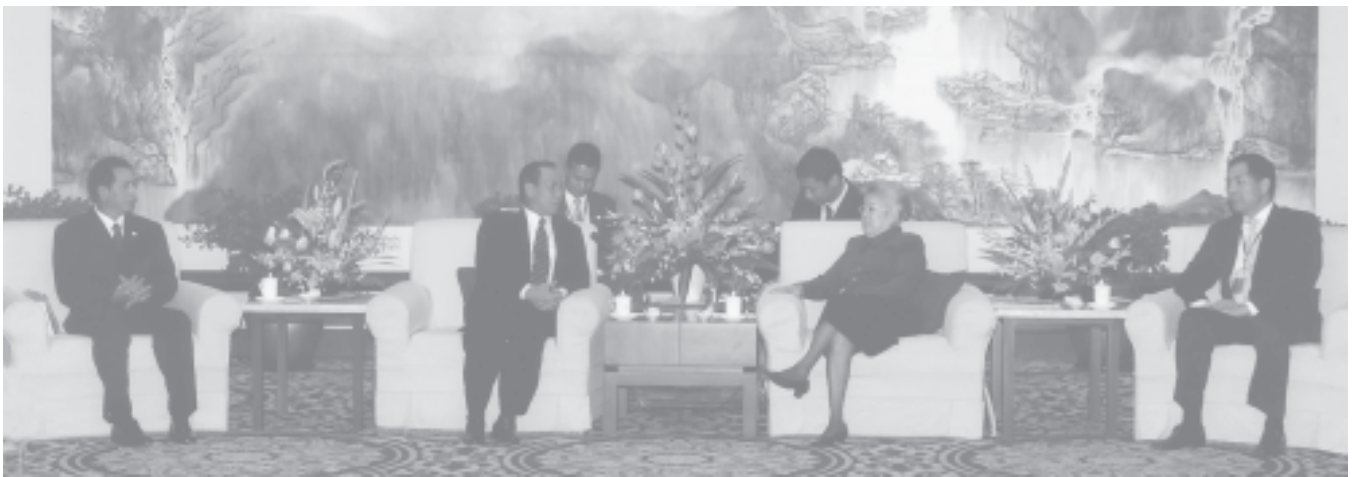
Prime Minister Lt-Gen Soe Win meets Vice-Premier of the State Council of the PRC Madame Wu Yi.