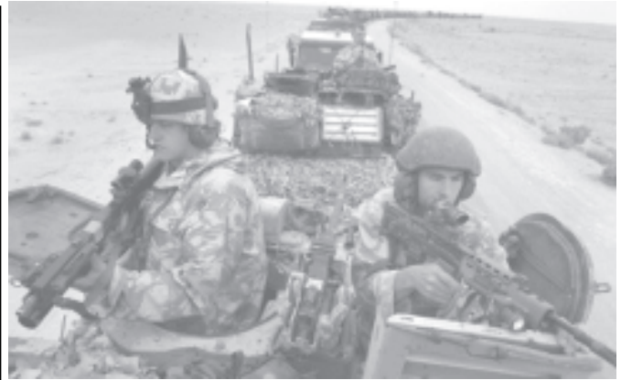
The 1st Queen's Dragoon Guards travel from Basra on 3 Nov 2004, to join the Black Watch battle group.