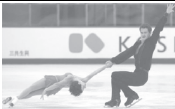
Russia's Maria Petrova and Alexei Tikhonov perform in the pairs short programme of the International Figure Skating Competition in Nagoya, central Japan, on Thursday, 4 Nov, 2004. The Russian pair finished first in the programme. —INTERNET

His seven-month suspension will apply worldwide provided it is endorsed by world ruling body FIFA, which usually requires a minimum six-month suspension for such offences. — MNA/Reuters