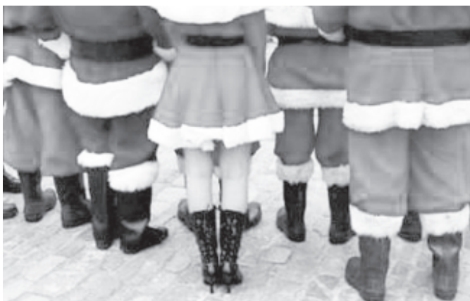
Professional Santa Claus performers attend a training day at the 'Ministry of Fun's Santa School' at Southwark Cathedral in London, on 1 Nov, 2004. The 'Ministry of Fun,' which provides Santa Claus performers for Christmas grottos, hosted the event for 35 Santas on Monday, with the aim of highlighting and turning around what they claim is a decline in demand for their services during the festive period.