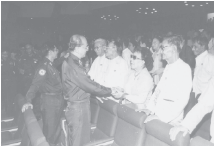
Secretary-1 Lt-Gen Thein Sein greets members of the Panel of Patrons for the 12th Myanmar Traditional Cultural Performing Arts Competitions.