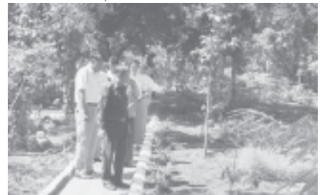
Minister Brig-Gen Thein Aung inspects herbal plantation at the foot of Mt. Popa.