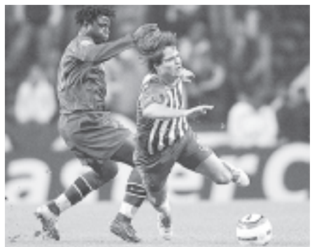
FC Porto's Brazilian Diego Ribas (R) is tackled by Paris St Germain's Modeste M'Bami (L) during their European Champions League clash in Porto.