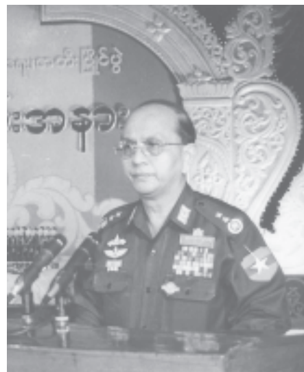
Secretary-1 Lt-Gen Thein Sein delivering a speech to the prize-presentation of the 12th Myanmar Traditional Cultural Performing Arts Competitions.

Significant power of Myanmar culture and fine arts is that they have never been tainted with any foreign culture, whenever they come into contact with it and that Myanmar character and styles, qualifications, power and national might, have been preserved and safeguarded for centuries, are being restored and promoted by the Myanmar Traditional Cultural Performing Arts Competitions at present.