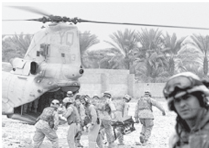
US Marines from 2/5 Marine transport an injured comrade into a Chinook helicopter in Ramadi, 100kms west of Baghdad, on 30 Oct, 2004.