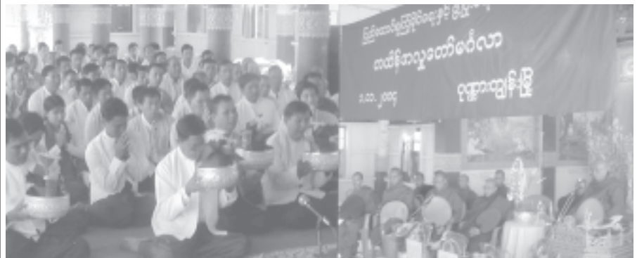
Deputy Minister Brig-Gen Khin Maung offers Kathina robes to members of the Sangha.