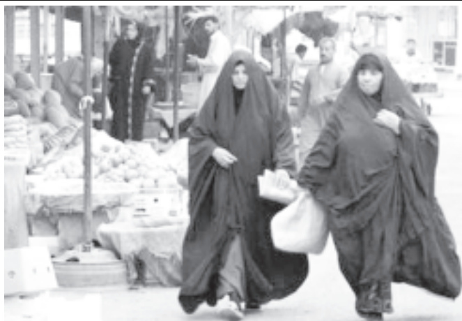
Iraqi women walk from an outdoor market in the restive city of Fallujah on 2 Nov, 2004. US Marines are preparing to attack Ramadi and Fallujah in a drive to pacify Iraq before the Iraqi national assembly polls. It is not clear if the assault will begin before Tuesday's American presidential poll. —INTERNET