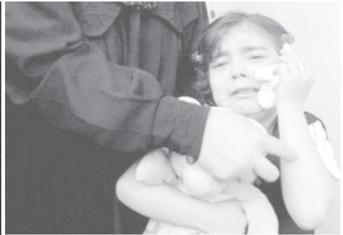
A little girl holds her teddy bear as she wipes away her tears standing next to her mother at the gate of their home, metres away from a car bomb in the centre of Baghdad on 3 Nov, 2004.