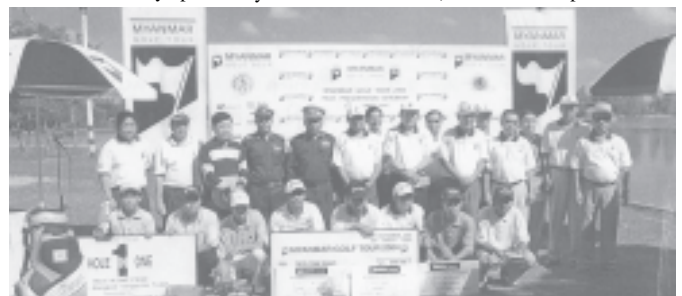
Prize-winning golfers of Monywa Open Golf Championship.

Han Management Event and other companies.