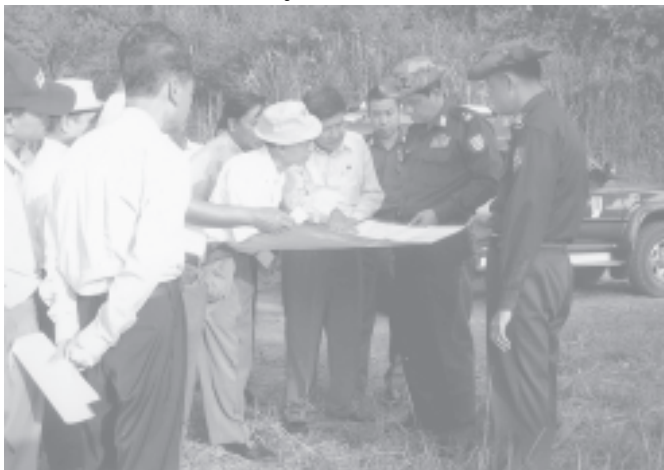
Minister Maj-Gen Htay Oo views the map for extended cultivation of crops along Maesai Creek in Tachilek Township. — AGRICULTURE AND IRRIGATION

YANGON, 3 Nov — Minister for Agriculture and Irrigation Maj-Gen Htay Oo observed a thriving lychee farm of Akha national race leader U Azee in Loiltawhkam region, Tachilek Township, eastern Shan State, on October 30.