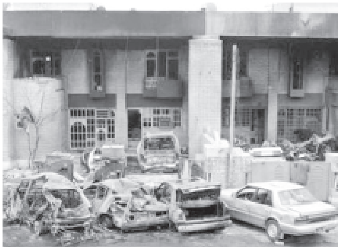
The Arab satellite television news station Al Arabiya's bureau stands damaged a day after a car bomb went off in the parking lot, in Baghdad on 31 Oct, 2004.

Some foreign media have pulled out of Iraq as the danger grows and moving around for stories becomes near-impossible.