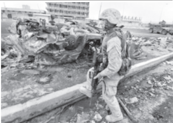
US Marines from the 2nd Battalion, 5th Marine Regiment patrol past unidentified wreckage in Ramadi, Iraq, on 31 Oct, 2004.

"We don't put financial values on our pieces, but these are obviously historically important items," she said.