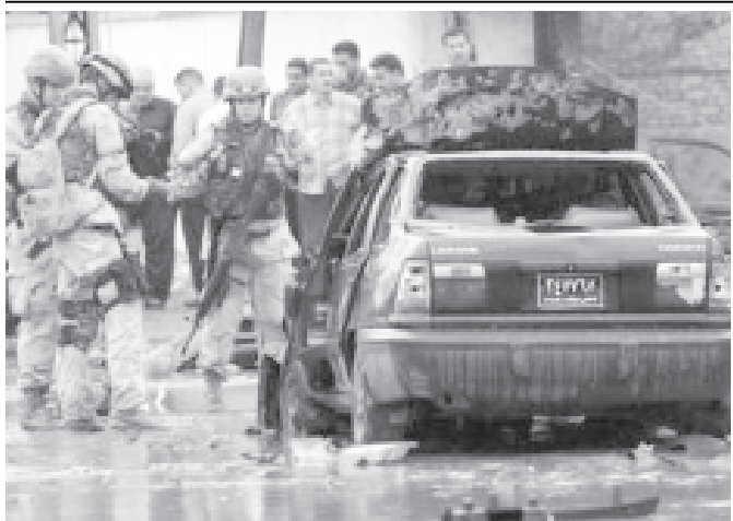
US Army soldiers survey a damaged car at the scene of a car bomb explosion outside a ministry in the capital Baghdad, on 2 Nov, 2004.