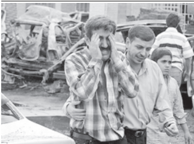
A man cries as he is led away past destroyed vehicles after viewing the place where his brother was killed in a car bomb that detonated across the road outside the villa housing the Dubai-based Al-Arabiya satellite television station on 30 Oct, 2004, in the Mansour District of Baghdad.

A known militant group, the Ansar al-Sunnah Army, is believed to be behind the assassination.