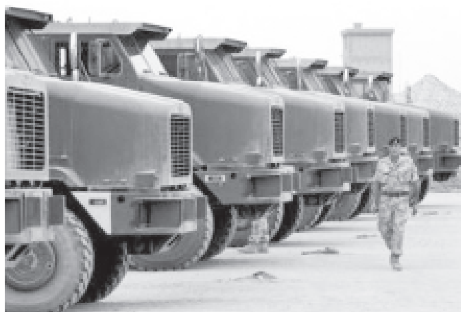
A British soldier passes a line of trucks at the Shaibah Base in Basra, southern Iraq, which will form part of a re-supply convoy on 30 Oct 2004.