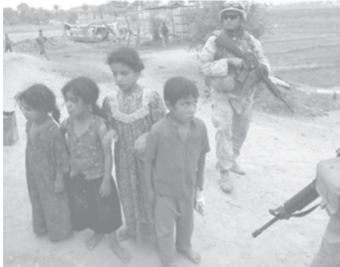
Iraqi children look on as US Marines of the 1st Division search the area outside Fallujah, Iraq Sunday, Oct. 31, 2004.