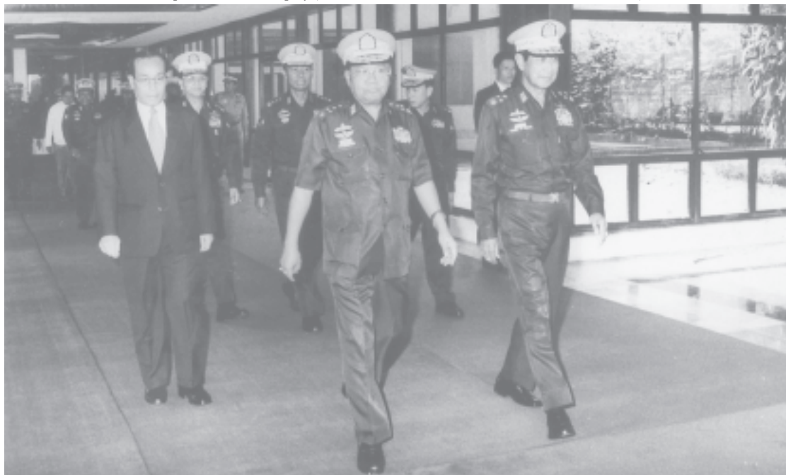
Senior General Than Shwe and party see off Prime Minister Lt-Gen Soe Win on their departure for PRC.

tary-1 of the State Peace and Development Council Lt-Gen Thein Sein, (See page 8)