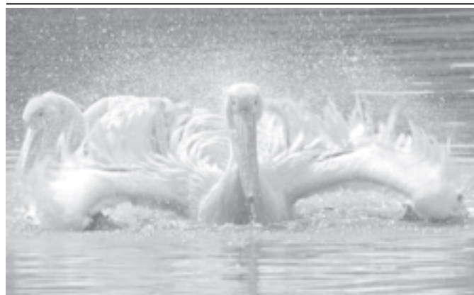
Pelicans swim in a pond in Delhi zoo. The zoo, spread over an area of 214 acres, has more than 2,000 animal and bird species including pelicans from all over the world.