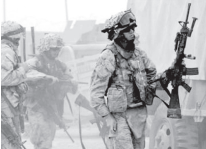
US Marines of the 1st Division prepare for a patrol outside Fallujah, Iraq on 31 Oct, 2004.