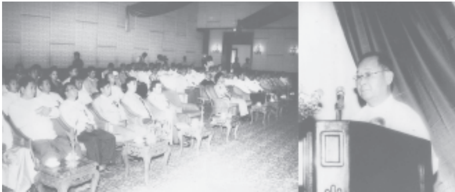
Deputy Minister U Pe Than delivers a speech at the first annual general meeting of Myanmar International Freight Forwarders' Association.

YANGON, 2 Nov— The first annual general meeting of Myanmar International Freight Forwarders' Association (MIFFA) was held at Traders Hotel this morning.