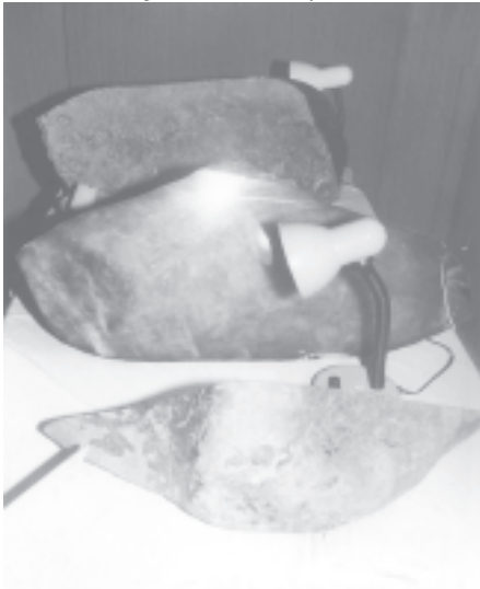
Jade lot of exceptional quality being displayed at Mid-Year Myanmar Gems Emporium.

According to an official of Myanmar Gems Enter-