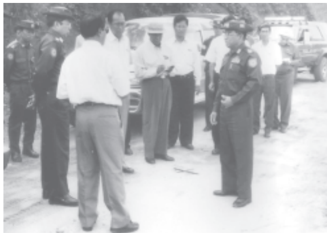
Minister Maj-Gen Saw Tun inspects work for maintenance of Patheingyi-Chaungtha Road.