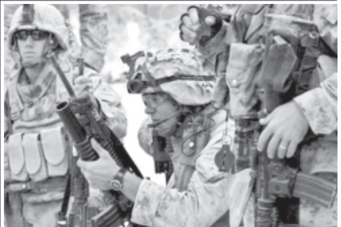
Marines of the 1st Division get a briefing prior to a mission outside Fallujah, Iraq on 30 Oct, 2004. US forces are preparing for a possible attack on the guerilla stronghold of Fallujah.