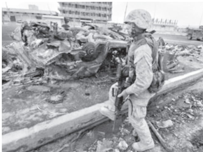
US Marines from the 2nd Battalion, 5th Marine Regiment patrol past unidentified wreckage in Ramadi, Iraq, on 31 Oct, 2004.