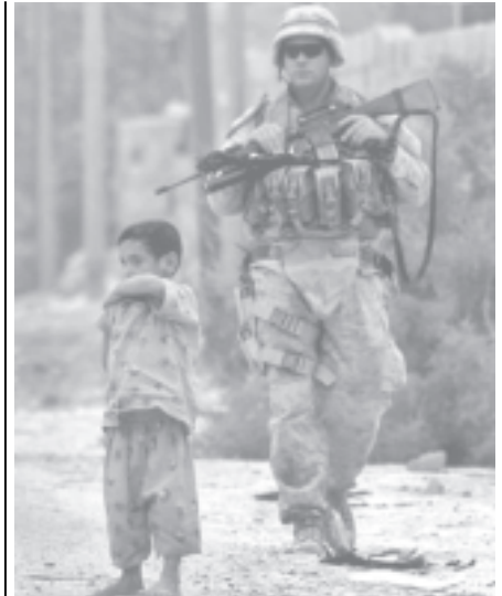
An Iraqi boy looks on as a Marine of the 1st Division joins a foot patrol outside Fallujah, on 30 Oct, 2004. US forces are preparing for a possible attack on the guerilla stronghold of Fallujah.