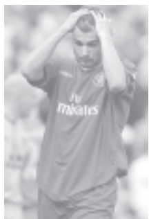
Disgraced Romanian striker Adrian Mutu, who blasted Premiership side Chelsea for their haste in sacking him after testing positive for a banned substance.

The statement added: "...The suggestions in the Press that Mr. Mutu had