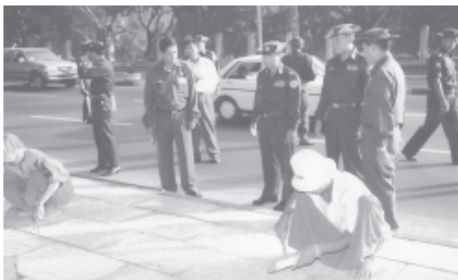
Commander Maj-Gen Myint Swe inspects tasks for upgrading of Yangon City.

During their inspection, Head of Engineering Department (Road and Bridge) U Bo Htay of YCDC and officials presented reports to the commander and the mayor on measures being taken for upgrading of the platforms to a 10-foot-wide ones between Ahlon