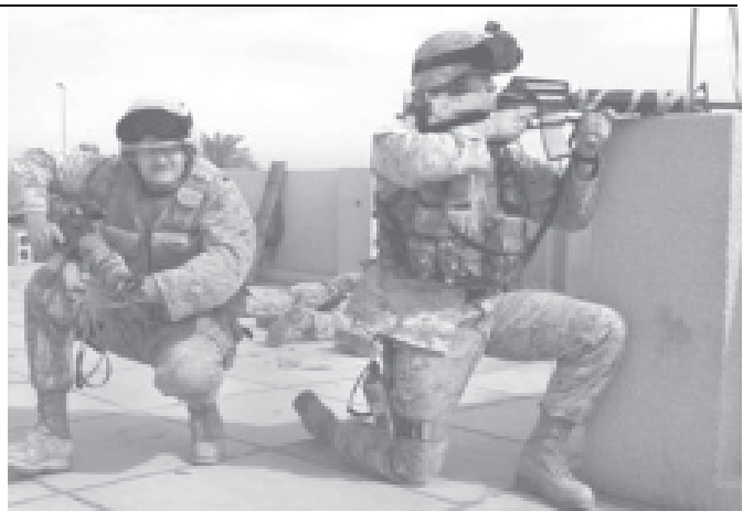
US Marines from the 2nd Battalion, 5th Marine Regiment patrol in Ramadi, Iraq, Sunday, Oct. 31, 2004. One Marine was killed and three others injured by a roadside bomb Sunday in Ramadi, and hospital officials said seven more people were killed and 11 injured in clashes between insurgents and U.S. forces.