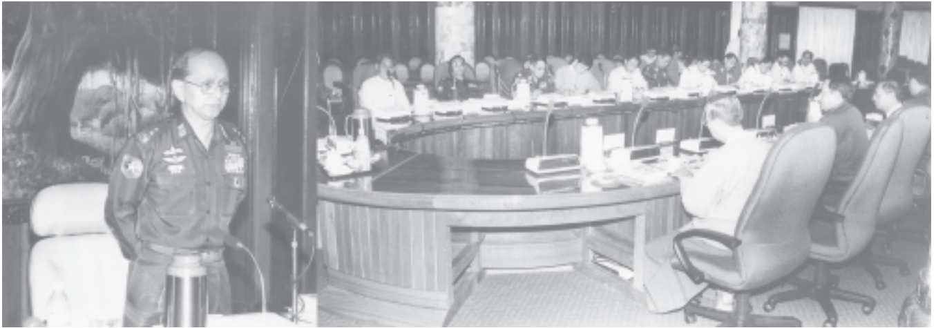
Secretary-1 Lt-Gen Thein Sein addresses the Meeting No 4/2004 of the Myanmar Education Committee.

YANGON, 2 Nov — Myanmar Education Committee held its meeting No 4/2004 at Zeyathiri Beikman, on Konmyinthta here this evening, with an address by Chairman of MEC Secretary-1 of the State Peace and Development