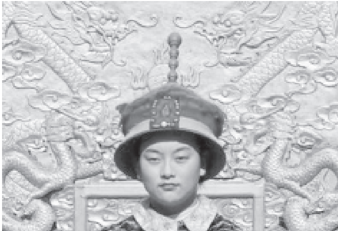
A Chinese visitor wearing emperor's costume waits for his souvenir photograph to be taken at the Forbidden City in Beijing on 1 November, 2004. Beijing's 600-year-old Forbidden City is undergoing a massive renovation project that is keeping 1,400 workers and engineers busy repainting, retiling, and rebuilding most of the crumbling imperial relics.