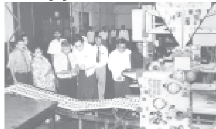
Nepalese journalist delegation studies Myanma Alin Press. — MNA