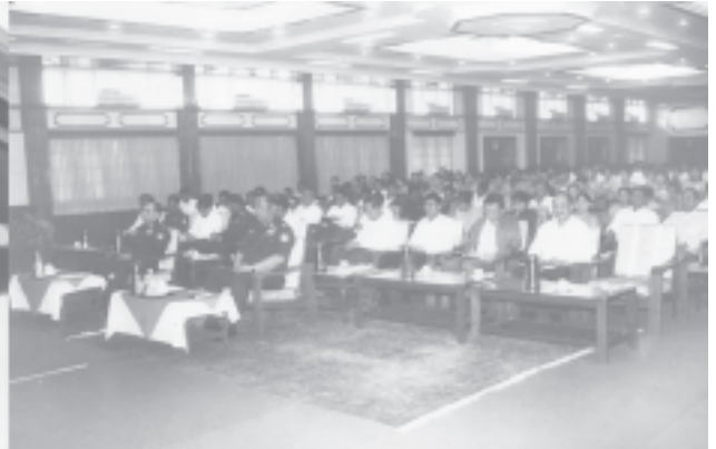
Minister U Aung Thaung delivers an address at the concluding ceremony of Computer Network Course No 1/2004 and 2/2004. — INDUSTRY-1

Minister Brig-Gen Thein Zaw delivers an address at opening ceremony of the training courses of Myanma Posts and Telecommunications.