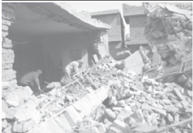
Iraqi men salvage what they can from their destroyed home (R) following a US air raid on Fallujah on 29 Oct, 2004.