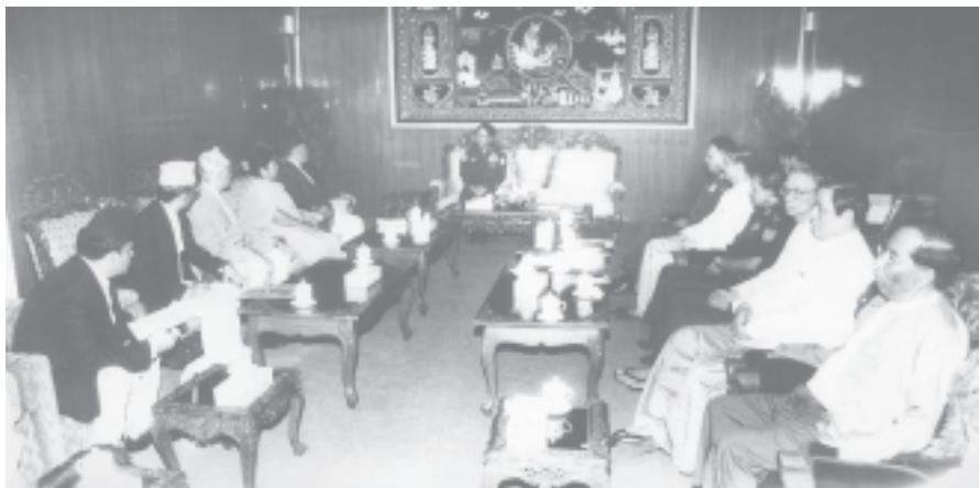
Minister for Information Brig-Gen Kyaw Hsan meets Nepalese Journalist Delegation.