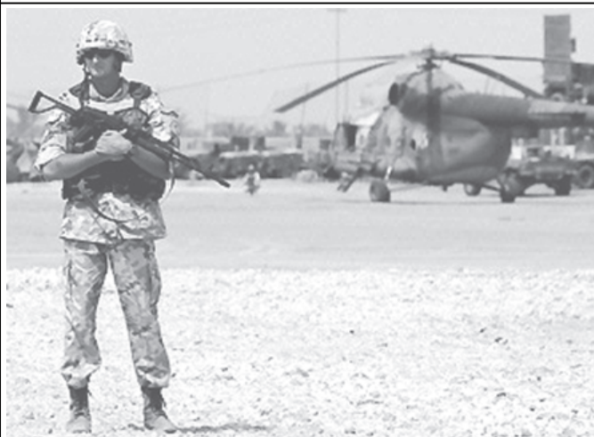
A Polish soldier stands guard near a helicopter in Camp Lima, some 100kms south of Baghdad on 29 Oct, 2004.

During his three-day visit Yawar is expected to meet Emir Sheikh Jaber al-Ahmad al-Sabah and other officials to discuss the debt and the security situation in the region. Kuwaiti Foreign Minister Sheikh Mohammad al-Salem al-Sabah, describing Yawar's visit as "historic", said Kuwait will stand by its former foe. But he did not give specifics regarding Iraq's debt issue. — MNA/Reuters