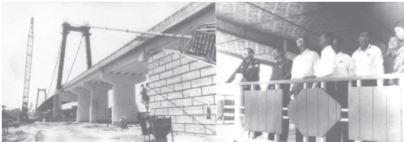
Minister for Construction Maj-Gen Saw Tun inspects construction of Pathein Bridge in Ayeyawady Division.— CONSTRUCTION

The construction of approach roads on the two banks is nearing completion. The workers have been working round the clock for completion of the bridge.—MNA