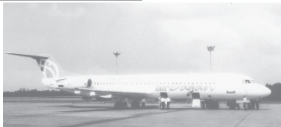
Fokker-100 jet of Air Bagan Lt which will fly in domestic flights.