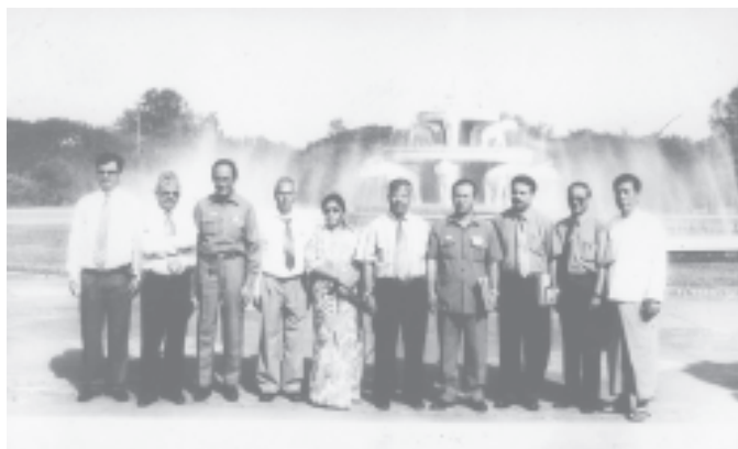
Nepalese Journalist Delegation and officials pose for a documentary photo at People's Square.