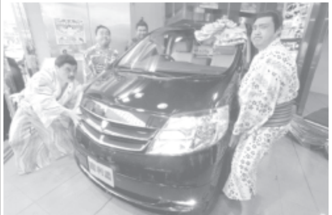
Two sumo wrestlers pose with a Toyota car in Hong Kong. Toyota is to raise its global production target for 2006 in a move that could push the Japanese firm ahead of General Motors as the world's largest automaker by units, a report said.—INTERNET