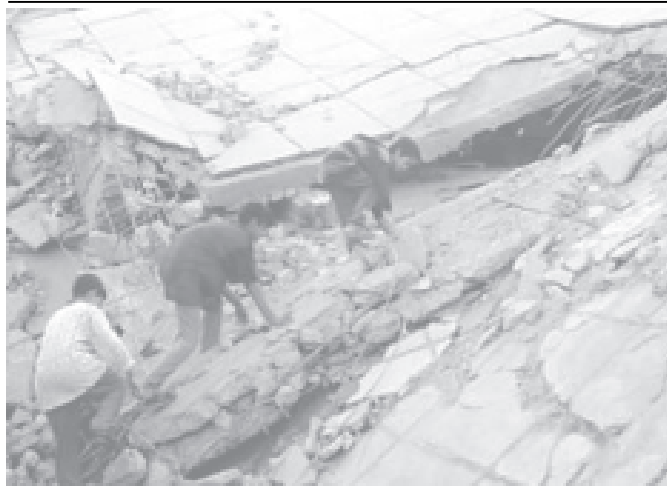
Iraqi boys climb up the rubble of a destroyed house following an overnight US air raid conducted over the western city of Fallujah, on 28 Oct, 2004.

A US military spokeswoman had no immediate information on the clashes. — MNA/Reuters