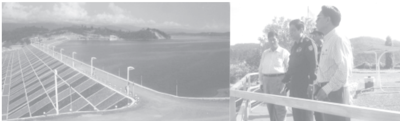
Minister for Agriculture & Irrigation Maj-Gen Htay Oo inspects main embankment and storage of Mone Creek Dam in Sedoktara Township on 25 Oct.—AGRI & IRR

Mone Creek, Man Creek, Salin Creek and Yaw Creek in western Magway Division pass through Pwintbyu, Salin and Sagu plains and flow into the Ayeyawady River. Of them, Mone Creek rises from mountains in Chin State and flows down 196 miles.