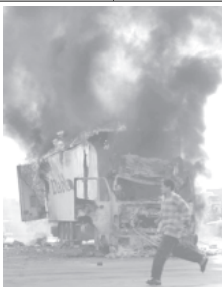
A Turkish truck burns after guerillas opened fire on it while it was carrying bottled water in the northern city of Mosul, Iraq, on 29 Oct, 2004.