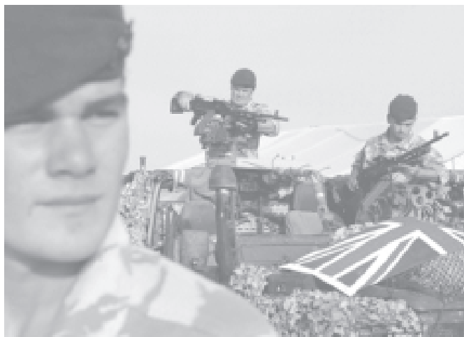
British Royal Marines operating near Baghdad on 30 October, 2004.