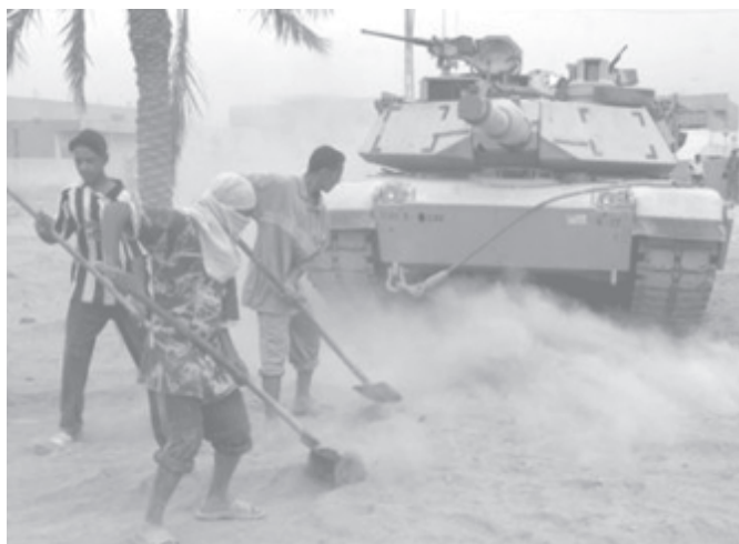
Municipal workers in the Sadr City neighbourhood of Baghdad, Iraq shovel dust while cleaning up an area near American tanks on, 30 Oct, 2004.