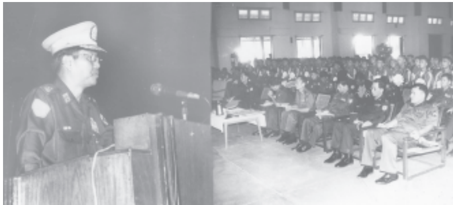
Commander Maj-Gen Myint Swe delivers an address at the meeting with athletes of Yangon Command. — YANGON COMMAND