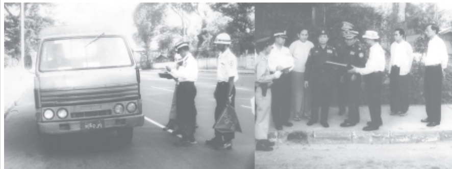
Minister for Mines Brig-Gen Ohn Myint and party supervise the inspection of Tatmadaw and departmental vehicles on Dry Day. — MNA

YANGON, 31 Oct — Chairman of Dry Day Supervisory Committee Minister for Mines Brig-Gen Ohn Myint, accompanied by committee members Deputy Minister for Construction U Tint Swe, Deputy Minister for Home Affairs Brig-Gen Phone Swe, Deputy Minister for Hotels and Tourism Brig-Gen Aye Myint Kyu, Deputy Minister for Energy Brig-Gen Than Htay, Vice-Adjutant-General Maj-Gen Hla Shwe, Myanmar Police Force Director-General Brig-Gen Khin Yi, Lt-Col Aung Thu of the Quartermaster-General's Office, Commander of No 1 Provost Company Major Win Myint Tun, Director-General U Khin Maung, Directors U Baw Htin, Maj Tin Aung and U