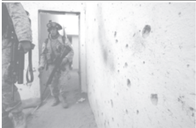
A US Marine walks past a bullet-riddled wall in Ramadi, 100 kms west of Baghdad recently.

Fallujah, some 50 kilometres west of Baghdad, remained a top security concern for US and Iraqi officials, and was on the list of cities to be retaken from guerrillas ahead of the national elections slated for January.