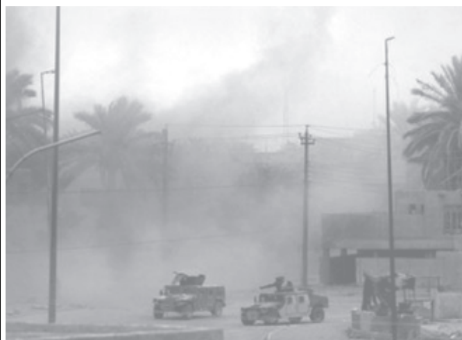
Smoke rises after US Marines from the 2nd Battalion, 5th Marine Regiment disposed of a roadside bomb with a controlled explosion in Ramadi, Iraq, on 30 Oct, 2004.