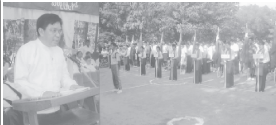
Deputy Minister for Transport Col Nyan Tun Aung delivers an address at opening ceremony of Sepak Takraw Competitions in Ahlon Township. — TRANSPORT

Afterwards, they proceeded to Lawka Chantha Abhaya Labha Muni Buddha Image in Insein Township and paid obeisance to Buddha Image and made cash donation there. — MNA