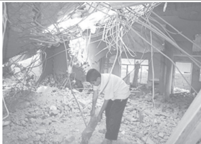
An Iraqi boy collects the remains of a rocket shell from inside a badly damaged building destroyed during an overnight US raid in the restive city of Fallujah, 50 kms from Baghdad, on 28 Oct, 2004.