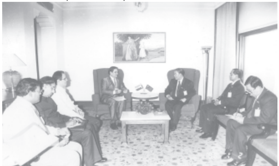
Minister for Energy Brig-Gen Lun Thi receives the Secretary of Petroleum & Natural Gas Ministry and the Chairman of ONGC (VEDESH) and Gail (India) Pte Ltd and party at Oberoi Hotel on October 25.—MNA

Matters related to health care services of the two countries and future tasks, especially treatment of and operation on heart, treatment and diagnosis of alimentary tract diseases and cooperation in research work were discussed. — MNA