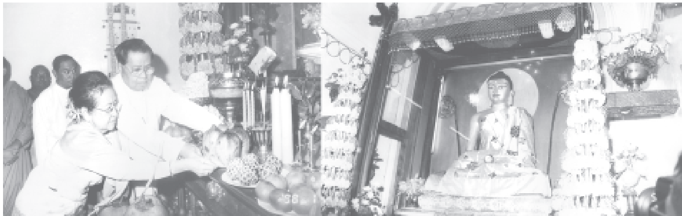
Senior General Than Shwe and wife Daw Kyaing Kyaing offer fruits to Buddha Image at Maha Bodhi Pagoda.