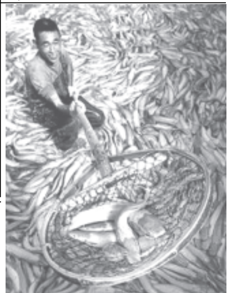
Sea of catfish : A Chinese farmer shows off his harvest of catfish, which he bred in his farm in the outskirts of Hangzhou, China's eastern province of Zhejiang.