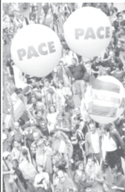
Italian demonstrators hold balloons reading 'peace' as they march in Rome, on 30 Oct, 2004 demanding peace in Iraq and the withdrawal of troops.