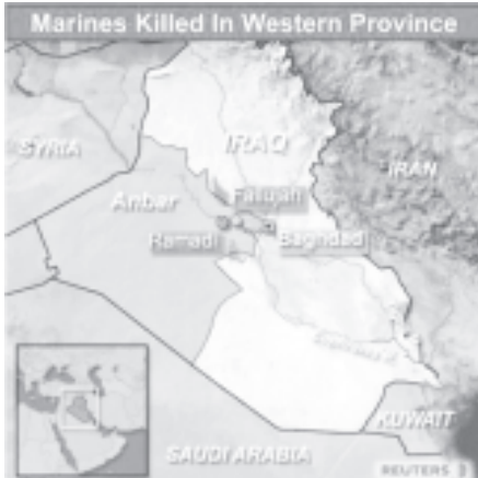
Eight US Marines were killed in the bloodiest attack on American forces in Iraq in almost seven months on 30 Oct, 2004, as troops prepared for a major assault to capture the guerilla towns of Ramadi and Fallujah.