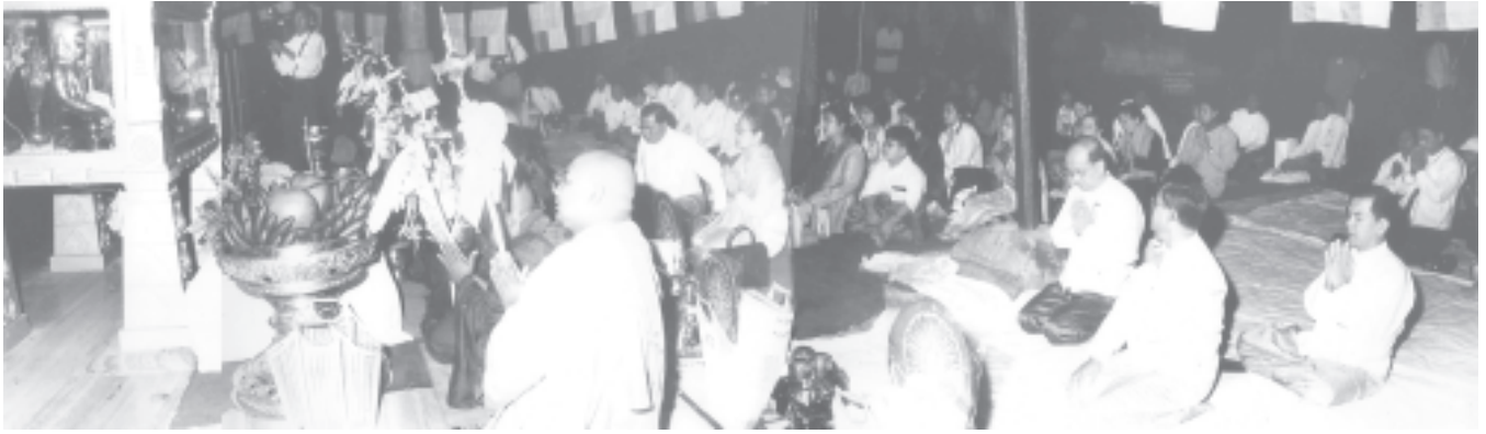
Senior General Than Shwe and wife Daw Kyaing Kyaing attend the consecration ceremony of Bronze Buddha Image to be kept in front of Maha Bo Tree and Golden Throne in Bodh Gaya. (News on page 16)