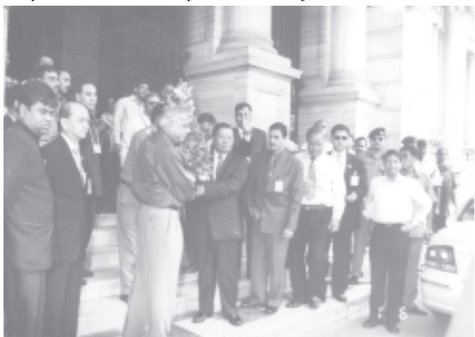
Senior General Than Shwe and party being welcomed at Victoria Memorial Hall in Kolkata.