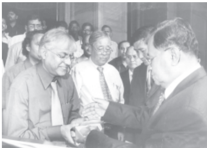
Senior General Than Shwe presents a souvenir to Curator of Victoria Memorial Hall in Kolkata.