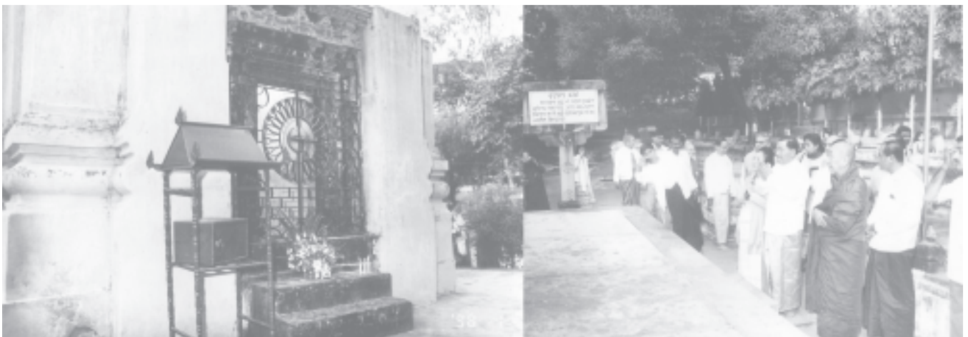
Senior General Than Shwe, wife Daw Kyaing Kyaing and party view Yadanaghara Sattaha Abhidhamma Sankyaungdaw.