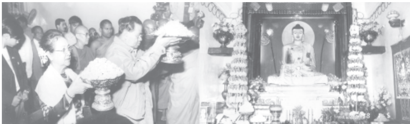
Senior General Than Shwe and wife Daw Kyaing Kyaing offer 'soon' to Buddha Image at Maha Bodhi Pagoda built by King Siri Dhammasoka in Bodh Gaya, India.