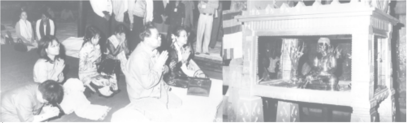
Senior General Than Shwe and wife Daw Kyaing Kyaing pay homage to Bronze Buddha Image to be kept in front of Maha Bo Tree and Golden Throne in Bodh Gaya.