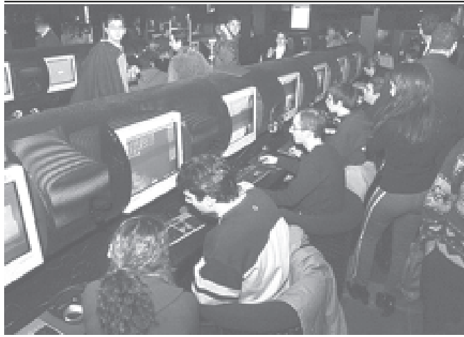
People play computer-networked games in the newly opened 'Gate 104' centre in Paris in January 2004. For all its charm and rustic traditions, France is moving along speedily on the information superhighway, a government report released showed.—INTERNET