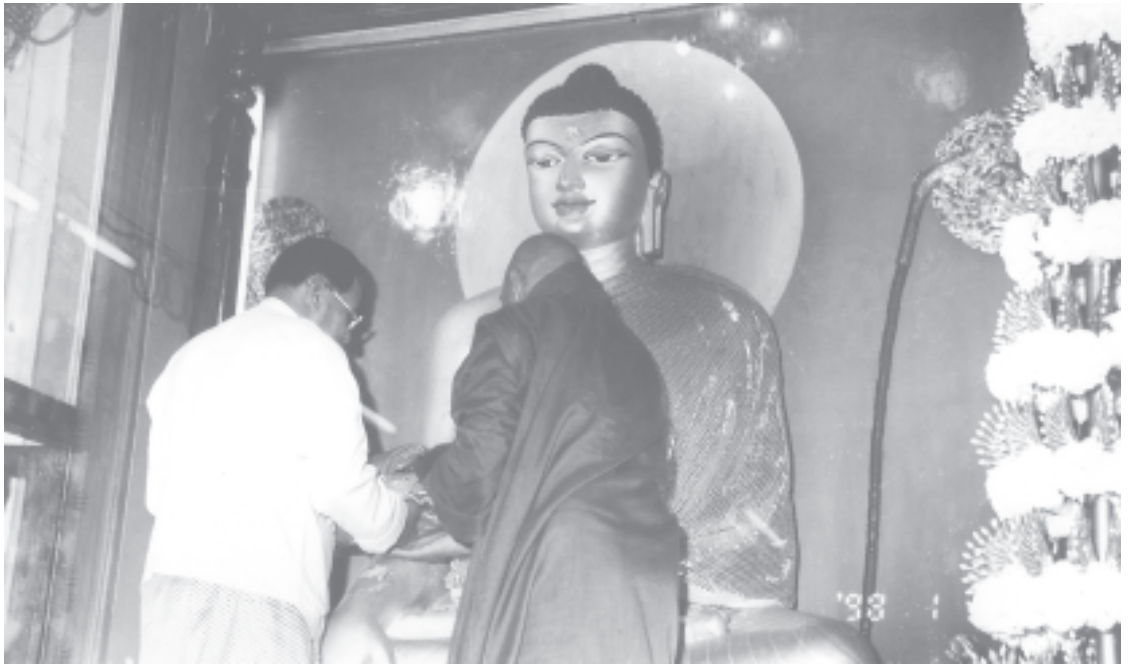
Chairman of the State Peace and Development Council Senior General Than Shwe offers gold foils to Buddha Image at Maha Bo Tree and Golden Throne in Bodh Gaya.