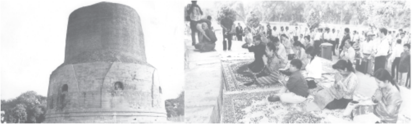
Senior General Than Shwe, Daw Kyaing Kyaing and party pay homage to Dhammacakkya Stupa in Migadawon, India.