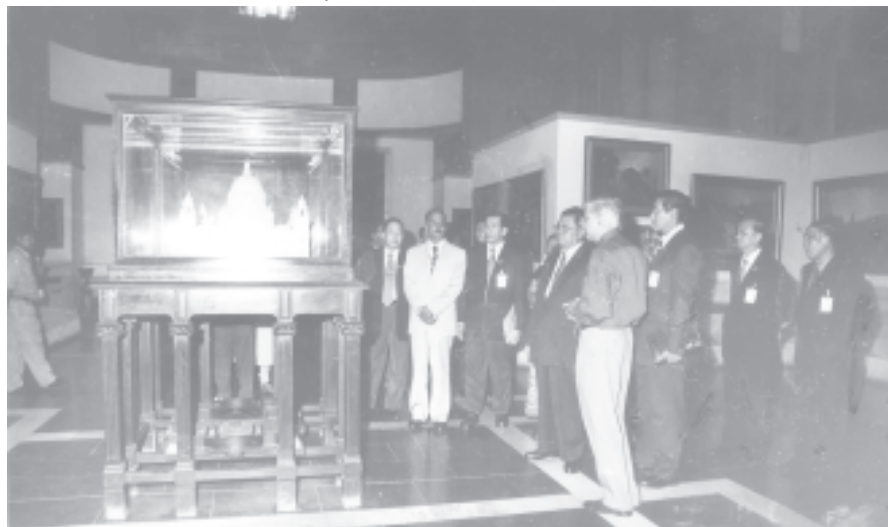
Senior General Than Shwe and party visit Victoria Memorial Hall in Kolkata.

heads of department. Together with the Governor of State of West (See page 7)