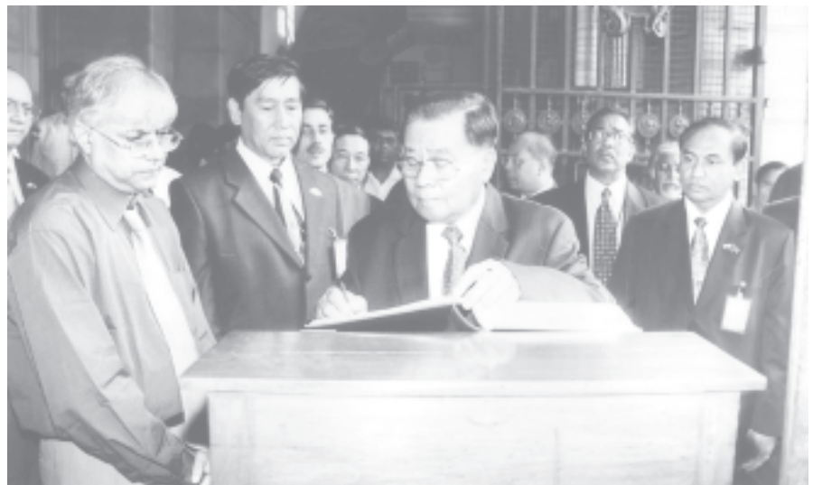
Senior General Than Shwe signs in the visitors' book at Victoria Memorial Hall in Kolkata.