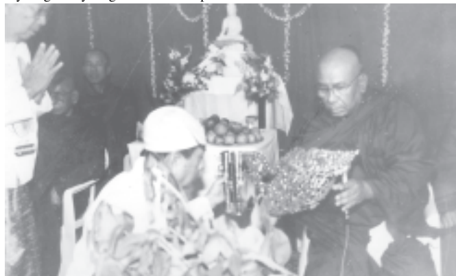
Minister for Religious Affairs Brig-Gen Thura Myint Maung offers the Hngetmyatnadaw to Sitagu Sayadaw.— MNA

Shwedagon Pagoda which will be built in Mumbai. — MNA