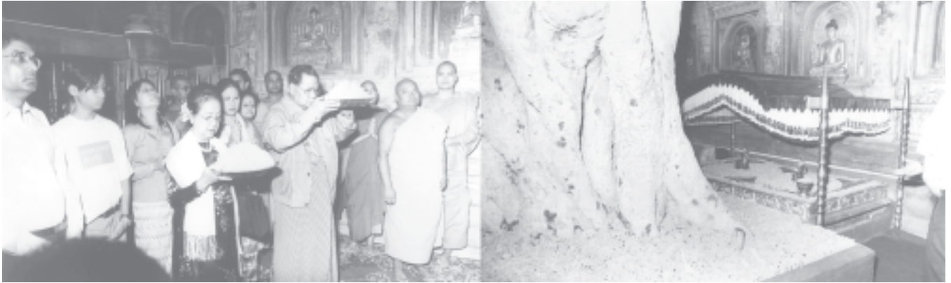
The Myanmar delegation led by Chairman of the State Peace and Development Council Senior General Than Shwe and wife Daw Kyaing Kyaing offer flowers to Buddha images at Aparajita Throne and Bo Tree.

Chairman of the State Peace and Development Council Senior General Than Shwe and wife Daw Kyaing Kyaing pay reverence to the place where Lord Buddha administered Dhammacakkya Desana to His first five monks in Migadawon.