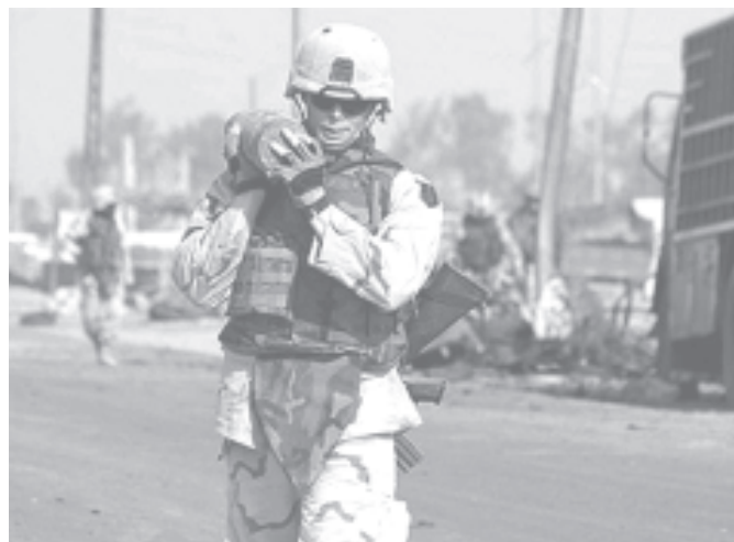
A US soldier carries a rocket he removed from close to the wreckage of a car bomb along a road north of the city of Baquba, 60 kms northeast of Baghdad.