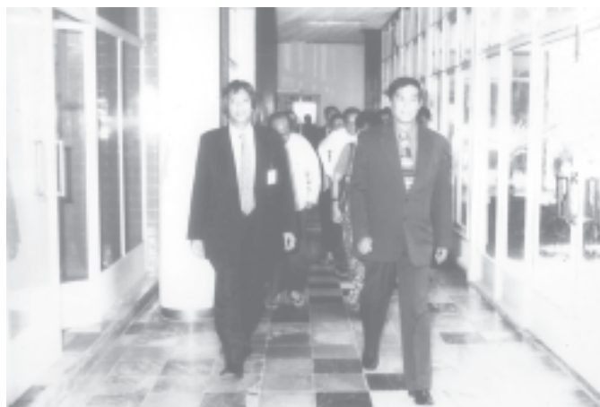
Deputy Minister for Foreign Affairs U Kyaw Thu being seen off at the airport before departure for Thailand to attend ACMECS Ministerial Retreat. — MNA

The Deputy Minister was seen off at Yangon International Airport by heads of departments, officials and Charge d'Affaires Mr Opas Chantarasap of the Royal Thai Embassy. — MNA