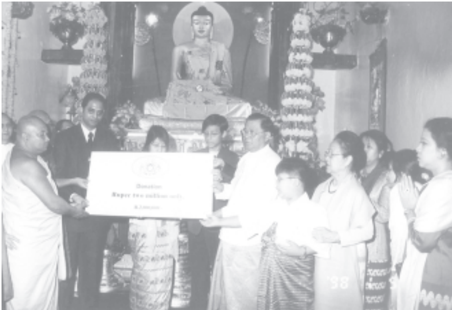
Senior General Than Shwe presents cash donation to Chairman of Bodh Gaya Maha Bodhi Pagoda Board of Trustees.