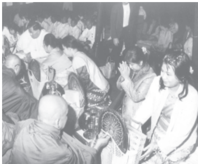
Senior General Than Shwe, wife Daw Kyaing Kyaing and party donate provisions to Sayadaws at consecration ceremony of Bronze Buddha Image at Maha Bodhi Pagoda in Bodh Gaya in Gaya, India.