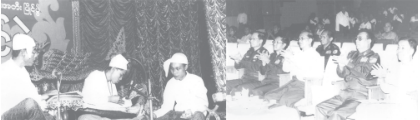
Secretary-1 Lt-Gen Thein Sein enjoys men's amateur harp contest at Padonma Theatre.—MNA

YANGON, 31 Oct — Secretary-1 of the State Peace and Development Council Lt-Gen Thein Sein enjoyed the violin contest at Kanbawza Theatre and the harp contest at Padonma Theatre of the 12th Myanmar Traditional Cultural Performing Arts Competitions today.