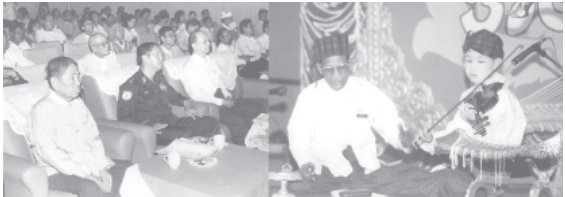
Secretary-1 Lt-Gen Thein Sein watches participation of Maung Nay Lin Soe of Kachin State in basic education level (aged 10-15) boys' violin contest. —MNA

was held at the National Museum, the dancing contest at the National Theatre, the song composing contest at the State School of Music and Drama, the music contest at the Kanbawza Theatre and the Mahosadha Marionette Contest at the National Theatre. — MNA