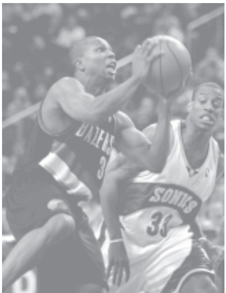
Portland Trail Blazers' Sebastian Telfair drives against Seattle SuperSonics' Antonio Daniels (33) during the fourth quarter on Friday, 29 Oct, 2004, in a preseason game in Seattle.

"I have not decided yet on Ashley Cole," Wenger said. "There could be a problem with the left back." —MNA/Reuters