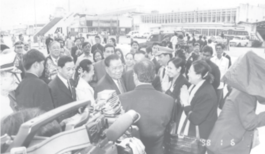
Senior General Than Shwe, wife Daw Kyaing Kyaing and party being seen off at the airport by Myanmar Ambassador and Governor of West Bengal State.