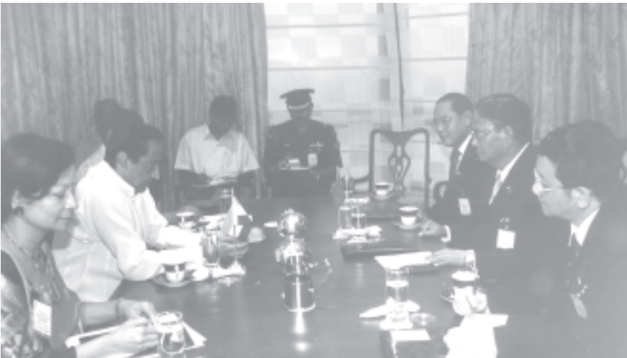
Minister for Industry-1 U Aung Thaung and Minister for Communications, Posts and Telegraphs Brig-Gen Thein Zaw discuss with Minister of Commerce and Industry Shri Kamal Nath at Maurya Sheraton Hotel in New Delhi.—MNA

YANGON, 31 Oct—Minister for Industry-1 U Aung Thaung, Minister for Communications, Posts and Telegraphs Brig-Gen Thein Zaw and Minister for Science and Technology U Thaung, who accompanied Chairman of the State Peace and Development Council Senior General Than Shwe and wife Daw Kyaing Kyaing as members of Myanmar goodwill delegation on a State Visit to the Republic of India, met officials of Chamber of Indian Industry at a ceremony, sponsored by the India-Myanmar Joint Task Force, at the Maurya Sheraton Hotel, New Delhi, on 25 October.