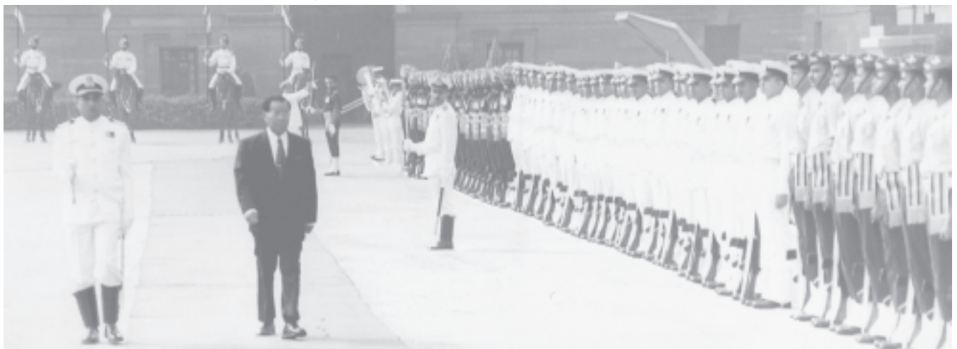
Senior General Than Shwe inspects Guard of Honour at the welcoming ceremony of Indian President Dr APJ Abdul Kalam.

Images of fraternal friendship between the Union of Myanmar and the Republic of India