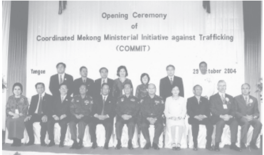
Prime Minister Lt-Gen Soe Win poses for documentary photo with ministers and deputy ministers to Coordinated Mekong Ministerial Initiative against Trafficking.

(ADB); Australian Agency for International Development (AusAID), the International Organization for Migration (IOM); New Zealand's International Aid and Development Agency (NZAID); the Royal Norwegian Government, Save the Children-UK; the Swedish International Development Cooperation Agency (SIDA); UNDP; UNFPA, UNICEF, and UNODC. A special note of thanks, of course, goes to UN-Inter Agency Project, the Secretariat of the COMMIT Process, for their tireless efforts in supporting the realization of this