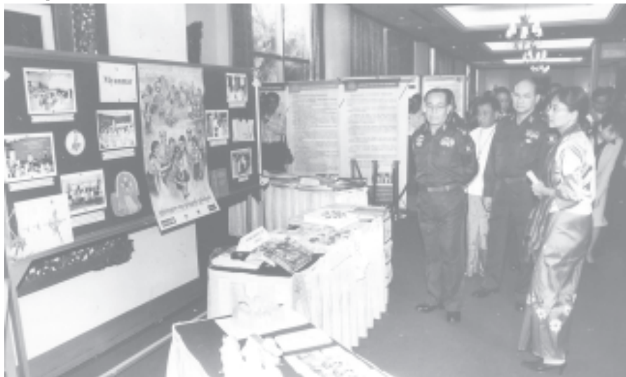
Prime Minister Lt-Gen Soe Win views booths on prevention against human trafficking.

The COMMIT Process in this sense reflects the essence and the spirit of the Protocol. While it provides for law enforcement measures against traffickers it