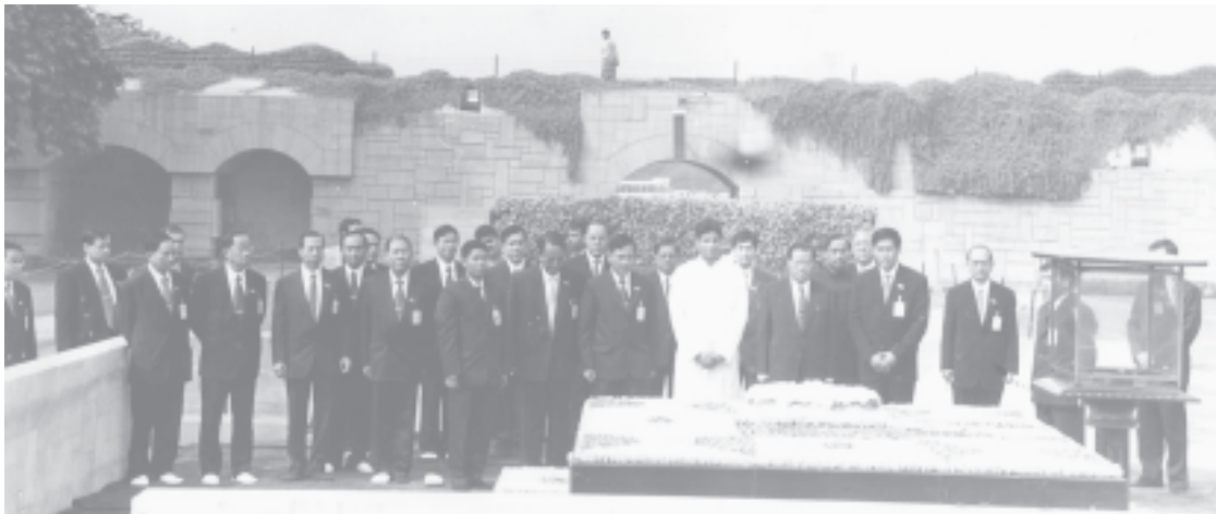
Senior General Than Shwe and party lay wreath at Samadhi of Mahatama Gandhi in Rajghat of New Delhi, India.

the Management Committee for Samadhi of Mahatama Gandhi Mr