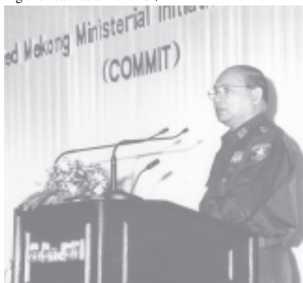
Minister for Home Affairs Col Tin Hlaing extends greetings to participants of COMMIT.—MNA