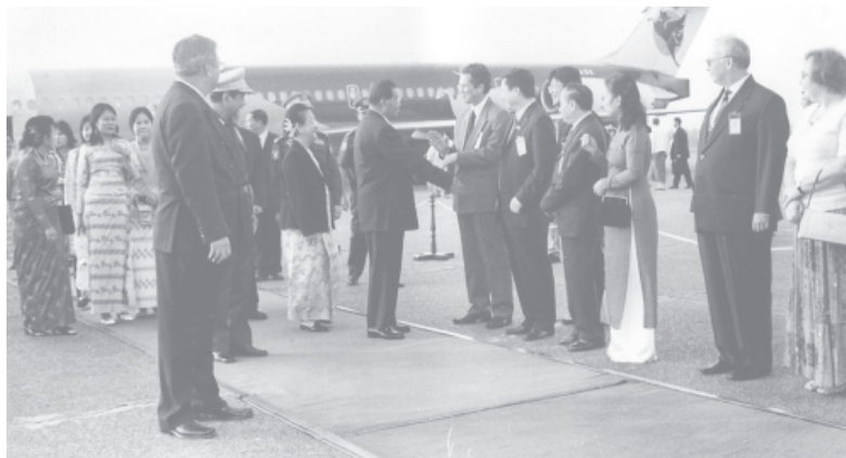
Senior General Than Shwe and wife Daw Kyaing Kyaing and party being welcomed back by diplomats and their wives and resident representatives of UN agencies.