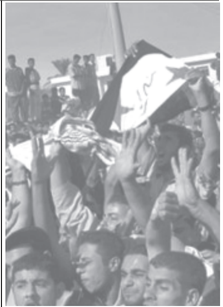
Pedestrians shelter from waves crashing over the sea wall at Torquay, south-west England, on 27 Oct, 2004. Communities across the region have been clearing up on