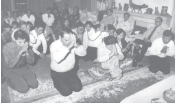
Myanmar Ambassador, Military Attaché, consul-general, staff, doctors and Myanmar trainees pay respects to Senior General Than Shwe and Daw Kyaing Kyaing.