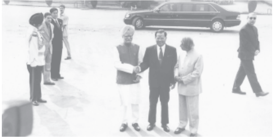
Senior General Than Shwe being greeted by Indian President Dr APJ Abdul Kalam and Prime Minister Dr Manmohan Singh.