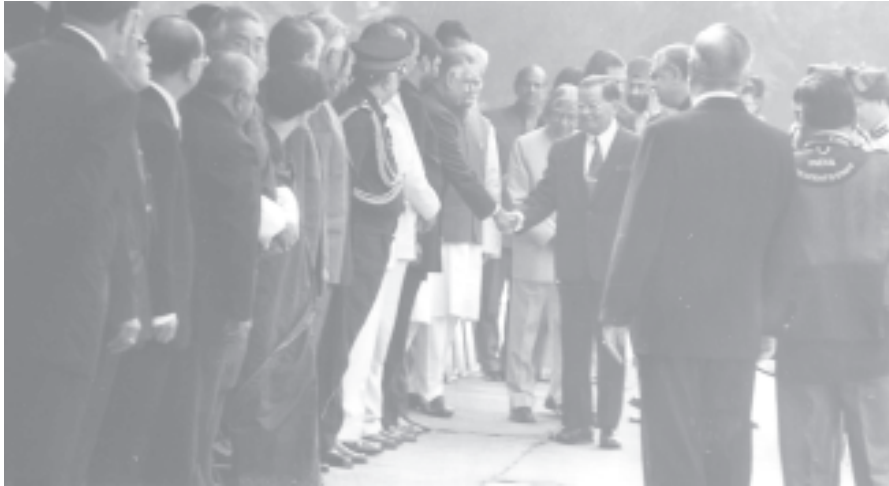
Senior General Than Shwe greets Indian Prime Minister Dr Manmohan Singh and senior officials.