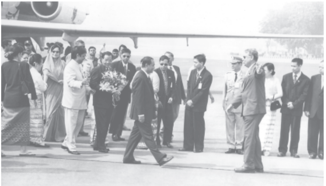
Senior General Than Shwe, wife Daw Kyaing Kyaing and party being welcomed by Indian Deputy Minister of External Affairs Mr E Ahamed and officials.