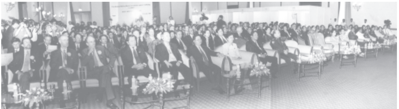
Ministers and deputy ministers and officials of Greater Mekong region countries attending Coordinated Mekong Ministerial Initiative against Trafficking (COMMIT).

of the State Peace and Development Council Office, departmental heads, social organizations, the patron, the president and members of Myanmar Foreign Correspondents Club, guests and observers.