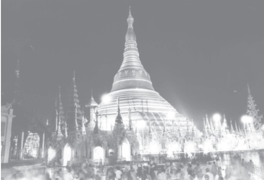
The photo shows night scene of Shwedagon Pagoda crowded with devotees and pilgrims on the day after Fullmoon Day of Thadingyut.—MNA