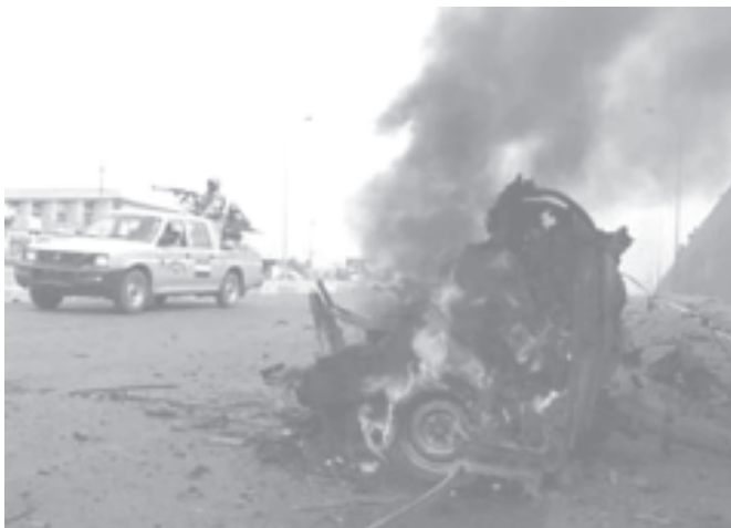
Iraq National Guard troops pass blazing wreckage from a car bomb attack, in Mosul on 28 October 2004. The US military said one of its soldiers was injured in the attack, which had targeted a convoy.