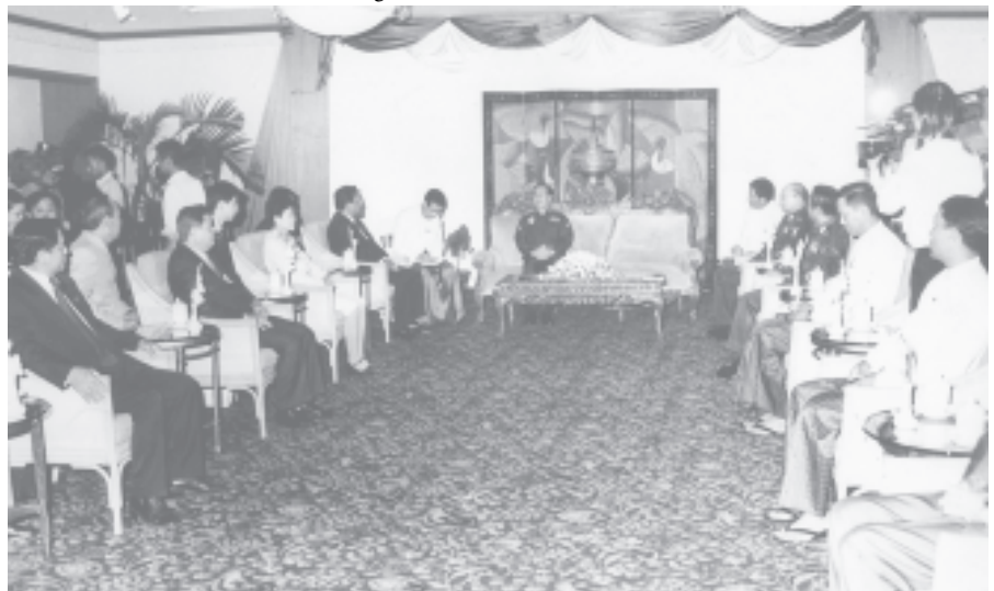
Prime Minister Lt-Gen Soe Win receives ministers and deputy ministers attending the Coordinated Mekong Ministerial Initiative against Trafficking.