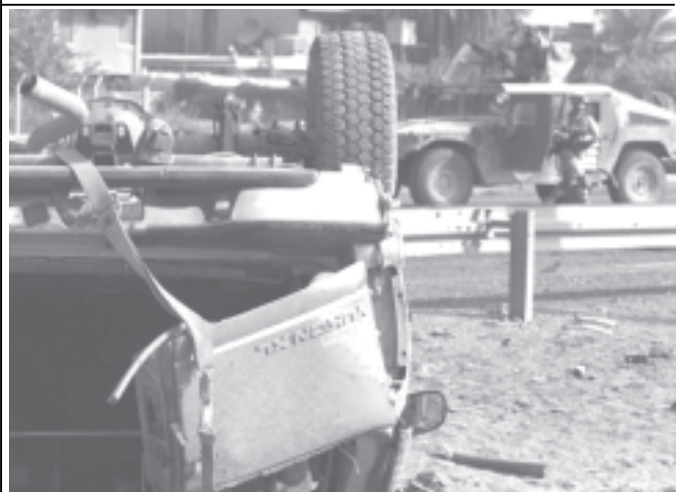
US soldiers arrive in their armoured vehicles to secure the area close to an overturned vehicle targeted along the airport road on the outskirts of Baghdad.

He said Zambia had the capacity to produce one billion tons of maize per year if it tapped its full potential. —MNA/Xinhua