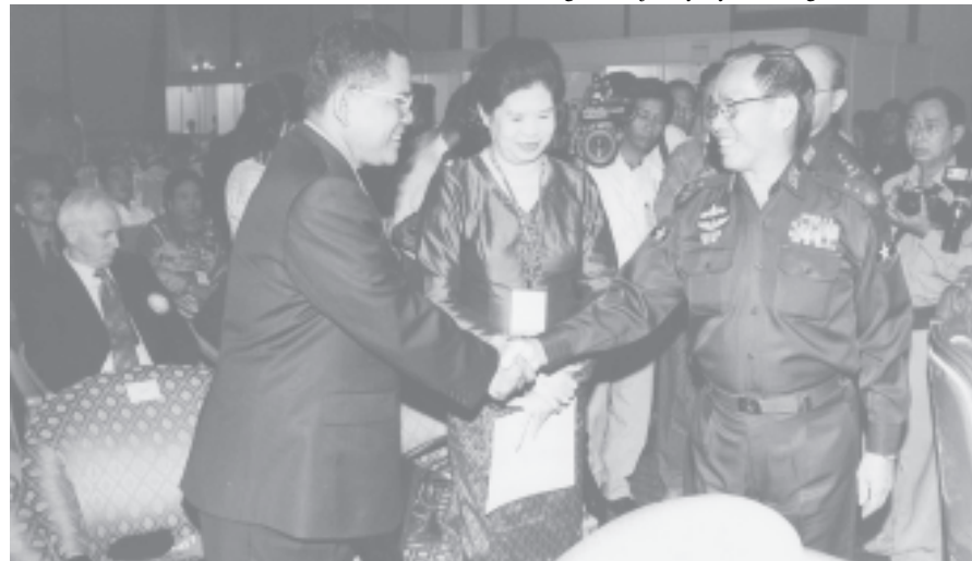
Prime Minister Lt-Gen Soe Win cordially greets ministers and deputy ministers to Coordinated Mekong Ministerial Initiative against Trafficking.— MNA

ing a similar mechanism between their two countries. The efforts by the Royal Thai Government to register illegal migrant workers is also to be commended. This effort created a "win-win" situation for all; the workers, their employers and the overall economy. We are all aware that in terms of trafficking, one of the most vulnerable and easily exploited aspects of any employee is his or her illegal status. This bold step sets a good example to many other countries of destination. Let me briefly touch upon some of the initiatives that Myanmar has been un-