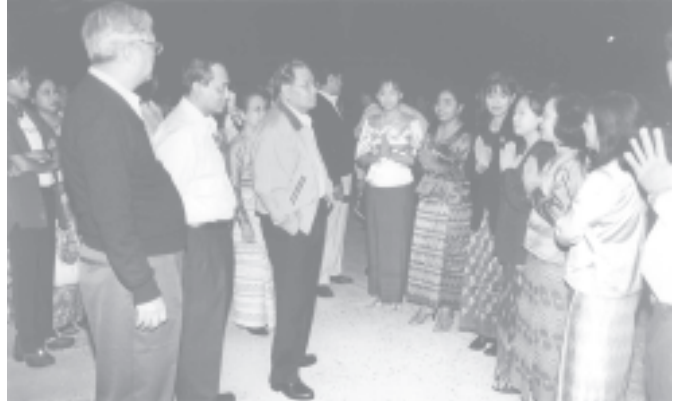
Senior General Than Shwe and wife Daw Kyaing Kyaing and party being welcomed by Myanmar trainees in New Delhi.

of visits between the leaders. Just as State Peace and Development Council Vice-Chairman Vice-Senior General Maung Aye paid a goodwill visit to India, Indian Vice-President Mr Bhairon Singh Shekhawat was on a goodwill visit to Myanmar as well.