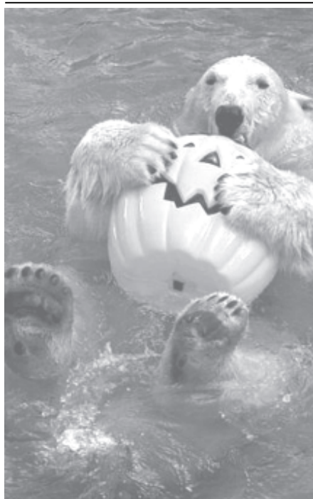
A polar bear at the San Diego Zoo gets into the Halloween spirit as he plays with a pumpkin on Thursday, 28 Oct, 2004.