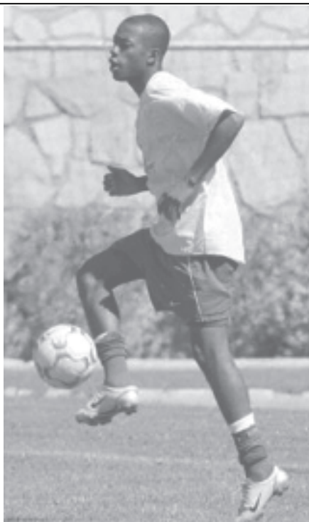
Chelsea were reported to have completed the 10 million pound signing of 20-year-old Santos striker Robinho, but he will first join Benfica until the 2006-2007 season.

With this Benfica could make the most expensive hiring of recent years as Robinho is considered Brazil's best offensive midfielder.