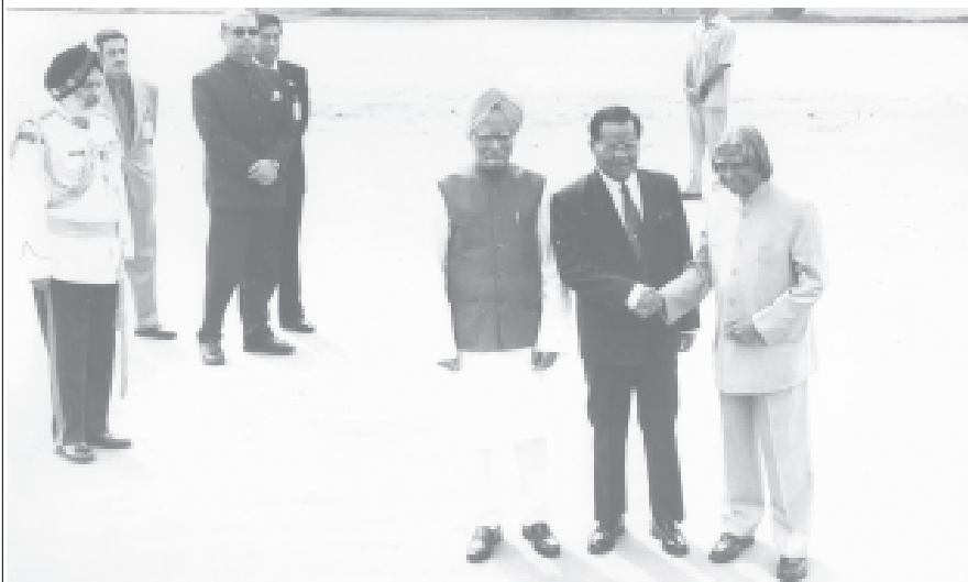
President of India Dr APJ Abdul Kalam and Prime Minister Dr Manmohan Singh cordially greet Senior General Than Shwe.

22. HE Senior General Than Shwe thanked HE Dr APJ Abdul Kalam and the Government and the people of India for warm and friendly reception and gracious hospitality accorded to him and to the Myanmar delegation.