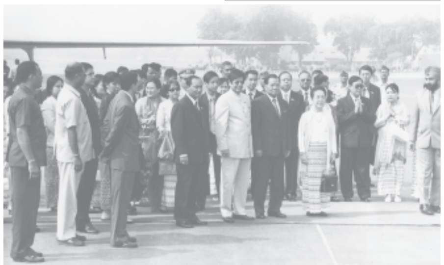
Senior General Than Shwe and wife Daw Kyaing Kyaing and party being welcomed by Indian Deputy Minister of External Affairs Mr E Ahamed and officials.—MNA

Next, Senior General Than Shwe and wife Daw Kyaing Kyaing and party, accompanied by Deputy Minister of External Affairs Mr E Ahamed and officials, left the Airforce Station in a motorcade and arrived at the Oberoi Hotel where they were going to stay. In extending the grand welcome to the Myanmar delegation led by Senior General Than Shwe and wife Daw Kyaing Kyaing, flags of the two nations were put up at the Airforce Station building and in its compound and at the junctions and roundabouts of main roads in New Delhi.—MNA