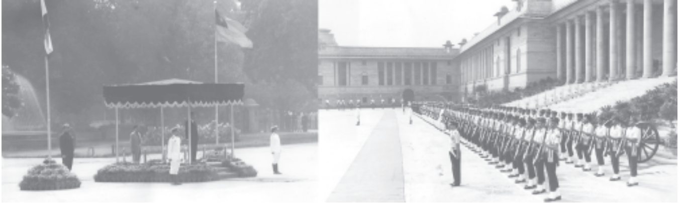
Senior General Than Shwe takes salute of Guard of Honour of Republic of India.