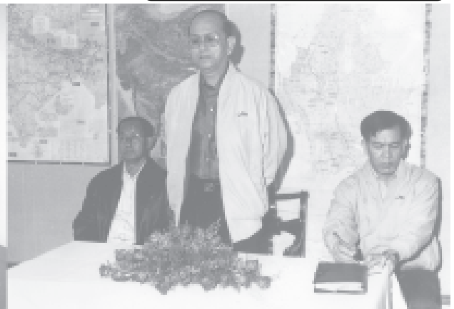
Secretary-1 Lt-Gen Thein Sein meets Myanmar Ambassador, Military Attaché, consul-general, staff, doctors and Myanmar trainees at the ambassador's residence in New Delhi.