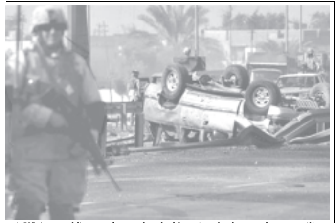
A US Army soldier stands guard at the blast site of a destroyed sports-utility vehicle at the airport highway in Baghdad, on 27 Oct, 2004.

Talks between the US-backed government and delegates from the Sunni Muslim hotspot collapsed in mid-October after Allawi ordered the city to surrender suspected al-Qaeda-linked militants or face invasion.