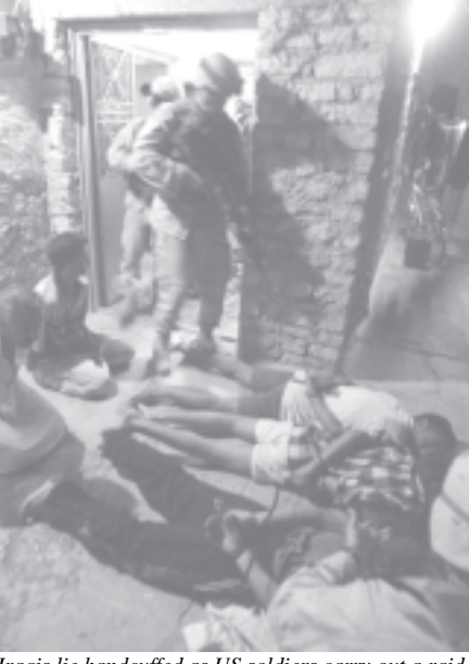
Iraqis lie handcuffed as US soldiers carry out a raid on a house in Ramadi on 27 Oct, 2004.

Wipro said a survey conducted at the forum confirmed a trend amongst European firms of plans to exploit global sourcing for multiple service lines. 74 per cent of the executives polled said their global sourcing budgets would increase this year and 63 per cent were planning to leverage global sourcing for multiple service lines.