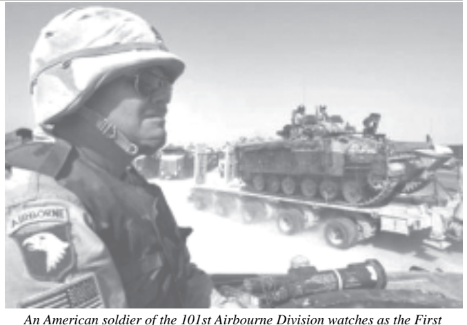
Battalion, The Black Watch, their vehicles mounted on US transporters, deploy to an area south of Baghdad, on 27 Oct, 2004.

Soldiers complained through family members in the United States that the trucks were poorly maintained and insufficiently protected, making the mission a "suicide" run through a region notorious for roadside attacks on Internet