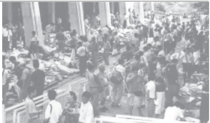
Gem merchants examine uncut jade lots at Mid-year Myanmar Gems Emporium. (News on page 11)-MNA

Vietnam and officials of UNIAP continued their discussions on Regional Plan of Action.