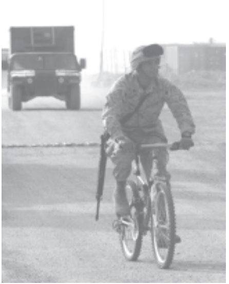
A US Marine uses a mountain bike to move around the Ramadi army camp on 27 Oct, 2004.