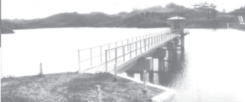
Lt-Gen Khin Maung Than inspects storage of water at Hinywet Dam in An, Rakhine State.—MNA

Emergence of the State Constitution is the duty of all citizens of Myanmar Naing-Ngan.