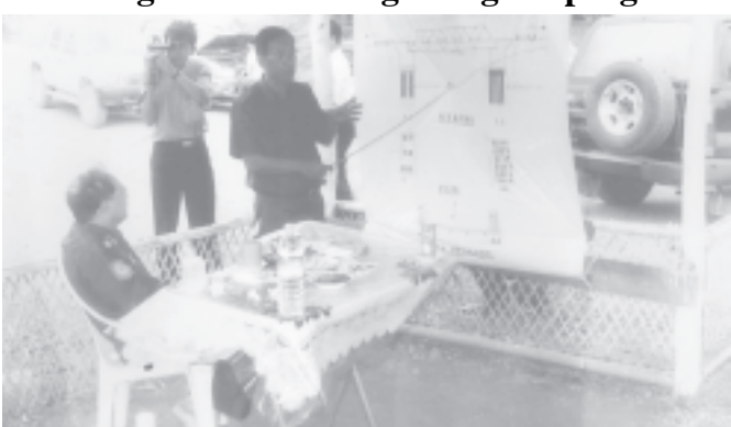
Minister for Construction Maj-Gen Saw Tun hears reports on construction of Htanchaung Bridge on An-Padekyaw-Maei Road by an official.

YANGON, 28 Oct — Minister for Construction Maj-Gen Saw Tun and Deputy Minister Brig-Gen Myint Thein inspected progress in building the An-Padekyaw-Maei Road in Rakhine State on 25