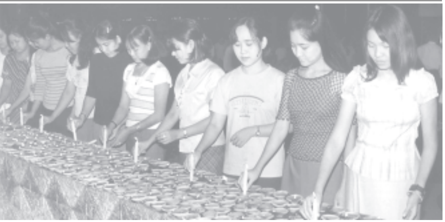
LIGHTS OFFERED TO PAGODA: The Abhidhamma Day ceremony was held at Shwedagon Pagoda on Fullmoon Day of Thadingyut. Belles offer candle lights to the pagoda.— NLM