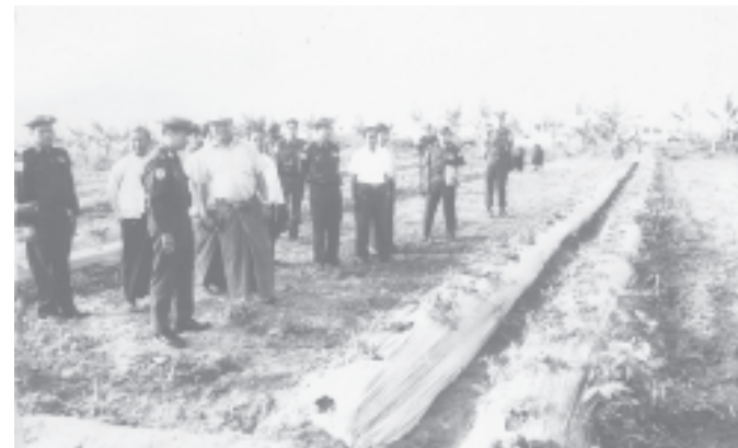
Commander Maj-Gen Myint Swe inspects Yangon Division Vegetable and Poultry Farming Special Zone in Hmawby Township.

YANGON, 28 Oct Chairman of Yangon Division Peace and Development Council Commander of Yangon Command Maj-Gen Myint Swe met with national agriculturists and breeders at Yangon Division Vegetable and Poultry Farming Special Zone near Nyaunghnapin Village in Hmawby Township this afternoon.