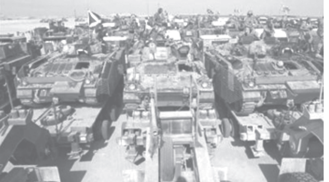
Soldiers of the British 1st Battalion Black Watch wait on their vehicles atop American heavy transport vehicles in Basra, Iraq, on 27 Oct, 2004, before their move to an area south of Baghdad.—Internet