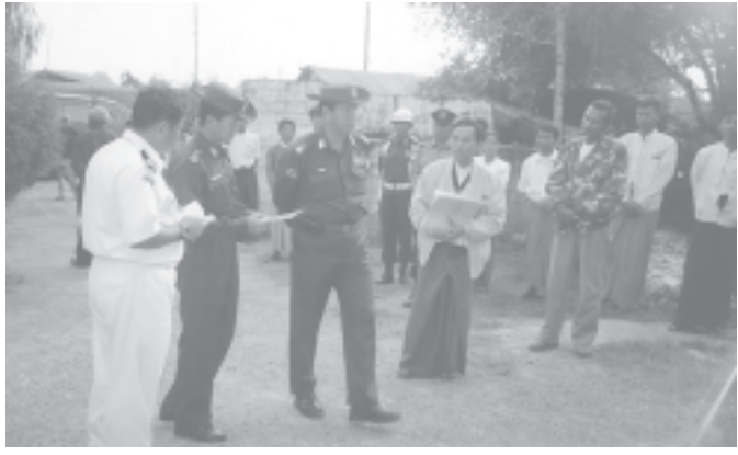
Minister for Finance and Revenue Maj-Gen Hla Tun inspects functions of departments under the ministry in Shan State.