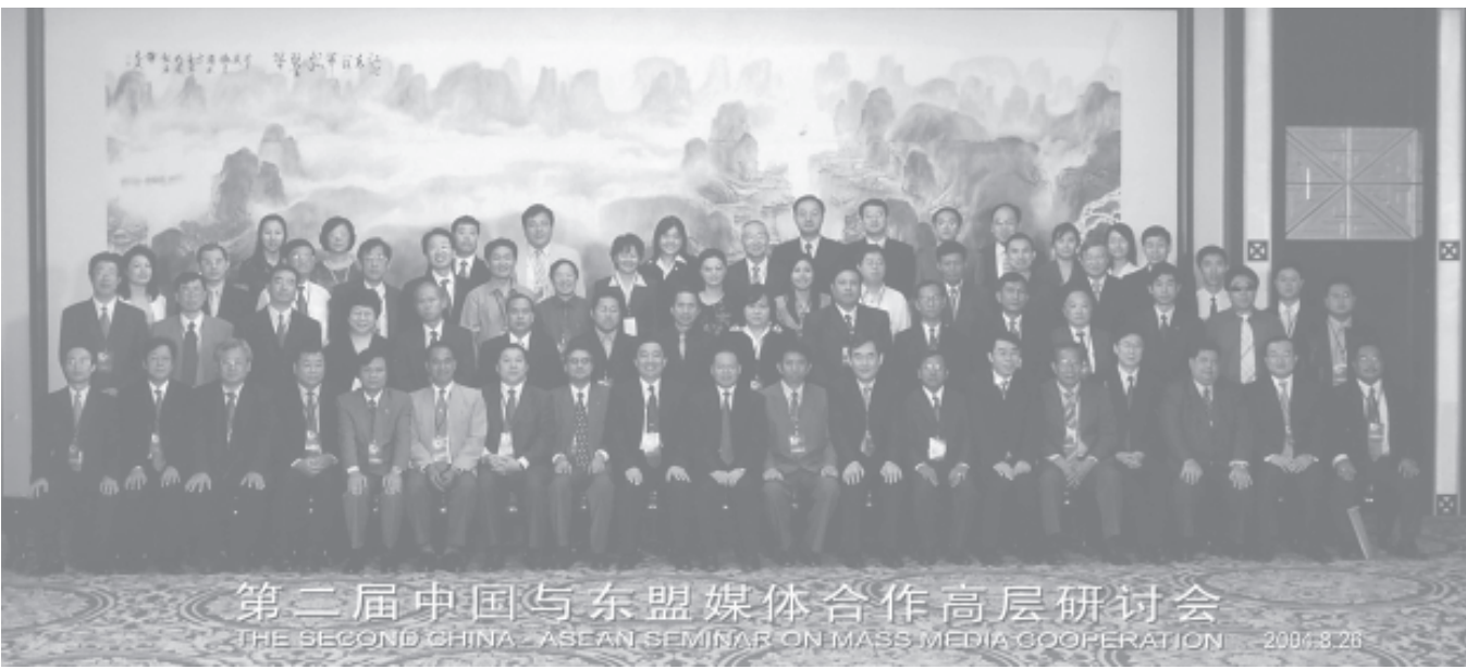
Participants of Second China-ASEAN Seminar on Mass Media Cooperation pose for group photo.

The First China-ASEAN Seminar on Mass Media Cooperation took place in Beijing in 2002.