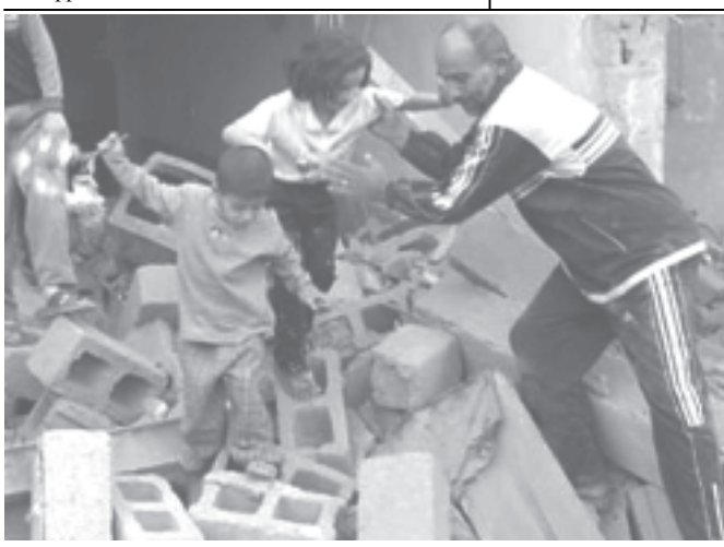
Children are led over bricks from their home, following an overnight air raid that destroyed one house and damaged three in the Iraqi city of Fallujah on 26 Oct, 2004.— INTERNET

Japan was the leading export market of Dalian's software products, taking in 93 per cent of the total volume for the three-quarter period. Other export markets included Singapore, the United States, Hong Kong and Taiwan.-MNA/Xinhua