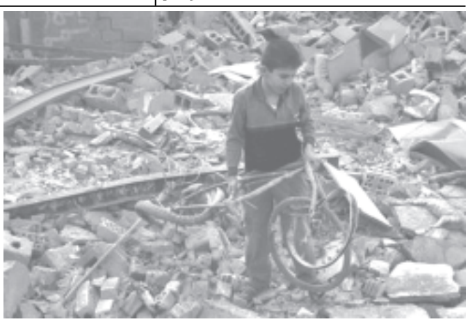
An Iraqi boy rescues a destroyed bicycle from the debris of a destroyed building in Fallujah, outside Baghdad, Iraq, on 26 Oct, 2004.

Sikatana said 200,000 cattle in the affected areas would be vaccinated before rains start because the government wanted to ensure that they were fit to plough. - MNA/Xinhua