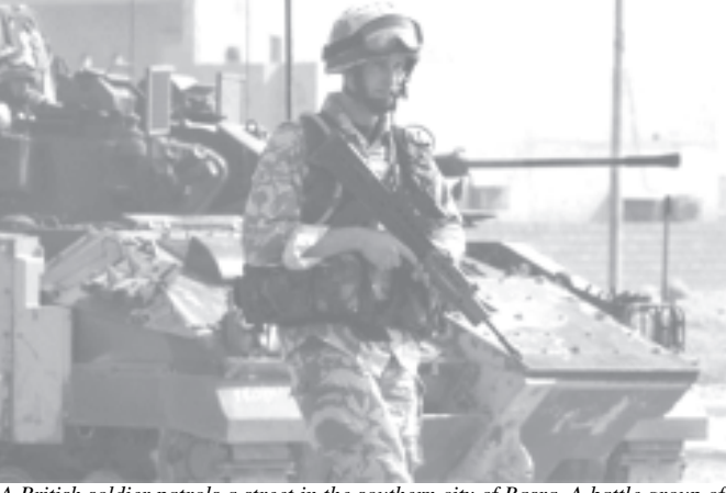
A British soldier patrols a street in the southern city of Basra. A battle group of British troops in southern Iraq has started to move northwards on a US-requested mission to more dangerous areas near Baghdad on 27 Oct, 2004.