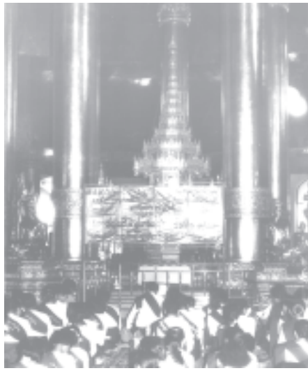
ABHIDHAMMA DAY OBSERVED: The seventh Abhidhamma Day was observed at Tooth Relic Pagoda (Yangon) on Dhammapala Hill in Mayangon Township on 28 October.