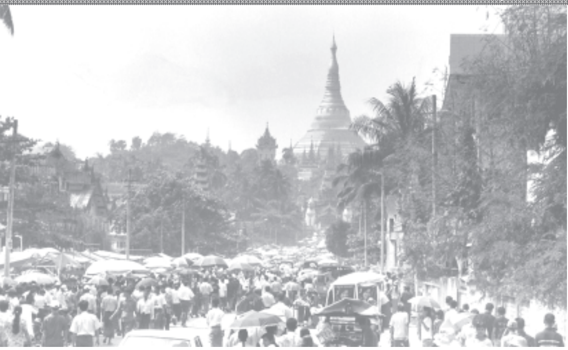
A stream of monks and people go to Shwedagon Pagoda for paying homage on Fullmoon Day of Thadingyut.

They paid homage to the pagodas, recited Maha Pathana Desana, offered flowers, lights.