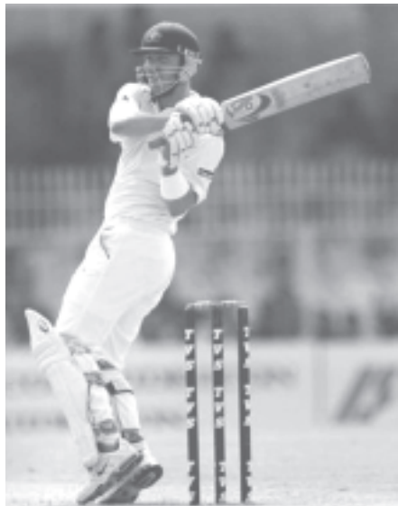
Australia's Damien Martyn bats during the first day of the third cricket test match against India in Nagpur, India, on Tuesday, 26 Oct, 2004.