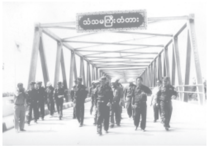
Lt-Gen Khin Maung Than inspects completion of Thanthamagyi Bridge in Yanbye Township.