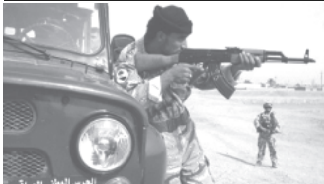
Iraqi National Guard (ING) secure the area while ING together with Iraqi Special Forces (unseen) and British soldiers (background) check the area for bandits on the outskirts of the city of Basra, on 24 October 2004.