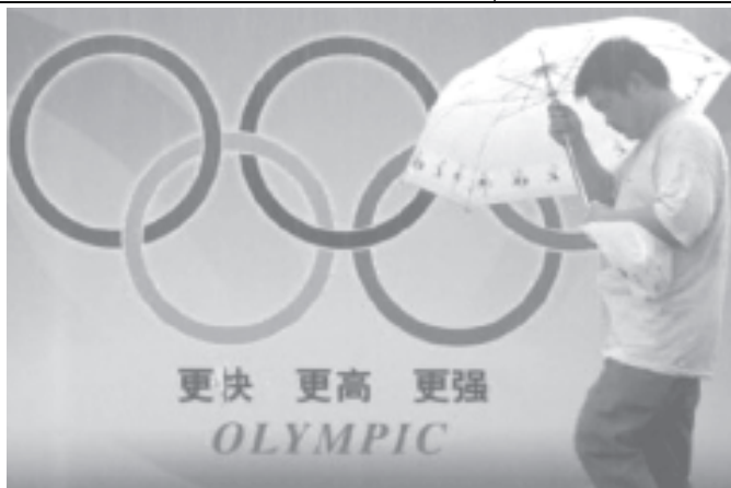
A man passes by an Olympic billboard on a street in Beijing, Britain, whose athletes with the exception of gold medal winners Kelly Holmes and the men's sprint relay, performed so poorly at the Athens Olympics, have turned to China for help in the buildup to the 2008 Beijing Games. —INTERNET

The ministry said a rescue boat sailed out to collect the migrants and take them to temporary holding centres. A Ghanaian woman and her two-year-old baby were taken to hospital, while another Ghanaian mother and baby pair were taken to a Red Cross centre. On Sunday, Spanish police intercepted another small boat making for Fuerteventura with another 36 African migrants on board. —MNA/Reuters