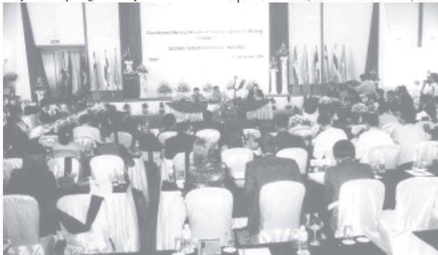
The Second Senior Officials Meeting of Coordinated Mekong Ministerial Initiative against Trafficking (COMMIT) in progress.