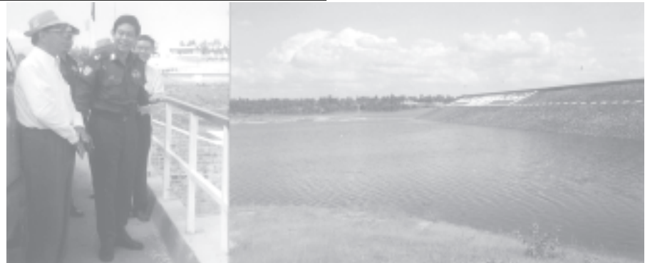
Minister for Agriculture and Irrigation Maj-Gen Htay Oo inspects water storage of Taunggyi Dam in Kyaukpadaung Township.