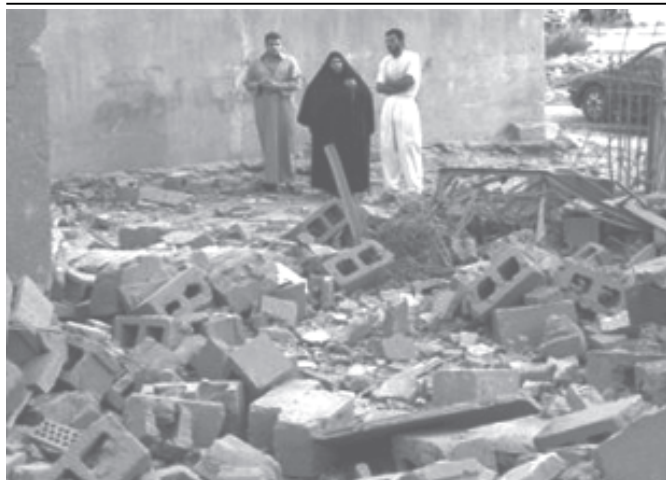
Iraqis inspect a destroyed building in Fallujah, outside Baghdad, Iraq, on 26 Oct, 2004.