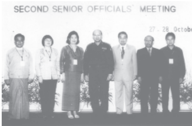
Minister for Home Affairs Col Tin Hlaing poses for a group photo with delegation leaders to COMMIT Senior Officials Meeting.

The root causes of trafficking are almost the same within the region and globally. Pull factors and push factors, need to be tackled, both at the point of origin and that of the destination. Collaboration is needed in these countries.