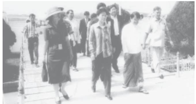
Chinese Minister Vice-Chairperson National Working Committee for Children and Women Ms Huang Qingyi being welcomed at the airport.

The minister was welcomed at Yangon International Airport by Deputy Minister for Immigration and Population U Maung Aung, departmental heads, Chinese Ambassador to Myanmar Mr Li Jinjun and embassy staff. Similarly, Secretary of State Ms You Ay of Ministry of Women Affairs (MWA) of Cambodia and party arrived here by air yesterday evening to