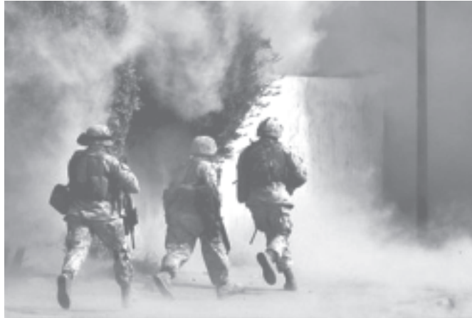
US Marines from the 2nd Battalion, 5th Marine Regiment run to a building after detonating explosives to open a gate during a mission in Ramadi, Iraq, on 26 Oct, 2004.