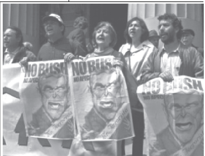
Demonstrators protest against the upcoming visit to Chile by US President George Bush in front of the central courts building where a coalition of leftist groups sued Bush and other US government officials for the abuses at the Abu Ghraib Prison in Iraq, in Santiago, Chile, on 26 Oct, 2004.