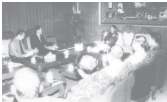
Minister for Information Brig-Gen Kyaw Hsan receives Cultural Counsellor Mr Wang Ruiqing of PRC.