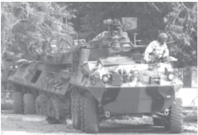
Australian armoured vehicles secure the area following a blast in the Karrada District of Baghdad on 26 Oct, 2004.