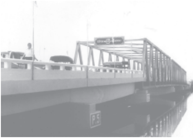
Progress in construction of Thanthamagyi Bridge to be opened soon in Yanbye Township. — MNA