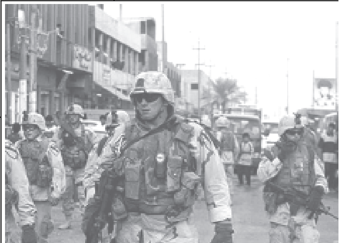
US soldiers patrol the streets of Sadr City in Baghdad on 26 Oct, 2004.

The western Anbar Province, including Ramadi, some 100 kilometres west of Baghdad, has long been a hotbed of insurgency against the US forces since last year's US-led war on Iraq.