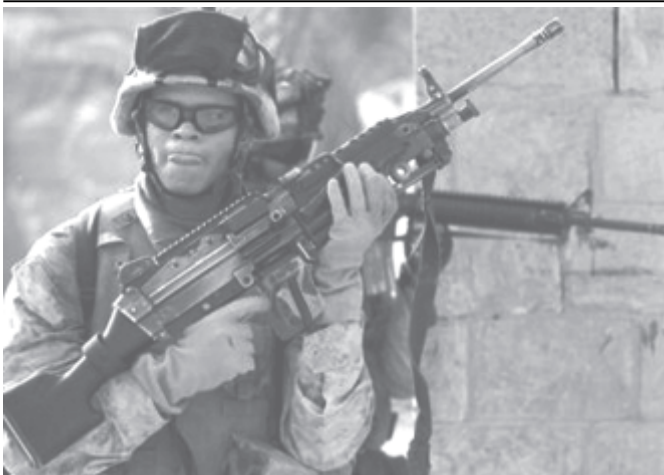
A US Marine from the 2nd Battalion, 5th Marine Regiment grimaces on patrol in Ramadi, Iraq, on 26 Oct, 2004.