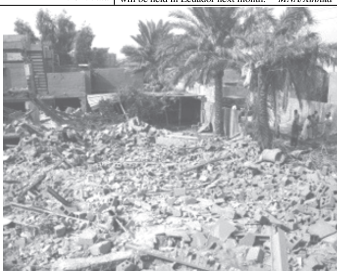
Citizens look at the demolished houses in a neighbourhood of the restive city of Fallujah recently.