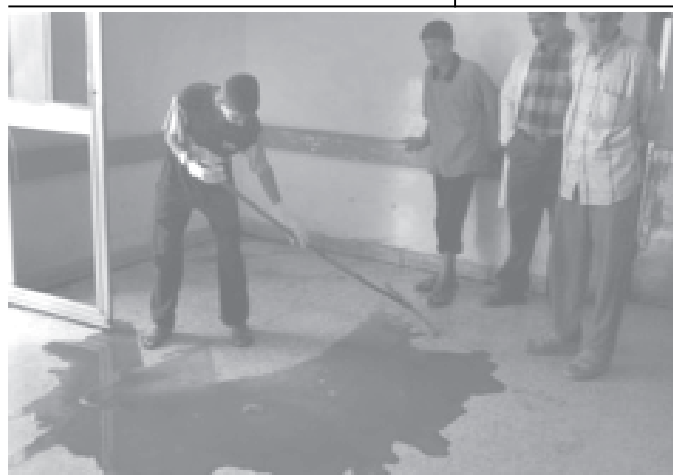
A hospital worker cleans up blood after fresh wounded were brought on 24 Oct, 2004.