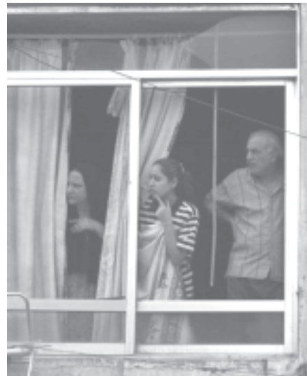
Iraqis watch from a window after a bomb exploded on 25 Oct, 2004 near a US military convoy in central Baghdad.