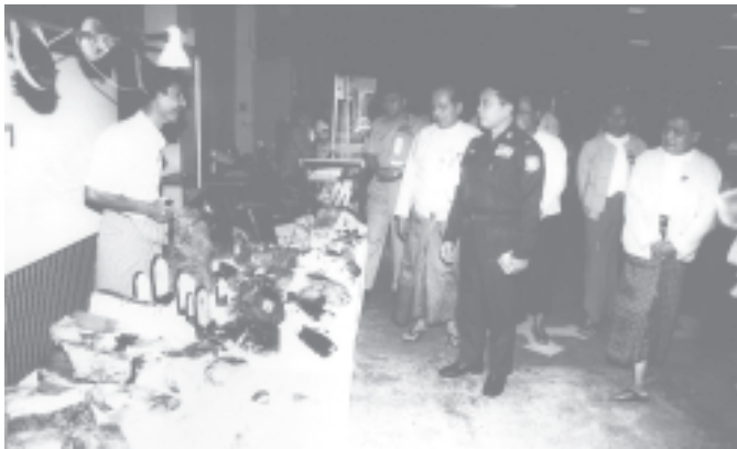
Minister Brig-Gen Ohn Myint inspects gems and jade being displayed at Mid-Year Gem Emporium. (News on page 1)