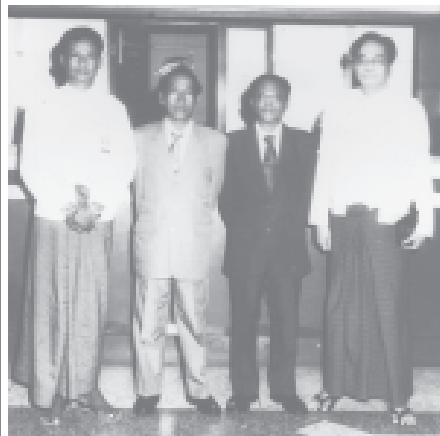
Myanmar journalist delegation being seen at the airport before departure for Laos. — MNA

and Development Councils, religious organizations and lay persons. Deputy Minister Brig-Gen Thura Aung Ko read out the message of condolence over the demise of the Sayadaw and U San Thin Hlaing of the Religious Affairs Department, the brief biography of the Sayadaw. The minister, the deputy minister and officials offered alms to the Sayadaws and members of the Sangha. Yaw Sayadaw Tipitakadhara Tipitaka Kovidha Tipitakadhara Dhamma Bandagarika Agga Maha Pandita Bhaddanta Sirinda Bhivamsa delivered a sermon to the congregation, followed by sharing of merits gained. Next, the Sayadaws, members of the Sangha, nuns, the minister, the deputy minister and the congregation paid homage to the dead body of the Sayadaw and cremated it. — MNA