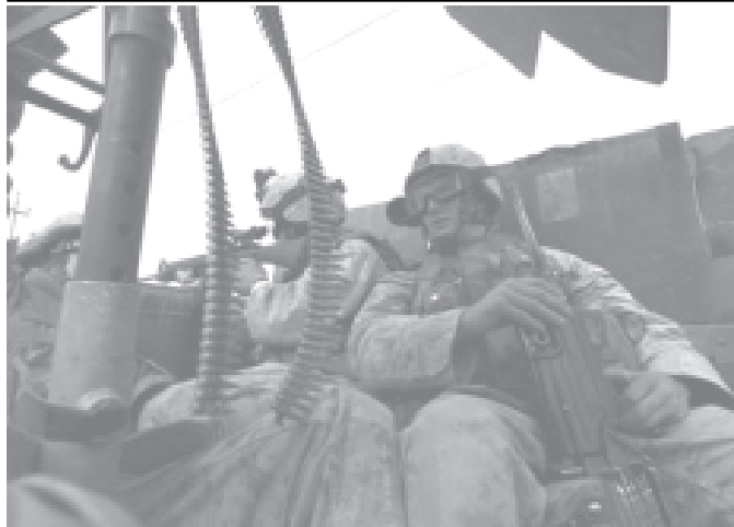
US Marines from the 2nd Battalion, 5th Marine Regiment patrol in a Humvee in Ramadi, Iraq, on 25 Oct, 2004.

A car bomb also targeted an Australian military convoy 350 yards from their country's embassy in Baghdad, killing three Iraqi civilians and wounding nine people, including three Australian soldiers who suffered minor injuries, Iraqi and coalition officials said.—Internet