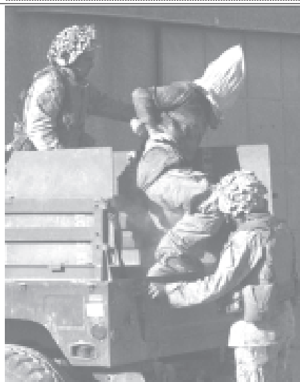
US Marines lead a hooded detainee out of a military vehicle in Fallujah recently.