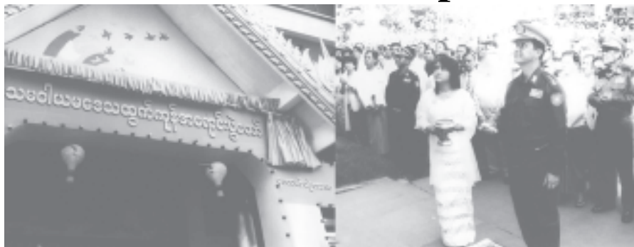
Minister Col Zaw Min unveils the billboard of Cooperative Products Exhibition.

Altogether 211 booths of cooperative societies from states and divisions, private companies and economic enterprises are opened there. At the exhibition, skill demonstrations of the hand-crafted materials including tapestries, earthen pots and wooden sculpture and traditional weaving of Palaung nationals in Shan State will be given. The exhibition last till 1 November and will be kept open from 9 am to 9 pm daily. With a view to developing the market for goods, securing the market for