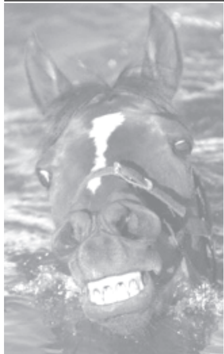
A horse takes a swim. A South African preacher baptised a thoroughbred racehorse called "Running Reverend" in front of his congregation in a controversial bid to raise church funds.