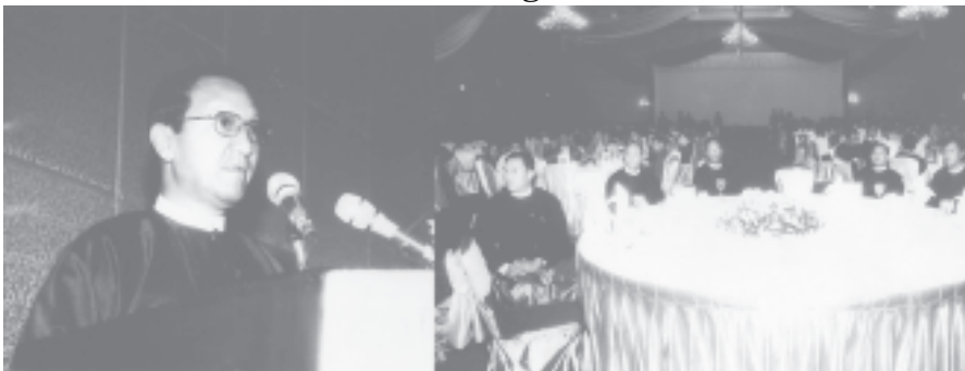
Minister Brig-Gen Thura Aye Myint delivers a speech at the dinner to make opening of the Junior World Ranking Tennis Tournament.

YANGON, 26 Oct — Myanmar Tennis Federation held a dinner to mark the opening of the first Myanmar Junior World Ranking Tennis Tournament Grade-5 at Traders Hotel here this evening.