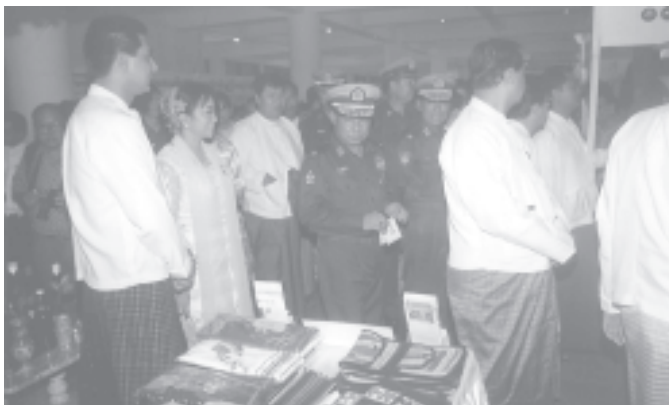
Ministers and officials view the booths of the Cooperative Products Exhibition. —UMFCCI

Officials of the respective camps warmly welcomed the 29 persons who exchanged arms for peace and fulfilled their needs. And, more persons in armed groups are willing to exchange arms for peace. — MNA