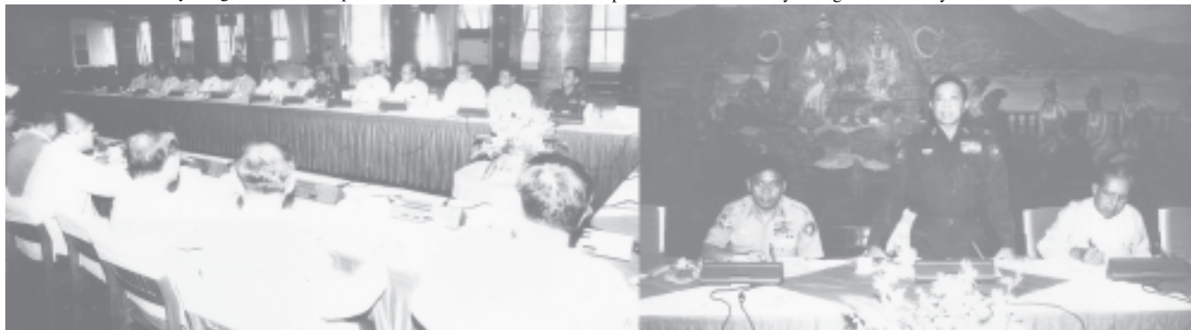
Minister for Mines Brig-Gen Ohn Myint delivers an address at the second meeting of the Mid-Year Gem Emporium Central Committee. — MNA

Next, the meeting ended with the concluding remarks by Patron of the Central Committee Minister Brig-Gen Ohn Myint. — MNA