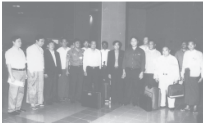
Delegates to Mekong Ministerial Initiative Against Trafficking Senior Officials Meeting being welcomed at the airport. — MNA

They were welcomed at Yangon International Airport by responsible personnel of the Reception and Accommodation Subcommittee. — MNA