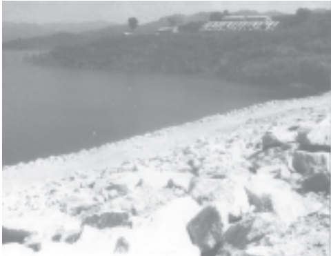
Minister Maj-Gen Htay Oo inspects Paunglaung Dam project on 23 October. — A & I

The minister then met engineers and local people and inspected construction of the dam and rural development works. — MNA