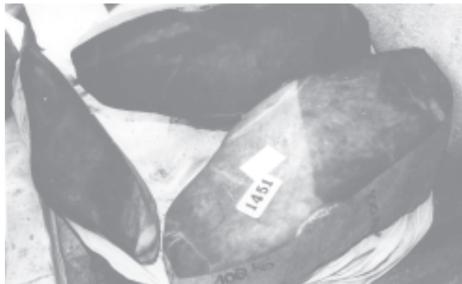
Jade lot worth 1,810,000 euros being displayed at Mid-Year Gem Emporium. (News on page 1)