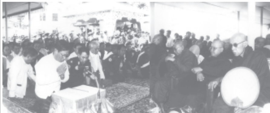
Deputy Minister for Religious Affairs Brig-Gen Thura Aung Ko reads out the message of condolence over the demise of Sayadaw Siri Bhaddanta Revata.