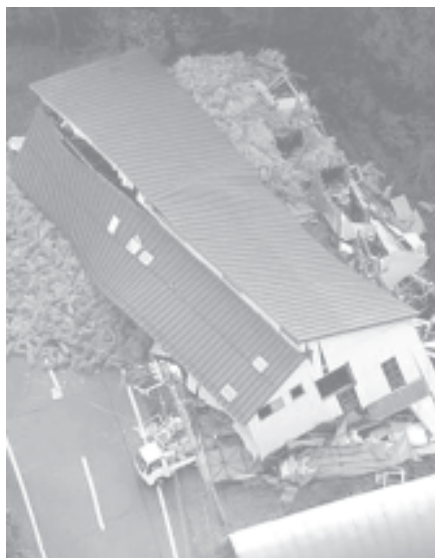
An aerial view shows a collapsed warehouse, after a powerful earthquake hit in Yamakoshi village, in northwestern Japan on 24 Oct, 2004. Strong aftershocks shook northern Japan after the country's deadliest earthquake in nine years killed at least 21 people and injured more than .