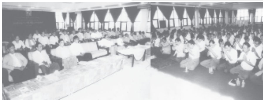
The respect-paying ceremony of the accounts office of the Ministry of Defence in progress. — MNA

Staff of the office paid respects to elders and presented gifts. — MNA