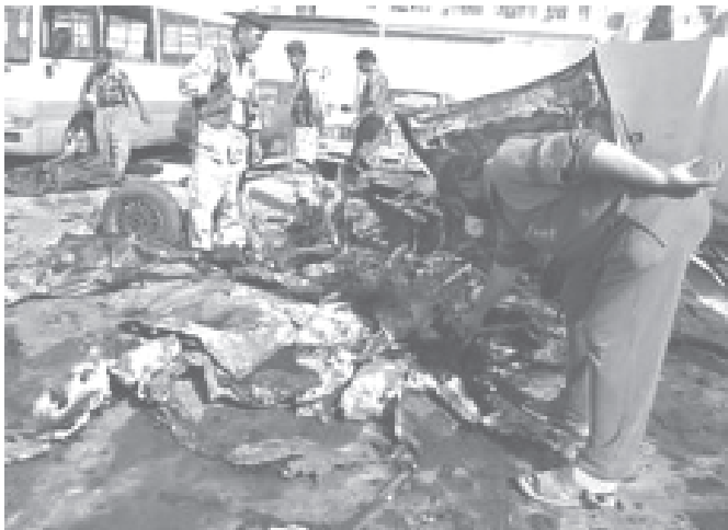
Members of an Iraqi security force inspect the scene of a car bomb attack outside the office of Mosul city governor in northern Iraq, on 25 Oct, 2004.

They struck again in the northern city of Mosul in a double car bombing against the governor and other administrative targets that killed four people and wounded four others. —Internet