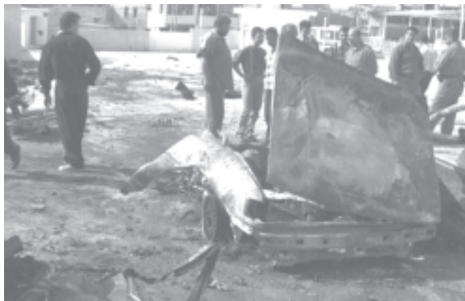
Iraqis arrive at the scene after Iraqi government buildings and a military convoy in two near-simultaneous bomb attacks were targeted in Mosul, northern Iraq, killing three people, the US military and Iraqi officials said.

Clinton took a softer line on Iraq, saying Kerry would "get more help and better management" and put more emphasis on chasing down members of the al-Qaeda organization blamed for the September 11, 2001, attacks on the United States.