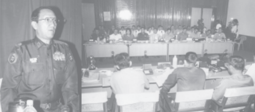
Minister Brig-Gen Thura Aye Myint delivers an address at the coordination meeting on 6th Asian Wushu Championship.