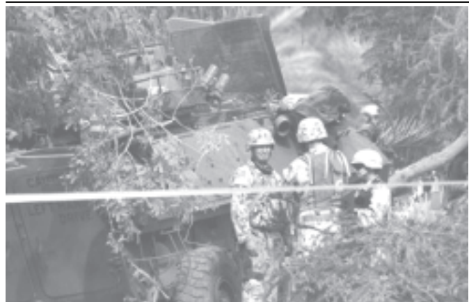
Australian soldiers arrive to secure the area after a bomb exploded on 25 Oct, 2004 near a US and Australian military convoy in central Baghdad.