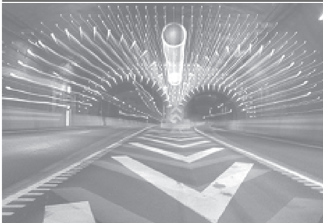
Tunnel vision : One of the art decorated exits in the tunnels of Stockholm's "Sodra Lanken" (Southern Link) that was opened to traffic after seven years of construction to a cost of around 880 million euros.