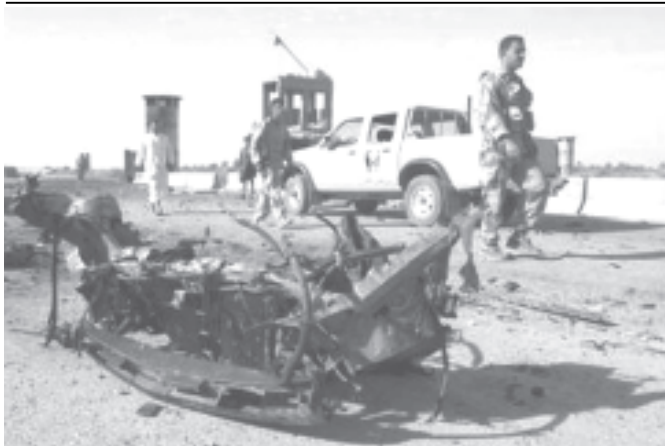
Iraqi national guardsmen arrive at the scene of a suicide car bomb attack north of Baghdad, on 23 Oct, 2004. A suicide bomber blew up his vehicle near a checkpoint manned by Iraqi National Guards in the village of Ishaqi, near Samarra, north of Baghdad, killing four guards. A guard officer said six guards were also wounded in the attack.

"One hears from many quarters the argument that the time has come for a renewed commitment and effort, but that the parties cannot succeed left to themselves," he said. "The international community's more vigorous engagement is therefore an indispensable ingredient if we want to end the violence and bring fresh hope of peace in the Middle East," he stressed.—MNA/Xinhua