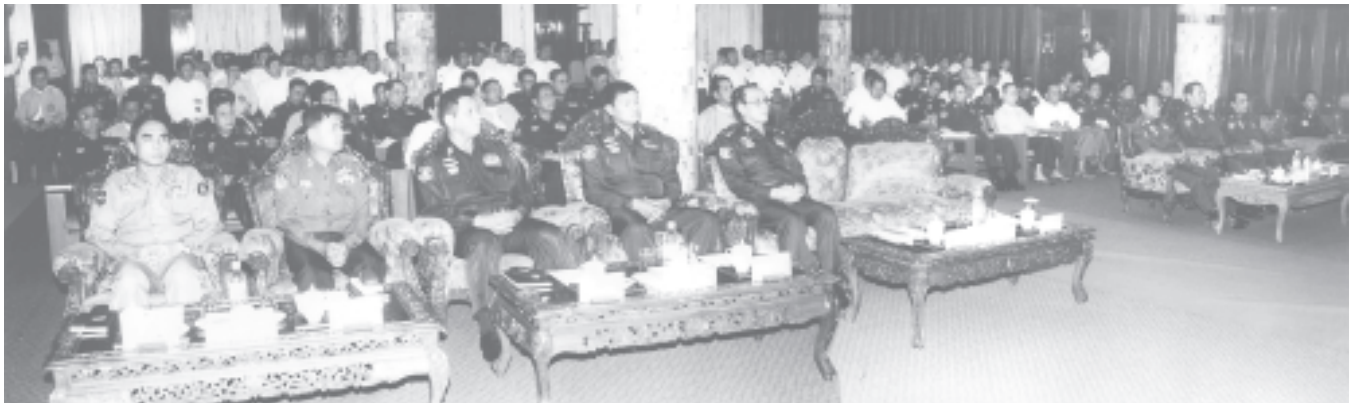
Prime Minister Lt-Gen Soe Win, officials and entrepreneurs attend the ceremony to clarify the latest developments of the State.

YANGON, 24 Oct—The Mahosadha Marionette Contest of the 12th Myanmar Traditional Cultural Performing Arts Competitions continued for the fourth day at the National Theatre on Myoma Kyaung Street here at 7 pm today.