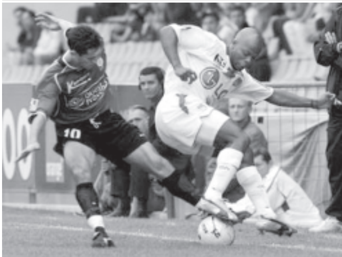
Olympique Lyon's Sylvain Wiltord (R) fights for the ball against Rafik Saïfi of Istres during their French Ligue 1 soccer match in Nîmes on 23 Oct, 2004.