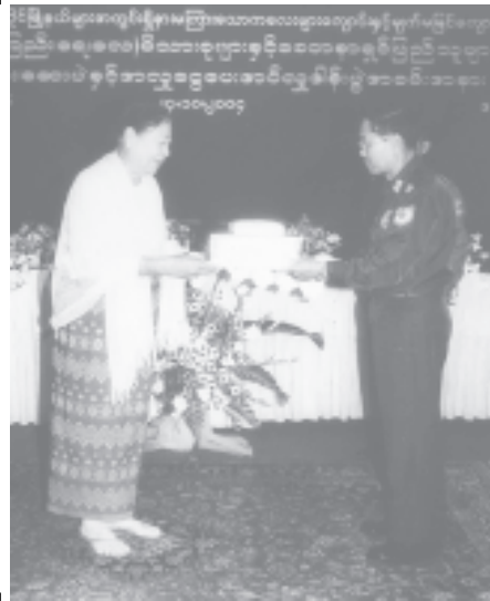
Commander Maj-Gen Myint Swe presents cash donations to an official.