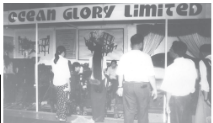
Entrepreneurs visit Ocean Glory Ltd's Booth at Myanmar Furniture Fair-2004.