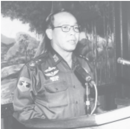
Prime Minister Lt-Gen Soe Win explains changes occurred in the State.

YANGON, 24 Oct — Member of the State Peace and Development Council General Thura Shwe Mann and Prime Minister Lt-Gen Soe Win this evening attended the ceremony to clarify changes taken place