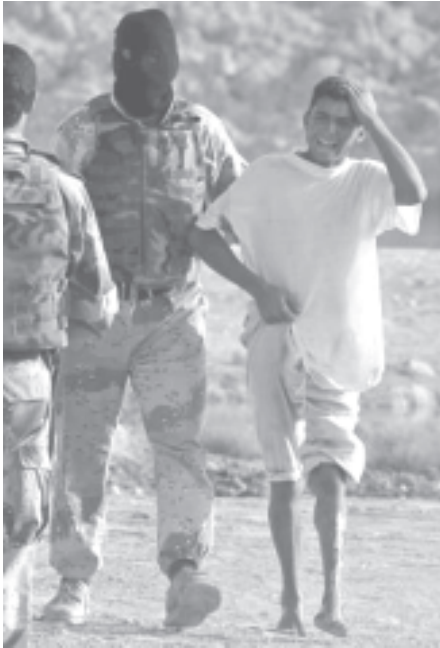
An Iraqi detainee shouts that he is innocent as he is guided by a national guardsman following his arrest during a joint raid in the town of Gurna, some 40 km north of Basra, on 23 Oct, 2004.