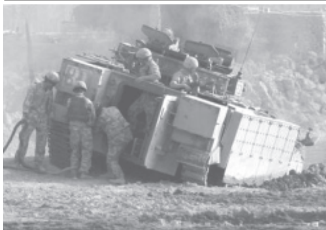
British Army soldiers tie a rope to an armoured vehicle which became stuck in the mud during a joint raid in the town of Gurna, some 40 km north of Basra, on 23 Oct, 2004.