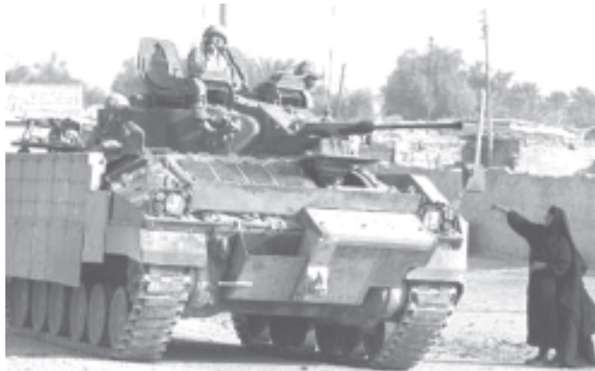
An Iraqi woman asks British soldiers, sealing off her area, for permission to walk to her house during a joint raid in the town of Gurna, some 40 km north of Basra, on 23 Oct, 2004.