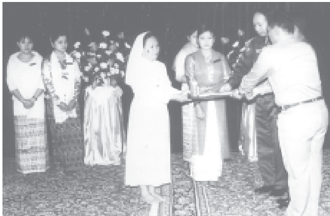
Senior military officers present cash donations to an official at the donation ceremony to Home for the Aged and Schools for the Deaf and Dumb.—MNA

Today's donations to three schools for the deaf and dumb in Mayangon, Kyimyindine and Dagon Townships were 179 bags of rice, 62 viss of edible oil, 123 viss of gram, 615 viss of iodized salt, 123 tubes of tooth paste, 1,560 bottles of traditional medicines and K 2,638,070.—MNA