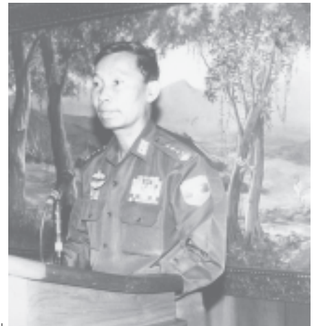
General Thura Shwe Mann clarifies matters regarding the latest developments of the State to national entrepreneurs.

Present on the occasion were the members of the State Peace and Development Council, the Commander-in-Chief (Navy), the Commander-in-Chief (Air), the chairman of Yangon Division Peace and Development Council commander of Yangon Command, ministers, the Chief Justice, the Attorney General, the Auditor-General, the Yangon Mayor, senior military officers of the Ministry of Defence, deputy ministers, officials of the SPDC Office, directors-general and managing directors of the departments and enterprises under various ministries, the president and vice-presidents of the Union of Myanmar Federation of Chambers of Commerce and Industry and executives, computer entrepreneurs, agricultural and livestock breeding entrepreneurs, exporters and importers, hotel and tourism entrepreneurs, construction entrepreneurs, rice traders, oil merchants, beans and pulses and sesame traders, fishery entrepreneurs, industrialists, rice millers, medicine and medical equipment traders, textile entrepreneurs and officials of Myanmar Mercantile Marine Development Association. Regarding the changing situations in the State, General Thura Shwe