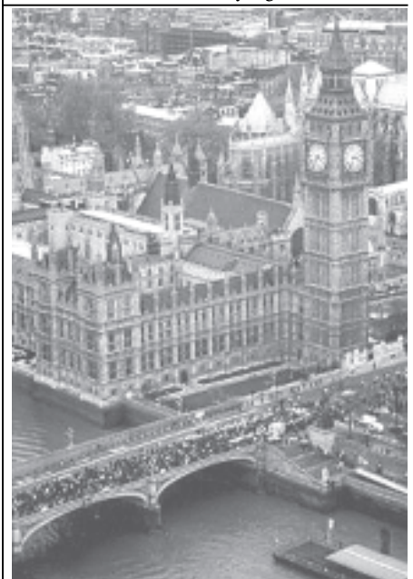
Aerial view of the Houses of Parliament in London. British MPs were forced to defend themselves for claiming more than 140 million dollars in expenses last year. — INTERNET

According to the local statistics, Wuhan has become the largest French investment destination and more than 30 French companies established businesses here, bringing about investment of 2.2 billion US dollars to the city. French Air Force's "Patrouille de France" gave its famous aerobatics show in the city six days ago. — MNA/Xinhua