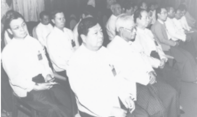
National entrepreneurs attend the ceremony to explain current changes of the State.