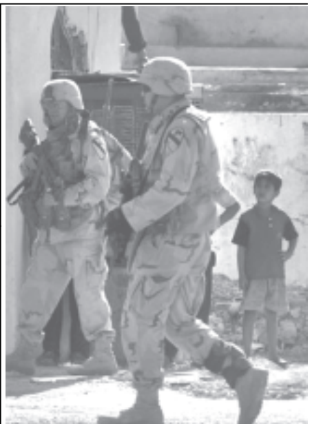
An Iraqi boy watches US Army soldiers patrolling the centre of Sadr City, Baghdad, Iraq on 23 Oct, 2004.