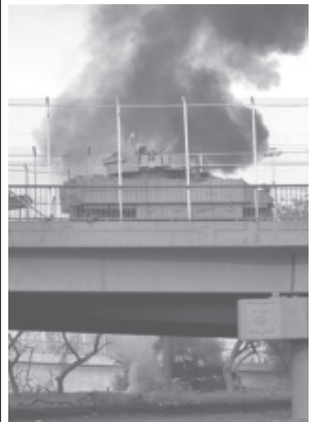
A US Army tank passes by a burning US Army Bradley armoured vehicle next to a junction on the airport highway in Baghdad, Iraq, on 23 Oct, 2004.