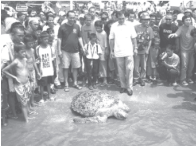
Residents watch as a sea turtle is released on the shore of Zamboanga on the island of Mindanao. An endangered sea turtle, caught in a net by fishermen off the southern Philippine city of Zamboanga, received a new lease of life after local officials learned of its plight and arranged to have it freed.