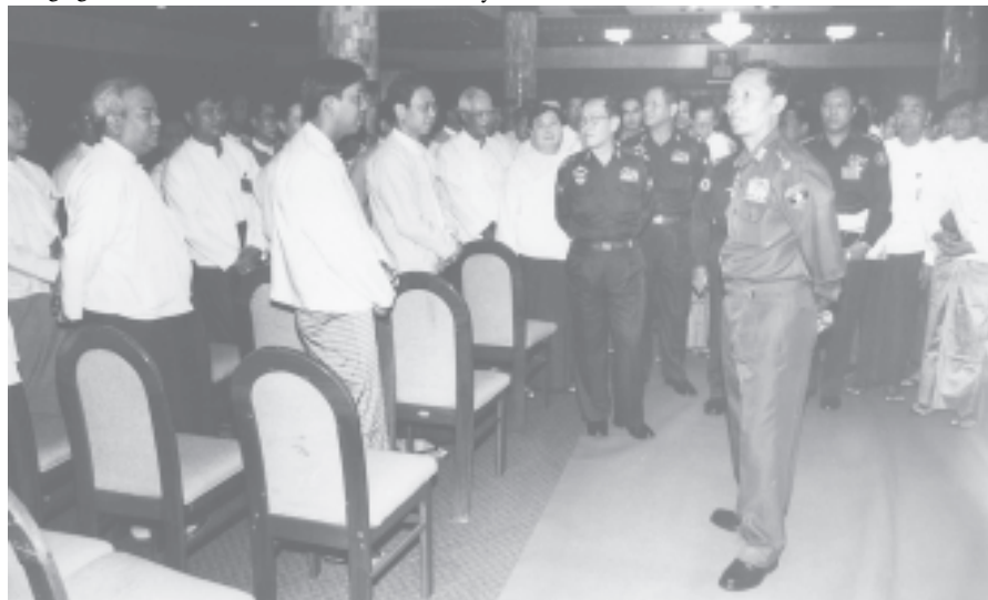
General Thura Shwe Mann and Prime Minister Lt-Gen Soe Win cordially converse with national entrepreneurs at the ceremony to clarify the latest developments of the State.— MNA

have gone against the policies, rules and regulations, or if they are unable to serve the interest of the people, they are to be removed from the posts.