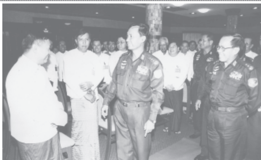
General Thura Shwe Mann and Prime Minister Lt-Gen Soe Win cordially converse with national entrepreneurs at the ceremony to clarify the latest developments of the State.— MNA

border trade at Muse, the border gate, the Government had to take action against service personnel who were involved in bribery and corruption of kyat billions, that were detrimental to the interest of the State and traders. The State Peace and Development Council, upholding the national interest in the fore, has taken actions whenever there arises a situation adversely affecting the national policies—non-disintegration of the Union, non-disintegration of national solidarity and perpetuation of sovereignty. Former Prime Minister General Khin Nyunt had been permitted to retire for his violation of Tatmadaw discipline such as insubordination, for his involvement in the bribery