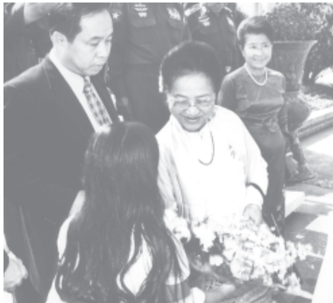
Two Indian Children of Indian Embassy present bouquets to Senior General Than Shwe and wife Daw Kyaing Kyaing at the airport before their departure for India to pay a State Visit.