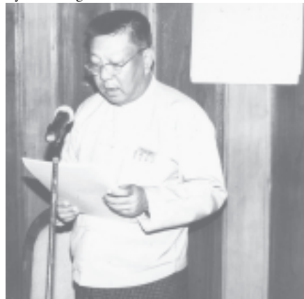
Deputy Director-General U Zaw Myint Pe of State Peace and Development Council Office acts master of ceremonies.