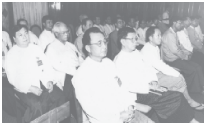
National entrepreneurs attend the ceremony to clarify the latest developments of the State.

He said all present at the meeting were the ones who were far-sighted, well experienced at home and abroad and very well-to-do. Therefore, he said, the clarification was made with the aim of enabling them to make efforts for serving the interest of the State, the people and the private sector after realizing the changing situations in the State. In his address to the traders and national entrepreneurs, Prime Minister Lt-Gen Soe Win said the government will continue to practise and implement the political, economic and social policies of the State; and the objectives of the State will not be changed for any reasons. He said the