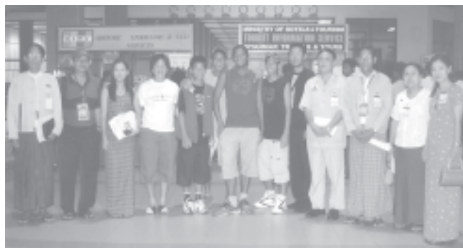
Indonesian tennis players arrive at Yangon International Airport.— SPED