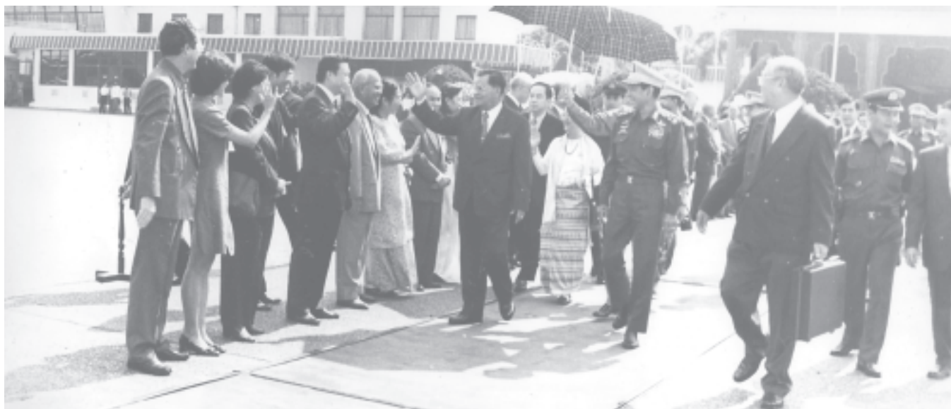
Senior General Than Shwe and wife Daw Kyaing Kyaing being seen off at Yangon International Airport by diplomats of foreign missions and officials of UN agencies.