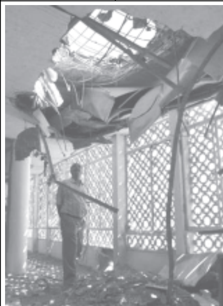
An Iraqi views the damage to the building in Baghdad after it was hit by a rocket on 23 Oct, 2004. —INTERNET

Schroeder and Russian leaders have met each other on a regular basis and the investment conference, sponsored by the German Foreign Ministry and economic sectors, is expected to attract businessmen from both countries. —MNA/Xinhua