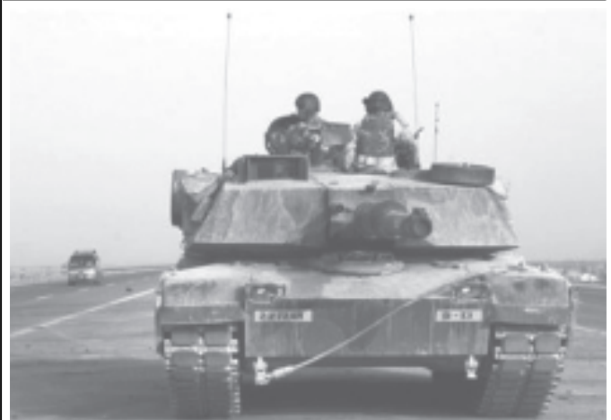
A US Army 2nd Infantry Division tank crew watches traffic on a highway near Ramadi, Iraq, on 17 Oct, 2004.

မြို့ပြဧကစာ၊ မိန်းပါးလေလွင့်၊ ထုတ်ကုန်မြင့်