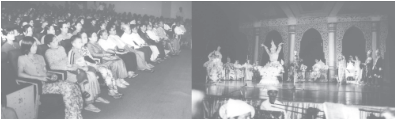
Ramayana Drama Contest of the 12th Myanmar Traditional Cultural Performing Arts Competitions in progress.