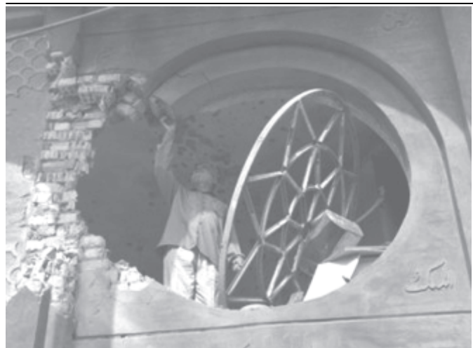
An Iraqi man inspects the damage at a building in Fallujah, outside Baghdad, Iraq, on 18 Oct, 2004 after US troops pounded the guerilla stronghold of Fallujah with airstrikes and tank fire overnight.—INTERNET

A group of 45 Labour MPs demanded a Commons vote before any decision was made. Amid signs that he was considering backing down, the Prime Minister insisted there was no political aspect and that no decision had been taken prior to a reconnaissance yesterday by British officers of the area where they would be based.— Internet