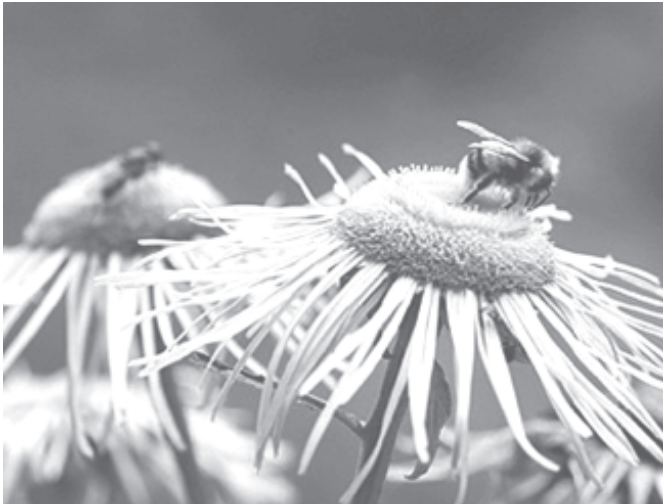
A bee is seen on a flower on the way to Sumela Monastery, northeast of Turkey. A Turkish honey called "mad honey" for its reputed ability to induce euphoria and stimulate an erection contains a poison that can cause vomiting and heart problems.