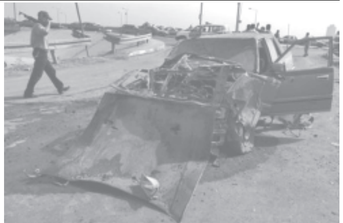
An Iraqi police officer guards the area after a road side bomb attack on the airport road in Baghdad, Iraq, on 18 Oct 2004. One man was killed and two others injured when their car hit the explosive device, according to witnesses at the scene.