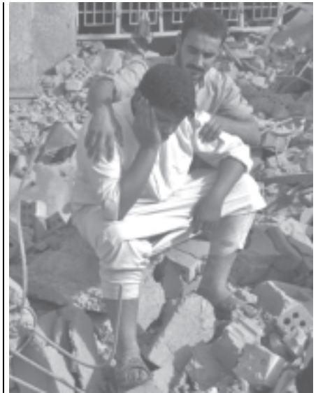
Iraqi men comfort each other as they sit in the rubble of their destroyed house in Fallujah, outside Baghdad, on 18 Oct, 2004.