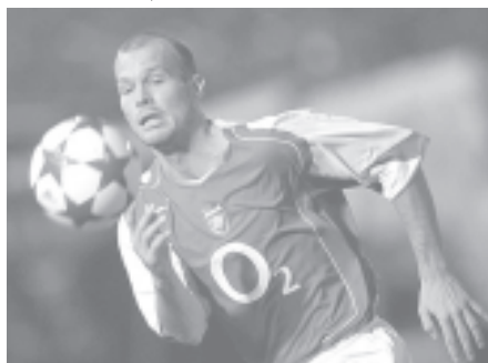
Champions in Athens: Arsenal's Fredrik Ljungberg runs for the ball during a group E European Champions League football game against Panathinaikos in Athens.

MONACO, 20 Oct — Last season's finalists Monaco took a big step towards the knockout stages of the Champions League with a 2-1 victory over Olympiakos Piraeus in Group A on Tuesday.