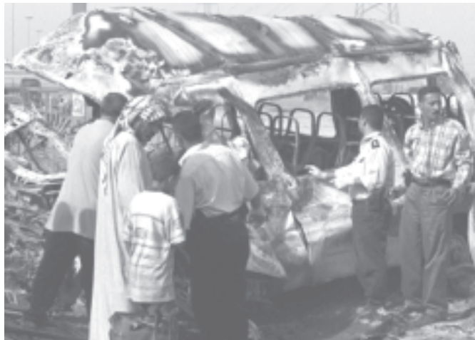
Iraqis and Iraqi police look inside a destroyed civilian vehicle following an attack on a main road in Baghdad on 18 Oct, 2004.