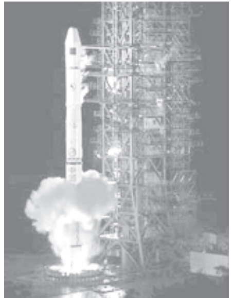
A Chinese Long March 3-A carrier rocket blasts off from the Xichang launching site on 25 May, 2003.

China has launched a meteorological satellite capable of monitoring natural disasters.—INTERNET