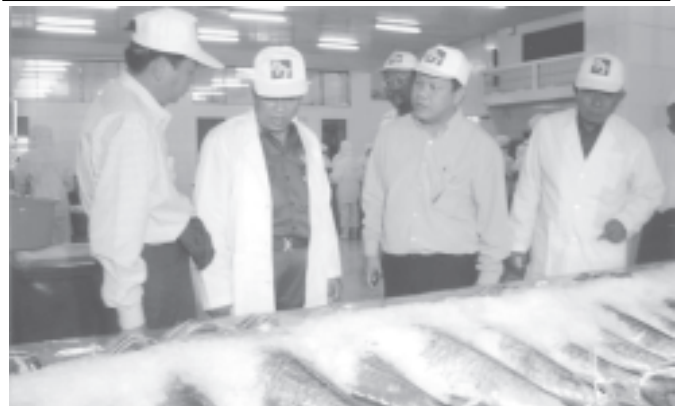
Minister for Livestock and Fisheries Brig-Gen Maung Maung Thein inspects 1,000-ton capacity cold storage of Pyi Phyto Tun Co in Kyunsu Township.

After the opening ceremonies, the minister went to Cooperative Bank (Head Office) and also inspected banking services. — MNA