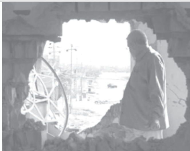
An Iraqi man views damage to his house after it was hit during a US air raid conducted over the western city of Fallujah, on 18 Oct 2004.

In addition, new energy sources such as water power, wind power, solar energy and biomass have big potential for use in China. But now, these sources account for less than 1 per cent in China's current energy use, Qu said.— MNA/Xinhua