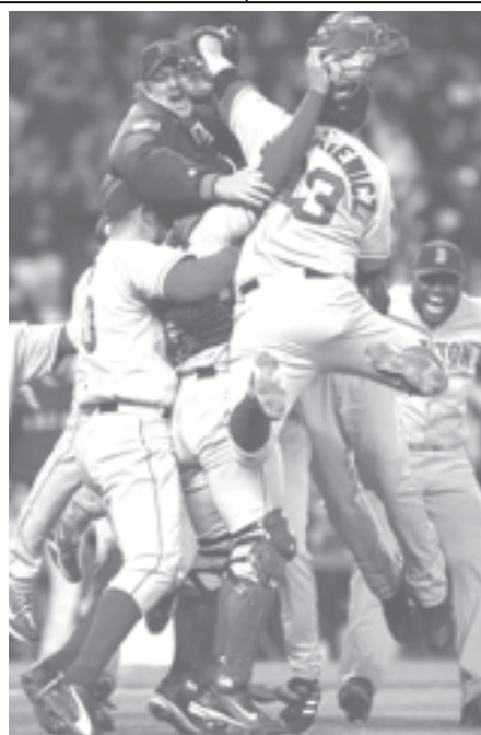
Boston Red Sox players celebrate after defeating the New York Yankees 10-3.