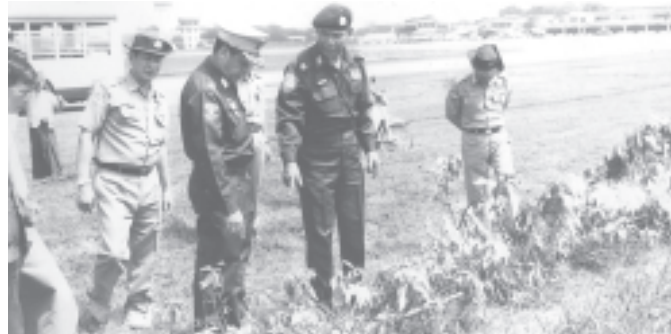
Minister for Transport Maj-Gen Thein Swe inspects growing of flowery plants between the runway and taxiway of Yangon International Airport.—TRANSPORT

inspected test run of the mill. The deputy factory manager reported on production process of the mill.