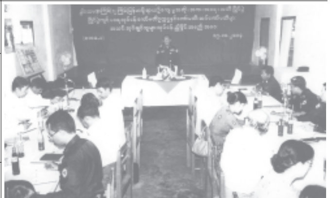
No 3 Military Region Commander Col Tint Hsan delivers a speech at the meeting with sub-committees and officials of state/division performing arts teams. —MNA (News on page 2)

The mayor also inspected paving of road in North Okkalapa Township, digging of drains for proper drainage and efforts for drinking water supply. —MNA