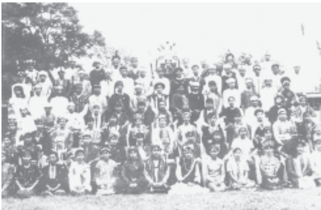
National races studying at the University for Development of National Races.

(Translation: TMT) Myanma Alin+Kyemon: 19.10.2004.