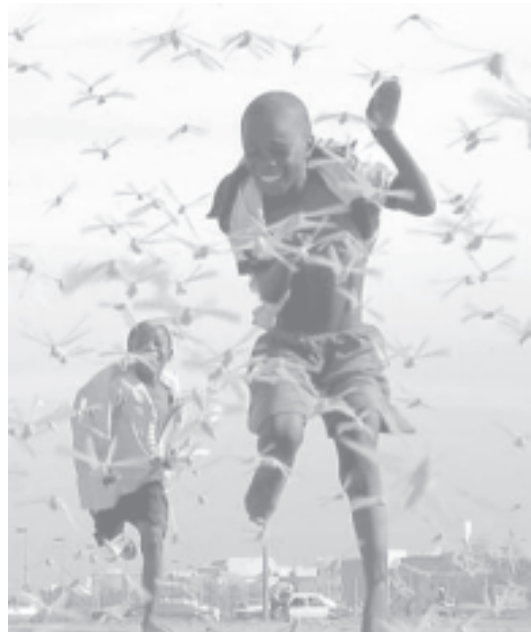
The desert locust infestation that descended on West and Central Africa this year is likely to return in 2005 and officials will have to be better prepared to avoid major damage to crops, experts said on October 18, 2004. INTERNET