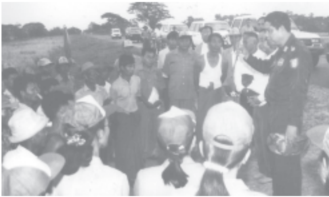
Minister Maj-Gen Htay Oo meets with local farmers in Tawwi Village in Nyaunglebin Township, Bago Division (News on page 1).