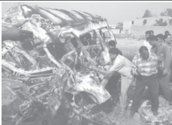
Iraqis try to dismantle a destroyed mini bus after a roadside bomb exploded while the bus was passing by in the centre of Baghdad, on 18 Oct 2004.