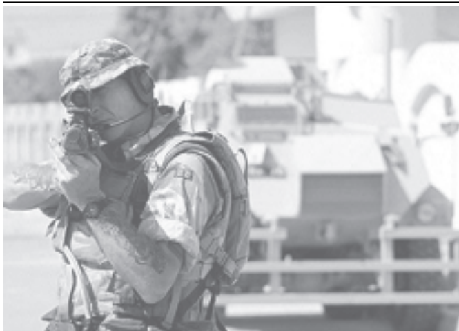
A British soldier on patrol in the southern Iraqi city of Basra on 18 Oct, 2004.

The Defence Department said in a statement quoted by the Times that the military was providing a "safe, humane and professional detention operation at Guantanamo".