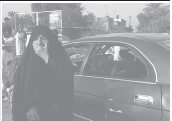
An Iraqi woman reacts after viewing a destroyed car in Baghdad, Iraq on 18 Oct, 2004, after a car bomb exploded near a police patrol in Baghdad's Jadiriyah district, killing at least six people, including three police officers, and wounding 26.