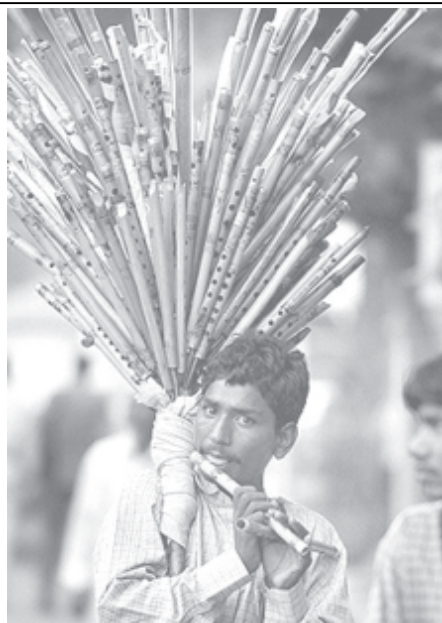
Flutes for sale : An Indian hawker carrying a variety of flutes, demonstrating the quality by playing, as he walks through the streets of Mumbai selling his wares.