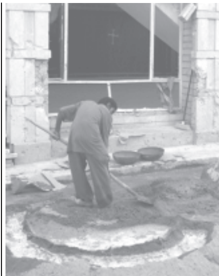
An Iraqi worker mixes cement outside a damaged building a day after it was bombed in the Mansour neighbourhood of Baghdad on 17 Oct, 2004.