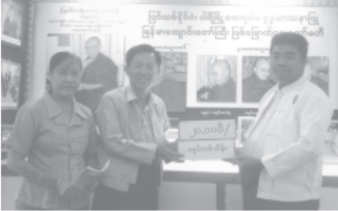
Wellwishers presented K 120,000 for construction of Theravada Buddha Sasana Myanmar Missionary Monastery in Paris, France, through an official on 19 October.