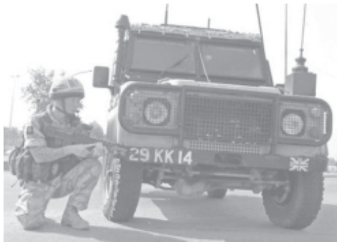
A British Army soldier arrives at the site of a roadside bomb attack in Basra on 17 Oct, 2004.

More than 40 people were killed last month after a suicide bomber detonated his vehicle outside a recruitment centre in the heart of Baghdad.