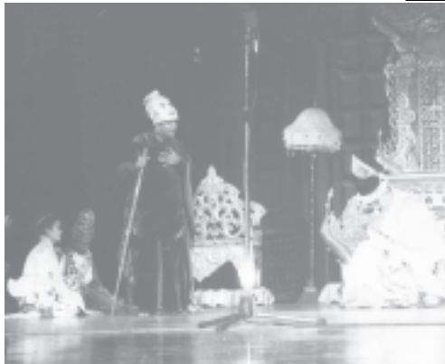
Minister Maj-Gen Kyi Aung and judges watch the Ramayana Drama contest.

performing arts competitions Deputy Minister for Culture Brig-Gen Soe Win, members of the work committee and subcommittees, artistes and the