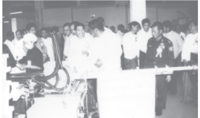
Ministers U Aung Thaung and Maj-Gen Saw Lwin view production process of new soap factory of Dragon Group Co. — INDUSTRY-1

ceremony, Minister U Aung Thaung said he is delighted at the emergence of the new factory as the State is rendering assistance to the private industries. After the ceremony, the ministers and guests viewed round the production process of the factory. — MNA