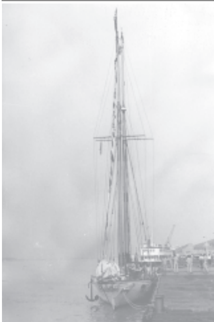
69' LWL Fife Schooner "Sunshine" luxury yacht built by the Myanmar Shipyards. (News on page 1) — MNA

Eleven contestants took part in the amateur level (women's) dance contest and 13 contestants (See page 9)