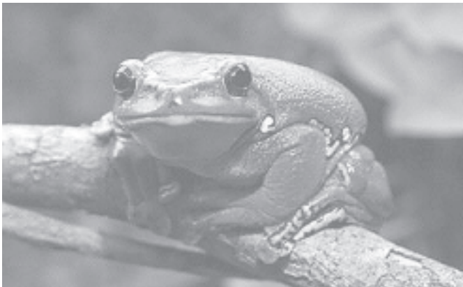
A Chinese Jumping Frog ( polypedates dennysi). Scientists warned that about one third of amphibians are under threat of extinction.

al-Hariri summoned US Ambassador Jeffrey Feltman today to express concern and opposition to...a request by members of Congress to US President George Bush to freeze assets of Lebanese and Syrian officials to pressure Lebanon and Syria," Hariri's office said in a statement.