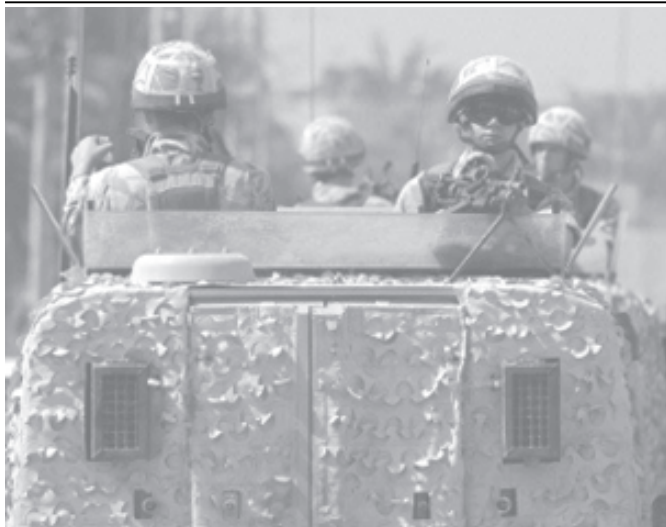
British troops on patrol in Baghdad, Iraq on 18 Oct, 2004.

The green zone houses Iraqi government offices and US forces in Baghdad.