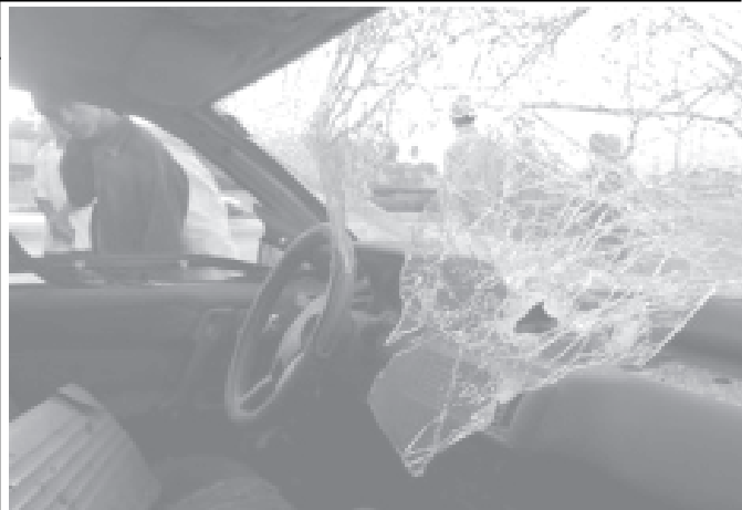
An Iraqi boy inspects a destroyed car in Baghdad, on 18 Oct, 2004, after a car bomb exploded near a police patrol in Baghdad's Jadiriya district, killing at least six people, including three police officers, and wounding 26. —INTERNET

It quoted a security source at the airport as saying there was nothing wrong with the passports of the deportees, adding the stamped visas were referred to specialists to make sure of their validity. —MNA/Xinhua