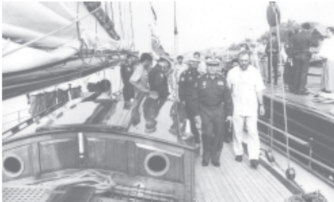
Minister Maj-Gen Thein Swe inspects 69' LWL Fife Schooner "Sunshine" yacht built by Myanma Shipyards. — MNA

structed in accordance with International Maritime Standard. Myanma Shipyards, since 1995, successfully constructed various kinds of ship for Indonesia, Singapore and China. — MNA