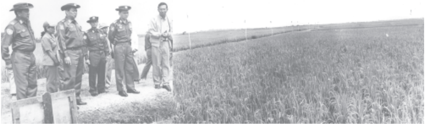
Secretary-2 Lt-Gen Thein Sein inspects cultivation of Shweyinaye paddy in Ingaung Village in Heho Township.—MNA