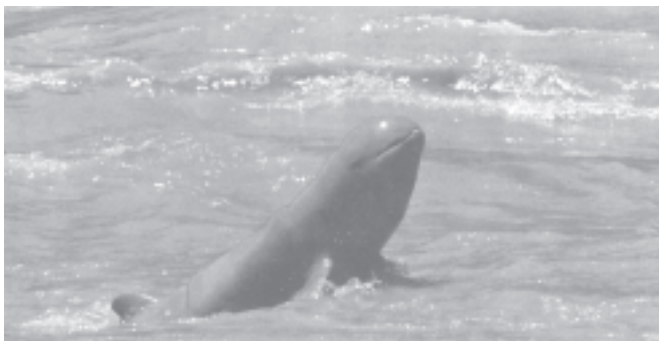
An Ayeyawady dolphin in the Ayeyawady River.