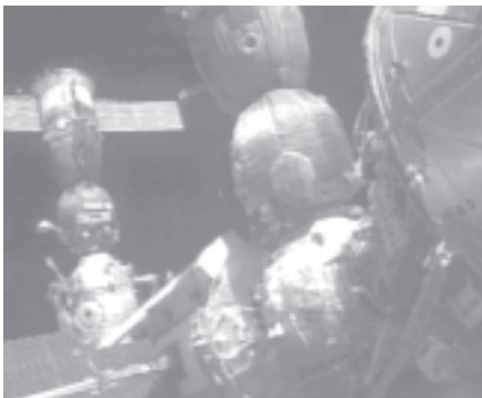
A frame grab shows the Soyuz space craft (L) moments before docking manually with the International Space Station (ISS) on 16 Oct, 2004. The Russian spacecraft delivered three astronauts to the station on Saturday, smoothly overcoming docking system problems which had delayed its launch.