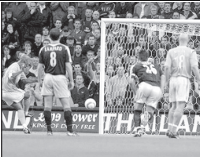
Manchester City's French Nicolas Anelka (L) scores a penalty to make it 1-0 against Chelsea during their Premier League football match at The City of Manchester Stadium on 16 Oct, 2004.

Roma are away to German club Bayer Leverkusen in the Champions League on Tuesday.