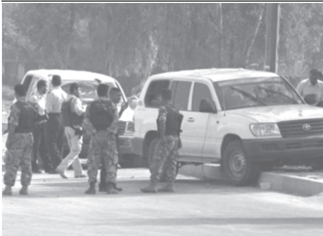
Iraqi police secure the area after a civilian convoy was hit by a roadside bomb in Basra, southern Iraq on 17 Oct, 2004. The bomb hit a convoy of four cars, seriously injuring one person according to Basra police.