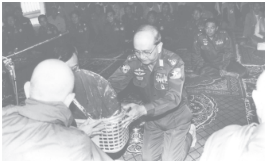
Lt-Gen Thein Sein donates alms to a Sayadaw at the rice-offering ceremony of Tatmadaw families.

The Secretary-2 and party inspected livestock