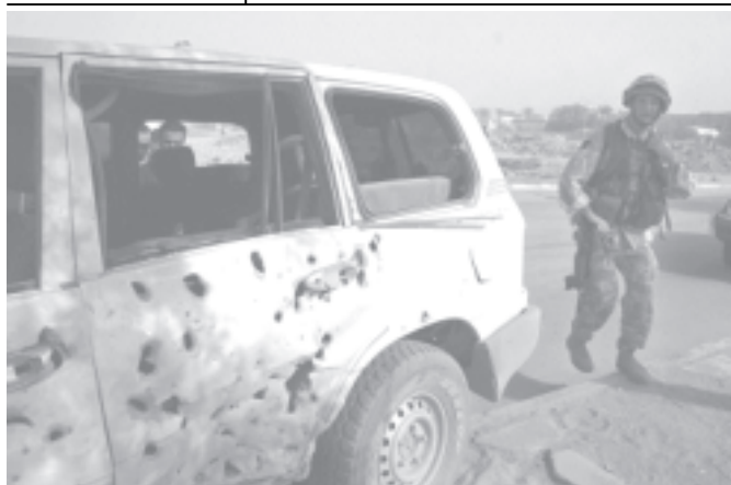
A British soldier walks around inspecting a damaged vehicle following an attack, in the southern city of Basra, 500 kms from Baghdad. US troops and guerillas battled on the edge of the rebel-held Iraqi city of Fallujah after deadly night-time air raids and nine policemen were killed in an ambush south of the capital recently.