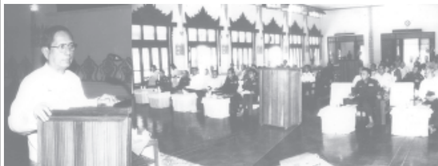
Minister Brig-Gen Thura Myint Maung gives a speech at the work coordination meeting.

The minister said that thanks to the efforts of the Religious Affairs Ministry and other related ministries, preparations for the summit have been almost completed. The whole world has accepted Myanmar as a true Theravada Buddhist country, he noted. He stressed the need to make collective efforts for the glory of Theravada Buddhism and the nation. Chairmen and secretaries of the subcommittees presented accomplishments sector-wise. Other participants also gave suggestions. The minister gave the concluding remarks.