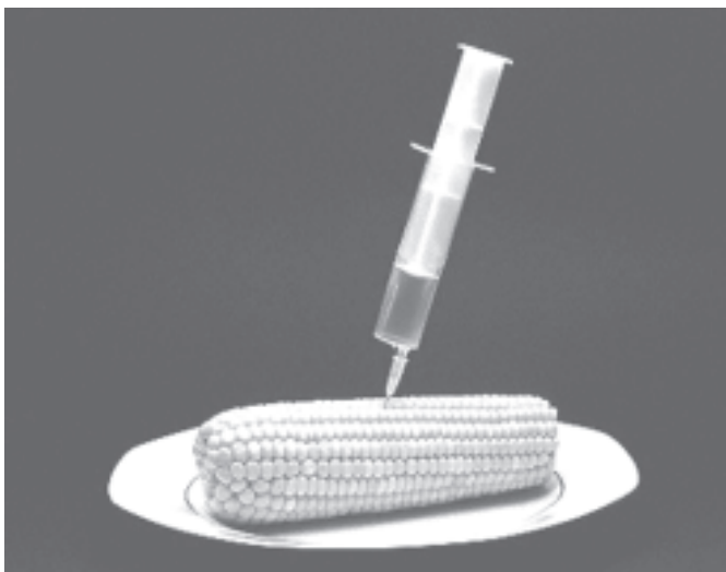
Syringe in a corn ear symbolizing genetically modified organisms. Asian giants India and China are accelerating investment in biotechnology research to fight the odds in agriculture and feed their teeming millions, say scientists and officials. — INTERNET

"We are one family and I hope the cooperation between the two nations will develop further." — MNA/PTI