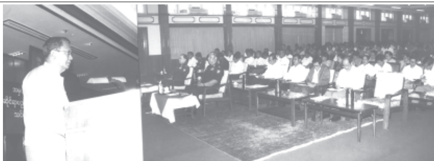
Minister U Aung Thaung addressing the opening of on-job training course No 2/2004. — INDUSTRY-1