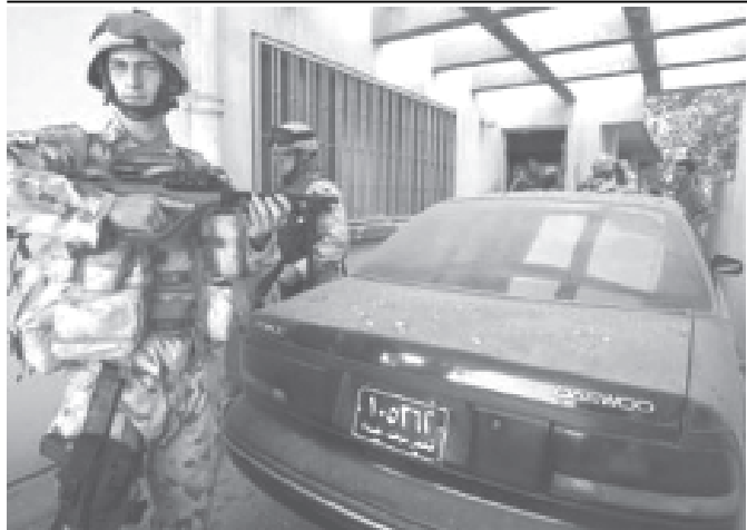
A soldier stands guard at the garage of a civilian house after it was attacked by mortar fire in central Baghdad, on 17 Oct, 2004.