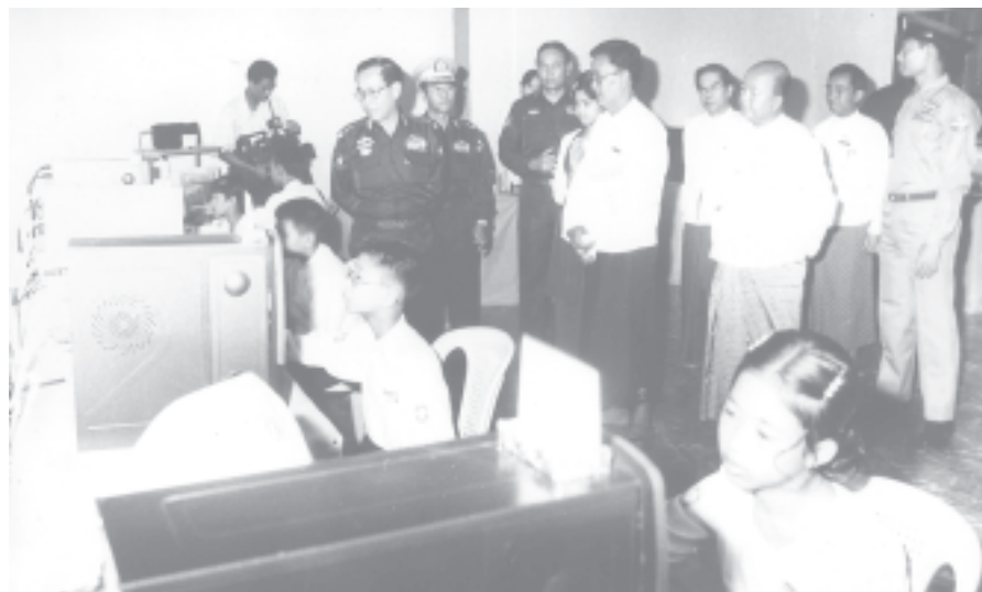
Secretary-1 Lt-Gen Soe Win inspects a multi-media classroom.