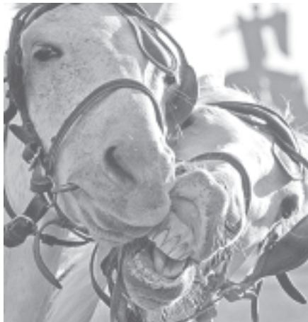
Two horses play with each other while waiting for tourists, at the Palace Square in St Petersburg.

မြန်မာ့စွေတာ၊ မိန်းပါလေလွင်၊ ထုတ်တုန်မြင့်