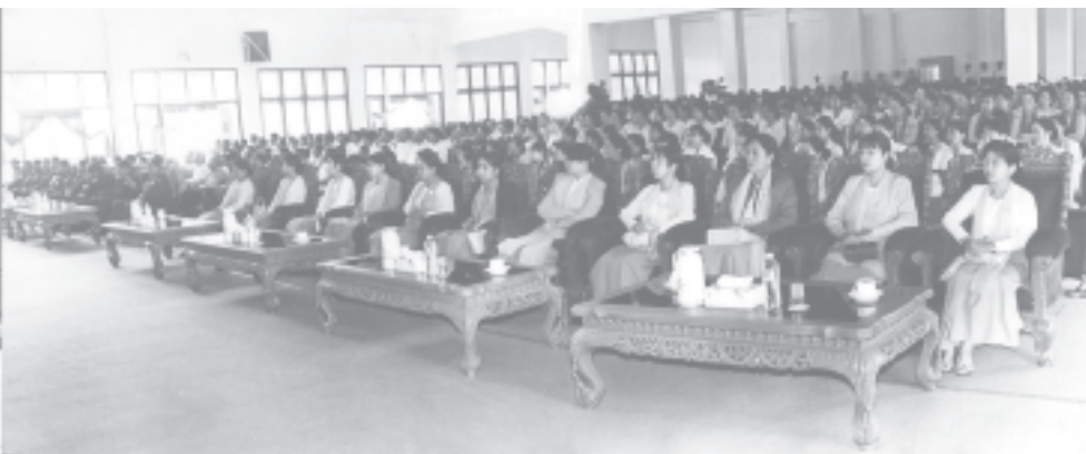
Lt-Gen Thein Sein gives a speech in meeting with departmental staff, social organizations and townselders in Kengtung.