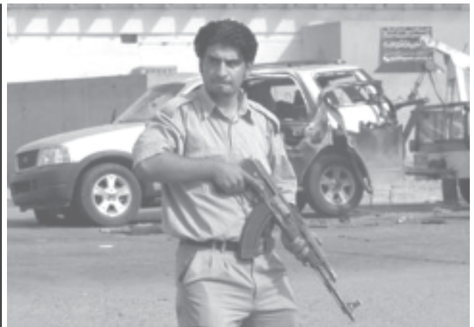
An Iraqi security guard stands near a damaged four-wheel drive vehicle after it came under attack in eastern Baghdad on 17 Oct, 2004.