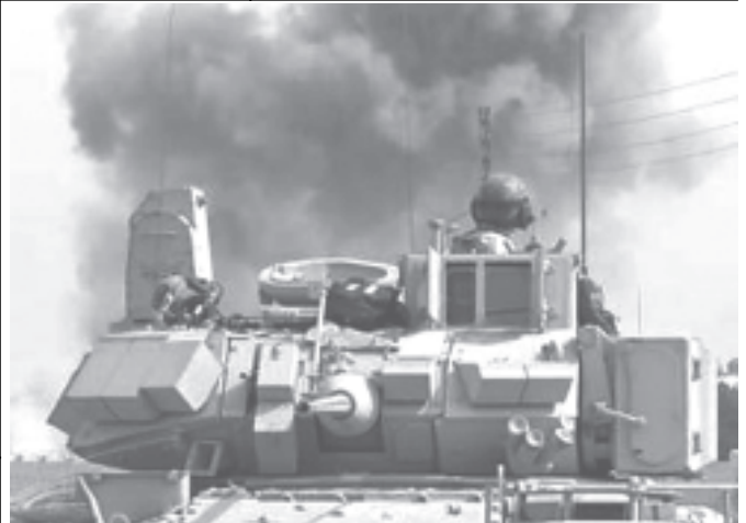
A US Army soldier, on top of a Bradley armoured vehicle, views smoke rising into the sky after his colleagues destroyed a seized Katyusha rocket, which was found in an empty yard next to a school in Baghdad, on 17 Oct, 2004.