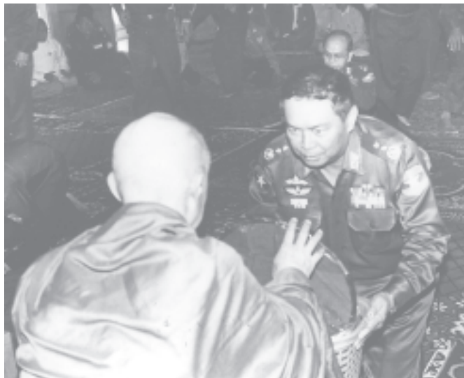
Lt-Gen Aung Htwe offers alms to a Sayadaw at the rice-offering ceremony of Tatmadaw families. (News on page 16)