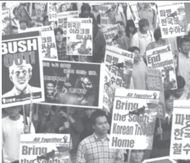
South Korean protesters march in central Seoul during an anti-war rally in Seoul on 17 Oct, 2004.