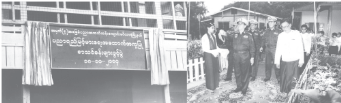
Secretary-1 Lt-Gen Soe Win unveils the signboard of multimedia classrooms of Mingaladon Township BEHS No 5.