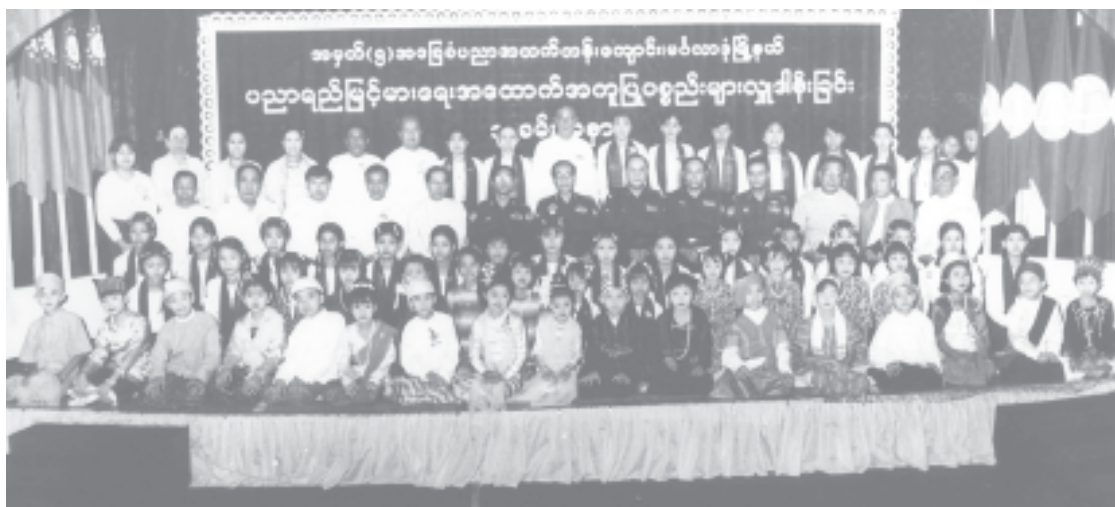
Secretary-1 Lt-Gen Soe Win poses for photos together with teachers and students of No 5 Basic Education High School in Mingaladon Township.

Also present at the opening ceremony were Yangon Division PDC Chairman Yangon Command Commander Maj-Gen Myint Swe, Minister for Communications, Posts and Telegraphs and for Hotels and Tourism Brig-Gen Thein Zaw, Yangon City Development Committee Chairman Mayor Brig-Gen Aung Thein Lin, Deputy Minister for Education U Myo Nyunt, senior military officers, officials of the SPDC Office, heads of