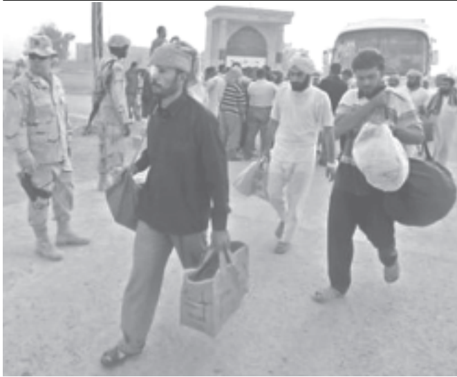
Former prisoners walk from a detention centre in the Baghdad suburb of Amriya, on 17 Oct, 2004 after being released from custody.