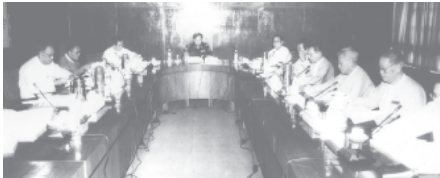
Coordination meeting of alternate chairmen of National Convention plenary session in progress.