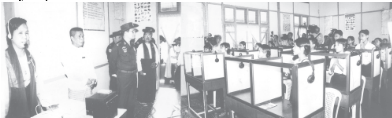
Prime Minister General Khin Nyunt inspects students learning at multimedia room at Latutta No 2 HEHS.