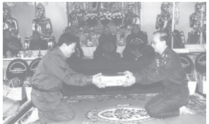
Secretary-2 Lt-Gen Thein Sein accepts donations for building Yan Taing Aung Hsutaungpyae Pagoda. (News on page 16)

Thanks to the concerted efforts of the Tatmadaw, departments and social organizations, the region will enjoy food sufficiency in the coming year. But greater and harmonious efforts are needed to produce surplus food in the region and to further develop economic, social and other sectors. Myanmar is a home to over 100 na-