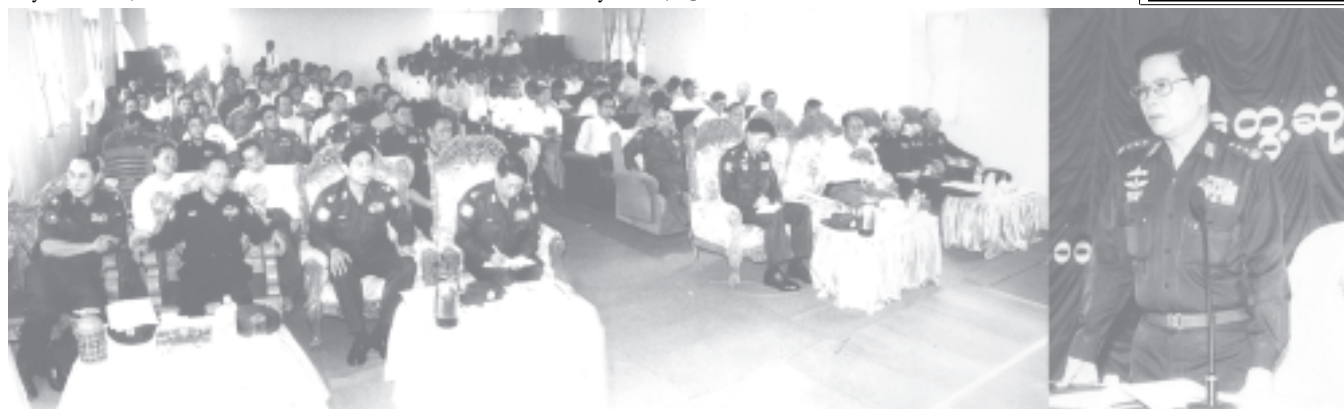
Prime Minister General Khin Nyunt meets departmental personnel, social organizations and townselders in Thabaung Township.

Perspectives Bring honour to the nation through sports (page 2)