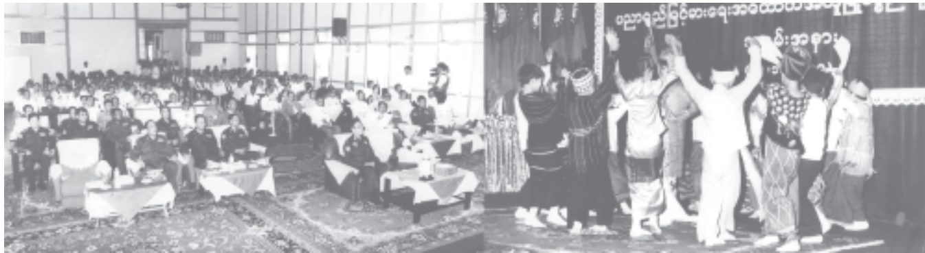
Secretary-1 Lt-Gen Soe Win enjoys entertainment programmes presented by students of BEHS-1, Mingaladon.