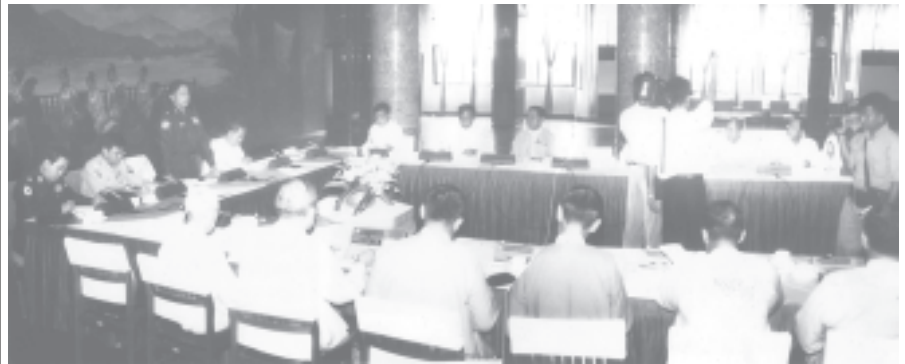
Minister Brig-Gen Ohn Myint delivers a speech at the meeting on review of the 41st Myanmar Gems Emporium.