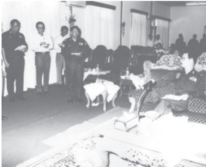
General Khin Nyunt gives instructions on 200-ton pulp mill project (Thabaung) at the briefing hall of the project.