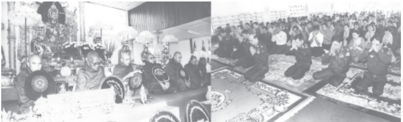
Secretary-2 Lt-Gen Thein Sein and party receive the Five Precepts from Sayadaw Bhaddanta Narada. (News on page 16)