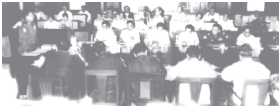
Minister Brig-Gen Pyi Sone delivers an address at Work Committee for Ensuring the Emergence of Myanmar Copyright.