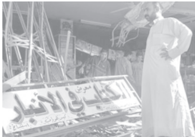
A local resident examines the debris after the central library was destroyed in overnight clashes between guerillas and the US Army in Ramadi, 70 miles west of Baghdad, Iraq, on 11 Oct, 2004.

MPs criticised Mr Blair for refusing to make a statement to the Commons and some are demanding a fresh debate on Iraq. Jack Straw, the Foreign Secretary, will seek to quell their protests by making a Commons statement today. He will highlight the corruption among French and Russian nationals identified in the report for taking oil from Saddam intended for the UN oil-for-food programme.—Internet