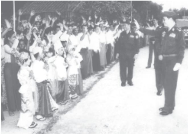
Prime Minister General Khin Nyunt greets locals in Ngapudaw.

and Development Council Lt-Col Kyi Htut Win, members of district/township Peace and Development Councils, departmental officials, members of social organizations and townsmen. Afterwards, General Khin Nyunt went to Labutta No 2 BEHS and attended the opening ceremony of the multimedia rooms of the school.