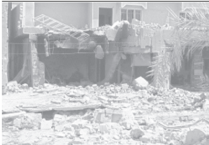
A destroyed home in Fallujah, where the US military has launched two airstrikes, flattening two buildings on 11 Oct, 2004.