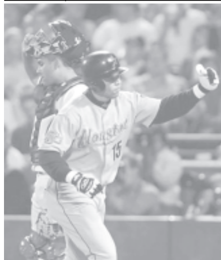
Houston Astros, Carlos Beltran (R) pumps his fist to teammates as he passes Atlanta Braves catcher Johnny Estrada after a solo home run in the third inning of Game 5 of the National League Division Series in Atlanta, on 11 Oct, 2004. Beltran also hit a home run in the sixth inning as the Astros went on to win 12-3 and advance against the St Louis Cardinals in the NLCS.

Kerry Zavagnin collected a quick throw-in from DaMarcus Beasley and found McBride, who lashed the ball in from 17 metres.