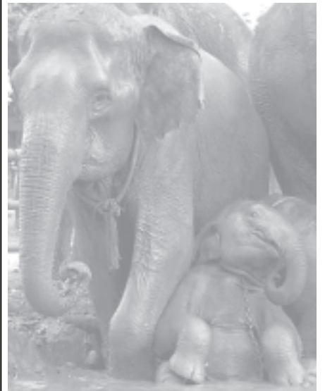
Elephants play in the mud at the Royal Elephant House in Ayutthaya, 50 miles north of Bangkok on 8 Oct, 2004. The elephant is on the 'Ten Most Wanted Species' list of animals most at risk from unregulated international trade and their fate will be at issue at the 13th Convention on International Trade in Endangered Species (CITES) in Bangkok.

Suicide stands as the biggest cause of death in harm cases, killing 250,000 to 350,000 people each year. The number of those killed in vehicle accidents ranks the second. And the third cause is drowning, said the experts. — MNA/Xinhua