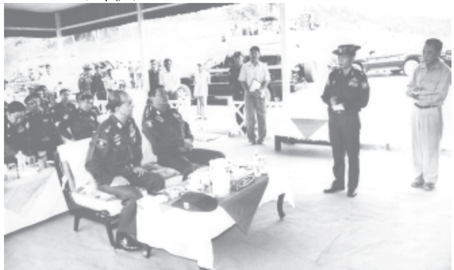
Lt-Gen Thein Sein gives instructions to officials at Kaukwe Creek Dam project briefing hall.