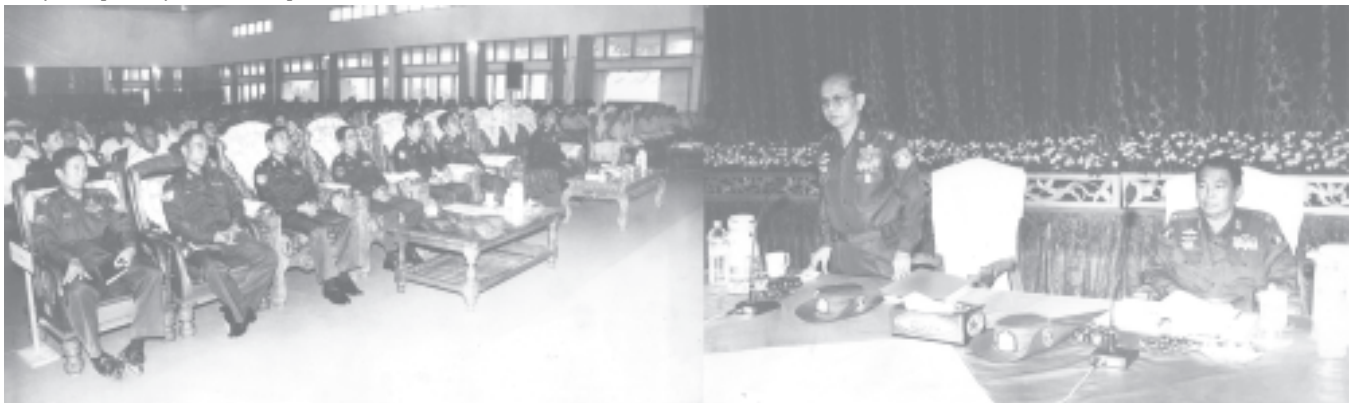
Secretary-2 Lt-Gen Thein Sein meets departmental officials, local people and members of social organizations in Lashio.