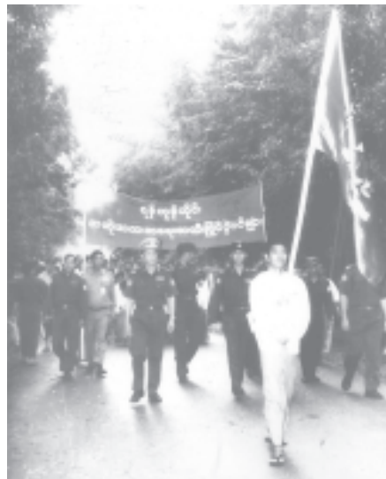
Participants to 12th Myanmar Traditional Performing Arts Competitions of Yangon Division arrive at No 1 Transit Centre (Bayint Naung).

Similarly, managers, judges and participants from Kachin and Kayin States arrived there in the evening.