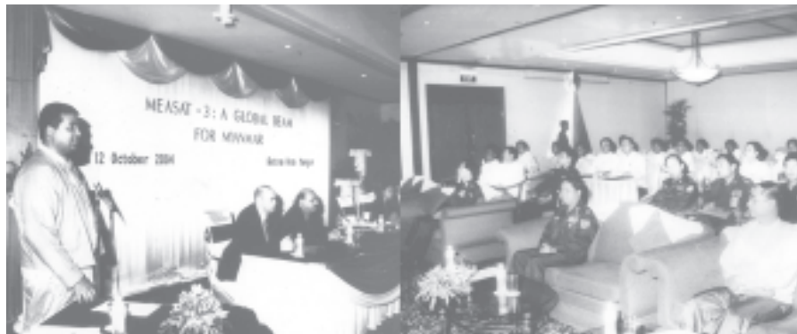
A presentation of MEASAT-3 satellite of Malaysia at Sedona Hotel and Minister for Information Brig-Gen Kyaw Hsan attends the presentation.