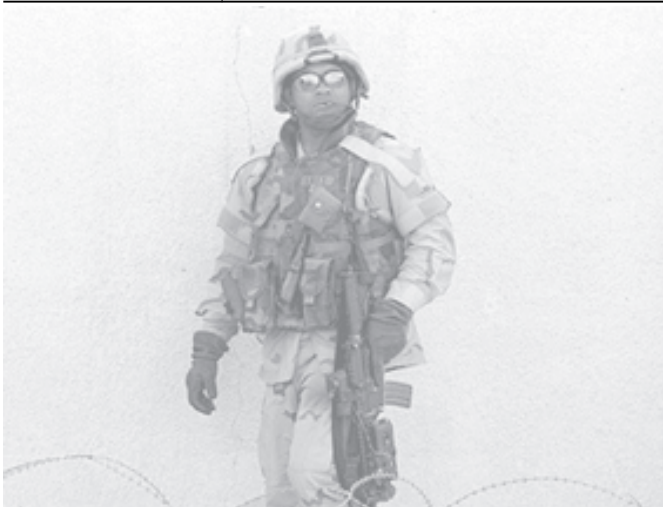
A US soldier patrols with others (unseen) the area close to designated Iraqi police station, serving as a drop-off centre in the Sadr City neighbourhood of Baghdad, on 11 Oct, 2004.