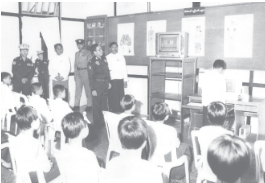
Secretary-1 Lt-Gen Soe Win inspects multimedia teaching room of Mingaladon Township No 1 BEHS.