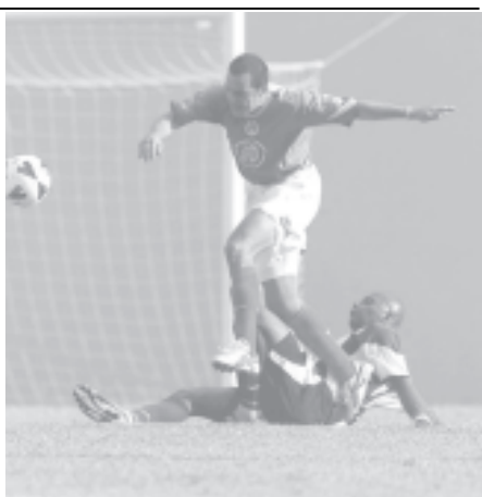
Mexico's Cuahutemoc Blanco, top, takes control of the ball against an unidentified St Vincent and the Grenadines player, during a CONCACAF World Cup qualifier in Kingstown, St Vincent, on Sunday, 10 Oct, 2004. Mexico won 1-0.