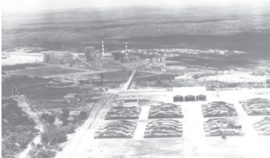
Progress of 200-ton Pulp Mill (Thabaung) of Ministry of Industry-1. — MNA

The 200-ton pulp mill is situated near Hlegyat Village in Thabaung Township. It was completed on 30 April 2004 and it started to test run. Plans are under way to build a 50-ton high quality paper factory and a 60-ton newsprint factory. — MNA