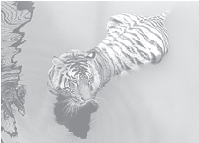
A Royal Bengal tiger cools down by taking a bath in a pond at Dhaka's National Zoo.