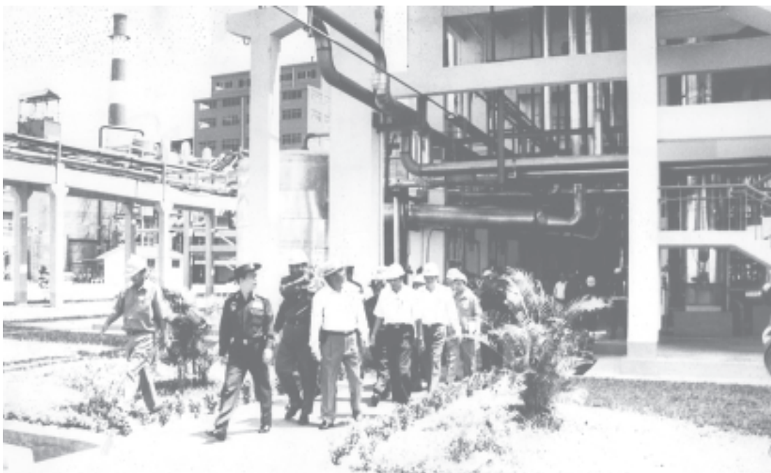
Prime Minister General Khin Nyunt looks into Thabaung Pulp Mill (200-ton).

The Prime Minister and party were accorded welcome by Ayeyawady Division PDC Chairman South-West Command Commander Maj-Gen Soe Naing, Deputy Minister for Industry-1 Brig-Gen Kyaw Win, (See page 8)