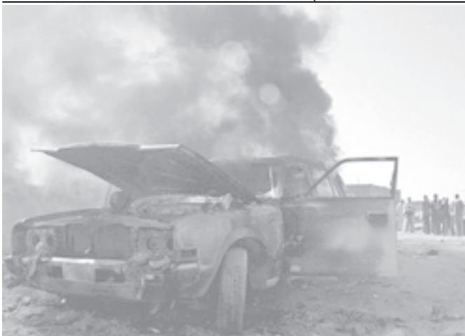
Iraqis watch a burning civilian vehicle following a car bomb attack in Mosul, Iraq, on 11 Oct, 2004.

Permanent Secretary for Health, Welfare and Food Carrie Yau said Saturday that the programme's objective is to encourage participating primary schools to promote the culture of caring for mental health. "The programme is aimed at inculcating teenagers to adopt a positive attitude in facing up to pressure," she said. About 100 schools signed a charter to affirm their support for the programme at Saturday's launching ceremony. They will organize activities like visits to rehabilitation centres, seminars, interactive activities or school-based activities to promote mental health.—MNA/Xinhua