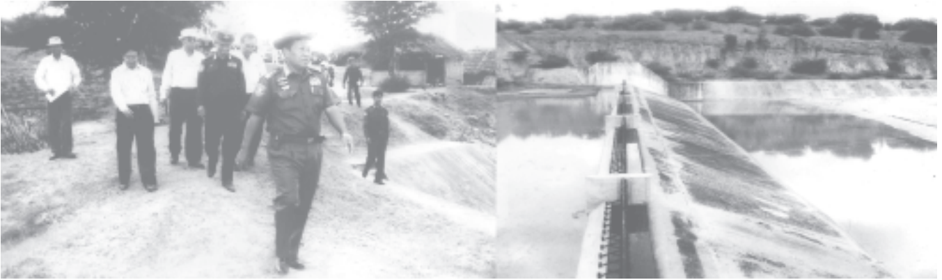
Lt-Gen Ye Myint of the Ministry of Defence inspects Mondine Dam.