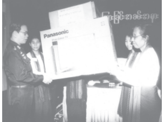
Prime Minister General Khin Nyunt presents a TV set to the township education officer.

The main requirement of the State is self-sufficiency in rice. Only when