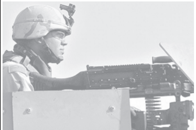
A US soldier of the 1 Cavalry Division secures an area near a police station in Baghdad's Sadr City neighbourhood on 12 Oct, 2004.

Around 100 officers and detectives were involved in the hunt for the girl's killer, and stop-and-search inquiries would take place over the weekend, Fish said. A post mortem examination is to be carried out later on Saturday.—MNA/Reuters