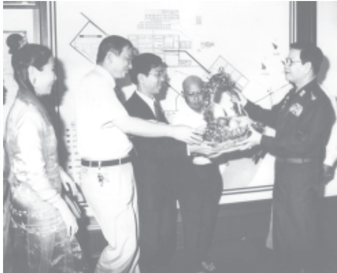
General Khin Nyunt presents fruit basket to China Metallurgical Construction (Group) Corporation Mr Xu and party. — MNA