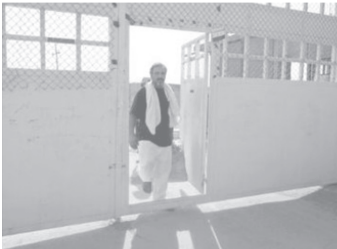
An Iraqi prisoner walks out of the US-run detention facility of al-Amiriya following his release in the capital Baghdad, on 11 Oct, 2004.

Militants have seized scores of foreign hostages in Iraq since April. At least 32 have been killed, including Turkish truck drivers.— Internet