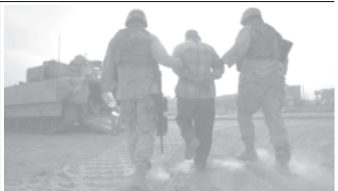
An Iraqi detainee is taken away after a search operation in the Sadr City neighbourhood of Baghdad, Iraq on 9 Oct, 2004.