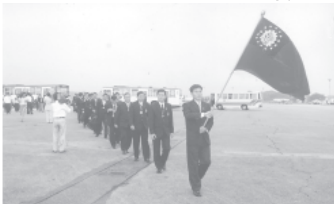
Finance & Revenue Soccer Team, champions of 110th Indian football federation shield soccer tournament, arrives back at Yangon International Airport. —NLM

football team (Myanmar) became champion in the football match and arrived (See page 10)