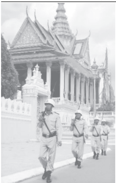
Cambodian Royal Palace guards march in front of the palace on Sunday, 10 Oct, 2004 in Phnom Penh, the capital of Cambodia.