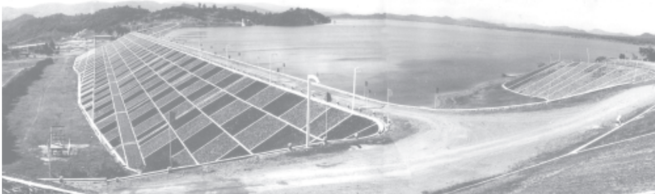
Progress of Mon Creek multipurpose dam project in Sedoktara Township in Magway Division..

Perspectives Work steadfastly towards eternal existence of the Union (page 2)