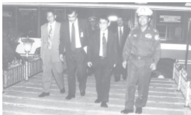
Deputy Minister for Immigration and Population U Maung Aung being welcomed back at Yangon International Airport.

YANGON, 11 Oct — Minister for Immigration and Population Maj-Gen Sein Htwa welcomed back the Myanmar delegation led by Deputy Minister for Immigration and Population U Maung Aung who arrived back at Yangon International Airport by air yesterday evening after attending the 55th UNHCR Executive Committee Meeting held in Geneva, Switzerland.