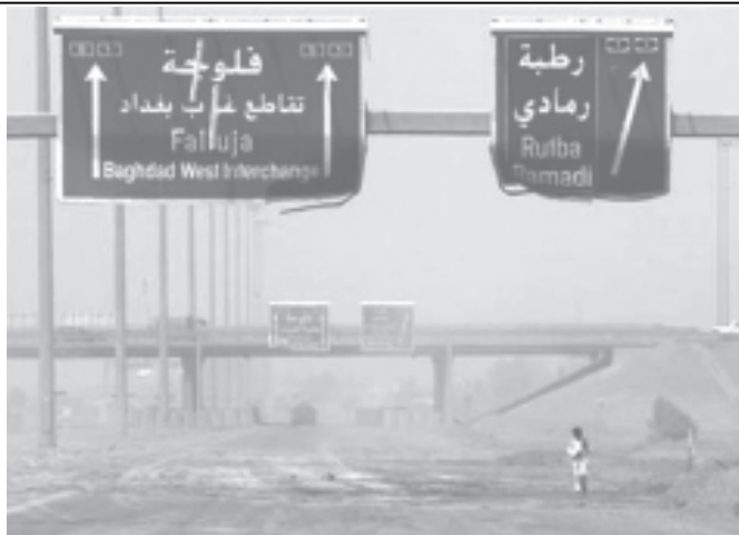
An Iraqi boy leaves the town of Fallujah, Iraq, recently.