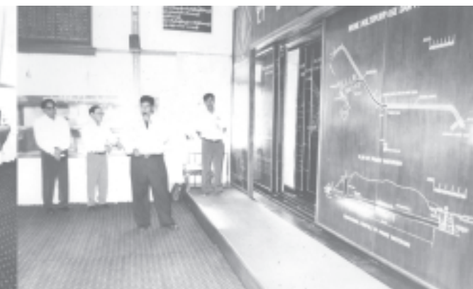
Secretary-1 Lt-Gen Soe Win gives instructions to officials at the briefing hall of Mon Creek Multipurpose Dam project.