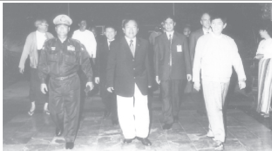
Minister U Tin Winn and Minister U Nyan Win being welcomed back at Yangon International Airport after attending the ASEM-5 on 7-9 October in Vietnam. (News reported). — MNA