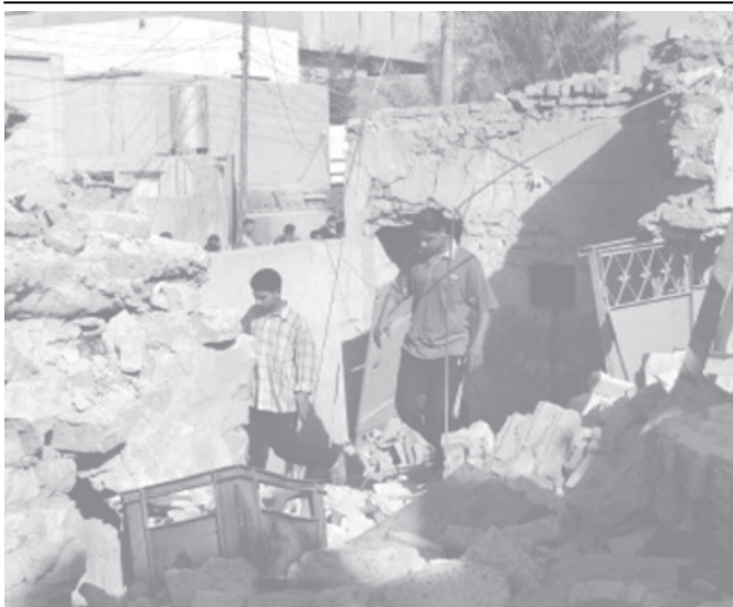
Iraqi youths walk across the roof of a damaged building following a raid by the US military on Fallujah recently.