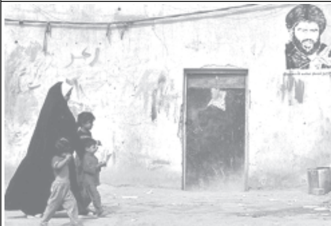
An Iraqi woman and her children walk past a house adorned with a picture of cleric Moqtada Sadr in the Sadr City neighbourhood of Baghdad, on 11 Oct, 2004.—INTERNET

them for dolphin shows and water parks across Asia." The proposal to ban commercial trade was put forward by Thailand, host of a conference on the Convention on Trade in International Species (CITES), which regulates global trade in wild plants and animals. —MNA/Reuters