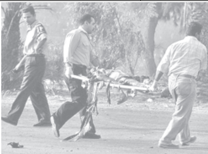
A medic and an Iraqi policeman evacuate a victim on a stretcher after a missile attack near the oil ministry in Baghdad on 11 Oct, 2004.

မြို့ပြဒေသထဲသို့ အိမ်ထောင်ရေးနှင့် ဆက်သွယ်မှု