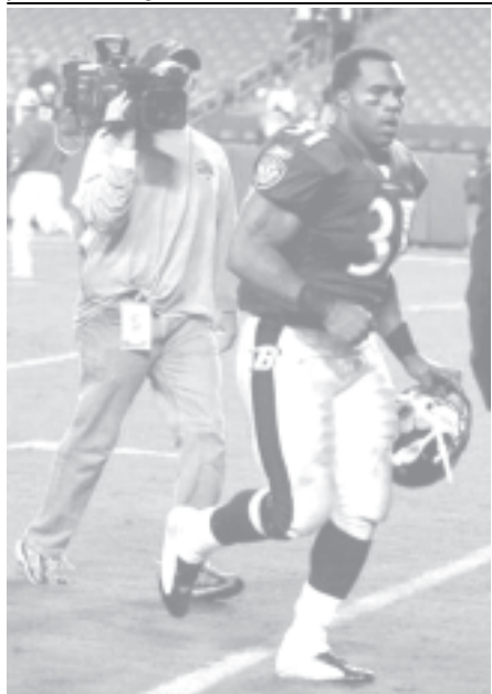
Baltimore Ravens running back Jamal Lewis leaves the field at FedEx Field in Landover, Maryland following the Ravens 17-10 win over the Washington Redskins, on 10 Oct, 2004. The game was Lewis' last before his having to serve a two-game suspension for violating the NFL's substance abuse policy.

But Figueroa, who has put his career back on the rails with Mexico's Cruz Azul after a nightmare spell with English Premier League Birmingham City last year, was on target in the 33rd minute.