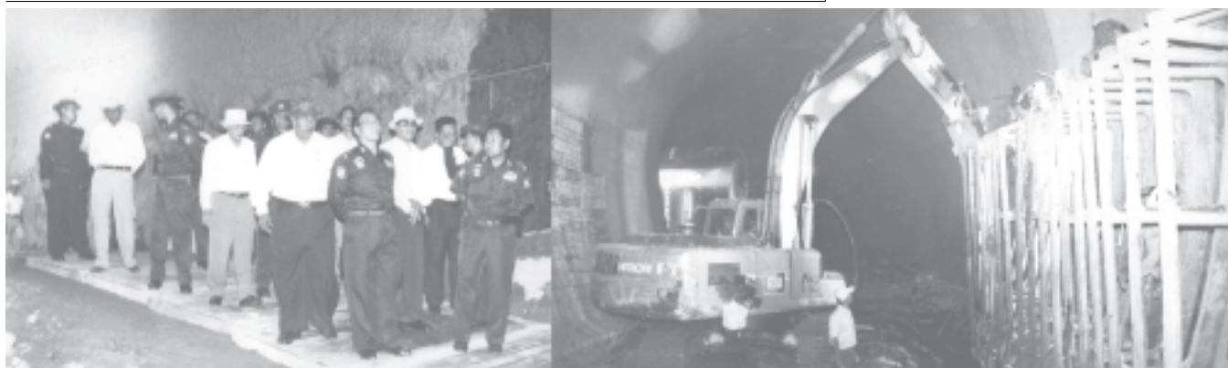
Secretary-1 Lt-Gen Soe Win inspects Mon Creek multipurpose dam project.

Requirements have been fulfilled to a certain degree for the development of Sedoktara Township's education and health sectors. Coordinated efforts have been also made for the betterment of telephone line and Salin-Sedoktara motor road in the township.