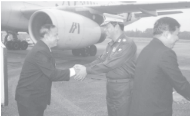
Minister for Finance and Revenue Maj-Gen Hla Tun welcomes Finance & Revenue Soccer Team, champion of 110th Indian Football Association's Shield. — MNA

YANGON, 12 Oct — U Nyan Win, Minister for Foreign Affairs of the Union of Myanmar, has sent a message of felicitations to His Excellency Mr Miguel Angel Moratinos, Minister of Foreign Affairs and International Cooperation of the Kingdom of Spain, on the occasion of the National Day of the Kingdom of Spain, which falls on 12 October 2004. — MNA