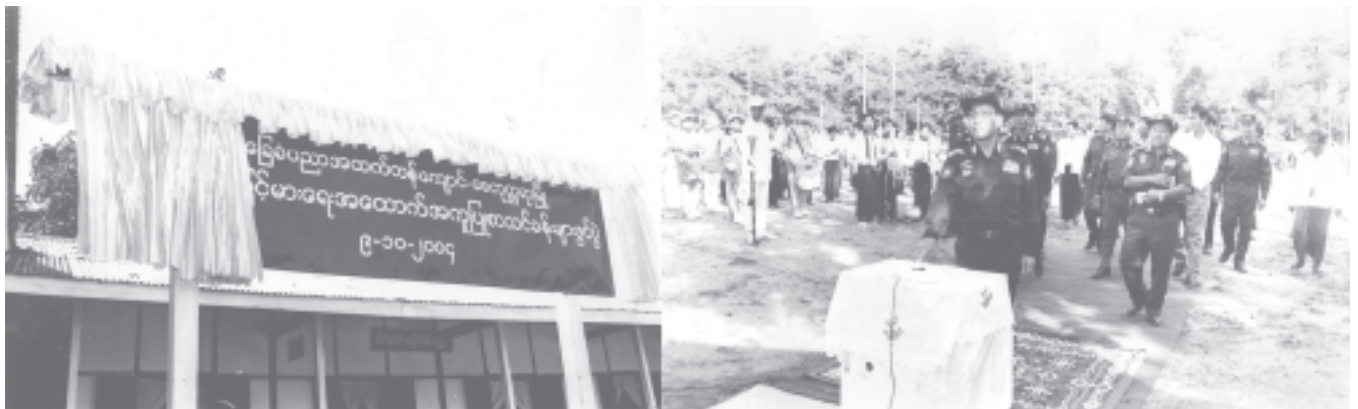
Secretary-1 of the State Peace and Development Council Lt-Gen Soe Win unveils the signboard of multimedia rooms at Sedoktara BEHS. — MNA