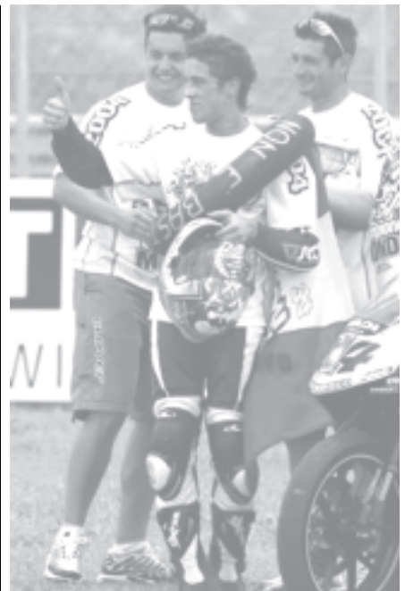
Italian 125cc rider Andrea Dovizioso, centre, celebrates after he won the 2004 world championship during the Malaysia Motorcycle Grand Prix at Sepang International Circuit, on Sunday, 10 Oct, 2004.

HELSINKI, 10 Oct—Stand-in striker Shefki Kuqi struck twice either side of a goal by Aleksei Eremenko as Finland beat Armenia 3-1 in a World Cup qualifier on Saturday.