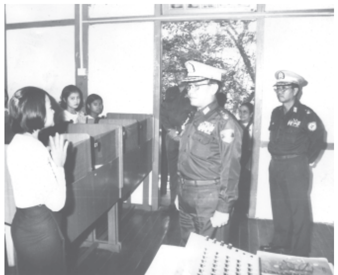
Secretary-1 Lt-Gen Soe Win inspects multimedia rooms at Htantabin BEHS. — MNA