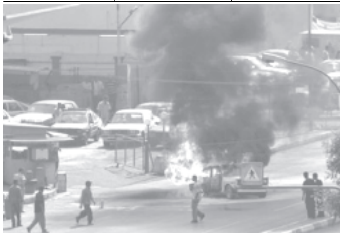
A car burns in the centre of Baghdad, Iraq, on 11 Oct, 2004. The cause of the fire was not immediately known. Car bombers struck twice in rapid succession in the capital on Sunday, killing at least 11 people including an American soldier.