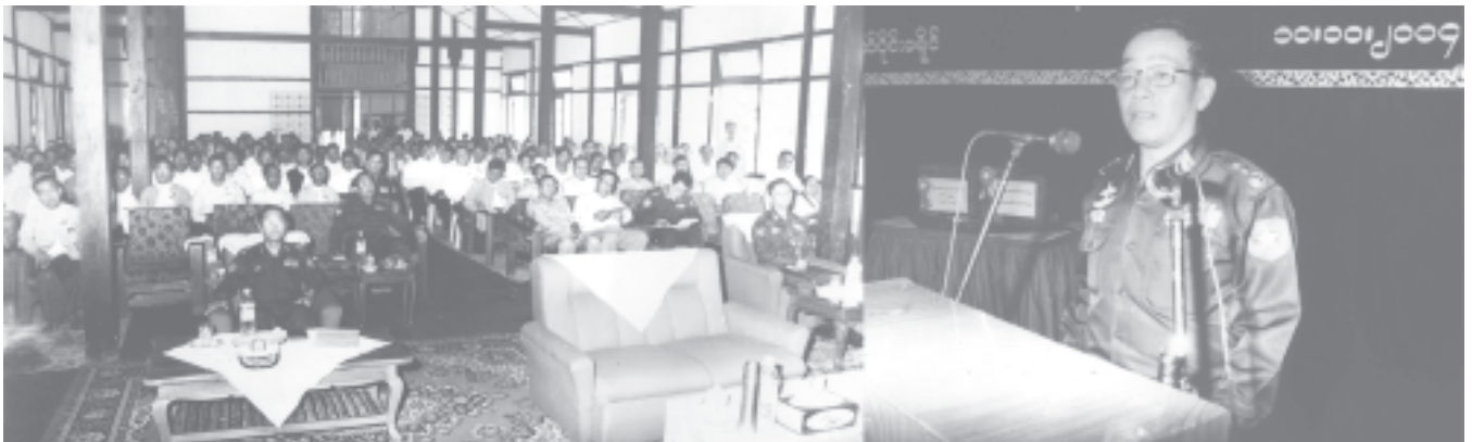
Secretary-1 Lt-Gen Soe Win delivers a speech at the donation ceremony of teaching aids at Htantabin BEHS in Yangon North District.

YANGON, 11 Oct — A ceremony to donate teaching aids to Htantabin Basic Education High School in Yangon North District was held yesterday morning at the school attended by Vice Chairman of Myanmar Education Committee Secretary-1 of the State Peace and Development Council Lt-Gen Soe Win.