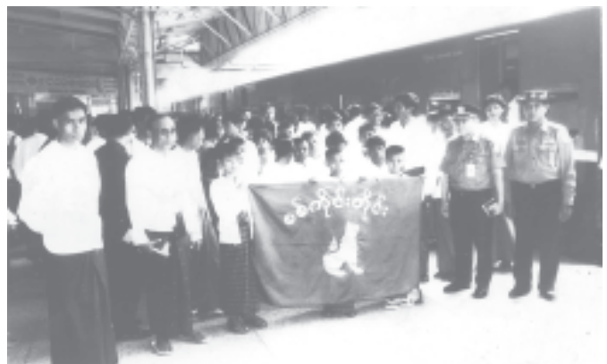
Participants in the 12th Myanmar Traditional Cultural Performing Arts Competitions arrive Yangon Central Railway Station.