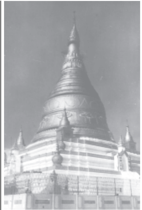
SoonU Ponnyashin Pagoda. — MNA