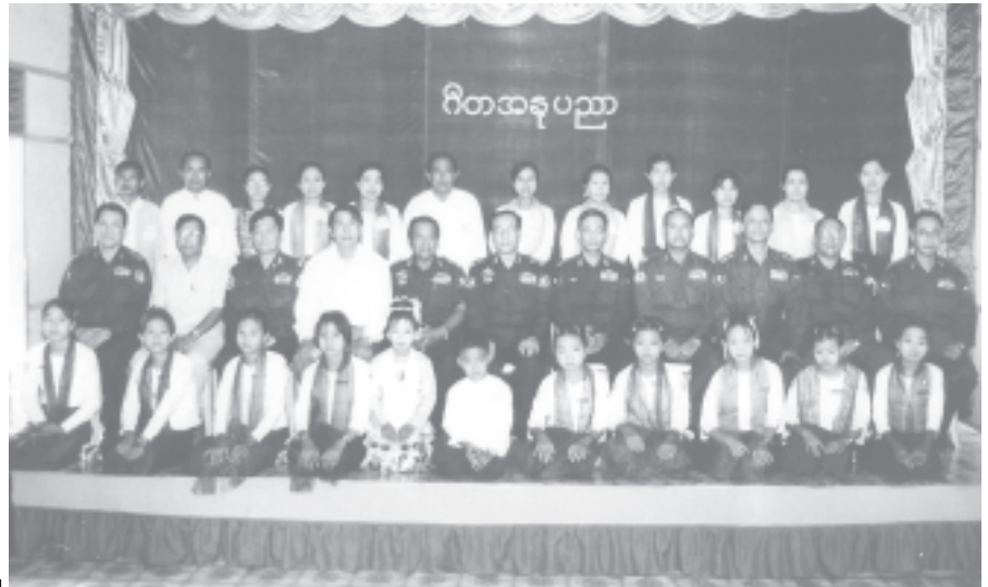
Secretary-1 Lt-Gen Soe Win and party pose for a documentary photo together with teachers and students. — MNA

After the ceremony, the Secretary-1 and party cordially greeted those present. The Secretary-1 and party inspected the thriving of 100-acre paddy plantations at the entrance to the township. Afterwards, they looked into Mezali spillway and construction of Kyionkyiwa Dam. They then helicoptered to Bagan-Nyaung-U Airport where they inspected the upgrading tasks. Minister for Transport Maj-Gen Thein Swe and officials reported on upgrading tasks of the airport to the Secretary-1 and party, who left there and arrived back here. — MNA