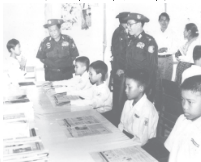
Secretary-1 Lt-Gen Soe Win and party view the students learning at multimedia room.

capable of irrigating 108,000 acres of farmland and generating 75 megawatts. Construction works are being carried out for speedy completion of the project.