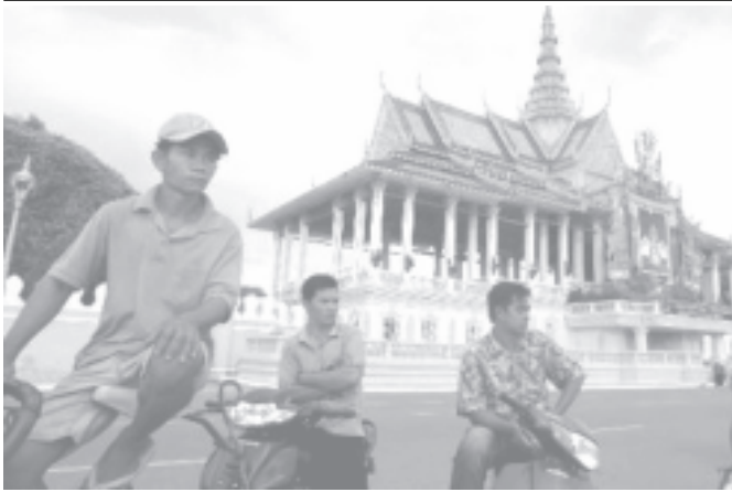
Motorcycle taxi drivers wait for passengers in front of the Cambodian Royal Palace on 10 Oct, 2004 in Phnom Penh, the capital of Cambodia.