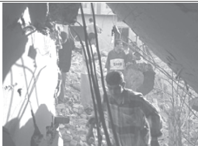
Local residents look at the destroyed houses flattened in an overnight airstrike in Fallujah, Iraq, on 6 Oct 2004. According to witnesses three houses were flattened in the attack but no one was injured as the families who lived there had already fled to a safer area. —INTERNET

The new Spanish Government has rekindled warm ties with traditional European ally France since it came to power, and it sees eye to eye with Paris on the Iraq issue. France was one of the most vocal opponents to the US-led invasion of Iraq. — MNA/Reuters