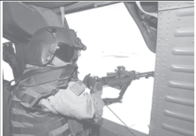
A US soldier mans a machine gun mounted on a blackhawk helicopter as it flies over the outskirts of Samarra.