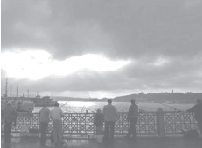
Turkish men fish at the Galata bridge in Istanbul, Turkey, on 29 Sept, 2004. The EU head office is expected to recommend 6 October whether Turkey is ready to begin membership negotiations, a goal that polls show some 70 percent of Turkey favours.