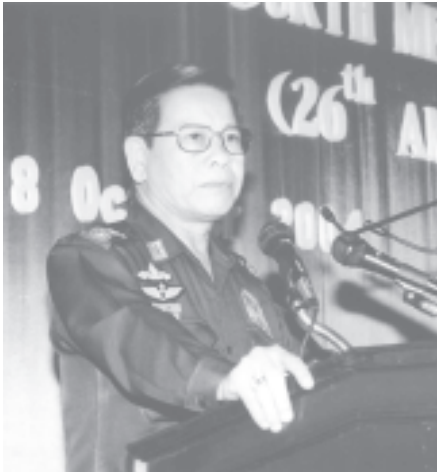
Prime Minister General Khin Nyunt addresses opening ceremony of 26th Meeting of ASEAN Ministers on Agriculture and Forestry and 4th Meeting of AMAF Plus Three.

emony was attended by Secretary-1 of the State Peace and Development Council Lt-Gen Soe Win, Secretary-2 Lt-Gen Thein Sein, Chairman of Yangon Division Peace and Development Council Commander of Yangon Command Maj-Gen Myint Swe, the ministers, the chairman of Yangon City Development Committee mayor of Yangon, agriculture and forestry ministers and deputy ministers from ASEAN countries, ministers and deputy ministers from plus three countries China, Japan and the Republic of Korea, ambassadors of the