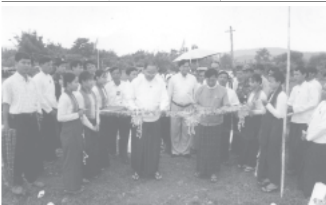
RURAL HYDEL POWER STATION LAUNCHED: The opening ceremony of rural hydel power station was held in Pynthonlon Village, Mogaung Township, on 2 October. USDA (Central) Secretariat Member Minister Brig-Gen Thein Zaw launches the power station.—H&T

After the opening ceremony, Prime Minister General Khin Nyunt and those present viewed the booth displayed by ASEAN and International Rice Research Institute, booth on opium substitute Nara Green Tea (See page 10)