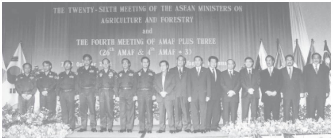
Prime Minister General Khin Nyunt, Secretary-1 Lt-Gen Soe Win, Secretary-2 Lt-Gen Thein Sein and party pose for documentary photos together with delegates to 26th AMAF & 4th AMAF+3.— MNA

Boost production of finished wood products (Page 2)