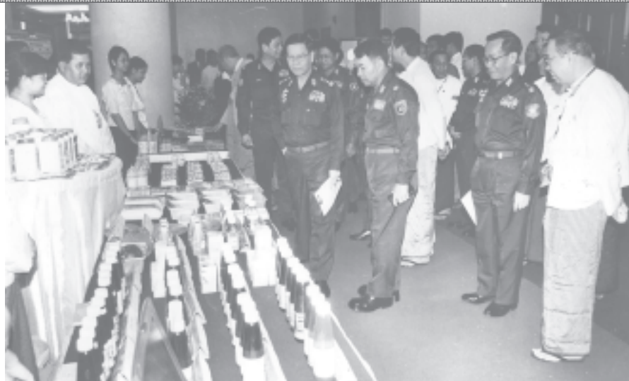
Prime Minister General Khin Nyunt and party views booths displayed at 26th AMAF Meeting and 4th ASEAN+3 Meeting at Sedona Hotel.

carried out by the Ministers remain highly commendable. The meeting will be focusing on agriculture, fisheries and forestry; the promotion of agro-based products; cooperation in the transfer of technology; the facilitation of intra-ASEAN investments; and the elimination of trade barriers. It is important that ASEAN cooperate closely in the area of agriculture and forestry to achieve food security and sustainable