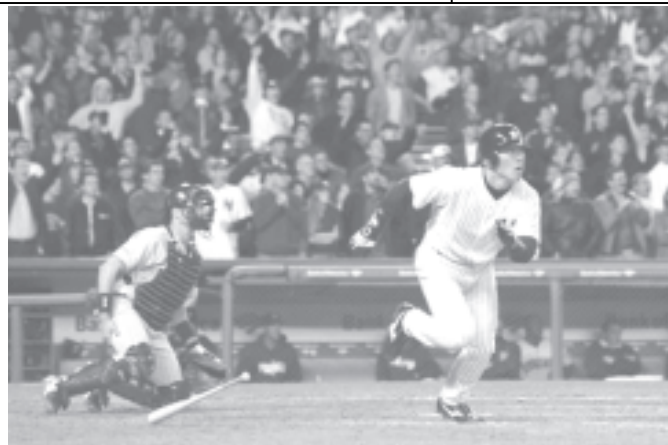
Hideki Matsui of the New York Yankees hits the game winning sacrifice fly to score Derek Jeter and beat the Minnesota Twins 7-6 in the 12th inning of Game 2 of the American League Division Series at Yankee Stadium in New York.

Alessandro Nesta (Italy), Michael Owen (England), Robert Pires (France), Raul (Spain), Roberto Carlos (Brazil), Ronaldinho (Brazil), Ronaldo (Brazil), Wayne Rooney (England), Andrej Shevchenko (Ukraine), Ruud van Nistelrooy (Netherlands), Theodoros Zagorakis (Greece), Zinedine Zidane (France).