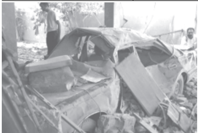
Iraqis look at their damaged vehicle following a raid by the US military on Fallujah. US and Iraqi forces swept bastions south of Baghdad and pounded positions held by Iraq most wanted, Abu Mussab al-Zarqawi, in Fallujah. —INTERNET

"The interim government is committing big mistakes against the Iraqi people they are supporting the occupation forces in their massacres against Iraqis," he said. — MNA/Reuters