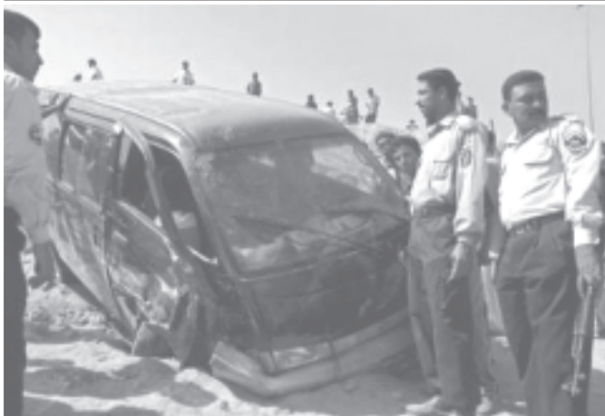
Iraqi police officers check a vehicle damaged by a roadside bomb near Basra on 6 Oct, 2004. Police said one Iraqi was killed and four were wounded in the attack.