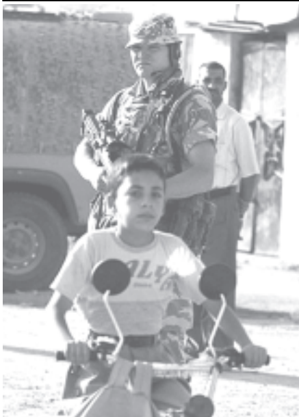
An Iraqi boy rides his bicycle as he is watched by a British soldier in the city of Basra on 6 Oct, 2004.