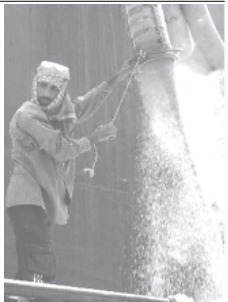
An Iraqi harbour worker unloads wheat received in line with the United Nations oil-for-food deal in the port of Umm Qasr, some 620 km south of Baghdad