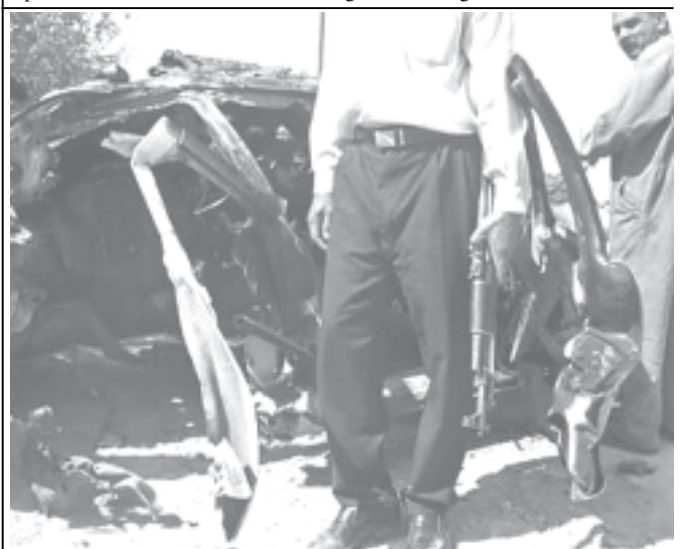
Iraqi police officers view a destroyed patrol car in the western town of Samarra on 6 Oct, 2004. One policeman was killed when his patrol car was hit by a roadside bomb blast.