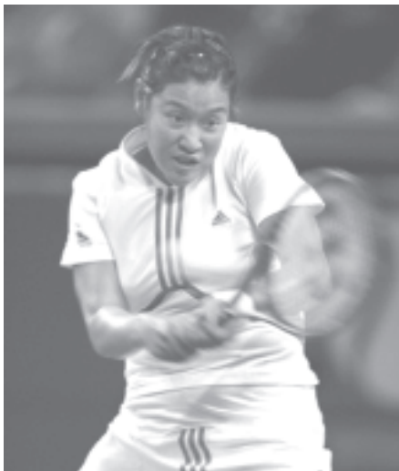
Unseeded Thai player Tamarine Tanasugarn, pictured in earlier competition, said she had mixed feelings when she became the first competitor to reach the semi-finals of the Japan Open after her opponent retired hurt.

Vietnam team one will meet Vietnam team two, which topped the Group A with nine points, in the semifinal match on Thursday while Myanmar will take on Indonesia in another semifinals.