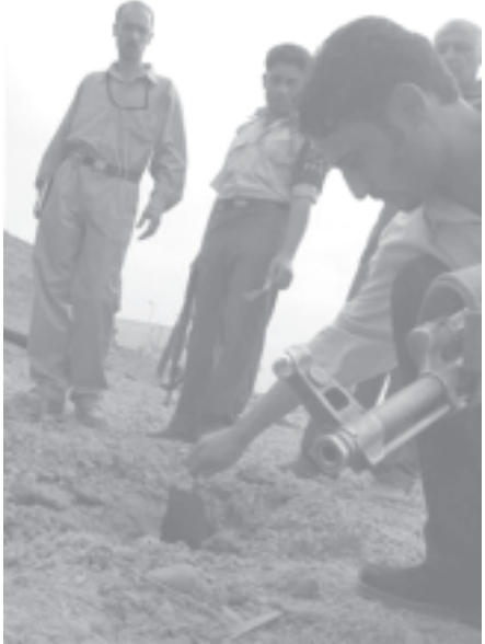
A policeman checks the remains of a rocket after it landed near the Oil Ministry, in Baghdad, on Tuesday, 5 Oct, 2004. — INTERNET

British Foreign Secretary Jack Straw told a news conference in Baghdad parts of Iraq had serious security problems. Elsewhere a roadside bomb killed a civilian and wounded four policemen in the southern city of Basra. A Kurdish tribal leader and a companion were shot dead in the northern city of Mosul. —Internet