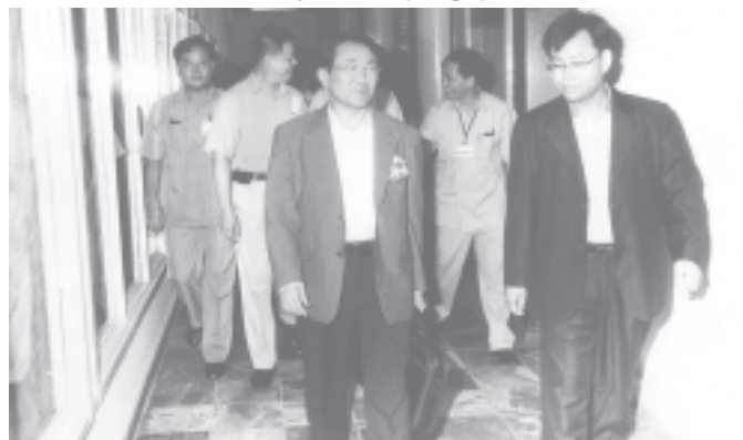
Vice Minister for Agriculture Fan Xiaojian of China and Deputy Minister for Agriculture and Forest Hae-Sang Park of ROK and party arrive at the airport.— MNA

Minister for Agriculture and Forest Hae-Sang Park in the evening. Director-General U Win Shwe of the Water Resources and Utilization Department and officials of the respective embassies of the plus three nations welcomed them at the Yangon International Airport. — MNA