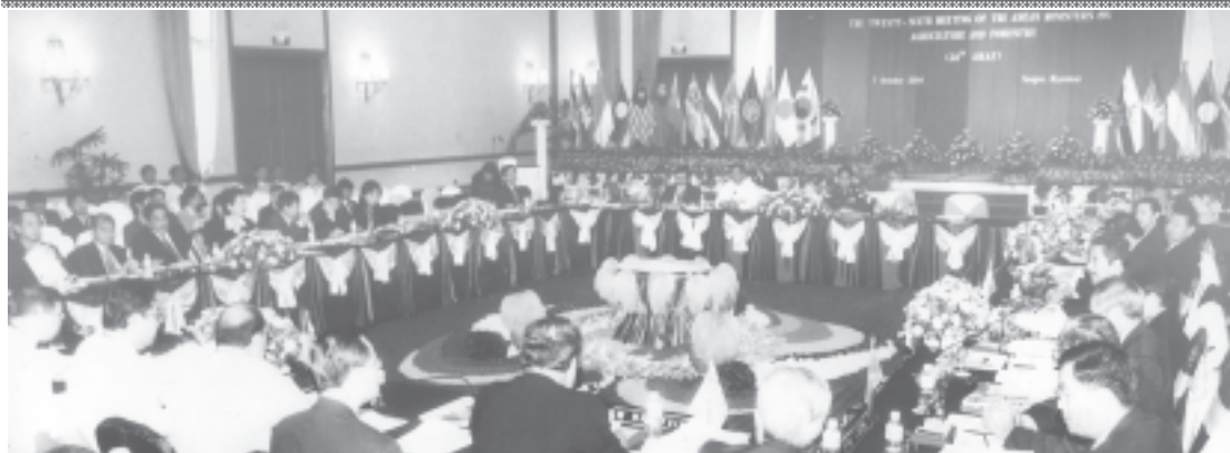
The 26th Meeting of the ASEAN Ministers on Agriculture and Forestry in progress.—MNA

YANGON, 7 Oct — The 26th Meeting of ASEAN Ministers on Agriculture and Forestry was launched at the Sedona Hotel on Kaba Aye Pagoda Road here this morning.