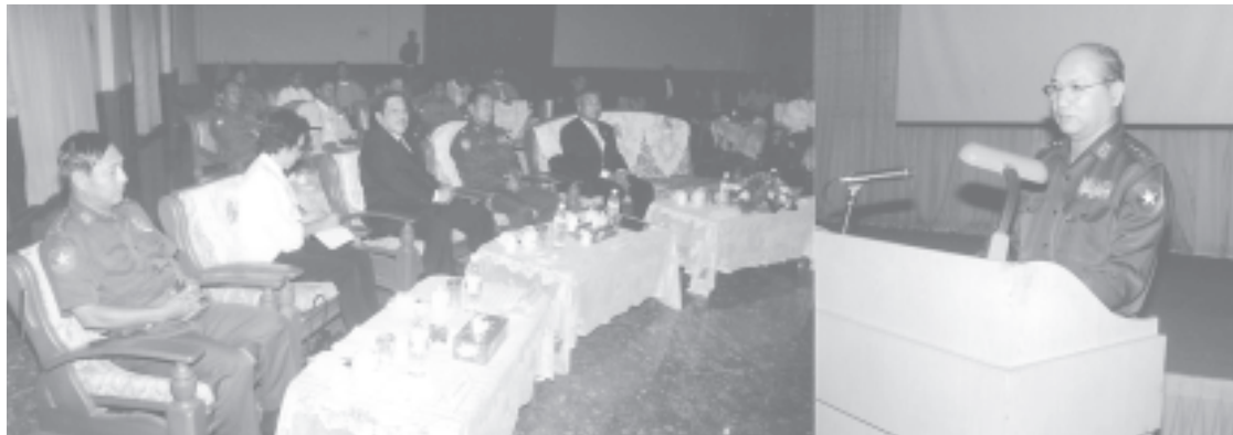
CCDAC Chairman Minister for Home Affairs Col Tin Hlaing addresses Myanmar and Thailand Cooperation in Drug Elimination Meeting. HOME AFFAIRS

YANGON, 7 Oct — The Myanmar-Thai Cooperation in Drug Elimination Meeting was held at the administration hall of the Drug Elimination Museum on Kyuntaw Street in Kamayut Township, this afternoon, attended by Chairman of Central Committee for Drug Abuse Control Minister for Home Affairs Col Tin Hlaing, Minister at the Prime Minister's Office Brig-Gen Pyi Sone, the work group chairmen and secretaries of CCDAC, guests, Secretary-General of Mae Fah Laung Foundation Chief Executive Officer of Doi Tung Development