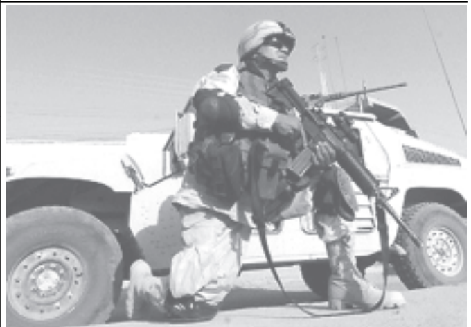
A US soldier of the 1st Infantry Division takes position at a neighbourhood in Samarra, some 125 kilometres north of Baghdad. — INTERNET