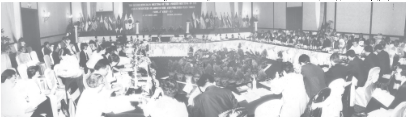
The Senior Officials Meeting of Fourth ASEAN Ministers on Agriculture and Forestry Plus Three in progress.

Malaysia, Myanmar, the Philippines, Singapore, Thailand and Vietnam. (See page 9)