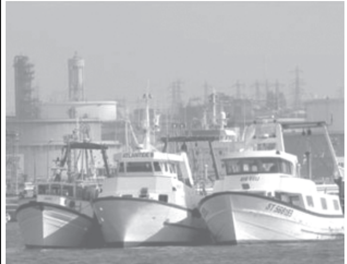
Fishermen's boats block the access to the oil port of Lavera outside Martigues, southern France, on 4 Oct, 2004.