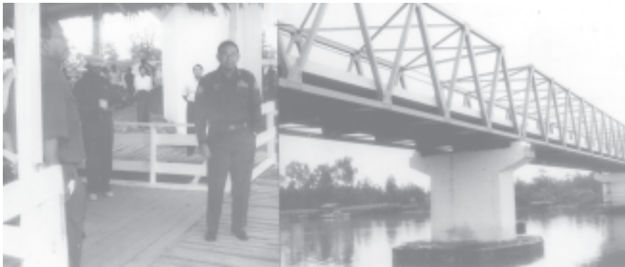
Minister for Construction Maj-Gen Saw Tun inspects progress of Lonedawpauk Bridge Project.