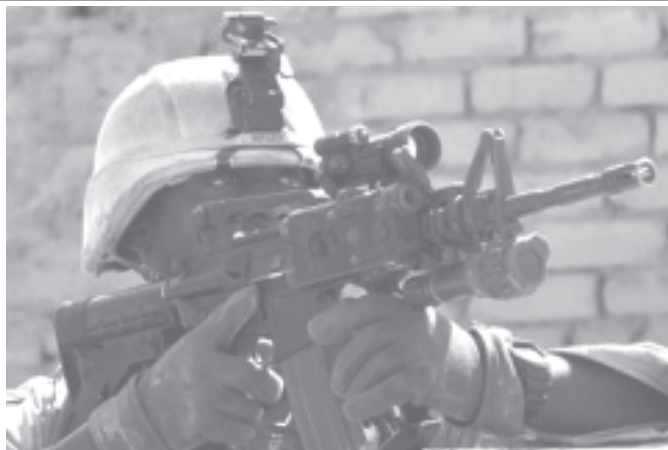
A US Army soldier guards the perimeter during a search for guerillas in the ancient section of Samarra, Iraq, on 4 Oct 2004, on the fourth day of a major US and Iraqi military incursion into the city.