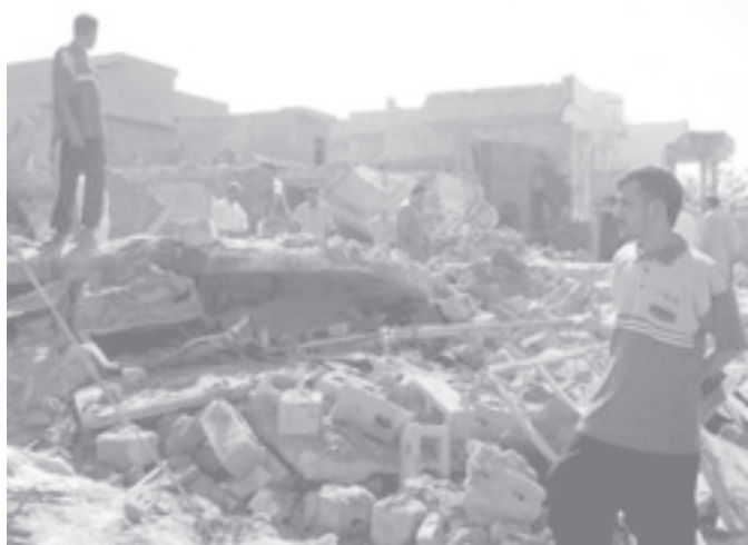
Local residents look at the damage done to buildings in Fallujah, Iraq on Saturday, 2 Oct, 2004, after a US airstrike late Friday night. The strike razed two houses.

The murder charge carries a maximum sentence of life in prison without possibility of parole, while the dereliction charge carries a maximum sentence of six months of confinement, according to the statement. The US military initially described the general's death as apparently from natural causes, but changed the account in the weeks after revelations surfaced this spring of the abuse of Iraqi prisoners at the Abu Ghraib Jail on the outskirts of Baghdad.—MNA/Reuters