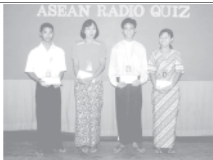
Winners of ASEAN Radio Quiz, organized by MRTV.