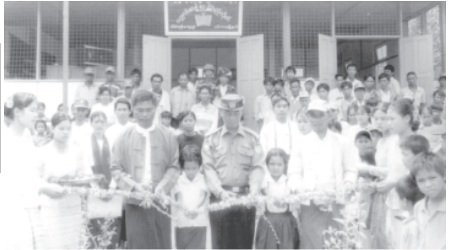
The self-reliant library in Theingon Village in Pindaya Township, Shan State (South), being opened.

Libraries built on self-reliant basis to disseminate knowledge