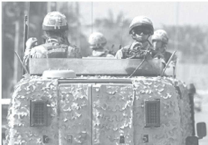
British troops patrol Basra, Iraq on 29 September, 2004.