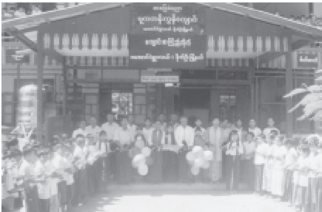
The opening ceremony of the self-reliant library in Phaaungwe Village in DaikU Township, Bago Division.