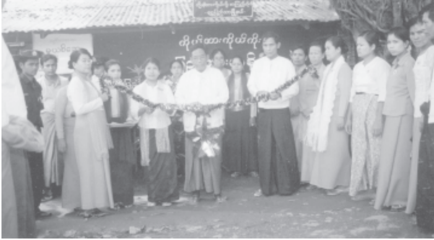
The opening ceremony of the self-reliant library of Hlawgar Village in Shwepyitha Township.

Bringing the library to the people and bringing the people to the library