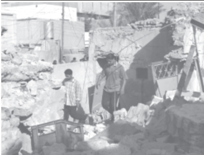
Iraqi youths walk across the roof of a damaged building following a US airstrike on Fallujah on 4 Oct, 2004. — INTERNET

Thirteen of the 80 US troops who died in Iraq in September were members of the National Guard or Reserve. —Internet