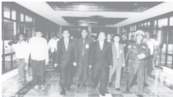
Minister U Tin Winn and Minister U Nyan Win being seen off at Yangon International Airport.

The ministers were seen off at Yangon International Airport by Minister for Culture Maj-Gen