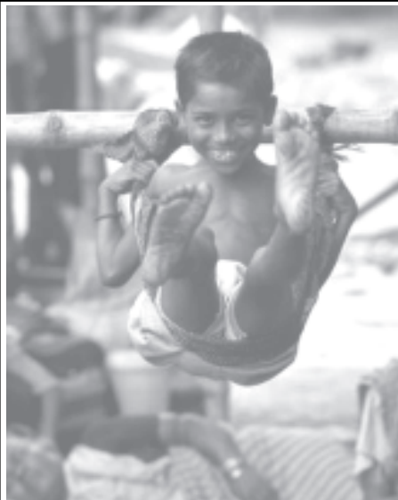
An Indian street boy plays on a swing in the eastern Indian city of Calcutta on 4 October, 2004.