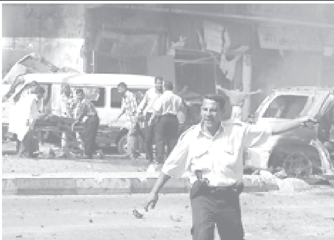
An Iraqi security officer gestures as a body is carried away following a car bomb in the Sadoon neighbourhood, central Baghdad recently.