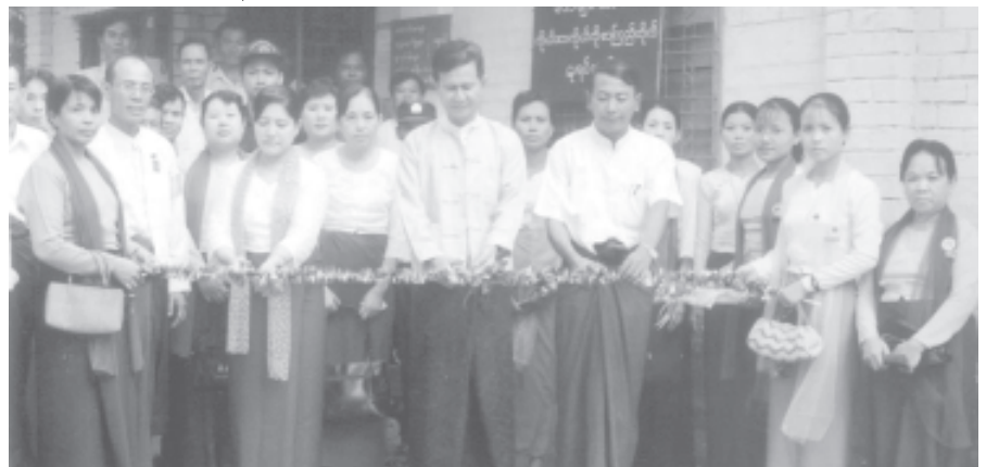
The opening ceremony of the self-reliant library of North Okkalapa Township in Yangon Division. —IPRD

Up to 5 October 2004, altogether 9,085 self-reliant libraries were opened nationwide.