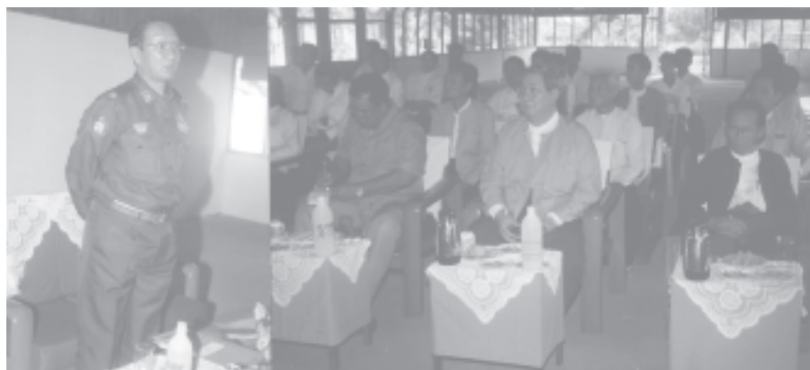
MINISTER MEETS MARTIAL ARTS MASTERS: Minister for Sports Brig-Gen Thura Aye Myint met executives of Myanmar Martial Arts Federation and athletes at Myanmar Martial Arts Training School in Dagon Myothit (North) Township on 6 October. The minister delivers an address at the meeting.