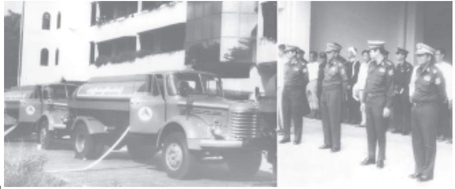
Minister for SWRR Maj-Gen Sein Htwa inspects six TE fire engines to be sent to Moemaik, Namti, Nyaungshwe, Manton, Nampaung and MraukU.

During his inspection with Deputy Minister Brig-Gen Kyaw Myint and Officer on Special Duty Brig-Gen Thura Sein Thauung, the Director-General of the FSD and officials presented reports to the minister and party. The minister met representatives of townships concerned from Shan, Kachin and Rakhine States who are to accept the fire engines. And he instructed officials to send them of the places as quickly as possible. — MNA