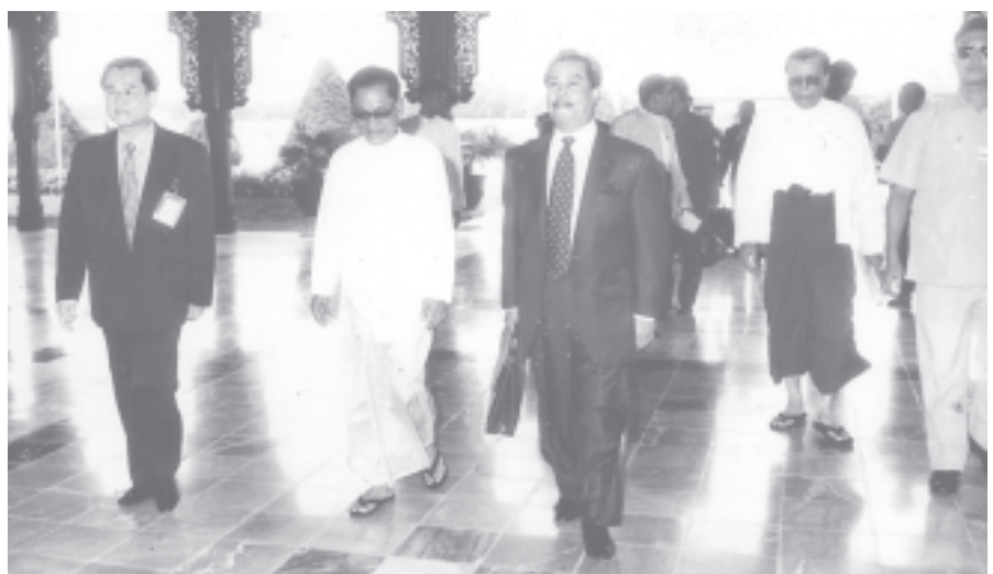
The Malaysian Minister and party arrive to attend ASEAN Ministers' meeting on Agriculture and Forestry.

Emergence of the State Constitution is the duty of all citizens of Myanmar Naing-Ngan.