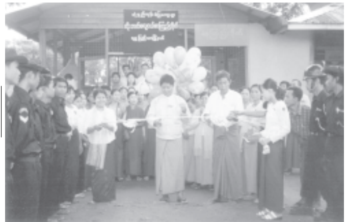
A library of model Bonshegon Village in Shwepyitha Township, Yangon Division, being opened.— IPRD

Up to 5 October 2004, altogether 9,085 self-reliant libraries were opened nationwide.