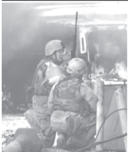
US soldiers take up a defensive position soon after a car bomb exploded in Baghdad on 3 Oct, 2004.