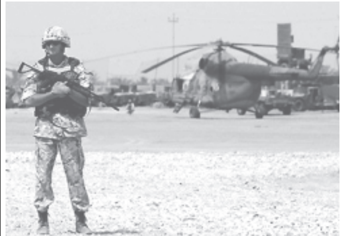
A Polish soldier stands guard near a helicopter in Camp Lima, some 100 kms south of Baghdad.

In view of this, the Philippine Government has appealed to the Middle East countries bordering Iraq and the United States for the help in curbing illegal entry of more OFWs to Iraq. — MNA/Xinhua