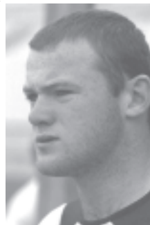
Manchester United forward Wayne Rooney has made it on to the shortlist for FIFA's 2004 Player of the Year award.

Fourth in the Premier League standings, United have been the subject