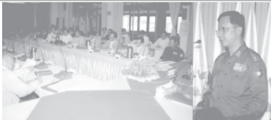
Minister for Cooperatives Col Zaw Min delivers a speech at the coordination meeting to enhance improvement of cooperative societies.