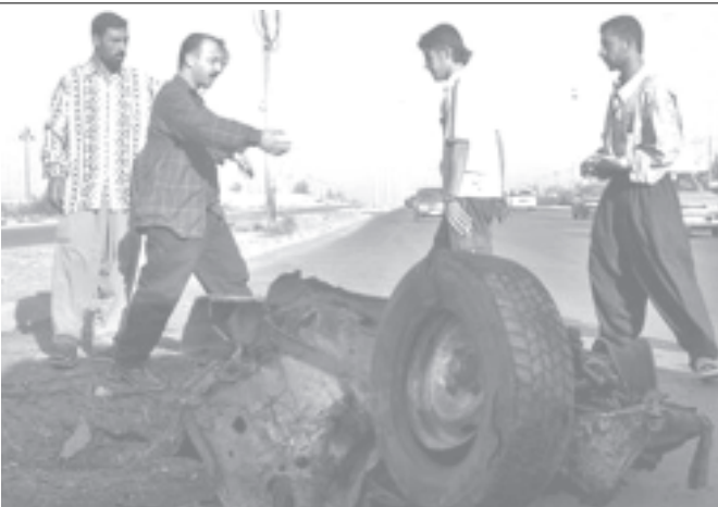
Iraqis pass the remains of a car after it exploded as a US military convoy was passing by in Mosul on 29 Sept, 2004.