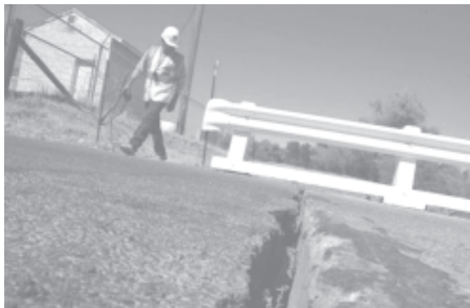
A worker checks a crack in a bridge from an earthquake on 28 Sept, 2004 in Parkfield, Calif. The bridge suffered some structural damage including separating nearly six inches from the road.