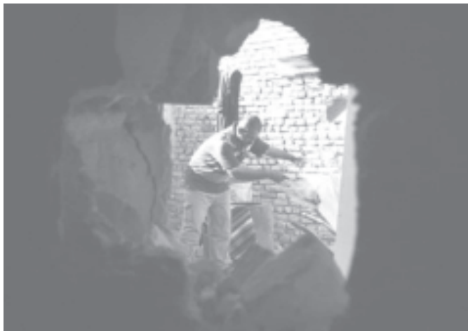
A local resident looks at the damage caused to a residence after US airstrikes in Sadr City, Baghdad, on 29 Sept, 2004.