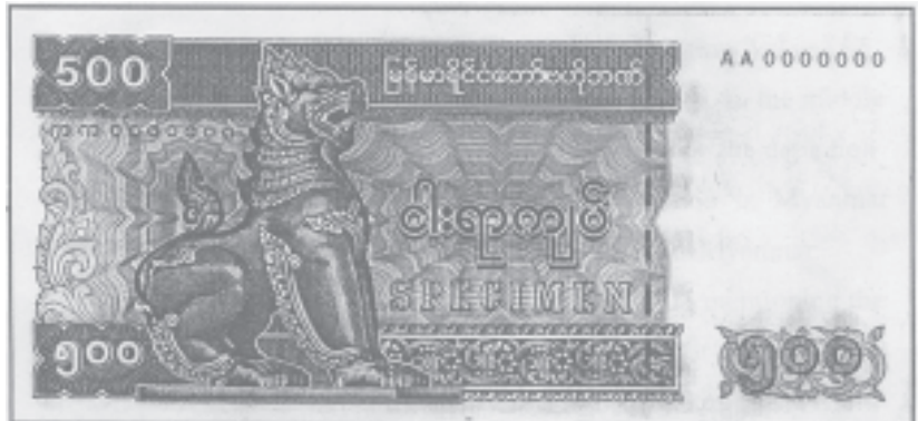
New note of K 500 seen on obverse side.

Obverse side On the top, the inscription “မြန်မာနိုင်ငံတော်ဗဟိုဘဏ်” is printed. In the middle portion, the Note carries the depiction of a majestic King Lion in Myanmar artistic style and the Myanmar inscription “ငါးရာကျပ်” mentioning the value of the Note. On the left hand side and at the bottom, floral designs in Myanmar artistic style are printed. On the three corners, the value of the Note is printed in numeral figures. Bank