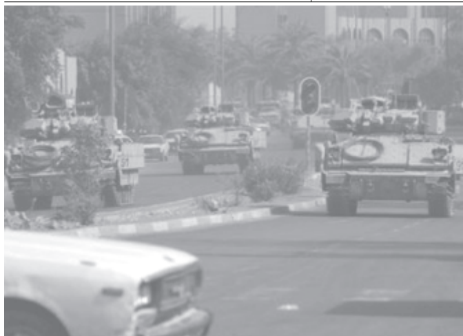
Bradley fighting vehicles block access to Haifa Street during clashes with Iraqi militants in Baghdad, on 28 Sept, 2004.

Yang Liwei will be conferred the degree of Doctor of Science, honoris causa. He received his bachelor's degree from No 8 Aviation College of the People's Liberation Army and became a member of the national astronaut team in 1998.