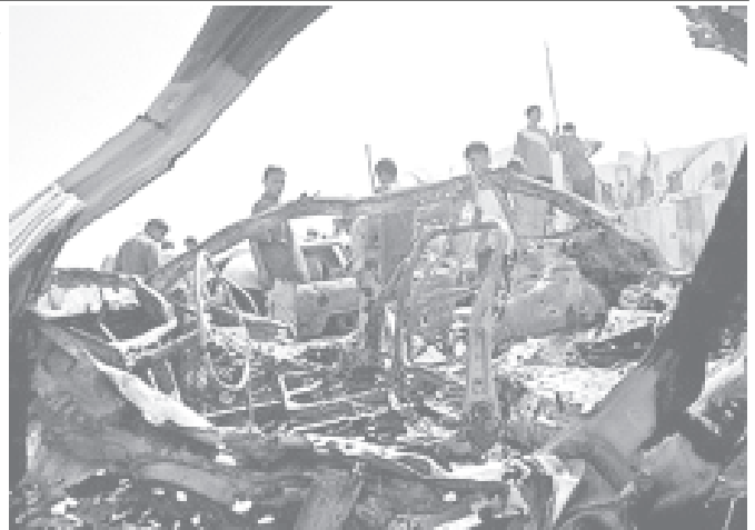
Iraqis check the wreckage of cars that were destroyed at Baghdad's Muslim Shiite Sadr City neighbourhood recently.—INTERNET