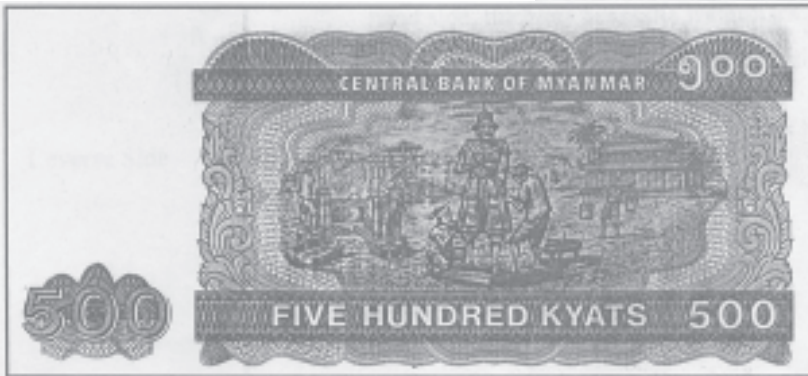
New note of K 500 seen on reverse side.

Reverse side On the top, the inscription “CENTRAL BANK OF MYANMAR” is printed. At the bottom, the inscription “FIVE HUNDRED KYATS” is printed. In the middle, the Note bears the illustration of Myanmar traditional bronze casting, working on the Maha Bandoola statue with Myanmar traditional floral designs on each side of the illustration. On the three corners, the value of the Note is printed in numeral figures.