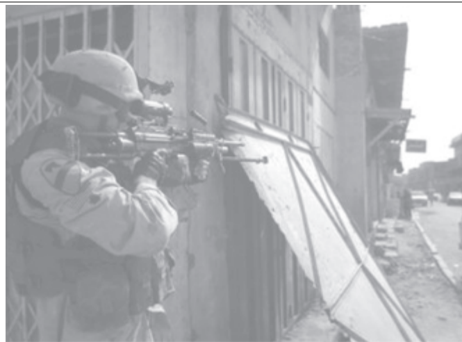
A US soldier takes aim during clashes with Iraqi militants in Haifa Street, Baghdad, Iraq, on 28 Sept, 2004.

A further 44 service personnel in the country have died as a result of other incidents including friendly fire and road traffic accidents.