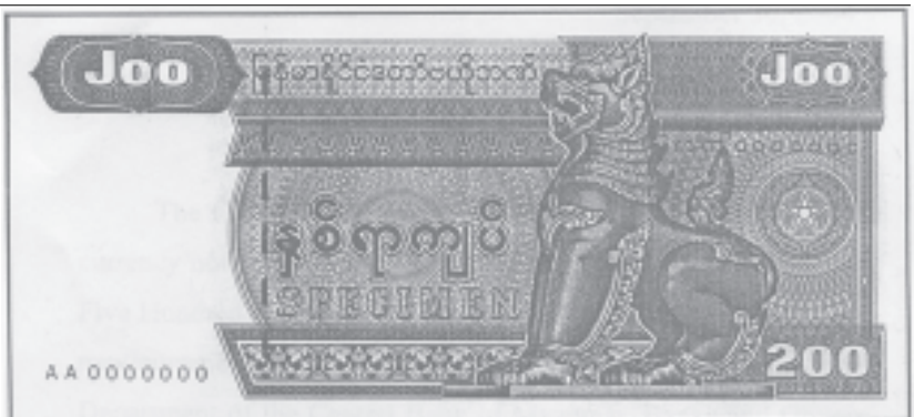
New note of K 200 seen on obverse side.

are printed in Myanmar and English. On the left hand side, the Note bears the watermark image of the lion head. A security thread is embedded upright in the Note.