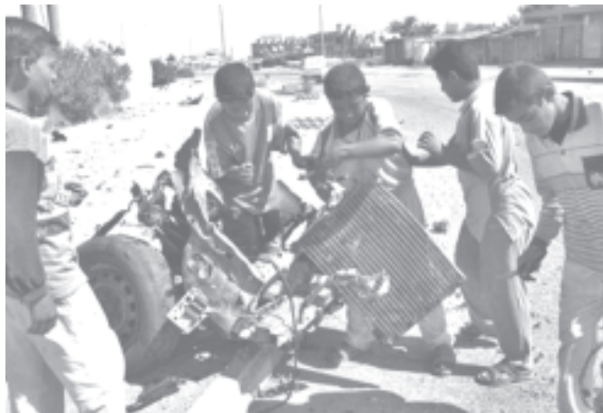
Local children try to salvage scrap from the remains of a car bomb after it exploded targeting a passing US military convoy in Ramadi, Iraq, on 28 Sept, 2004. Eyewitnesses reported that two soldiers were seriously injured in the explosion.

Excluding troubled areas from the nationwide poll would only isolate Iraq's Sunnis and create deeper divisions in the country, he told the Paris daily Le Figaro according to a text distributed in advance. The United States and Iraq's interim government insist the vote should go ahead as scheduled despite a worsening insurgency there.—MNA/Reuters