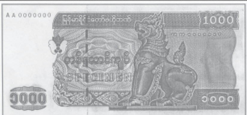
New note of K 1000 seen on obverse side.

Emergence of the State Constitution is the duty of all citizens of Myanmar Naing-Ngan.