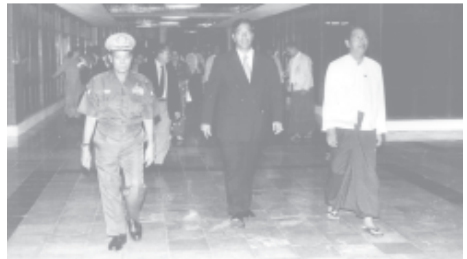
Minister for Finance and Revenue Maj-Gen Hla Tun being seen off at the airport before departure for Washington DC.