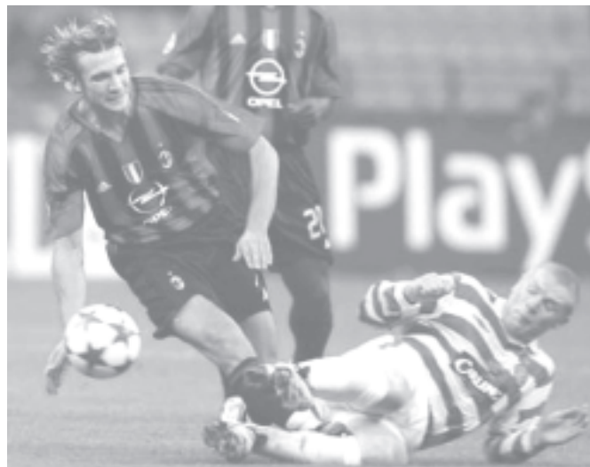
AC Milan's Andriy Shevchenko (L) fights for the ball against Neil Lennon of Celtic during their Champions League Group F soccer match at the San Siro Stadium in Milan, on 29 Sept, 2004.

The 46-year-old Rangnick, who signed a contract with Schalke until June 2006, was sacked by Hanover in March af-