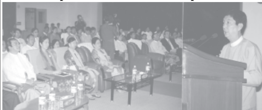
Minister for Health Dr Kyaw Myint addresses opening ceremony of National Consultative Workshop on UN Millennium Development Goals. — HEALTH

YANGON, 30 Sept — The National Consultative Workshop on UN Millennium Development Goals organized by the Health Planning Department of the Ministry of Health and the WHO commenced at the International Business Centre on Pyay Road here this afternoon.