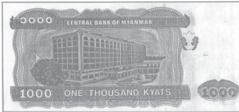
New note of K 1000 seen on reverse side.