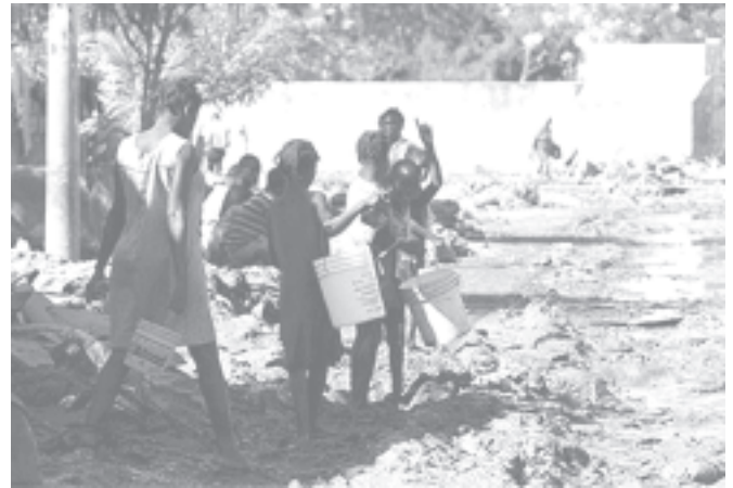
Children play amid mud on 28 Sept, 2004 in Gonaives. Thousands more remain homeless after torrential rains and floodwaters ripped through this coastal city, 170 kilometres (105 miles) north of Port-au-Prince.