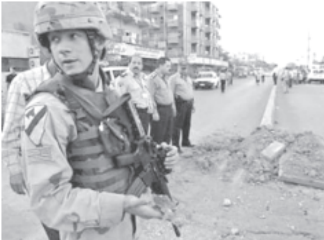
US soldiers and Iraqi policemen survey the scene of a roadside bomb explosion in central Baghdad, on 28 Sept, 2004.