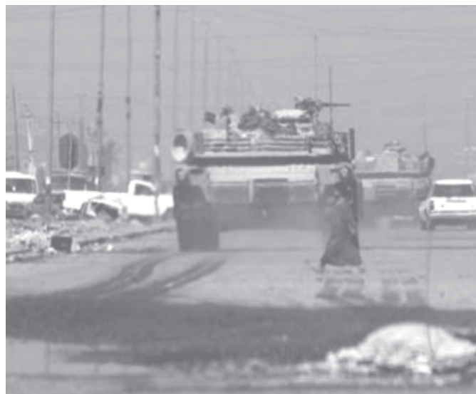
An Iraqi girl walks behind two US tanks on patrol in Sadr City district in Baghdad, on 28 Sept, 2004. The sound of heavy bombardments echoed across Baghdad from the poor Shiite district of Sadr City on Tuesday morning, following a night of sustained US aerial attacks, residents said.