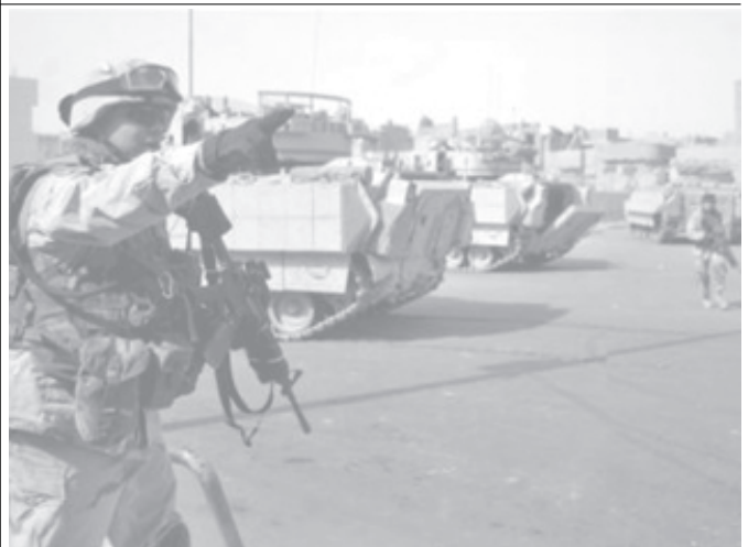
A US soldier points out a place where they should assume position during clashes with Iraqi militants in Haifa Street in Baghdad, Iraq, on 28 Sept, 2004. Haifa Street, a militant stronghold, has been the scene of bloody car bomb attacks, raids and fierce firefights.

"I found the best way to size up for him to form an opinion of me and for me to get something of his personality... was to meet one-to-one," Singh said.