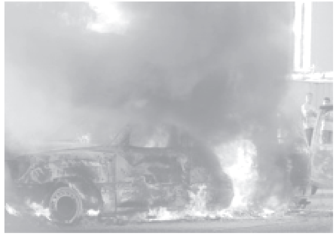
A four-wheel drive vehicle burns during clashes between US troops and Iraqi militants in Haifa Street, Baghdad, Iraq, on 28 Sept, 2004.