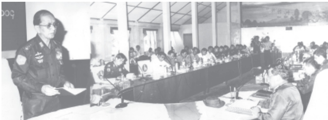
Secretary-2 Lt-Gen Thein Sein meets members of Sagaing Division and eight district agricultural supervisory committees.

Therefore, the Government plans to continue turning out (See page 11)