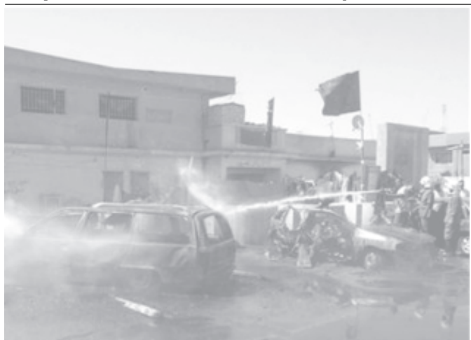
Firefighters hose down a car which caught fire after guerillas fired three mortars that landed close to a US base near Sadr City, Baghdad, Iraq, on 28 Sept 2004. —INTERNET

"We are looking for the Islamic world, the Muslim world, to participate in Iraq," Musharraf said. "That will give us grounds to change public opinion here in Pakistan and is the only way to go forward. We cannot harm our internal environment for the sake of participating in Iraq."—MNA/Reuters