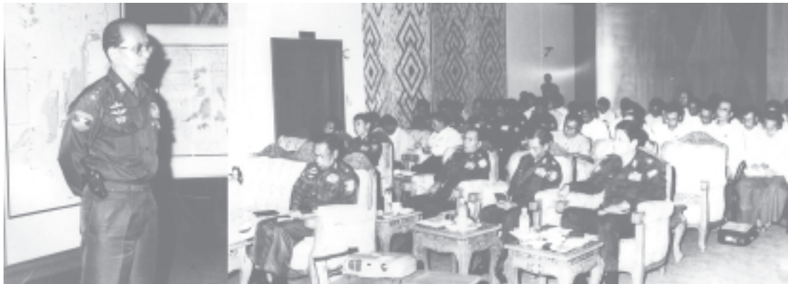
Chairman of Agricultural Development Committee Secretary-2 Lt-Gen Thein Sein gives instructions to officials on agricultural development of Mandalay Division.