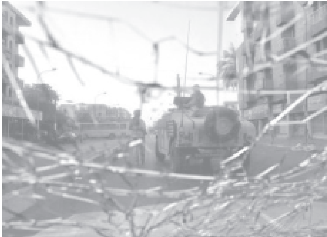
US soldiers guard the scene of a roadside bomb explosion in central Baghdad, on 28 Sept, 2004.