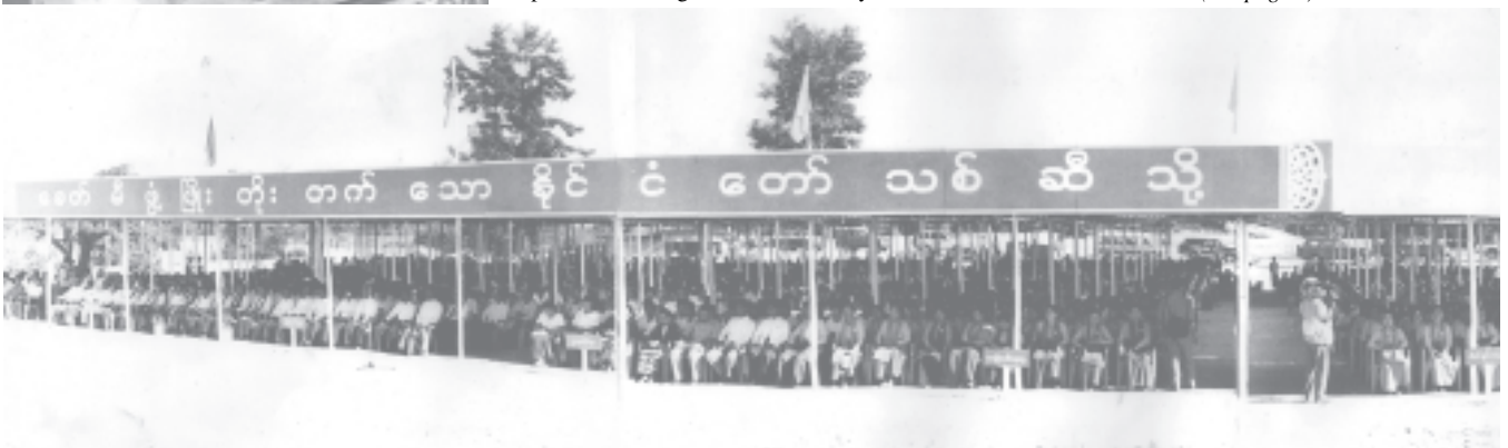
Chairman of Agricultural Development Committee Secretary-2 Lt-Gen Thein Sein addresses opening ceremony of Myothit Dam.