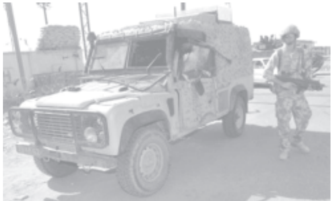
A British soldier stands near a damaged Land Rover after guerillas ambushed a British Army convoy near the southern city of Basra, Iraq, on 28 Sept, 2004.