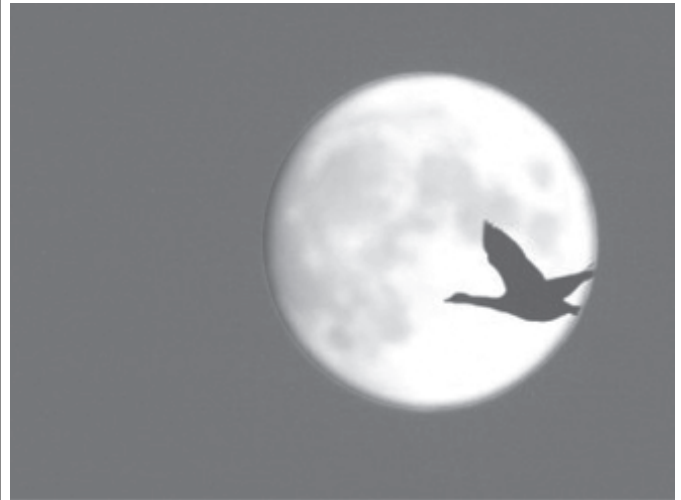
A Canada goose is seen flying across the moon at Oak Hammock Marsh, a wildlife reserve, just north of Winnipeg on 26 Sept. 2004.

standing and 2.735 billion US dollars in deposits in foreign currencies, according to Chen Jing. Between January and June, bank-card-based trade amounted to 12.14 trillion yuan (1.5 trillion US dollars) nationwide, a growth of 60.37 per cent over the same period of last year, Chen Jing added. According to statistics from China UnionPay Co, Ltd, which is devoted to the bank card networking business on the Mainland, 141 card issuers, 370,000 POS (point of sales) machines and 62,000 ATM (automatic teller machine) had been hooked up to the company's bank card business network by the end of June. — MNA/Xinhua