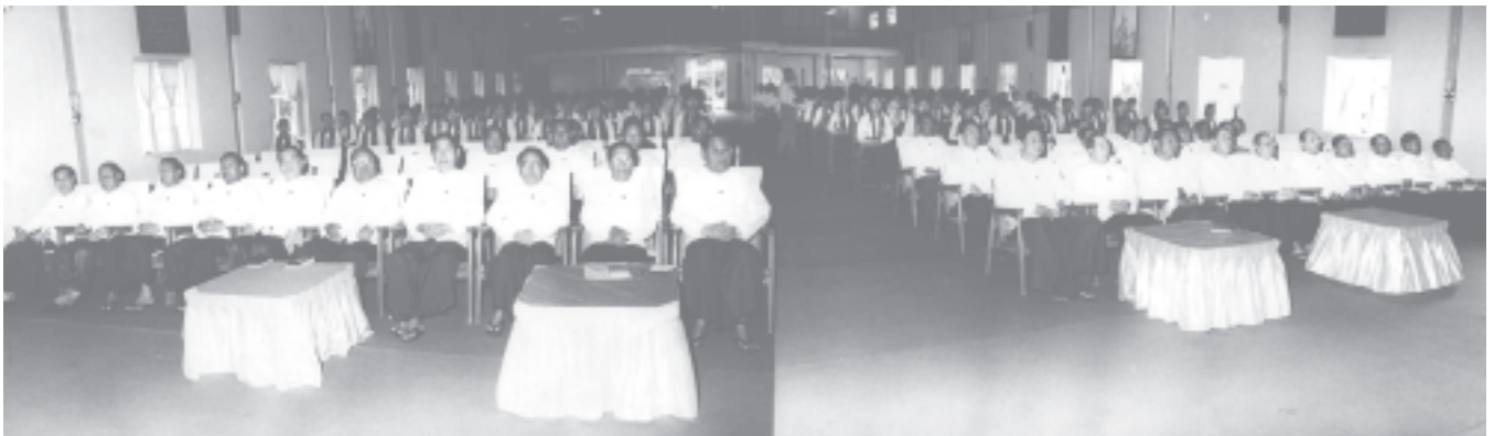
Member of Panel of Patrons of USDA (Central) Secretary-1 Lt-Gen Soe Win addresses conclusion ceremony of Instructor Course No 4 on Myanmar Development and Studies. (News on page 1)—MNA