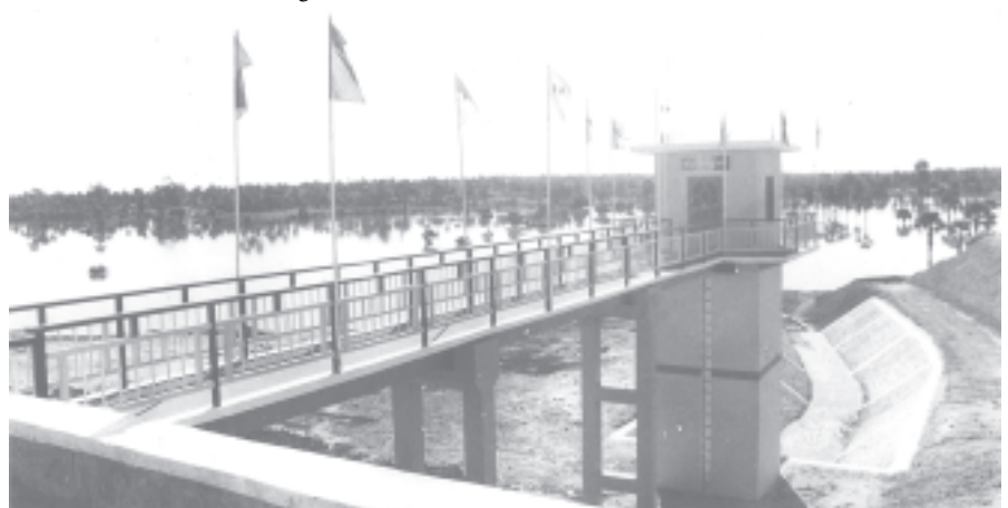
Newly-opened Myothit Dam built on Myothitchaung Village, Budalin Township.