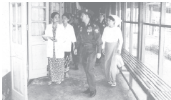
NHC Vice-Chairman Secretary-2 Lt-Gen Thein Sein inspects Monywa General Hospital (200-Bed).— MNA

Deputy Minister for Health Dr Mya Oo inspected Division People's Hospital, Nursing and Midwifery Training Schools and Traditional Medicine Hospital. On 26 September, the deputy minister inspected People Hospital in Kanbalu.— MNA