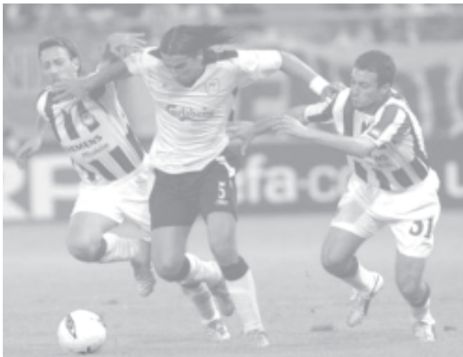
Liverpool's Milan Baros (C) fights for the ball against Olympiakos' Georgios Georgiadis (R) and Pantelis Kafes (L) during their Champions League Group A soccer match at Karaiskaki Stadium in Athens on 28 Sept, 2004.

MONACO, 29 Sept— Early goals by strikers Mohamed Kallon and Javier Saviola earned Monaco a 2-0 victory over Deportivo Coruna in a Champions League Group A match on Tuesday.