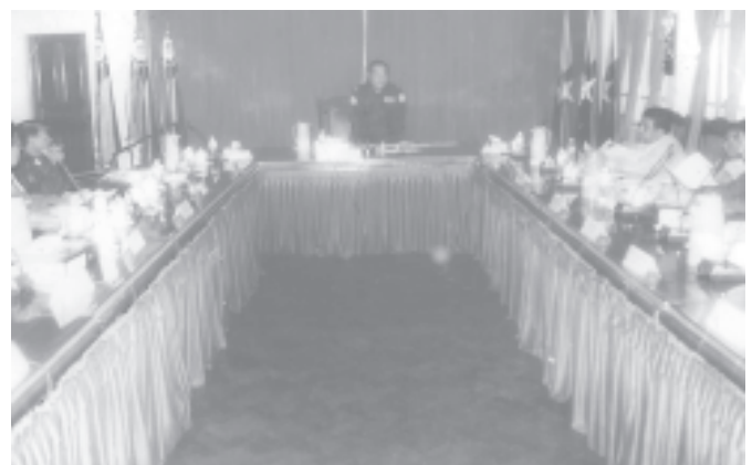
Deputy Minister for Home Affairs Brig-Gen Phone Shwe addresses first meeting of Work Committee for holding Coordinated Mekong Ministerial Initiative against Trafficking. — HOME AFFAIRS

Also present at the meeting were Vice-Chairman of the Working Committee Deputy Minister for Information