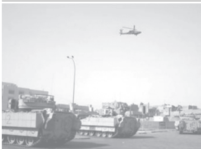
Armoured vehicles and an Apache helicopter provide support during clashes with Iraqi militants in Haifa Street, Baghdad, Iraq, on 28 Sept, 2004.

"The children were on their way from the (central Greek town of) Trikala to Athens to watch the Games when their bus collided with a truck," a police spokesman said. The crash happened about 100 miles north of Athens. There were 41 pupils and teachers on board the bus.