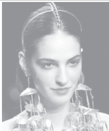
Intricate earrings; A model wears a creation as part of Pollini by Rifat Ozbek's Spring/Summer 2005 women's collection at Milan's fashion week.—INTERNET

Anthrax is an acute infectious disease caused by spore-forming bacteria whose spores can survive in an environment for a long time. — MNA/Xinhua