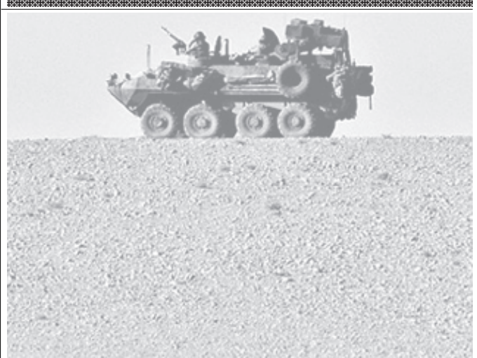
US Marines in a Light Armour Vehicle secure the Iraqi border with Syria in Al Waleed, on 28 Sept, 2004.

မြန်မာ့စွေတာ၊ သိန်းပါးလေလွင့်၊ ထုတ်ကုန်မြင့်