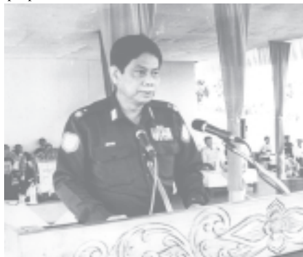
Minister for Agriculture and Irrigation Maj-Gen Htay Oo speaking at opening of Myothit Dam.

In conclusion, the Secretary-2 called on local administrative bodies, departmental personnel and local people: