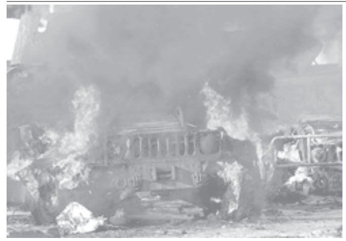
Two US military Humvees burn after a car bomb exploded in al-Mansour neighbourhood of Baghdad, on 22 Sept, 2004. Eyewitnesses said that US soldiers were injured in the attack.