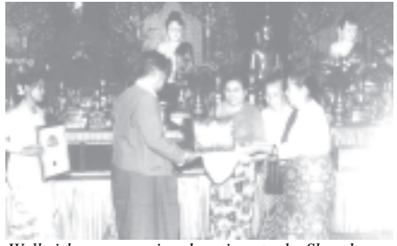
Wellwishers presenting donations to the Shwedagon Pagoda through an official of the pagoda board of trustees.