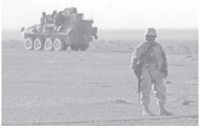
US Marines from the 1st Expeditionary Unit patrol along the Iraqi-Syrian border on 25 Sept, 2004.