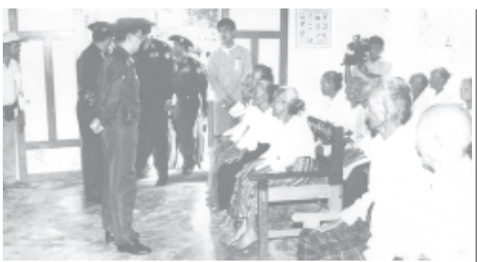
Secretary-2 Lt-Gen Thein Sein cordially meets aged persons in Seikphu-Myaung Model Village in Kanbalu Township.

Minister Maj-Gen Tin Htut briefed them on