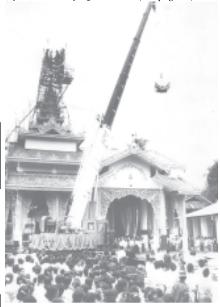
The Htidaw hoisting ceremony in progress.