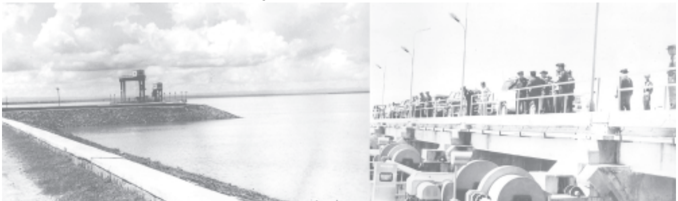
Secretary-2 Lt-Gen Thein Sein looks into the Thaphanseik Dam.

Article For whom does the US extend its economic sanctions on Myanmar? (Page 7)