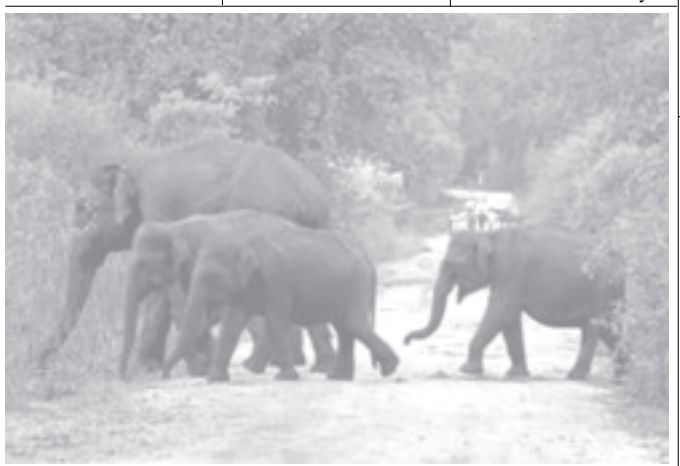
Wild elephants cross the road at Rotawawe observation point in Anuradhapura, 110 miles (180 km) northeast of Colombo, Sri Lanka, on 27 Sept. 2004. — Internet

"Several addresses | News of the World, a Sunday tabloid, which had received an anonymous call about the alleged terror plot. All four have been taken into custody at a central London police station for questioning, he added. MNA/Xinhua