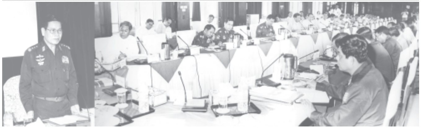
Chairman of Myanmar Education Committee Prime Minister General Khin Nyunt delivers a speech at Meeting No 3/2004 of the MEC.

Ministry of Education holds conferences annually with scholars and teachers, makes reviews of previous tasks, coordinates future plans