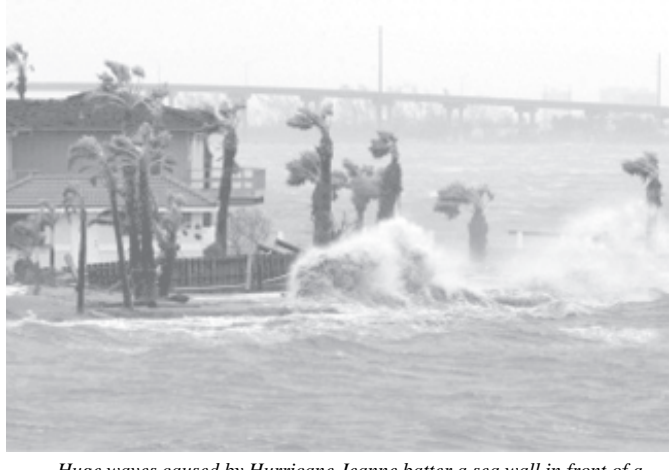
Huge waves caused by Hurricane Jeanne batter a sea wall in front of a water front home on the inter coastal waterway in Ft Pierce, Florida, battered southeastern Florida for hours on 26 Sept, 2004 .