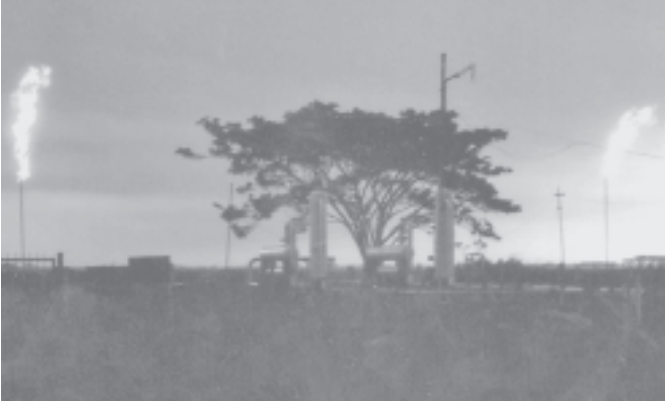
Oil well No 23 produces 5,016 million cubic feet of natural gas and 48 barrels of condensate per day. — ENERGY

(Exploration) of Myanma Oil and Gas Enterprise, reported on successful drilling of Nyaungdon new