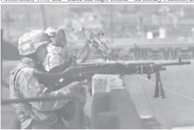
US Army soldiers guard a rooftop stronghold in the Sadr City section of Baghdad, on 23 Sept, 2004.

A second soldier was killed in the same area when a US military patrol vehicle swerved to avoid an Iraqi truck that was being driven erratically. Two soldiers were injured, and one died later from his injuries, the statement said. Outside Fallujah, a suicide car bomber attacked a checkpoint, killing three Iraqi National Guard soldiers, the Associated Press reported.