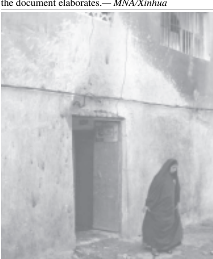
An Iraqi woman leaves a damaged house, following fresh clashes between the US Army and the militia of radical Shiite cleric Moqtaba al-Sadr in the mostly Shiite populated district of Sadr City in Baghdad, on 27 Sept, 2004. —INTERNET

The party's governance capability refers to its ability to "put forth correct theories, guidelines, principles, policies and tactics, lead in the formulation and enforcement of the Constitution and laws, adopt a scientific system and mode of leadership, mobilize and organize the people to manage state and social affairs, economic and cultural undertakings according to law, effectively run the Party, the state and the military, and build a modernized socialist country," the document elaborates .- MNA/Xinhua