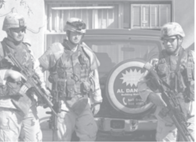
US soldiers come out after checking a house near the Italian Embassy in Baghdad, Iraq, after mortars exploded near it, on 24 Sept, 2004.