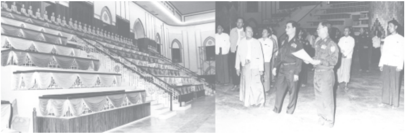
Prime Minister General Khin Nyunt inspects progress in decoration of Maha Pasana Cave on Kaba Aye Hill.— MNA