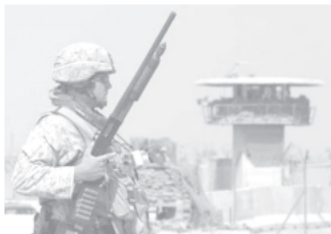
A US soldier stands guard in front of the main gate of Abu Ghraib prison near Baghdad on 24 Sept, 2004.