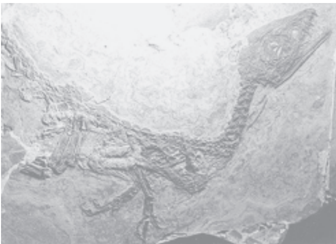
This picture released in 1999 by Oregon State University shows a fossil of a theropod found in Italy. Paleontologists have been wondering what is the purpose of the long neck on a group of predatory reptiles that roamed the earth millions of years ago.

During Chirac's visit, Vietnam and China will sign some 16 documents, mostly involving projects on education and infrastructure, an official from the French Embassy in Hanoi said on condition of anonymity, noting that the French President will be accompanied by around 20 businesses. — MNA/Xinhua