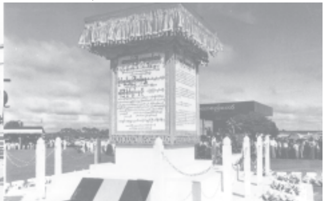
Agricultural Development Committee Chairman Secretary-2 Lt-Gen Thein Sein unveils the stone plaque of Salingyi Dam.