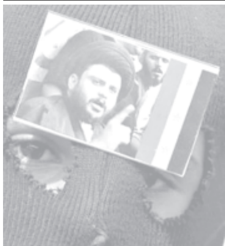
A masked Iraqi boy, a supporter of radical Shi'ite cleric Moqtada al-Sadr, attends a march in the Shi'ite dominated Sadr City district of Baghdad, on 24 Sept, 2004. — INTERNET

Over the past four years, the UAE has pumped more than eight billion US dollars into its oil sector within long-term plans to maintain its current output and expand capacity. — MNA/Xinhua