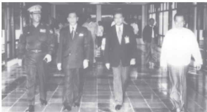
Minister for Foreign Affairs U Nyan Win being seen off at the airport before departure for New York.

Minister for Finance and Revenue Maj-Gen Hla Tun, Minister for Science and Technology U Thauang, Representative of UNFPA Mr Najib M Assifi on behalf of the UN Resident Representative, Deputy Ministers for