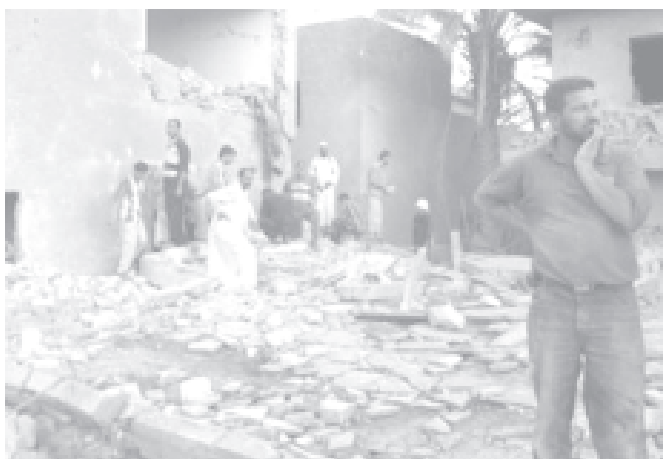
People stand on the rubble of destroyed houses in Fallujah, Iraq on 25 Sept, 2004.