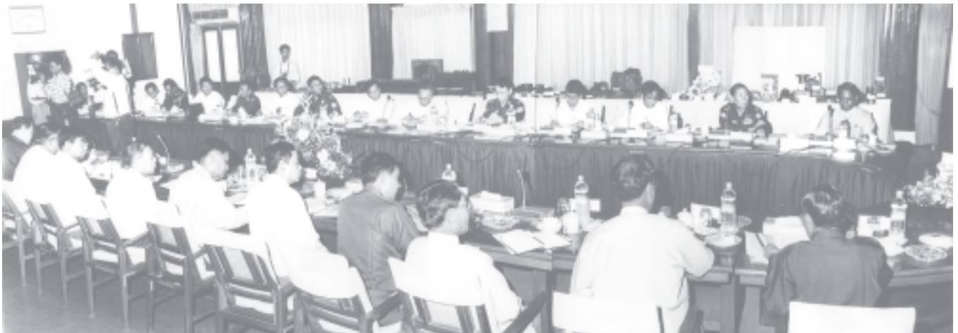
Industrial Development Committee Chairman Secretary-1 Lt-Gen Soe Win addresses coordination meeting to establish modern iron product factories in Mandalay, Monywa and Taunggyi (Ayethaya) Industrial Zones.