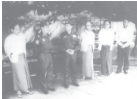
Dry Day Supervisory Committee Chairman Minister for Mines Brig-Gen Ohn Myint supervises dry day inspection teams.

YANGON, 12 Sept — Chairman of the Dry Day Supervisory Committee Minister for Mines Brig-Gen Ohn Myint, Vice-Chairman Minister for Transport Maj-Gen Thein Swe, members of the committee Deputy Minister for Construction U Tint