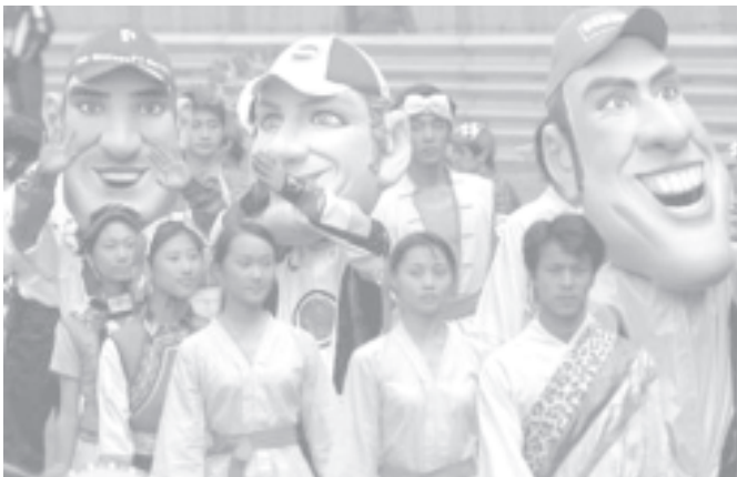
Wearing masks representing F-1 drivers, Chinese performers march during the opening ceremony of the Chinese Grand Prix at the Shanghai Circuit on 26 Sept, 2004. Shanghai hosts the inaugural Chinese Grand Prix on Sunday with a breathtaking $325 million Shanghai Circuit and a sellout crowd of at least 150,000, one of two debut grand prix this year - the other was Bahrain's first race in the Middle East - that allow Formula One to boast of being a truly global championship.