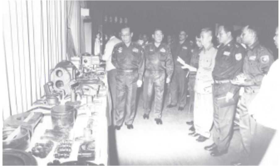
Secretary-1 Lt-Gen Soe Win inspects machine parts displayed at the meeting to establish modern iron product factories in Mandalay, Monywa and Taunggyi (Ayethaya) Industrial Zones.

The government is making arrangements to establish industrial zones and to give necessary assistance for private industry. These efforts are being made for the private industry to get on the way to progress and success. Realising the objective and goodwill of the State, state-owned and private-owned factories are to make coordinated efforts for development of industrial sector. Next, Minister U Aung Thuang reported on raising of funds for construction of foundry plants and press shops and construction progress, preparations for supply of raw