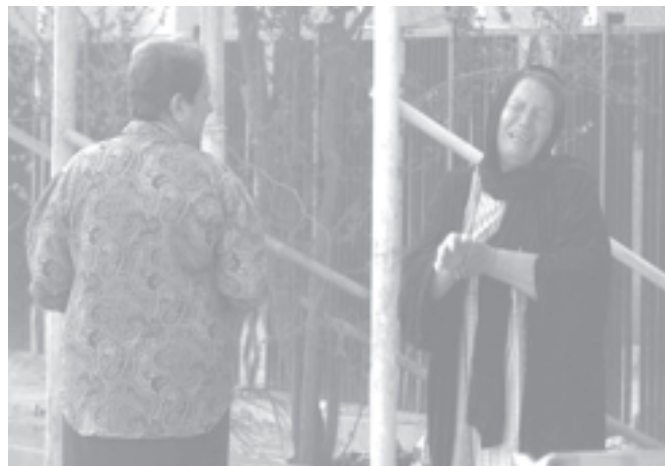
An unidentified woman cries after her husband died in a rocket attack on Palestine Street, in Baghdad, Iraq, on 24 Sept, 2004.

Dhuluiyah, some 90 kilometres north of Baghdad, is inhabited with Sunni Muslim Iraqis who have fought US occupation since April 2003.