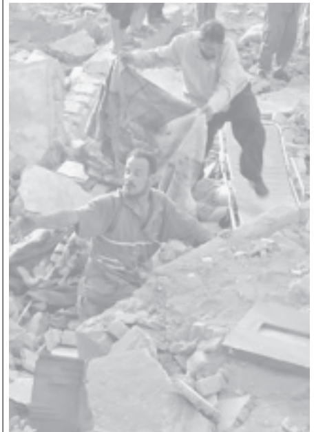
Iraqi men inspect a destroyed house, following a US Army bombardment in the town of Fallujah, on 25 Sept, 2004. — INTERNET

Iraq's oil infrastructure is the target of frequent attack by guerillas, preventing the country from restoring exports and bringing in much-needed hard currency. Pipelines supplying two refineries in southern and northern Iraq were attacked on Friday. — Internet