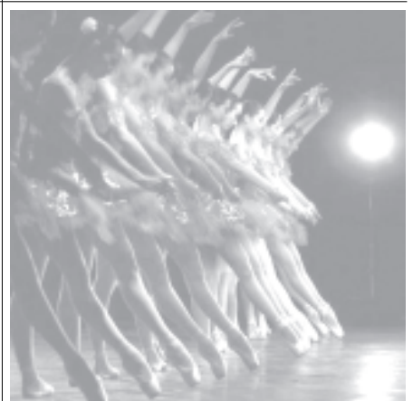
Chinese ballet dancers rehearse, for their performance during the National Day holiday, in Guangzhou, southern China on 24 Sept, 2004. China celebrates its 55th National Day on 1 Oct.

Relevant agencies of Vietnam and China are currently exploring possibilities of letting their automobiles to travel in some localities of each country. The move aims at facilitating transport, trade and tourism in the two economic corridors involving the two Chinese provinces of Yunnan and Guangxi and five Vietnamese localities of Hanoi, Hai Phong, Quang Ninh, Lao Cai and Lang Son. — MNA/Xinhua