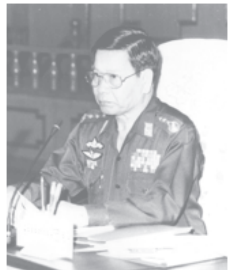
Prime Minister General Khin Nyunt addresses coordination meeting to produce medicines for six major common diseases.