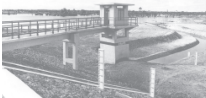
Control tower of Salingyi Dam built in Salingyi Township— MNA