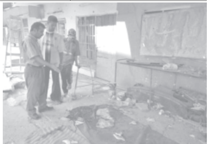
Men stand near a pool of blood left after a rocket landed nearby, in Baghdad, Iraq on 24 Sept, 2004.

Earlier in the day, Dubai-based al-Arabiya TV channel reported that kidnappers seized six Egyptians and four Iraqis working for a mobile phone company in separate incidents in the war-torn country. — MNA/Xinhua