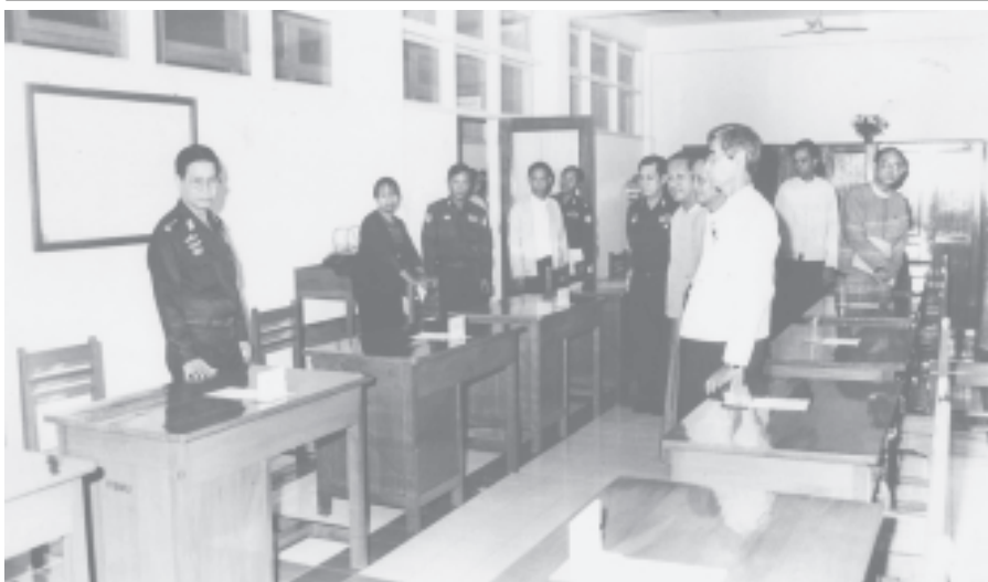
Prime Minister General Khin Nyunt inspects office of Secretariat for Fourth World Buddhist Summit at International Theravada Buddhist Missionary University.