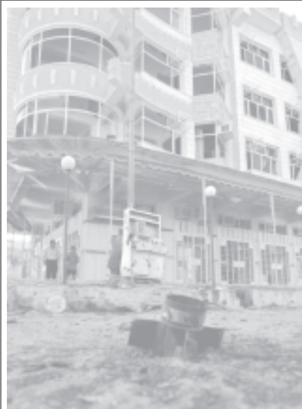
The remains of a rocket is seen on a street outside a destroyed building in Baghdad on 24 Sept, 2004.