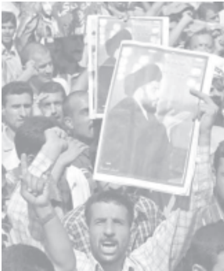
Iraqi Shi'ite men shout anti-US slogans in Baghdad, on 24 Sept, 2004.

Guerillas are fighting back in other parts of Anbar province, covering much of western Iraq and including the mid-Euphrates cities of Fallujah and Ramadi. Four marines were killed in three separate incidents on Friday. Another soldier was killed by a bomb yesterday, bringing to 1,042 the total number of US military killed since the invasion of Iraq in March 2003. A further 7,000 have been wounded. — Internet