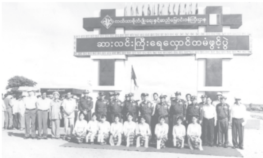
Secretary-2 Lt-Gen Thein Sein and party pose for documentary photo with local people at the opening ceremony of Salingyi Dam.— MNA

construction of a die and mould making plant along with the foundry shop, forging and heat treatment shops and machine shops. After the meeting, Secretary-1 Lt-Gen Soe Win and party viewed the power tillers and parts of four-inch pump displayed at the meeting hall. — MNA