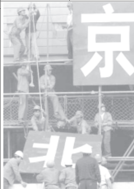
Chinese labourers work on a scaffolding at the National Museum in Beijing on 24 Sept, 2004. China's capital is renovating its city infrastructure for the 2008 Summer Olympic Games.

The move aroused public interest, and nearly 10,000 scholars, expeditioners and others came up with various hypotheses.—MNA/Xinhua