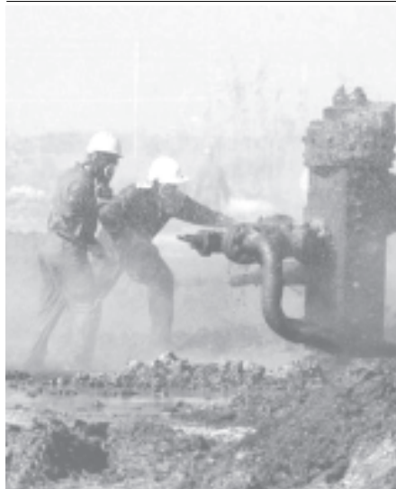
Oil workers try to stop the oilflow close to a burning pipeline near al-Fahhama Village, 25 kms north of Baghdad, on 23 Sept, 2004.