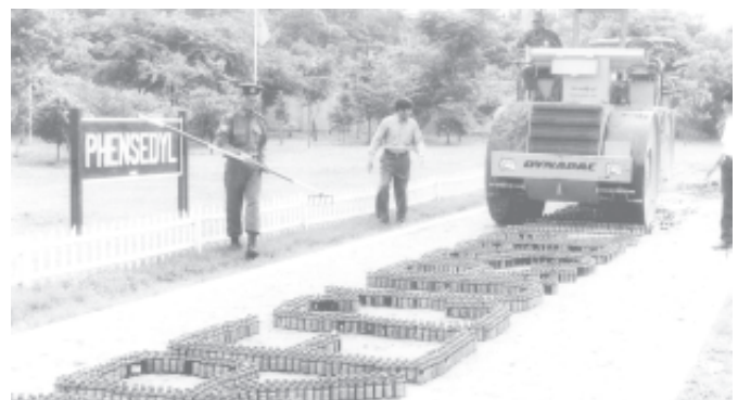
Bottles of cough syrup with drug potency being destroyed by rollers at the 17th destruction ceremony of seized narcotic drugs on 27-6-2003.

The Government is taking steps to completely wipe out smuggling and trading narcotic drugs in Tachilek, Myawady and Kawthoung, which share border with neighbouring nations, after designating these townships to be drugs free zones.