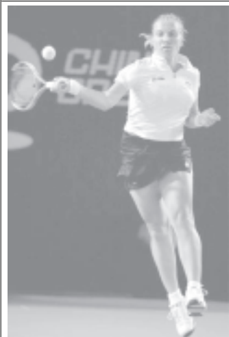
Russia's US Open champion Svetlana Kuznetsova returns a forehand to China's Li Na during a second round match at the China Open WTA tennis tournament in Beijing on 23 Sept, 2004. Kuznetsova won 6-3, 6-7, 7-6.