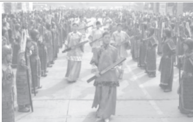
Chinese youths dressed as ancient soldiers and ladies perform to entertain visitors at a property fair in Xian, the capital of China's Shaanxi Province, on 23 Sept, 2004. China property sales surged 41.4 per cent year-on-year to 365.7 billion yuan ($44.32 billion) in the first seven months, with 134 million square metres of property sold, up 25.2 per cent, according to official figures.