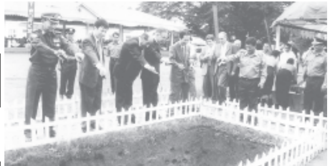
Diplomats and UN officials destroying narcotic drug potent cough syrup on 27-6-2004.