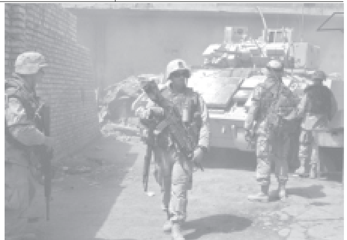
A picture released by the Multi National Force-Iraq (MNF-I) shows US troops securing an alley during a raid in Baghdad's Shiite Sadr City neighbourhood recently.