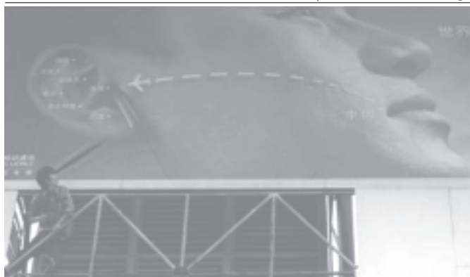
A man works underneath a billboard advertising mobile phone services in Guangzhou, the capital of southern China's Guangdong Province, in this picture taken on 22 Sept, 2004. China is the world's largest mobile phone market and occupies a growing share of the global handset market. —INTERNET

Vietnam Plans to boost the turnover of woodwork export up to 750 million US dollars in 2004 and one billion US dollars in 2005, up from 563 million US dollars in 2003. It will expand exports to the United States and open such new markets as South Africa, Kuwait, Chile and Peru. —MNA/Xinhua