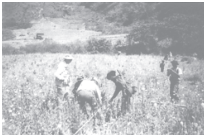
US and Myanmar joint opium survey in 2004.

national development are huge as they are to be carried out on self-reliant basis. But they are to be regarded as national duties.