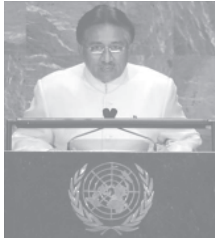
Pakistan President General Pervez Musharraf addresses the United Nations General Assembly on 22 September, 2004.

"That itself will be the best option of substituting the US and British forces to withdraw from their high visibility, handing over to Iraqi local forces, and then ultimately working out an exit strategy after an elected