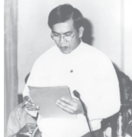
CCDAC Vice-Chairman Minister for Foreign Affairs U Nyan Win.— MNA

The 15-year plan has been implemented in connection with the New Destiny Project as the task of drug eradication alone cannot bring success. The anti-drug drive will