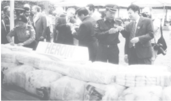
Ambassadors, diplomats, UN officials test narcotic drugs to be burnt on 27-6-2004.