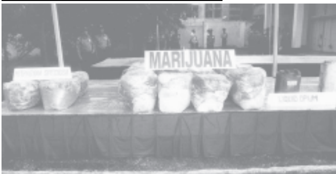
Seized narcotic drugs seen at 18th Destruction of Seized Narcotic Drugs on 27-6-2004.

The drug elimination tasks have met progress to a greater degree, and Myanmar was proud to have declared to the international community that Mongla Region in Shan State (East) had been a narcotic drugs free area. At the same time, Kokang and Wa regions are putting their goal into practice to eliminate narcotic drugs in respective regions by 2005.