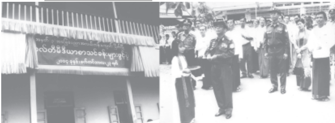
Lt-Gen Maung Bo unveils signboard of the multimedia classrooms at Myeik BEMS No 3.