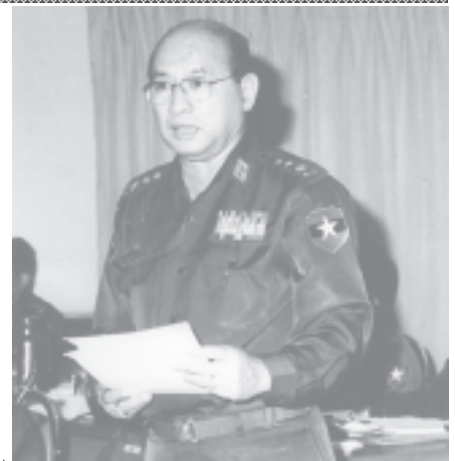
CCDAC Chairman Minister for Home Affairs Col Tin Hlaing.

organizations to eradicate narcotic drugs. Myanmar-China, and Myanmar-Thailand and UNODC tripartite agreement was signed in 1992, Myanmar-