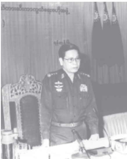
Prime Minister General Khin Nyunt addresses Special Meeting No 2/2004 of Central Committee for Drug Abuse Control.—MNA

International community acknowledges nation's anti-drug drive success