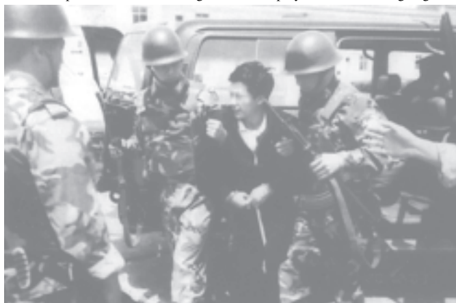
Chinese drug kingpin, Tan Xioli repatriated to China on 23 April 2001.