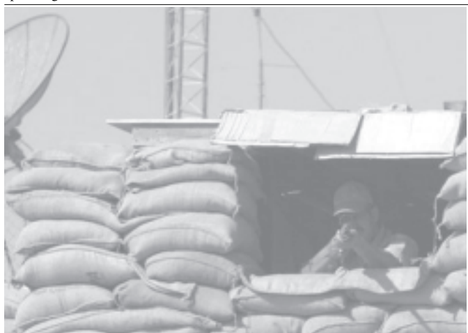
A security guard takes aim as he guards the Italian Embassy in Baghdad, on 23 Sept, 2004.

Hailing Singh as the leader of the world's largest democracy, Thain said the financial community is looking forward to hearing his vision for India's future. "We hope to hear of the opportunities for greater economic cooperation between our two great nations."