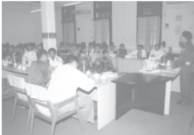
Minister for Information Brig-Gen Kyaw Hsan addresses third ceremony to donate cash and books to self-reliant village libraries.

Next, the minister accepted K 2 million of Chairman of Shan State (North) Peace and Development Council Commander of North-East Command Maj-Gen Myint Hlaing; K 1 million donated by U Tint Hsan (ACE Construction Co Ltd); K 200,000 each by U