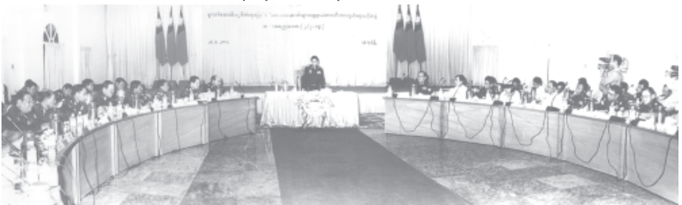
The special meeting (2/2004) of the Central Committee for Drug Abuse Control in progress.

Emergence of the State Constitution is the duty of all citizens of Myanmar Naing-Ngan.