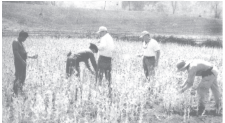
Members of Myanmar-US opium yield survey team conduct opium yield survey in Tanyan Township in Shan State (North) on 25 February 2002.