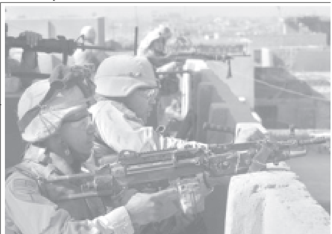
US Army soldiers watch over the Sadr City section of Baghdad, from a rooftop position on 23 Sept, 2004.

in Sino-Russian trade relations. Zhukov also spoke highly of the remarkable development in cooperation between Russia and China. He said the meeting of the two countries' prime ministers is very important since it enables leaders from both countries to analyze the state of their cooperation and make plans for the future. —MNA/Xinhua