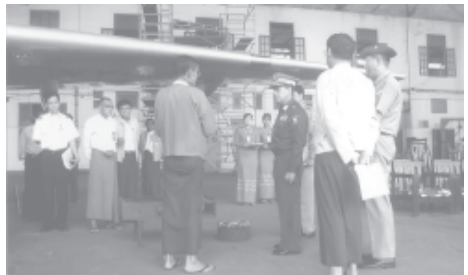
Minister for Transport Maj-Gen Thein Swe inspects mechanical division of Myanmar Airways.—TRANSPORT

The Deputy Minister gave a supplementary report. After giving necessary instructions, the minister attended to the needs and inspected the repair work in the division. —MNA