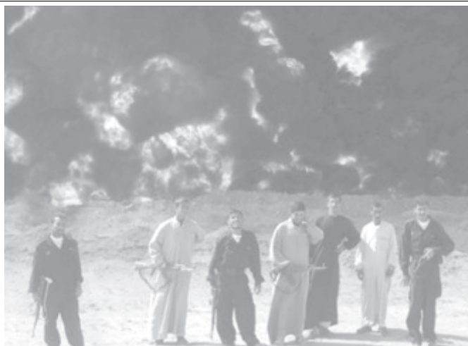
Policemen and private guards stand near a burning oil pipeline after suspected guerillas blew it up at Angour, 80 kms east of Fallujah, Iraq, on 23 Sept, 2004.—INTERNET

Guerillas waging a 17-month insurgency here have repeatedly targeted Iraq's crucial oil infrastructure in a bid to destabilize Iraq and undermine the US-backed interim authorities. —Internet