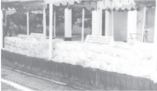
Seized narcotic drugs seen at the 17th destruction on 27-6-2003.

In accordance with the instructions given by the Prime Minister at the special meeting of CCDAC held on 7 September, 2003, the construction of Shwepyithit Rehabilitation Centre was started near Teema Village in Muse Township and is now 90 per cent completed. And efforts are being made so that it can be inaugurated in the coming November. Moreover, necessary steps are being taken to be able to establish Tachilek, Kawthoung and Myawady Districts as