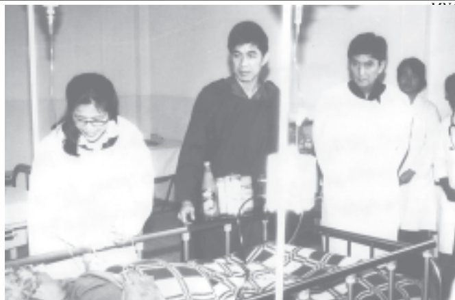
Minister for Health Dr Kyaw Myint and visiting Thai counterpart comfort patients at NyaungU District Hospital.—HEALTH