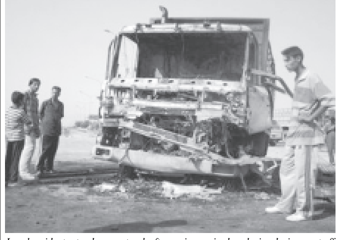
Local residents stand near a truck after an improvised explosive device went off under it, in Baghdad, Iraq on 19 September, 2004. The driver died and two persons were injured in the explosion.