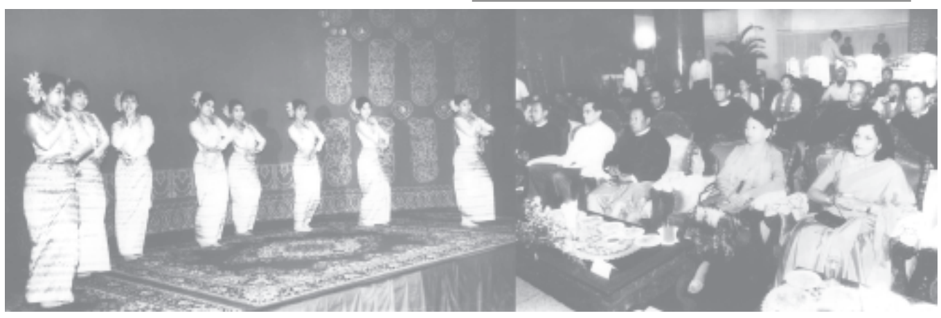
Lt-Gen Ye Myint and Indian delegation enjoy Myanmar traditional cultural dance after dinner at Myayeiknyo Royal Hotel. (News on page 16)