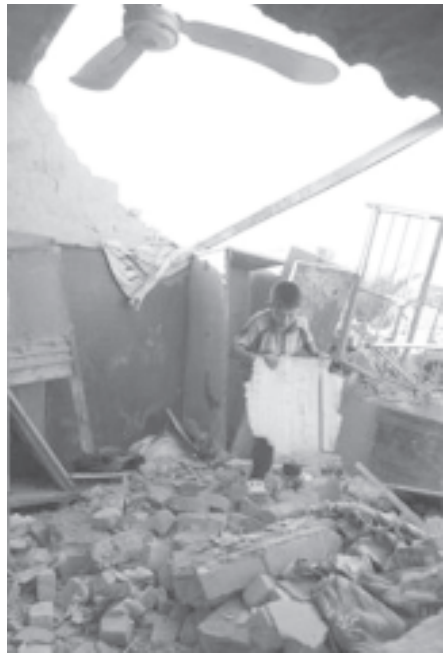
A young boy picks up reusable pieces of materials after rockets allegedly fired from a US fighter plane damaged a house, according to evewitnesses, in Sadr City, Baghdad, on 19 Sept, 2004. One person was injured in the attack.

Overall more than 100 foreigners from dozens of countries have been snatched in the last six months, and at least 30