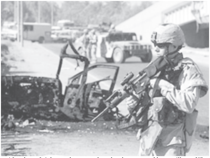
After days of violence when several car bombs were used by guerillas, a US soldier looks at a suspected car bomb through a pair of binoculars in Baghdad, on 16 Sept, 2004.