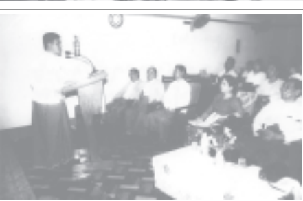
President of MCBA briefs on the course.