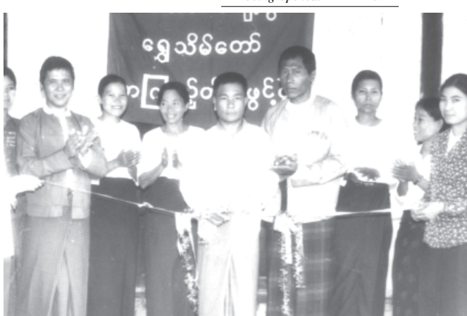
Shwetheindaw self-reliant library beeing opend in Khawtaw Village in Wetlet Towship, Sagaing Division.

Knowledge banks or libraries opened in villages on self-reliant basis