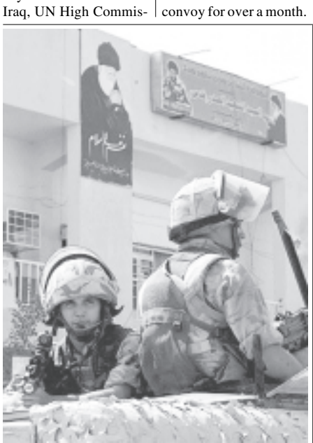
British soldiers are positioned outside the Basra office of radical Iraqi cleric Moqtada Sadr on 19 Sept, 2004.