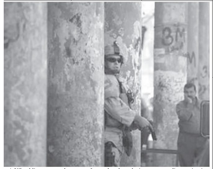
A US soldier secures the scene of a car bomb explosion near a police station in central Baghdad, on 17 September, 2004.

Guerillas have carried out most of the kidnappings in a bid to drive foreign companies out of Iraq and thwart the US-led reconstruction of the country.