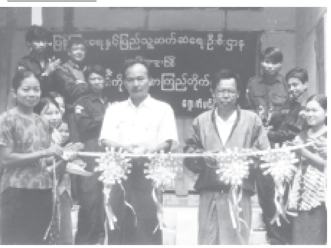
People living in Shaukpinyoe Village in Singu Township, PyinOoLwin District, have now access to books in the self-reliant library opened in their village.