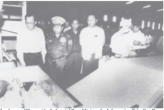
In-charge of Shwepyitha Industrial Zone Minister for Information Brig-Gen Kyaw Hsan inspects MB biscuit factory of Super Five Manufacturing Co Ltd.

Next, Minister Brig-Gen Kyaw Hsan inspected