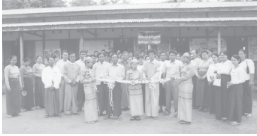
The opening ceremony of self-reliant library in Sint-in Village-tract in Shan State (North).— H