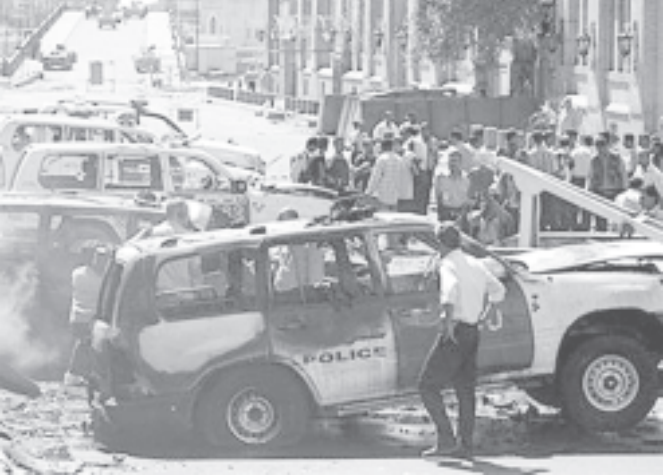
Iraqi policemen gather around smouldering police cars after a suicide bomber detonated an explosives-filled car targeting an Iraqi police convoy near Rasheed Street in central Baghdad, on 17 Sept, 2004. Five died and 20 were injured in the attack.