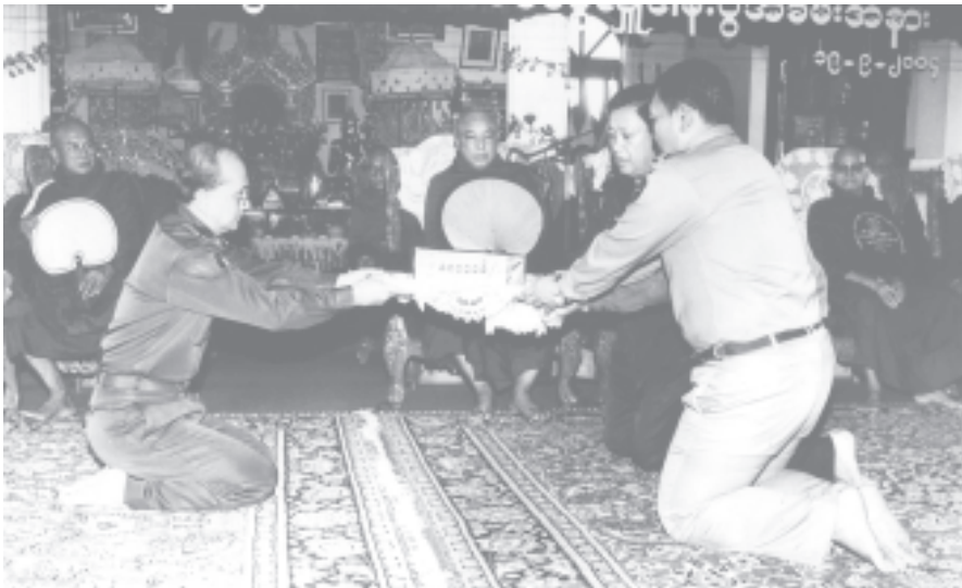
Secretary-2 Lt-Gen Thein Sein accepts cash donations from a wellwisher at the ceremony to donate provisions to monasteries in Mingala Taungnyunt Township.