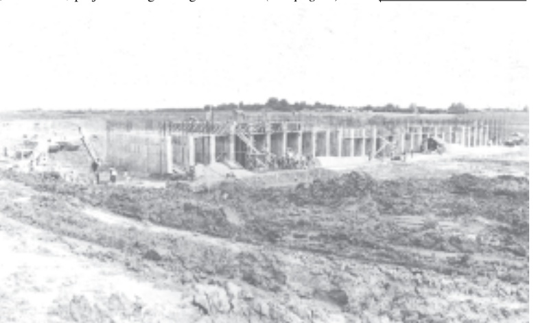
Secretary-2 Lt-Gen Thein Sein inspects construction of Kayan Sluice Gate Project.— MNA

Emergence of the State Constitution is the duty of all citizens of Myanmar Naing-Ngan.