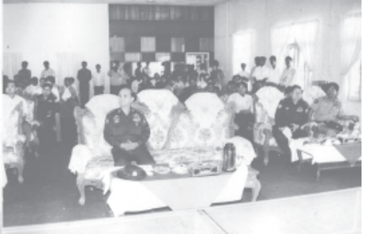
Secretary-2 Lt-Gen Thein Sein hears reports on water supply for cultivation and greening tasks all the year round by Commander Maj-Gen Myint Swe.

Yangon-Thanyin Bridge No 2 Construction Project to Kayan Sluice Gate Construction Project being implemented by the Ministry of Agriculture and Irrigation near Chaungwa village, Thanyin, via Bago River by boat.