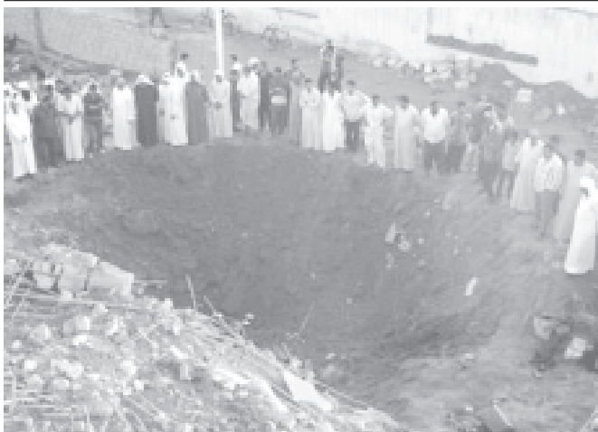
People look at a crater in Fallujah, Iraq on 18, Sept 2004, after an US airstrike on Friday evening.