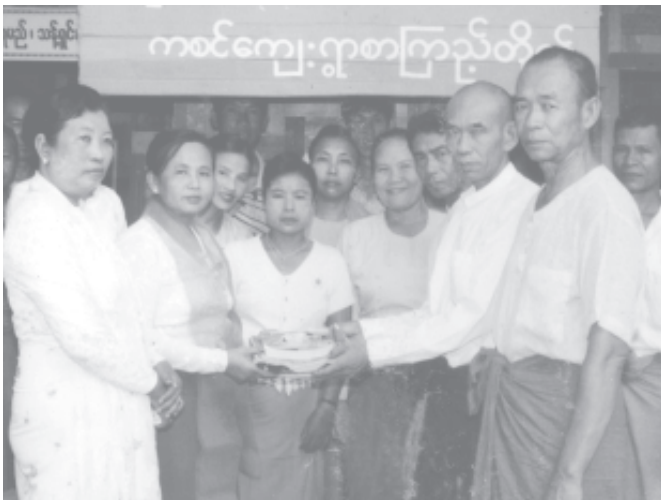
The opening ceremony of library in Kapin Village in Hlinethaya Township in Yangon District (North).

Villagers of Bawkyo Village in Hsipaw Township in Shan State (North) have now access to books in the self-reliant library opened in their village.