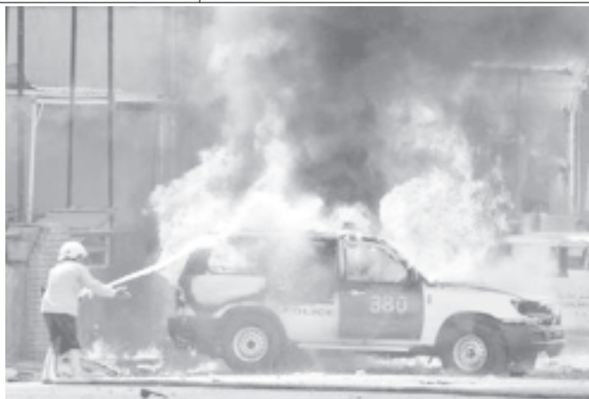
A suicide car bomber struck near a major police checkpoint in central Baghdad on Friday, killing at least five people and wounding 20, health ministry and government sources said. An Iraqi fireman battles a burning car, following an explosion near a police station in Rashid Street in central Baghdad, on 17 Sept, 2004.