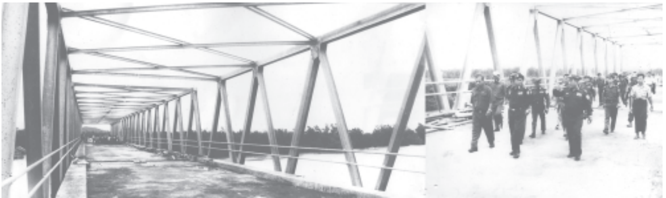
Lt-Gen Khin Maung Than inspects progress of Londawpauk Bridge in An Township.— MNA