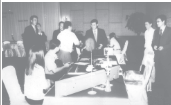
Korean trade delegation of Iksan, the Republic of Korea, holds talks with Myanmar entrepreneurs on 17 September at Traders Hotel.