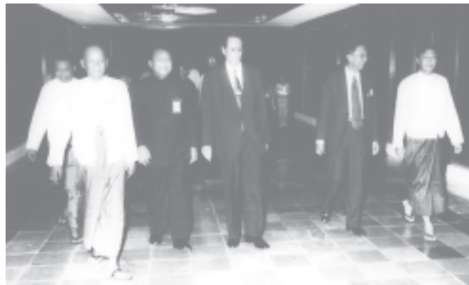
Chief Justice U Aung Toe and party arrive back from Cambodia.

The Myanmar delegation was welcomed back at Yangon International Airport by Attorney-General U Aye Maung, Chairman of Civil Service Selection and Training Board Dr Than Nyun, Deputy Chief Justice U Thein Soe, Deputy Attorney-General U Myint Naing, Judge of the Supreme Court U Khin Myint, Cambo-