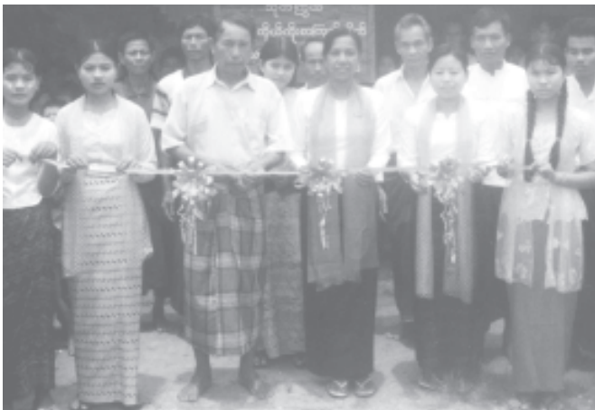
People living in Ywamagyi Village in Yepawle Village-tract in Hmawby Township gain knowledge through a library opened in the village.

Up to 14 September 2004, altogether 8,104 self- reliant libraries were opened nationwide.