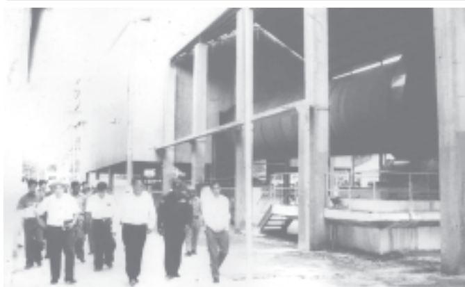
Minister for Industry-1 U Aung Thaung inspects Thayet Cement Plant. INDUSTRY-1