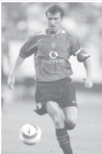
Manchester United skipper Roy Keane has described his performance in the 2-2 Champions League draw with Lyon in midweek as 'abysmal'.