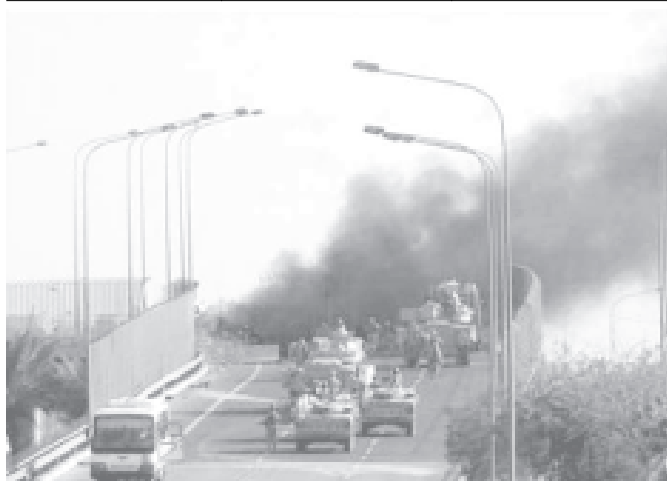
US soldiers investigate after a car bomb exploded as a US military convoy was passing by in Baghdad, Iraq, on 18 Sept, 2004. Three soldiers were wounded in the attack, the military said.