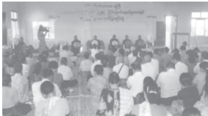
The 28th merit-sharing ceremony for setting up medical trust-fund of Jivitadana Sangha Hospital and ceremony to honour wellwishers in progress.

Next, the well-wishers donated provisions to the Sayadaws.