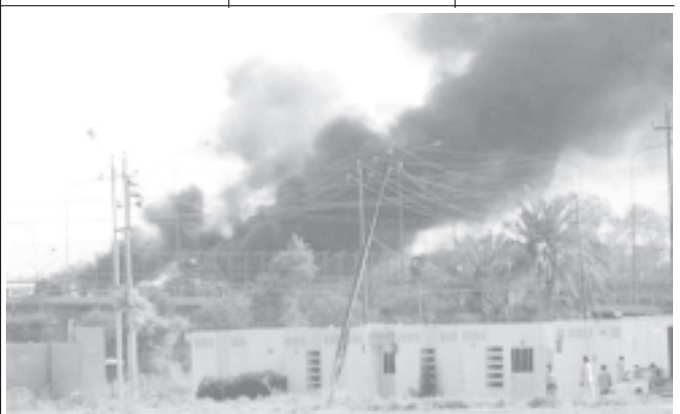
US military vehicles catch fire after a car bomb exploded as a US military convoy was passing by in Baghdad, Iraq, on 18 Sept, 2004. Three soldiers were wounded in the attack, the military said.

make our own decisions. Nobody should try to impose conditions on us concerning the EU," he said. — MNA/Xinhua