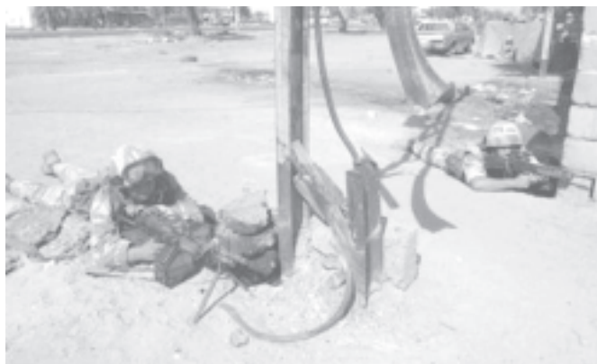
British soldiers at a defensive position outside the office of guerillas Shiite cleric Moqtada al-Sadr in Basra, Iraq, on 18 Sept, 2004.