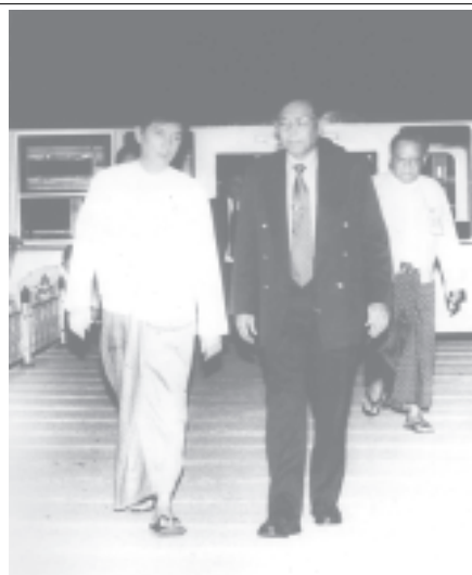
Minister for Health Dr Kyaw Myint welcomes back Deputy Minister for Health Dr Mya Oo at the airport.—HEALTH

Lt-Gen Ye Myint inspected construction of the shaft at the piers and approach structures and flow of water in Pinchar Bridge.