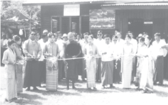
The opening ceremony of self-reliant library in Sabadwin Village in Ayadaw Township, Monywa District, Sagaing Division.