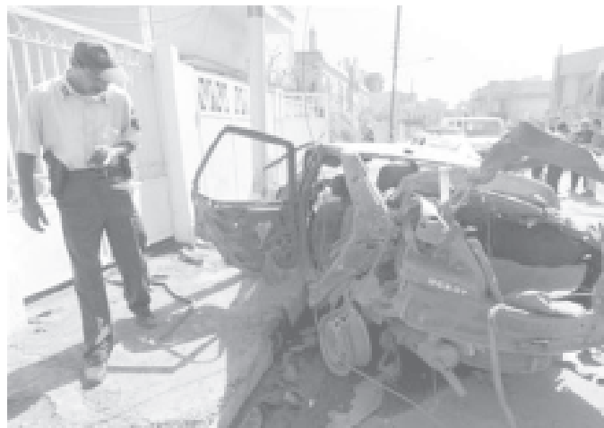
An Iraqi police officer looks over the wreckage of a car which was destroyed by a roadside bomb in central Baghdad, Iraq, on 18 Sept, 2004.