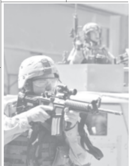
A US soldier points his weapon at incoming vehicles at the scene of a car bomb explosion near a police station at Rashid street in central Baghdad on 17, Sept 2004.