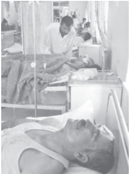
A wounded Iraqi man lies in the city's hospital in Kirkuk, on 18 September, 2004. A suicide car bomb attack on Saturday outside the regional headquarters of the Iraqi National Guard in the northern city of Kirkuk killed 23 men, most of whom were waiting to join the force, doctors said.