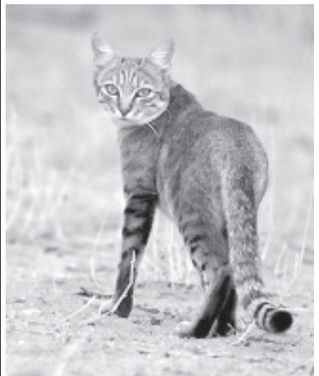
African wild cat. The ancient Egyptians put as much care into mummifying their animals as they did to their kings and relatives, according to a study published in the British scientific journal Nature.

uniform official selling price and significant spot trading of West Asian crude to increase liquidity and establish a genuine and representative market for crude oil for fast-growing Asian market." The traditional producer benchmark prices, like Brent, Dubia/Oman, should not apply for Asian importers, who should be indexed to the crude they produce, he said.—MNA/PTI