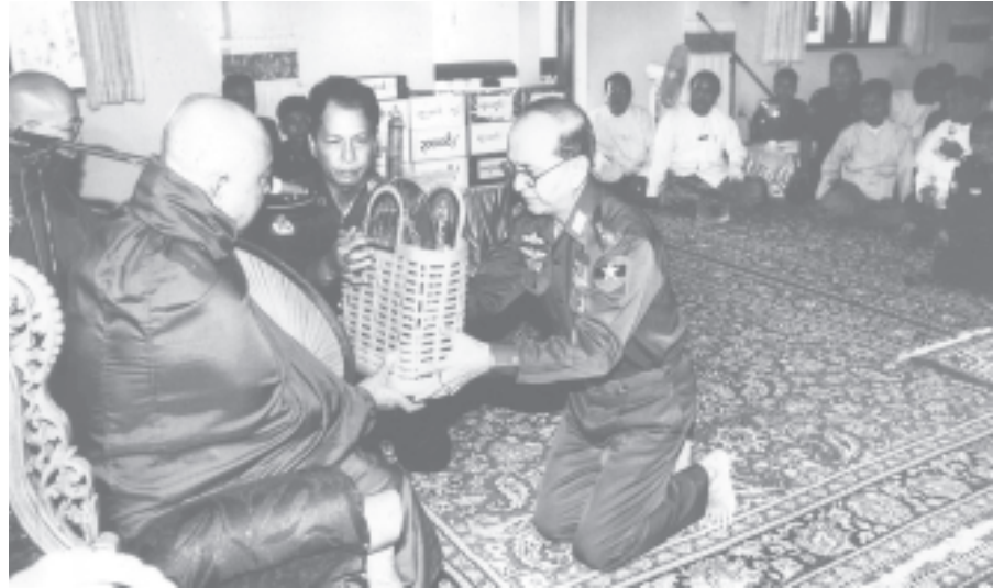
Secretary-2 Lt-Gen Thein Sein offers provisions to a Sayadaw at the donation ceremony for monasteries in Mingala Taungnyunt Township.