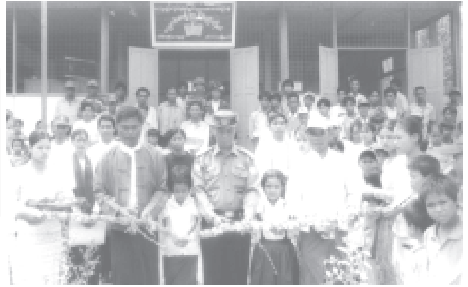
Self-reliant library being opened in Theingon Village in Pintaya, Shan State (South).

Up to 14 September 2004, altogether 8,104 self- reliant libraries were opened nationwide.