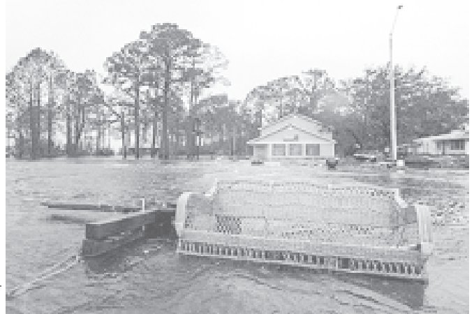
A wicker couch floats in a flooded section of Highway 59 on 16 September, 2004 in Gulf Shores, Alabama. —INTERNET

He said Uganda occupied an important position with the ADB, in terms of commitments and being the second largest beneficiary of concessional resources from the African Development Fund (ADF), with allocations amounting to 180 million dollars. The ADF is a concessional lending arm of ADB. —MNA/Xinhua