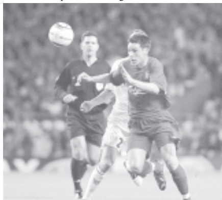
Liverpool defender Steven Finnan races to the ball ahead of Monaco midfielder Pontus Farnerud during their Champions League match at Anfield.—INTERNET

United, who lie 11th in the table, have endured their worst start to a Premier League season with only six points from their first five games. Liverpool are in eighth position with seven points from four games.—MNA/Reuters