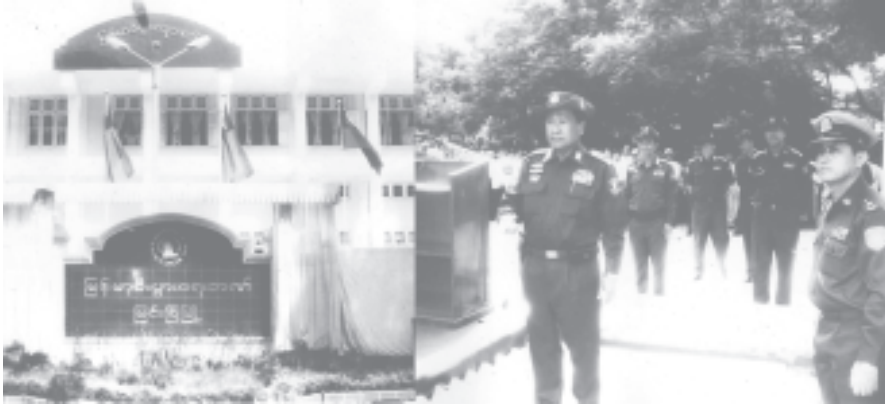
Lt-Gen Ye Myint unveils signboard of Myingyan Myanmar Economic Bank.—MNA