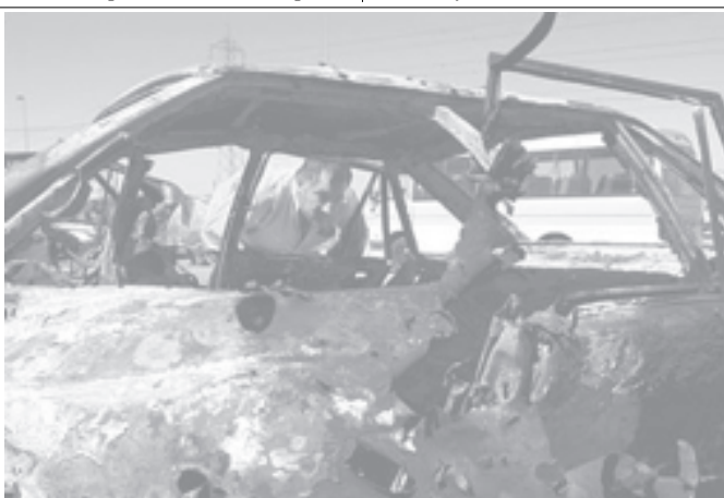
A local resident inspects a car in a parking lot that was allegedly fired upon by US troops, in Sadr City, Iraq, on 13 Sept, 2004.—INTERNET

Donor countries have given only about half of the total amount they agreed would be needed to implement the Programme of Action — 3.1 billion US dollars a year rather than 6.1 billion US dollars a year, it said.—MNA/PTI