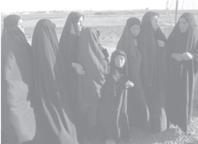
Women wait outside Abu Ghraib Prison, for the release of family members held prisoner there, in Baghdad, Iraq, on 15 Sept, 2004. —INTERNET

Fighters loyal to Moqtada Al-Sadr, the rebel Shi'ite cleric, and Sunni insurgents in militant strongholds such as Fallujah often take those killed in fighting straight to burial sites, rather than have their deaths recorded centrally in hospitals. — Internet