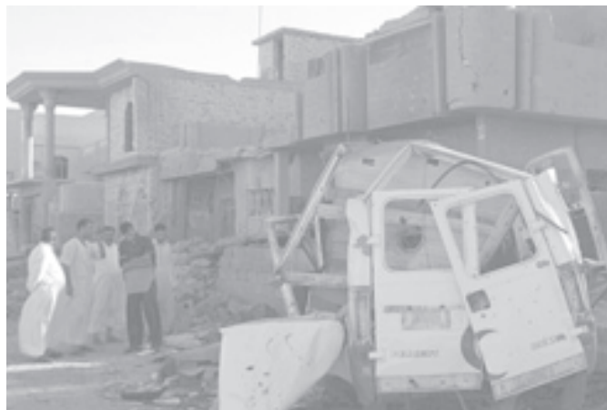
Local residents look at a destroyed ambulance belonging to the Iraqi Red Crescent, after US warplanes and artillery bombed the Sunni guerillas stronghold of Fallujah, Iraq, on 13 Sept, 2004.