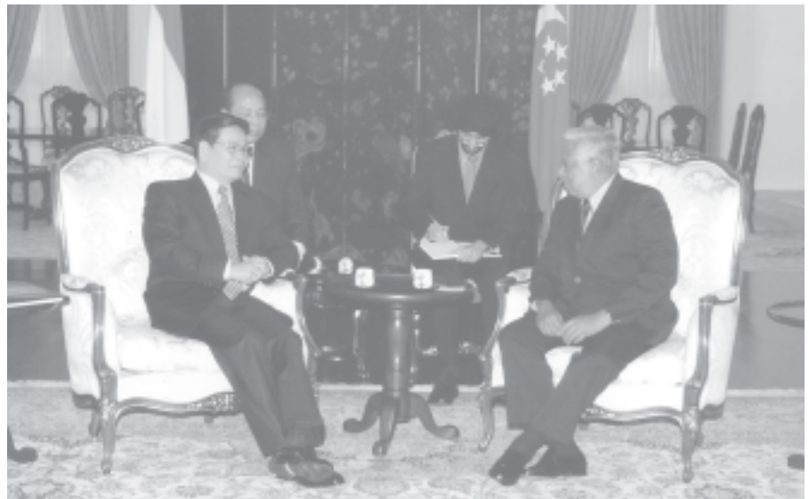
Prime Minister General Khin Nyunt calls on Singaporean President Mr SR Nathan at Istana in Singapore.

During the cordial talks, they exchanged views on nation-building experiences and bilateral friendly ties and mutual cooperation. Prime Minister General Khin Nyunt, on his part, explained the nation's endeavours in various sectors including political, economic and social fields and for unity of all the national races. The Singaporean President expressed his love and