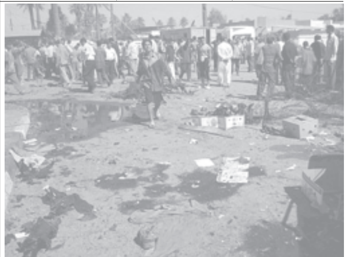
Blood and burned pieces of clothes lie strewn around after a massive explosion outside a police station at the end of Haifa Street in Baghdad, Iraq, on 14 Sept, 2004. At least 47 people were killed and 114 wounded as the blast ripped through scores of people gathered there with aspirations to join the police force.