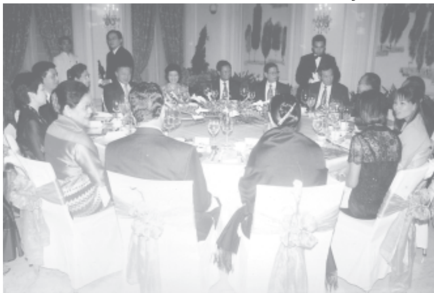
Singaporean Prime Minister Mr Lee Hsien Loong and wife host dinner in honour of Prime Minister General Khin Nyunt and wife Dr Daw Khin Win Shwe at Istana Presidential House.