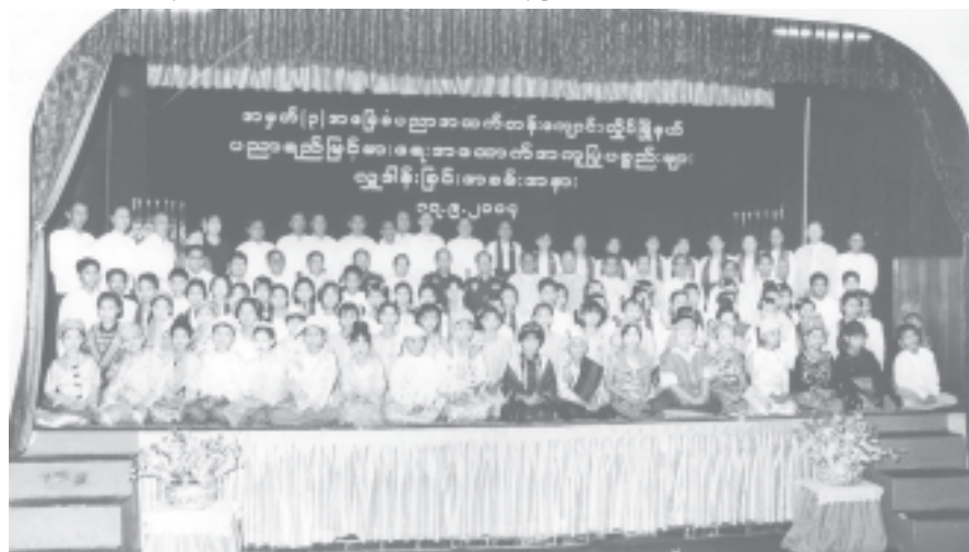
MEC Vice-Chairman Secretary-1 Lt-Gen Soe Win poses for documentary photo with teachers, students, officials and wellwishers at opening ceremony of multimedia classrooms at Hline BEHS No 3.