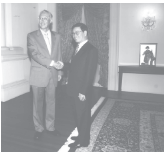
Singaporean Senior Minister Mr Goh Chok Tong cordially greets Prime Minister General Khin Nyunt at Istana in Singapore.