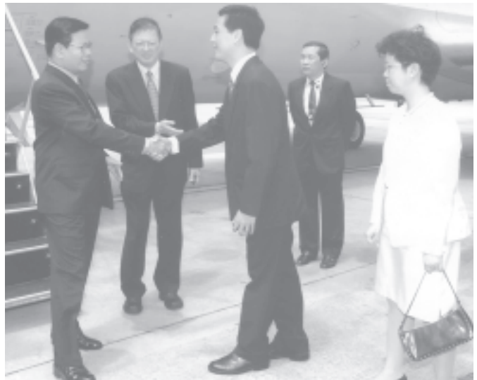
Prime Minister General Khin Nyunt being welcomed by Second Minister for Trade and Industry Mr Heng Chee How and wife at Changi International Airport.