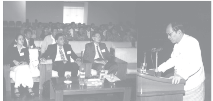
Opening of mobile course on management of catchment area in progress.—H