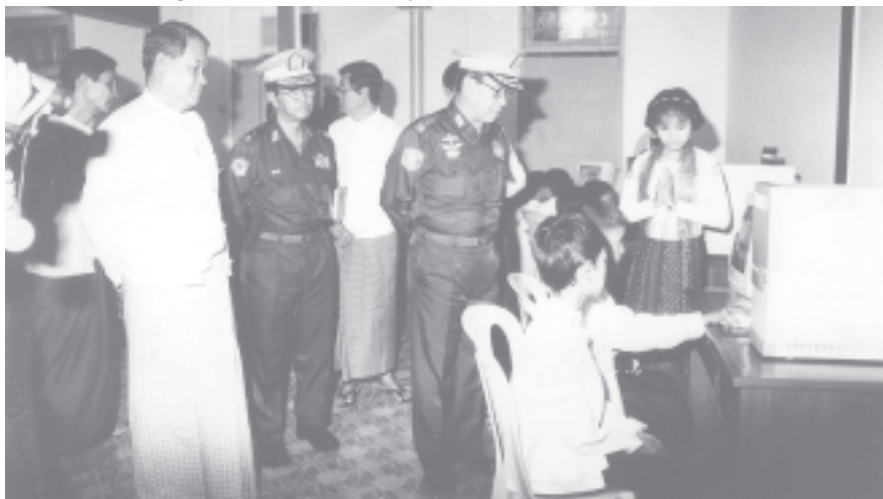
MEC Vice-Chairman Secretary-1 Lt-Gen Soe Win inspects multimedia classrooms at Hline BEHS No 3.

Next, the Secretary-1 and party, together with the headmistress, teachers, members of the school board of trustees, wellwishers and students, posed for a documentary photo.