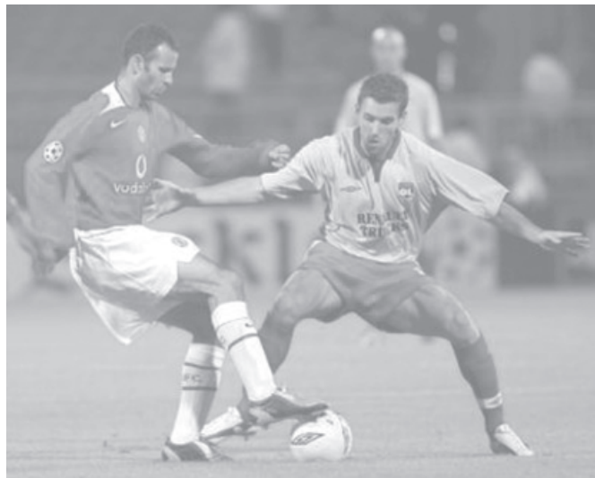
Olympique Lyon's Pierre Alain Frau (R) challenges Manchester United's Ryan Giggs (L) during their Champions League Group D soccer match at Gerland Stadium in Lyon, on 15 Sept, 2004. The match finished 2-2.

Olympiakos were first to settle and came within a whisker of taking the lead when former Deportivo player Rivaldo