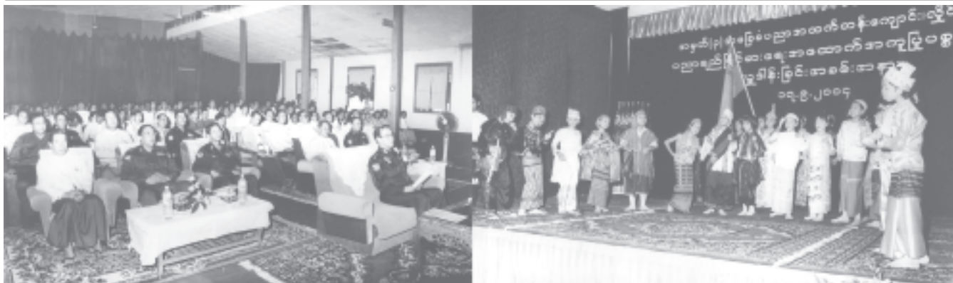
MEC Vice-Chairman Secretary-1 Lt-Gen Soe Win enjoys entertainment of students at opening ceremony of multimedia classrooms at Hline BEHS No 3.

YANGON, 17 Sept—The opening of the multimedia classrooms of No 3 Basic Education High School in Hline Township, Yangon West District, took place this morning, attended by Vice-Chairman of Myanmar Education Committee Secretary-1 of the State Peace and Development Council Lt-Gen Soe Win.