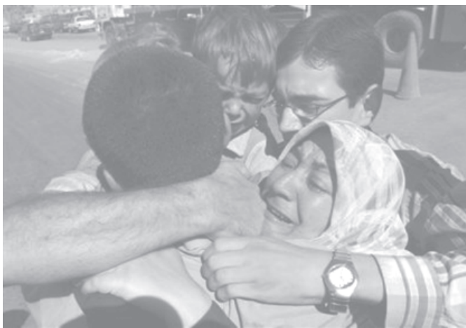
A family embraces an unidentified prisoner, left, just after his release from the Abu Ghraib Prison in Baghdad, on 15 Sept, 2004.

The wars in Iraq and Afghanistan have put the all-volunteer US military under strain and sparked concern over the ability to re-enlist troops, especially in part-time Reserve and National Guard units called to duty to support regular forces.