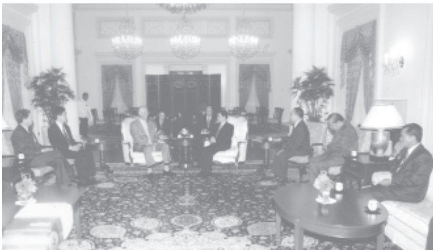
Prime Minister General Khin Nyunt meets with Senior Minister Mr Goh Chok Tong at Istana in Singapore.— MNA

Present at the meeting were Myanmar entrepreneurs, Ambassador of the Republic of Korea Mr Lee Kyung Woo, Economic Counsellor Mr Choi Yoon Tae, members of the trade delegation from Iksan of the ROK, officials of companies which produce garbage van, fuel bowser and other vehicles, agriculture and fisheries, cold storage and icy materials, photograph and developing chemicals, machinery, chemical liquid used in boiler for prevention of air pollution, LED colour light boxes, multi-coloured crayon sticks, water and oil colour paints, granites, marble and others. They discussed trade matters.— MNA