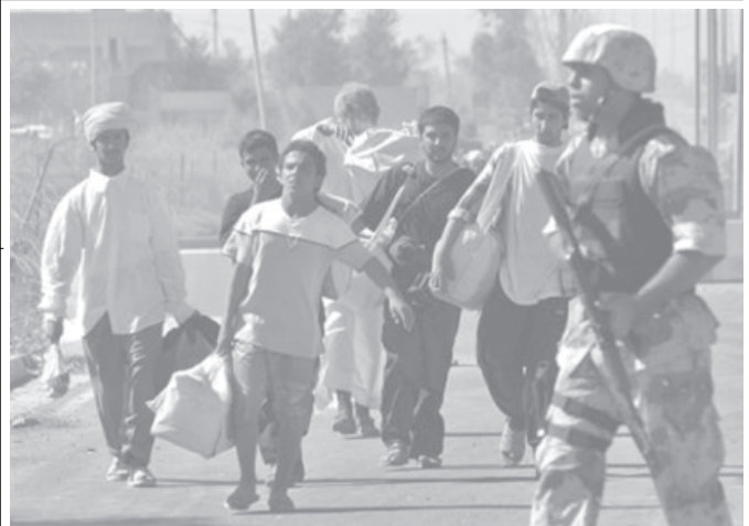
Prisoners walk out of an Iraqi military base after they were brought there from Abu Ghraib Prison to be released, in Baghdad, on 15 Sept, 2004.