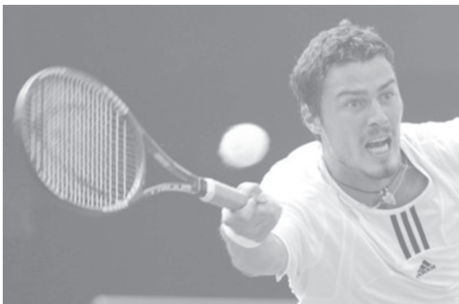
Russia's Marat Safin returns the ball during his match against Alex Bogomolov of the United States at the China Open tennis tournament in Beijing on Thursday, 16 Sept, 2004. Safin won 6-4, 7-5.