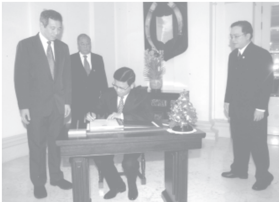
Prime Minister General Khin Nyunt signs in the visitors' book of Presidential House of Singapore. (News on page 16)