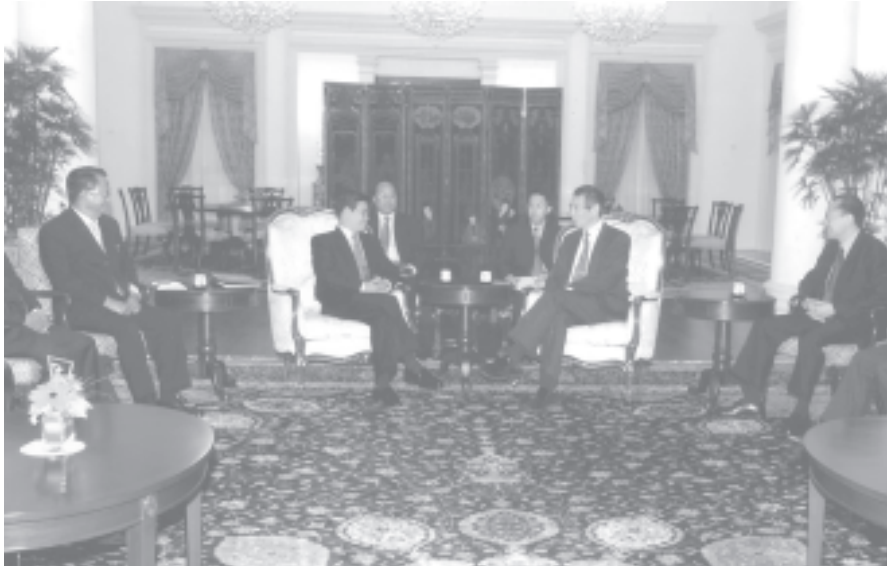
Prime Minister General Khin Nyunt meets Singaporean Prime Minister Mr Lee Hsien Loong at Istana in Singapore.—MNA

Thaung, Minister for Commerce Brig-Gen Pyi Sone, Minister for Finance and Revenue Maj-Gen Hla Tun, Minister for Foreign Affairs U Win Aung, Deputy Minister U Khin Maung Win, Myanmar Ambassador to Singapore U Hla Than and Director-General of the Political Department of the Ministry of Foreign Affairs U Thaung Tun. Also present on the Singaporean side were Minister for Foreign Affairs Brig-Gen George Yeo, Minister for Trade and Industry Mr Lim Hng Kiang, Minister of State for Trade and Industry Mr Heng Chee How, Second Permanent Secretary of