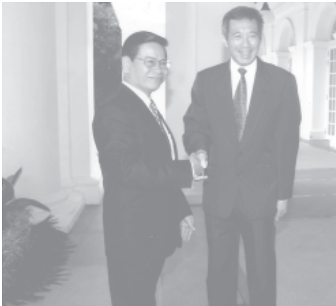
Singaporean Prime Minister Mr Lee Hsien Loong cordially greets Prime Minister General Khin Nyunt at Istana in Singapore.