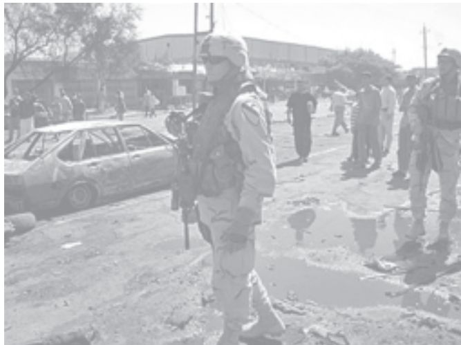
US soldiers inspect the site after a massive explosion outside a police station at the end of Haifa Street in Baghdad, on 14 Sept, 2004.