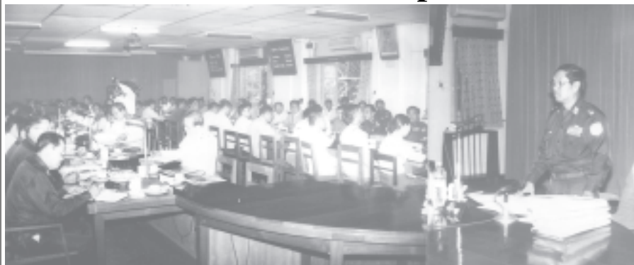
Commander Maj-Gen Myint Swe addresses weekly coordination meeting for ensuring secure and smooth transport. — YANGON COMMAND

YANGON, 17 Sept — Yangon Division Supervisory Committee for Ensuring Secure and Smooth Transport held a coordination meeting at Yangon Command Headquarters this afternoon.