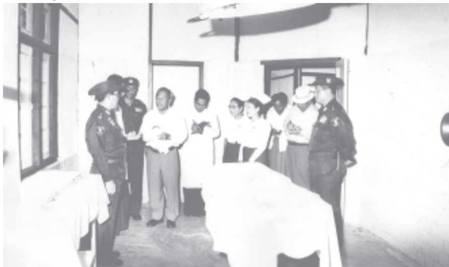
MEC Vice-Chairman Secretary-1 Lt-Gen Soe Win inspects Ngaphe Township Hospital.

That is why, development of all the regions of the rural areas will contribute towards the cent per cent development of the State. Therefore, he said