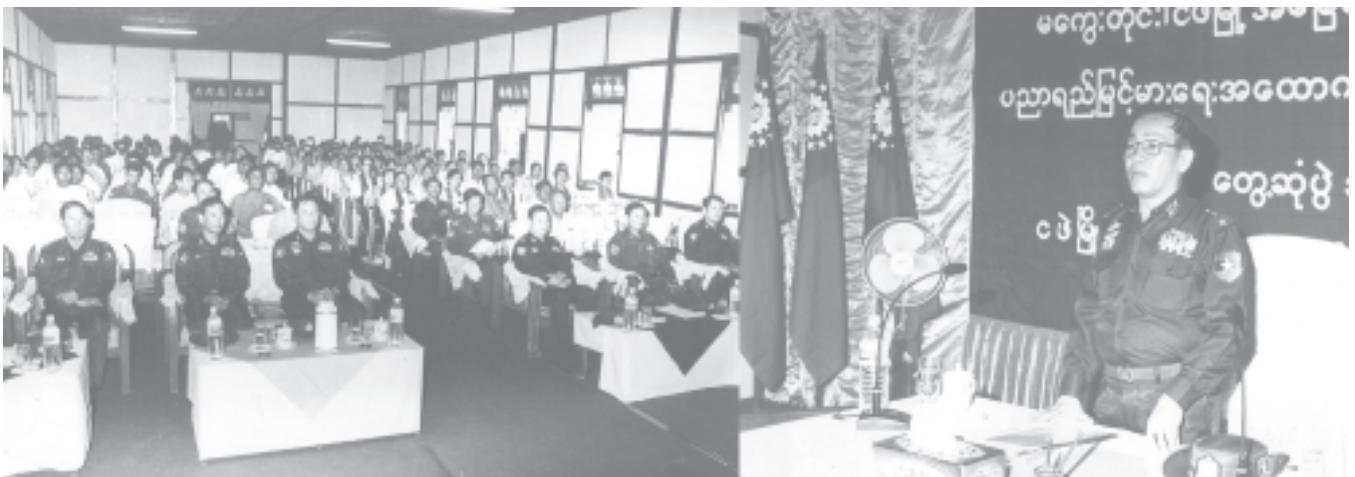
MEC Vice-Chairman Secretary-1 Lt-Gen Soe Win addresses opening ceremony of multimedia classrooms at Ngaphe BEHS.

YANGON, 15 Sept — Vice-Chairman of the Myanmar Education Committee Secretary-1 of the State Peace and Development Council Lt-Gen Soe Win attended the ceremony to open multimedia classrooms of Basic Education High School in Ngaphe on 12 September morning.