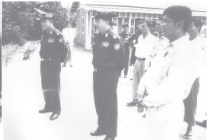
Lt-Gen Khin Maung Than inspects Inngagwa Sugarcane Farm of No 11 Sugar Mill in Inngagwa, Paukhaung Township.