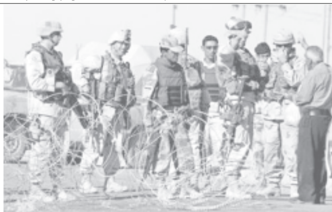
A US soldier turns back an elderly man, who wants to enter the town, at the check-point in the outskirts of the town of Tal Afar, some 390 km north of the Iraqi capital Baghdad, on 14 Sept, 2004.

Among which, capital inflows approved by the Board of Investments totalled 2.08 billion dollars for the seven months, up from 217.14 million dollars for the same period last year, the department said. — MNA/Xinhua