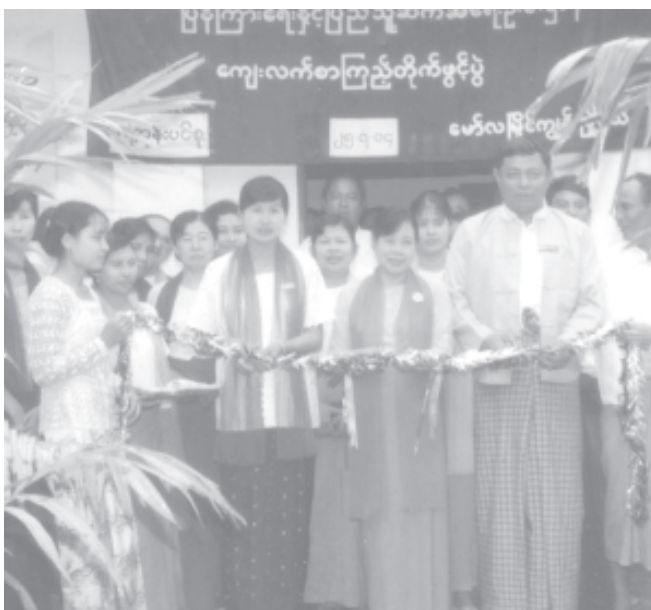
The opening ceremony of a library in Phayehnbinsu model village in Mawlamyinegyun Township, Ayeyawady Division. —IPRD

Up to 14 September 2004, altogether 8,104 self-reliant libraries were opened nationwide.