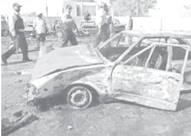
Iraqi policemen inspect the scene of an explosion in central Baghdad, on 14 Sept, 2004.