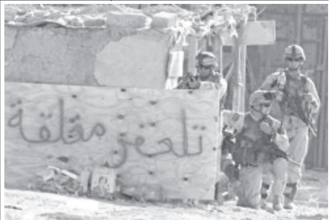
US soldiers stand guard next to a sign, reading in Arabic 'Tal Afar is closed', at the outskirts of the town of Tal Afar, some 390 km north of the Iraqi capital Baghdad, on 14 Sept, 2004.