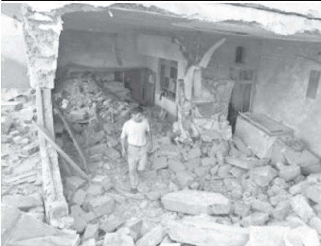
A man walks inside his destroyed house, following heavy clashes in the town of Tal Afar, some 390 km north of the Iraqi capital Baghdad, on 14 Sept, 2004. —INTERNET

He said a girls' school was also near the site of the blast. — MNA/Reuters