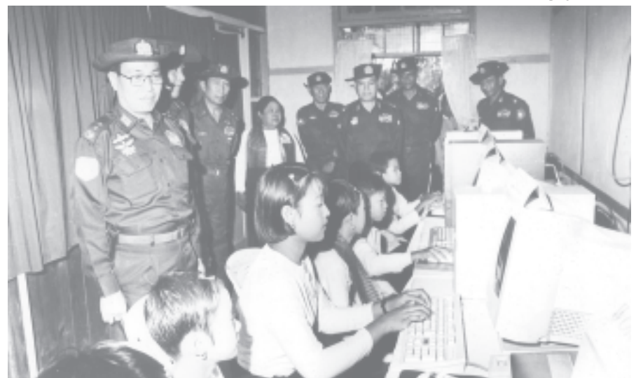
MEC Vice-Chairman Secretary-1 Lt-Gen Soe Win views computer skill of students at multimedia classrooms of Ngaphe BEHS.