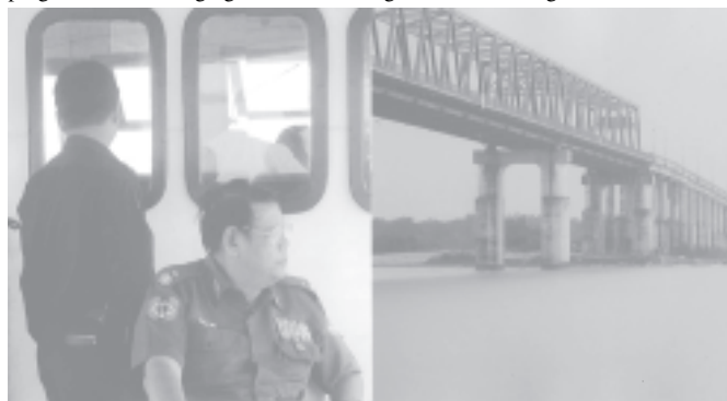
Minister for Transport Maj-Gen Hla Myint Swe inspects waterway of Nyaungdon-Sakkawt waterway. — TRANSPORT

supplementary report. After giving instructions to officials, the minister looked into construction tasks for maintenance of banks near Bo Myat Tun Bridge. — MNA