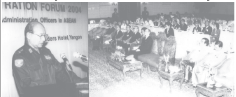
Minister for Home Affairs Col Tin Hlaing addresses opening of ASEAN Region Local Administration Forum-2004.

YANGON, 15 Sept — The ASEAN Region Local Administration Forum-2004, jointly-organized by the General Administration Department of the Ministry of Home Affairs and the Japan Council of Local Authorities for International Relations (CLAIR, Singapore) was held at Traders Hotel on Sule Pagoda Road this morning.