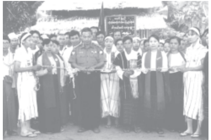
A library was opened in Ngapeinn Village in Kyauktaga Township, Bago Division, to disseminate knowledge to local people.

ကျေးရွာတိုင်း ကိုယ်တိုင်ဆောက်လုပ်ထားသော ကျေးရွာ စာရုံများကို ဖွင့်လှစ်ပေးခြင်းဖြင့်