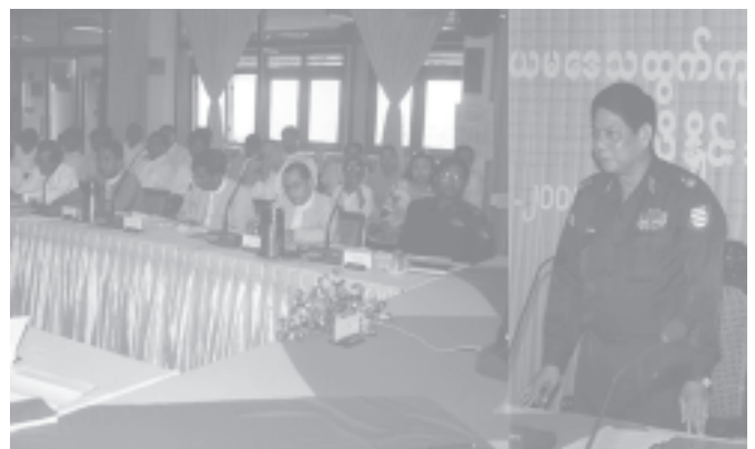
Minister for Cooperatives Maj-Gen Htay Oo speaking at coordination meeting to hold cooperative local products market festival.

The meeting came to a close with the concluding remark by Minister Maj-Gen Htay Oo.