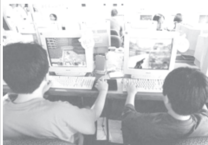
Children at a Cyber cafe in Singapore.

The exercise, codenamed Exercise Western Arc, will be conducted at the Dijon Air Base in eastern France from 20 September to 4 October. During the exercise, the first of the series with the French Air Force, the Air Forces of the two countries will engage in air combat and air-to-air flying manoeuvres.—MNA/Xinhua