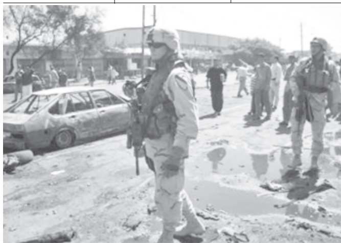
US soldiers inspect the site after a massive explosion outside a police station at the end of Haifa Street in Baghdad, Iraq, on Tuesday, 14 Sept, 2004.