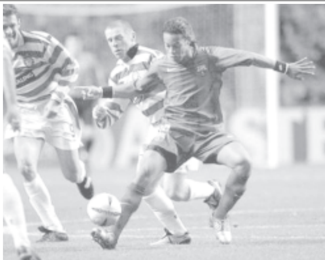
Barcelona's Ronaldinho (R) is challenged by Celtic's Neil Lennon in the Champions League Group F soccer match at Celtic Park in Glasgow, on 14 Sept, 2004. Barcelona won the match 3-1.