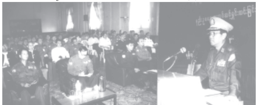
Commander Maj-Gen Myint Swe addresses opening ceremony to clarify the rules relating to Supervision of Controlled Precursor Chemicals.