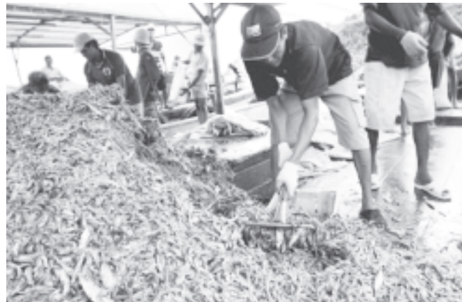
Fishermen unload anchovies, the type of fish used to produce nuoc mam, from a fishing boat at a port in southern Phu Quoc island. The island, some 45 kilometres off Vietnam's southwestern coast in the Gulf of Thailand, is famed for making the best fish sauce — or nuoc mam as is known in Vietnamese — in the world and its 80,000 inhabitants are justifiably proud of their reputation.

"I am ... clear that the alarm and camera systems installed over the last three years worked and that police acted correctly in assessing the threat he posed," Home Secretary David Blunkett told the House of Commons in a late night sitting.