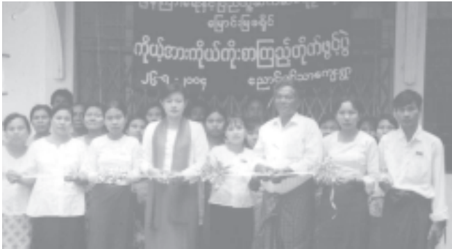
Opening ceremony of a library in Nyaungbintha Village in Myaungmya District, Ayeyawady Division.