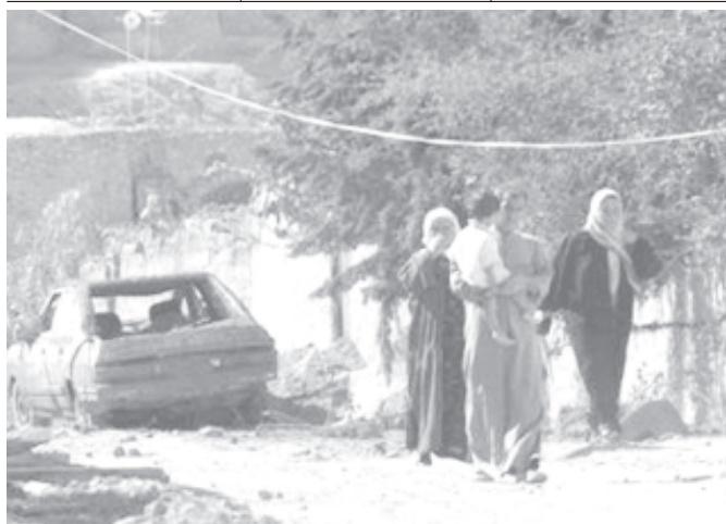
Residents return after days of fighting between US forces and armed groups, in the besieged city of Tal Afar, northern Iraq, on 14 Sept, 2004.—INTERNET

More than 700 policemen and prospective recruits have been killed in insurgent attacks since US forces toppled former president Saddam Hussein government in April 2003, according to Iraq's Interior Ministry. Most were killed in suicide bombings, and many were simply applying for jobs.— Internet