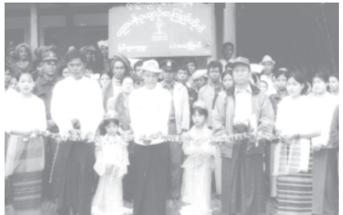
People living in Myinmu Village, Pindaya Township, Shan State (South) gain knowledge through a library opened in the village.—IPRD

ပြန်ကြားရေးဝန်ကြီးဌာန ပြန်ကြားရေးနှင့် ပြည်သူ့ဆက်ဆံရေးဦးစီးဌာန