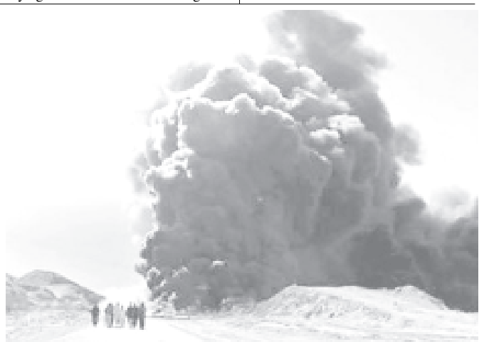
Iraqi policemen and oil company personnel walk on the road next to burning oil pipeline, near the town of Baiji, on 14 Sept, 2004. Engineers at the power station said they had shut down the plant on Tuesday, knocking out power to the Iraqi town, because of a sabotage attack on a nearby oil export pipeline.