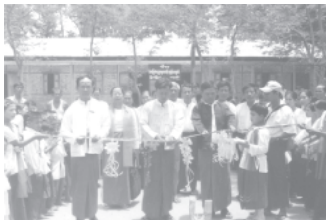
Self-reliance library in Magyihtoo Village in Myothit Township, Magway Division.