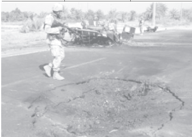
A US soldier stands guard near a destroyed Humvee after a suicide attacker detonated a car bomb near it in Baghdad, Iraq, on 12 Sept, 2004. The crater made by the impact of the explosion is visible in the foreground. US casualties were not known although at least three civilians in a nearby car died.