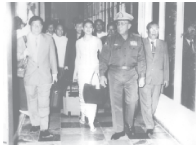
Deputy Minister Brig-Gen Aung Thein sees off the Myanmar film delegation at Yangon International Airport.

The delegation was seen off at the Yangon International Airport by Deputy Minister for Information Brig-Gen Aung Thein