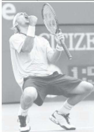
Lleyton Hewitt of Australia celebrates his winning match point against Joachim Johansson of Sweden during their semi-final match at the 2004 US Open in Flushing Meadows, New York.

Earlier, champions Valencia relied on substitute Miguel Angel Angulo to spark a fightback that lifted them from two goals down at the break to claim a 2-2 draw at Athletic Bilbao. Valencia appeared to have one eye on next week's Champions League opener against Anderlecht as they made a sluggish start and fell behind in the 15th minute when Bilbao striker Ismael Urzaiz finished off a slick counter-attack with a fine first-time shot.—MNA/Reuters