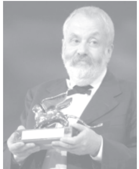
British movie director Mike Leigh holds the Golden Lion trophy he won for best movie at the 61st Venice Film Festival in Venice, northern Italy, on 11 Sept, 2004. Leigh won for his film 'Vera Drake.'