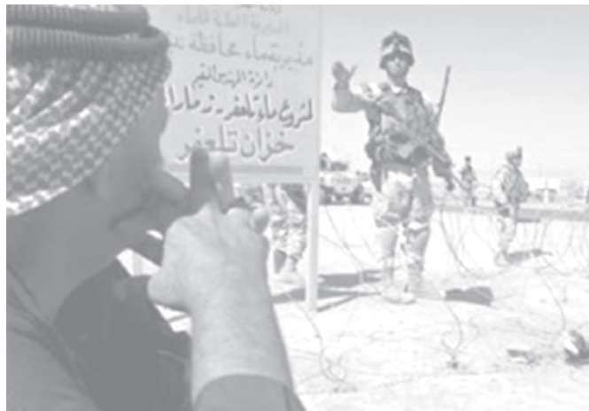
A US soldier orders an elderly Iraqi man to leave the outskirts of the city of Tal Afar, some 390 km north of the Iraqi capital Baghdad, on 11 Sept, 2004.

မြန်မာ့စွေတာ၊ မိန်းပါလေလွင်၊ ထုတ်ကုန်မြင့်