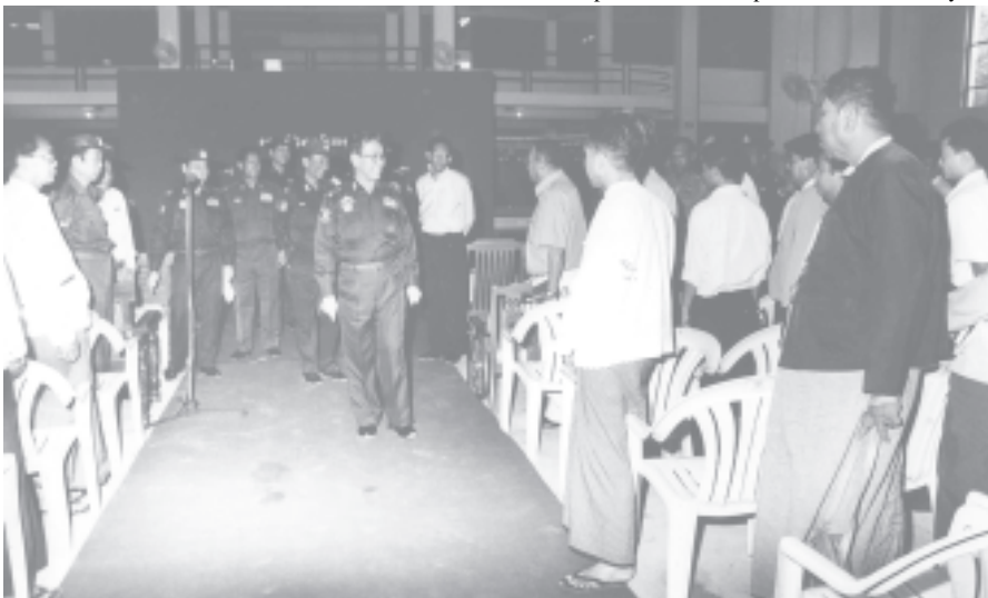
Secretary-1 Lt-Gen Soe Win meets members of Mandalay Industrial Zone Development Committee, industrialists and officials at Kanaung Hall in Mandalay Industrial Zone.