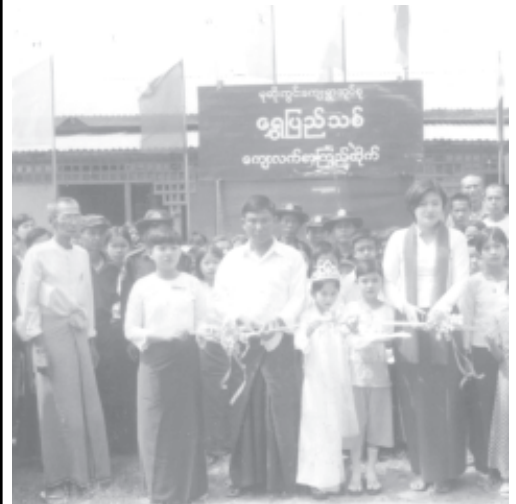
Shwepyithit Library was opened in Mothsoegwin Village-tract in Myaungmya Township, Ayeyawady Division.