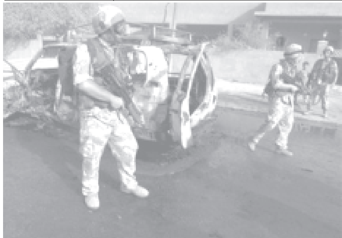
British soldiers stand at a site of explosion near the US consular office in Basra, Iraq on 11 Sept, 2004.