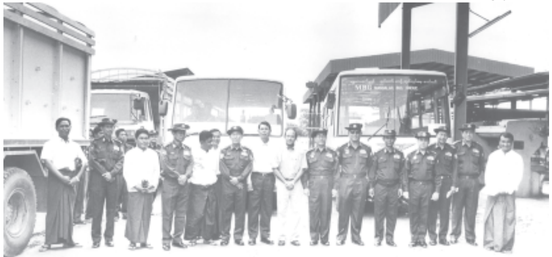
Industrial Development Committee Chairman Secretary-1 Lt-Gen Soe Win and party pose for a documentary photo at UD Group Factory which manufactures parts for CNG run car engines. — MNA

Industrial sector of the State increases yearly with greater momentum beginning 1992-1993, and contribution 10 per cent to the Gross Domestic Product (GDP).