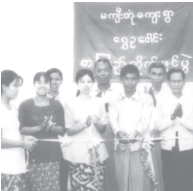
A library opened for bookworms of Magyiton Village in Wetlet Township, Sagaing Division.