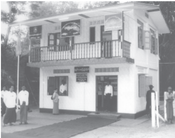
The photo shows a library built in Kwanmoe Dain Model Village, Kayan Township, Yangon Division, to disseminate knowledge to rural people. — MNA

Self-reliant libraries have already been opened in 7,364 village-tracts out of 13,748 village-tracts; and arrangements are being made for opening of self-reliant libraries in the remaining over 6,000 villages.