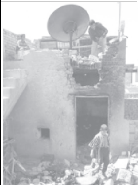
Local residents assess damage done to their home after an US offensive in Sadr City, Iraq, on 11 Sept, 2004.