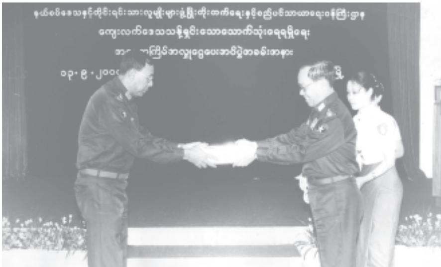
Secretary-1 Lt-Gen Soe Win accepts K 2.5 million donated by Myanmar Economic Corporation at 8th cash donation ceremony for pure drinking water supply in rural regions.

Water supply projects were implemented in eight townships in cooperation with the Union Solidarity and Development Association, Myanmar National Committee for Women's Affairs and international organizations such as JICA, BAJ and UNICEF.