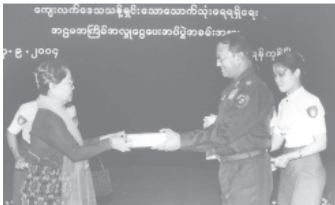
Minister Brig-Gen Thura Aye Myint accepts cash donation made by a wellwisher at 8th cash donation ceremony for pure drinking water supply in rural regions. — MNA