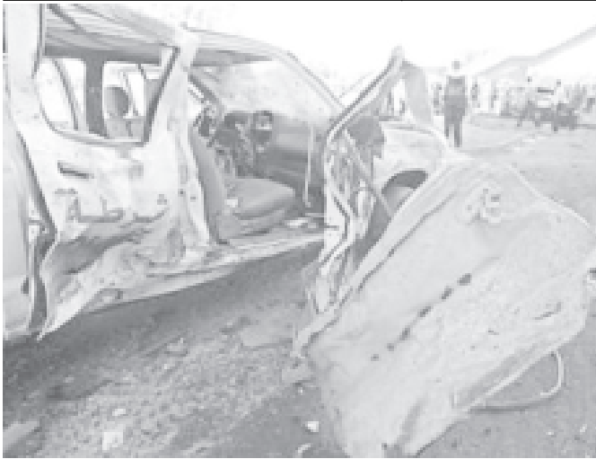
Iraqi policemen inspect a damaged police car at the scene of a suicide car bomb attack near a police station at Al-Amiriya District of the Iraqi capital Baghdad, on 12 Sept, 2004. —INTERNET

The deaths raise the number of Polish soldiers killed in Iraq to 13.— Internet