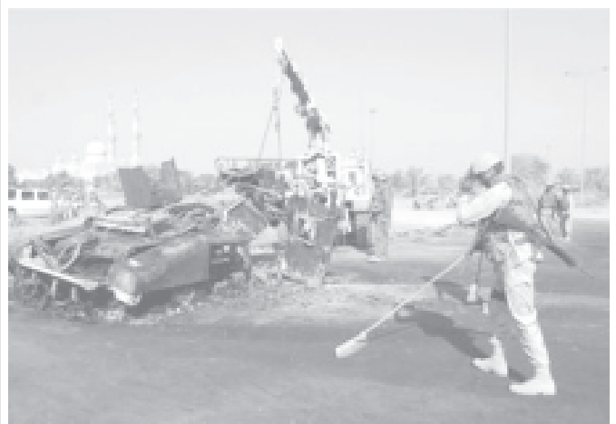
A US soldier cleans debris near a destroyed Humvee after a suicide attacker detonated a car bomb near it in Baghdad, Iraq on 12 Sept, 2004.

Najib said the farming community must look into new approaches, including the use of latest techniques and technology and wider market till the international level.—MNA/Xinhua