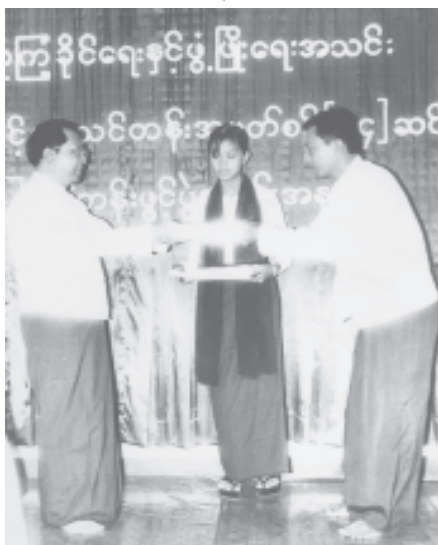
Minister for Information Brig-Gen Kyaw Hsan presents exercise books to secretary of Pazundaung Township USDA for trainees of Basic Organization Course. — MNA