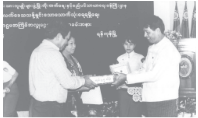
Minister U Soe Tha accepts cash donation made by wellwishers at 8th cash donation ceremony for pure drinking water supply in rural regions.