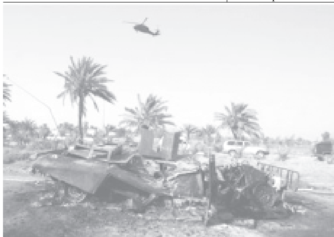
A US military helicopter flies near a destroyed Humvee after a suicide attacker detonated a car bomb near it in Baghdad, Iraq, on 12 Sept, 2004.