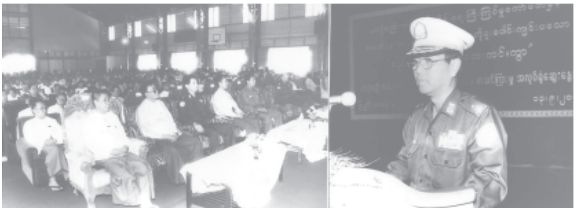
Commander Maj-Gen Myint Swe delivers an address at Workshop on traffic rules.

occasion were Deputy Minister for Education Col Aung Myo Min,