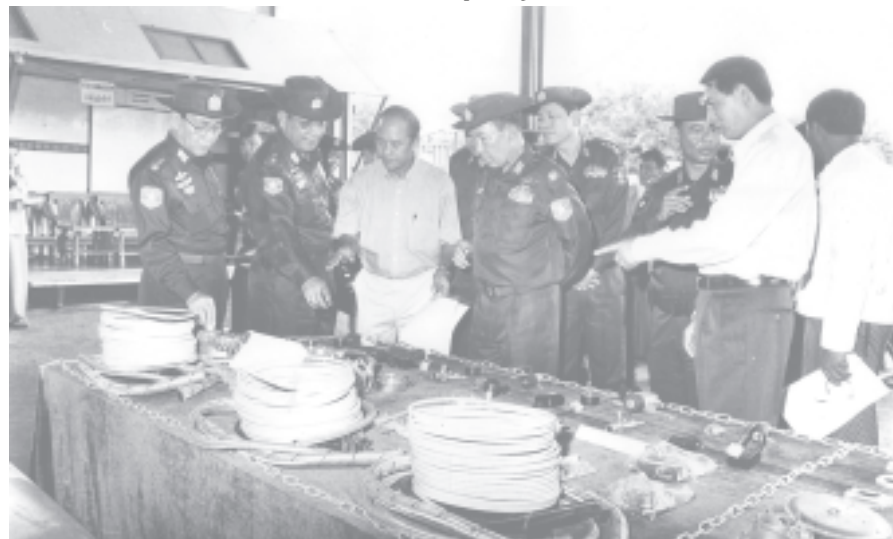
Secretary-1 Lt-Gen Soe Win inspects UD Group Factory which produces compressed natural gas (CNG)-run vehicles.

The Secretary-1 and party proceeded to UD Group Factory that are test-manufacturing Compressed Natu-