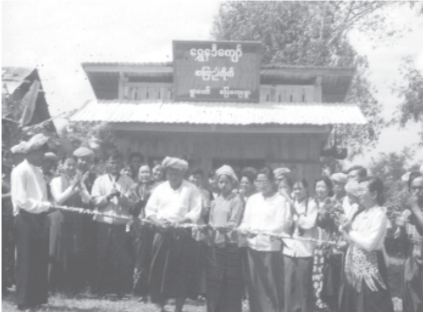
Under the rural area development programme, a library of Information and Public Relations Department has been opened in Ywadow Model village in Kalaw Township, Shan State (South).