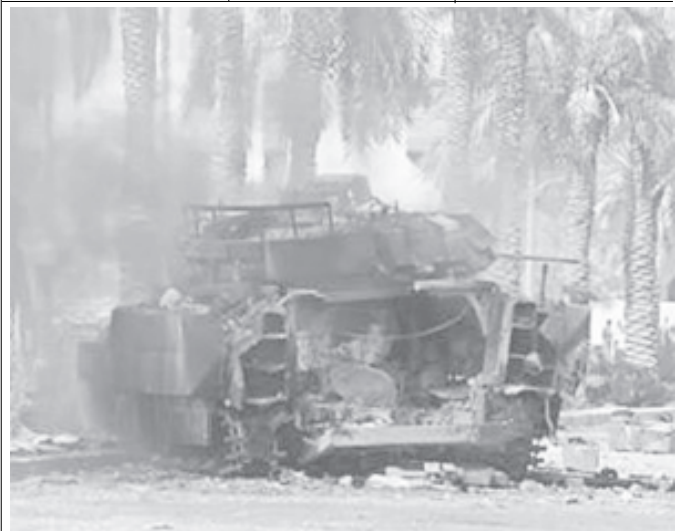
A US Bradley armoured vehicle burns in the street following heavy clashes in the centre of the Iraqi capital Baghdad, on 12 Sept, 2004.