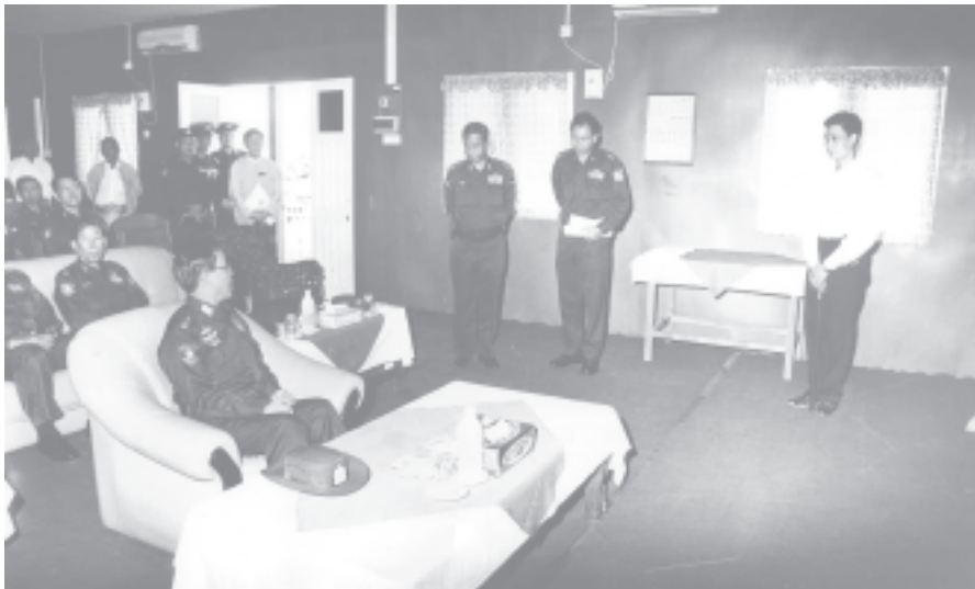
Secretary-1 Lt-Gen Soe Win gives instructions at briefing hall of foundries construction project in Mandalay Industrial Zone.