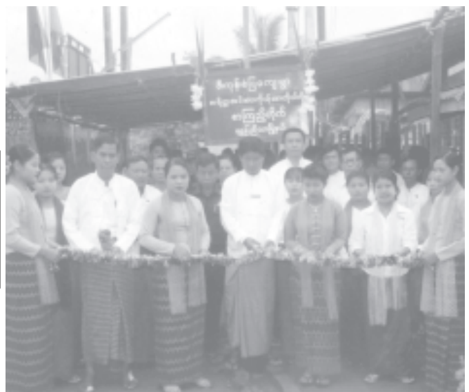
Villagers of Zegon Sanypa Village, Shwepyitha Township, Yangon Division are now able to read books in the library opened in their village. —IPRD