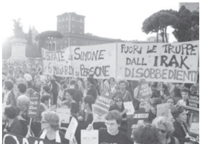
People gather at the foot of the vittoriano monument to the unknown soldiers before a march past the Colosseum for the release of Italian aid organization 'Un Ponte Per Baghdad' (A Bridge for Baghdad) volunteers who were kidnapped in Iraq, in Rome, Italy, on 10 Sept, 2004. —INTERNET

"We remain mobilized and our position is that we remain confident, we think a positive outcome to this hostage-taking is possible," he told Europe 1 Radio. —MNA/Reuters