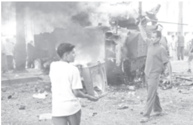
Iraqis celebrate around a burning US armoured vehicle, following heavy clashes in the centre of Baghdad, on 11 Sept, 2004. More than a dozen explosions shook central Baghdad at dawn on Sunday and heavy gunfire erupted in a street at the heart of the city, leaving a US armoured vehicle on fire, witnesses said.