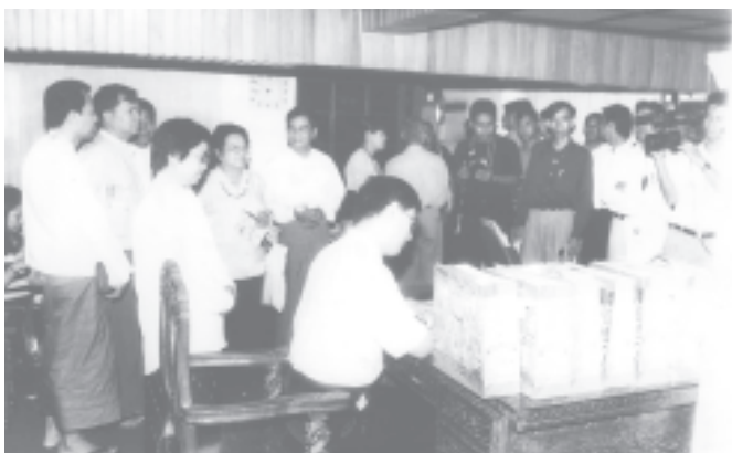
Delegates to Workshop for ASEAN Cultural Interaction at Grassroots, Phase III visit Mawriya Traditional Medicine Industry on 11 September. (News reported)