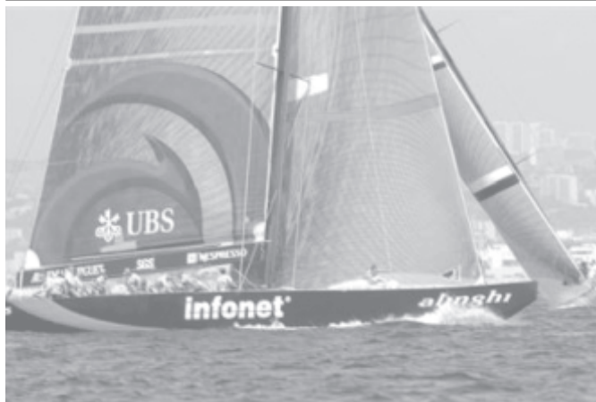
Challenger BMW Oracle Racing of the United States, right, sails past defender Alinghi, of Switzerland, during the final race of the America's Cup opening act, off Marseille, southern France, on Saturday, 11 Sept, 2004.