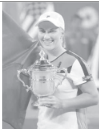
Svetlana Kuznetsova of Russia holds the Russian flag and the US Open trophy after defeating compatriot Elena Dementieva, in the final at the 2004 US Open in New York, on 11 Sept, 2004. Kuznetsova defeated Dementieva 6-3, 7-5 to win the championship.