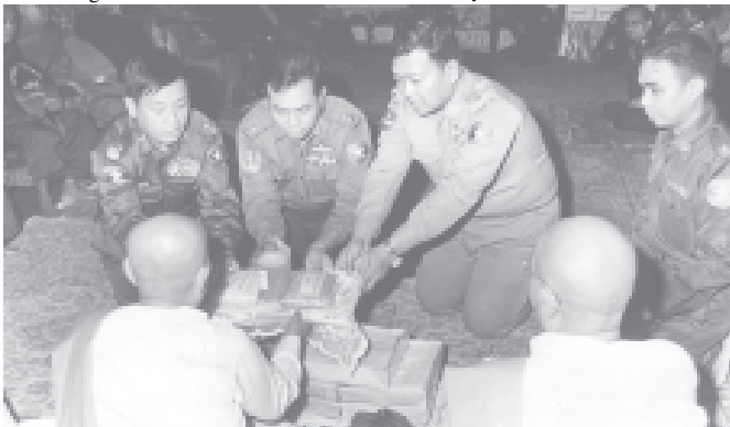
Senior military officers present rice, oil and gram to a nun at the donation ceremony for monasteries and nunneries in Thingangyun Township.—MNA

Secretary-2 Lt-Gen Thein Sein accepted K 120,000 for the monastery