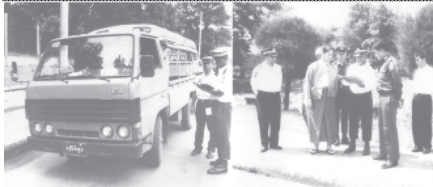
Dry Day Supervisory Committee members and dry day inspection teams check departmental vehicles.

YANGON, 12 Sept — Member of the Dry Day Supervisory Committee Deputy Minister for Construction U Tint Swe, Deputy Minister for Hotels and Tourism Brig-Gen Aye Myint Kyu, Lt-Col Aung Thu of the Office of the Quartermaster-General, Commandant Maj Hla Myint Oo of Provost Unit (Air), Directors-General U Kyaw San Win, U Thaik Tun and U Khin Maung, Director Lt-Col Tin Maung Kyi, Secretary Deputy Director-General U Sein Hla of the Government Office and Joint-Sec-