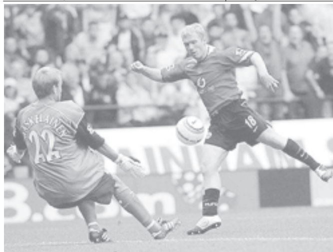
Manchester United's Paul Scholes (R) comes close to getting the ball past Bolton's goal keeper Jussi Jaaskelainen during their Premier League clash at The Reebok Stadium, in Bolton on 11 Sept, 2004.

"I believe, here at Liverpool, we will have a long time to enjoy watching Steven Gerrard."