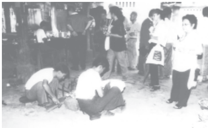
Delegates to Workshop for ASEAN Cultural Interaction at Grassroots observe Silversmith and Handicraft Workshop in Ywahtaung Ward, Sagaing Township on 11 September. (News reported)—MNA