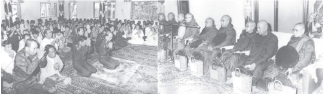
Secretary-2 Adjutant-General Lt-Gen Thein Sein and party taking Five Precepts from a Sayadaw at the ceremony to donate provisions to monasteries and nunneries in Hlinethaya Township.