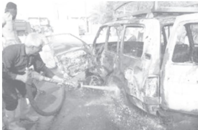
A firefighter hoses down a car damaged in an explosion near the US consular office in Basra, Iraq on 11 Sept, 2004.

After weeks of fighting that killed hundreds of Iraqis in Fallujah, US Marines pulled out of the city in May and handed over control of security to an Iraqi force. That force, the Fallujah Brigade, has collapsed and the city is now controlled by guerrillas. — MNA/Xinhua