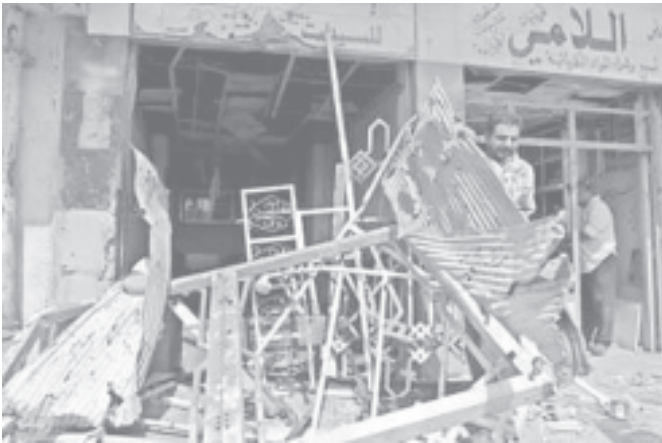
An Iraqi clears debris of a destroyed shop, following clashes between the US army and Shiite militia in the Sadr city district of the Iraqi capital Baghdad, on 10 Sept, 2004.