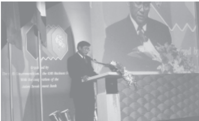
Deputy Minister for Foreign Affairs U Kyaw Thu addresses Greater Mekong Sub-region High Level Public-Private Consultation Meeting in Bangkok.—MNA