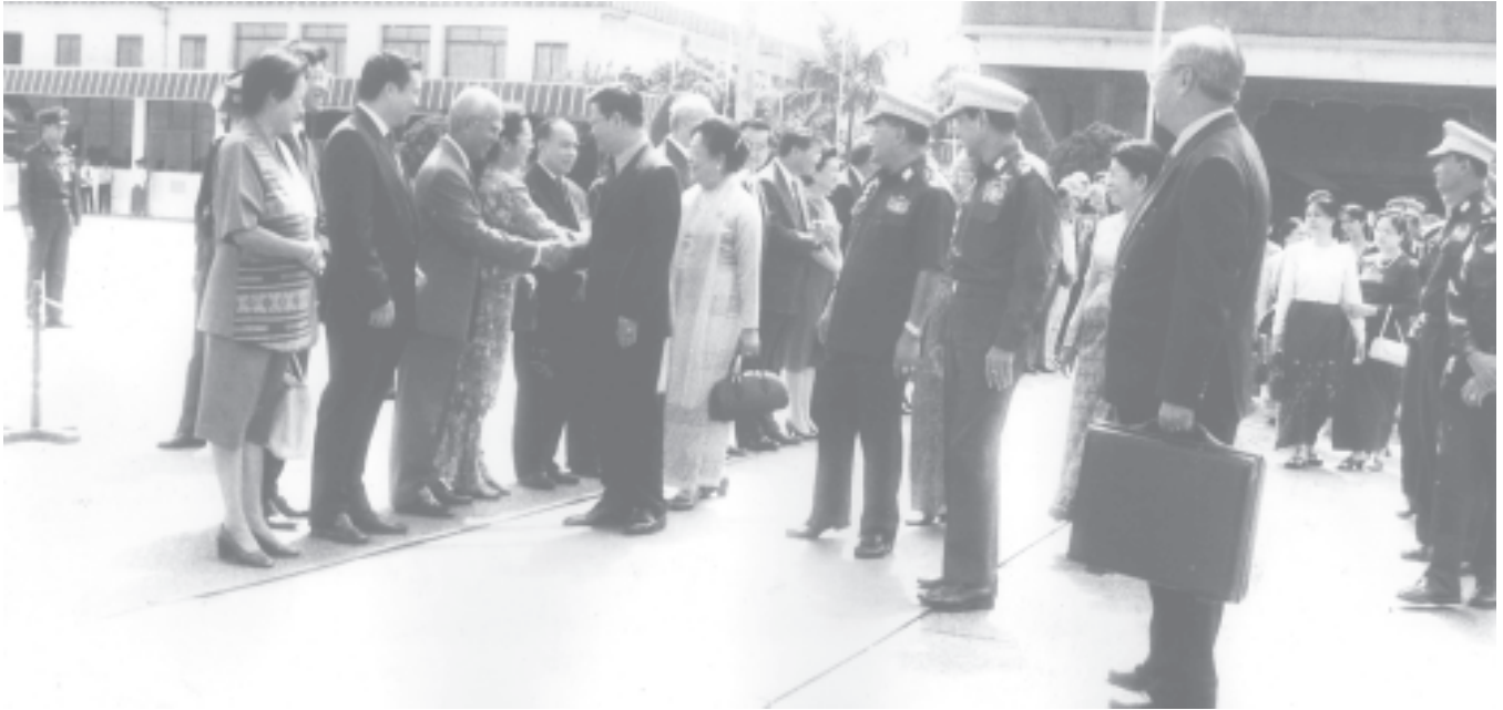
Prime Minister General Khin Nyunt and wife Dr Daw Khin Win Shwe being seen off at the airport by diplomats. (New on page 1)