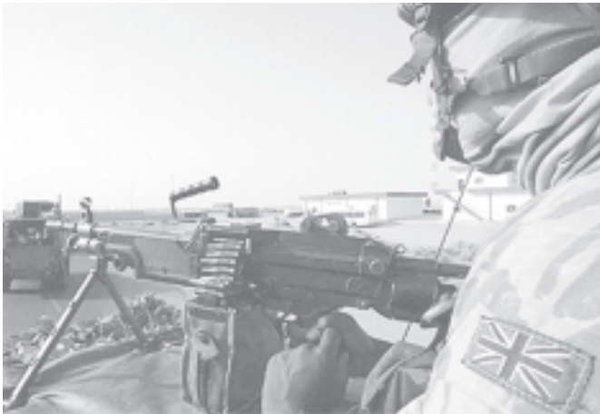
British troops on patrol near Basra recently. A British soldier has been killed in a road accident in southern Iraq, the Ministry of Defence announced.