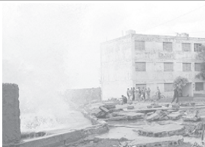
Residents of the Siboney village, 900 km east of Havana, look at the big waves splashing over the waterfront as Cuba is struck by Hurricane Ivan.

most prestigious one, while only half of the young people aged 18 to 29 think so, according to the survey conducted in 2003. Nearly half of those surveyed hope their kids would take up teaching as a profession, and more women than men are willing to see their kids become teachers.—MNA/Xinhua