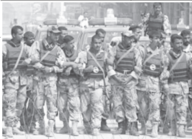
Members of the Iraqi National Guard secure the area during a rally in support of Grand Ayatollah Ali al-Sayid al-Sayid, Iraq's most influential Shiite cleric in the city of Najaf, on 10 Sept, 2004.

NEW DELHI, 11 Sept — Observing that "modest progress" has been made in the just-concluded Indo-Pakistan ministerial talks, Indian External Affairs Minister K Natwar Singh on Thursday said the two sides have "moved forward" while pledging to continue the Composite Dialogue process. Singh saw a "departure from the past" in Pakistan Foreign Minister Khurshid Mehmood Kasuri's statement that Islamabad was "not unifocal" and committed to carry the Composite Dialogue process forward on all issues. — MNA/PTI