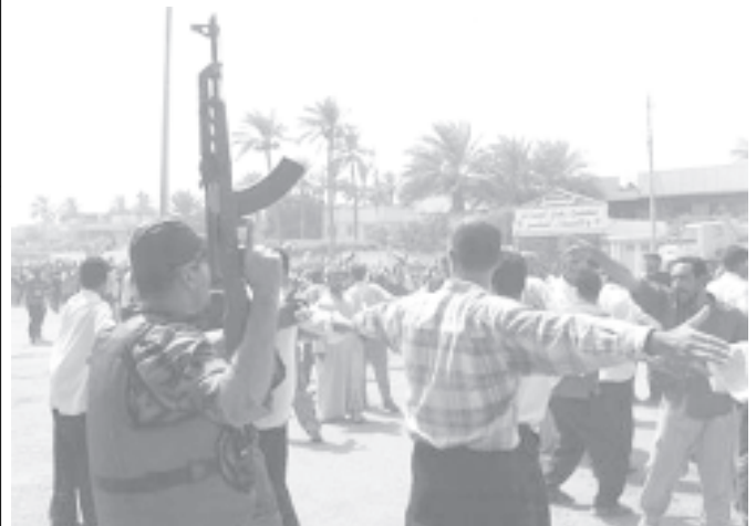
Supporter of radical Shiite cleric Moqtada al-Sadr are barred from arguing with Iraqi soldiers by their leaders as they congregate to show support for al-Sadr in Baghdad, Iraq on 10 Sept, 2004.

The trained dogs were a gift from New York State police. Three more bomb-sniffers will join the canine contingent at the United Nations before year's end, replacing a costly two-dog team used since 1998 that was hired through a private contractor.