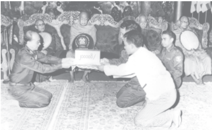
Secretary-2 Lt-Gen Thein Sein accepts K 200,000 from wellwishers at the ceremony to offer provisions to monasteries and nunneries in Thingangyun Township.

YANGON, 12 Sept— Families of Defence Services (Army, Navy and Air) and wellwishers donated rice, oil, salt, gram and cash to 12 monasteries and a nunnery in Hlinethaya Township, Yangon North District, this afternoon.