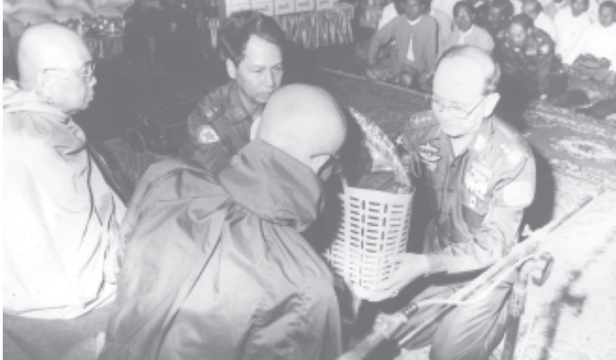
Secretary-2 Lt-Gen Thein Sein offers provisions to a Sayadaw at the donation ceremony for monasteries and nunneries in Thingangyun Township.

entrepreneurs in the township; K 200,000 each by Myanmar Pyithahay KN Company; Pylon Chantha Traditional Medicine House; and UMFCCI; K 198,000 by the wellwishers; K 150,090 by Sandi Traditional Medicine House; K150,000 each by BTB Company; and Great Wall Traditional Medicine Industry; K 180,000 by Win Yadana Transport Service; K 100,000 by Hman Cho Clinic; K 120,000 by Thammada Robes House; K 100,000 by Hsan Myanmar Co Ltd;