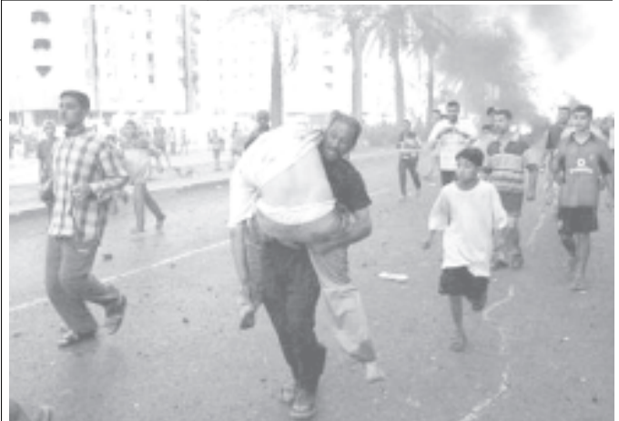
An injured man is carried away after US helicopters fired missiles at a crowd of people cheering near a burning US Bradley Fighting Vehicle at Haifa street in Baghdad, Iraq on 12 Sept, 2004. Five people were reported to have died and over 40 injured in the incident.