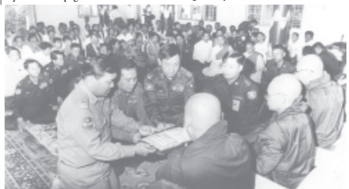
Senior military officers donate provisions to a Sayadaw at the donation ceremony in Thingangyun Township.

monasteries and 7 nunneries in Thingangyun Township of Yangon East District at Dhammayon of Kyaikkasan pagoda in