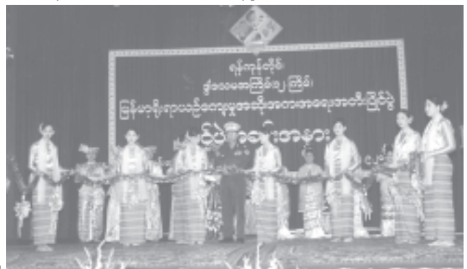
Commander Maj-Gen Myint Swe formally opens 12th traditional Performing Arts Competitions of Yangon Command.