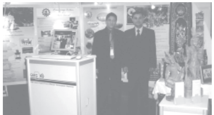
The booth of Myanmar being displayed at the exhibition relating to Greater Mekong Sub-region High Level Public-Private Consultation Meeting in Bangkok.