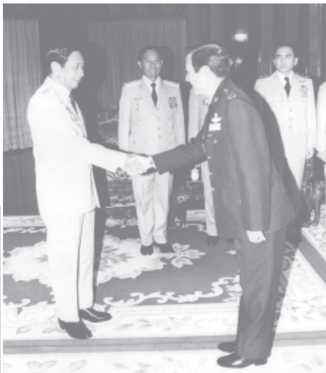
Vice-Senior General Maung Aye greets Supreme Commander of Royal Thai Armed Forces General Somdhat Attanand at Zeyathiri Beikman.