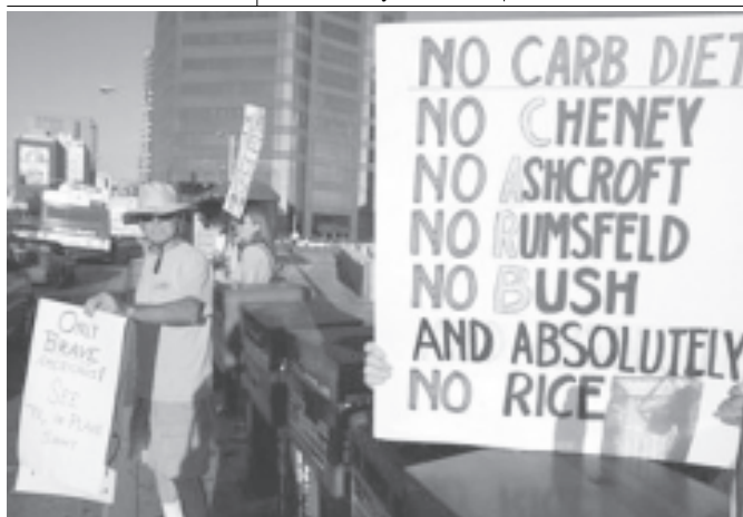
Peace activist protest President Bush's administration policies during a vigil to remember the over 1,000 US Armed Forces members killed in Iraq on Thursday, 9 Sept, 2004, in Los Angeles. The total represents troops killed in both combat and non-hostile incidents since the beginning of the conflict. —INTERNET

The government has maintained its decision not to withdraw troops early, despite of increasing domestic pressure after two soldiers were killed in an attack in last December. — MNA/Xinhua