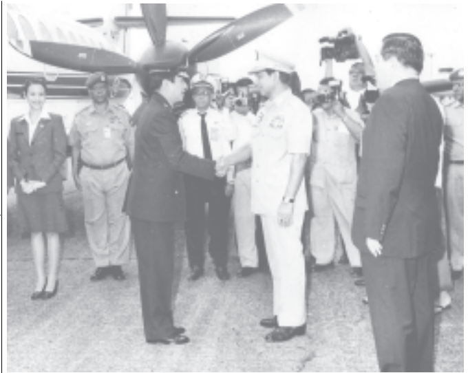
Vice-Senior General Maung Aye greets Supreme Commander of Royal Thai Armed Forces General Somdhat Attanand at the airport. — MNA

YANGON, 10 Sept — General Khin Nyunt, Prime Minister of the Union of Myanmar has sent a message of condolences to Her Excellency Madam Megawati Soekarnoputri, President of the Republic of Indonesia, for the loss of innocent lives and devastations in the bombing incident in Jakarta, Indonesia, on 9 September 2004. — MNA