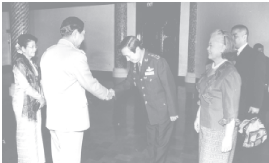
Vice-Senior General Maung Aye and wife Daw Mya Mya San welcome Supreme Commander of Royal Thai Armed Forces General Somdhat Attanand and Madame Khunying Suppanapa Attanand at the dinner.