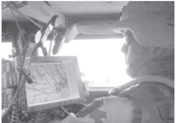
A US Army soldier patrols the highway leading to Tikrit on 9 Sept, 2004.