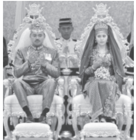
Newlywed royal couple, Brunei's Crown Prince Al-Muhtadee Billah and Sarah Pengiran Salleh recite a prayer during their wedding ceremony at Nurul Iman Palace in Bandar Seri Begawan on 9 Sept, 2004.

banquet, scheduled for Friday, will be attended by the Royal family and those distinguished guests and it will be followed by a fire-