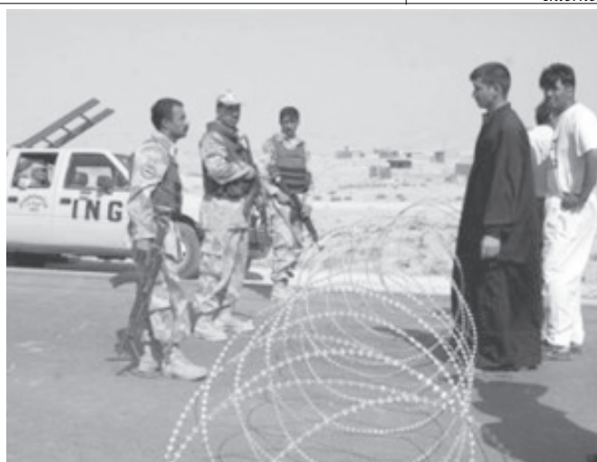
Iraqi soldiers cut off all access to Tal Afar, Iraq on 9 Sept, 2004. At least 26 Iraqis have been reportedly killed and more than 70 others have been wounded in armed clashes between US troops and Iraqi gunmen in Tal Afar city, in northern Iraq.