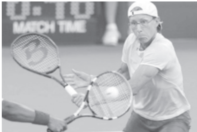
Martina Navratilova, from the United States, gets some help from her mixed doubles partner Leander Paes during her match with Alicia Molik, from Australia, and Todd Woodbridge, from Australia, at the US Open in New York, on Thursday, 9 Sept, 2004.