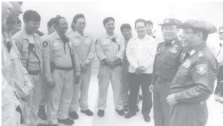
Lt-Gen Maung Bo cordially converses with Myanmar and foreigner employees of Yedagun Oil and Natural Gas Project. — MNA

YANGON, 10 Sept — Member of the State Peace and Development Council Lt-Gen Maung Bo of the Ministry of Defence, accompanied by Minister for Energy Brig-Gen Lun Thi and officials, inspected work to boost production of crude oil and natural gas at Yedagun Oil and Gas Project in Taninthayi Offshore this morning.