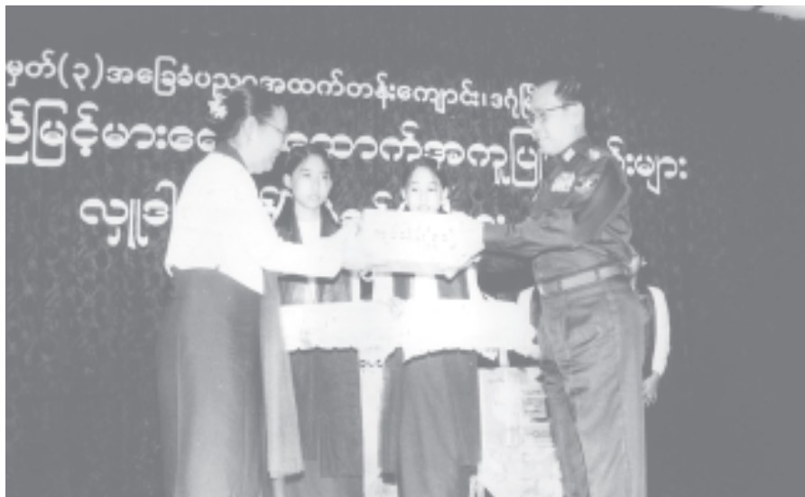
MEC Vice-Chairman Secretary-1 Lt-Gen Soe Win presents cash for multimedia equipment to the Headmistress of Dagon BEHS No 3.