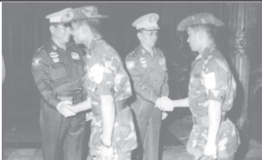
Secretary-2 Adjutant-General Lt-Gen Thein Sein welcomes back members of Myanmar Tatmadaw shooting team.