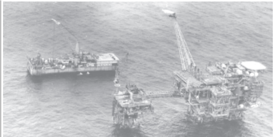
YEDAGUN OFFSHORE OIL AND GAS FIELD, FE EARNER: Sales of natural gas to Thailand started in April 2000. Four new wells were successfully drilled by the end of August 2004. In response to the demand of Thailand, 400 million cubic-feet of natural gas per day will be sold to Thailand soon. (News on page 7) — MNA