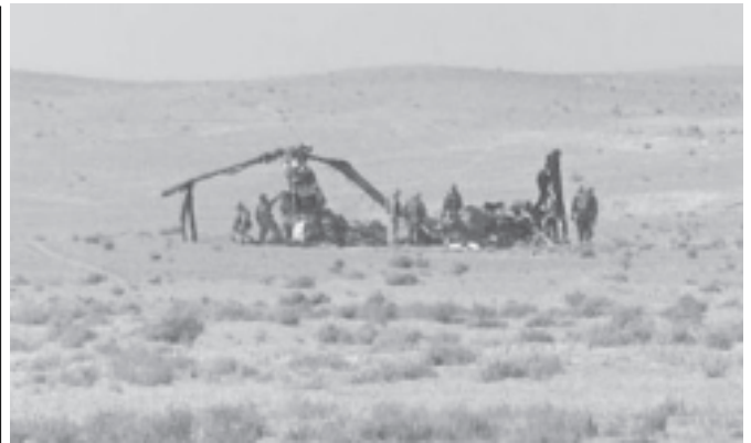
US soldiers survey the scene of a helicopter crash near the town of Fallujah, on 9 Sept, 2004. A US helicopter crashed in western Iraq on Wednesday and the four crew members were rescued from the crash scene, the US military said in a statement.