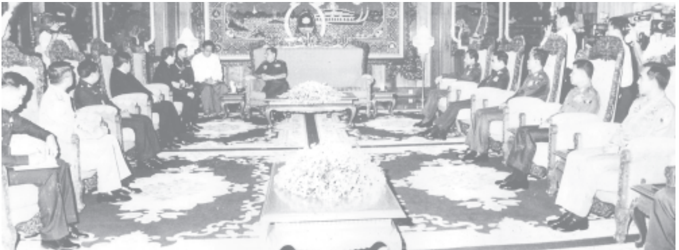
Senior General Than Shwe receives Supreme Commander General Somdhat Attanand of Royal Thai Armed Forces at Zeyathiri Beikman on Konmyinthta.

Emergence of the State Constitution is the duty of all citizens of Myanmar Naing-Ngan.