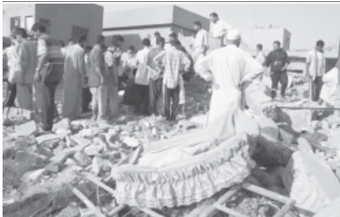
A cradle lies on the rubble as Iraqis survey the damage from overnight raids in Fallujah recently. At least 40 people were killed when US-led forces spearheaded overnight assaults on Iraq’s northern trouble spot of Tall Afar and the notorious militant bastion of Fallujah, officials said.