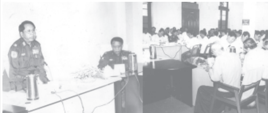
Minister for Information Brig-Gen Kyaw Hsan addresses coordination meeting to establish self-reliant village libraries.

YANGON, 10 Sept —The coordination meeting on opening of self-reliant libraries in villages was held at the meeting hall of the Ministry of Information on Theinbyu Road here this afternoon with an address by Minister for Information Brig-Gen Kyaw Hsan.