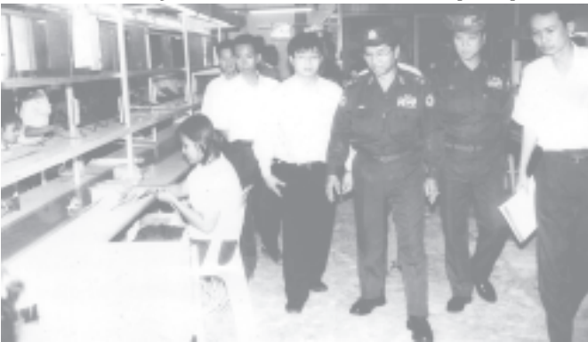
Commander Maj-Gen Myint Swe inspects production process of Nibban Electric and Electronics Factory in Thakayta Industrial Zone.