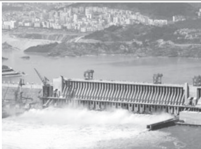
Water gushes from more than 20 open sluice gates on the Three Gorges dam in Yichang, Hubei Province, on 9 Sept, 2004. —INTERNET

Coal will be more environmentally acceptable in that by 2030, 72 per cent of coal-based power general in the world is likely to use cost-effective clean coal technologies, said the report. —MNA/Xinhua