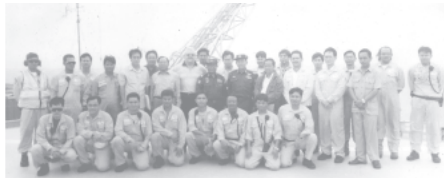
Lt-Gen Maung Bo, Minister for Energy Brig-Gen Lun Thi and employees pose for documentary photo at the drilling rig. — MNA

The Myanmar Oil and Gas Enterprise of the Ministry Energy is earning foreign currency from the project as a shareholder and as the host. — MNA