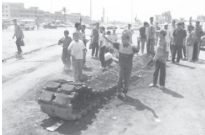
Local residents stand by a track of an US Abrams tank at Sadr City, Baghdad, on 9 Sept, 2004. US forces left the track behind after a tank damaged during fighting had to be recovered with a Hercules recovery vehicle.