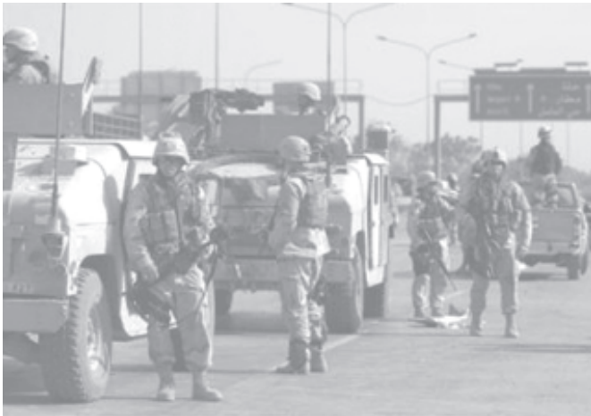
US soldiers block road to search cars in Baghdad, on 8 Sept, 2004. A spate of recent attacks, including a suicide car bombing, pushed the number of US military deaths in the Iraq campaign this week past 1,000.