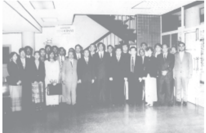
Deputy Minister for Foreign Affairs U Kyaw Thu and party being seen off at the airport before departure for Thailand.—MNA

The deputy minister was accompanied by senior officers from the Ministry of Foreign Affairs, the Ministry of Agriculture and Irrigation, the Ministry of Hotels and Tourism, the Ministry of Industry-1, the Ministry of Industry-2, the Ministry of Transport, the Ministry of Construction, the Ministry of National Plan-