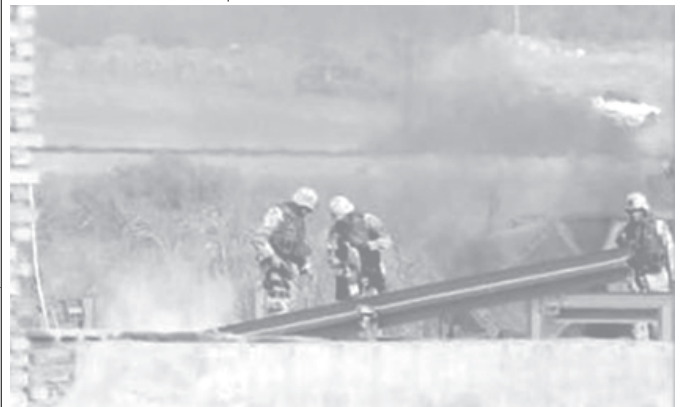
US Army soldiers survey the scene, following an attack on a military convoy on the motorway west from the Iraqi capital Baghdad, on 8 Sept, 2004. Militants attacked a US military convoy in western Baghdad setting three military vehicles on fire and wounding at least three troops, a Reuters witness said.

nese Government opposes all forms of terrorism and condemns terrorism activities directed at innocent civilians. He also said China is willing to cooperate closely with all countries, including Spain, to push the international anti-terrorism struggle forward. — MNA/Xinhua