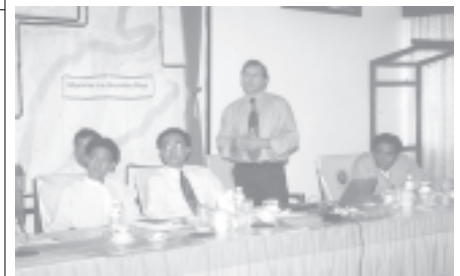
Concluding ceremony of Photogrammetry Course in progress.—H