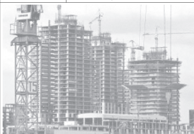
Cranes fill the sky as work progresses at a residential project in downtown Bangkok.