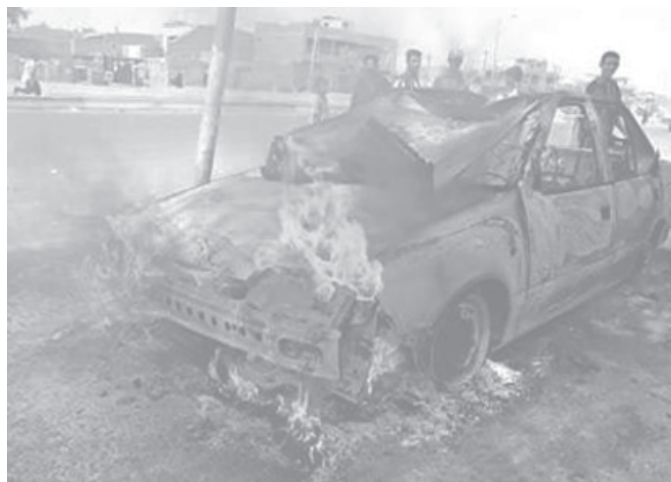
Thick smoke rises after a US airstrike in Fallujah, Iraq, on 8 Sept, 2004.