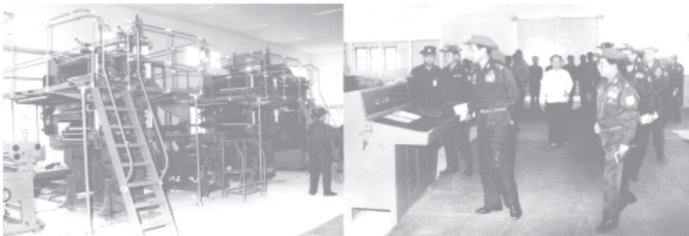
Vice-Senior General Maung Aye inspects progress in installation of four-unit rotary press at Upper Myanmar Government Press (Mandalay).

Apart from the one in Mandalay, other sub-printing houses in Kalay, Myitkyina, Lashio, Taunggyi, Kengtung, Magway and Sittway are printing and publishing newspapers for distributing them to the people daily.