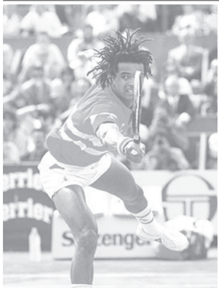
French tennis ace Yannick Noah, seen here in 1987, is among eight people nominated for possible 2005 induction to the International Tennis Hall of Fame.