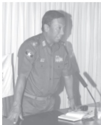
Vice-Chief of Military Intelligence Maj-Gen Kyaw Win addresses the meeting to upgrade Yangon International Airport, to secure safety and smooth air services.