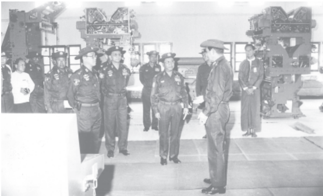
Vice-Senior General Maung Aye gives instructions to officials on installation of four unit rotary press at Upper Myanmar Government Press (Mandalay).—MNA

In the briefing hall, Minister for Information Brig-Gen Kyaw Hsan reported that Upper Myanmar Government Press (Mandalay) was established with a view to printing necessary school textbooks in Mandalay and distributing them to basic education students from Upper Myanmar.