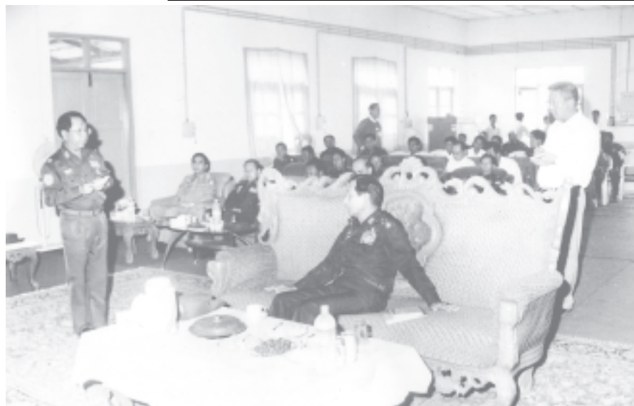
Vice-Senior General Maung Aye hears reports on matters related to Upper Myanmar Government Press (Mandalay).

In the briefing hall, Minister for Information Brig-Gen Kyaw Hsan reported that Upper Myanmar Government Press (Mandalay) was established with a view to printing necessary school textbooks in Mandalay and distributing them to basic education students from Upper Myanmar.