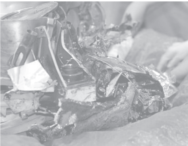
The remains of the Genesis capsule is examined after it crashed on 8 Sept, 2004, in Dugway Proving Ground, Utah. The space capsule, containing particles of solar wind, was supposed to have been snatched from the sky by a helicopter before hitting the ground. But the parachutes failed to deploy.