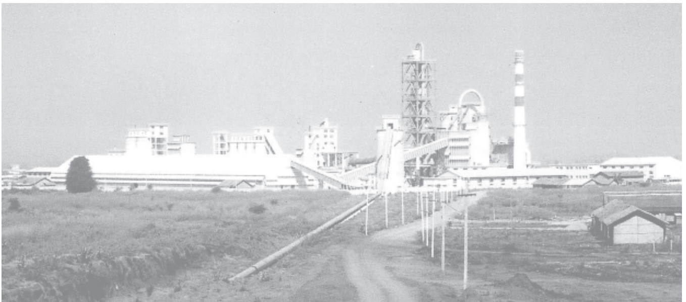
Kyaukse Cement Plant which can produce 120,000 tons of cement a year.