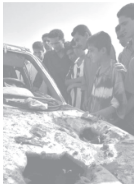
Local residents stand by a car damaged in US air strikes in Sadr City, Baghdad, on 8 Sept, 2004.