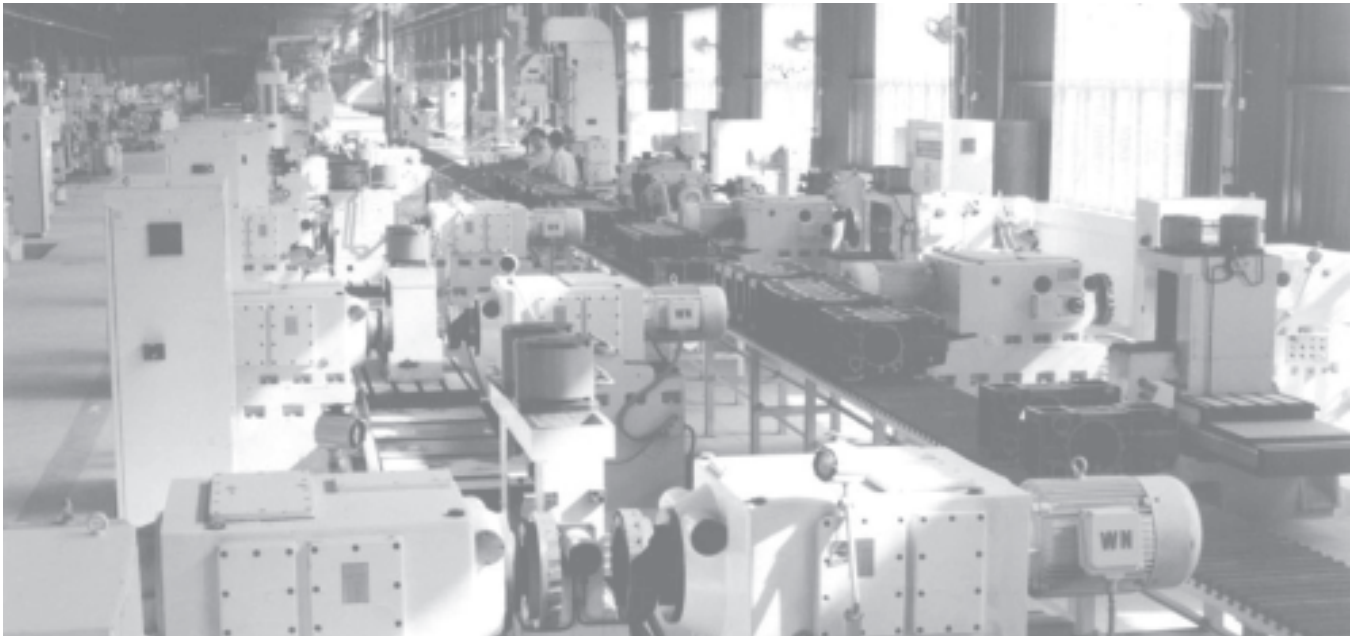
Cylinder blocks of farm machinery plant in Ingon Village in Kyaukse Township.