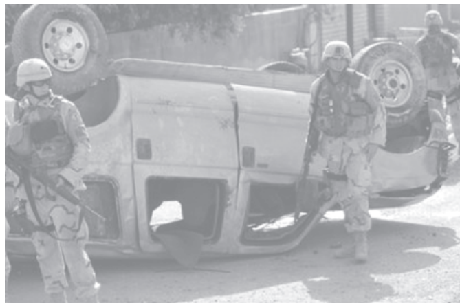
US soldiers inspect a car, reportedly transporting foreigners wearing bulletproof vests and carrying guns, that was attacked by militants in Baghdad, on 8 Sept, 2004.