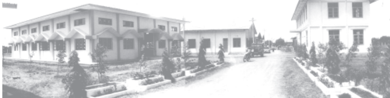
Construction site of Upper Myanmar Government Press (Mandalay).