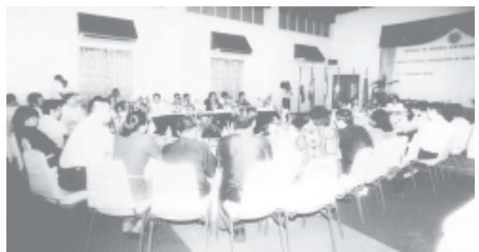
The second day of Workshop for People-to-People Exchange Programme ASEAN Cultural Interaction at Grassroots, Phase III, in progress in Mandalay.

The Ministry of Information Information and Public Relations Department