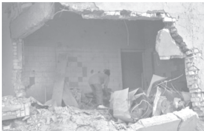
An unidentified resident retrieves intact household goods after US air attacks destroyed his home in Fallujah, Iraq, on 8 Sept, 2004. On Tuesday night and Wednesday morning, US jets fired several missiles into Fallujah in retaliation for Monday's militant attacks on Marine positions outside the city that killed seven Marines.