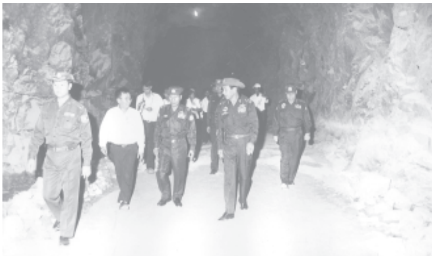
Vice-Senior General Maung Aye and party inspect the tunnel at Ye Ywa Hydropower Project.

The project is being implemented on Dokhtawady River at a place 31 miles south-east of Mandalay. Its generation capacity will be 790 megawatts. Thirty-one per cent of the project have been completed at present.