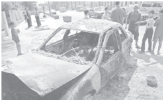
Iraqis survey a destroyed car following clashes between the US Army and Iraqi guerillas in the centre of Baghdad, on 6 September, 2004. —INTERNET

Sunni Muslim guerillas and foreign-born fighters west and north of Baghdad. Since the start of the Iraq war, 979 US troops have died in the country and almost 7,000 have been wounded, the report said. — MNA/Xinhua