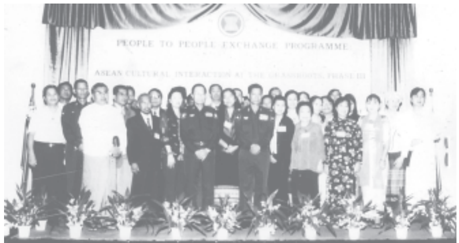
Mayor Brig-Gen Yan Thein, Deputy Minister Brig-Gen Soe Win Maung and delegates pose for a documentary photo.