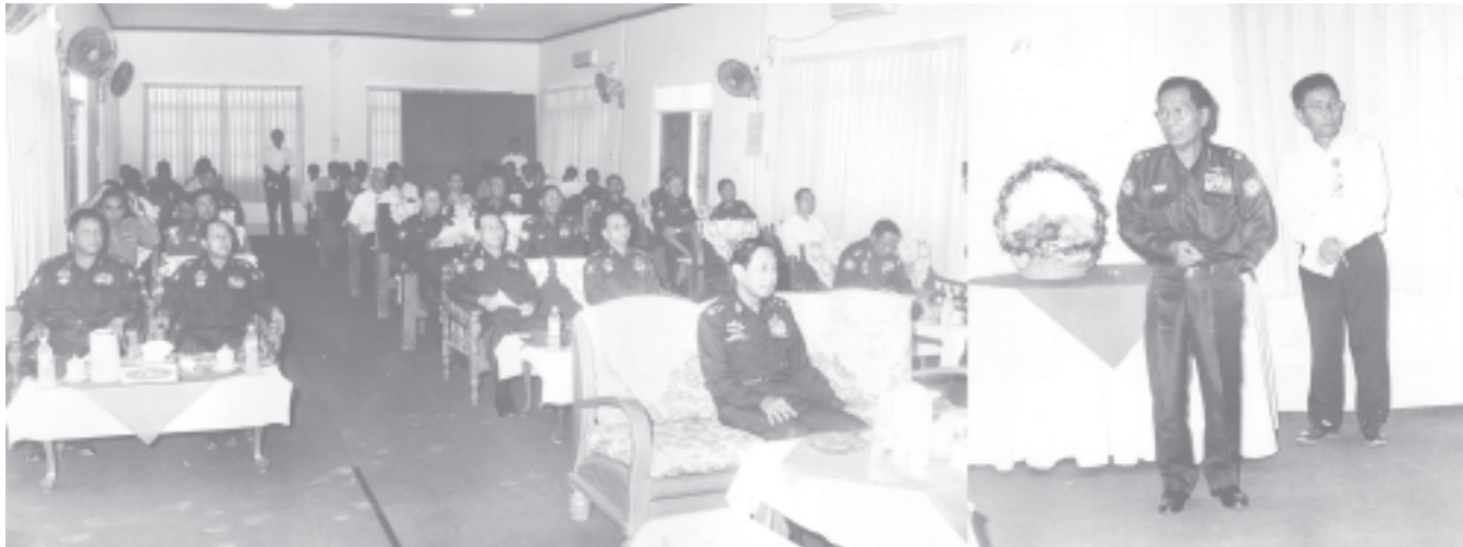
Vice-Senior General Maung Aye hears a report by Minister for Electric Power Maj-Gen Tin Htut at Ye Ywa Hydropower Project. — MNA