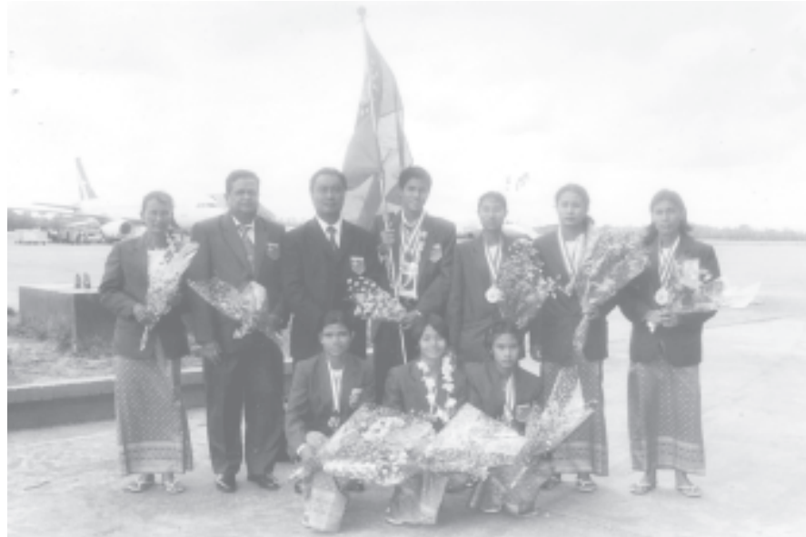
The Myanmar track and field team that bags nine gold and four silver.