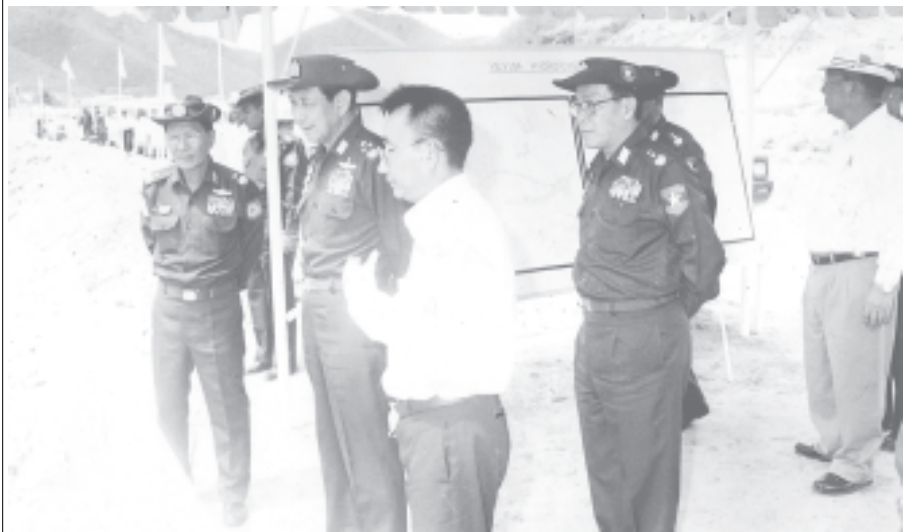
Vice-Senior General Maung Aye looks into Ye Ywa Hydropower Project.

YANGON, 7 Sept — Senior General Than Shwe, Chairman of the State Peace and Development Council of the Union of Myanmar has sent a message of sympathy to Mr Hu Jintao, President of the People's Republic of China for the loss of life and property caused by the recent floods and landslides in some parts of Southwest China.