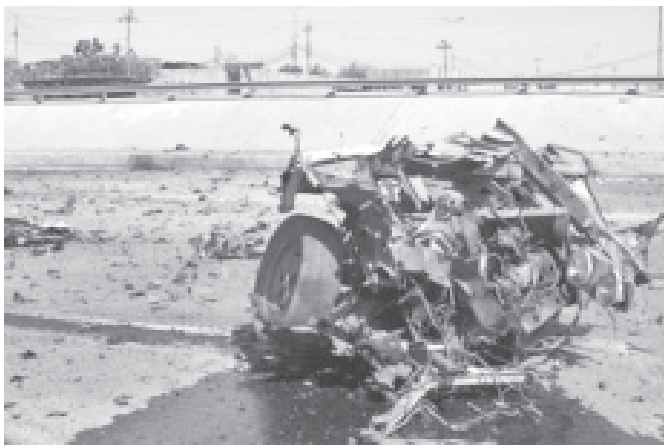
The crew of a US Striker armoured vehicle keeps watch over the site of a car bomb explosion in Mosul, Iraq, on 6 Sept, 2004. An US armoured vehicle was reportedly damaged in the blast.