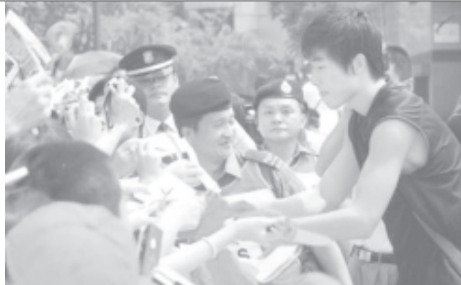
Security personnel surround Chinese Olympic gold medalist hurdler Liu Xiang as he signs autographs for fans at a Hong Kong seaside promenade, on Tuesday, 7 Sept, 2004. China's 32 Olympic gold medalists fanned out across Hong Kong on Tuesday in a charm offensive analysts say is aimed at boosting support for pro-Beijing candidates in a legislative election just days away.