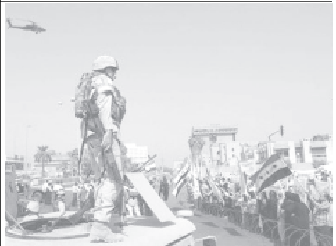
A US soldier keeps watch as Iraqi citizens shout slogans against the rising insurgency in Iraq, during a demonstration in Baghdad on 6 Sept, 2004.