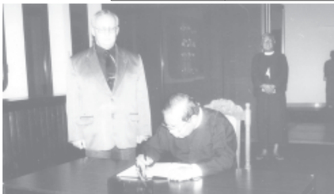
Deputy Minister U Khin Maung Win signs the book of condolences.