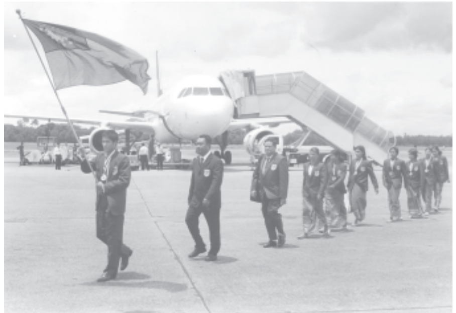
Victorious Myanmar team seen arriving back at the airport.

5000 metres event and at the men's 10000 metres event; Kay Khine Lwin, who won two gold at the women's 400 metres event and at the women's 200 metres event; Myint Myint Aye, who won two gold at the women's 1500 metres event and at the women's 800 metres event; Kay Khine Myo Tun, who won one gold at the women's 5000 me-