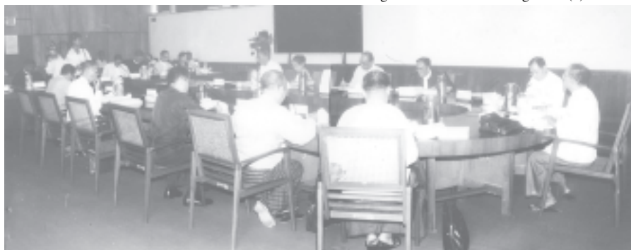
The meeting of members of the panel of chairmen of National Convention Plenary Session in progress.