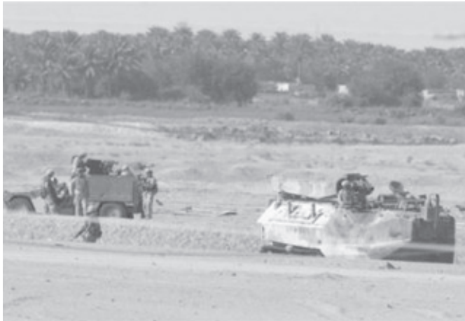
US soldiers stand at the site of a massive car bomb attack on the outskirts of Fallujah, 40 miles north west of Baghdad, on 6 Sept, 2004. —INTERNET

The deaths raise to at least 985 the number of US soldiers killed in Iraq since the US-led forces invaded the country in March 2003.— Internet