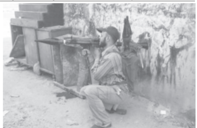
A supporter of radical Shiite cleric Moqtada al-Sadr checks his RPG launcher before beginning a patrol of al-Sadr's militia controlled territory in Sadr City, Iraq, on 6 Sept, 2004.