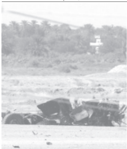
A destroyed vehicle lies at the site of a massive car bomb attack on the outskirts of Fallujah, 40 miles northwest of Baghdad, on 6 Sept, 2004.

He said that Egypt has supported Russia's hosting of an international conference on Iraq, adding that Egypt believes such a conference will be a positive step, if tangible results could be achieved to help restore Iraq's stability. — MNA/Xinhua