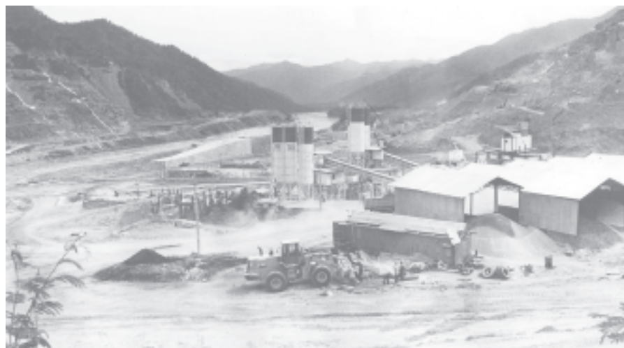
Ye Ywa Hydropower Project site.