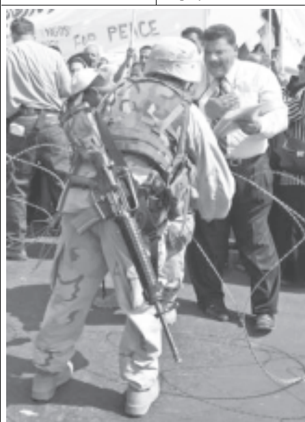
A US Army soldier spreads barbed wire as an Iraqi protester shouts during a demonstration against terrorism outside the so called Green Zone which contains the US Embassy in Baghdad on 6 September, 2004.—INTERNET

Turkish city of Antakya, was the latest in a series of Turkish companies to pull out of Iraq to try to secure the release of captured employees.—Internet