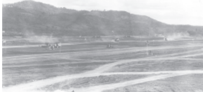
Anisakhan Airport Project being implemented in PyinOoLwin Township.