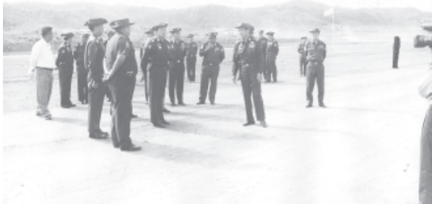
Vice-Senior General Maung Aye inspects Anisakhan Airport Construction Project in PyinOoLwin Township.