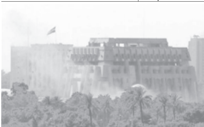
Smoke rises after explosions inside the heavily guarded Green Zone, the headquarters of the US Embassy and Iraq's interim government, in Baghdad, on 6 September, 2004.