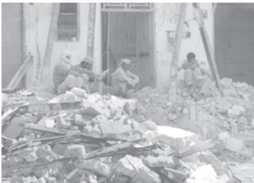
Residents sit on piles of rubble of their destroyed homes in Najaf, Iraq, on 29 August, 2004.