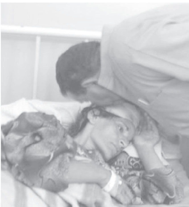
An Iraqi woman is looked after by her father after she was injured in a clash in Tal Afar, about 30 miles west of Mosul, Iraq, on 29 August, 2004.