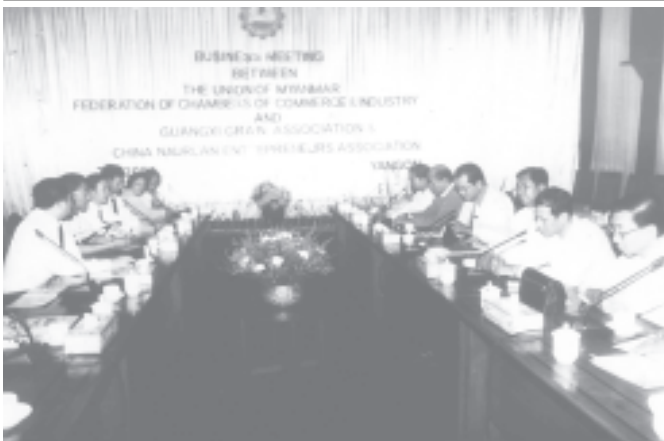
Officials of UMFCCI and China Nauruan Entrepreneurs Association seen at business meeting.

It is learnt that 90 per cent of the construction of Yangon Kart Speedway is completed. — MNA