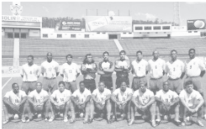
Ecuador's national soccer team poses for team photo at Atahualpa Stadium in Quito, Ecuador, on Wednesday, 1 Sept, 2004. Ecuador will face to Uruguay in a World Cup qualifying match on 5 Sept, in Montevideo. —INTERNET

Japan, who top Group 3 with a maximum nine points, thrashed India 7-0 at home in June and are expected to register another big win in the return tie to be played in Kolkata next Wednesday. — MNA/Reuters