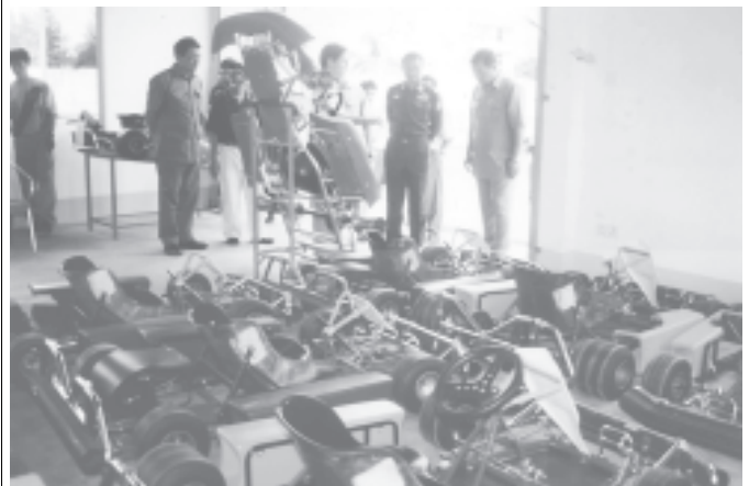
Minister for Sports Brig-Gen Thura Aye Myint inspects Yangon Kart Speedway being built by Torque and Power Motors Ltd.— SPED