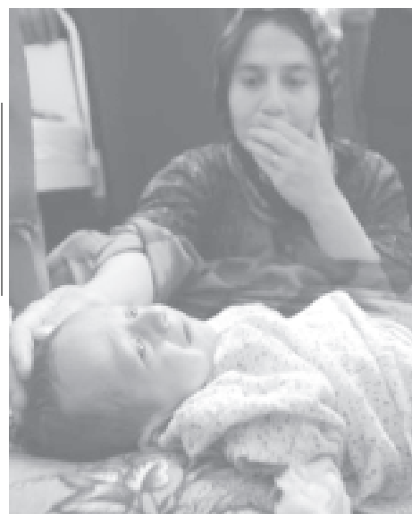
An Iraqi baby lies with injuries in a hospital following clashes on 29 August, 2004 around Tal Afar, near the northern city of Mosul, Iraq.