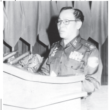
Lt-Gen Soe Win addresses opening of Special Refresher Course for Basic Education Teachers. MNA

The Secretary-1 explained that in shouldering the responsibility of the State, the State Peace and Development Council Secretary-1 (See page 8)