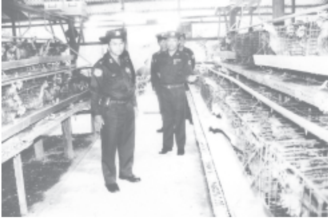
Commander Maj-Gen Myint Swe inspects No 2 Livestock Breeding Farm of Yangon Command.