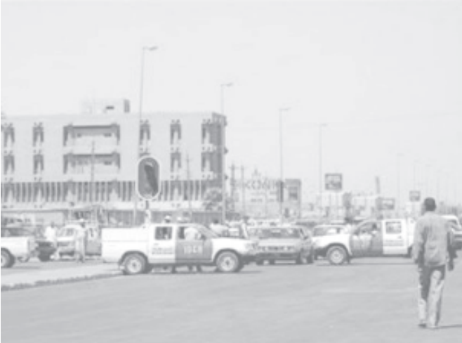
Policemen cordon off the area after several mortar rounds exploded near the convention centre where delegates to Iraq's new National Council met for the first time inside the heavily guarded Green Zone, Baghdad, on 1 Sept, 2004.