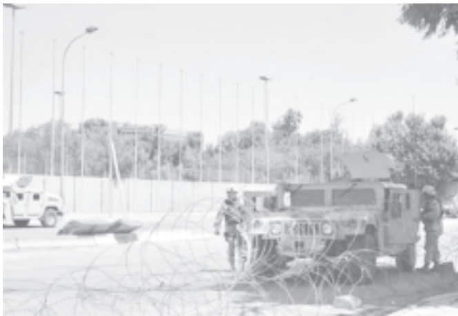
US soldiers keep guard after several mortar rounds exploded near the convention centre where delegates to Iraq's new National Council met inside the heavily guarded Green Zone, Baghdad, on 1 Sept, 2004. —INTERNET

It added that the house attacked in the air strike was next to fields. —Internet