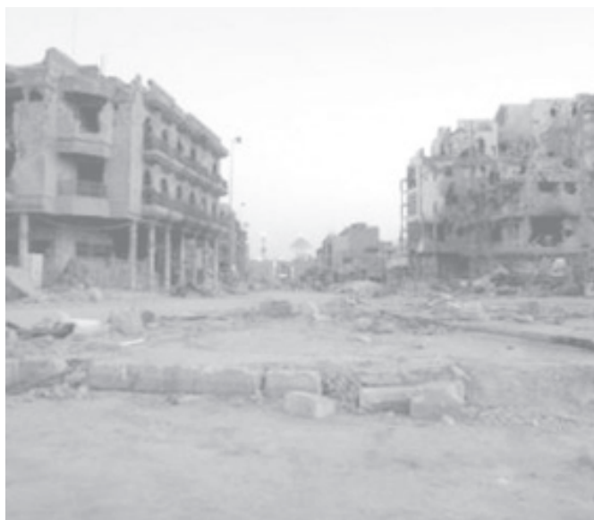
Destroyed buildings in Najaf, Iraq, seen on 28 August, 2004.