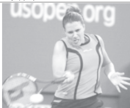
Jennifer Capriati from the United States eyes her return to Magui Serna from Spain at the US Open tennis tournament in New York on Wednesday, 1 Sept, 2004.

Mido, who has suffered a string of injuries, was due to return to action with Marseille on September 12 after a hamstring problem but had made it clear he wanted to leave. — MNA/Reuters