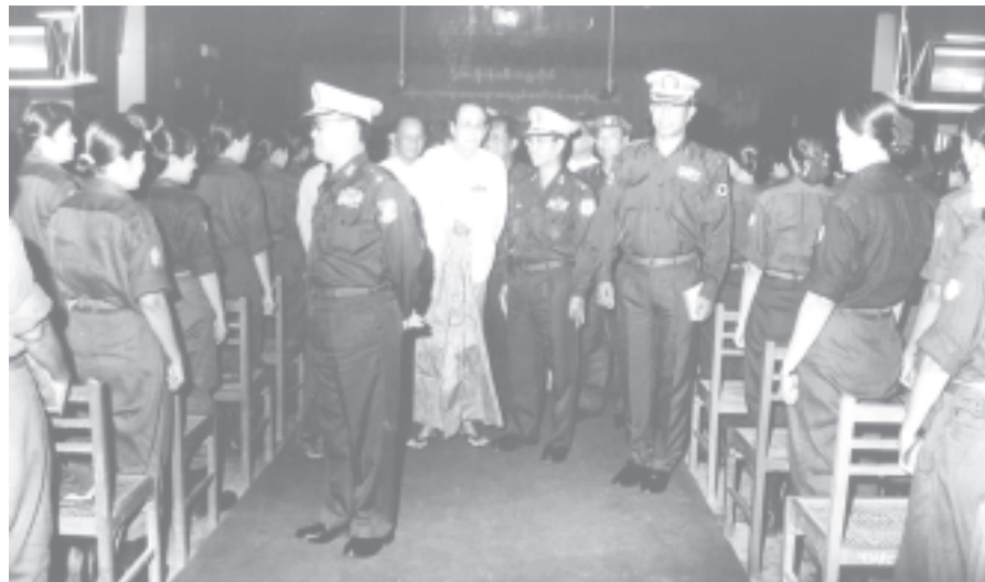
MEC Vice-Chairman Secretary-1 Lt-Gen Soe Win cordially converses with trainees of Special Refresher Course No 55 for Basic Education Teachers.

The classes are not the only ones concerning with the national education goal at the knowledge age. And it has covered the entire nation, resulting in lofty aims, which are the concern of the entire national people such as ensuring all national people to be literate ones, all school-going-age children to complete primary education and to pursue middle school education, constant learning opportunity for everyone regardless of age and education level, elevating of the education standard of the entire people, and transforming the nation into a peaceful, modern and developed one. In this regard, the teachers are to uphold the concept that the people's