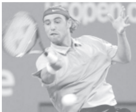
Marcos Baghdalis of Cyprus hits a return to Roger Federer of Switzerland during their match at the 2004 US Open in New York, on 1 Sept, 2004. Federer defeated Baghdalis 6-2, 6-7, 6-3, 6-1.

"It was difficult because I've supported Everton all my life and I've been playing for Everton for two years so it made it even more difficult... but then United came in for me and I knew I wanted to further my career and go and play in the Champions League. — MNA/Reuters