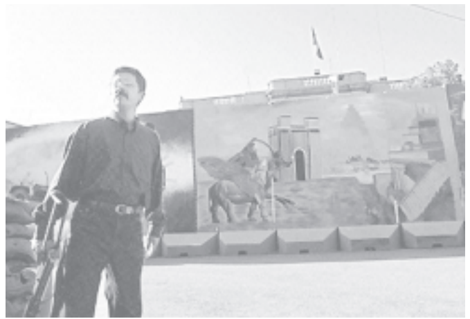
A private security guard secures the entrance of the French Embassy in Baghdad on 1 Sept, 2004. — INTERNET

French Foreign Minister Michel Barnier was in the Egyptian city of Alexandria on Tuesday evening after talks with Jordanian and Egyptian leaders during the day. He was been on a Middle East tour drumming up appeals for their release. — MNA/Reuters