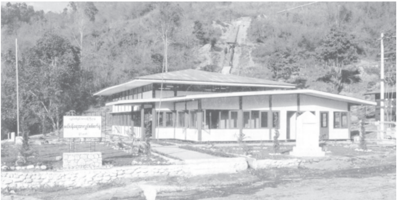
Maipan hydro-power station was built to the east of Monghsat, Shan State (East) to supply electricity to local people.