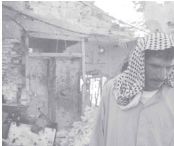
Locals assess damage done to buildings during airstrikes and gunbattles between US soldiers and Mahdi Army militiamen, in Najaf, Iraq, on 28 August, 2004.