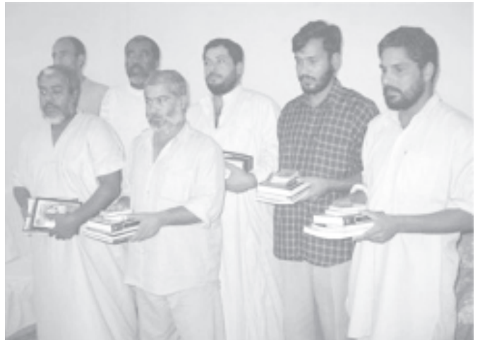
Seven hostages, from India, Kenya and Egypt, are seen at an undisclosed location just before their release in Iraq on 1 Sept, 2004.