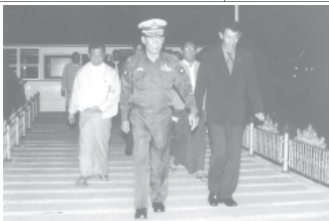
Minister for Energy Brig-Gen Lun Thi welcomes back Deputy Minister for Energy Brig-Gen Than Htay who attended Conference on Biofuel in Thailand.—ENERGY

Delegation member Director (Admin) U Thuang Myint of Myanmar Petrochemical Enterprise also arrived back on the same flight.—MNA