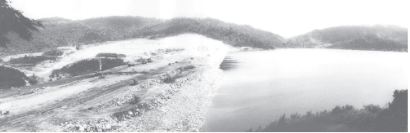
The Paunglaung Multi-purpose Dam Project in Mandalay Division.