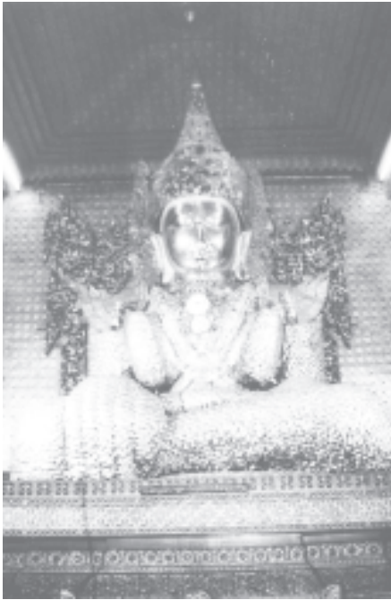
Commander-in-Chief of Royal Thai Army General Chaisit and party pay homage to Maha Muni Buddha Image in Mandalay.