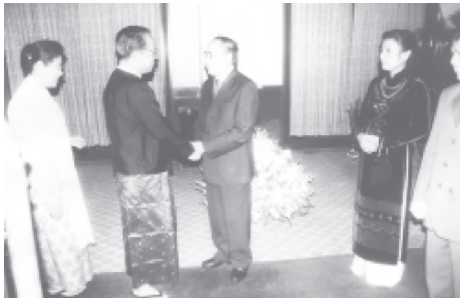
SRV NATIONAL DAY MARKED: The Vietnamese Embassy in Myanmar today held a ceremony to mark National Day of the Socialist Republic of Vietnam. Minister for Foreign Affairs U Win Aung and wife being welcomed by Vietnamese Ambassador Mr Pham Quang Khon and wife at the reception.