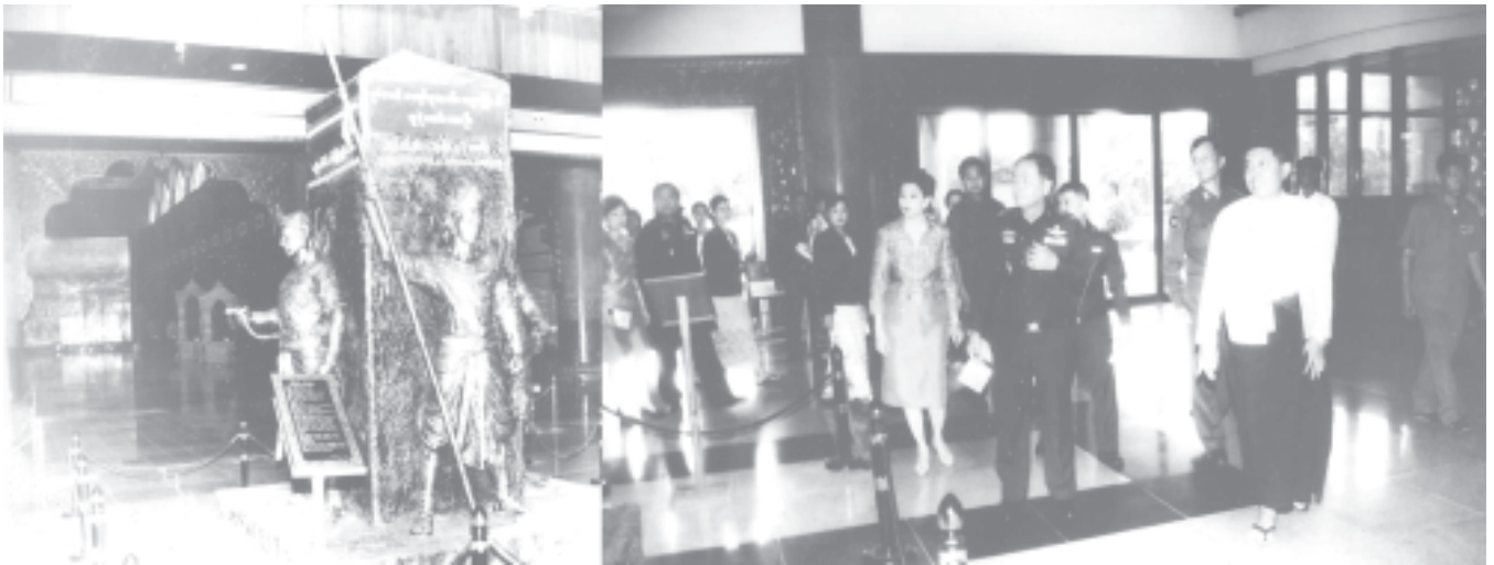
Commander-in-Chief of Royal Thai Army General Chaisit Shinawatra and wife and party visit Bagan Archaeological Museum.