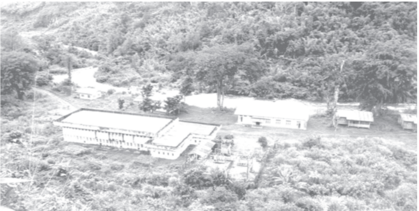
Kyeinkharankha hydro power station built in Myitkyina Township, Kachin State, is generating 25 kilowatt and supplying electricity to villages in the township.