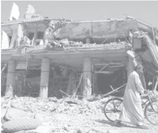
An Iraqi man wheels his bicycle past a destroyed Najaf building on 28 August, 2004.