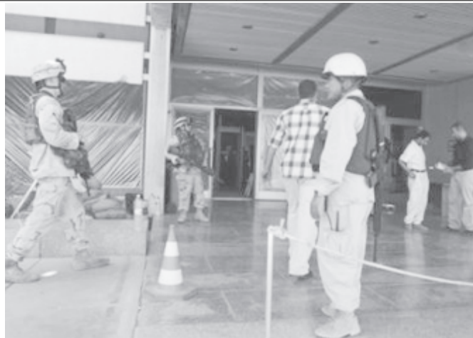
US soldiers and private security personnel guard an entrance to the convention centre where delegates to Iraq's new National Council met for the first time inside the heavily guarded Green Zone, Baghdad, on 1 Sept, 2004. One person was wounded after several mortars landed nearby.

Cambodia and Nepal were welcomed by the fifth WTO ministerial conference held in Cancun, Mexico last September into its fold. Accession to the WTO must be ratified by Cambodia's National Assembly by March 31, 2004, but the political deadlock after the July 27 election in 2003 made Cambodia failure to meet the deadline.—MNA/Xinhua