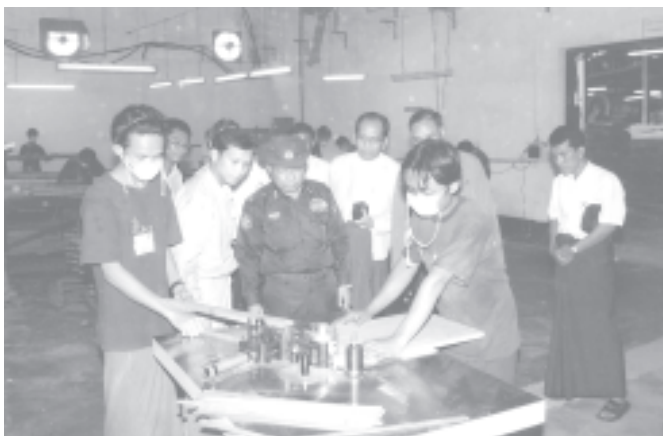
Minister for Forestry Brig-Gen Thein Aung inspects Wood-based Products Factory in Hlinethaya Industrial Zone.—FORESTRY

The minister gave necessary instructions to the officials on efforts to be made for progress of wood-based industries, seeking export market and upgrading the qualities of the products and attended to the needs. —MNA