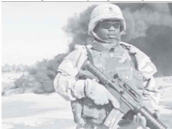
A US soldier guards the perimeter as Iraqi fire fighters work on controlling a burning pipeline near Baghdad, on 30 Aug, 2004.

However, some analysts warned the underlying market conditions still supported higher-than-normal oil prices. The main problem was that there was only a thin margin of spare output capacity, perhaps only 1 per cent, giving extra importance to even the slightest threat of a supply disruption.—MNA/Xinhua