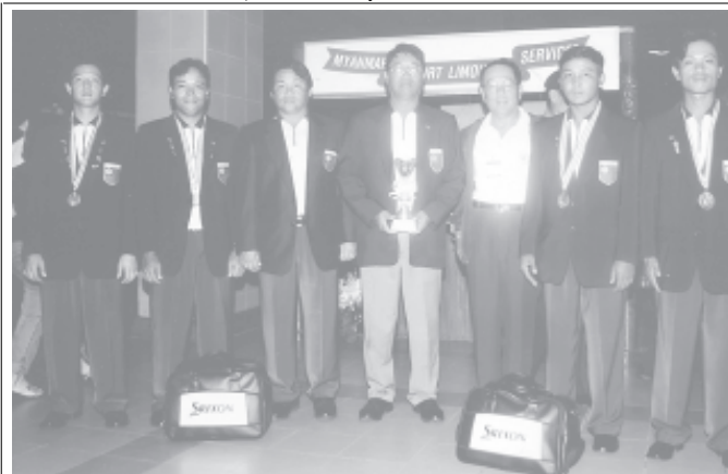
Victorious Myanmar golf team which won third prize in Putra Cup seen at the airport on their arrival.