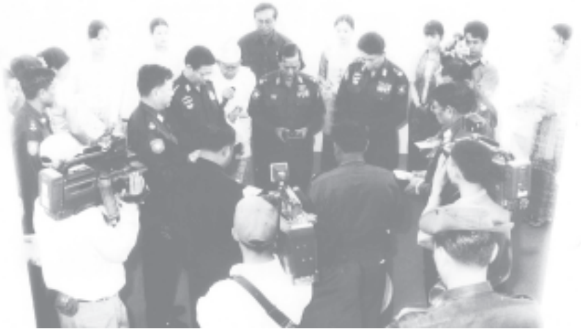
Prime Minister General Khin Nyunt lays cornerstone for building Multi-purpose Diesel Engine Factory in Thagara, Yedashe Township, on 29-8-2004.

Then, the Prime Minister and party posed for a documentary photo together with departmental heads, the Chinese Charge d' affaires and Chinese experts. — MNA