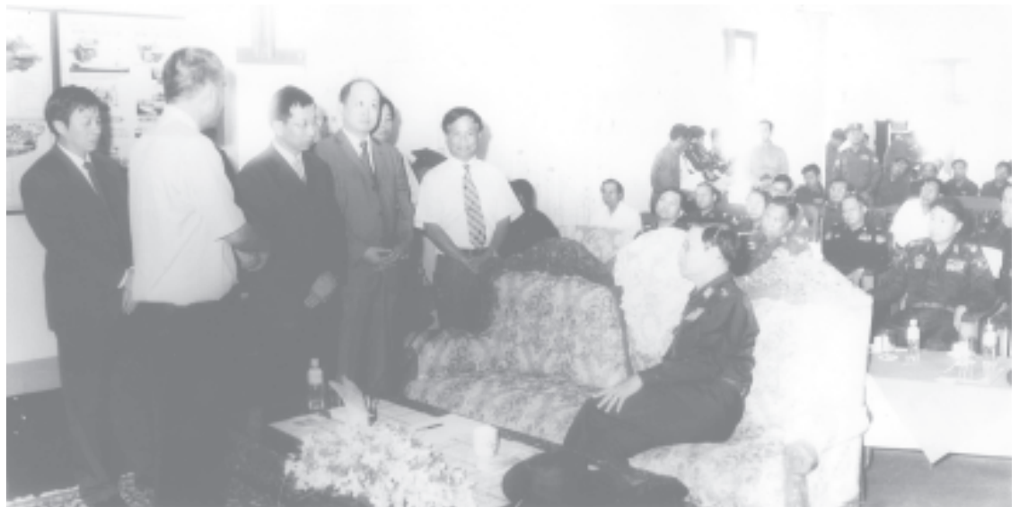
Prime Minister General Khin Nyunt cordially converses with Chinese experts at Multi-purpose Diesel Engine Factory Project site in Thagara, Yedashe Township, on 29-8-2004.

The Prime Minister attended to the needs and gave instructions on conservation of the woods and trees in the area, planting of teak and other hardwood trees, and growing such plants as cashew and mango at the vacant land of the factory compound.