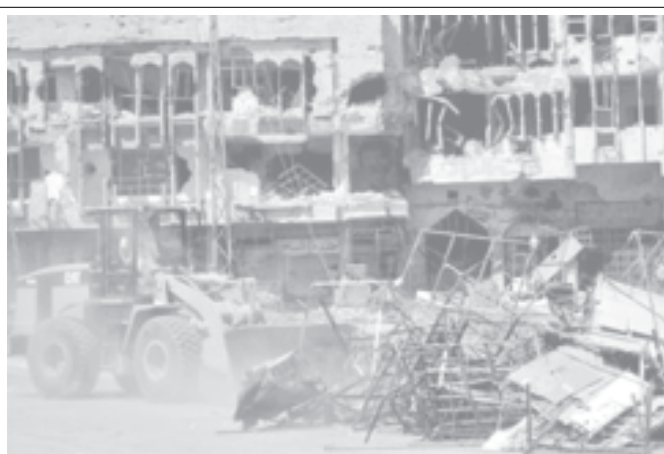
Dozens of municipal workers were out for the first time in weeks, sweeping debris off roads lined with battle-scarred buildings that US bombs had torn huge chunks out of in the holy city of Najaf, Iraq, on 28 Aug, 2004.

Aziz said poverty is not the destiny of Pakistani people as the country has the necessary potential to make an economic turn around. He said policies of last five years have proved Pakistan can take a lead forward in economic development "if we steadfastly pursue the charted course of action". — MNA/PTI