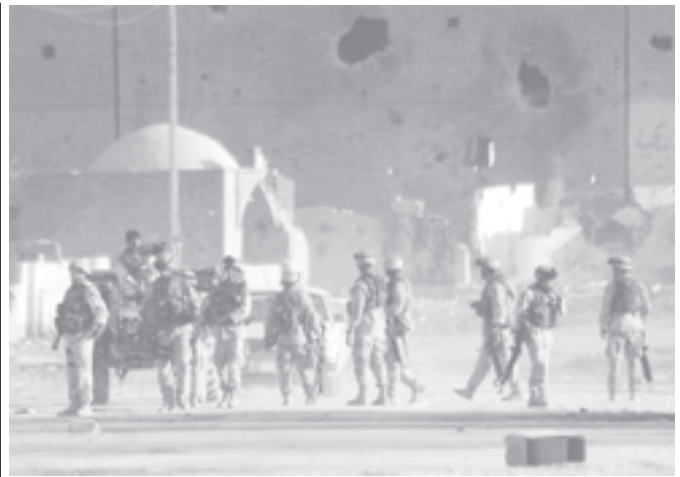
US soldiers patrol an area in Najaf, Iraq on 28 Aug, 2004. On Friday, militants loyal to rebel Shiite cleric Moqtada al-Sadr filed out of the city's revered Imam Ali Shrine ending three weeks of devastating fighting.