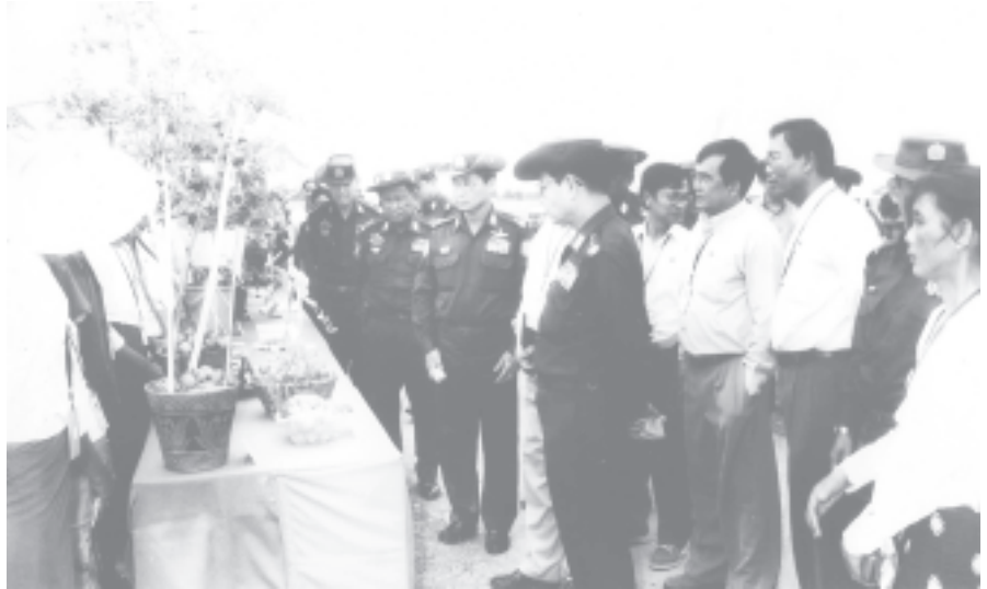
Prime Minister General Khin Nyunt inspects pilot-growing of crops at Yezin Agricultural Research Department in Pyinmana Township.— MNA

The Prime Minister gave instructions on conservation of the forests and trees in accord with rules and regula-