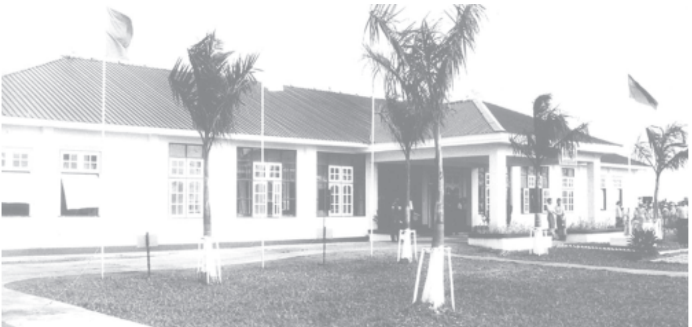
People's Hospital built by Department of Human Settlement and Housing Development in Dagon Myothit (South) Township.