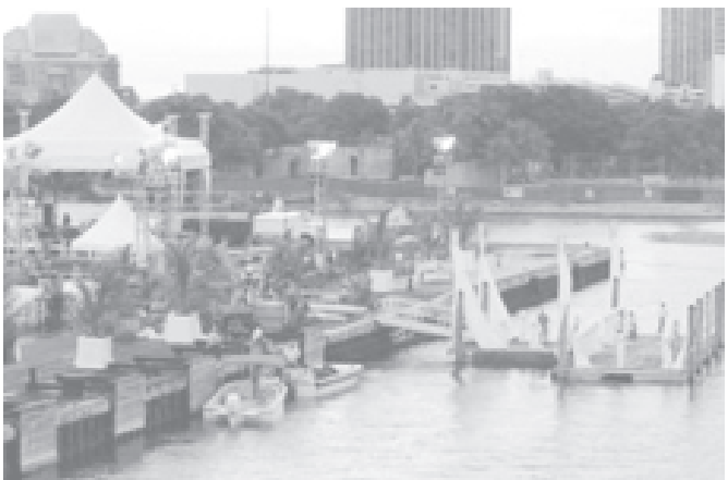
Workers prepare the arrivals area for the MTV Video Music Awards at the US Air Arena in Miami, on 28 Aug, 2004. Nominees and guests will arrive by boat for the award show which will take place on 29 Aug.