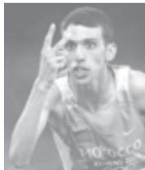
Morocco's Hicham El Guerrouj celebrates his two gold medals after winning the men's 5,000 metres final at the Athens 2004 Olympic Games, on 28 August, 2004.

Bekele, 22, had been hoping for a double of his own. The 10,000 winner, he hoped to become the first man since compatriot Miruts Yifter in 1980 to win the long-distance double. El Guerrouj, however, played the perfect waiting game under the Olympic stadium floodlights, allowing the Ethiopians and Kenyans to dictate the early pace.