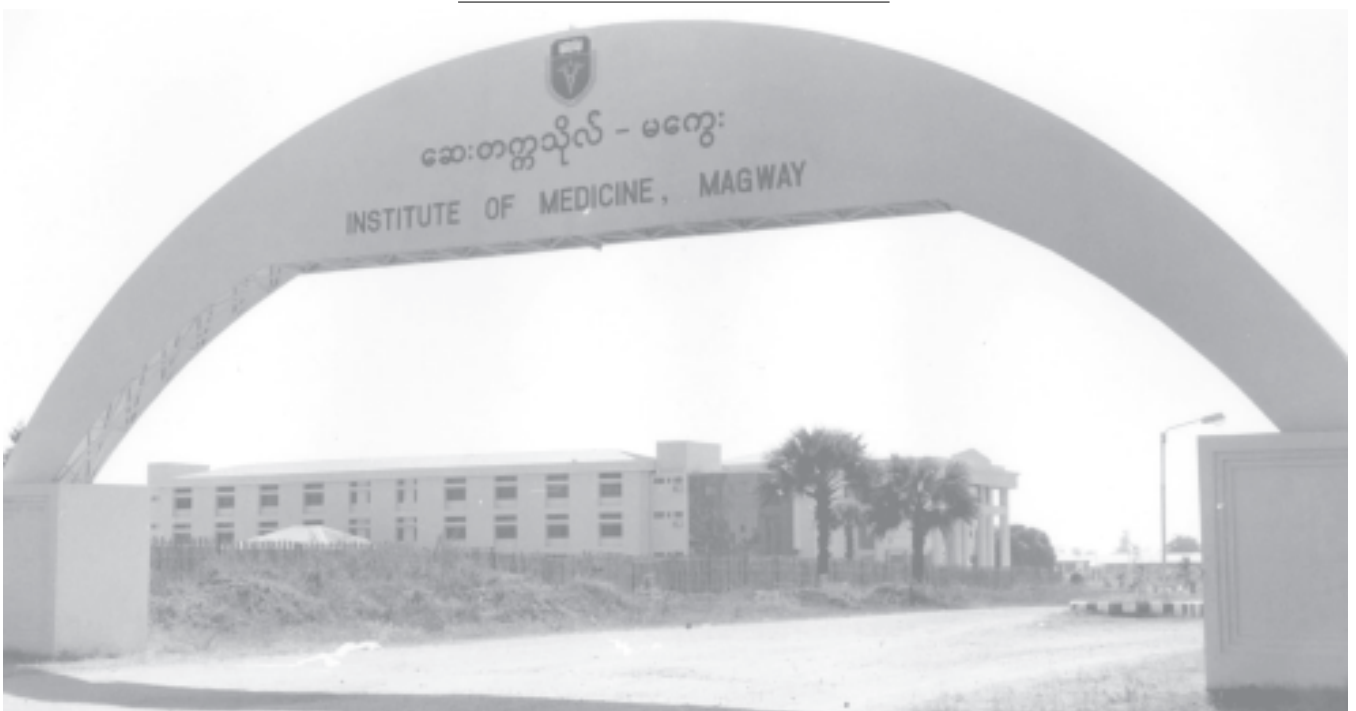
To produce qualified physicians and health staff, institutes of medicines, institute of traditional medicine and institute of dental medicine have been built. Photo shows Magway Institute of Medicine.