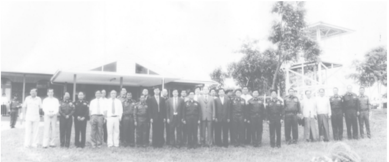
Prime Minister General Khin Nyunt and party pose for documentary photo with Chinese experts at Multi-purpose Diesel Engine Factory Project site in Thagara, Yedashe Township, on 29 August.—MNA

The Prime Minister attended to the needs and gave instructions on conservation of the woods and trees in the area, planting of teak and other hardwood trees, and growing such plants as cashew and mango at the vacant land of the factory compound.