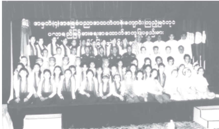
Secretary-1 Lt-Gen Soe Win poses for documentary photo with officials and students at the opening of multimedia classrooms at Kyimyindine BEHS-4.