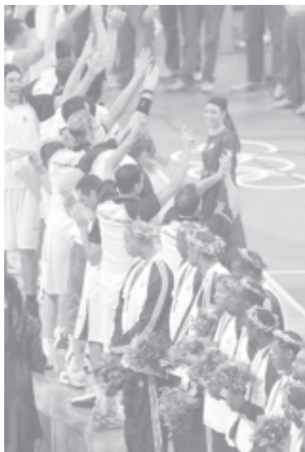
Argentina (top) celebrate their gold medal success in the men's basketball competition at the Athens 2004 Olympic Games as bronze winning US team (bottom) look away, August 28, 2004. Argentina beat Italy 84-69 to win the men's Olympic basketball gold on Saturday, the country's first medal in the sport.

Gianmarco Pozzeco and Matteo Soragna both had 12 points for Italy, who were looking to take their first gold in the sport to go along with a silver they won in 1980. It was Argentina's first Olympics basketball medal.