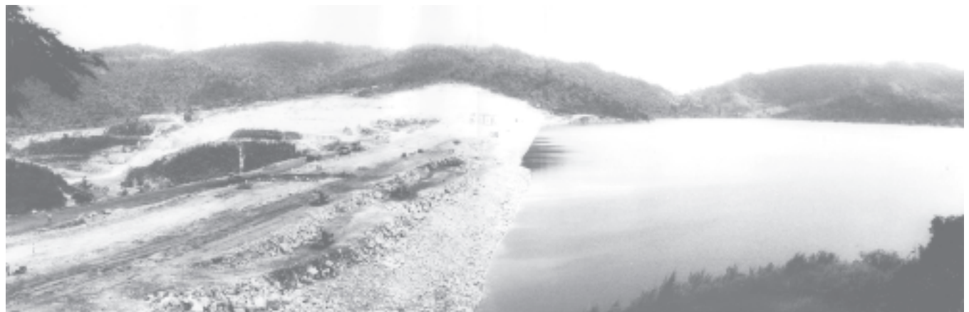
The Paunglaung Multi-purpose Dam Project. (News on page 1)