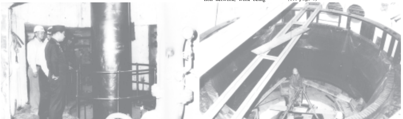
Prime Minister General Khin Nyunt inspects installation of machines at Paunglaung Underground Power Station.— MNA

Installation of turbine No 4 of Paunglaung Dam was completed cent per cent and with its 70-megawatt generation capacity, it will supply power across the nation through the national grid. It is also learnt that installation of the remaining three turbines will be completed before the end of this year.