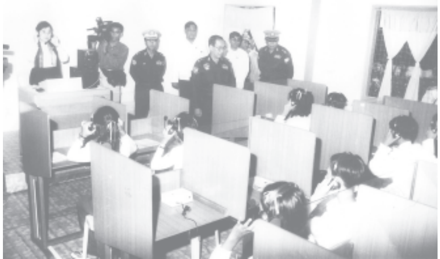
Secretary-1 Lt-Gen Soe Win meets students at multimedia classrooms at Kyimyindine BEHS-4.

Next, the Secretary-1 cordially met those present. The Secretary-1 and party posed for documentary photos with the headmistress, teachers, members of SBT, wellwishers and students. Before their departure, the students presented the song entitled "Zartiman".