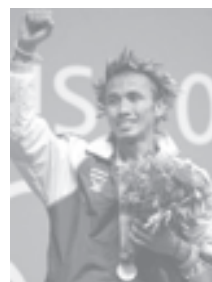
Thailand's Boonjumnong Manus celebrates his gold medal victory during an awarding ceremony for the light-welterweight boxing in the 2004 Athens Summer Olympic Games.