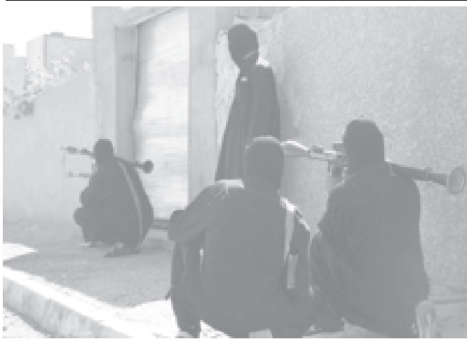
Guerrillas take up a position to fight US troops in Fallujah, Iraq, on 28 Aug, 2004. US warplanes and tanks bombarded targets and US forces had sporadic exchanges of fire with guerrillas in Fallujah on Saturday.

Sunday's march takes place as the 50,000 visitors come to New York for the four-day convention to nominate the president for a second term in the White House. He will face Democratic candidate Sen John Kerry of Massachusetts in the November election.—Internet