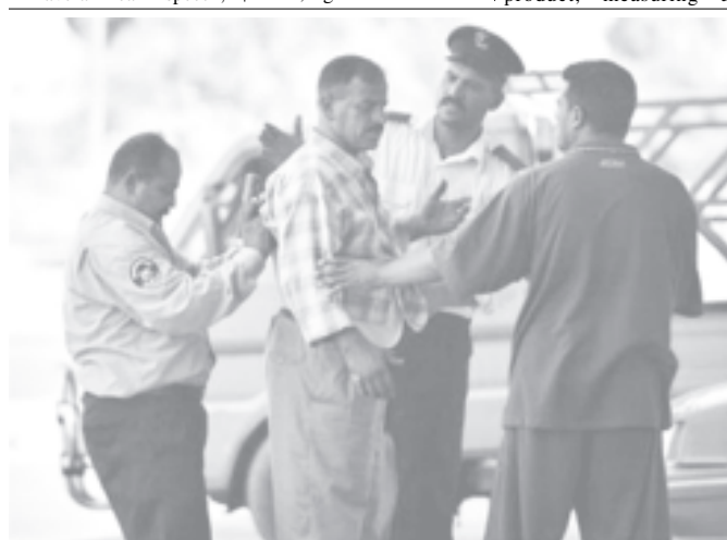
Policemen question a suspect after several mortars landed in eastern Baghdad, Iraq, on 28 Aug, 2004. At least two civilians died and several were injured after guerrillas fired a barrage of mortars into eastern Baghdad on Saturday. —INTERNET