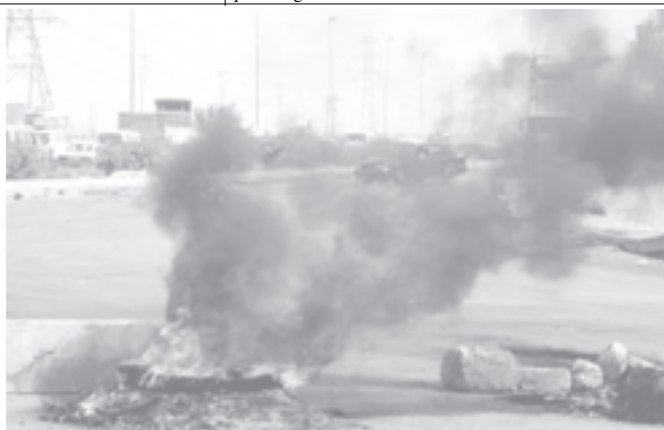
A tire burns as rebel cleric Moqtada al-Sadr's supporters set up a roadblock in the slums of Sadr City of Baghdad, on 28 Aug, 2004. US and Iraqi forces fought militants loyal to al-Sadr in Iraq's capital in battles on Saturday that left three dead and 25 injured.