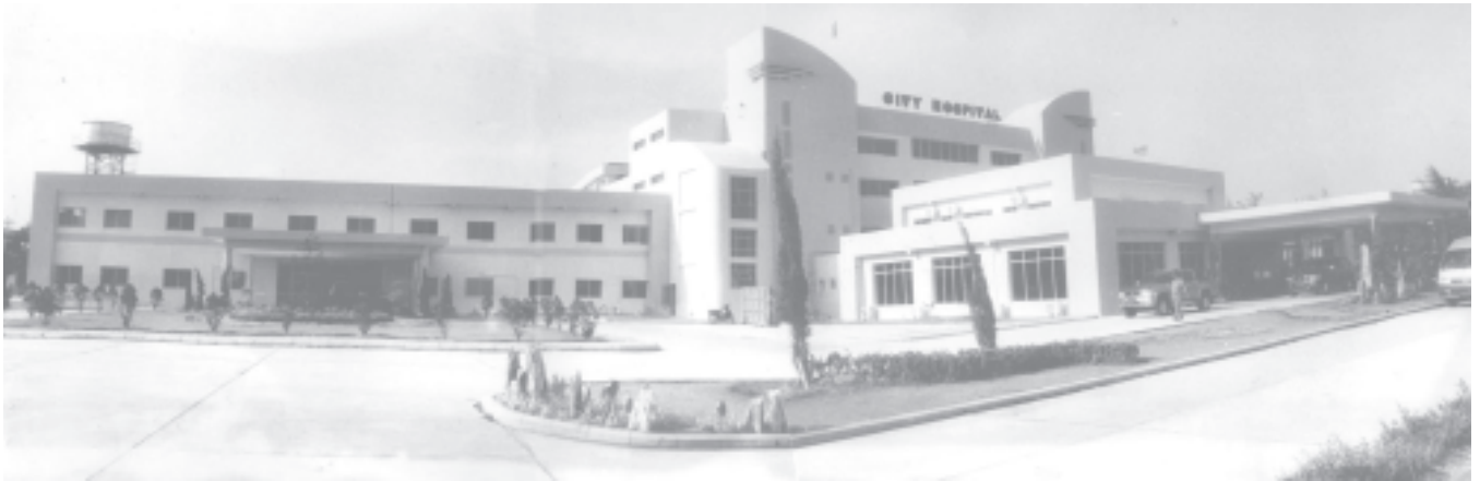
Newly built City Hospital in Mandalay.