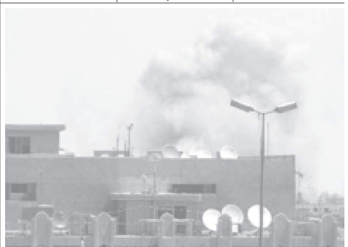
Smoke rises up after a US airstrike in Fallujah, Iraq, on 28 Aug, 2004. The attacks struck the city's eastern al-Askari neighbourhood as well as the industrial area at the eastern entrance of Fallujah destroying four homes and injuring several people.

The committee was considering the proposal with an "open mind", but the final decision "will be taken protecting the interest, not at the cost of the country's interest", he said.—MNA/PTI