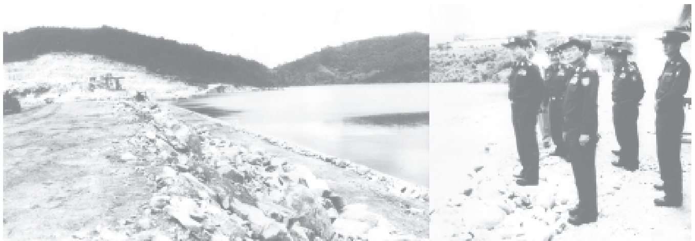
Prime Minister General Khin Nyunt inspects construction of Paunglaung Multi-purpose Dam Project.— MNA

As Myanmar is an agro-based country, agricultural research is of great importance for the nation. It is an important task for development of the national economy.