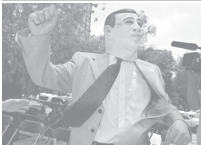
A man dressed as US President Bush performs during a fake trial against him on 28 Aug, 2004, in front of the US Embassy in Mexico City to protest against the Republican Convention and the war on Iraq.

Hours later, the two companies that employed the men said they were withdrawing all staff from Iraq. — Interent