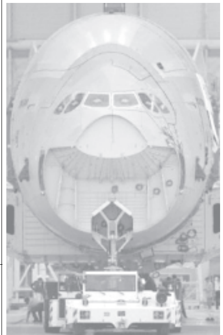
The first A380 super jumbo leaves the Airbus factory at Toulouse-Blagnac in France to undergo tests. The rivalry over Asian skies between US aerospace giant Boeing Co and European rival Airbus is heating up as premium airlines boost their long-range fleets and prepare for the arrival of super jumbos. —INTERNET