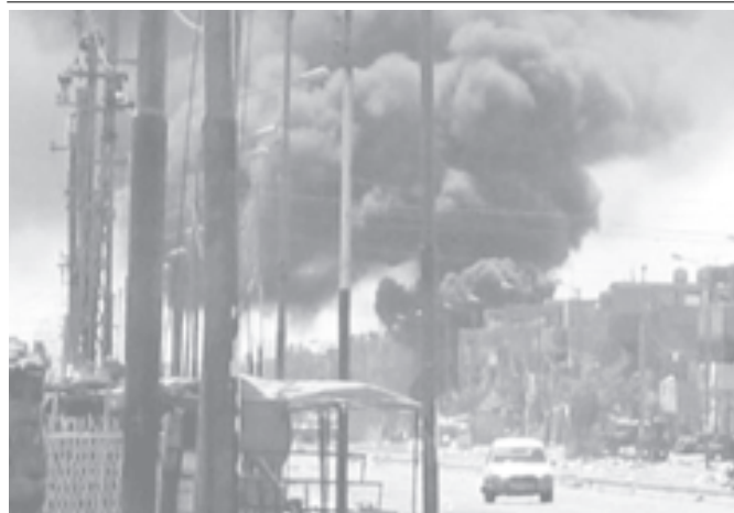
Smoke bellows across the sky, allegedly coming from a US army vehicle that was hit by al-Sadr's supporters in a narrow alley, in Sadr-city in Baghdad, on 28 Aug, 2004. US and Iraqi forces fought militants loyal to rebel Shiite cleric Moqtada al-Sadr in Iraq's capital in battles Saturday that left three dead and 25 injured.