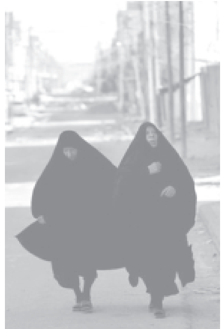
Iraq women make their way through a deserted street during clashes between Moqtada al-Sadr's loyalists and US and Iraqi forces in the besieged city of Najaf on Saturday, 21 Aug. 2004.