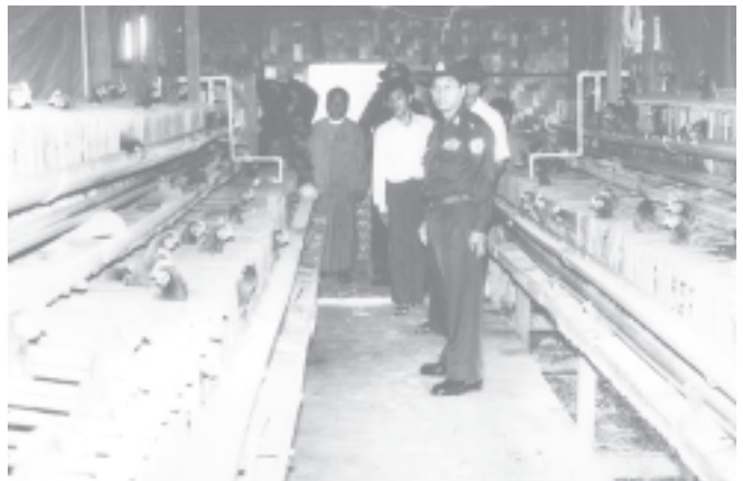
Commander Maj-Gen Myint Swe inspects poultry farming at Yangon Division Vegetables Cultivation and Poultry Farming Special Zone in Hmawby Township.

Next, the commander fulfilled the requirements and inspected progress of special zones. A total of 6,075 acres of land have been put under vegetable in the special zone. Over 1.2 million of broilers and layers have been bred and over 1 million of broilers have been sold. Over 1.36 million fish are being bred in the 568 acres of fish ponds. — MNA