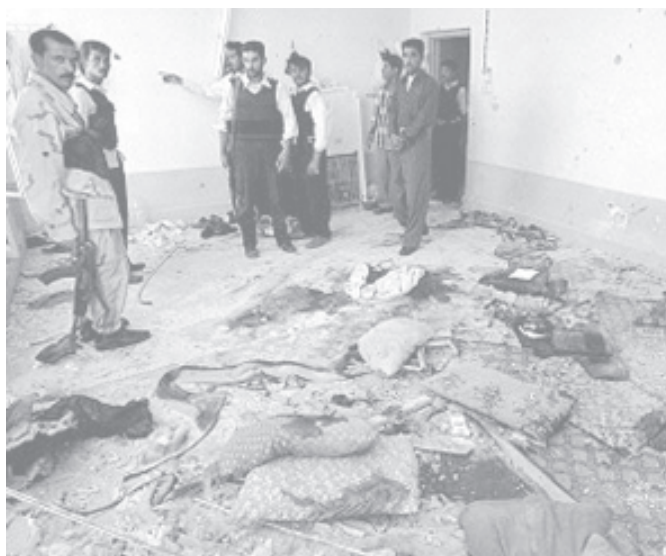
Iraqi police search for colleagues who were killed when two mortar bombs hit the police headquarters in Najaf on 19 August, 2004.