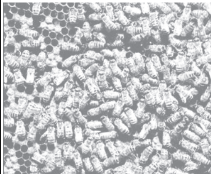
Australian scientists are using the collective intelligence found in insect swarms, like these worker bees, to develop the next generation of hi-tech military hardware.

The Chinese people will work with the people of other countries in the world to promote global multipolarization and the democratization of international relations, push economic globalization toward common prosperity, oppose hegemonism and power politics, fight terrorism in all forms, and devote to the establishment of a new, just and rational international political and economic order, he said. — MNA/Xinhua