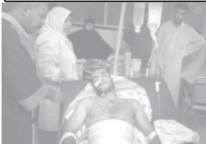
An Iraqi man was injured when his vehicle was caught in the cross fire during clashes between Iraqi guerillas and US forces, in the Shiite stronghold of Sadr City, Baghdad, Iraq, on 23 August, 2004.