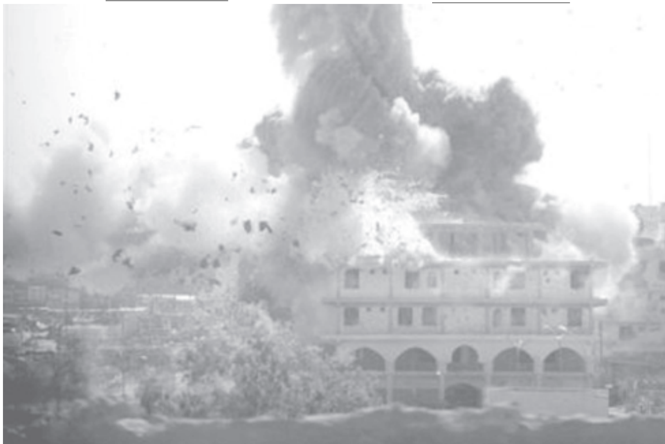
Debris fly from a building explosion during a US aerial assault on guerilla targets in Najaf, Iraq, on 19 August 2004.