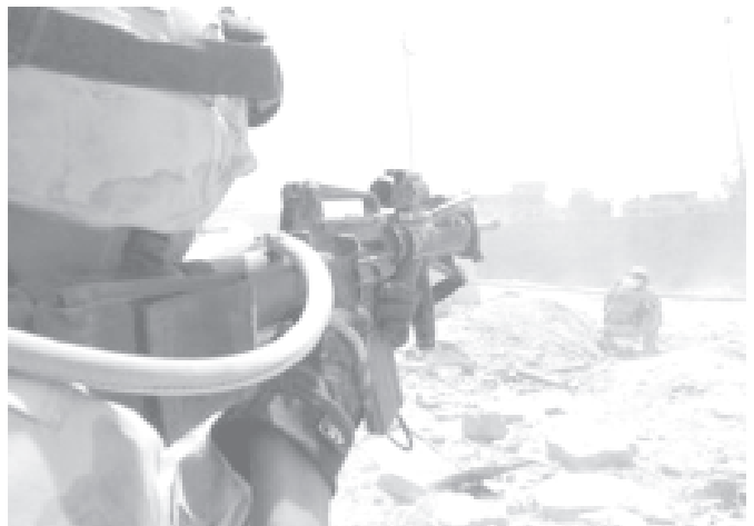
A US Army soldier fires his rifle over a comrade during a gun battle with guerillas in Najaf, Iraq on 21 Aug, 2004.