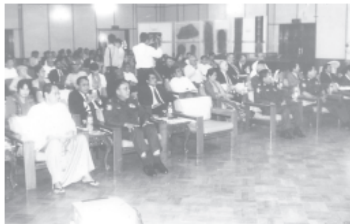
Minister Maj-Gen Kyi Aung addresses opening ceremony of Symposium on Preservation of Cultural Heritage. — MNA

First, Minister Maj-Gen Kyi Aung gave an opening