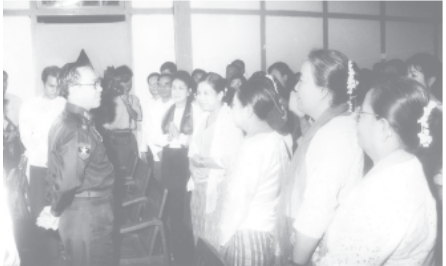
MEC Vice-Chairman Secretary-1 Lt-Gen Soe Win meets those attend the opening ceremony of multimedia classrooms at Kyimyindine BEHS No 5.

He said multimedia classrooms have been opened in almost every basic education high school nationwide with the encouragement of dignitaries of the State and participation of teachers, wellwishers, members of the School Board of Trustees. He said the government provided assistance for upgrading of the multimedia classrooms. Opening of such classrooms reflects the