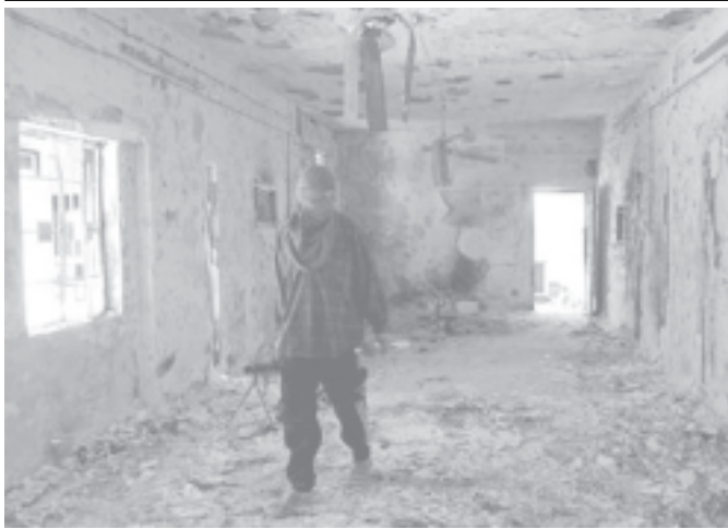
A militiaman of radical Shiite cleric Moqtada al Sadr's Mehdi army looks through a destroyed courthouse in Kufa, near the city of Najaf on 21 August 2004. — INTERNET

Higher concentration of blood cotinine among non-smokers was associated with a 50-to 60-per-cent greater risk of heart diseases. It also concluded that risks associated with passive smoking were widespread among non-smokers. Meanwhile, activists here said ban on tobacco products imposed since May 1 had turned out to be a "facade". "People are seen smoking in the lobby of five star hotels. Same is true for many big restaurants where people smoke freely in non-smoking area," Bejon Mishra from the consumer rights organization "Consumers' Voice" said. — MNA/PTI