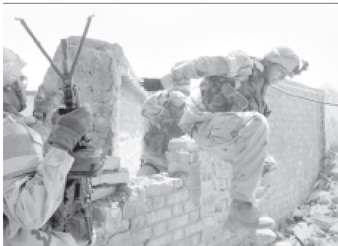
US Army soldiers jump through a wall coming out of the ancient cemetery during a gun battle with guerillas in Najaf, Iraq, on Saturday, 21 Aug, 2004.

The US military said it fired on sites south of the shrine, where militants were shooting from, and did not hit the compound wall.