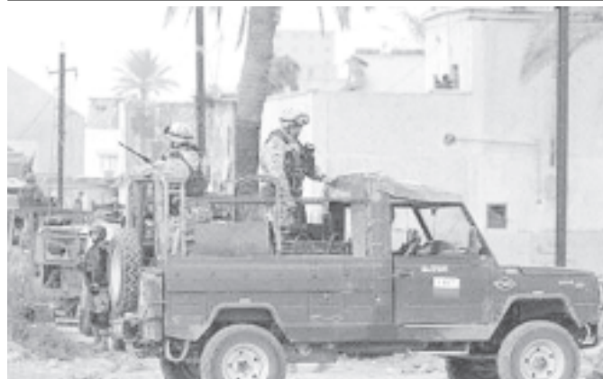
Polish soldiers on patrol in Iraq recently. A Polish soldier was killed and six others wounded in a car bomb attack near Hilla in southern Iraq, a Polish military spokesman said.