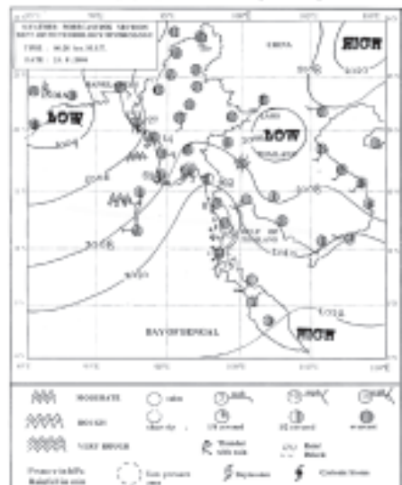
Weather Map of Myanmar and Neighbouring Areas