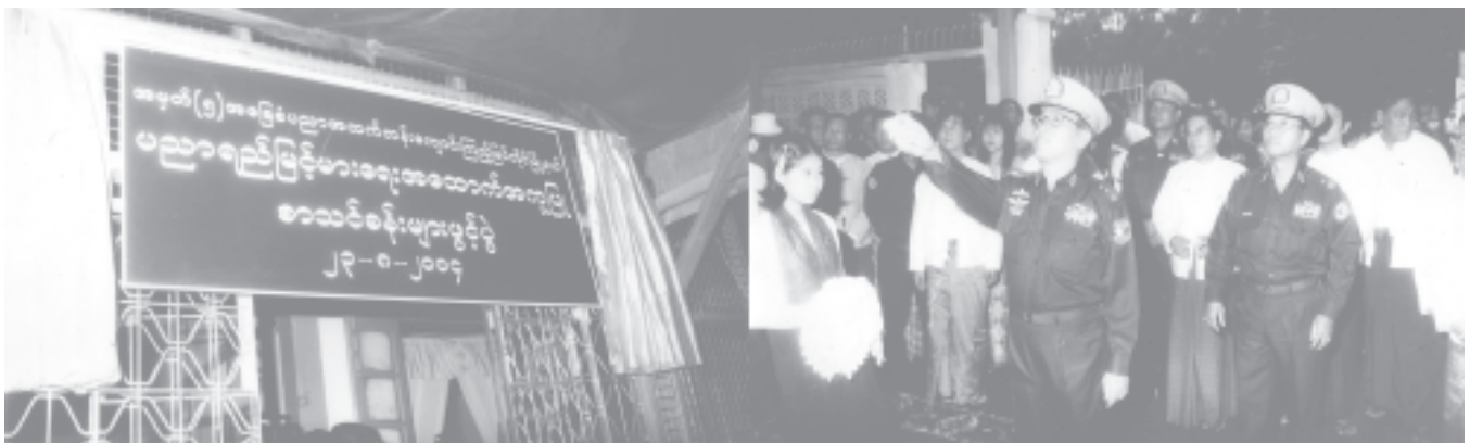
MEC Vice-Chairman Secretary-1 Lt-Gen Soe Win unveils the signboard of multimedia classrooms of Kyimyindine BEHS No 5.

YANGON, 23 Aug—A ceremony to present modern teaching equipment for No 5 Basic Education High School in Kyimyindine Township was held at the school this morning, attended by Vice-Chairman of Myanmar Education Committee Secretary-1 of the State Peace and Development Council Lt-Gen Soe Win.