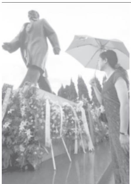
A woman walks underneath a bronze statue of the late paramount leader Deng Xiaoping, the only such statue of Deng in China, surrounded by wreaths at Shenzhen's Lianhua mountain park to mark the 100th anniversary of the birth of Deng on 22 Aug, 2004. The Chinese authorities heaped praise on Deng, a reminder to China's 1.3 billion people that they owe their rising prosperity to Deng and to the Communist Party.