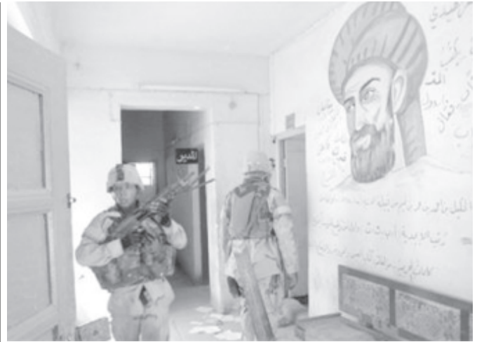
US Army soldiers raid a building under fire from guerillas in Najaf, Iraq, on 21 Aug, 2004.