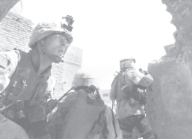
A US Army soldiers take cover during a gun battle with guerillas in Najaf, Iraq, on 21 Aug, 2004.

Since the start of the war last year, 714 American troops have been killed in action.