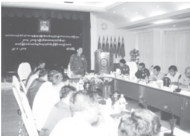
Minister for Progress of Border Areas and National Races and Development Affairs Col Thein Nyunt delivers an address at the meeting.