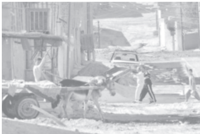
Iraqi civilians cross a street in the besieged city of Najaf on 19 August, 2004.