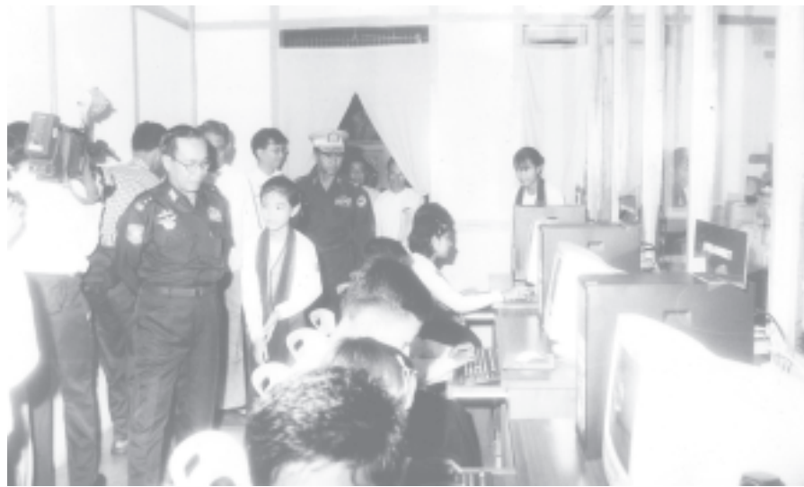
Myanmar Education Committee Vice-Chairman State Peace and development Council Secretary-1 Lt-Gen Soe Win inspects multimedia classrooms at Kyimyindine BEHS-5.

government's efforts and the ministry's implementation for development of the education sector, he added.