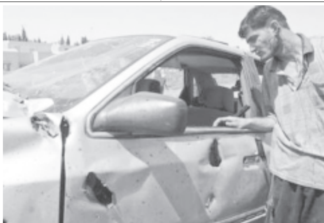
A wounded Iraqi man views the damage to his car following a roadside bomb attack in the northern city of Mosul, on 21 Aug, 2004. At least two members of the Iraqi National Guard force were injured along with three other civilians when a roadside bomb went off as their convoy was driving past on a highway in Mosul, 390 km north of Baghdad.