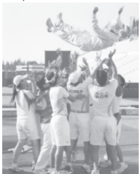
South Korea's archery team toss their coach into the air after a gold medal win in the men's team archery competition at the Athens 2004 Olympic Games, on 21 August, 2004. Defending champions South Korea won the Olympic gold medal after comfortably beating Taiwan in the final, giving their country three of the four archery titles.

Ukraine took the bronze medal after beating the United States 237-235 in the third place match. Taiwan's silver medal was only their country's second medal of the Games and followed the bronze won by their women's team on Friday.