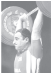
Georgia's George Asanidze competes during the men's 85 kg weightlifting competition of the Olympic Games at Nikaia Olympic Weightlifting Hall in Athens. Asanidze won the gold medal.