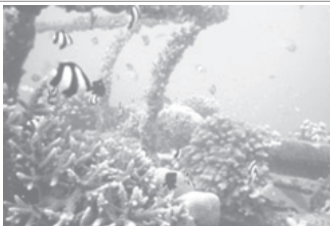
Tropical fish swim around the coral formations on the artificial reef project, in Pemuteran, on the island of Bali, Indonesia. — INTERNET

He added that increased stress, drug abuse and alcoholism among Ugandans have been blamed for an increased rate of mental illnesses across the country. — MNA/Xinhua