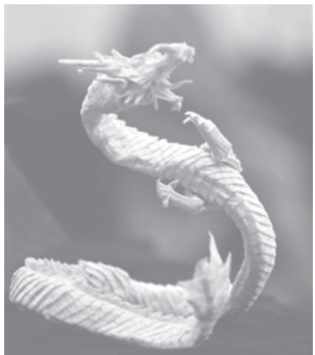
A work of origami, or paper folding, is shown on display during the origami convention in Tokyo, on 20 Aug, 2004. Showcasing a renaissance in the ancient Japanese art of origami, some of the best paper-folders in the world descended on Tokyo on Friday for a three-day competition and convention to celebrate the artistic possibilities of origami, which is believed to have been used to create sacred ornaments at the Grand Shrines of Ise, the centre of Japan's native shinto religion.

The United States accuses Iran of supporting terrorism and seeking nuclear weapons, while Iran terms the United States as the enemy of all Islamic countries. As on the nuclear issue, Iran says its nuclear activity is solely for peaceful purposes, but the United States alleges Iran may also be in pursuit of nuclear weapons. — MNA/Xinhua