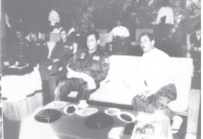
Lt-Gen Tin Aye views merchants purchase of gems and jade by merchants at 17th Gem and Jade Sales of UMEHL.— MNA