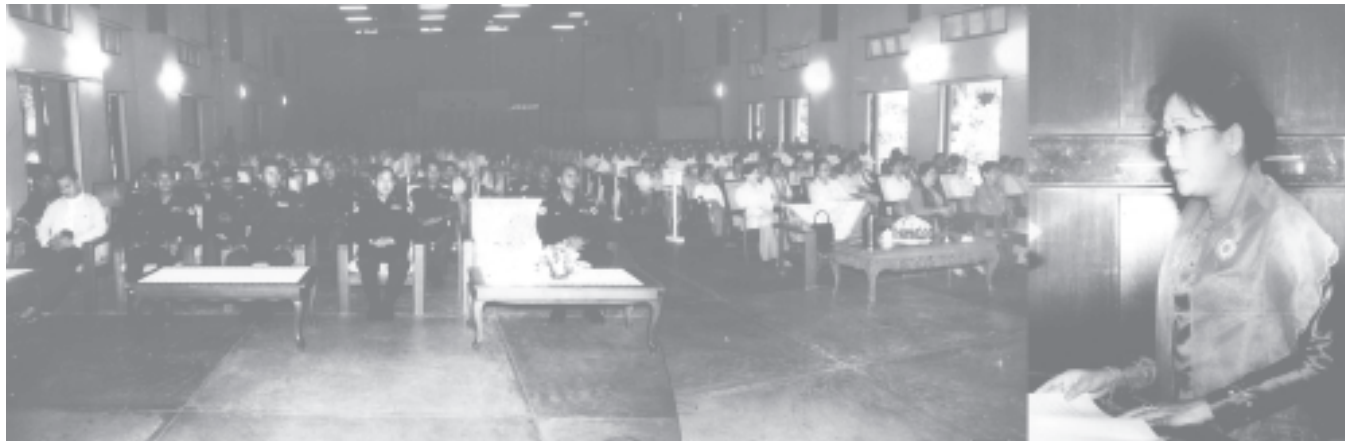
Yangon Division SC MCWA Patron Daw Khin Thet Htay speaking at closing ceremony of Youth Educative Training Camp 8/2004.—MNA