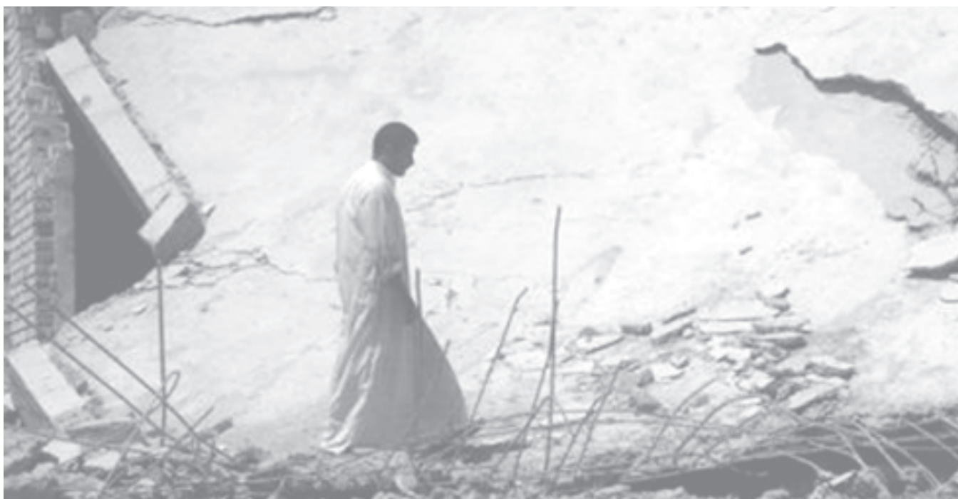
An Iraqi man walks among houses damaged during air strikes by US planes in the turbulent city of Fallujah, Iraq, on 12 August, 2004.