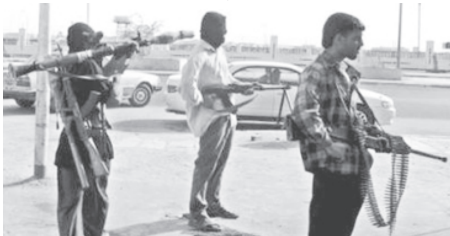
Armed Iraqi militiamen, loyal to radical Shiite cleric Moqtada al-Sadr, stand guard in a street in the southern city of Basra on 18 August, 2004.