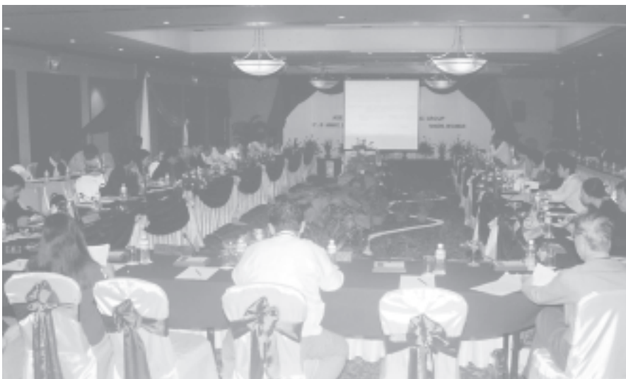
The third meeting of ASEAN CITES experts in progress.