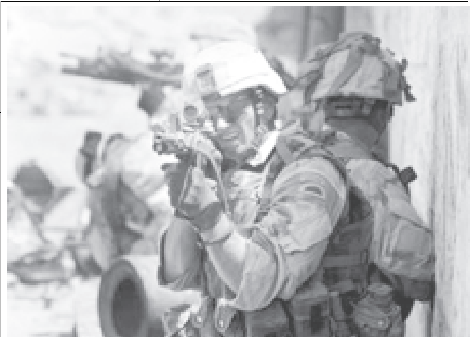
US Army soldiers take cover during a gun battle with guerilla snipers in Najaf, Iraq, on 18 Aug, 2004.

The company currently operates in Brazil, China, the Philippines, Thailand, Bangladesh and Singapore while in Africa, it has only been in Angola and currently prospecting Uganda and Zambia.—MNA/Xinhua