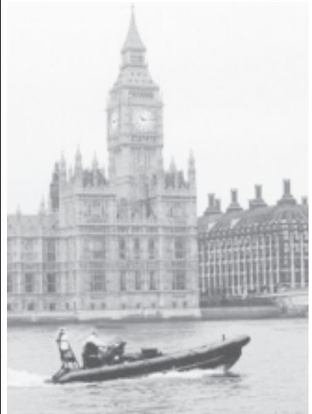
The River Thames, which bisects the centre of London, is said by some to be among the world's cleaner urban waterways, but that claim to fame is undermined by frequent spillage from the capital's sewage system. — INTERNET