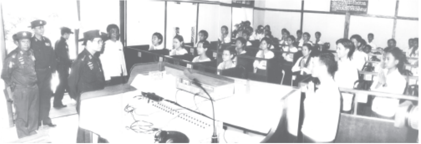
Myanmar Education Committee Chairman Prime Minister General Khin Nyunt inspects multimedia classrooms of Minhla High School on 13 August 2004.