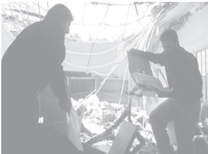
Residents look for documents in a building after it was bombed by US warplanes in Samarra, Iraq, on 14 August, 2004.