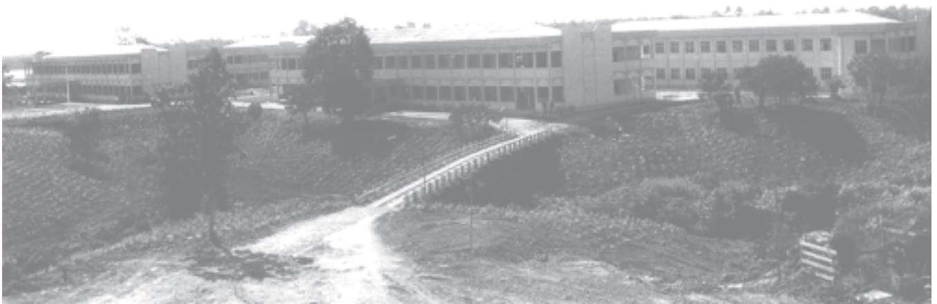
Bhamo Degree College in Kachin State. —MNA