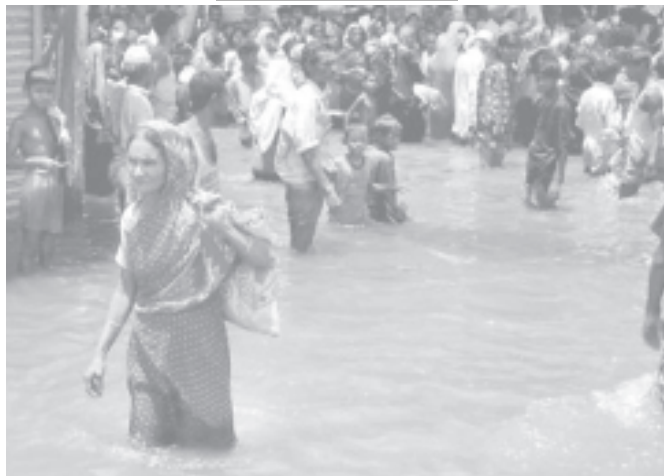
The United Nations Development Programme is considering building floating homes in Bangladesh following the worst flooding in years to strike this low-lying south Asian country.