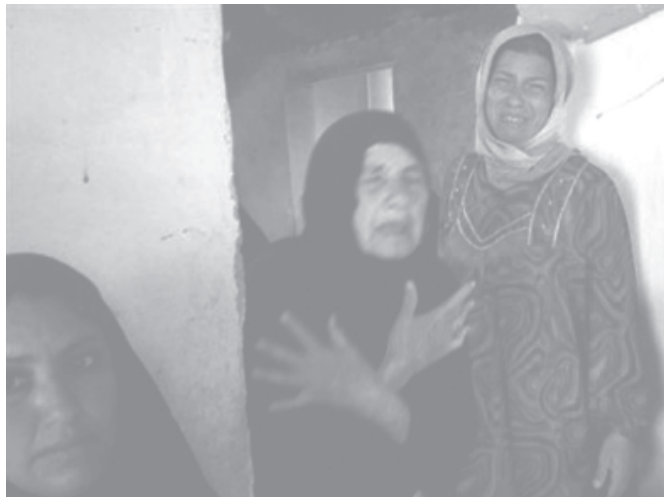
Women mourn for their relatives who were killed when a mortar shell struck their house in the town of Baqouba, Iraq, on 16 August, 2004.