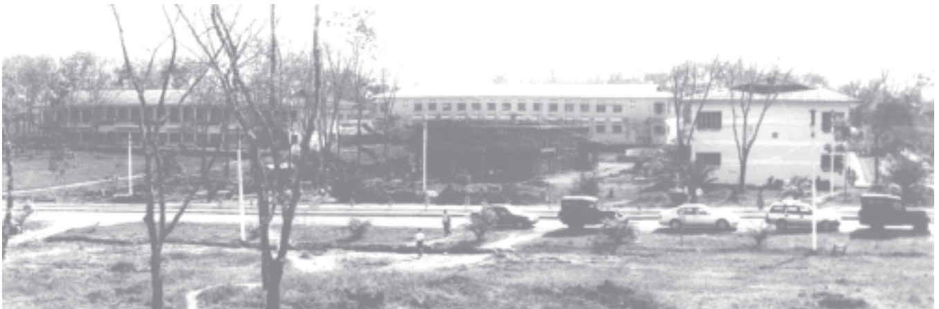
Buildings on Myeik University campus in Taninthayi Division.

To produce qualified intellectuals and intelligentsia