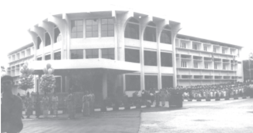
The three-storey library of Mawlamyine University in Mon State.

To produce qualified intellectuals and intelligentsia