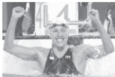
Ukraine's Yana Klochkova raises her arms in victory after winning the gold medal in the women's 200 metres individual medley at the Athens 2004 Olympic Games, on 17 August, 2004.