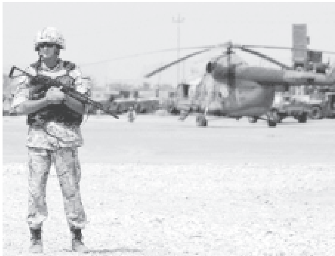
A Polish soldier stands guard near a helicopter in Camp Lima, some 100kms south of Baghdad. — INTERNET

Analysts forecast that the CPI will increase in August in line with surging oil prices which hit record highs last week.—MNA/Xinhua