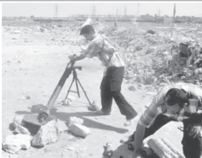
Mahdi army fighters loyal to radical Shiite cleric Moqtada al-Sadr prepare to launch a mortar attack as violence continues in the Sadr stronghold of Sadr city neighbourhood in Baghdad, on 18 Aug, 2004.