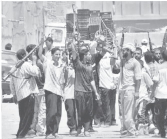
Mahdi army fighters loyal to radical Shiite cleric Moqtada al-Sadr hoist their weapons as violence continues in the al-Sadr stronghold of Sadr city neighbourhood in Baghdad, on 18 Aug, 2004. — INTERNET

Basra, where Britain has more than 9,000 troops, has been the scene of sporadic clashes between Iraqi militants and British forces over the past 12 days.—Internet