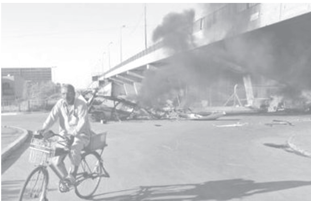
An Iraqi man rides his bicycle past a burning Iraqi army vehicle following an attack in central Baghdad on 15 August, 2004.