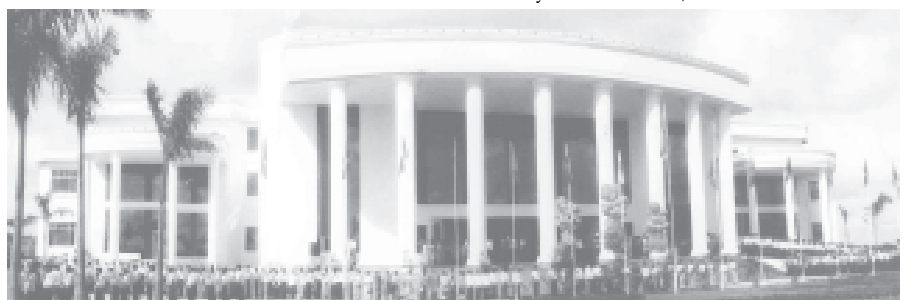
Maubin University in Ayeyawady Division.

Communication Technology (ICT)-based learning centres and resource centres have been opened from basic educational schools right up