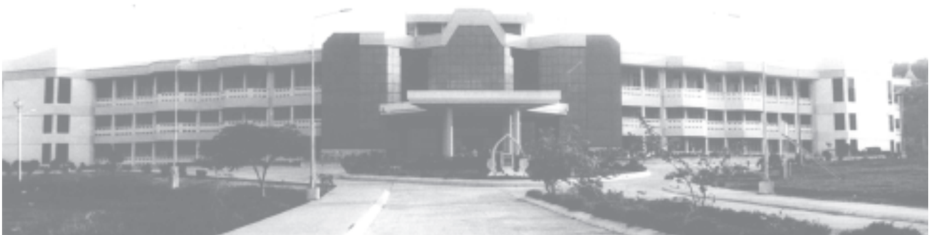
Kengtung Degree College in Shan State (East).