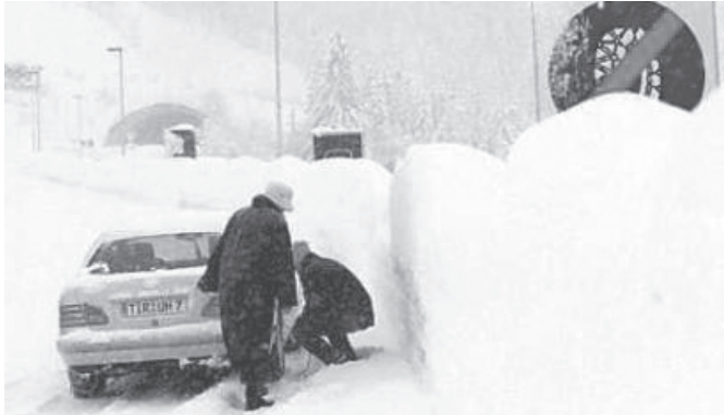
Europe is warming up more quickly than the rest of the world and cold winters could disappear almost entirely by 2080 as a result of global warming, researchers predicted on 18 August, 2004. Heat waves and floods are likely to become more frequent, threatening the elderly and infirm, and three quarters of the Swiss Alps' glaciers might melt down by 2050, the study prepared by the European Environment Agency (EEA) said. German holiday makers in this 8 Feb, 1999 file photo try to make their car snow safe after more than 1.70 metres of snow fell in parts of Austria's western Province of Tyrol.

ment of school facilities, and the enhancing of mathematics, science, English and values formation in basic education. Earlier, the Presidential Palace explained that Arroyo is eager to continue her interaction with the masses to feel their pulse on significant issues and enable her to respond quickly to people's complaints brought to her attention during the meeting with local masses. — MNA/Xinhua