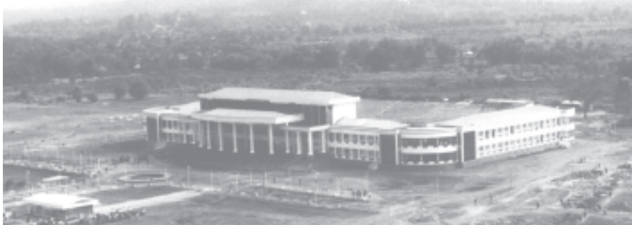
The Government Technical Institute in Mohnyin, Kachin State.

MICT Parks have been opened in Yangon and Mandalay cities. So, ICT-based services and modern communications networks are now accessible nationwide.