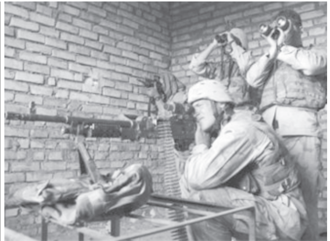
US Army soldiers fight from a fortified position in Najaf, Iraq, on 17 Aug, 2004. Sporadic but heavy fighting continued overnight, with US forces attacking from tanks, Bradley fighting vehicles, and fortified positions, and guerrillas returning fire with mortars and small arms.

His findings follow months of insistence by the White House and Pentagon that the abuse at Abu Ghraib was confined to a handful of junior reservists. So far only seven members of a military police unit from Maryland have been charged.