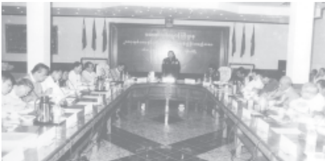
Construction Minister Maj-Gen Saw Tun delivers an address at 1st and 2nd four-monthly work coordination meeting for 2004. — CONSTRUCTION