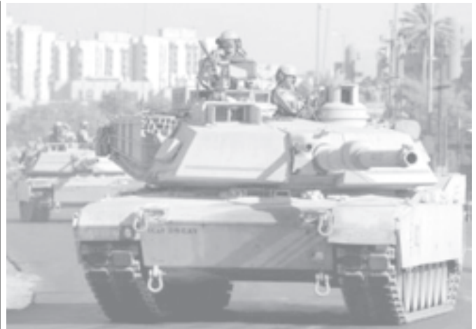
US Army tanks of the 1st Cavalry Division drive down a street during an operation in Baghdad, on 15 August, 2004. Guerillas fired mortars at a meeting where Iraqi leaders met to pick an interim national assembly on Sunday, killing at least two people.