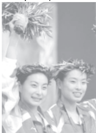
China's gold medallists Minxia Wu and Jingjing Guo celebrate during the medal ceremony following their victory in the women's synchronised three metres springboard final at the Athens 2004 Olympic Games on 14 August, 2004.

ATHENS, 16 Aug— China enjoyed a golden start to the Olympic diving competition on Saturday when they won both the women's three-metre springboard and the men's 10-metre platform synchronized events in style.