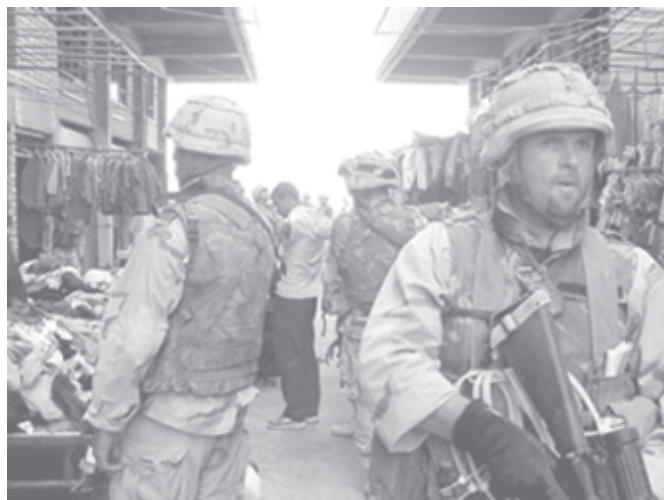
Dutch soldiers search for weapons in the used clothing market in the Iraqi town of Samawa, on 14 Aug, 2004.