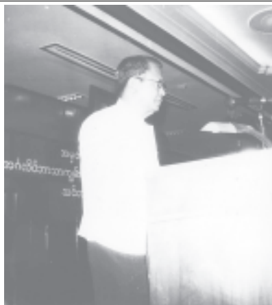
Industry-1 Minister U Aung Thaung delivers an address the English Proficiency Course No 2/2004 concluding ceremony.

Agriculture and Irrigation Minister Maj-Gen Nyunt Tin inspects Salingyi Reservoir construction site on 14-8-04. (News on page 1)— (A & I)