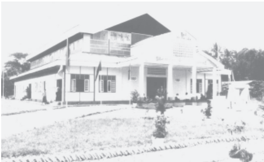
Kyaunggon in Ayeyawady Division gets a new gymnasium to produce fit and healthy youths.