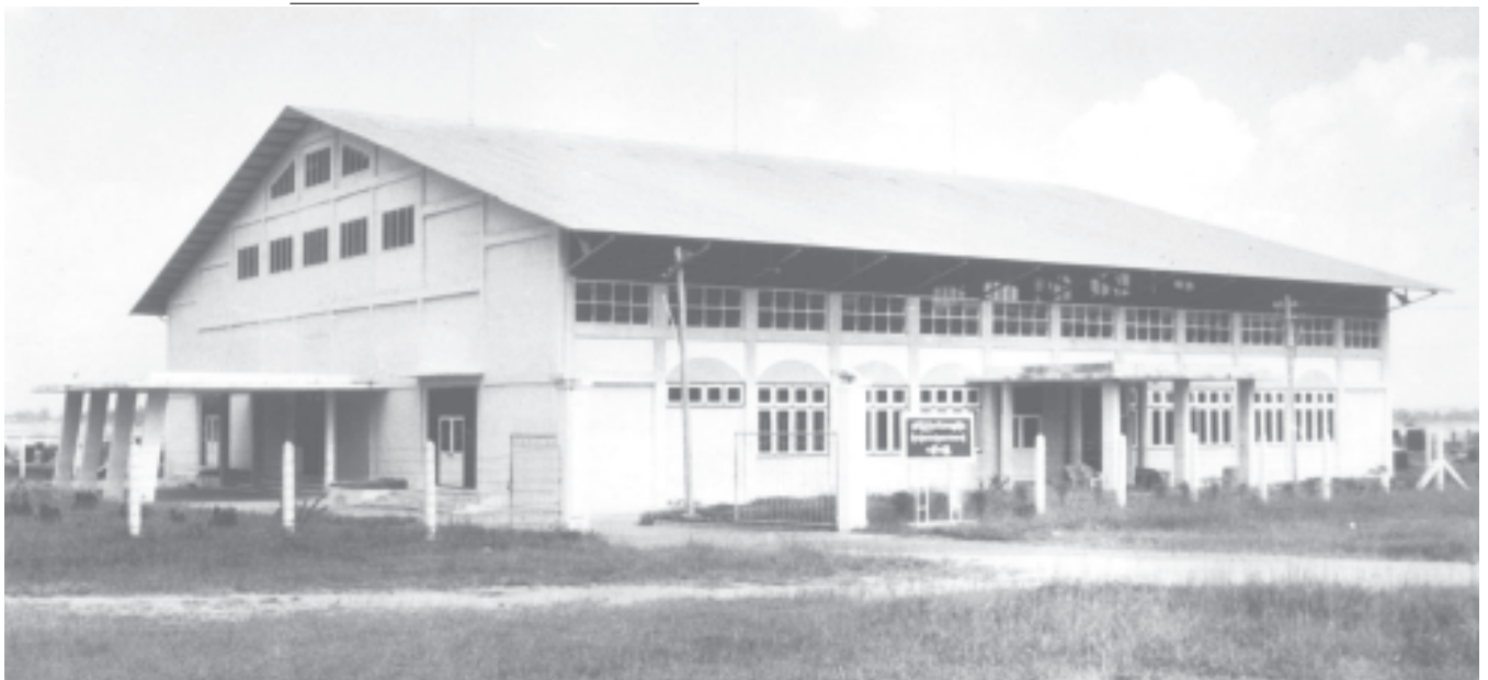
Youths in Kengtung of Shan State (East) are now able to undergo physical training at the newly built gymnasium.

Endeavours to uplift health and fitness of the entire nation