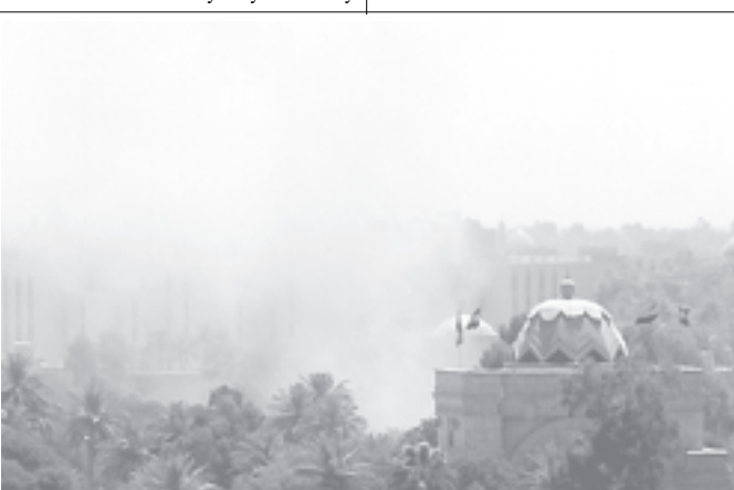
Smoke billows from inside the so-called Green Zone, where over 1,000 delegates are taking part in the Iraqi national conference on 15 August, after several mortars landed in the heavily fortified area in the centre of Baghdad.

မြန်မာ့စွေတာ၊ သိန်းပါးလေလွင့်၊ ထုတ်ကုန်မြင့်