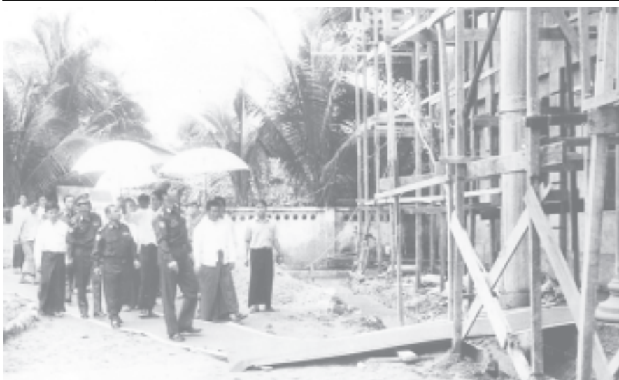
Minister for Finance and Revenue Maj-Gen Hla Tun and party inspect construction of Myanma Economic Bank building (Pazundaung Branch).

Next, the minister and party went to Pazundaung Bank Branch that is being constructed in Tamway Township. U Aung Than of Olympic Construction Co reported to the minister on construction tasks. Later, the minister left necessary instructions. — MNA