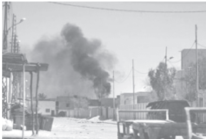
A plume of smoke rises over the skyline of the holy city of Najaf in southern Iraq on 15 Aug, 2004.