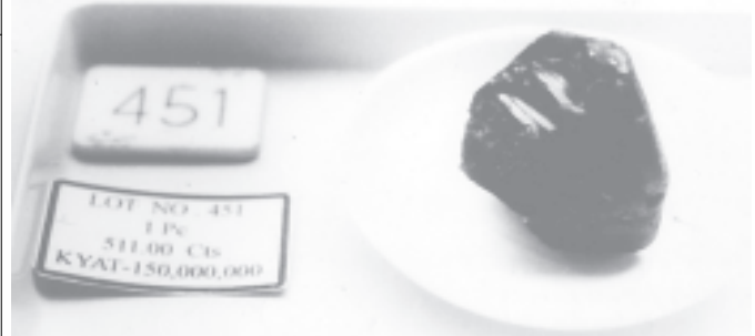
A 511-carat sapphire worth K 150 million displayed at the 17th gem and jade sale for 2004. — MNA

Altogether 164 jade lots and 323 gem lots were sold through tender system and competitive bidding at the gem and jade sale.—MNA