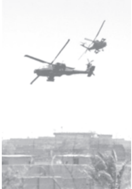
American helicopters fly over the holy city of Najaf, in southern Iraq on 15 Aug, 2004. — INTERNET

"We gave air support and carried out six different sorties during the day. Right now, it has stopped. We do it as and when needed," he added. Two civilians were also killed in clashes between Iraqi resistance fighters and a US patrol west of Fallujah.—Internet