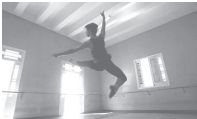
A member of the National Ballet of Cuba practices before a rehearsal of 'Cinderella,' on the top floor of a century-old mansion housing Alicia Alonso's company dance studio, in Havana, on 28 April, 2004. Cuba is turning out some of the world's finest ballet dancers hotly sought by leading international companies. Their blend of joyful Cuban sensuality and a superb classical training has stunned audiences and won them critical acclaim.