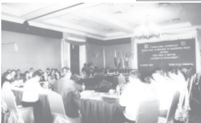
Third meeting of ASEAN-China Cooperative Operations in Response to Dangerous Drugs (ACCORD) in progress.