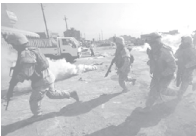
Soldiers with the US Army's 1st Cavalry Division, 1st Brigade, 1-12 Cav, from Fort Hood, Texas, run into a building during a codon and search in a neighbourhood outside of Sadr City in Baghdad on 15 Aug, 2004.