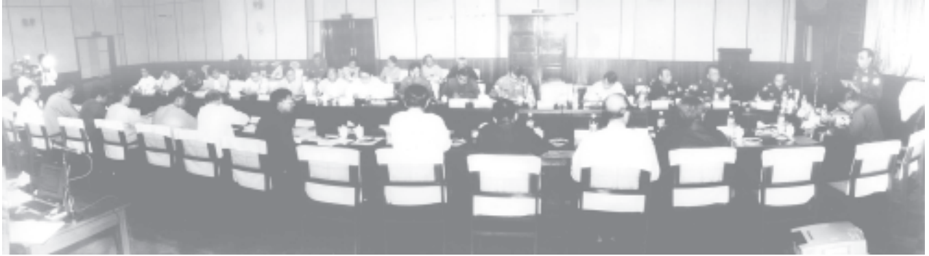
Minister for Culture Maj-Gen Kyi Aung delivers an address at the coordination meeting (2/2004) of organizing the People-to-people Exchange Programme: ASEAN Cultural Interaction at the Grassroots, Phase III, on 16-8-2004.