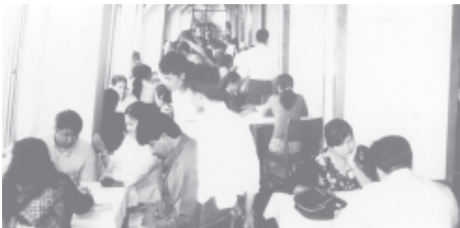
Gem merchants observe jade and gem lots at the 17th gem and jade sale for 2004.

of Ayeyawady Bridge (Magway) in Magway, current of Ayeyawady River, warning signs and a check point.