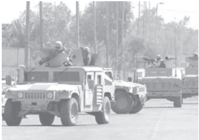
US troops deploy on the streets of the southern Iraq city of Najaf, on 15 August, 2004. Shiite militiamen battled US and Iraqi forces in Najaf on Sunday, resuming hostilities after Saturday's collapse of peace talks aimed at ending 10 days of fighting.

The latest casualties bring to 694 the number of US soldiers killed in Iraq since the beginning of the US-led invasion in March last year.