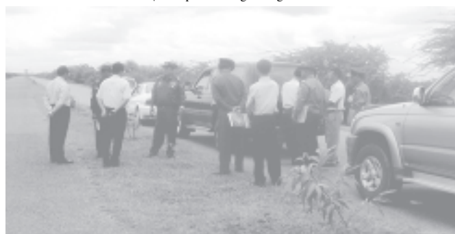
Minister for Transport Maj-Gen Hla Myint Swe inspects cultivation of shady plants along the road to Mandalay International Airport. — TRANSPORT