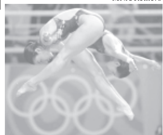
China's Minxia Wu (left) and Jingjing Guo perform one of their gold medal dives during the Womens 3m synchro springboard at the 2004 Summer Olympic Games in Athens, Greece, on Saturday, 14 Aug, 2004.

Guo Jinjing and Wu Minxia avenged their defeat by Yulia Pakhalina and Vera Ilyina in Sydney four years ago by beating the Russians into second place in the women's event.