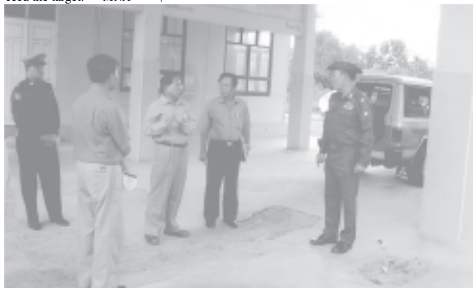
Minister for Energy Brig-Gen Lun Thi inspects the shop to sell compressed natural gas-CNG at Paleik, Singaing Township on 14 August. — ENERGY

Kyawzi river water pumping project was built to irrigate the farm lands northwest of Taungtha Township.