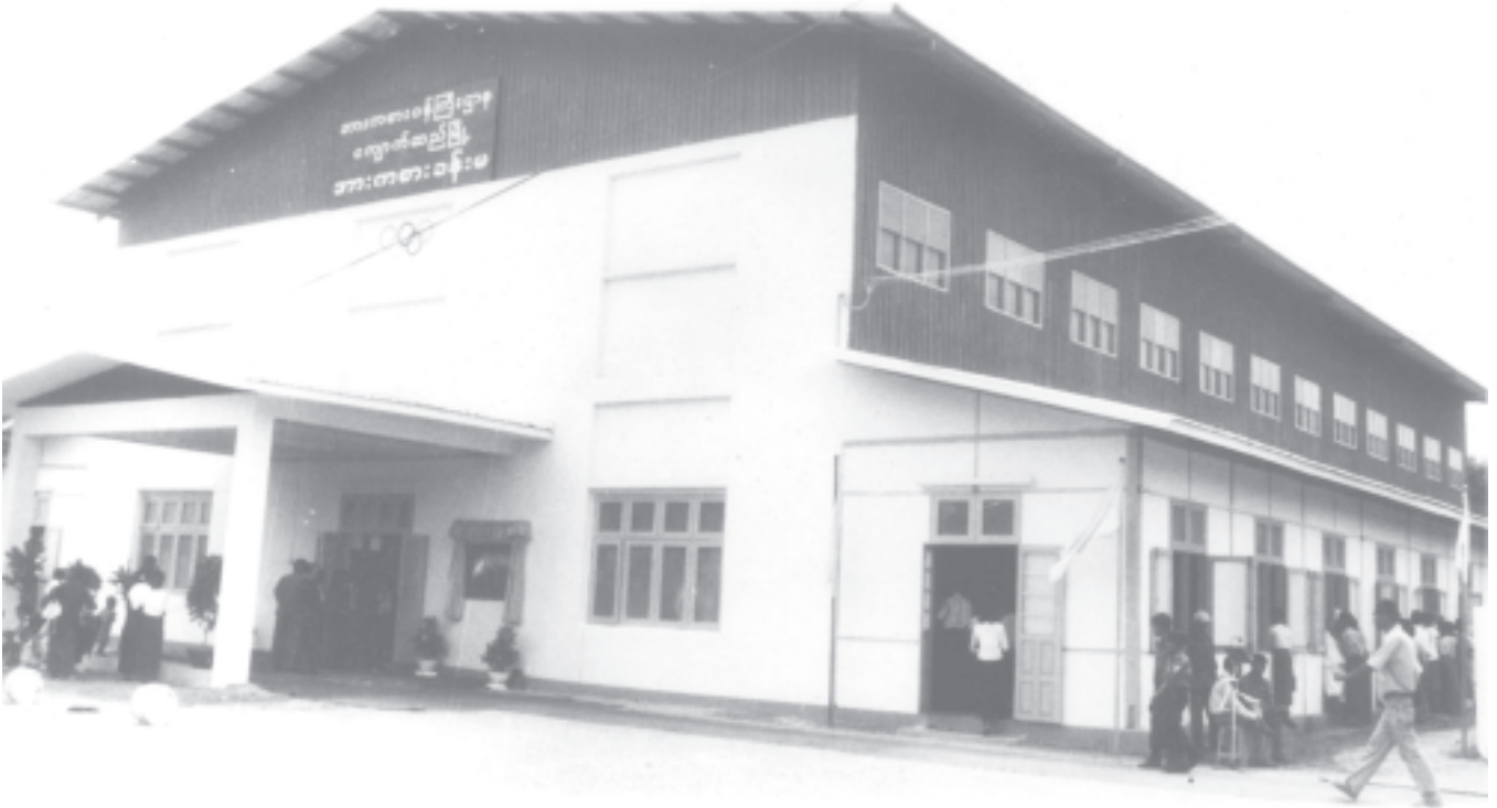
A gymnasium built in Kyaukse, Mandalay Division.—MNA