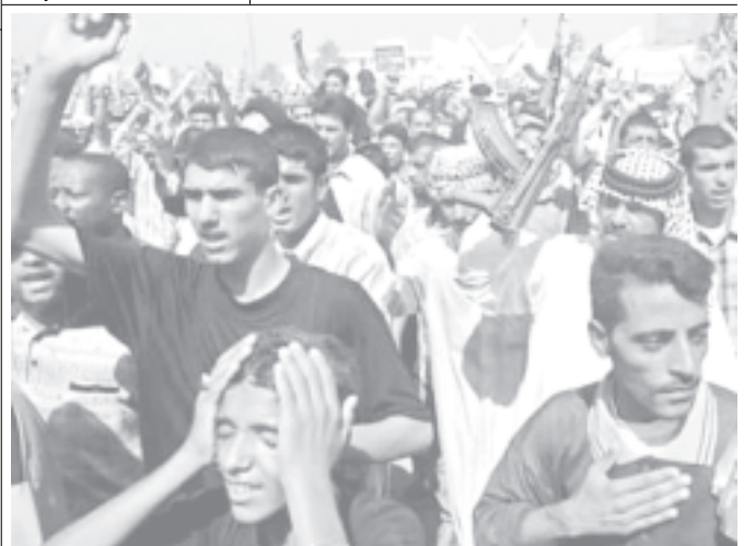
Iraqi Shiites take to the streets of the southern city of Basra to protest against ongoing conflict in Najaf on 12 August, 2004. US Marines backed by aircraft and tanks launched a major offensive to crush a Shiite militia resistance in Najaf, igniting mass street protests in at least two other cities.—INTERNET