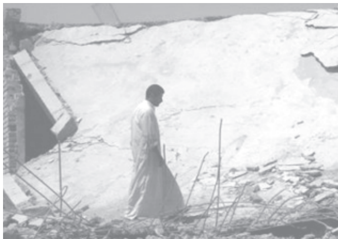
An Iraqi man walks among houses damaged during air strikes by American planes in the turbulent city of Fallujah, Iraq, on 12 Aug, 2004. The strikes killed four people and injured four others, hospital officials said.

He called on international organizations to “react without delay to the events in Najaf and stop the massacre of the defenceless people in Iraq.” —Internet