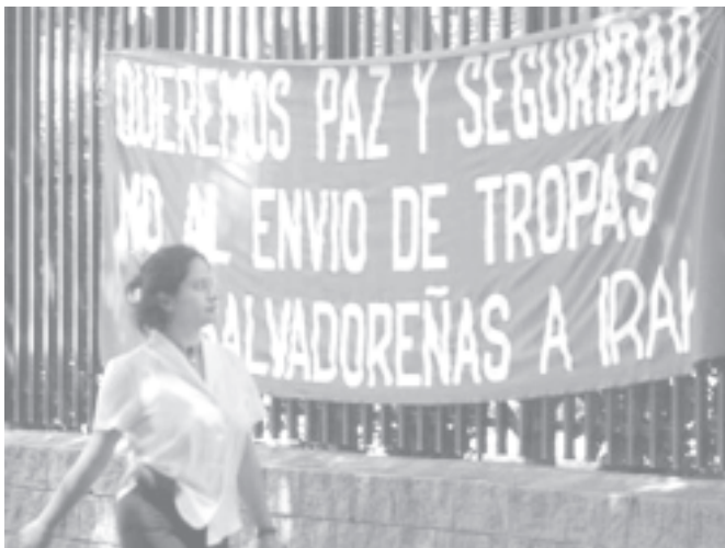
A woman walks past a banner that reads 'We want peace and security, not deployment of Salvadoran troops to Iraq, at the entrance of the Legislative Assembly in San Salvador, on 12 Aug, 2004.