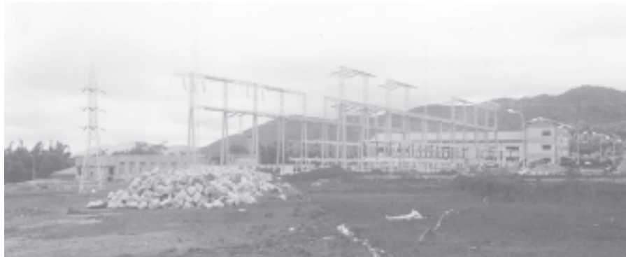
Construction of Tikyit Coal-Fired Power Plant Project in progress in Pinlaung Township.

The meeting focused on security issues, repair and maintenance of buildings, landscaping, systematic keeping of facilities for delegates, and construction of new buildings.