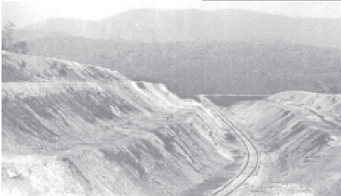
Pyinthaya-Htiri section of Hsaikkhaung-Namhsan Railroad runs through the mountainous region of southern Shan State.

Rail links strengthening friendship among national brethren and forging Union Spirit