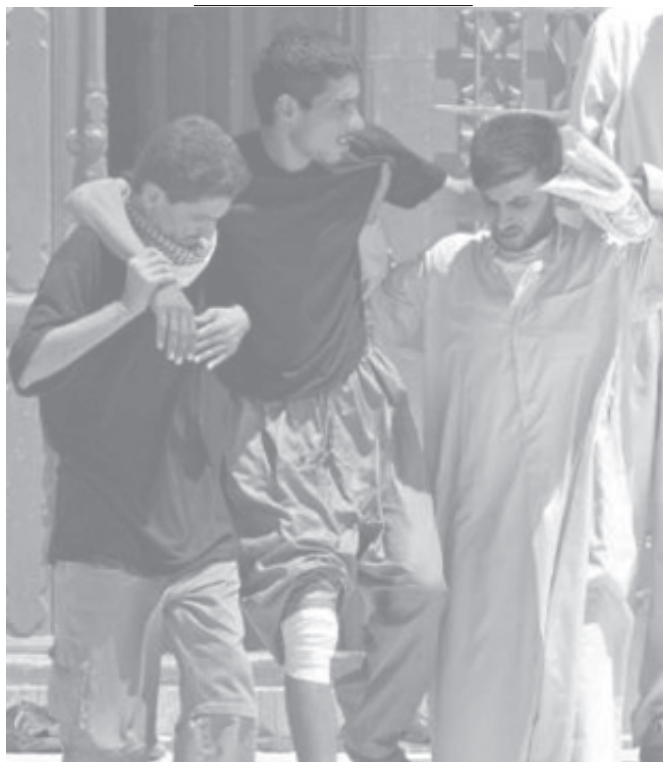
A wounded Iraqi man is helped in Najaf after US led troops raided the city on 12 August, 2004.