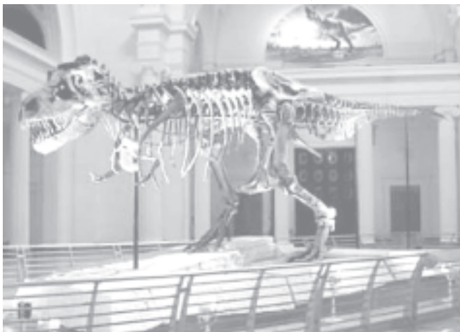
Thanks to the discovery in recent decades of more complete fossil skeletons of T Rex, such as the 67-million-year-old ‘Sue’ on display at the Field Museum in Chicago seen here, paleontologists have learned much more about how dinosaurs moved, lived and died. Tyrannosaurus Rex grew incredibly fast during a teenaged growth spurt that saw the dinosaur expand its bulk by six times, but the fearsome beasts ‘lived fast and died young,’ researchers said on 11 Aug, 2004.

T Rex had the fastest growth spurt of the largest dinosaurs. — MNA/Reuters