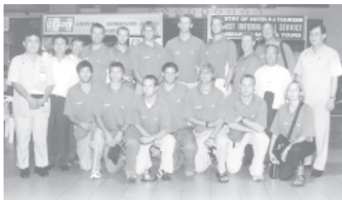
The Canadian volleyball team seen on arrival at Yangon Airport.

YANGON, 13 Aug — The Athletes in Action volleyball team of Canada will play goodwill matches with Myanmar Volleyball Federation selected team on 14 August and with MVF youth selected team on 16 August at National Gymnasium-1 in Thuwunna here. Admission is free. — MNA