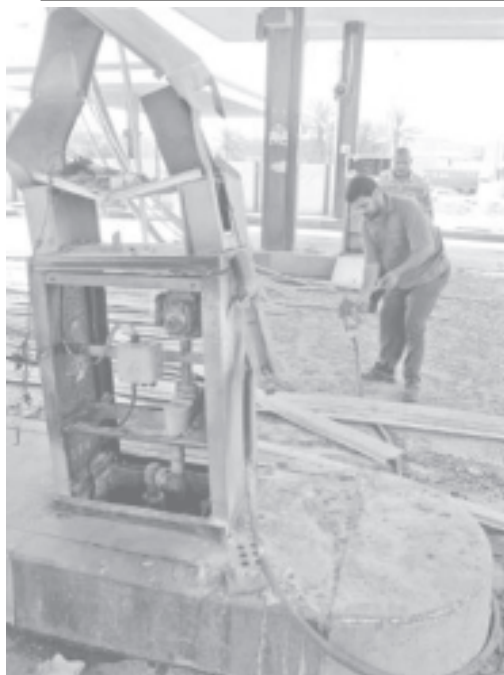
An Iraqi worker cleans the debris of a damaged gas station after it came under attack by mortar fire in Baghdad, on 9 August, 2004.