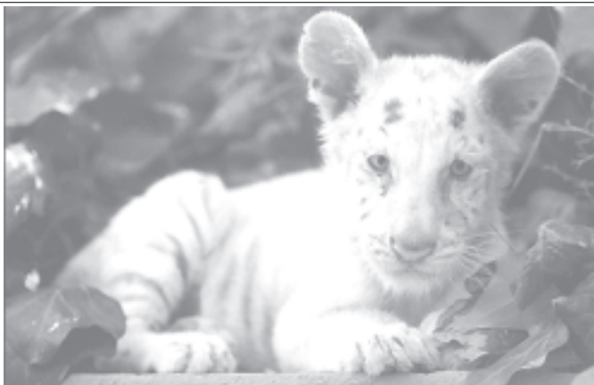
A white tiger with blue eyes and no stripes, one of only 20 worldwide, born in captivity is seen at a wild animal refuge in the southern Spanish town of Guadalest.