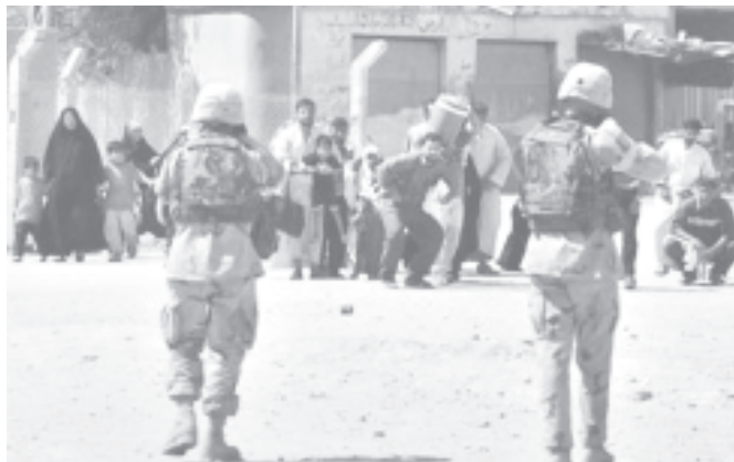
US soldiers aim their guns as Iraqi civilians flee their homes for safety during a day of heavy gun battles in Najaf in southern Iraq on 12 Aug, 2004.

Iran's claim that it has no intention of building nuclear arms was given a boost on Tuesday by reports that UN nuclear inspectors had traced highly enriched uranium particles found in Iran to equipment bought from Pakistan.—MNA/Reuters