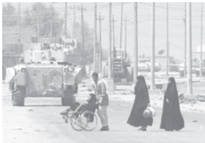
An Iraqi pushes a Shiite woman in a wheel chair past American armoured vehicles lining up on the streets, while civilians flee amid heavy gun battles resonating throughout Najaf in southern Iraq on 12 Aug, 2004. US forces launched a major offensive to crush a militia loyal to radical Shiite cleric Moqtada al-Sadr. The fighting between US forces and al-Sadr’s Mahdi Army militia began here a week ago and has spread to other Shiite areas of the country.

“We should have warned readers we had information that the basis for this was