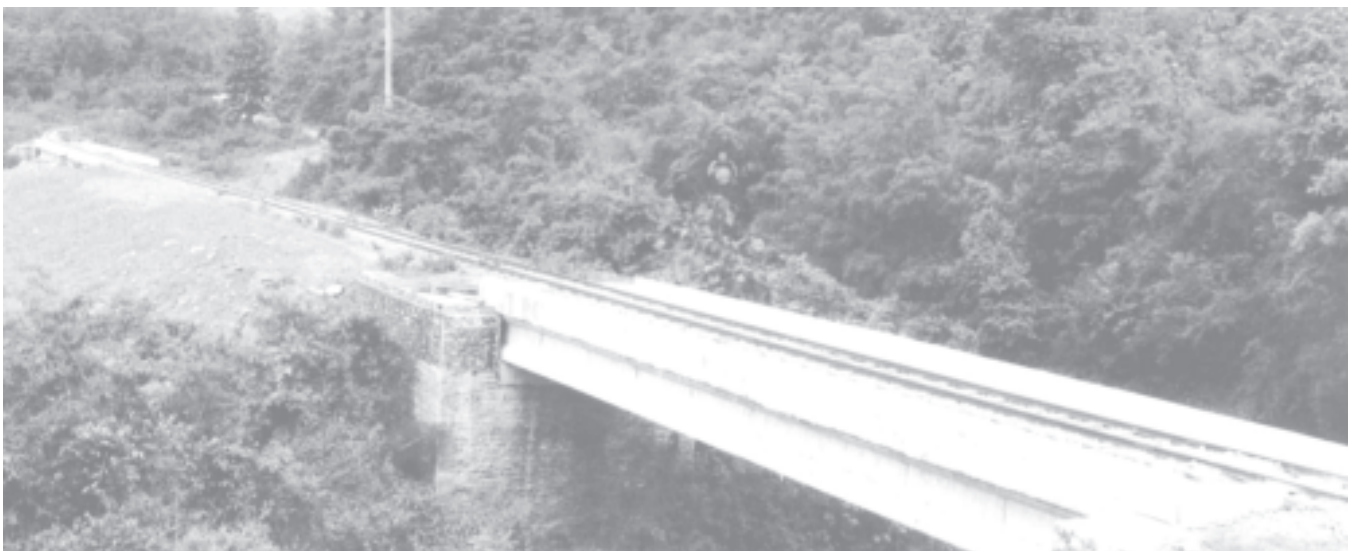
A railroad and a bridge built on Pakokku-Gangaw-Kalay railroad in Magway Division.

Rail links strengthening friendship among national brethren and forging Union Spirit