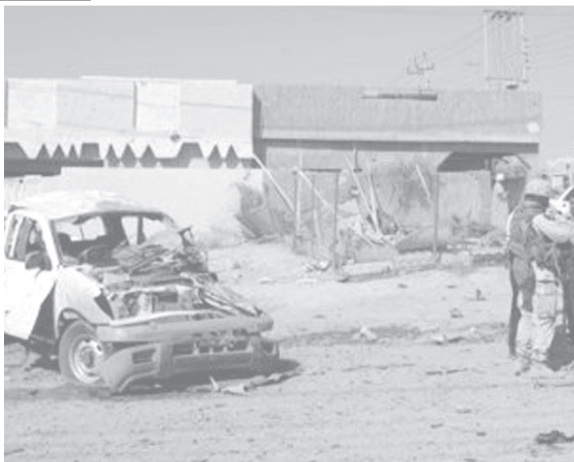
American soldiers stand guard next to the damaged vehicle left at the site of car bomb blast in Balad Ruz some 100 kms northeast of Baghdad, Iraq, on 9 August, 2004. The blast killed at least seven police officers in an apparent attempt to assassinate a deputy governor.