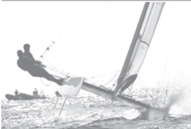
Unidentified athlete sail on their Tornado catamaran during a training session at the Agios Kosmas Sailing Centre two days before the opening of the 2004 Olympic Games in Athens.