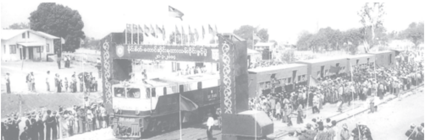
The inauguration of Mongseik-Kaunghsai section of Shwenyaung-Namhsan Rail Road in Shan State (South). — MNA