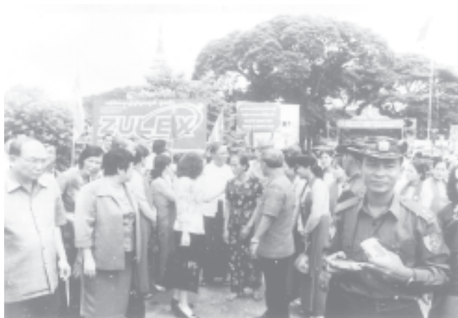
Officials from Myanmar and Thailand hand over 20 Myanmar young women who went to Thailand illegally for work, in Tachilek.