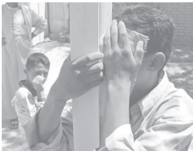
An Iraqi man grieves after losing his brother in a bomb explosion near Baquba, 40 miles north of Baghdad, on 11 August, 2004.