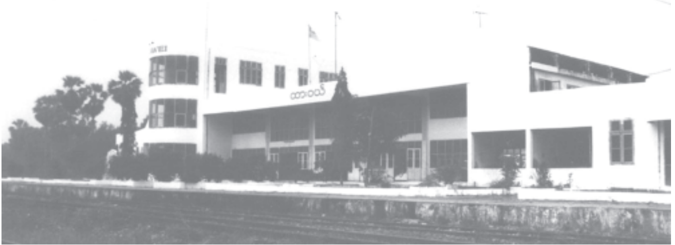
Dawei railway station in Taninthayi Division.