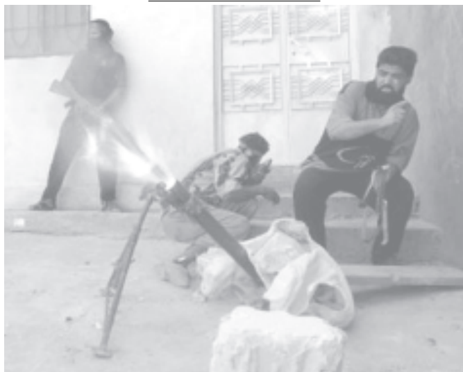
Guerrillas fire a mortar in the city of Najaf on 9 August, 2004.