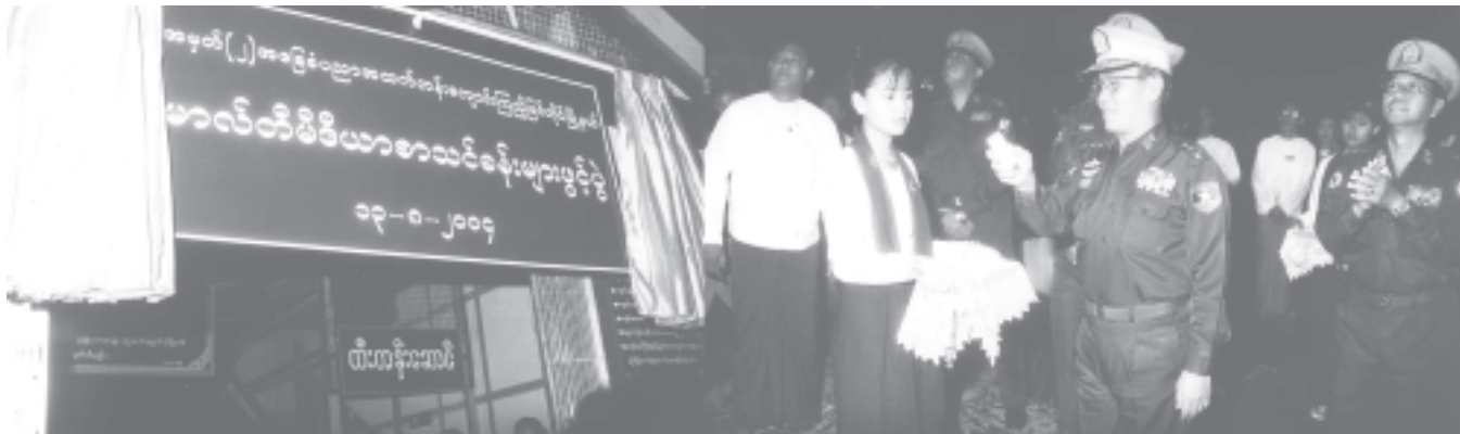
MEC Vice-Chairman SPDC Secretary-1 Lt-Gen Soe Win unveils signboard of the multimedia classrooms of Kyimyindine BEHS-2.