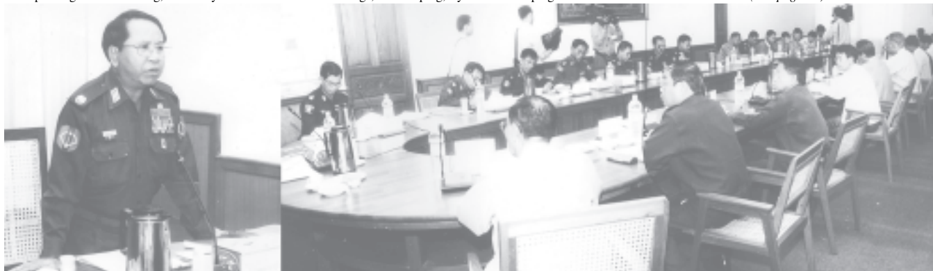
NCCC Secretary Minister for Information Brig-Gen Kyaw Hsan addresses preparations for National Convention during adjournment.