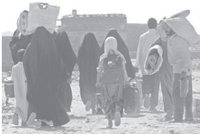
Iraqi civilians flee to a safe area after US led troops raided the city of Najaf on 12 August, 2004.