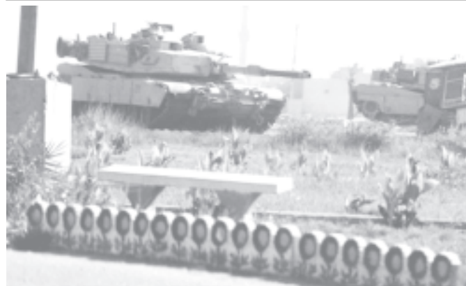
US tanks take position in Baghdad's Sadr City slum as fighting raged on between militiamen loyal to radical Iraqi Shiite Muslim cleric Moqtada Sadr and US forces on 11 Aug., 2004.