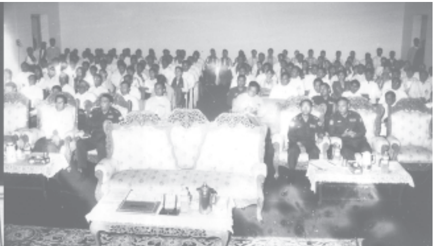
MEC Vice-Chairman Secretary-1 Lt-Gen Soe Win addresses opening ceremony of multimedia teaching centre at Kyimyindine BEHS No 2.— MNA

Emergence of the State Constitution is the duty of all citizens of Myanmar Naing-Ngan.