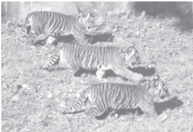
A trio of male Sumatran tiger cubs, recently born at the National Zoo, explore their habitat at the zoo in Washington, on Wednesday, 11 Aug, 2004. The three 14-week-old male cubs are, from top to bottom, Jalan, Besar, and Marah. The cubs are part of the Species Survival Plan, meaning they will be relocated to other zoos for breeding within the next three years. Sumatran tigers are an endangered species, with only 500 found in the wild on the Indonesian island of Sumatra and 200 in captivity.