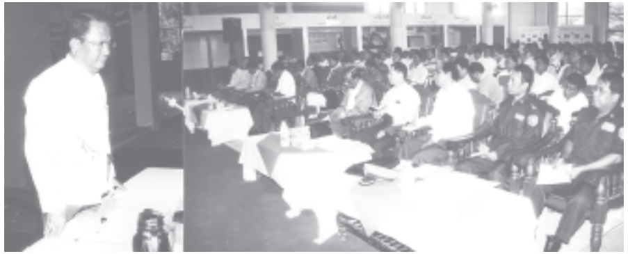
Minister U Aung Thaung delivers an address in meeting with industrialists in Mandalay. — INDUSTRY-1

Afterwards, the minister viewed tasks of private factories. Later, the minister inspected the site for building Win Thuza Shop in the compound of Leather Factory in the township. — MNA