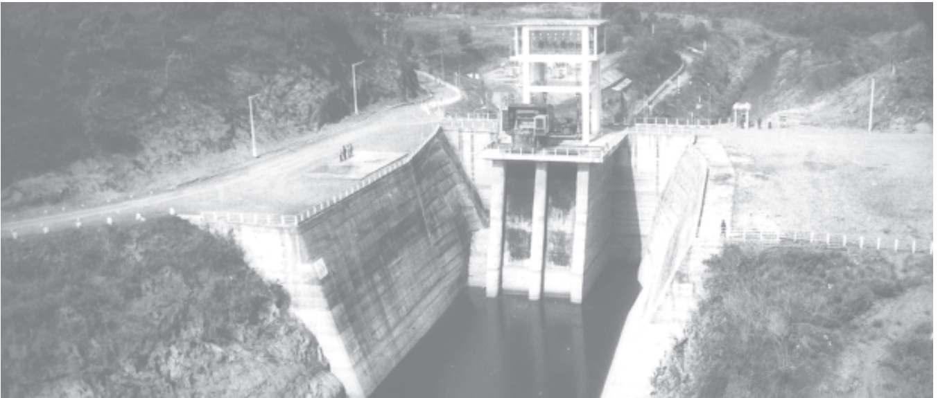
Zawgyi Hydroelectric Power Plant in Yaksawk Township, Shan State.