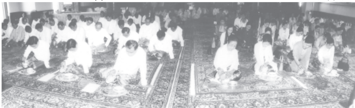
Senior General Than Shwe, wife Daw Kyaing Kyaing and Tatmadaw families share merits for offering of Waso robes to Sayadaws at Five Nikaya Pitakat Thonbon Monastery.

A historical milestone leading the nation to a new age—7 (Page 10)