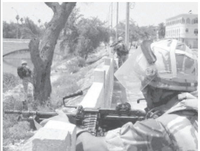
British soldiers take position during clashes in Basra on 5 Aug, 2004.