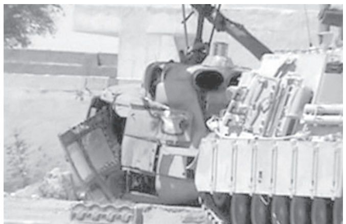
A US Marine helicopter is grounded in Najaf after being shot down during fighting in the southern Iraqi city in this image taken from TV on 5 Aug, 2004.