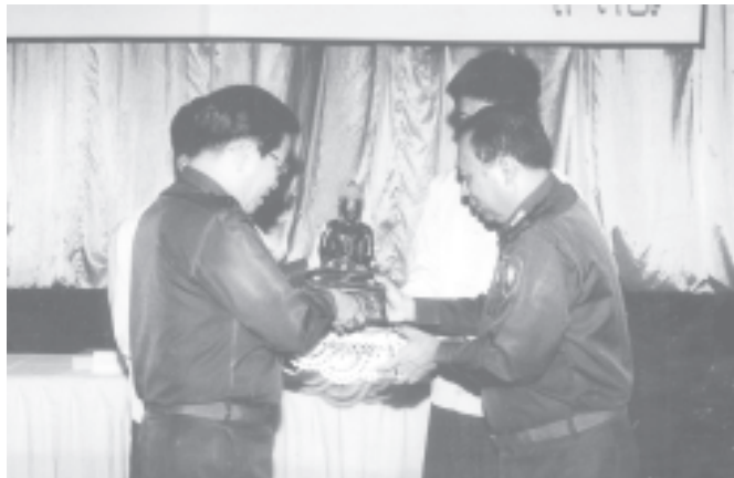
Prime Minister General Khin Nyunt hands over an ancient Buddha image to Minister for Culture Maj-Gen Kyi Aung.