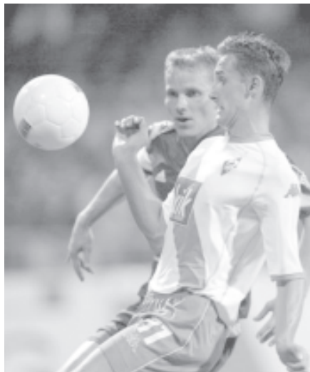
Schalke's Tomasz Waldoch, left, from Poland, and Bremen's Miroslav Klose, right, go for the ball during the German Bundesliga soccer match in Bremen, Germany, between Werder Bremen and FC Schalke, on Friday, 6 Aug, 2004.

"Mutu is Chelsea's player for the next four years," Becali said.