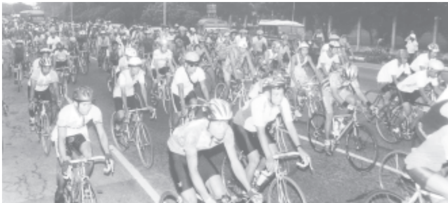
Cyclists with full enthusiasm take part in the race.