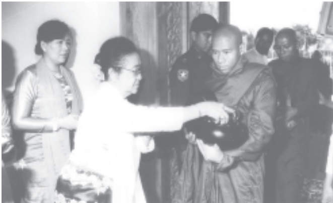
Daw Kyaing Kyaing, wife of Head of State Senior General Than Shwe presents offertories to a Sayadaw.

Head of State Senior General Than Shwe, wife Daw Kyaing Kyaing and party presented Eight requisites, alms and Waso robes to the Sayadaws and members of the Sangha.