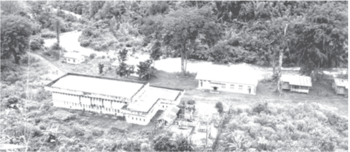
People living in Myitkyina, Kachin State, are now enjoying electricity supplied by Kyeinkharankha hydro power station which is generating 25 kilowatt.