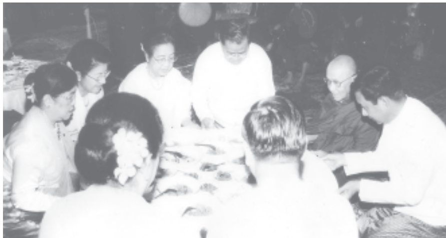
Senior General Than Shwe, wife Daw Kyaing Kyaing and party offer 'soon' to a Sayadaw.