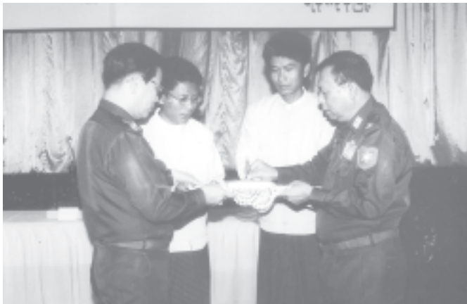
Prime Minister General Khin Nyunt hands over an ancient Buddha image to Minister for Culture Maj-Gen Kyi Aung.