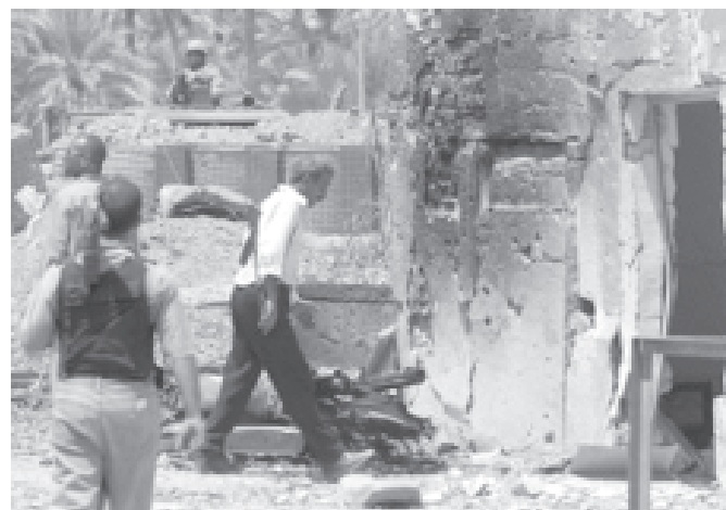
A US soldier stands guard as Iraqi policemen inspect the site of a suicide car bomb outside a police station in the town of Mahawil, 95km south of Baghdad recently.