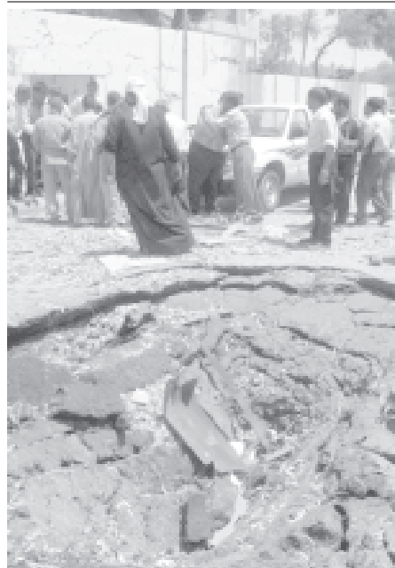
Iraqi policemen gather at the site of a suicide car bomb outside a police station in the town of Mahawil, 95km south of Baghdad recently. At least 16 people were killed and a US helicopter was shot down in the fiercest fighting between multinational troops and Shiite Muslim militiamen in Iraq since a truce was brokered in June.