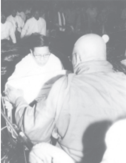
Prime Minister General Khin Nyunt presents offertories to Sagaing Sitagu Sayadaw.