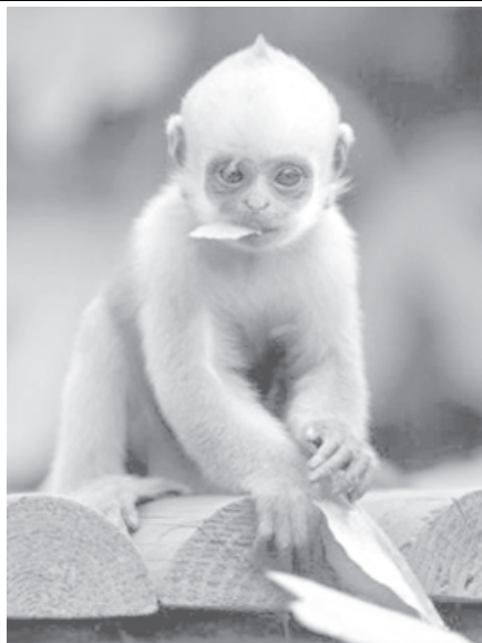
PLaa Laa, a rare baby Francois' Langur monkey born on 6 July, gazes at the public from its enclosure at London Zoo on 5 Aug, 2004.