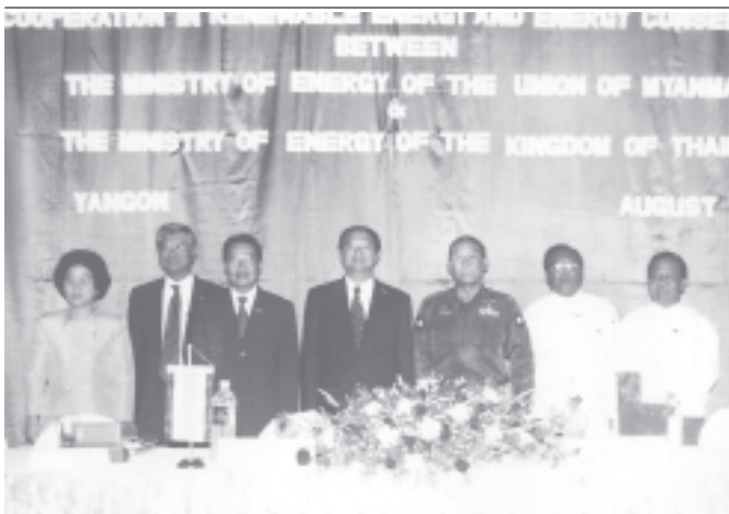
Minister for Energy Brig-Gen Lun Thi and Thai guests at the energal contract signing ceremony.— ENERGY

In the presence of Myanmar Energy Minister Brig-Gen Lun Thi and Thai Energy Minister Mr Prommin Lertsuridej, officials sign production sharing contracts for oil and natural gas exploitation and MoU on cooperation in renewable energy and energy saving sectors.