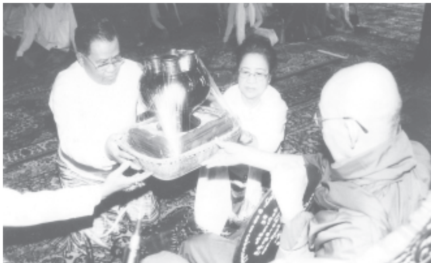
Senior General Than Shwe and wife Daw Kyaing Kyaing offer eight requisites and Waso robes to a Sayadaw.