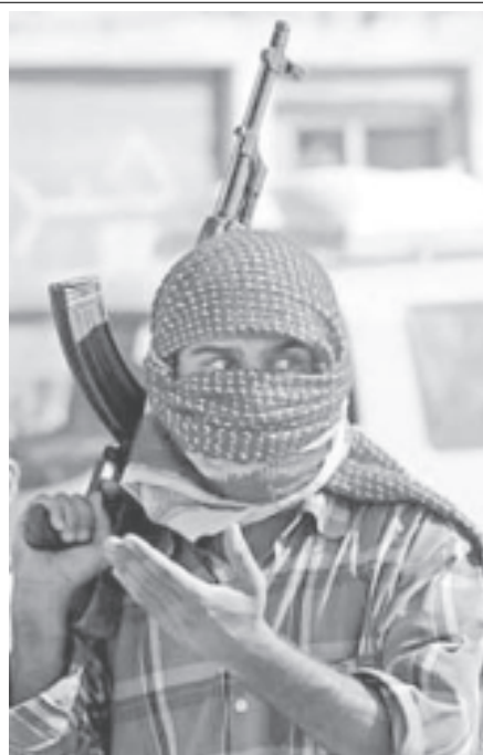
An armed Iraqi Shi'ite militiaman, follower of the radical cleric Moqtada al-Sadr, mans a checkpoint in the eastern Baghdad suburb of Al Sadr city on 6 Aug, 2004.