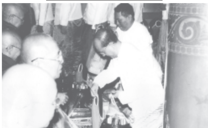
Secretary-2 Lt-Gen Thein Sein presents offertories to a Sayadaw.