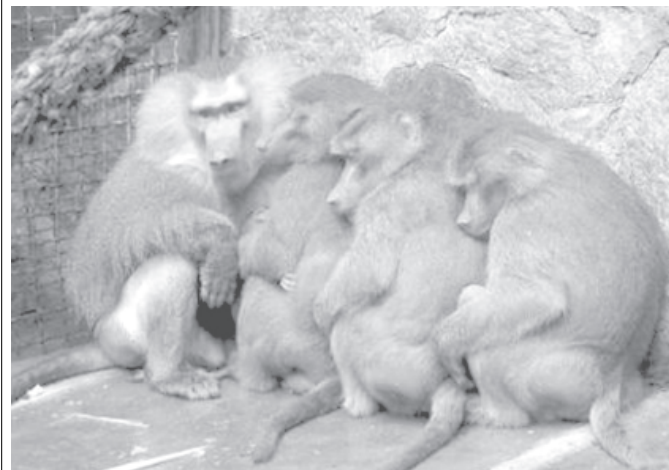
Baboons warm up as they shelter in their cage in drizzling rain at a private zoo near the Black sea resort of Yalta, on 5 Aug, 2004. After weeks of hot muggy days in most regions of Ukraine temperatures fell to some 20 degrees Celsius. — INTERNET

J.J., he said, "is doing really well. It is certainly going to improve his life expectancy". It may help the owners, too. — MNA/Reuters