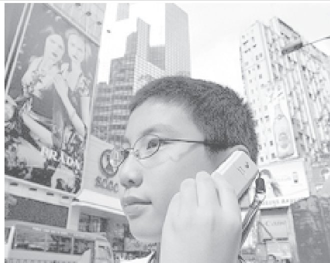
A 13 years old boy displays his mobile phone in Hong Kong. A survey showed that mobile phone ownership among children in Hong Kong is the highest as compared to 12 other countries in Asia.—INTERNET