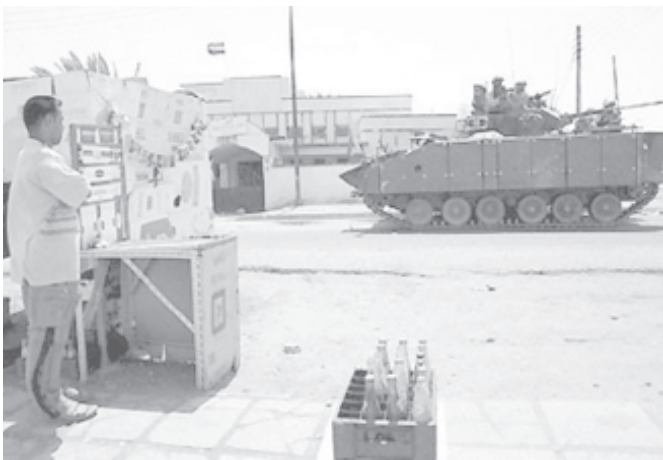
A vendor watches British troops securing the main avenue leading to radical Shiite cleric Moqtada Sadr's office in Basra, southern Iraq on 5 Aug, 2004.