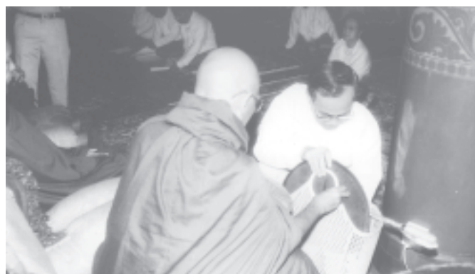
Secretary-1 Lt-Gen Soe Win presents offertories to a Sayadaw.

Yangon Mayor and senior military officers and their wives, the Director-General of the State Peace and Development Council Office, departmental heads and families of Defence Services (Army, Navy and