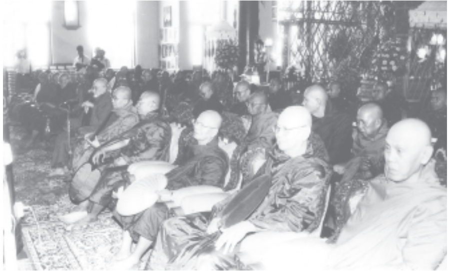
Sayadaws and members of the Sangha seen at the Waso robes offering ceremony.