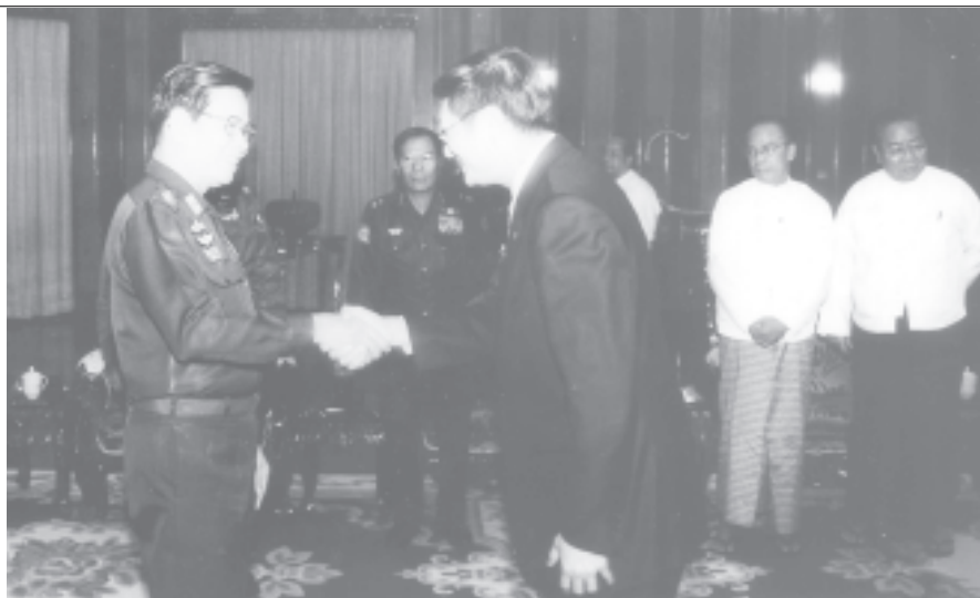
Prime Minister General Khin Nyunt receives Minister of Energy Mr Prommin Lertsuridej of Thailand at Zeyathiri Beikman.