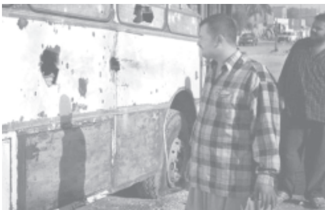
An Iraqi man looks at a damaged bus in the city of Najaf in southern Iraq, on 3 August, 2004.