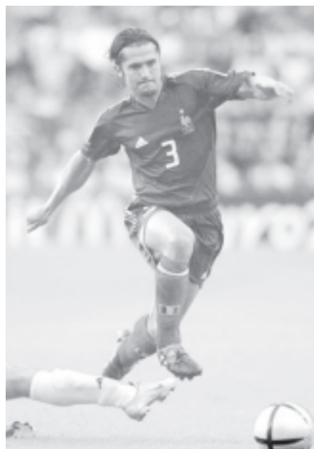
Bixente Lizarazu of France evades a tackle during the Euro 2004 quarterfinal soccer match between France and Greece at the Jose Alvalade Stadium in Lisbon, Portugal, on 25 June, 2004. Lizarazu, 34, announced he was retiring from international soccer on Thursday, 5 Aug, 2004, saying it's time to let younger players make their mark in the national team with the 2006 World Cup on the horizon.

"It was a very interesting meeting but you mustn't draw any conclusions yet."