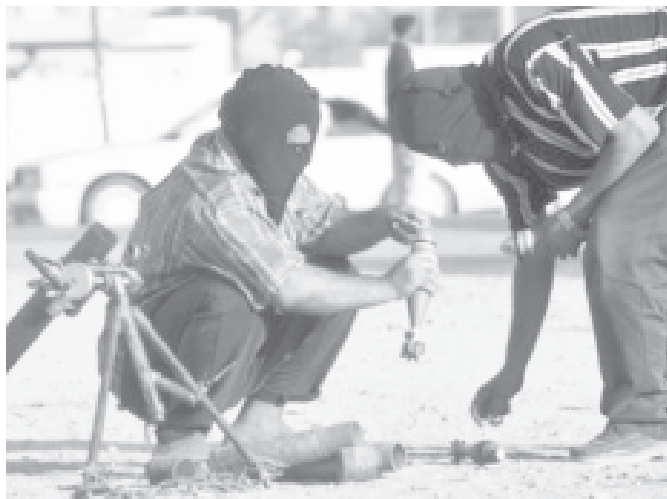
Al-Sadr's men fight with US troops in the Baghdad neighbourhood of Sadr City, Iraq, on 5 Aug, 2004. — INTERNET

"How did we get to the point where we have 130,000 troops in Iraq and 15,000 in Afghanistan?" — Internet