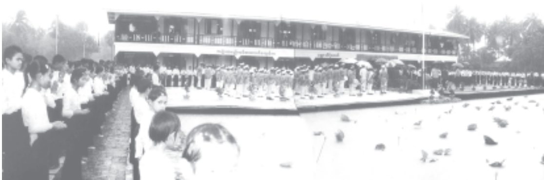
The opening ceremony of the new school building of Pyapon Township Basic Education High School No 2 in progress. — MNA

Speaking on the occasion, Lt-Gen Khin Maung Than said that the