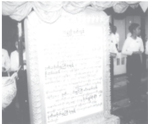
Lt-Gen Khin Maung Than formally unveils the stone inscription of the new school building of Pyapon BEHS-2. — MNA

They inspected thriving monsoon paddy in Bogale, Pyapon, Kyaiklat, Maubin and Nyaungdon townships by boat and arrived back here in the evening. — MNA