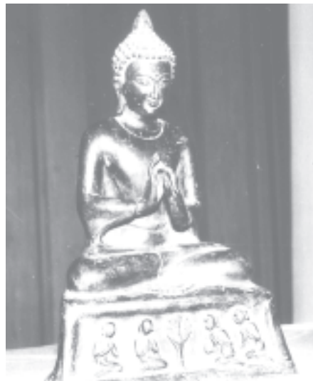
Bagan period style ancient bronze Buddha image cast in Konbaung period.— MNA

As a result, Pakokku District has been facilitated with 50-bed, 25-bed and 16-bed hospitals and station hospitals including the 200-bed hospital numbering 15. With respect to the education sphere, a splendid university is in the process of being built in Pakokku and so are Pakokku Government Computer College and Pakokku Government Technological College. Pakokku is a region in which cotton thrives, so the government is implementing Pakokku Textile Plant Project and it will be opened soon. Regarding the agricultural sector, it has built dams and water pumping