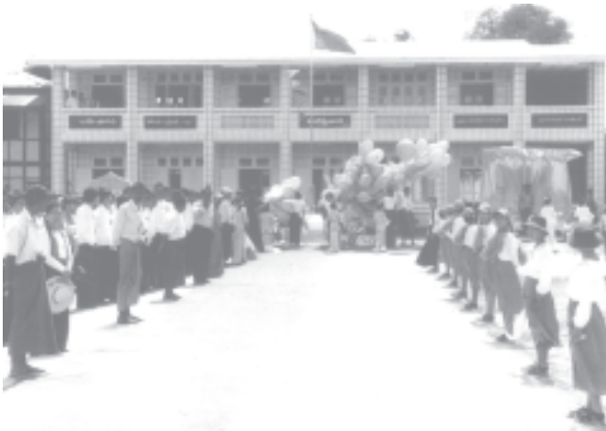
Sabaibyu building of Thayettan Basic Education Post Primary School in Madaya Township, Mandalay Division.