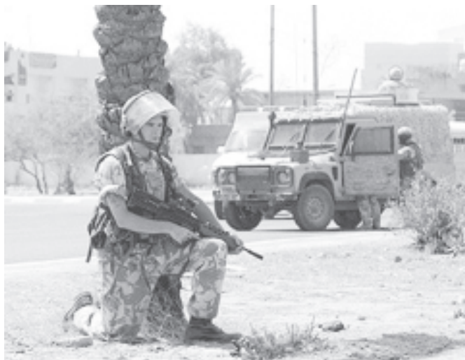
British troops secure the main avenue leading to Shiite cleric Moqtada Sadr's office in Basra, southern Iraq, on 5 Aug, 2004.