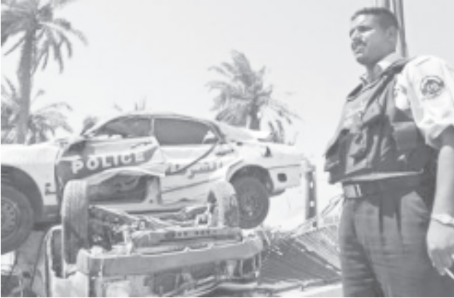
An Iraqi police officer stands guard near wreckage of police vehicles destroyed in a car bomb attack which targeted a police station in the town of Mahawil, south of Baghdad, on 5 Aug, 2004. Guerillas detonated a car bomb and sprayed gunfire at a police station in a town south of Baghdad on Thursday, killing at least six people and wounding 24 in the latest attack on Iraq's fledgling security forces. — INTERNET

"A UH-1 marine helicopter was shot down at about 11.45 am (0745 GMT)," a military spokesman said. The two crew members were recovered alive, although the extent of their injuries was not immediately known, he added.— Internet