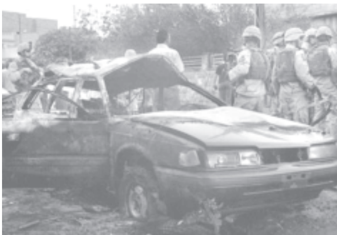
Car bombing in Mosul, Iraq, killed at least two people and injured about 60 on 1 August, 2004.