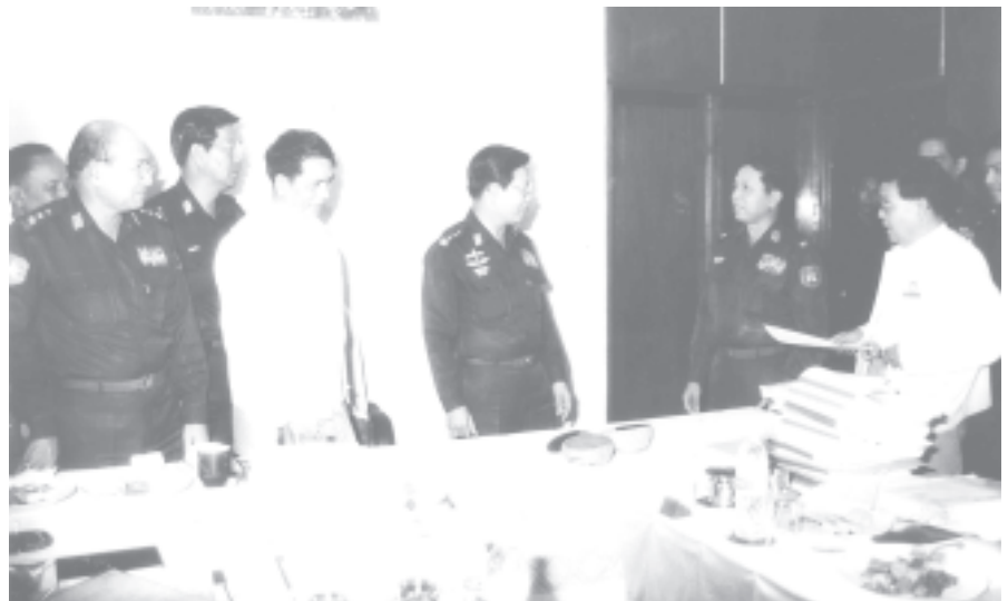
Prime Minister General Khin Nyunt views the rare stones of prime quality.

After the meeting, the Prime Minister presented two gem stones of significant quality to the State through Minister Brig-Gen Ohn Myint. An entrepreneur presented the two gem stones to the Prime Minister. Mined from Phakant gemland in Kachin State, the two precious stones are of prime quality. The gem stone contain a moving