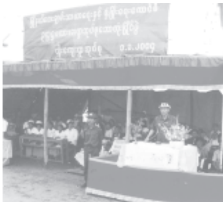
The opening ceremony of the beach football tournament for six delta regions of Toe River for the Dedaye Township Peace and Development Council Chairman's trophy in progress.

YANGON, 6 Aug — The beach football tournament for six delta regions of Toe River for the Dedaye Township Peace and Development Council Chairman's trophy was held at Toe village on 1 August. Local authorities, personnel of social organizations and students were present on the occasion. Hsu Club team and Tamar Takaw team played 2-2 draw. The local populace were interested in the beach football tournament which never took place there.