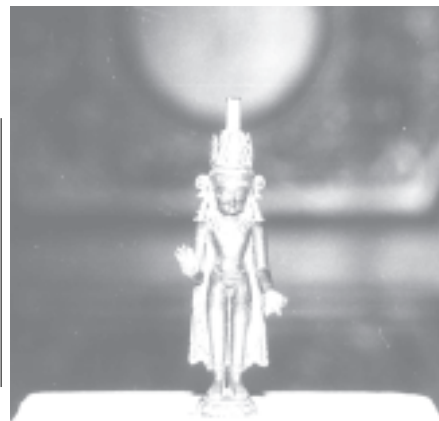
Ancient Pañcaloha Buddha image cast in the 11th AD of early Bagan period.