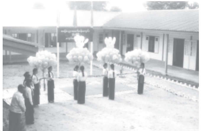
Thanks to the combined efforts of the government and the people, Mongkai in Shan State gets new school building for its Basic Education High School.