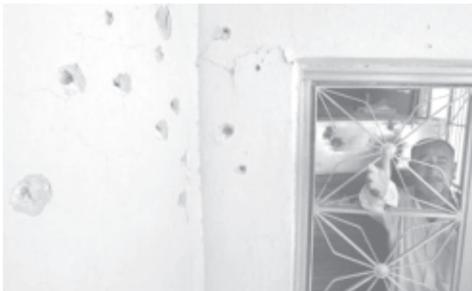
An Iraqi man gestures toward battle damage in the city of Najaf in Iraq, on 3 August, 2004.