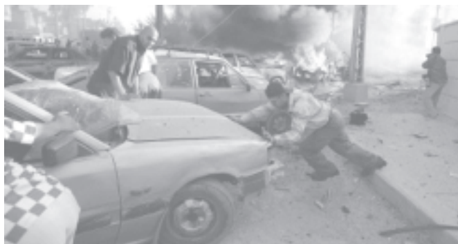
Iraqis push parked vehicle away from the site of two car bombs that exploded in Baghdad on 1 August, 2004.