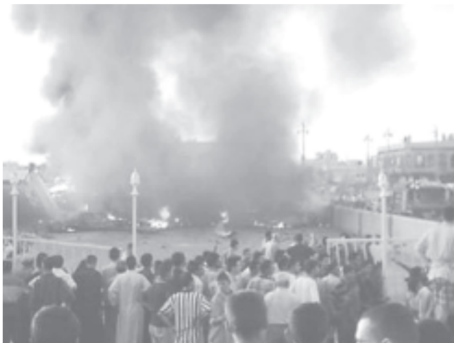
Iraqis crowd the area after an explosion in the parking lot in the Baghdad suburb of Al Doura on 1 August, 2004.