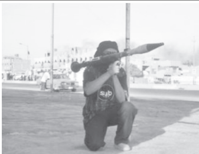
One of al-Sadr's men fights with US troops in the Baghdad neighbourhood of Sadr City, Iraq, on 5 Aug, 2004.