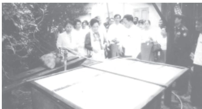
MWAF President Dr Daw Khin Win Shwe inspects water supply works at Indagaw model village in Bago Township.

The National Convention was adjourned on 9 July 2004 after completing one of the its portions. As the Panel of Patrons of the National Convention strives to lay down basic principles after coordinating and combining proposals submitted by eight delegates groups to the National Convention, the Work Committee is to provide assistance to the Panel of Patrons if necessary.