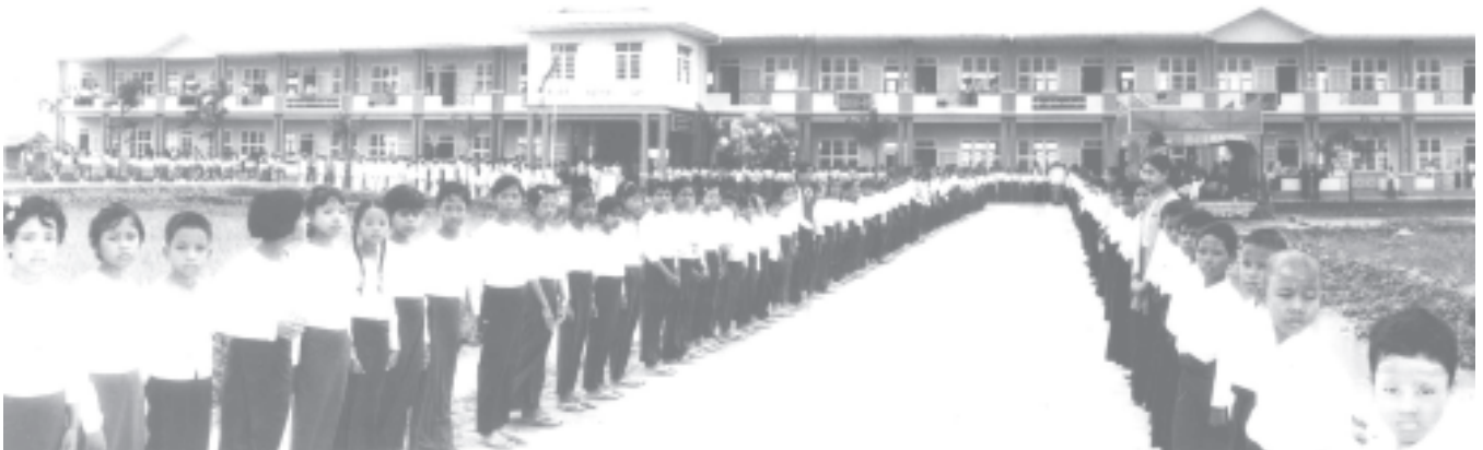
New school building of Basic Education Primary School No.7 in Ward 168, Dagon Myothit Seikkan Township, Yangon Division.