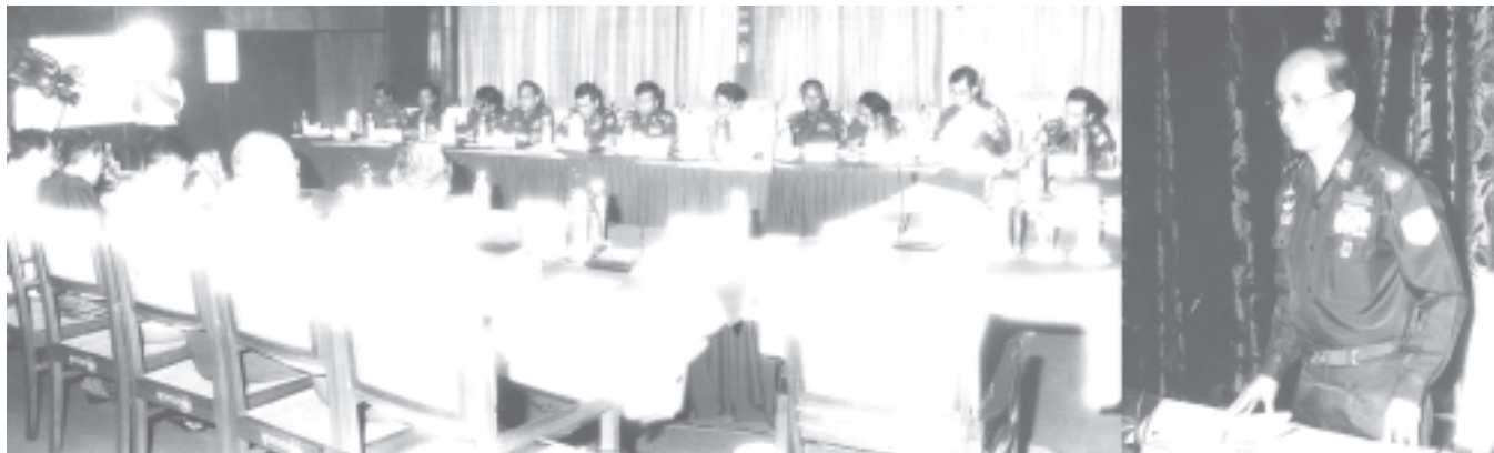
NCCC Chairman State Peace and Development Council Secretary-2 Lt-Gen Thein Sein delivers an address at the co-ordination meeting.