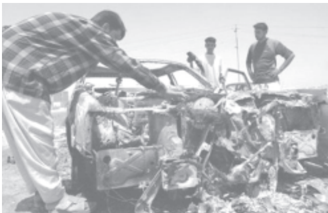
Iraqis look at a damaged car in the city of Najaf, Iraq, on 3 Aug, 2004.