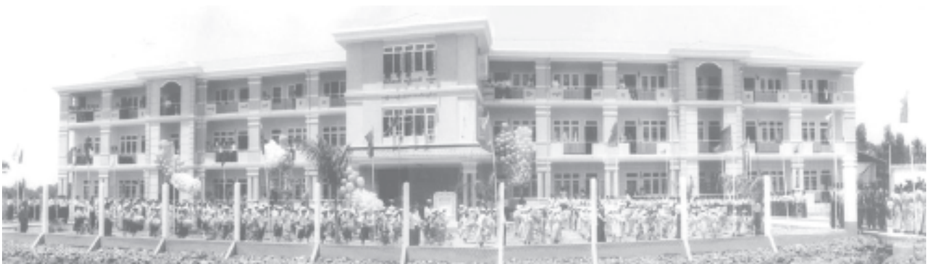
The three-storey school building of No.2 Basic Education High School in Wakema, Ayeyawady Division.