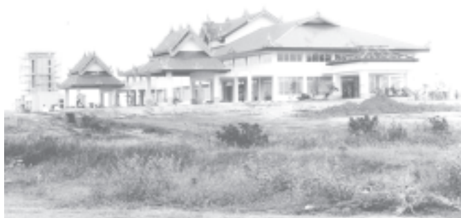
Construction of the main building at Pakokku Airport in progress.— MNA

Head of State Senior General Than Shwe designated Pakokku as the capital of the region on the western bank of Ayeyawady River and gave guidance on upgrading Pakokku to a city possessing characteristics of a city.