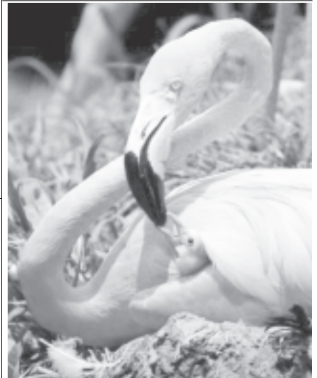
An American flamingo chick, born on 16 July, 2004, peeks out from its mother's feathers to feed at the Smithsonian's National Zoo in Washington, on 20 July, 2004.