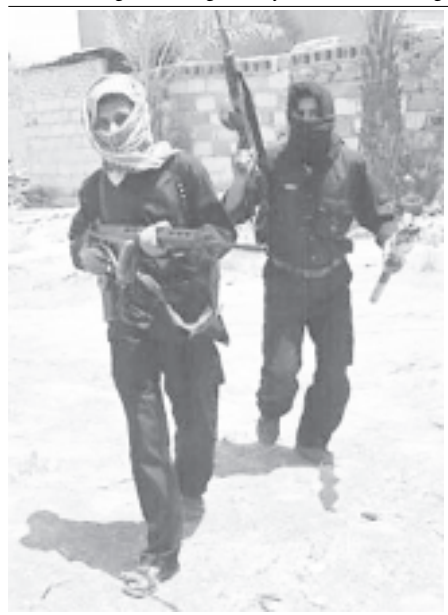
Gunmen allied to radical Iraqi Shiite cleric Moqtada al-Sadr deploy during skirmishes with British troops in the southern Iraq city of Basra on 5 Aug, 2004.