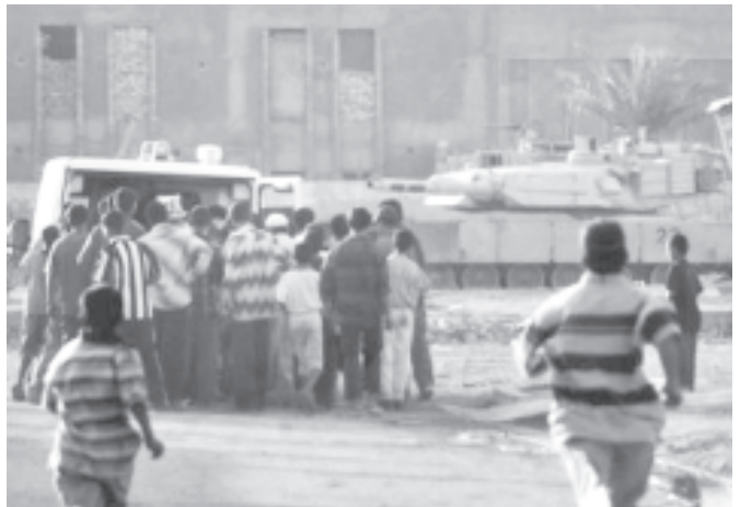
An American tank stands by as the crew allow time for an ambulance to pick up a Mahdi army injured man and another casualty from the fighting between Al-Sadr's men and US troops in the Baghdad neighbourhood of Sadr City, Iraq, on 5 Aug, 2004.

Wen briefed the guests on China's economic situation. The development of China is a major contribution to global peace and prosperity and also creates conditions for the expansion of Sino-US economic relations, he said.— MNA/Xinhua