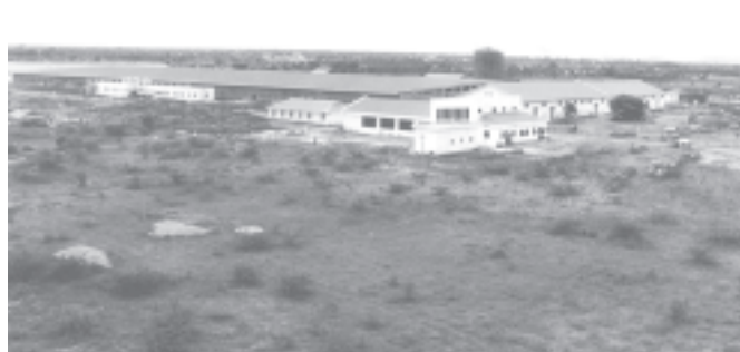
Construction of Pakokku Textile Factory nearing completion.