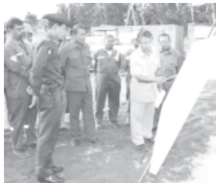
Deputy Minister for Energy Brig-Gen Than Htay being reported on production of oil and natural gas in Yenangyoung oil field. — ENERGY

During his inspection tour, the deputy minister dealt with increased production of oil and gas, minimizing loss and wastage, measures for drilling of new oil wells, and timely completion of the projects and attended to the needs. — MNA