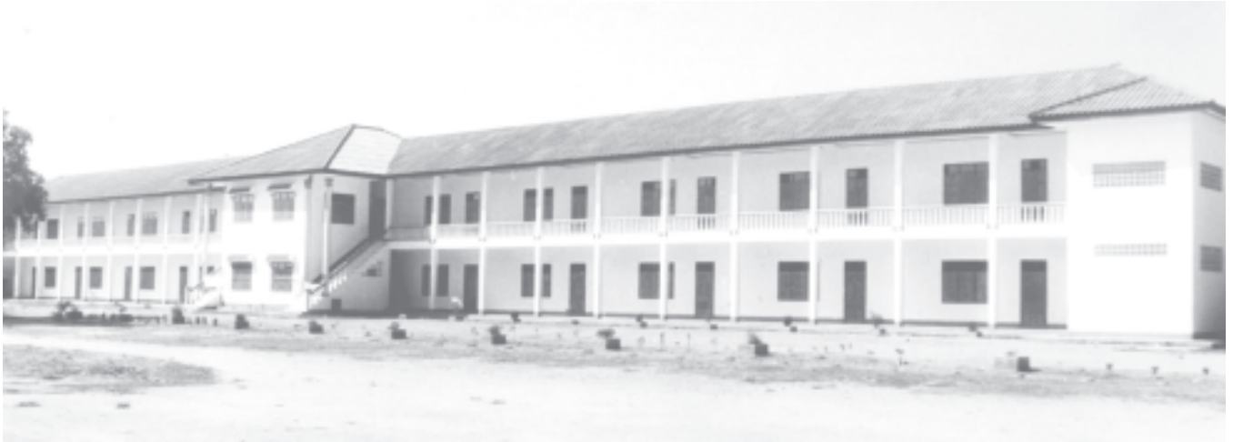
New school building of Tachilek Basic Education Middle School in Shan State (East).