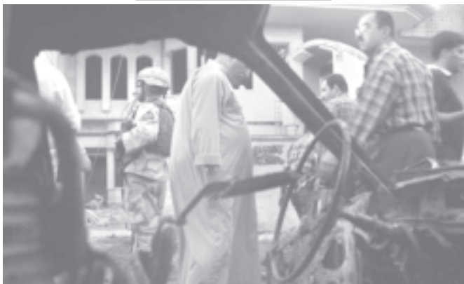
US Army soldiers and Iraqis gather at the scene of car bombing in Mosul, Iraq, on 1 August, 2004.