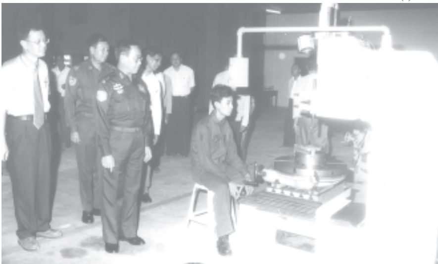
Industrial Development Committee Chairman Secretary-1 Lt-Gen Soe Win inspects tasks of Fair Sun Co Ltd in Shwepyitha Industrial Zone (3).

The two gem stones will be displayed at the Myanmar Gems Museum.