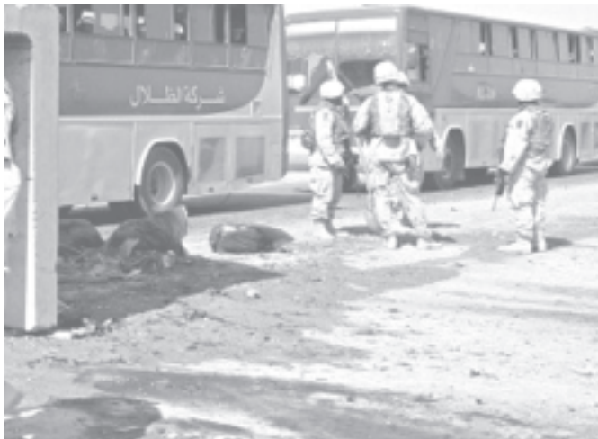
Pool of blood seen at a checkpoint on the northern road heading to the city of Baquba, northeast Baghdad, where a suicide car bomb exploded on 3 August, 2004.