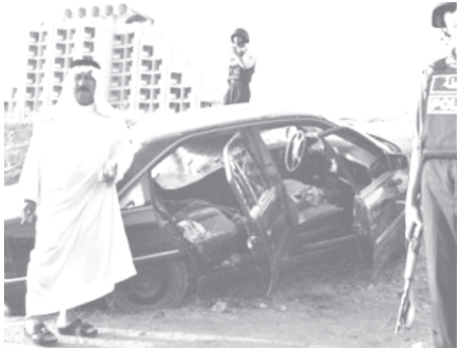
Iraqi police and a civilian stand next to a car caught in the middle of a gunfight as it was passing by an area where clashes between gunmen and police were taking place in the northern Iraqi town of Mosul on 4 Aug, 2004.