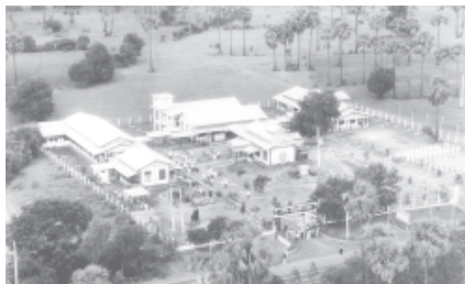
Daw Oo Home for the Aged in Yesagyo.