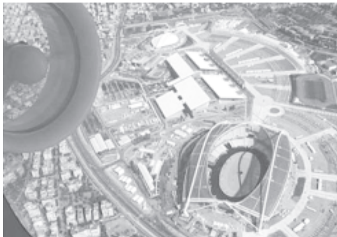
A security blimp flies over the Olympic Stadium complex, which also includes the tennis and aquatic centres, the velodrome and indoor hall, in Athens, on Wednesday, 4 Aug, 2004, as preparations continue for the 2004 Olympic Games which are scheduled to begin on 13 August.