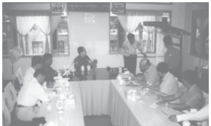
Minister for PBANRDA Col Thein Nyunt being reported on progress in development works by officials concerned on 4 August. — PBANRDA