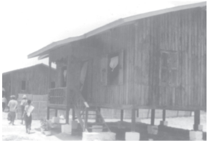
Rural houses built in Kanthit village in Wundwin Township, Mandalay Division.