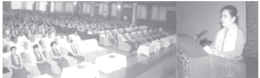
MNAF President Dr Daw Khin Win Shwe gives talks on Myanmar Women's Affairs Federation. EDUCATION

Also present on the occasion were Deputy Minister U Myint Thein and officials. — MNA