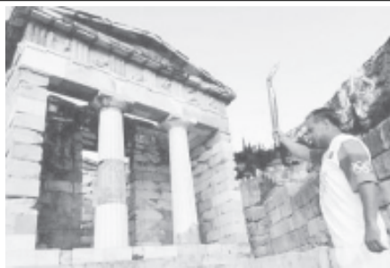
A torch bearer carries the Olympic flame inside the Delfi archaeological site, northwest of Athens, as he participates in the torch relay in Greece on 4 Aug, 2004. The flame is due to be lit at the Athens Olympic Stadium on 13 August.