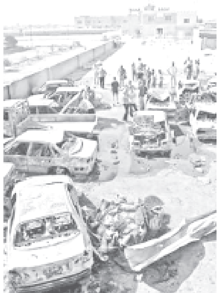
Iraqis view the wreckage of destroyed vehicles in Baghdad on 2 Aug, 2004. —INTERNET

Five Britons, including Dergoul, were released in March after being detained at the US naval base for more than two years. They allege they were kicked, punched and stood on by guards, interrogated at gunpoint and taunted by naked female soldiers. — MNA/Xinhua