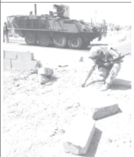
A British Army soldier, accompanying US troops, checks debris following a roadside blast which killed two civilians in the northern Iraqi city of Mosul on 4 Aug, 2004.

board some of India's demands like those in agriculture with regard to special products.—MNA/PTI