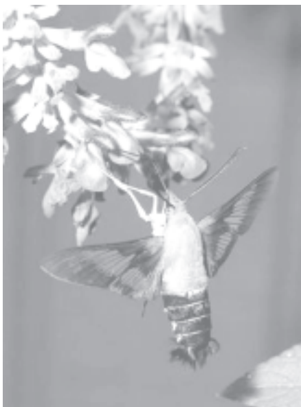
A Hummingbird Moth hovers feeds on flowers on early Tuesday, 3 Aug, 2004 near Archer, Fla. This moth is often confused with the hummingbird as it feeds in the same areas and manner as the hummingbird. This insect is about 2 inches long and can be seen usually from May to September in the South.