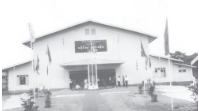
The newly opened Gymnasium of Maubin.