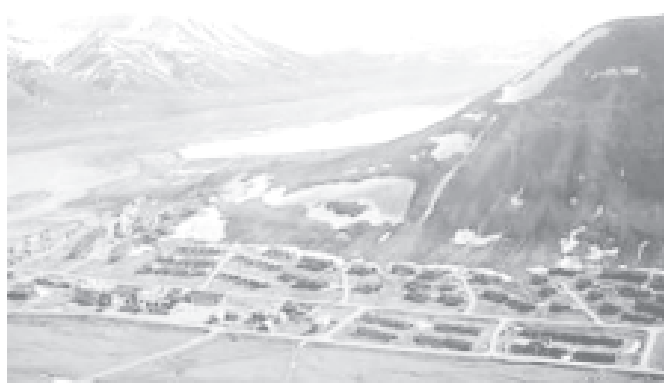
Longyearbyen, one of the world's most northerly tourist destinations, is a coal-dusted town situated among snowy peaks and icy landscapes between the Arctic Ocean and the Barents Sea, and has only 1,700 inhabitants. While the polar bears are a major draw to the Norwegian archipelago — along with husky-drawn sleigh rides under the midnight sun and expeditions to the North Pole — nature lovers are advised not to go unarmed outside the capital, Longyearbyen. —INTERNET

has been consistently conducting immunization campaigns since 1996 in line with its national commitment towards the eradication of polio, and the country has been free of wild poliovirus since 2001. — MNA/Xinhua