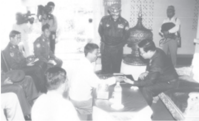
Prime Minister General Khin Nyunt inspects antiques at Pakhangyi Archaeological Museum in Yesagyo. — MNA