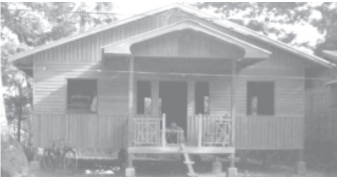
A rural house built by Development Affairs Department in Nyaungwaing village in Kyauktan Township, Yangon Division.