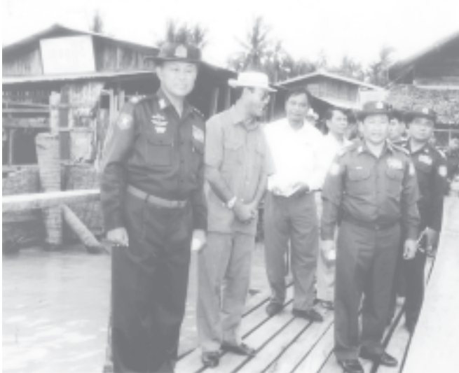
State Peace and Development Council member Lt-Gen Khin Maung Than inspects progress in construction of Pyapon Bridge on 4-8-2004.