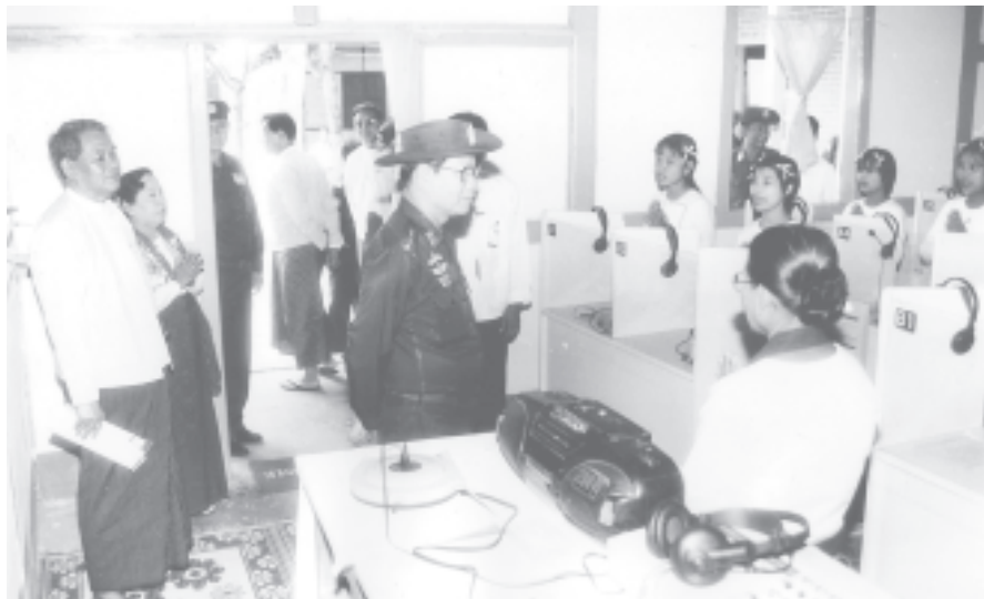
Prime Minister General Khin Nyunt inspects multimedia classroom at Pauk BEHS.