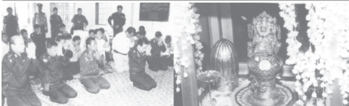
Prime Minister General Khin Nyunt and party pay homage to Tharakkhan Buddha Image at Pakhangyi Village in Yesagyo Township on 4 August 2004.