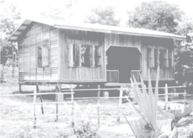
A rural house built by Development Affairs Department in Mogaung Village in Aunglan Township, Magway Division.