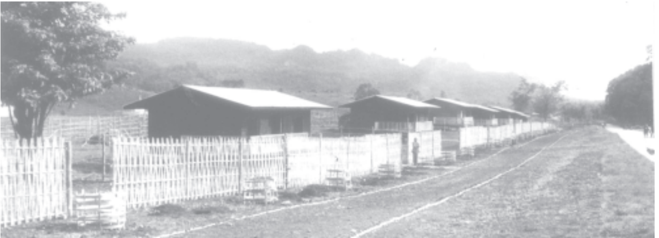
Rural houses built in Mongli model village in Hsenwi Township, Shan State (North).