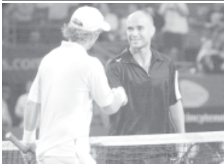
Thomas Johansson of Sweden, left, congratulates Andre Agassi following their match at the Tennis Masters Cincinnati in Mason, Ohio, on Wednesday, 4 Aug, 2004. Agassi won 6-1, 3-6, 6-1.