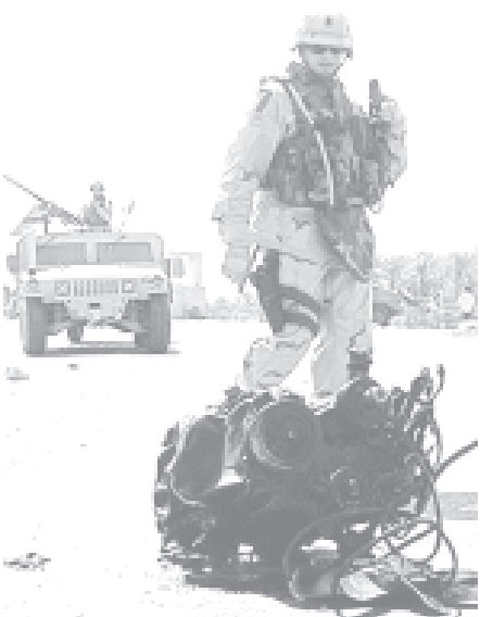
A US soldier looks at the remains of a car bomb that exploded at a checkpoint on the northern road heading to the city of Baquba, northeast Baghdad recently.

Out of the top 50 most expensive office locations in the world, 29 have experienced a fall in the occupational cost over the last six months. — MNA/PTI