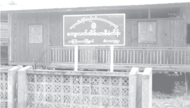
A rural house built by Development Affairs Committee in Daka village, Kangyidaunt Township, Ayeyawady Division.