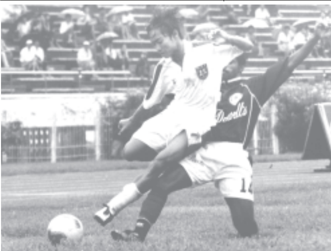
Players of MFF selected youth team and Mohun Bagan XI team of India seen in action on Thursday. The Indian team beat the Myanmar team 1-0.