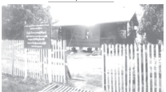
Rural house in Shwepyigon Village, Yedashe Township, Bago Division. — PBANRDA