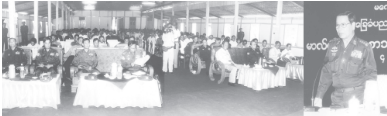
Prime Minister General Khin Nyunt meets with departmental personnel, townsenders and officials of social organizations at Pauk BEHS.