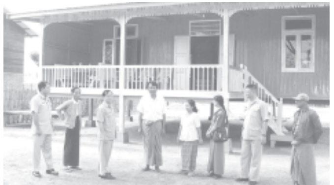
Rural housing projects implemented in Thityakauk Village of Magway Township.