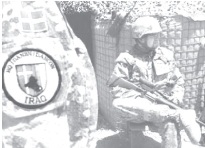
Danish troops guard their contingent's base in the Iraqi town of Al Qurna on 4 Aug, 2004.

Also on Wednesday, reports Aljazeera's correspondent in Ramadi, a car bomb exploded near a US checkpoint at the eastern entrance of the city. The blast, which targeted a US patrol, left a number of casualties among the US forces and damaged a military vehicle, the correspondent said.—Internet