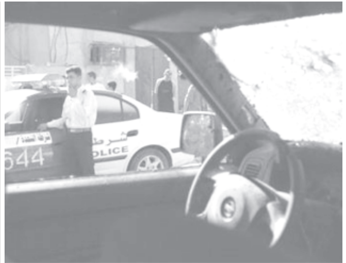
An Iraqi Police officer stands by the scene after assailants detonated a roadside bomb, killing a local police chief and another officer in Baghdad on 3 Aug, 2004.

India was one of five big trading powers — along with the United States, the European Union, Australia and Brazil — that forged con-