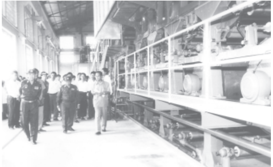
Lt-Gen Khin Maung Than inspects installation of new machines at Paper Mill of Myanmar Jute Enterprise in Maubin on 4-8-2004.—MNA

Minister Brig-Gen Thura Aye Myint delivered a speech and presented sports gear for the townships of