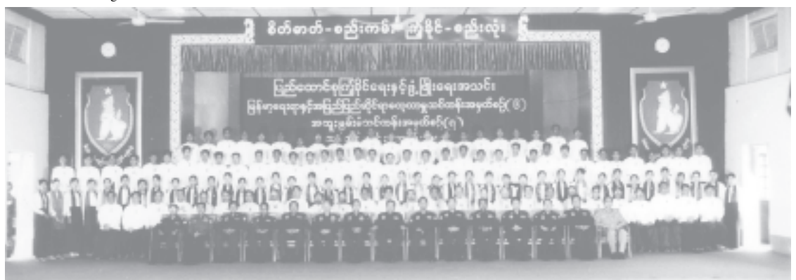
Senior General Than Shwe and party pose for documentary photo with trainees.—MNA

In studying the irrigation projects, electric power projects and river-crossing bridge projects, it can be seen that intellectuals and intelligentsia in the country have participated relentlessly in implementing them with their knowledge and technologies. Similarly, the national education promotion programme is being implemented in the country and in this endeavour, millions of citizens including rural people are participating. The people have rendered physical and financial assistance to the endeavours for emergence of multimedia classrooms and for promoting the image of schools.