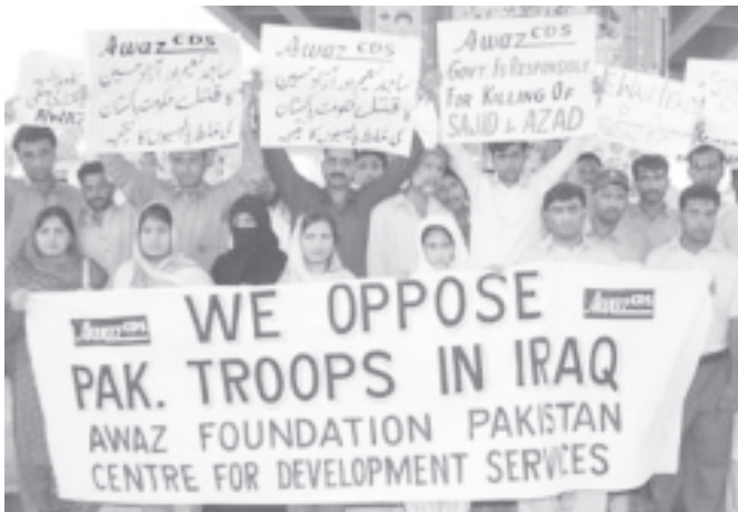
Peace activists hold placards during a protest in Multan on 29 July, 2004 against the killing of two Pakistani drivers in Iraq.

The statement was issued in the name of the Jamaat al-Tawhid al-Islamiya — Omar el-Mukhtar Brigade, a little known group whose main title means the Group of Islamic Monotheism. Omar el-Mukhtar fought the Italian occupation of Libya and was hanged in 1931. —Internet