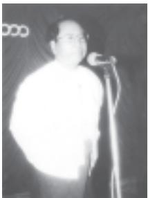
USDA Secretariat Member Minister Brig-Gen Kyaw Hsan meets local people at Phaunggata village of Salingyi Township.

Later, the Sagaing Division USDA Secretary and executives presented gifts to the instructors of Monywa Institute of Economics.