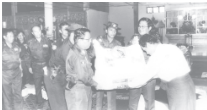
Lt-Gen Maung Bo presents clothes for villagers of Khawza village in Ye region.

The State Peace and Development Council is building a modern, developed and discipline-flourishing democratic nation in cooperation with the national people. If we march to the State's goal with democracy system, it is necessary to firmly strengthen consolidation of the entire nation as well as to develop education, health, transport and social sectors. It is needed to ensure proper administrative machinery and prevalence of law and order. To flourish the democracy system, it is necessary to strengthen political, economic, social and administration pillars. Therefore, the government is fulfilling basic needs for flourishing the democracy system which the entire people desire. Now, the