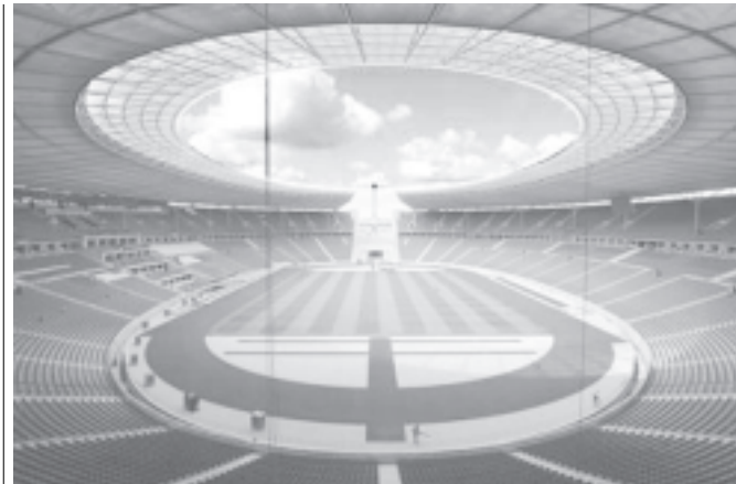
View into the reconstructed Berlin Olympic Stadium on Wednesday, 28 July, 2004, which will have its official opening ceremony during the weekend after four years of reconstruction. The stadium will host the World Cup Soccer final in 2006.