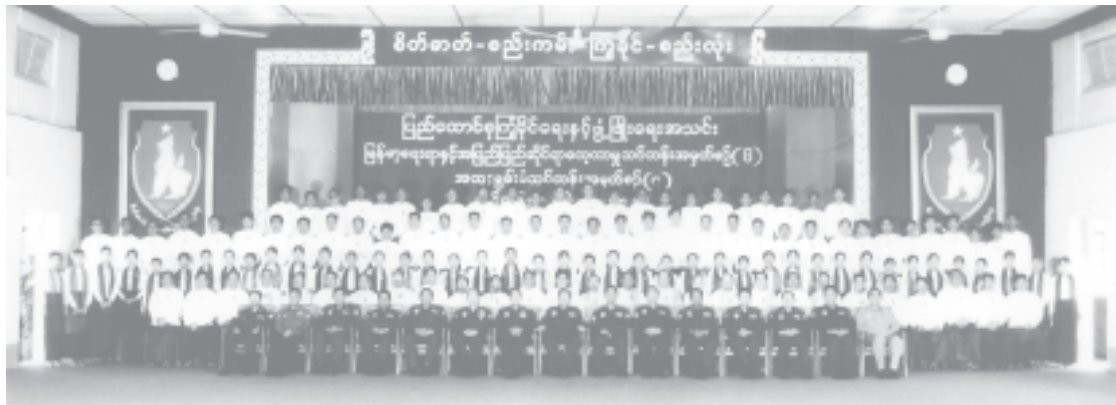
Senior General Than Shwe and party pose for documentary photo with trainees.—MNA

I have just mentioned that the building of a new modern nation is a very