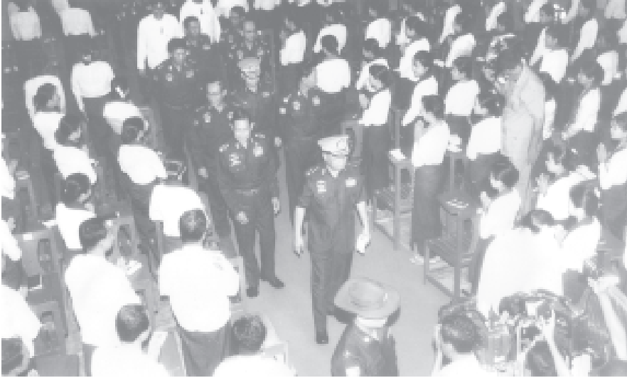
Senior General Than Shwe cordially greets trainees after the concluding ceremony of the courses.

Regarding the steps towards promotion of national education standard, more new basic education schools, universities and colleges have been opened, new subjects prescribed and there has been a sharp increase in the number of students. So, even some retired scholars of old age have to continue participation in academic and research work in the interest of the nation.