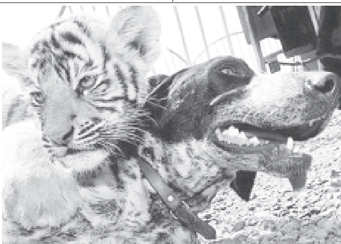
Mother and son : Cora, a two-month-old baby tiger plays with her adoptive mother, a four-year-old dog in Villeneuve-d'Asq, northern France.

The raids were part of Operation Grafton, a crackdown on large-scale crime at Heathrow Airport launched in April, 2003 following complaints from private firms over huge losses to organized crime there. One company left and relocated to Frankfurt Airport.