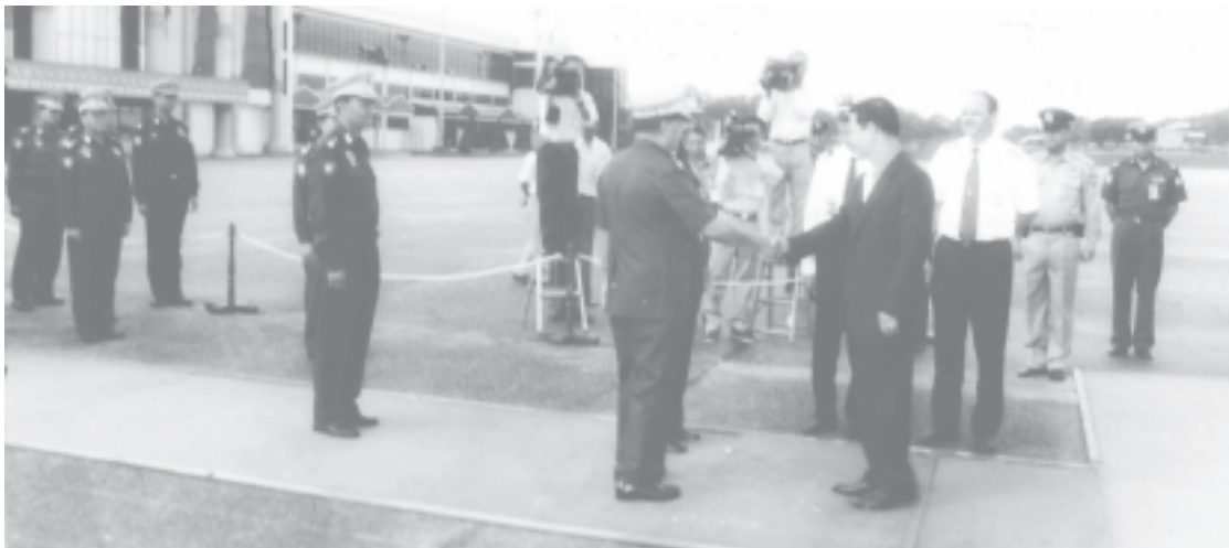
Senior General Than Shwe and party see off Prime Minister General Khin Nyunt on his departure for Thailand.