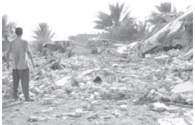
An Iraqi man looks at the ruins of a house destroyed in an airstrike near the village of Al-Suwariyah, southern Iraq, on 28 July, 2004.

With a population over 16 million, Shanghai is one of China's grain import giants, consuming 5.7 million tons every year, nearly half of which is rice. However, the trade volume of rice amounted to 750,000 tons in 2003, fulfilling only 36 per cent of the market's requirement.