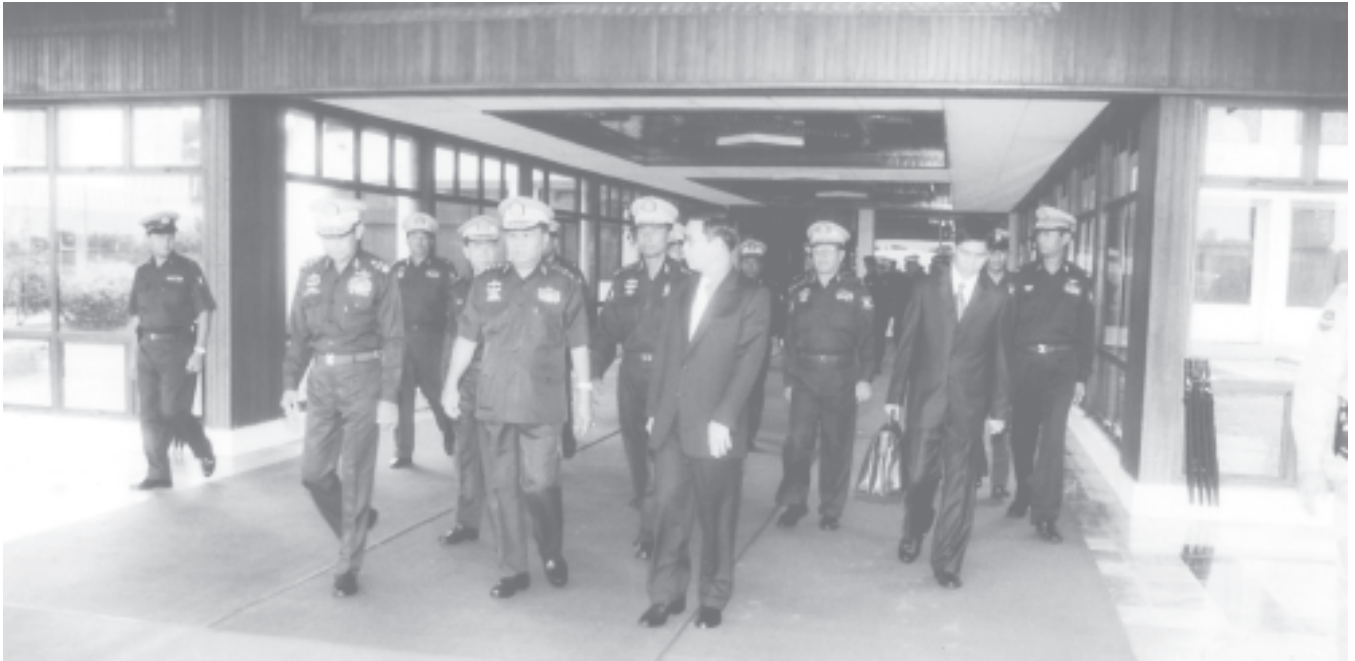
Senior General Than Shwe and party see off Prime Minister General Khin Nyunt on his departure for Thailand.