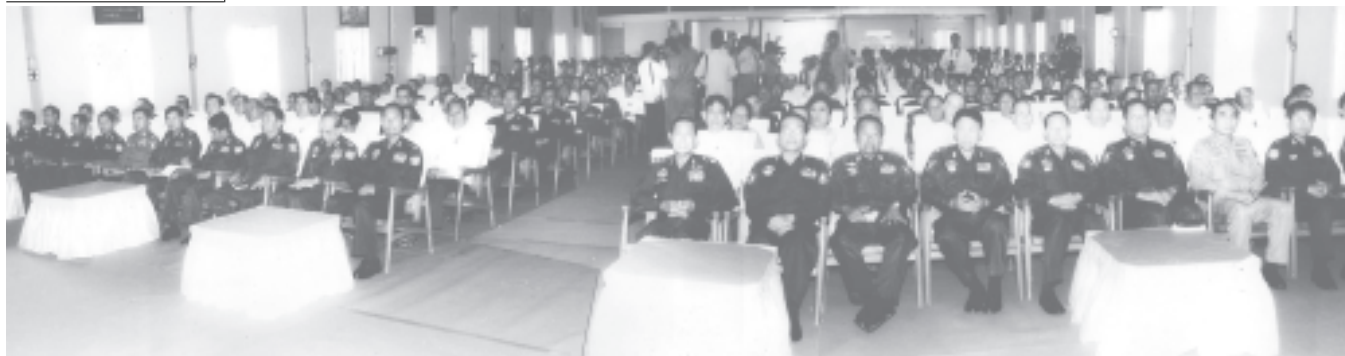
Dignitaries seen at the concluding ceremony of Myanmar and International Studies Course No 6 and Special Refresher Course No 7 of USDA. — MNA

Hepatitis infections and Medical Research (Page 10)