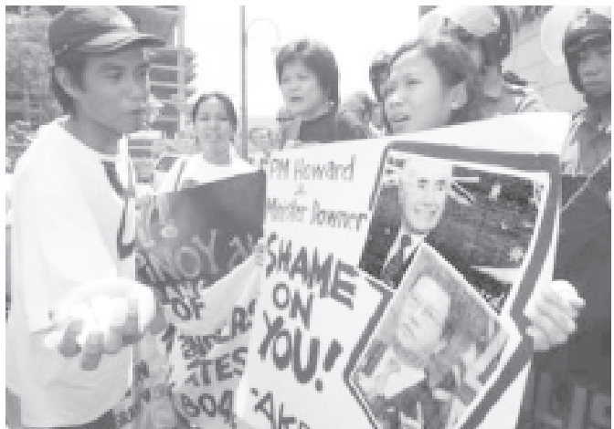
A Philippine protester aims to throw marshmallows to a poster of Australian Prime Minister John Howard outside the Australian Embassy in Manila's Makati financial district on 30 July, 2004.

Saudi Arabia was used as a launchpad for US forces, which stayed in the kingdom until last year. — MNA/Xinhua