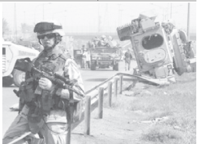
A US tank lies turned over on a highway west of Baghdad as soldiers secure the area recently. — INTERNET

details to be hammered out. The French government is standing firm in resisting an Alliance mission in Iraq itself, pressing for training to take place outside the war-scarred country, diplomats say. The United States, which has long pushed for a bigger NATO role in Iraq where American troops have been struggling to contain mounting violence, is pushing hard for an accord. —Internet