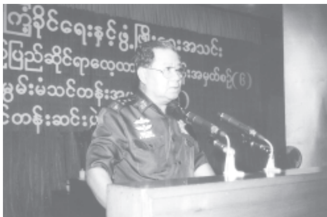
USDA Patron Head of State Senior General Than Shwe addresses the concluding ceremony of Myanmar and International Studies Course No 6 and Special Refresher Course No 7 of USDA.

YANGON, 30 July — Patron of the Union Solidarity and Development Association Chairman of the State Peace and Development Council Commander-in-Chief of Defence Services Senior General Than Shwe attended concluding