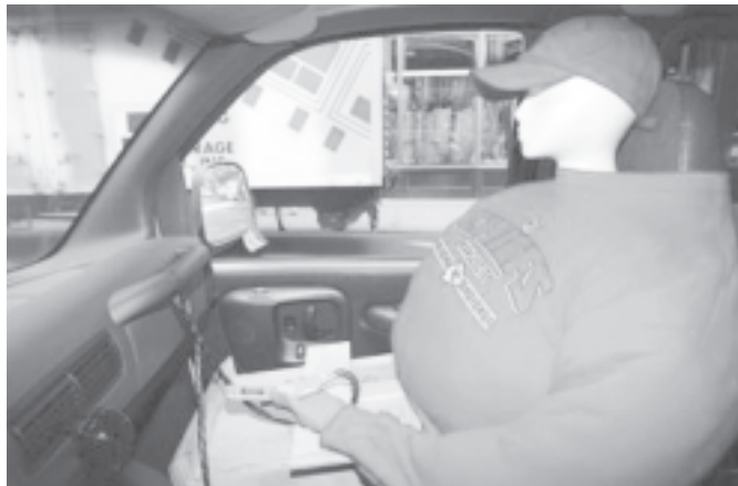
'Bob,' a hands-free cell phone test dummy, demonstrates technology being used by Magnolia Broadband in New York on 6 July, 2004. Magnolia Broadband, a small company based in Clinton, NJ, has been driving the life-sized dummy around New York City and Kansas City to determine how their wireless technology fares in different environments.

The results are based on data collected by 14 observation towers in the jungles, which scientists use to monitor carbon dioxide, wind, temperature levels and weather conditions. The full findings are not yet ready but projections are.