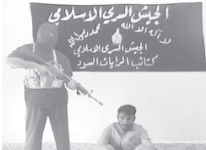
In a videotape given to foreign news organizations on 29 July, 2004, a masked man points an M-16 automatic rifle at the head of an Indian hostage, who was wearing orange clothing. Kidnappers holding seven foreign truck drivers hostage in Iraq threatened to kill one of them on Friday if they received no response to their demands.