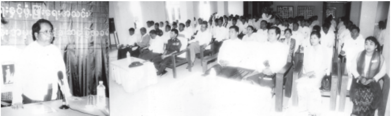
USDA (Central) Secretariat Member Minister for Information Brig-Gen Kyaw Hsan delivers an address at the closing ceremony of basic rural development course.