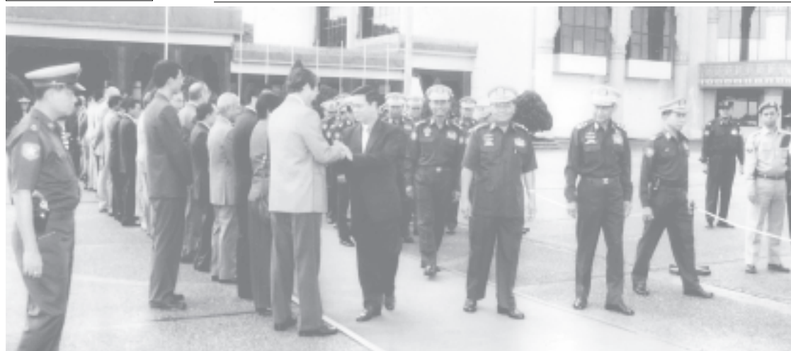
Ambassadors, diplomats and UN officials see off Prime Minister General Khin Nyunt on his departure for Thailand.