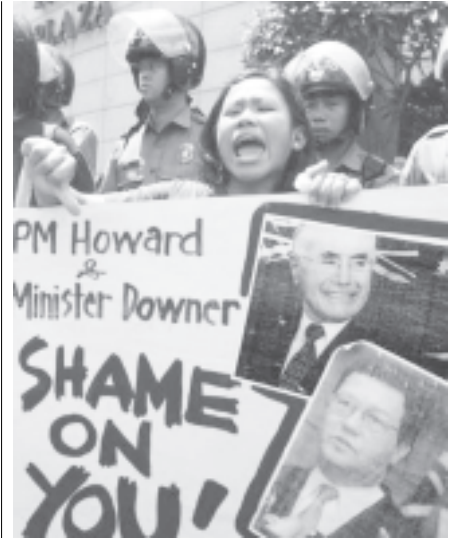
A protester gives thumbs down sign while chanting anti-Australia slogans outside the Australian Embassy in Manila on 30 July, 2004. A diplomatic row sparked by Australia, blaming the Philippines and Spain for encouraging guerillas, by withdrawing from Iraq deepened on Wednesday when Manila scolded the Australian envoy over her government's stance.