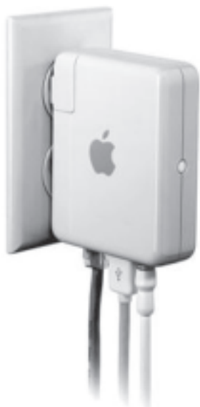
Apple's AirPort Express is seen in a photo provided by Apple Computer Inc. It is a device that is an access point, print server, range extender and media adapter all in one. The unit, which works both with Windows and Mac PCs, plugs into the wall and is the first media adapter to stream copyright-protected music purchased from Apple's popular iTunes Music Store. —INTERNET

Vaccinations will be administered to people prone to infection, such as poultry farmers, slaughterhouse workers, livestock and health officials handling the outbreak, and children in rural areas where chickens were raised. Eight people have been killed during the first round of bird flu outbreak in Thailand early this year. — MNA/Xinhua