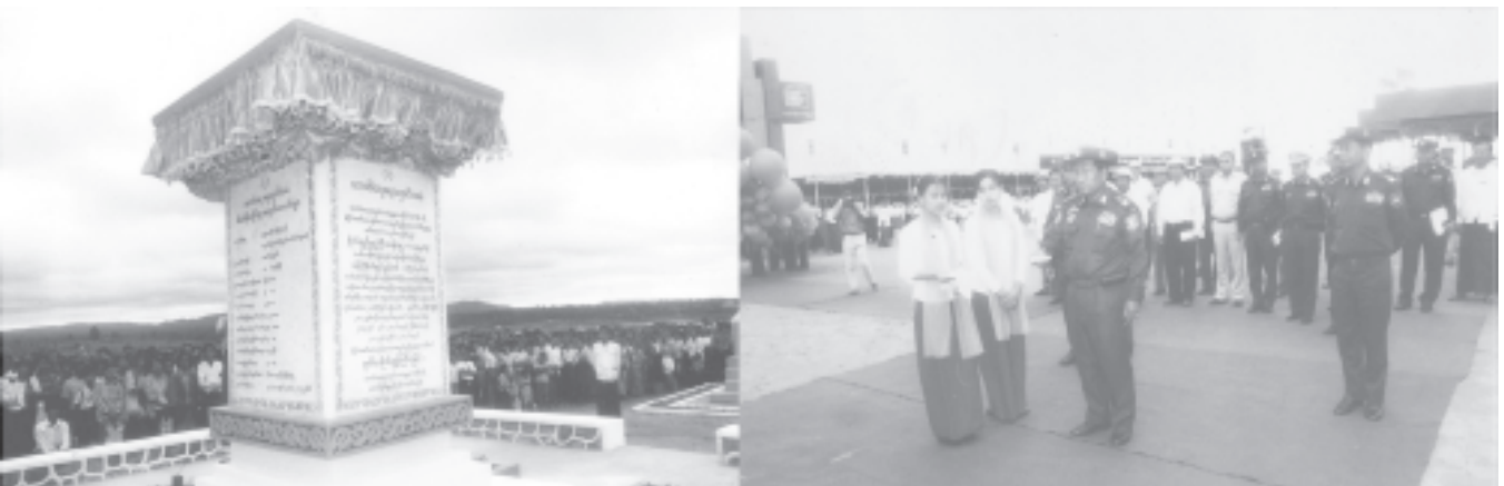
Lt-Gen Ye Myint formally unveils the stone inscription of Taunggyay Dam in Kyaukpadaung Township.

The economy of the entire people will develop, only if there is progress in the agricultural sector. Thus, farmers will have to produce an abundant supply of crops. Mandalay Division is a reliable region of the nation in terms of economy.