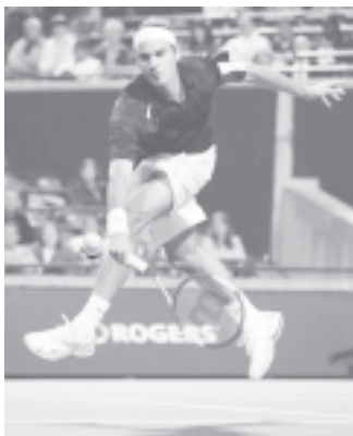
Roger Federer of Switzerland makes a leaping volley to Hicham Arazi of Morocco during their first round match at the Tennis Masters Series Canada tournament in Toronto on Tuesday, 27 July, 2004.

BERLIN, 27 July — Former captain Juergen Klinsmann has agreed a two-year contract to coach the German national team until the end of the 2006 World Cup, the German Football Association (DFB) said on Monday.