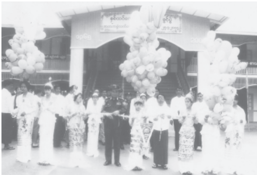
Commander Maj-Gen Tha Aye and Minister for Information USDA (Central) Secretariat member Brig-Gen Kyaw Hsan formally open the new two-storey building of Lettaunggyi village BEHS by cutting a ribbon.

Government, local people and wellwishers cooperate in efforts for uplift of rural education standard by constructing school buildings.