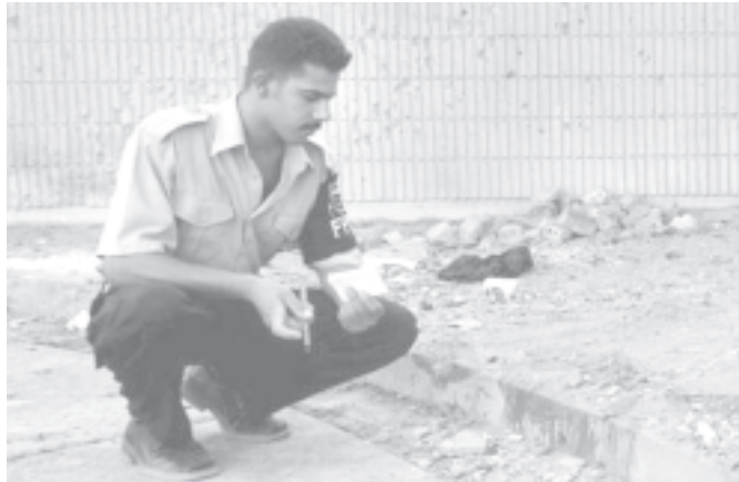
An Iraqi policeman inspects the area where mortar fire struck a residential area in central Baghdad, Iraq on early 27 July, 2004. The mortar killed an Iraqi garbage collector and injured another, an eyewitness said.