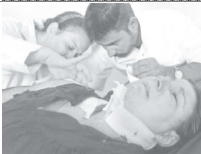
Doctors treat a wounded Iraqi woman after she was shot by gunmen in Iraq's southern city of Basra on 26 July, 2004.

မြို့ခြံချွေတာ၊ ထိန်းပါးလေလွင့်၊ ထုတ်တုန်မြင့်