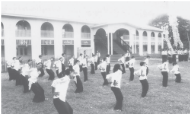
New two-storey building of Mintaingbin village BEHS in Pale Township.

Govt and people should join hands to implement seven-step future policy of the State. As the National Convention resumed, one part of the Convention has been held successfully. Internal and external destructive elements are trying to disturb with various ways implementation of the seven-step future policy.