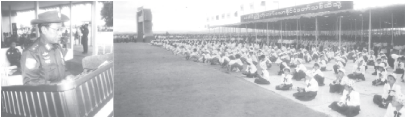
Lt-Gen Ye Myint delivers an address at the opening ceremony of Taunggyay Dam in Kyaukpadaung Township.