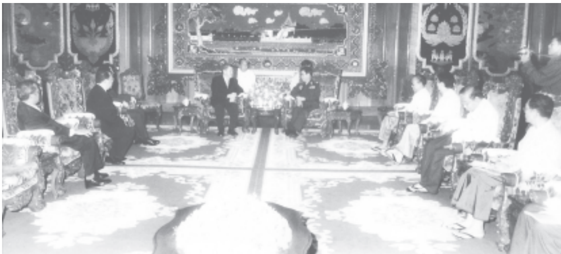
Prime Minister General Khin Nyunt receives visiting Malaysian Minister of Health Datuk Dr Chua Soi Lek at Zeyathiri Beikman.— MNA

The visiting Malaysian Health Minister was accompanied by Malaysian Ambassador Dato' Cheah Sam Kip. —MNA