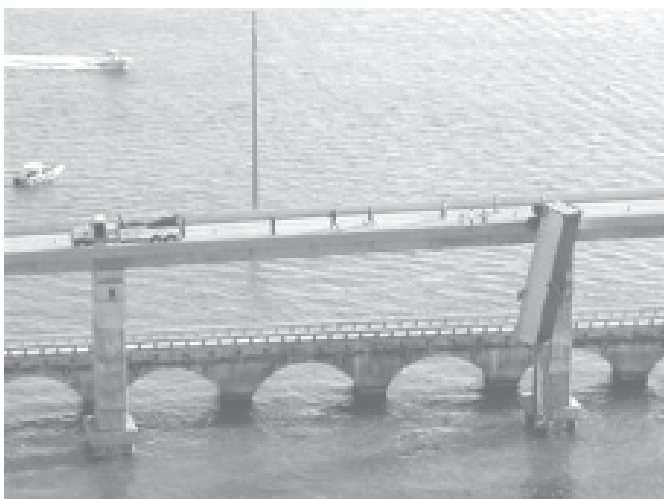
A separated trailer, from a tractor-trailer truck, dangles off the Channel 2 bridge on the Florida Keys' Overseas Highway near Islamorada, Fla, on Monday, 26 July, 2004, following an accident with a disabled vehicle.

SINGAPORE, 28 July — Singapore's Prime Minister Goh Chok Tong will become the senior minister in the new Cabinet after he completes the handover of power to Deputy Prime Minister Lee Hsien Loong on 12 August. According to local Press reports on Tuesday night, Singapore's Senior Minister Lee Kuan Yew, father of Lee Hsien Loong, revealed this in an interview with Reuters on Tuesday. "Mr Goh Chok Tong will be the number two in the new government," Lee Kuan Yew said.