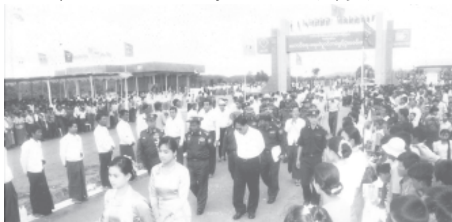
Lt-Gen Ye Myint and party inspect embankment of Taungyay Dam in Kyaukpadaung Township.