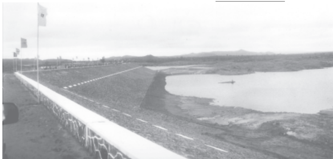
View of Taungyay Dam built in Kyaukpadaung Township.