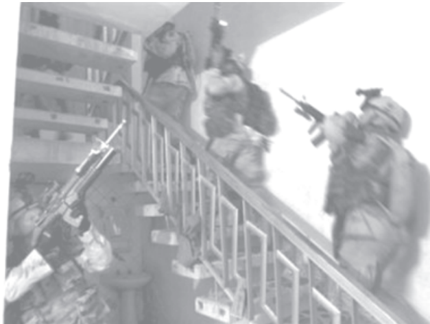
US Army 1st Infantry Division soldiers raid a home while searching for car bomb makers and supplies in Khan Bani Sa'ad, near Baqouba, Iraq, before dawn on 27 July, 2004. Eight Iraqi men were detained. — INTERNET

The rift began last weekend when the Islamic Tawhid group, which claimed to be the European wing of al-Qa'eda, threatened Australia with attacks unless it pulled out of Iraq.— Internet