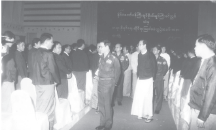
Prime Minister General Khin Nyunt greets judges, law officers and attorneys after the meeting.

If we should objectively examine the judicial sector and its administration of justice today, it must be admitted that although there has been a fair measure of success, there have unfortunately also been errors, blunders and