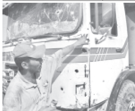
A shot up truck on the road to Baqouba as a man points at the bullet holes on the vehicle, 60 kms north of Baghdad, Iraq on Tuesday, 27 July, 2004. — INTERNET

"We, the older generation, can expect a younger flare, one that will weigh the risks, but one that won't play defensively and will go on the offence," Klaus told a news conference on Monday. — MNA/Reuters