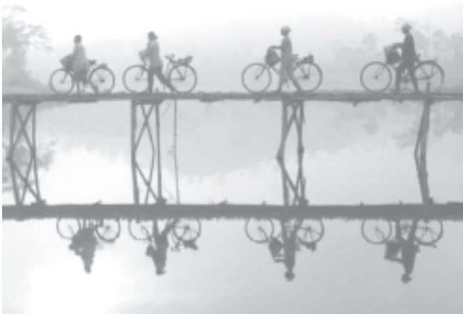
Indonesian villagers carry their belongings across a bamboo bridge as the sun rises outside Yogyakarta city in Central Java, on 24 July, 2004.