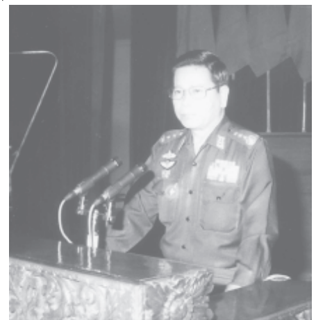
Prime Minister General Khin Nyunt clarifies judicial matters to judges, law officers and attorneys.

The government is at present working assiduously for putting in place the proper political, economic and social foundations in all their aspects with the goal of reconstituting the Union of Myanmar as a peaceful, modern, developed and fully disciplined democratic state.