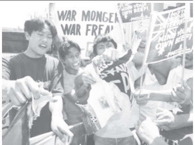
Filipino demonstrators chant anti-Australia slogans outside the Australian Embassy in Manila, on 27 July, 2004. Australia refused on Tuesday to apologize to Spain and the Philippines after blaming them for encouraging militants to issue threats by withdrawing their troops in Iraq.