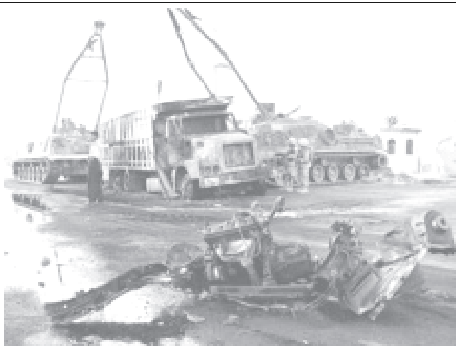
The remnants of a car bomb lie near the place where American forces remove the charred remains of a truck which was targeted by guerrillas at the entrance of Baqouba, 65 kms north of Iraq, on 27 July, 2004.