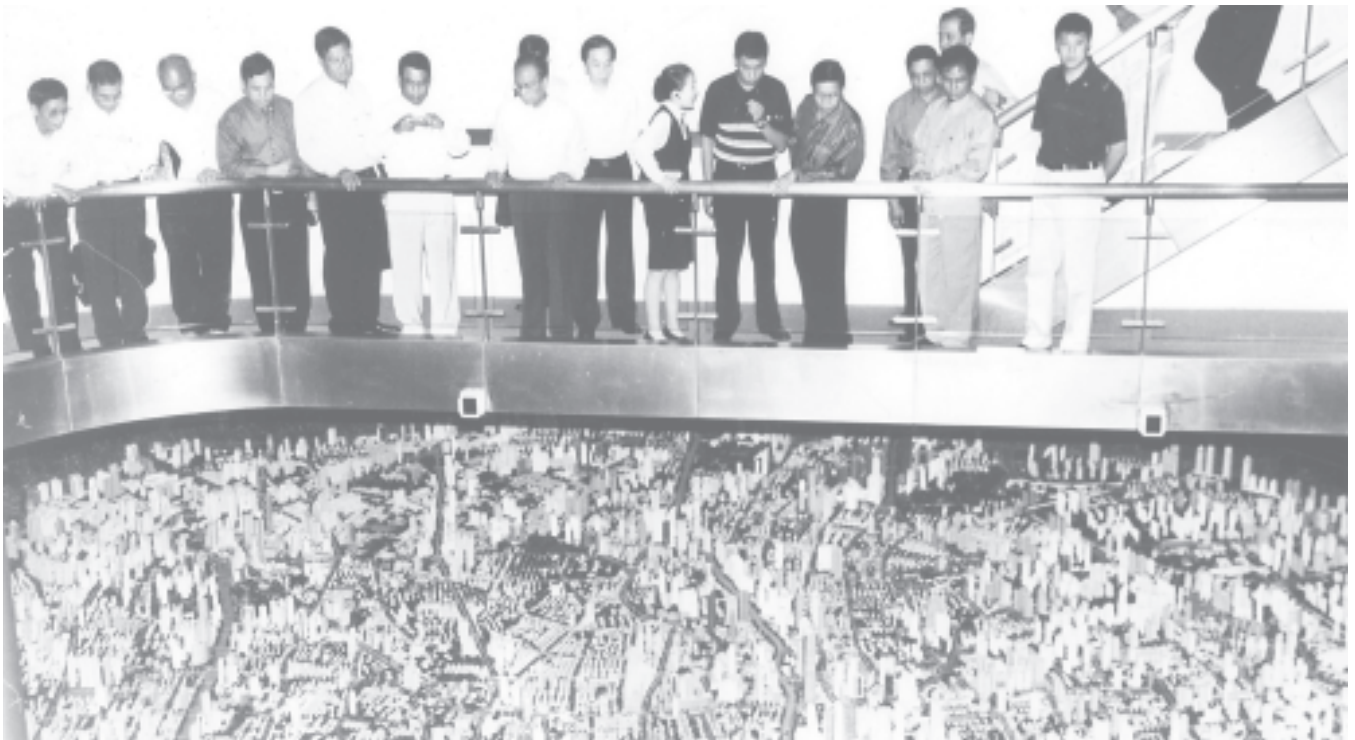
Prime Minister General Khin Nyunt views progress of Shanghai in year 2020 at Shanghai Urban Planning Exhibition Centre on 15 July.