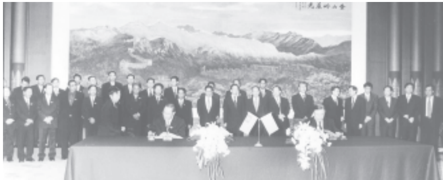
CPT Minister Brig-Gen Thein Zaw and Chinese Minister of Information Industry Mr Wang Xudong sign MoU between Ministry of Communications, Posts and Telegraphs of Myanmar and Ministry of Information Industry of China in the field of Information and Communications on 12 July.

MoU signed between the Ministry of Communications, Posts and Telegraphs of the Union of Myanmar and the Ministry of Information Industry of the People's Republic of China in the field of Information and Communications.