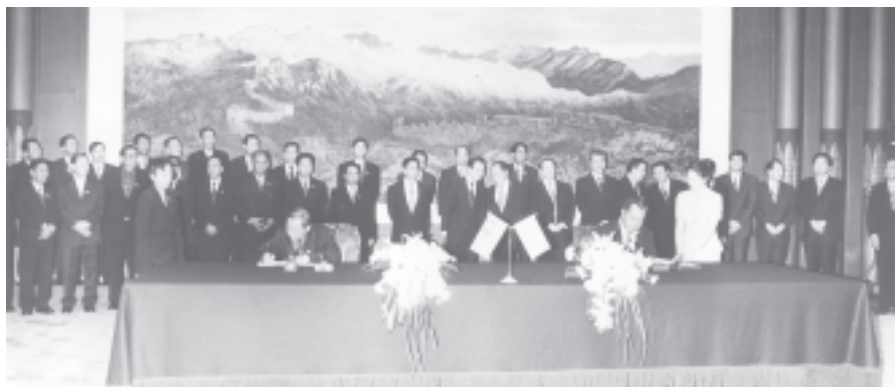
Deputy Minister for Finance & Revenue Col Hla Thein Swe and Chairman and President of Export-Import Bank of China Mr Yang Zilin sign Agreement on Financing Plan for No 4 Urea Fertilizer Factory at Taikkyi.

Agreement on Financing Plan for No 4 Urea Fertilizer Factory at Taikkyi was signed by Deputy Minister for Finance & Revenue Col Hla Thein Swe of the Union of Myanmar and Chairman and President of Export-Import Bank of the People's Republic of China Mr Yang Zilin.