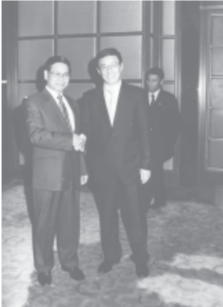
Prime Minister General Khin Nyunt greets Shanghai Mayor Mr Han Zheng at Jin Jiang Grand Hall in Shanghai on 15-7-2004.