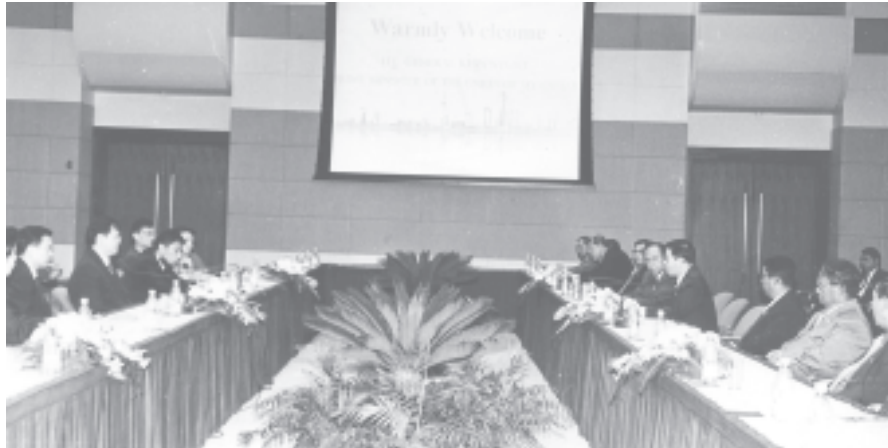
Vice-Mayor of Shanghai Pudong New Area People's Government Mr Endi Zhang reports Prime Minister General Khin Nyunt on matters relating the Pudong Industrial Zone on 15 July.