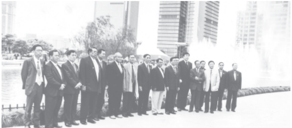
Prime Minister General Khin Nyunt and party pose for documentary photo at Lujiazui Central Green Park in Shanghai on 15 July.