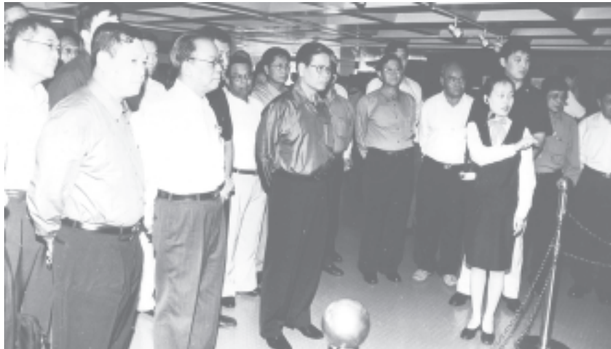
Prime Minister General Khin Nyunt and party view progress of Shanghai in year 2020 at Shanghai Urban Planning Exhibition Centre on 15 July.— MNA

The Prime Minister and party viewed scale models of magnificent buildings in Shanghai region, historical photos on cumulative development of Shanghai, layout of the buildings in Shanghai, model scale for emergence of Shanghai in 2020, the future airport design of Shanghai, the deepsea port of Shanghai, equipment of the municipal department, graphs showing development of Shanghai, the scale model of the layout of buildings of Pudong Industrial Zone when developed in future and the scale model of the underground electric train which can run 400 km per hour. Officials conducted them round the exhibition.