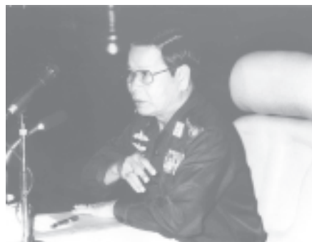
Chairman of Myanmar Computer Science Development Council Prime Minister General Khin Nyunt gives instructions at briefing on e-Government tasks.