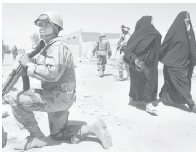
Iraqi women walk past Iraqi Army 2nd Battalion soldiers on patrol in the al-Dora section of Baghdad, Iraq, on Tuesday, 20 July, 2004. The 2nd Battalion is the first unit to go into service with the new Iraqi Army.