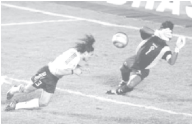
Argentina's Juan Pablo Sorin (L) heads the ball in for a goal past Colombian goalie Juan Carlos Henao, in the second half of their Copa America semifinal match in Lima, Peru, on 20 July, 2004. Argentina won the match 3-0.

"They will pressure the ball in midfield again and hit us on the break," said Zico.