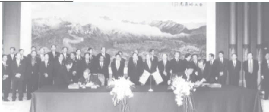
Deputy Minister for F & R Col Hla Thein Swe and Chinese Vice Minister of Commerce Mr Yu Guangshou sign Agreement on Economic and Technical Cooperation, Exchange of Notes on Project of International Convention Centre, Exchange of Notes on Master Plan for Hydropower Projects in Myanmar, Exchange of Notes on Master Plan for Thanlyin-Kyauktan Industrial Zone and Exchange of Notes for provision and shipment of rails. — MNA

Agreement on Economic and Technical Cooperation, Exchange of Notes on Project of International Convention Centre, Exchange of Notes on Master Plan for Hydropower Projects in Myanmar, Exchange of Notes on Master Plan for Thanlyin-Kyauktan Industrial Zone and Exchange of Notes for provision and shipment of rails