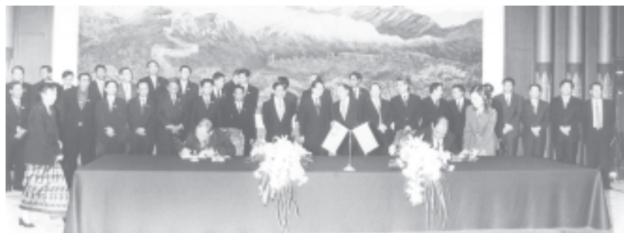
Deputy Minister for Finance and Revenue Col Hla Thein Swe and China Export & Credit Insurance Corporation President Mr Tang Ruoxin sign Debt Rescheduling Agreement in the presence of Prime Minister General Khin Nyunt and Chinese Premier Mr Wen Jiabao.

Debt Rescheduling Agreement was signed by Deputy Minister for Finance & Revenue Col Hla Thein Swe and China Export & Credit Insurance Corporation President Mr Tang Ruoxin.