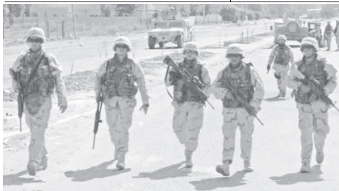
US Army soldiers arrive at the scene of a roadside bomb explosion in Baghdad's district of al-Doura, on 20 July, 2004. At least two Iraqi policemen were injured when an improvised explosive device went off as their convoy was driving past. — INTERNET

In the new facility, which is about the size of three football fields, there will be no escalators, aerobridges or holding rooms, and passengers will have to take a shuttle bus to the airplane. — MNA/Xinhua