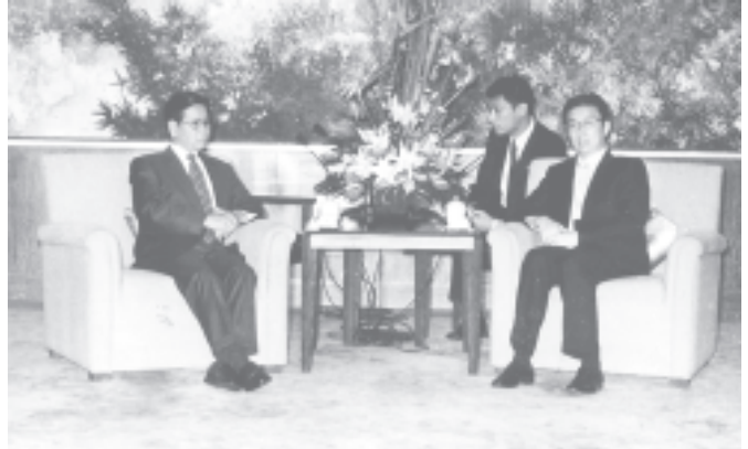
Prime Minister General Khin Nyunt meets Mayor of Shanghai Mr Han Zheng at Jin Jiang Grand Hall in Shanghai on 15 July.