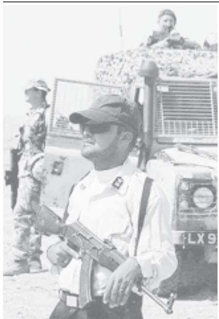
An Iraqi policeman and British soldiers man a checkpoint on the outskirts of the southern Iraqi city of Basra. A senior official in Basra was shot dead along with two of his guards by unknown assailants as he was heading to work, officials and a relative said.