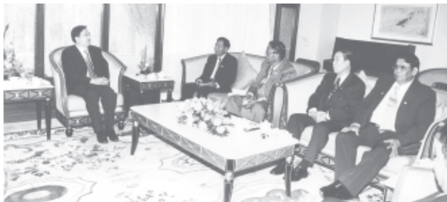
President of Jsing Daring Biotechnologies Group Mr Yang Yingzhi calls on members of the delegation Minister for Industry-1 U Aung Thaug, Minister for Transport Maj-Gen Hla Myint Swe, Minister for Energy Brig-Gen Lun Thi and Minister for Electric Power Maj-Gen Tin Htut at Jin Jiang Tower Hotel in Shanghai on 15 July. — MNA