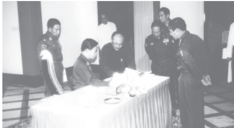
Prime Minister General Khin Nyunt hears reports to upgrade Yangon City Kandawgyi Gardens' environs and Zoological Gardens (Yangon).