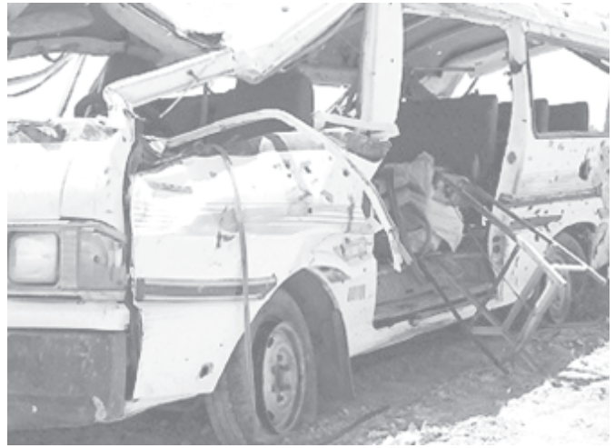
A vehicle which was transporting seven Iraqi veterinarians lies damaged on a highway after a roadside bomb exploded when they were driving on the outskirts of Baquba, 50 kms west of Baghdad recently.