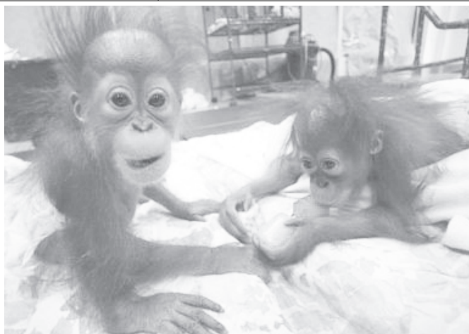
Twin female orangutans play in their nursery, on 19 July, 2004, at Parrot Jungle Island in Miami. The unnamed orangutans, which are the first recorded twin births in 20 years, were born on 2 Dec, 2003 and will be introduced to the public on 24 July.