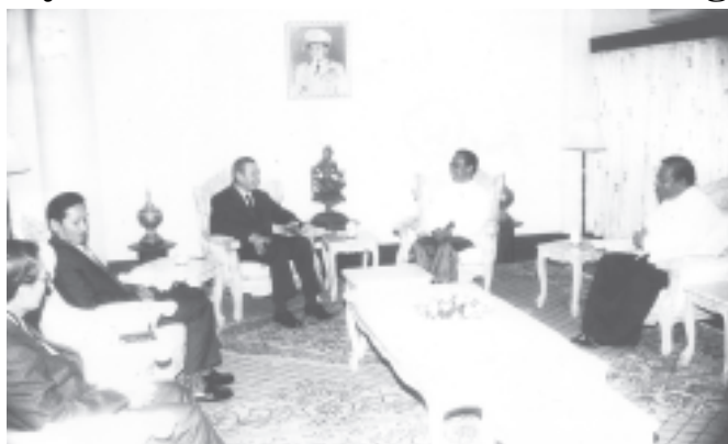
Foreign Affairs Minister U Win Aung receives Deputy Minister for Foreign Affairs of Lao People's Democratic Republic Mr Phongsavath Boupouha at the Ministry of Foreign Affairs. — MNA

YANGON, 22 July — Deputy Minister for Foreign Affairs of the Lao People's Democratic Republic Mr Phongsavath Boupouha called on Minister for Foreign Affairs U Win Aung at the Ministry of Foreign Affairs at 11 am today. Present at the call were Deputy Minister for Foreign Affairs U Khin Maung Win, Myanmar Ambassador to LPDR U Tin Oo, Director-General of Political Department U Thaug Tun and officials. In the evening, Deputy Minister for Foreign Affairs U Khin Maung Win hosted a dinner in honour of the Laotian delegation. — MNA