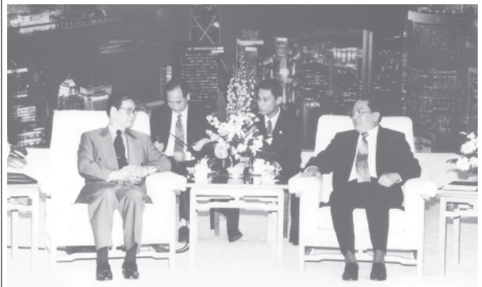
Prime Minister General Khin Nyunt meets member of the Standing Committee of the Political Bureau Mr Luo Gan at the hall of the Great Hall of the People in Beijing on 13 July.