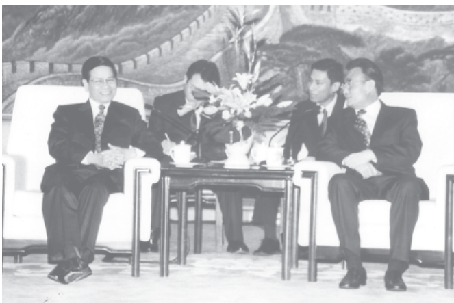
Prime Minister General Khin Nyunt meets Chairman of the National People's Congress of China Mr Wu Bangguo on 13 July.