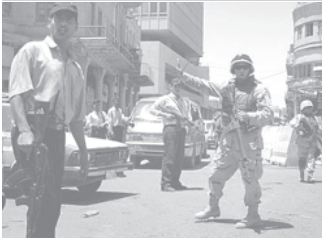
An American soldier and Iraqi police stop traffic as a US military convoy passes through a busy intersection in Baghdad, Iraq, on 13 July, 2004.