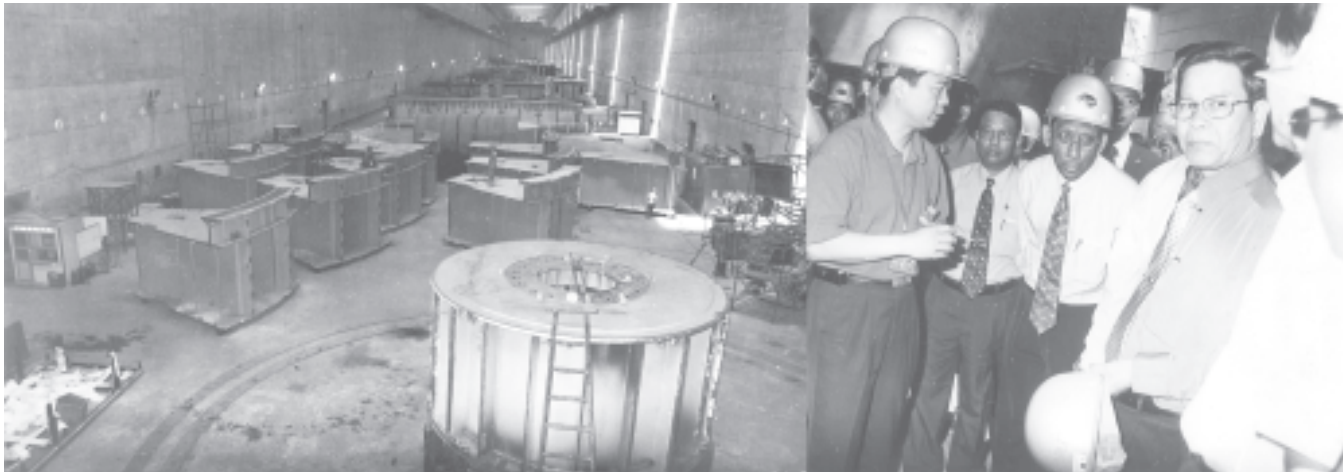
Prime Minister General Khin Nyunt observes the Three Gorges Dam Project site on 14-7-2004.