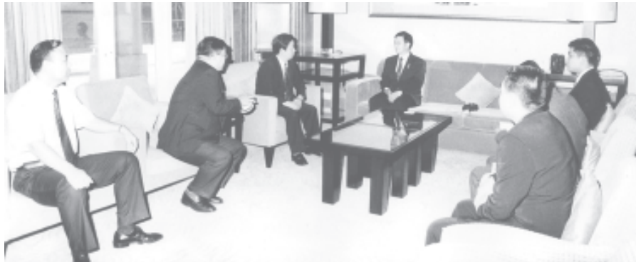
Rail Transportation Minister Maj-Gen Aung Min meets presidents of Chinese economic organizations.