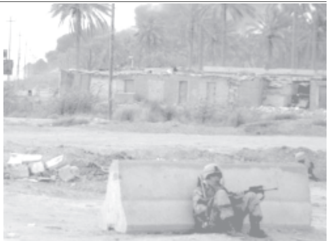
An American soldier takes cover behind a concrete barrier as fire bellows from a fuel tanker hit by an air strike in Latefia, 40 kms south of Baghdad, Iraq, on 18 July, 2004. The multinational force asked Prime Minister Allawi for permission to launch strikes on some specific places.