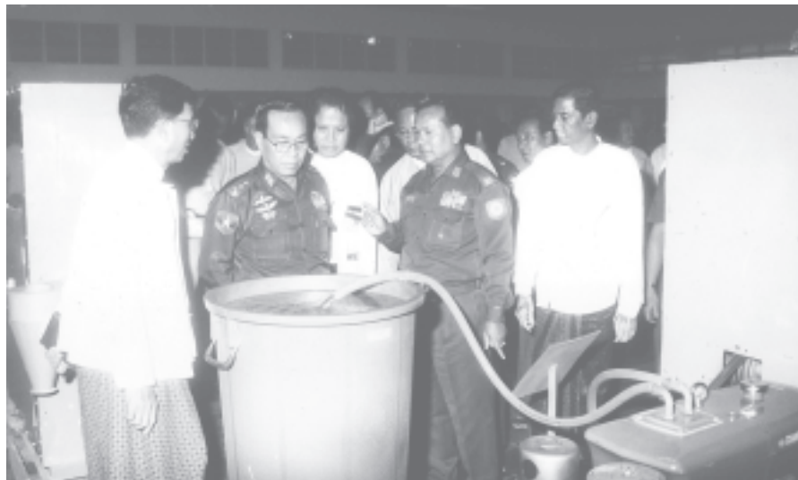
Secretary-1 Lt-Gen Soe Win inspects modern small rice mills innovated by the MAPT. — MNA