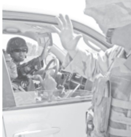
A US military policeman waves to Philippine Army soldiers driving to the Iraq-Kuwait border on 19 July, 2004. The Philippine soldiers left a Polish-controlled military base in Hilla, 120km south of Baghdad where over 50 soldiers were based, heading to the Iraq-Kuwait border as part of a withdrawal plan.