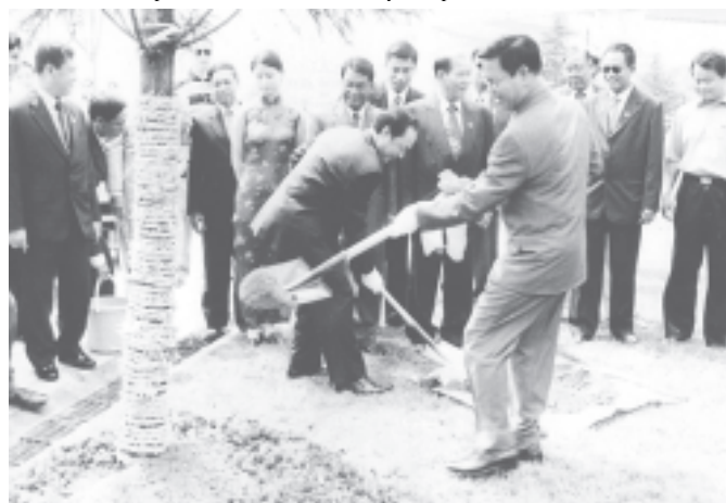
Prime Minister General Khin Nyunt plants a commemorative tree at the World Peace Park in Yichang on 14 July.