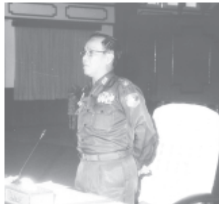
Secretary-1 Lt-Gen Soe Win delivering an address to the Coordination Meeting No 3/2004 on Industrial Development.