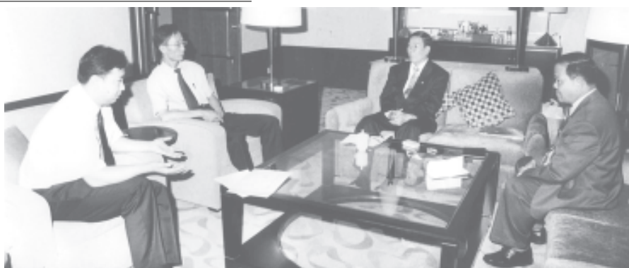
Energy Minister Brig-Gen Lun Thi meets presidents of Chinese economic organizations.

Minister for Communications, Posts and Telegraphs Brig-Gen Thein Zaw met Chinese Minister of Information Industry Mr Wang Xudong at Beijing Hotel on 12 July morning. They dealt with matters related to cooperation in Myanmar's communication sector. Minister Brig-Gen Thein Zaw also met President of Sichuan Machinery & Equipment