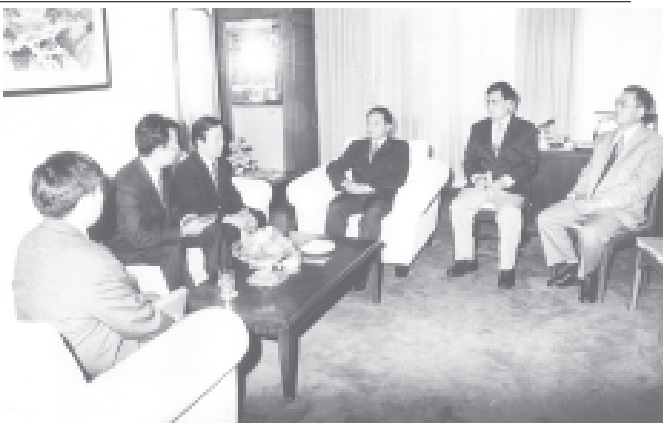
Minister for Mines Brig-Gen Ohn Myint meets presidents of Chinese economic organizations. MNA

At 3.30 pm, the minister and President of Dongfang Electric Corporation (DEC) Mr Juo Zhigang and party dealt with Turbine Generator Factory in Sichuan Province. — MNA