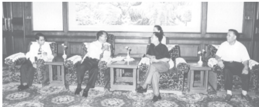
Industry-1 Minister U Aung Thaung meets presidents of Chinese economic organizations.

President of Hongga International Trading Co Ltd Mr Bai Wei Hua and party at the State Guest House in Beijing. The meeting focused on industrial cooperation between the two countries. Also present at the call together with Minister U Aung Thaung were Director-General of the State Peace and Development Council Office Lt-Col Pe Nyein and Director-General of Industries U Kyaw Myint.