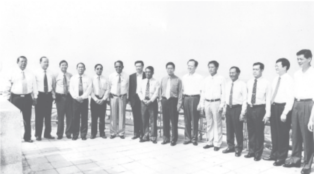
Prime Minister General Khin Nyunt and party pose for a documentary photo together with Chinese experts at the Three Gorges Dam Project site on 14 July.