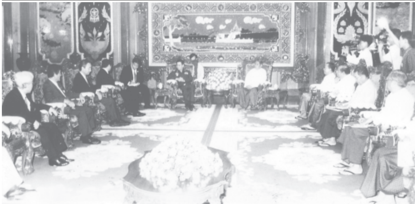
Prime Minister General Khin Nyunt receives members of the House of Representatives of Japan.