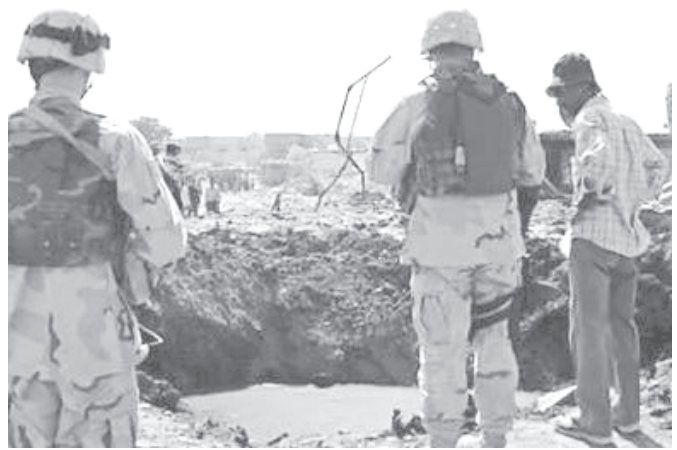
US Army troops and an Iraqi man view a massive crater left after a suspected car bomb blew up outside a police station in south western Baghdad on 19 July, 2004. The bomb killed at least nine people, wounded dozens and left tangled wreckage of burned out cars and destroyed buildings.