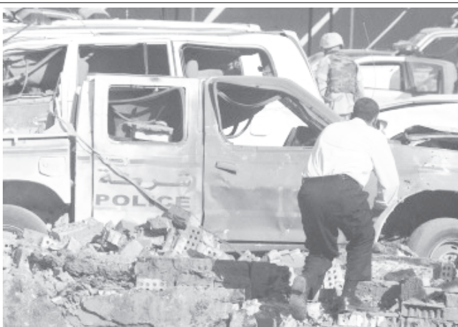
US Army and Iraqi security forces inspect the site of a suicide car bomb attack near a police station in southern Baghdad. The truck bomb blast near a Baghdad police station killed nine people, while the last Philippine soldier left Iraq to save a hostage threatened with beheading and whose fate remains a mystery.