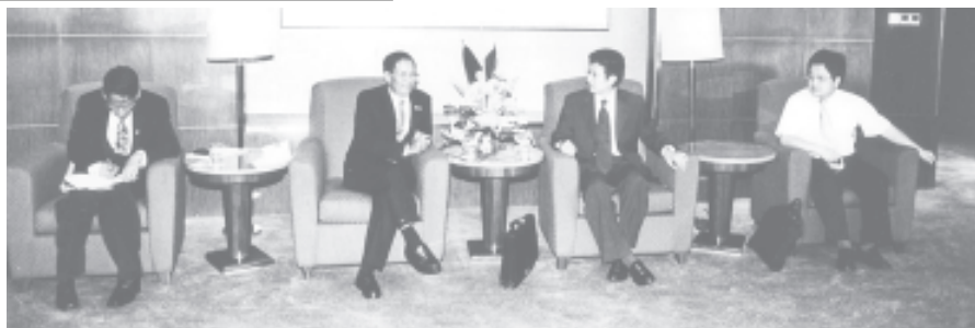
Electric Power Minister Maj-Gen Tin Htut meets presidents of Chinese economic organizations.

Similarly, Minister for Rail Transportation Brig-Gen Aung Min met Executive Director of NORINCO Co of