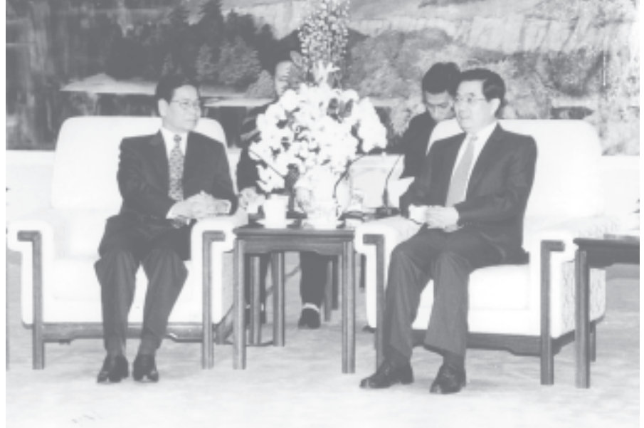
Prime Minister General Khin Nyunt calls on President of the PRC Mr Hu Jintao at Fujian Hall at the Great Hall of the People in Beijing on 13 July.