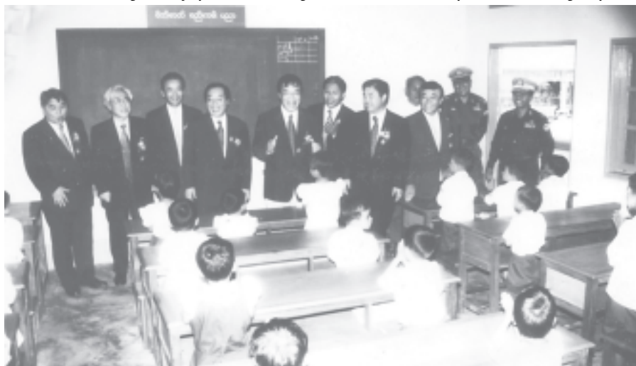
Commander Maj-Gen Myint Swe and wellwishers look into the new building of Letyetsan Village Basic Education Primary School in Thanlyin Township, Yangon South District. — YGN COMMAND