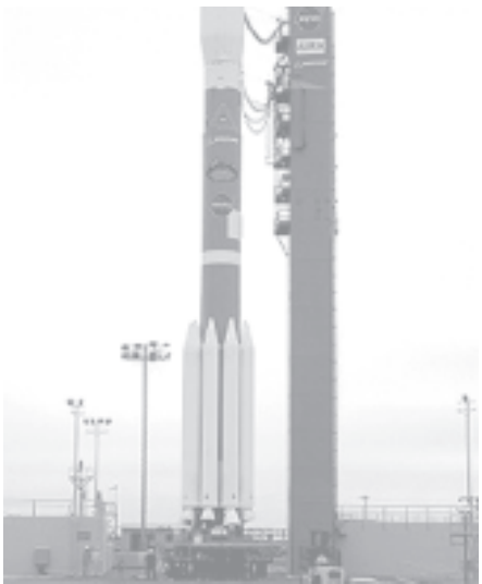
NASA delayed for a fourth time the launch of the Aura satellite, shown here on 12 July atop a Boeing Delta II rocket awaiting launch at the Vandenberg Air Force Base.