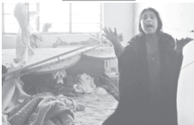
An Iraqi woman weeps after her house was damaged in a car bomb explosion in central Baghdad, on 14 July, 2004.