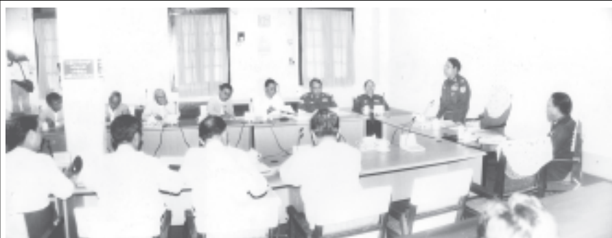
Minister for Information Brig-Gen Kyaw Hsan delivers an address at the coordination meeting.

The course was attended by 36 trainees from Kayin, Kayah, Mon and Rakhine States and Yangon, Ayeyawady, Tannithayi and Bago Divisions.