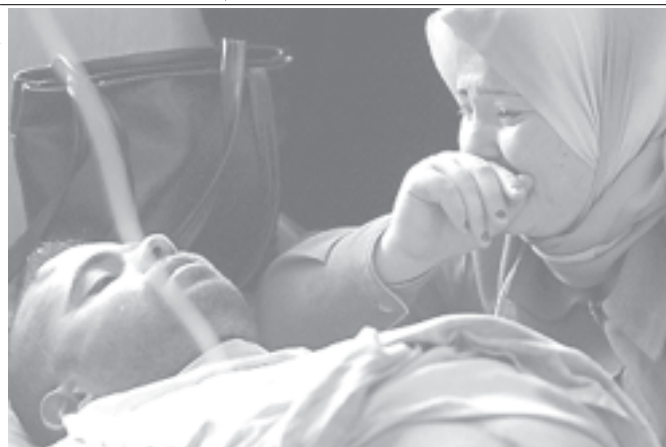
An Iraqi woman weeps next to a seriously injured relative at the al-Kark Hospital in Baghdad on 14 July, 2004, after a car bombing at the main entrance to the heavily-fortified Baghdad compound that houses the Iraqi Government and the US Embassy.