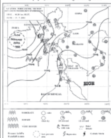
Weather Map of Myanmar and Neighboring Areas

- (0.82 inch) at Yangon Airport, - (0.63 inch) at Kaba-Aye and - (0.55 inch) at central Yangon. Total rainfall since 1-1-2004 was 1443mm (56.81 inches) at Yangon Airport and 1380mm (54.33 inches) at Kaba-Aye and 1375mm (54.13 inches) at central Yangon.