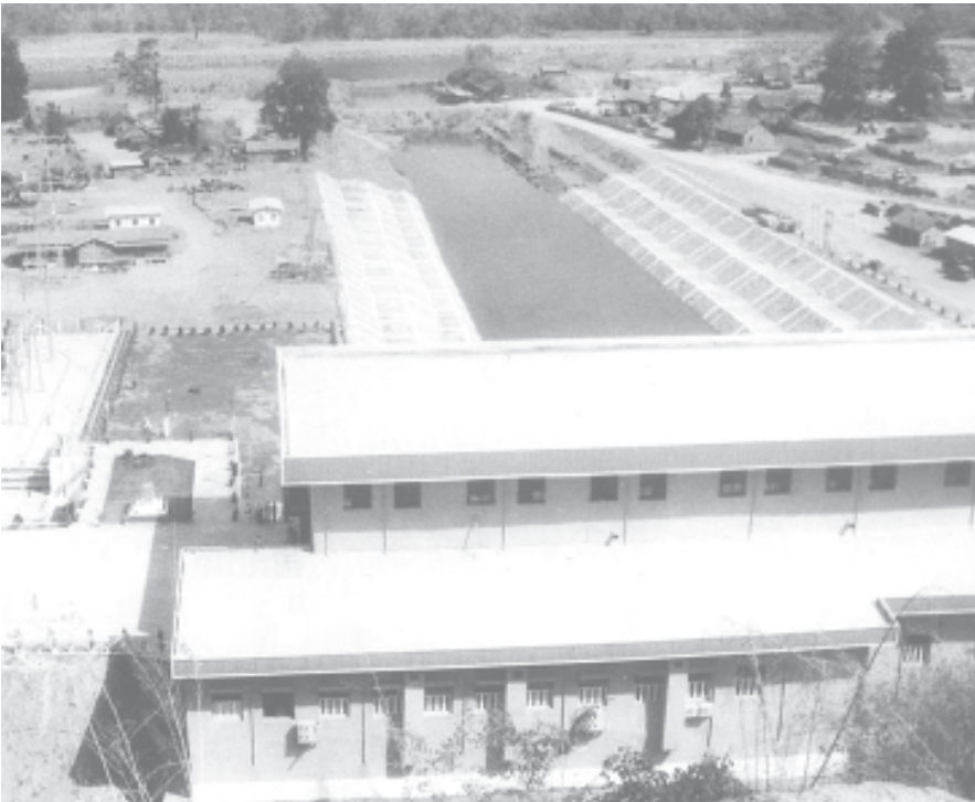
Mone Creek Hydel Power Project in Sedoktara Township, Magway Division.