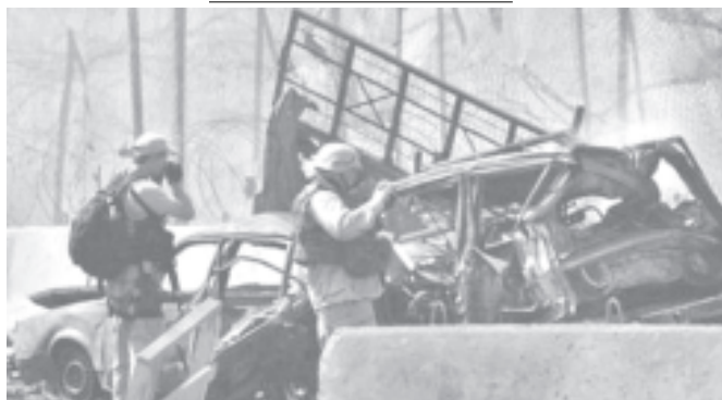
Debris seen after a suspected car bomb blast near the so-called Green Zone in central Baghdad, on 14 July, 2004.