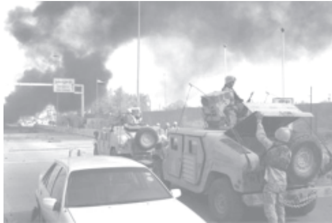
American soldiers arrive at the scene of a car bomb explosion in Baghdad, on 14 July, 2004.