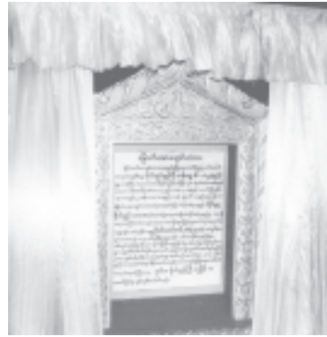
Lt-Gen Ye Myint formally unveils the stone inscription of North Yama Creek Bridge.

The construction of the bridge began on 15 January 2004 and it was completed on 27 June. It was built of the Bailey suspension section and the wooden section. The bridge is 947 feet long and it can withstand 30-ton loads. At the same time, the 7.5 miles long gravel road linking Salingyi and Yinnabin townships to be connected with Pale-Gangaw Road and Monywa-Yagyi-Kalewa Road was completed. Local authorities, local people and