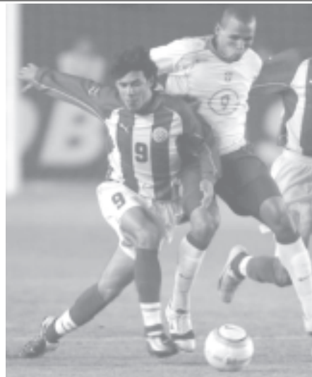
Brazil's Luis Fabiano (R) challenges Paraguay's Fredy Bareiro during the second half of their first round Copa America match in Arequipa, Peru, on 14 July, 2004. Paraguay won the match 2-1.