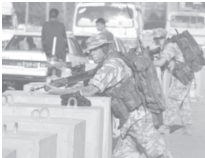
British Army soldiers stand guard in the southern Iraq city of Basra on 14 July, 2004.