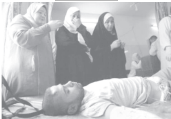
An Iraqi man is treated for injuries received when a suspected car bomb exploded near the so-called Green Zone in central Baghdad, on 14 July, 2004.