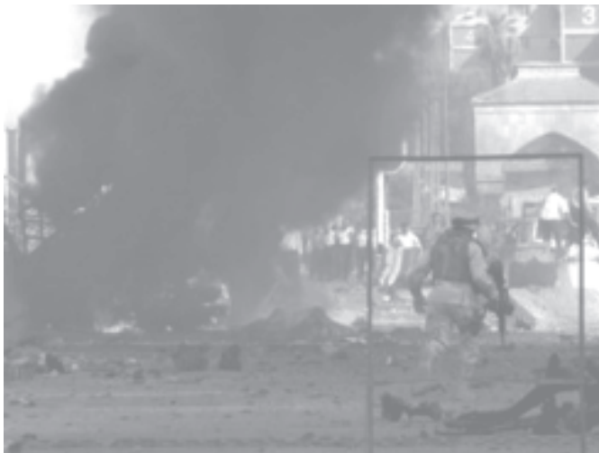
An American soldier races to the scene of a car bomb explosion in Baghdad on 14 July, 2004.

Witness said a convoy of around 10 US military vehicles was moving near the entrance to the city when attackers opened fire with Kalashnikov assault rifles and rocket-propelled grenades.