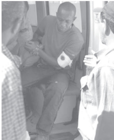
An unidentified injured man arrives at a hospital following a car bomb explosion in Baghdad, Iraq, on Wednesday, 14 July, 2004.

"We're hearing that the C Champion refused to go there because of security and threats against shipping circulating on this site," a broker said, referring to an Iraqi-based web site that allegedly carried a warning from an extreme Islamist group threatening to attack merchant ships that transport supplies for the US Armed Forces. The site has strongly denied it carried such a warning. At the weekend South Korea warned the country's shipping firms of possible attacks following threats by a militant group posted on an Iraqi-based site albasrah.net. — MNA/Reuters