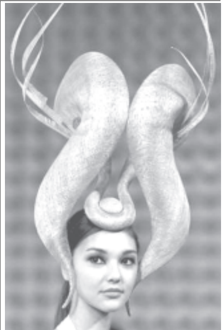
A model presents a creation by Indonesian fashion designer Didi Budiardjo during Hong Kong Fashion Week for Spring/Summer 2005, in Hong Kong on 13 July, 2004.