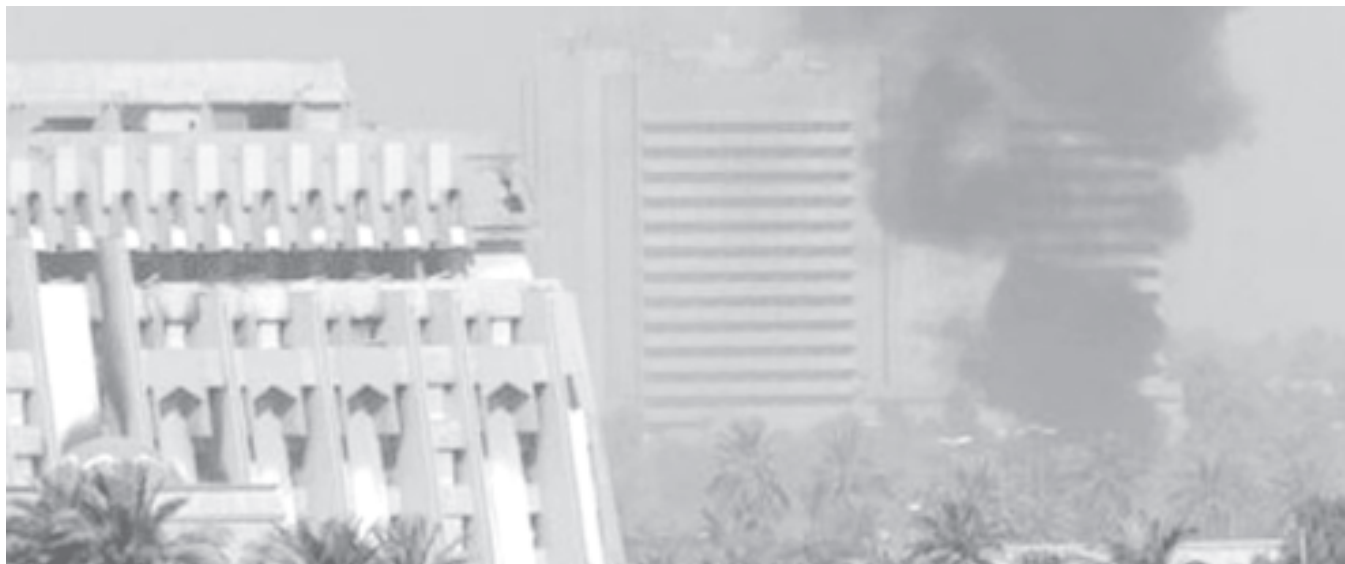
Smoke rises from the site of an explosion at the entrance to the so-called 'Green Zone' in Baghdad, Iraq, on 14 July, 2004.