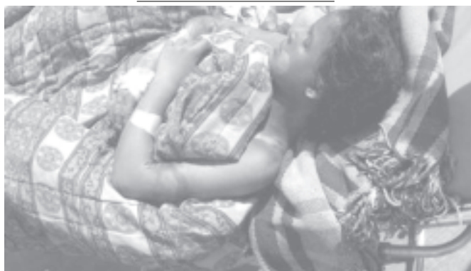
A badly burned girl arrives at a hospital following a car bomb explosion in Baghdad, Iraq, on 14 July, 2004.