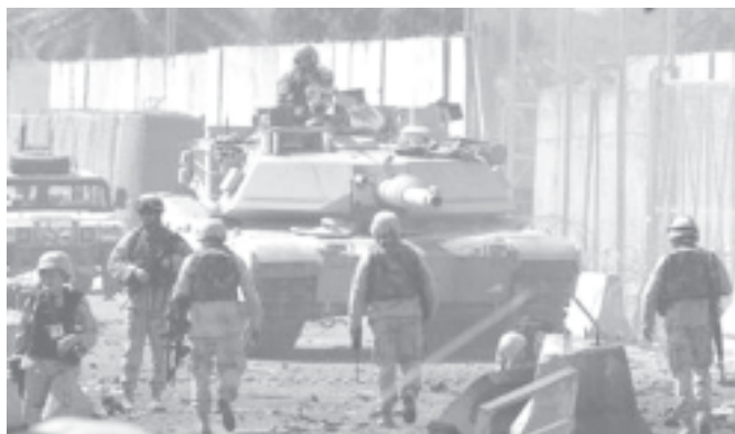
A scene of bomb blast on 14 July, 2004 near the so-called Green Zone in central Baghdad.