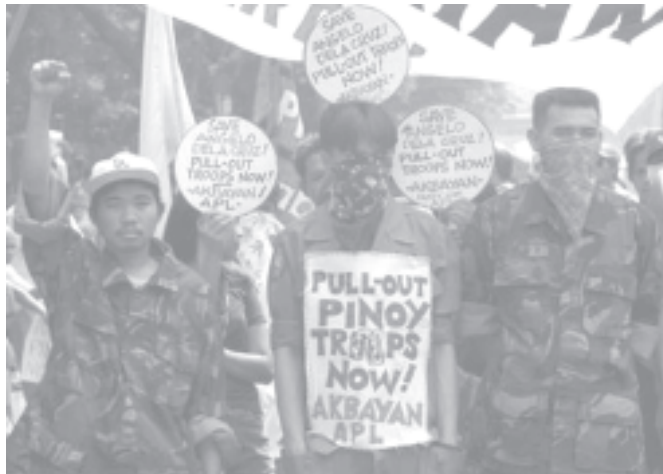
Filipino protesters in military uniforms march towards the Presidential Palace in Manila calling for the withdrawal of Philippine troops from Iraq and protesting against the hostage situation of a Filipino overseas workers held by Iraqi militants, in Manila on 14 July, 2004.