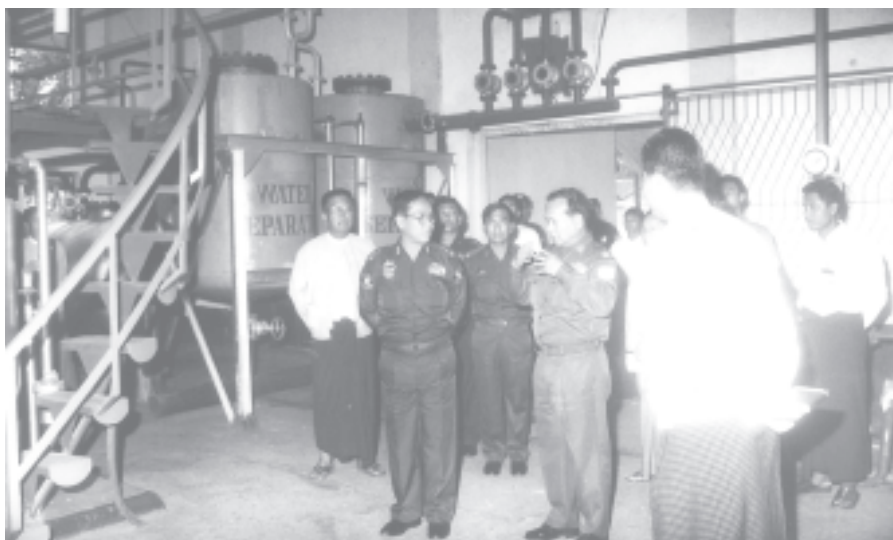
State Peace and Development Council Secretary-1 Lt-Gen Soe Win inspects No 01 Bran Oil Mill in Hline Township.