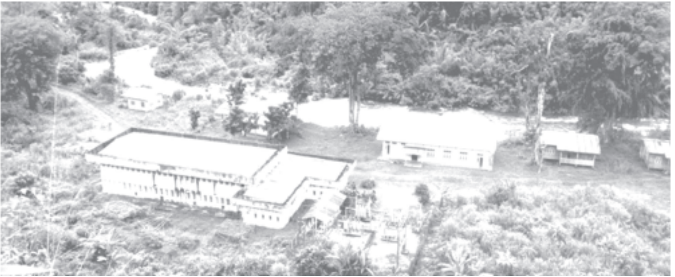
Kyeinkharankha hydro power station built in Myitkyina, Kachin State, is generating 25 kilowatt and supplying electricity to villages in the township.