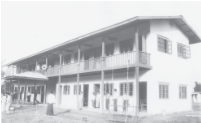
New building of Kyaunggon Village post-primary School in Htantabin Township.