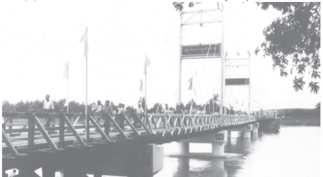
The North Yama Creek Bridge linking Yontaw village of Yinnabin Township and Aungchantha village of Salingyi Township. — MNA