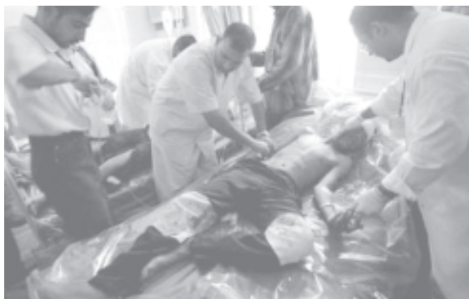
An Iraqi boy is treated for injuries received when a suspected car bomb exploded near the so-called Green Zone in central Baghdad, on 14 July, 2004.