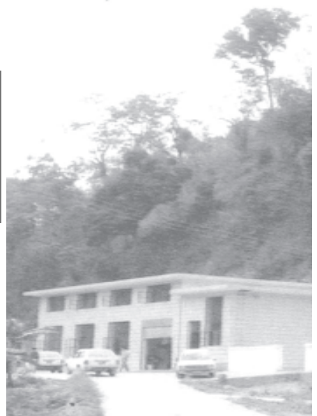
Hydel-power station in Mongla, Shan State (East) for rural electrification.