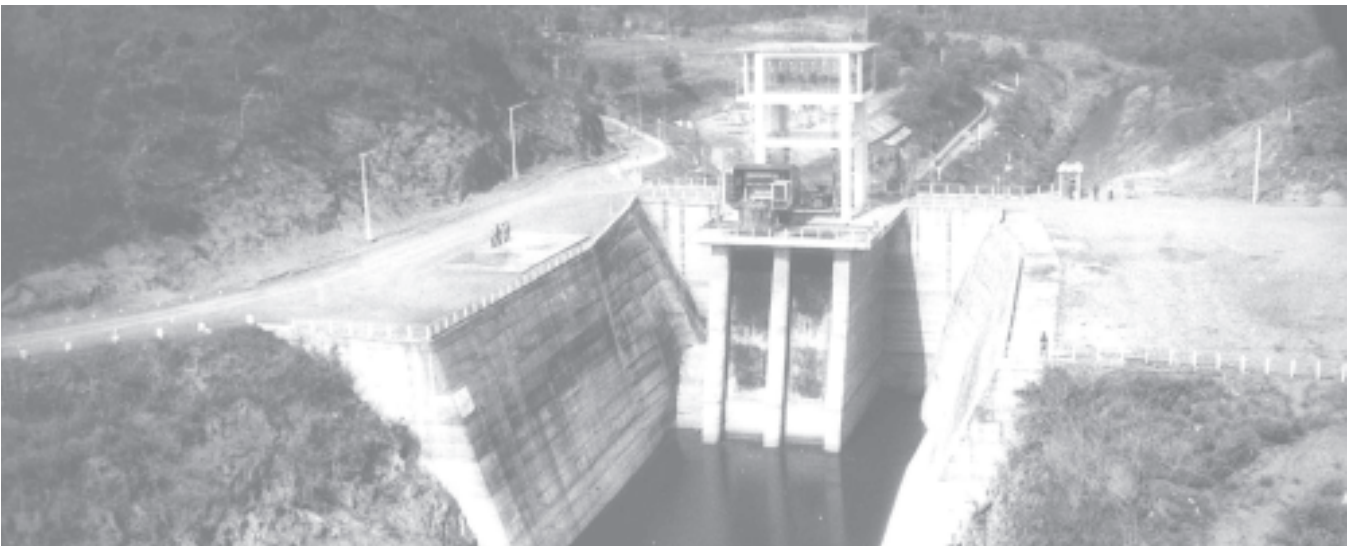
Canal and intake structure of Zawgyi Hydroelectric Power Plant seen in Yaksawk Township, Shan State.