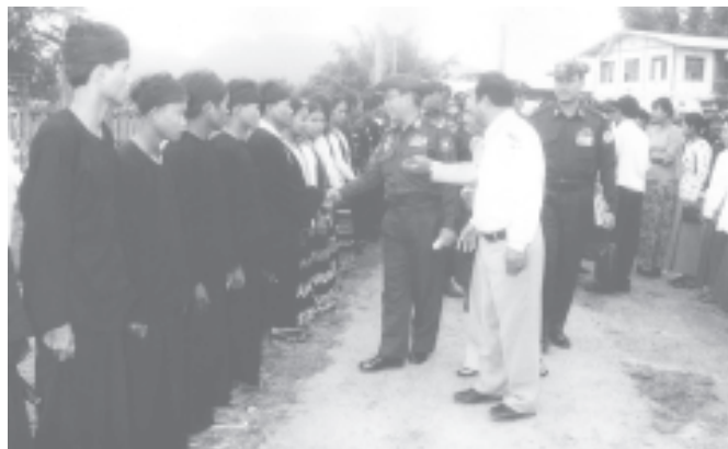
State Peace and Development Council Secretary-1 Lt-Gen Soe Win being welcomed by local people at Wamhaing region in Kehsi Township.