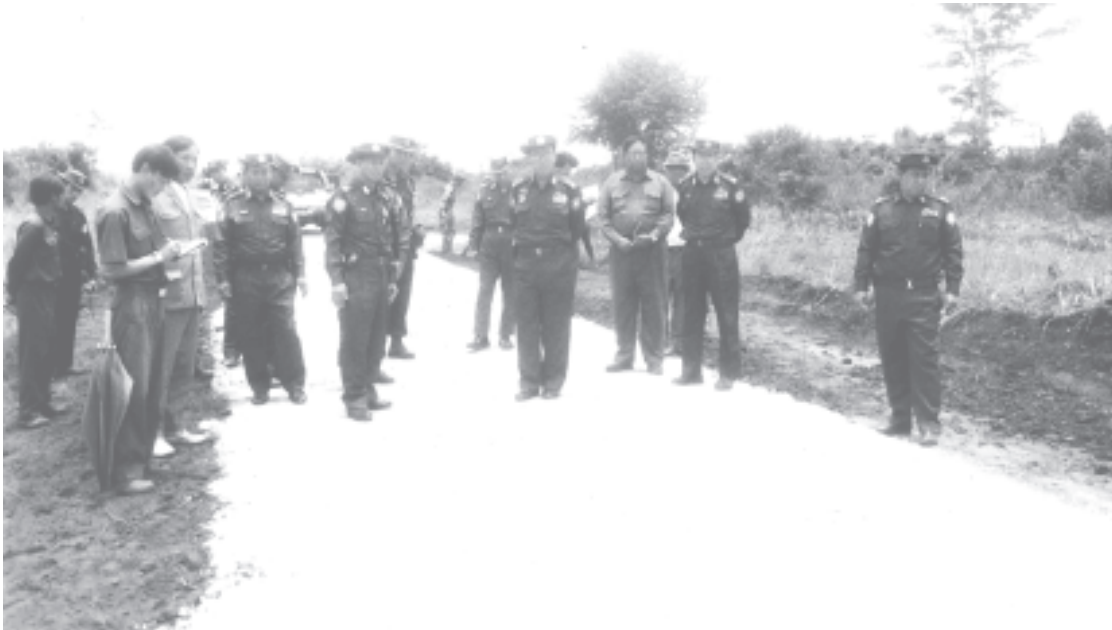
Secretary-1 Lt-Gen Soe Win inspects construction of Kholan-Wamhsim-Mongnaung-Mongshu Road.— MNA

Afterwards, the Secretary-1 and party attended (See page 8)