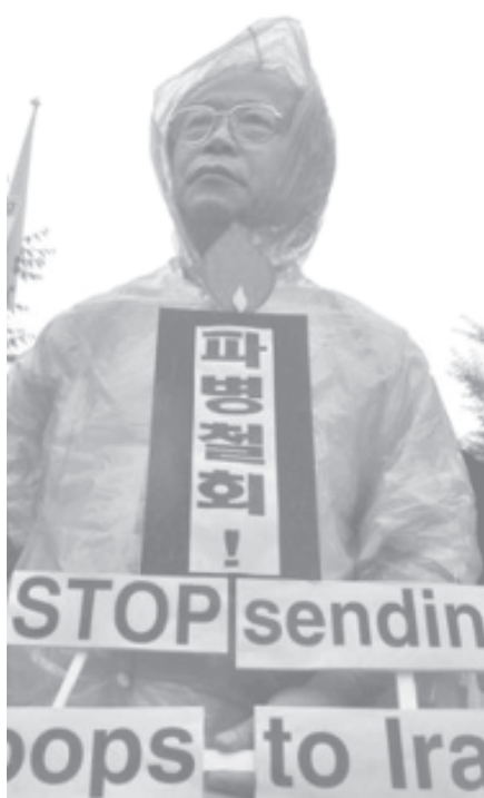
A South Korean protester holds a banner during an anti-war rally near the US Embassy in Seoul, on 13 July, 2004.