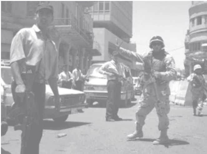
An American soldier and Iraqi police stop traffic as a US military convoy passes through a busy intersection in Baghdad Iraq, on 13 July, 2004.