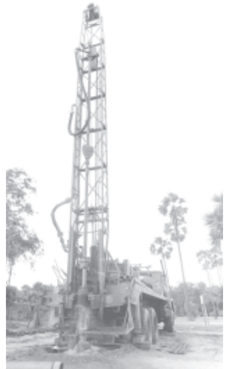
A tube-well sinking truck in action in Pyibin Village, Chauk Township, Magway Division, to supply potable water to rural people.