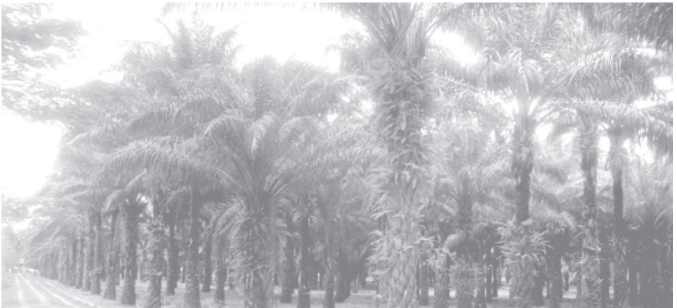
Thriving oil palm plantation in Longlon Township, Taninthayi Division.