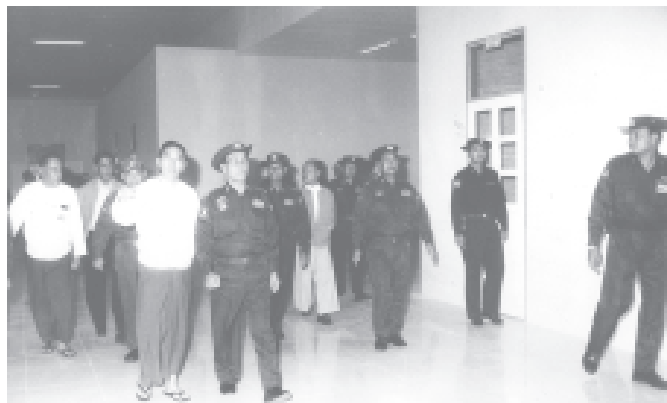
State Peace and Development Council Secretary-1 Lt-Gen Soe Win and party view round the Mongkaing Township People's Hospital.