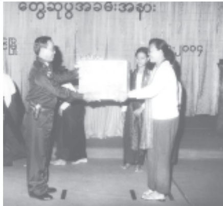
State Peace and Development Council Secretary-1 Lt-Gen Soe Win presents computer and exercise books for Hsihseng BEHS.