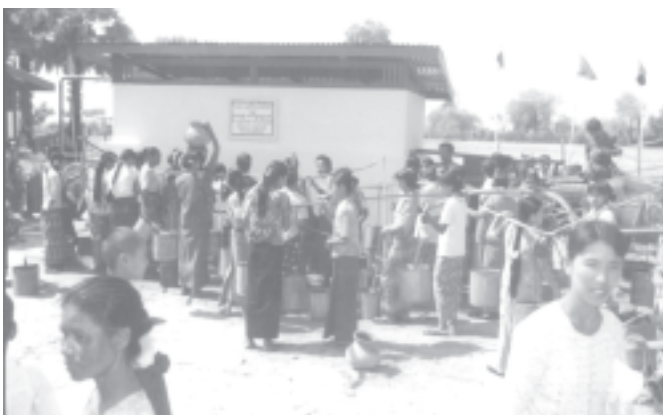
Rural people living in Yone village in Kyaukpadaung Township, Magway Division are fetching potable water from a tube-well.