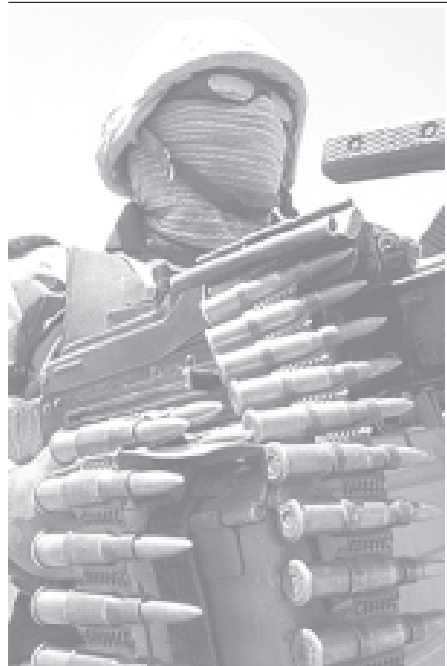
A heavily armed Iraqi national guardsman stands guard at a checkpoint on the highway joining the flashpoint towns of Ramadi and Fallujah to Baghdad in Abu Ghraib on 13 July.