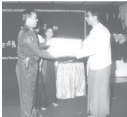
Secretary-1 Lt-Gen Soe Win presents medicines for Kehsi Township People's Hospital.