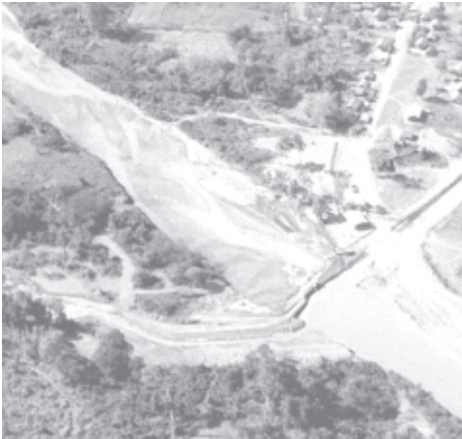
Kandawyan diversion weir built by the State in Waingmaw Township, Kachin State, benefits 12,000 acres of farmland in the region.