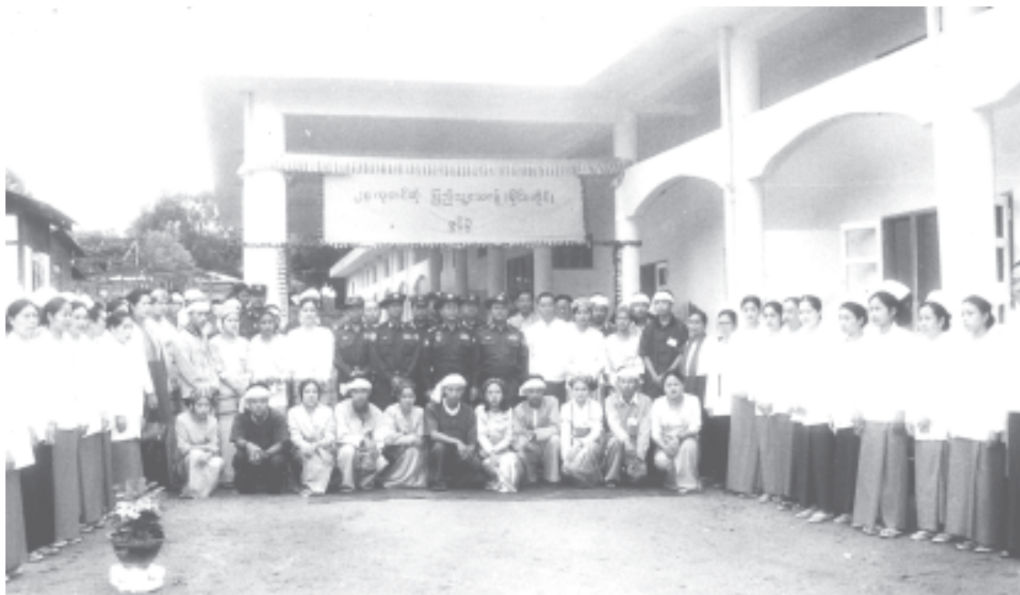
Secretary-1 Lt-Gen Soe Win poses for group photo with health staff and local people in front of Mongkaing Township Hospital. (News page1)—MNA

Next, Minister for Culture Maj-Gen Kyi Aung inspected Bamayathana Hall, Bago Archaeological Museum and the royal audience hall. The minister instructed officials to keep buildings of the palace clean and pleasant and to ensure its durability. — MNA