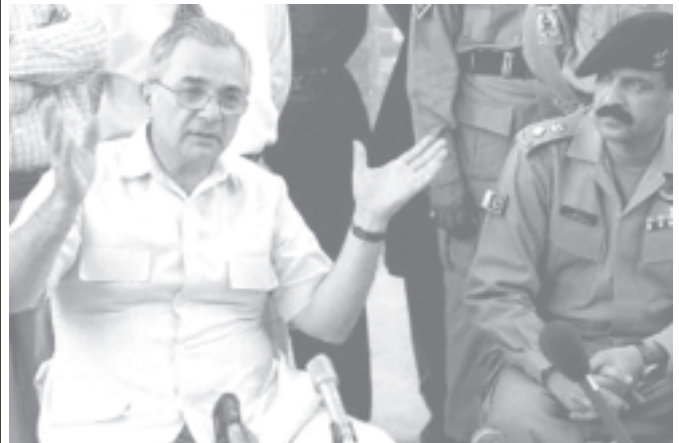
Pakistani High Commissioner Ashraf Jehangir Qazi, who was named as the UN's most senior officer in Iraq, is a skilful negotiator and good communicator who could handle any crisis, a colleague said.