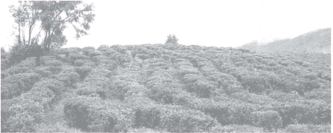
Tea plantation of local national race farmers in Silu region, Shan State (East).