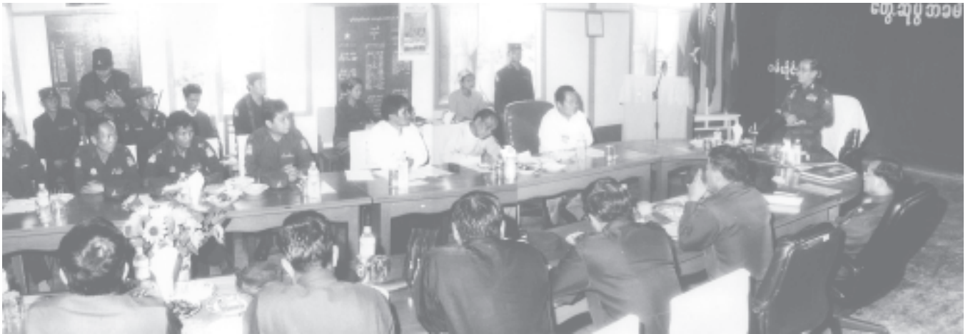
Secretary-1 Lt-Gen Soe Win meets local national race leaders at Sao Hsay Nwam Hall in Wamhaing region.