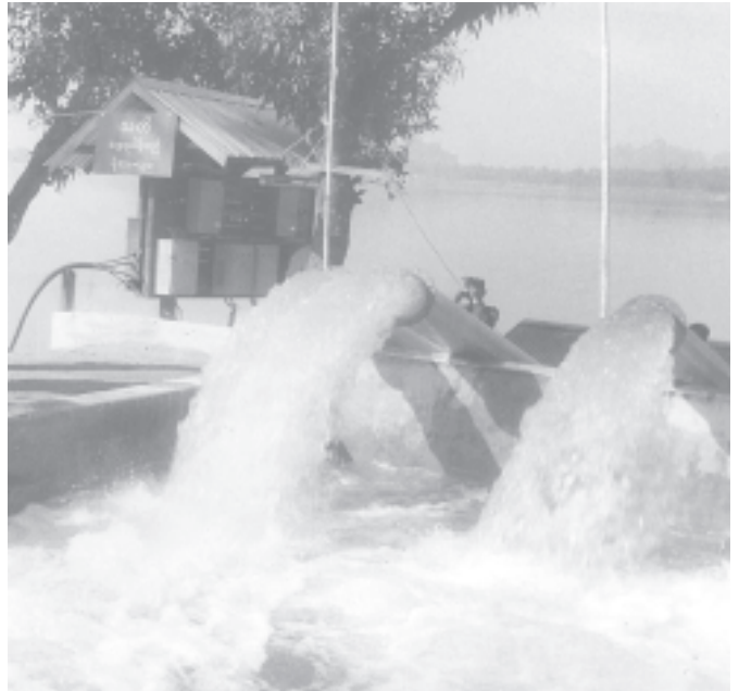
To supply water for agricultural purpose, a river water pumping station was built in Tayokehla Model Village, Hpa-an Township, Kayin State. — MNA