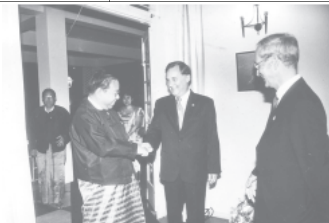
Deputy Minister for Foreign Affairs U Khin Maung Win being welcomed by French Ambassador Jean-Michel Lacombe at the reception to mark National Day of France Wednesday evening.— MNA

Joint-Secretary Sayadaw Agga Maha Pandita Agga Maha Saddhamma Jotikadhaja Mandalay Wizitayon Sayadaw Bhaddanta Viçarindabhivamsa delivered a sermon. Later, the minister, the deputy minister and wellwishers shared merits gained.— MNA