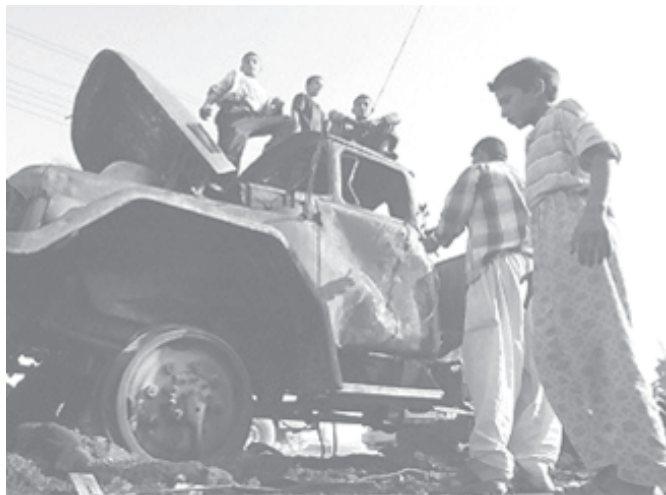
Iraqi children look at a burnt Bulgarian military truck in Karbala. The Bulgarian government confirmed that one of two Bulgarian nationals being held hostage in Iraq has been executed.

Zebari was expected to meet NATO Secretary-General Jaap de Hoop Scheffer on Tuesday, an alliance official said, to discuss how NATO can help the embryonic Iraqi armed forces.