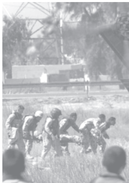
American and Iraqi troops evacuate a soldier from a US Army humvee which was heavily damaged from an apparent roadside attack on the main route to the airport on the outskirts of the Baghdad Iraq on 13 July, 2004. — INTERNET

"Given the improving (market) condition, we hope the sale of Yamaha will be able to reach the 1 million level next year," YKMI vice-President Yoshiteru Takhashi was quoted as saying.— MNA/Xinhua