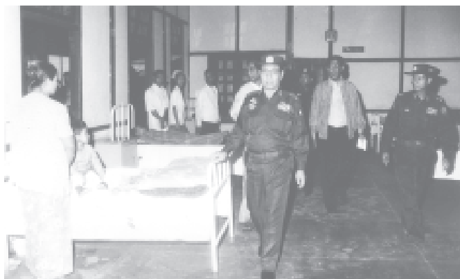
State Peace and Development Council Secretary-1 Lt-Gen Soe Win and party view round the Hsihseng Township People's Hospital.