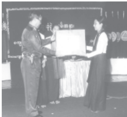
State Peace and Development Council Secretary-1 Lt-Gen Soe Win presents teaching aids and exercise books for Kehsi BEHS.

Next, the minister presented championship shields to Sagaing Division women's team and Shan State (South) men's team.