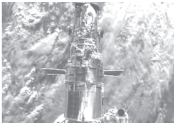
NASA should not rule out sending a shuttle to fix the aging Hubble Space Telescope, an expert panel told the space agency on 13 July, 2004, six months after a planned repair mission was dismissed as too risky. The Hubble is seen in its repair dock in the payload bay of the Space Shuttle Columbia in this 3 March, 2002 file photo.