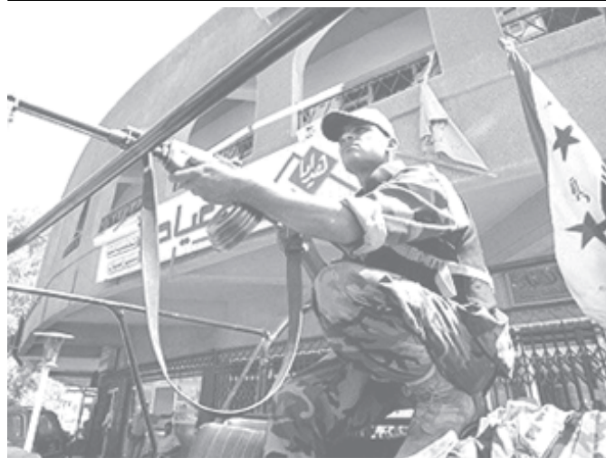
An Iraqi national guardsmen keeps his position while securing a neighbourhood in central Baghdad on 13 July.