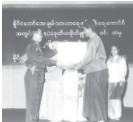
Secretary-1 Lt-Gen Soe Win presents computer and exercise books for Mongkaing BEHS.