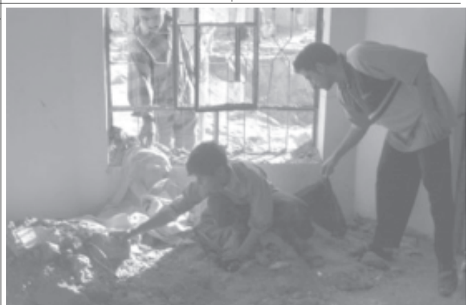
Fallujah residents sift through debris in Fallujah, Iraq, on 1 July, 2004, after the US military launched another airstrike on a suspected hideout of Abu Musab al-Zarqawi. It was the fourth attack this month against suspected guerilla targets in the city.