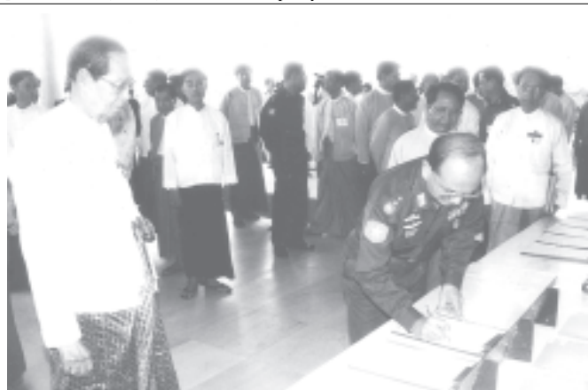
NCC Commission Chairman State Peace and development Council Secretary-2 Lt-Gen Thein Sein signs attendance register at National Convention.