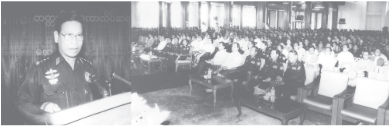
Prime Minister General Khin Nyunt addresses opening ceremony of Special Refresher Course No 5 for Faculty Members of Universities and Colleges.