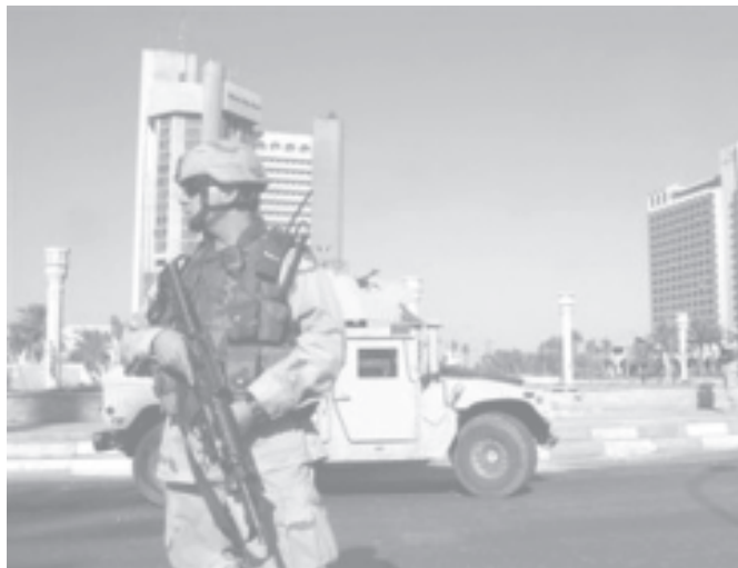
A US Army soldier stands guard in Firdous Square in front of the Sheraton, left, and Palestine hotels in Baghdad, on 2 July, 2004.

US and Iraqi security forces have been on high alert this week, fearing spectacular attacks to coincide with the formal handover of sovereignty to an Iraqi government which took place on Monday, two days earlier than planned. —Internet