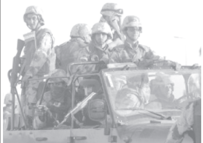
Iraqi National Guard soldiers head out on an evening patrol from Camp Victory near Baghdad, on Thursday, 1 July, 2004.

The latest death brought to at least 633 the number of US troops who have been killed since the start of last year's invasion to oust Saddam Hussein.