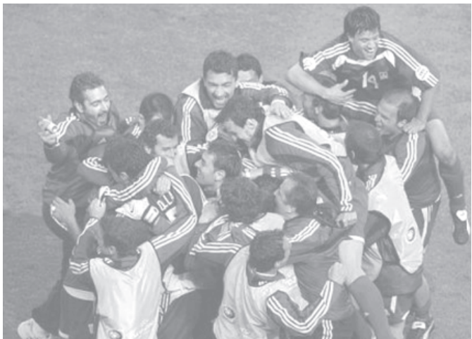
Taianos Dellas of Greece, at 2nd left with back to camera, celebrates with teammates after scoring the silver goal winner during extra time in the Euro 2004 semifinal soccer match between Greece and the Czech Republic at the Dragao Stadium in Porto, Portugal, on Thursday, 1 July, 2004. Greece won the match, 1-0.