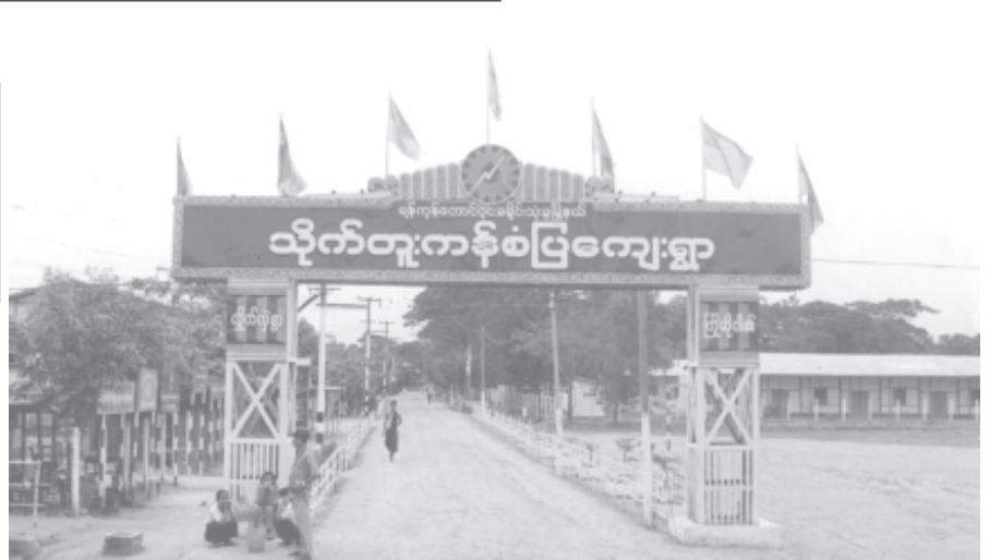
Development undertakings have been carried out in Thaiktugan model village, Thogwa Township, Yangon Division.