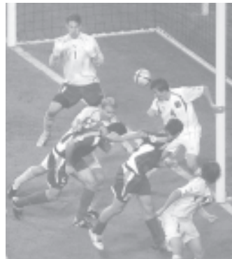
Taianos Dellas, bottom left, of Greece, scores the silver goal-winner during extra time in the Euro 2004 semifinal soccer match between Greece and the Czech Republic at the Dragao Stadium in Porto, Portugal, on Thursday, 1 July, 2004. Greece won the match, 1-0.

The Czechs, buoyed by four successive wins, made the brighter start and went close to opening the scoring after only three minutes when a powerful volley by midfielder Tomas Rosicky rattled the bar after Koller headed on a free kick.