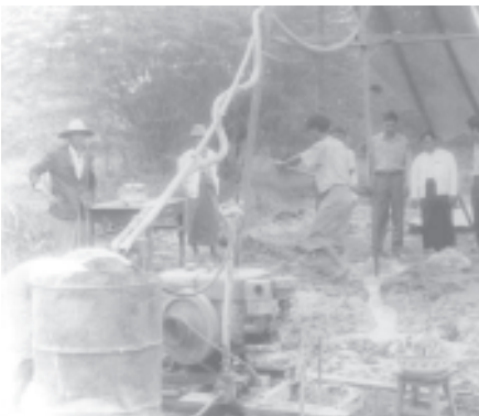
Artesian well sunk in Kyigan village, KhinU Township, Sagaing Division.