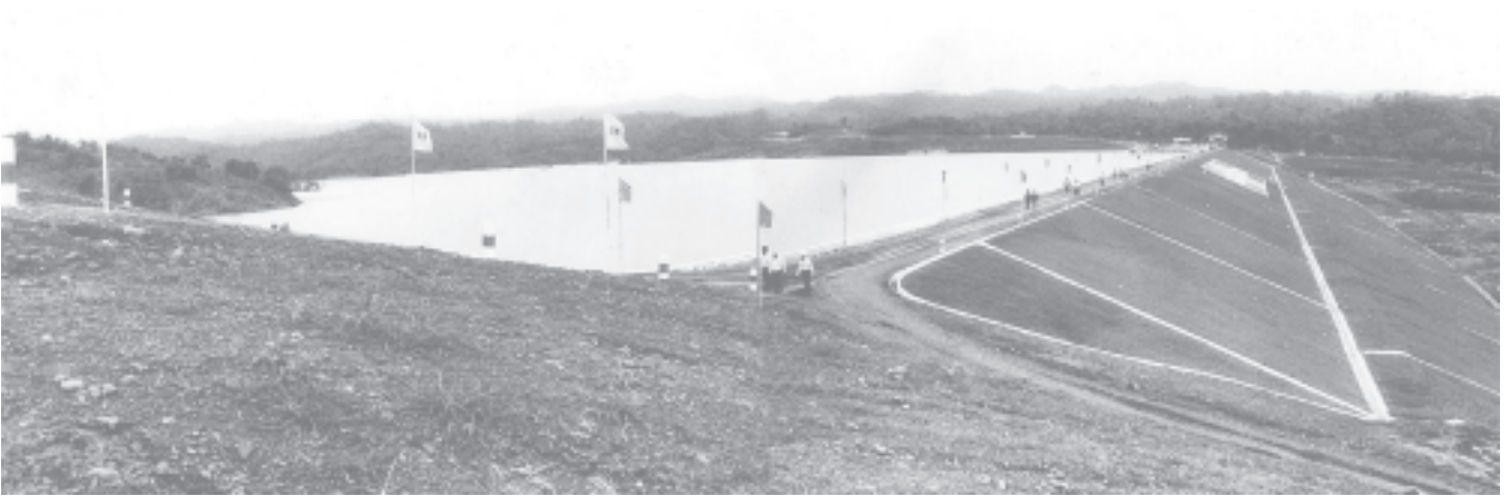
Khawa Dam in Padaung Township, Pyay District, Bago Division, benefits 2,000 acres of land.