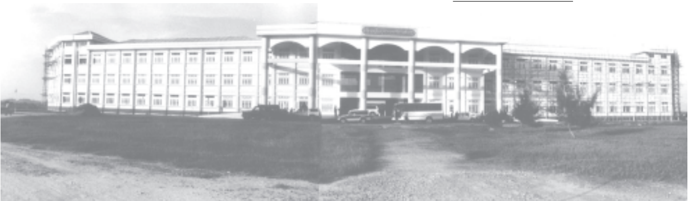
Progress in construction of Sittway Government Technological College in Sittway, Rakhine State.