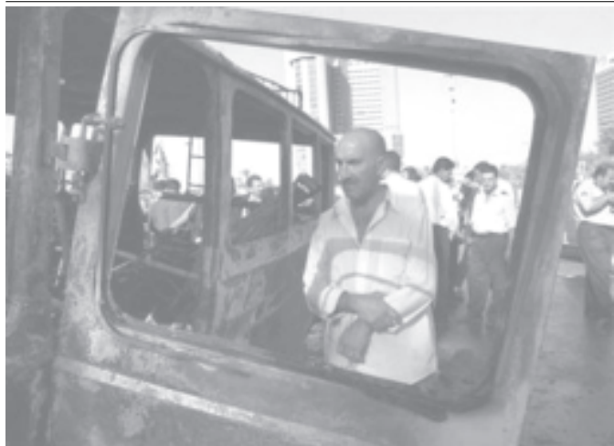
A local resident inspects a burnt-out minibus with a multiple rocket launcher inside, in Firdous Square next to the Sheraton Hotel in Baghdad, Iraq, on Friday, 2 July, 2004.