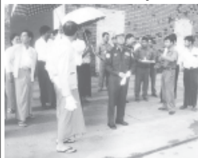
Minister for Construction Maj-Gen Saw Tun inspects unloading of steel frames at Sule wharf. — MNA

YANGON, 1 July—Minister for Construction Maj-Gen Saw Tun, together with Deputy Minister Brig-Gen Myint Thein, Managing Director of Public Works U Nay Soe Naing and officials, inspected unloading of steel frames and related materials from MV Liang Shan at Sule Wharf No 6 this afternoon. The construction materials that arrived under the arrangements of Myanmar Five Star Line are for Ayeyawady Bridge (Yadanabon) Project being built on Ayeyawady River, Patheingyi Bridge (Ngawun) Project on Ngawun River, and Twantay Bridge Project on Twantay Canal. The minister gave instructions to engineers in charge of Public Works on secure and smooth transport for ensuring arrival of the materials at the respective projects as soon as possible. — MNA