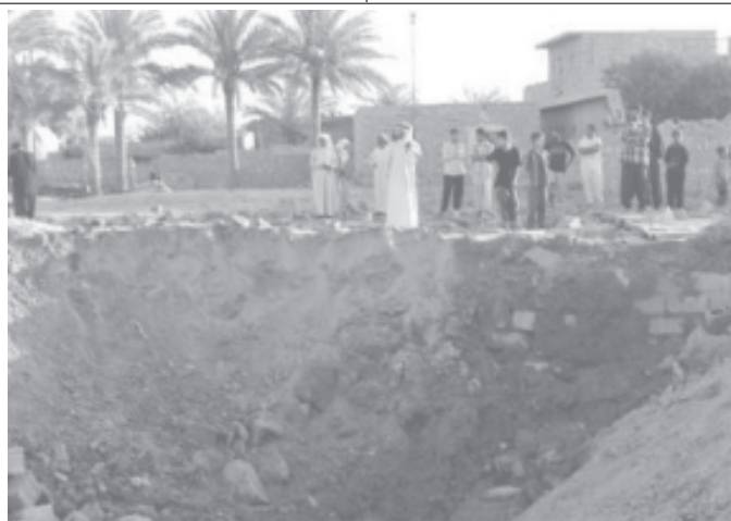
Iraqis survey a large crater caused by a US airstrike in the restive town of Fallujah on 1 July, 2004. At least four people were killed when US forces attacked and destroyed what they said was a 'safehouse' belonging to the Jordanian militant Washington views as its top guerilla target in Iraq, Abu Musab al-Zarqawi.

"The strike left a huge hole where the building was," the resident said, declining to be named.