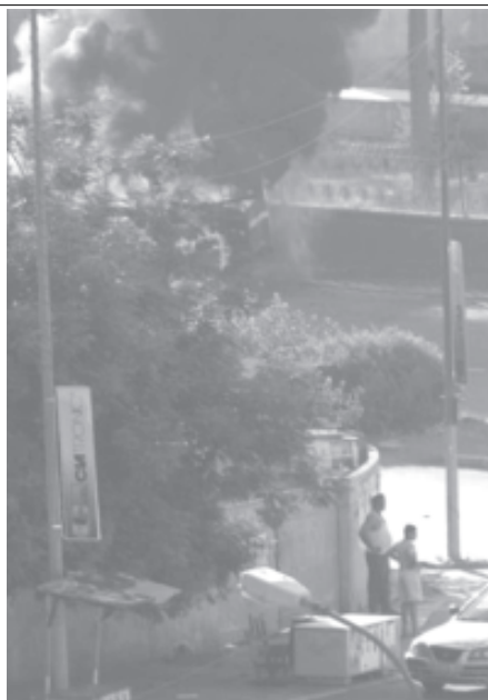
A vehicle burns in Firdous Square, Baghdad, on 2 July, 2004 after an explosion.