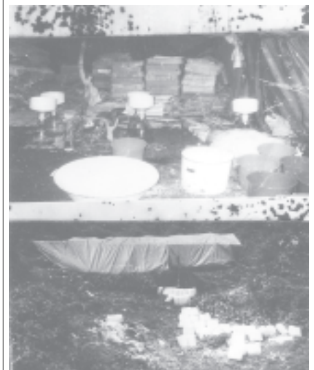
The opium refineries and paraphernalia seized in Muse Township.