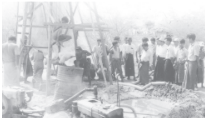
A tubewell donated by Mandalay Division Peace and Development Council and Mandalay Division Maternal and Child Welfare Association is sunk in Myingyan Township.