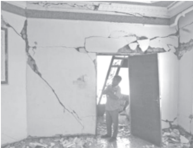
An Iraqi boy surveys the damage of his house after a US airstrike in the restive town of Fallujah, western Iraq, on 1 July, 2004.

The ministers reaffirmed the importance of the Treaty of Amity and Cooperation in East Asia. They said this treaty is the key code of conduct governing relations between states and diplomatic instruments for the promotion of peace and stability in the region. They also reiterated commitment to enhance cooperation with nations outside the ASEAN region in the strengthening of international peace, security and stability. — MNA/Xinhua