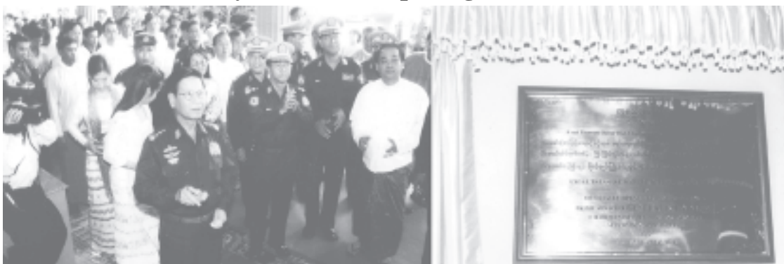
Prime Minister General Khin Nyunt formally unveils bronze plaque of Excel Treasure Tower.

Also present were Chairman of Yangon Division Peace and Development Council Commander of Yangon Command Maj-Gen Myint Swe, ministers, the Yangon mayor, deputy ministers, officials of the State Peace and Development Council Office, heads of department, local authorities, the chairman and officials of Super Technology