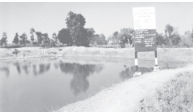
With the aim of supplying water to rural people and greening the environs Wetchokekon Lake was built in Wetchokekon village, Kyaukpadaung Township, Mandalay Division.