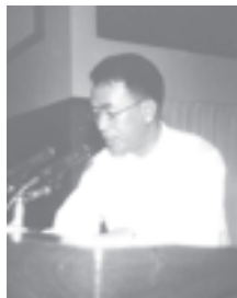
U Kyaw Hsan of Magway Division reads the proposal at Plenary Session of National Convention.