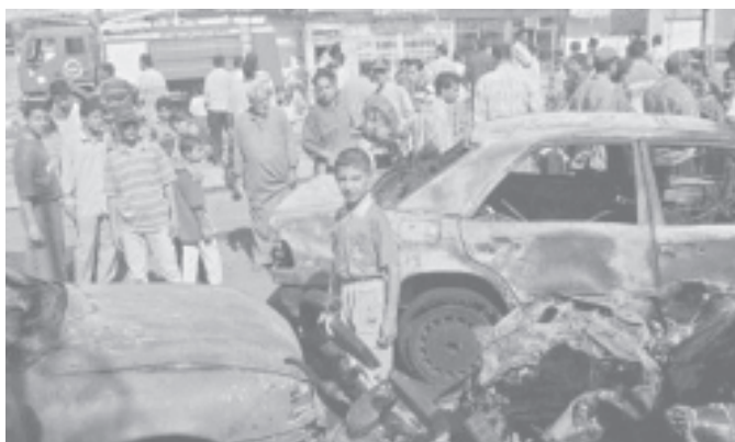
Iraqis check the site of a car bomb attack which took place in Hilla, Iraq, on 27 June, 2004.