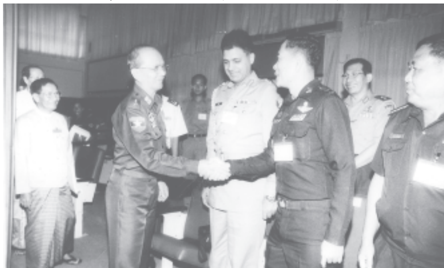
Chairman of NCC Commission Secretary-2 Lt-Gen Thein Sein greets foreign military attachés who are to observe the National Convention proceedings.