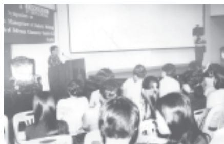
The Symposium on management of diabetes in progress.