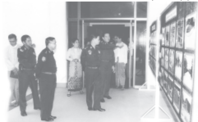
Prime Minister General Khin Nyunt and party view round documentary photos displayed at the co-ordination meeting.

integrated parts and in these 14 states and divisions over a hundred ethnic peoples have lived together in close kinship across the country. It is thus necessary to make arrangements for the equal and rigorous development of all these states, divisions and regions. For only then will the Union stand firm and endure forever in all its strength and prosperity.