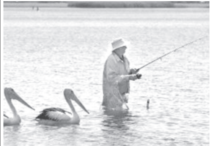
Desalination of sea water and low quality ground water is now a realistic part solution to Australia's long-term water crisis caused by changing weather patterns, scientists say. Here a fisherman on a lake north of Sydney.