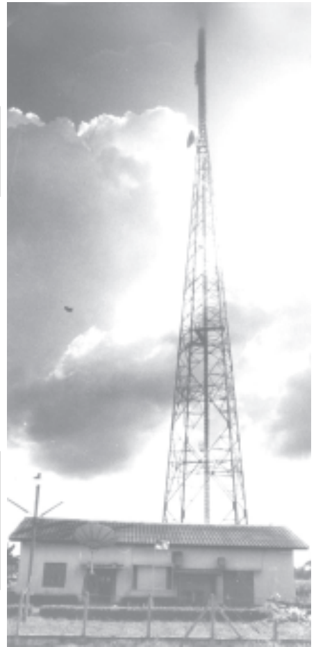
TV retransmission station in Kyaunggon, Ayeyawady Division helps raise the knowledge of local people.