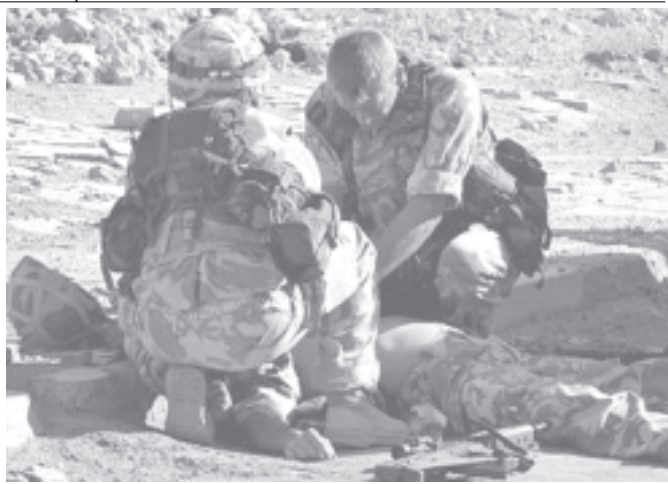
British soldiers try to save the life of a fellow soldier following a roadside explosion in the southern city of Basra, Iraq, on 28 June 2004. The soldier died of his wounds and two other troops were injured.