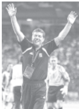
Greek coach Otto Rehagel, shown here on 25 June after his team beat France, said he will not take over as German national coach.