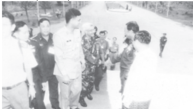
Vice-Chief of Military Intelligence Maj-Gen Kyaw Win welcomes foreign military attaches to the National Convention. — MNA

The National Convention Convening Commission hosted breakfast to the military attaches at the Anawrahta Hall of the camp. They went round the camp in a motorcade. Afterwards, they left the camp. — MNA