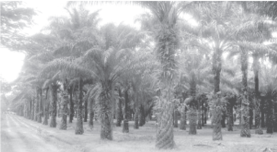
Thriving oil palm plantation in Longlon Township, Taninthayi Division.