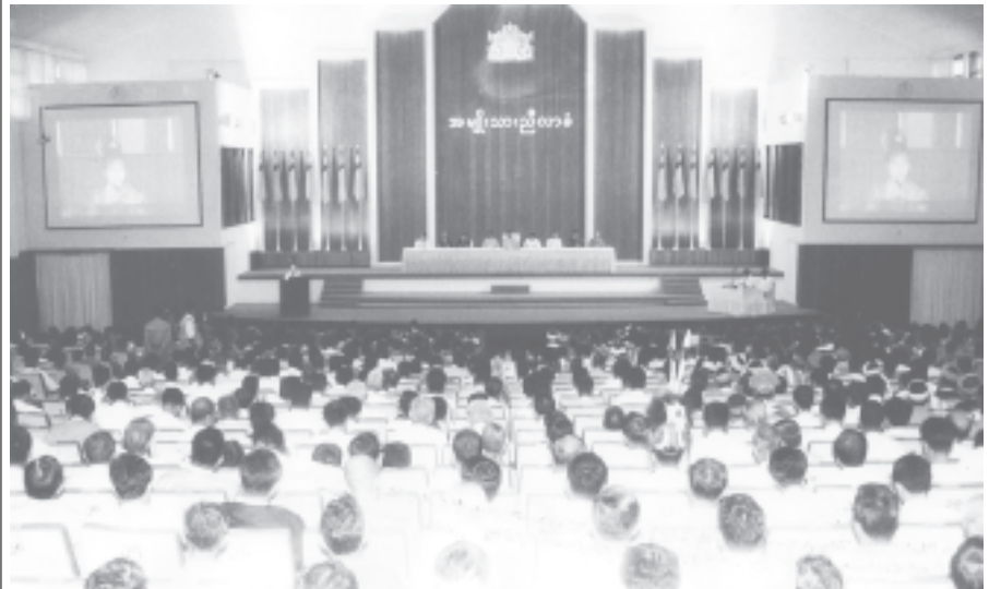
The Plenary Session of National Convention in progress. (News on page 16)

After the ceremony, Minister Brig-Gen Pyi Sone and party, and guests viewed hard wood for