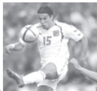
Czech Republic's Milan Baros