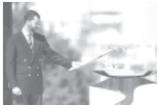
Spain's Prince Felipe lights a cauldron with a torch during a lighting ceremony for a symbolic Olympic flame at Madrid's Puerta de Alcalá on Sunday 27 June, 2004. The games are scheduled to take place in Athens, Greece, August 2004.

MADRID, 28 June— Spain's Crown Prince Felipe received the Olympic flame in Madrid to the cheers of thousands of Spaniards on Sunday as the capital marked its bid to host the 2012 Games.