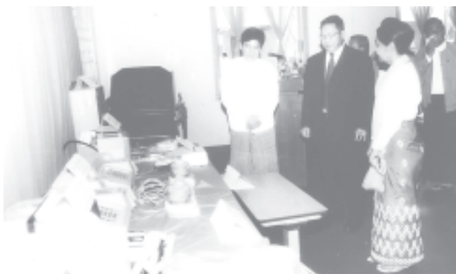
Minister Dr Kyaw Myint and guests view round the hospital equipment.