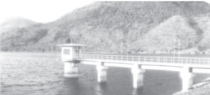
Loinampha Dam in Dimawhso Township, Kayah State benefits local farmers.