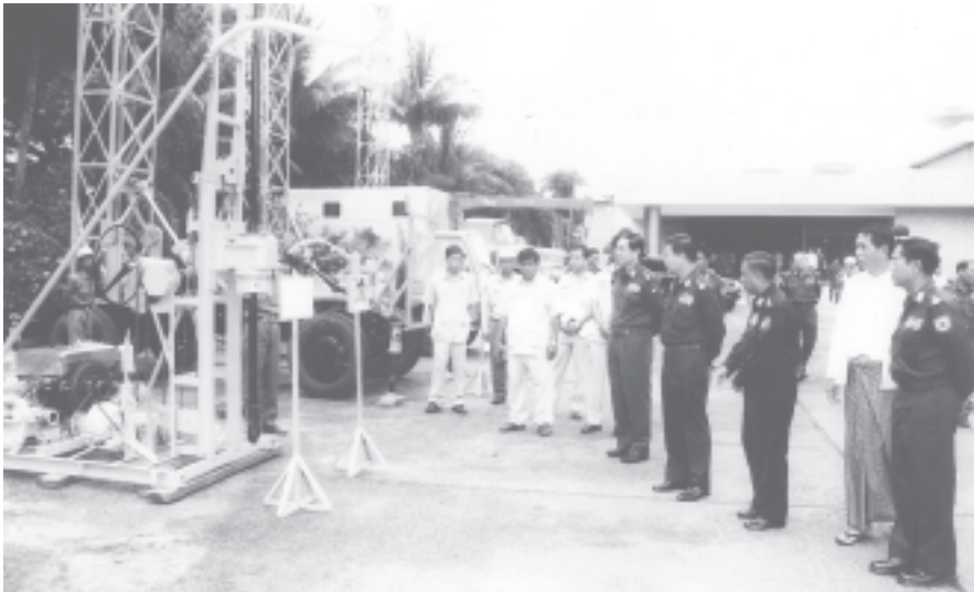
Prime Minister General Khin Nyunt inspects tube-well drilling machines, mobile workshop and machinery which were innovated by Development Affairs Department.