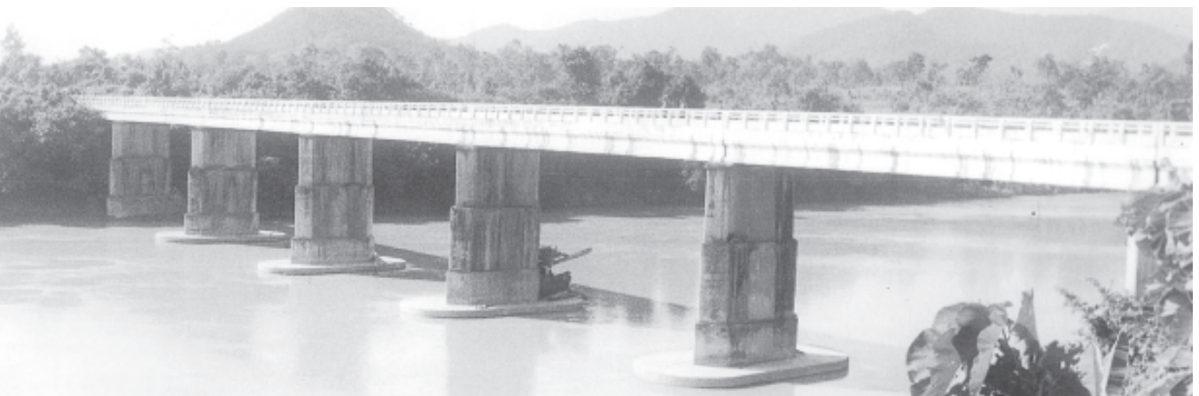
With the length of 595 feet and built at a cost of 145 million kyat, Kanbani bridge across Manipur river in Kalay Township, Sagaing Division, contributes much towards economic development of Chin State and Sagaing Division.