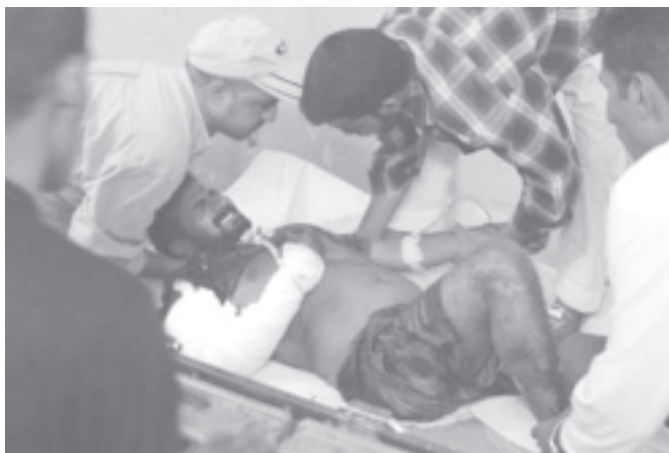
A wounded Iraqi man grimaces as he is moved by hospital staff, after two mortars exploded in central Baghdad on 27 June, 2004.