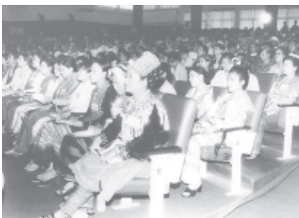
Delegates attend the Plenary Session of the National Convention at Nyaungnapin Camp in Hmawby Township, Yangon Division. — MNA