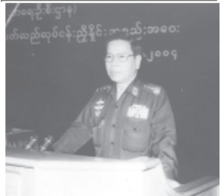
Prime Minister General Khin Nyunt addresses the Annual Coordination Meeting of Development Affairs Committees under the Development Affairs Department.