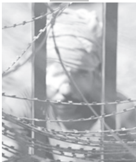
An Iraqi detainee awaits medical attention from medics inside the Abu Ghraib prison on the outskirts of Baghdad, Iraq, on 24 June, 2004.