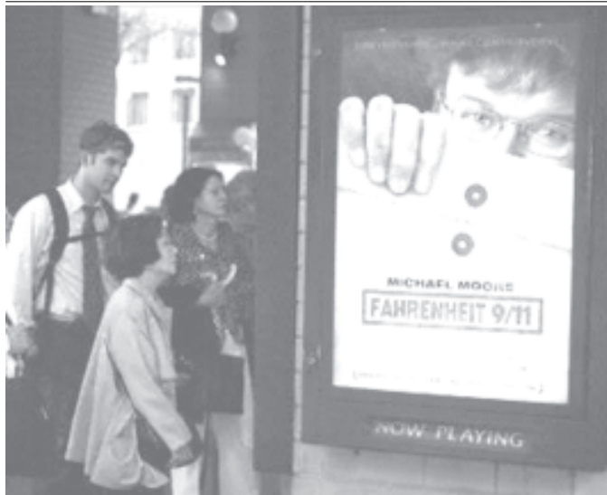
People line up to see director Michael Moore's new film 'Fahrenheit 9/11' in New York. Crowds in Washington flocked to the opening the film, some to get fired up about ousting President George W Bush in the November 2 election, others to see what the controversy is all about.