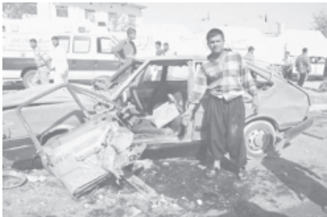
An Iraqi man stands close to a pool of blood at the scene of one of the five car bombs that exploded in Mosul, 370 kms north of Baghdad, on 24 June, 2004.