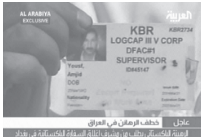
A TV grab taken from Al-Arabiya shows the ID of a Pakistani hostage in Iraq. An armed group holding the Pakistani has threatened to behead the captive unless prisoners are released in Iraq.