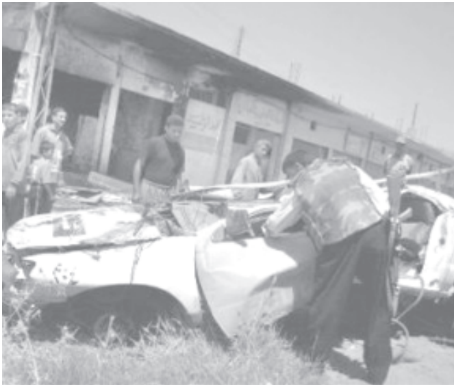
An Iraqi policeman inspects a destroyed police car in Mosul, Iraq, on 25 June 2004, a day after a car bomb destroyed the police station there.