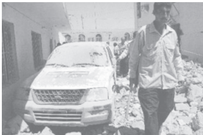
An Iraqi man walks through the courtyard of a destroyed building in Ramadi, Iraq, after a militant attack on 24 June, 2004.