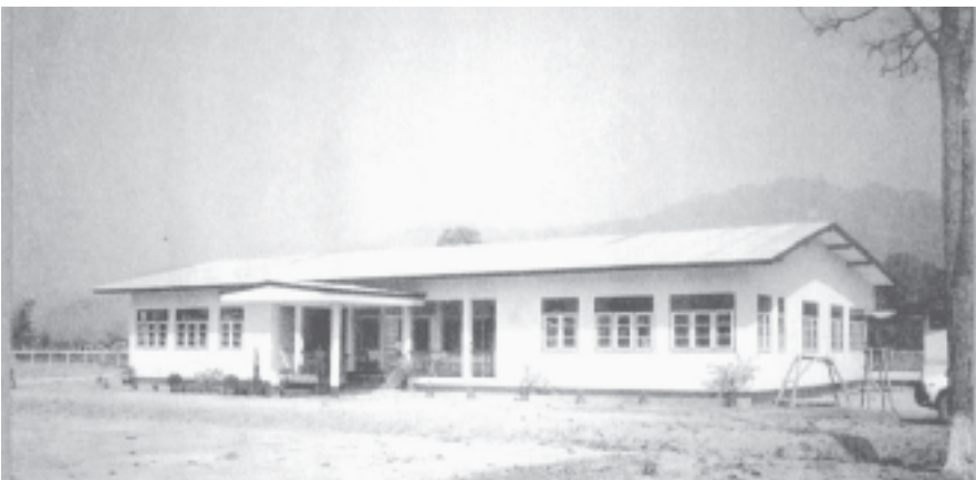
Wanpon People's Hospital in Shan State (East) is providing health care services to local people.