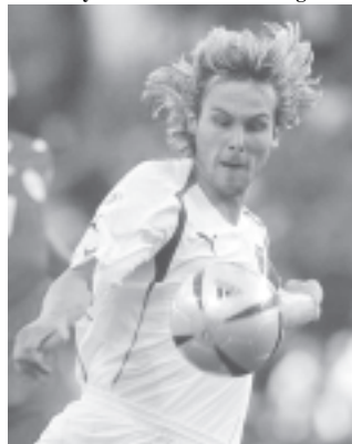
Czech captain Pavel Nedved