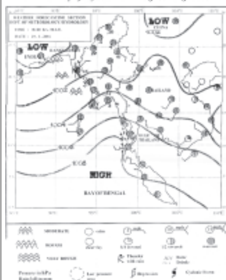
Weather Map of Myanmar and Neighboring Areas

- 0.08 inch at Yangon Airport, - 0.12 inch at Kaba-Aye and - 0.12 inch at central Yangon. Total rainfall since 1-1-2004 was 48.74 inches at Yangon Airport and 45.00 inches at Kaba-Aye and 46.85 inches at central Yangon.