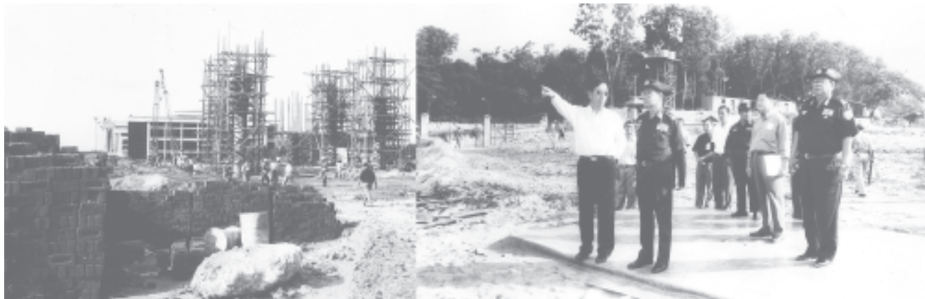
Prime Minister General Khin Nyunt inspects tasks for extension of Yangon International Airport.