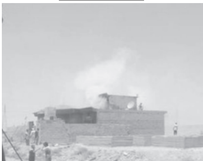
A house was burnt during clashes between US forces and guerillas, in Falluja, on 24 June, 2004.