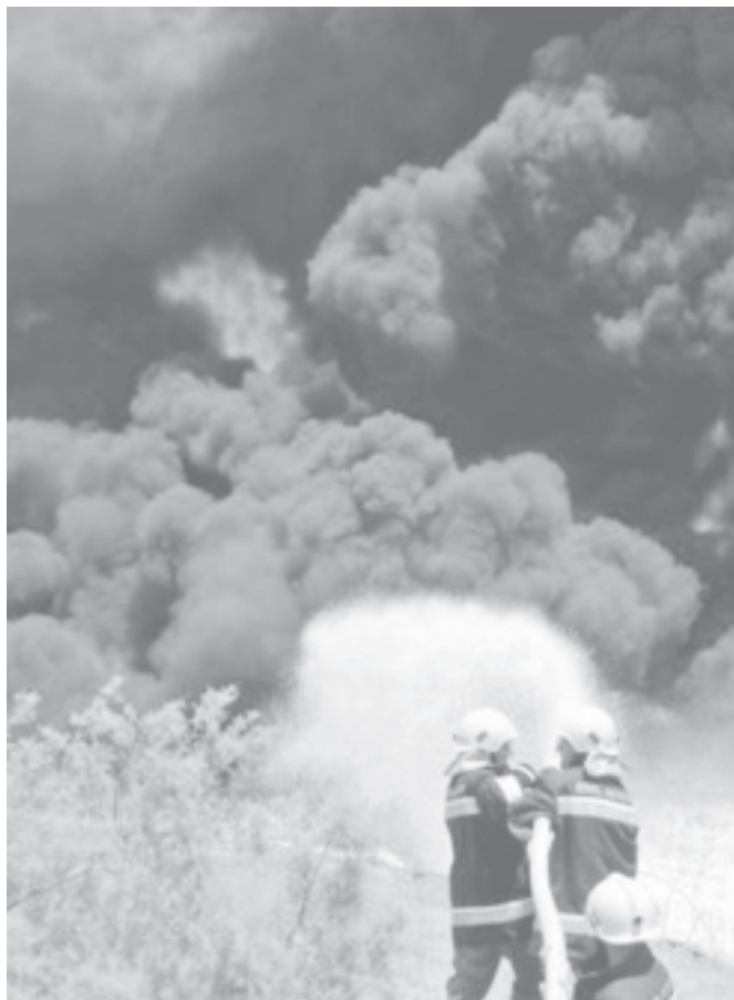
Iraqi fire fighters try to control a blazing oil slick near the town of Boub al-Sham, to the northeast of the Iraqi capital Baghdad, on 27 June, 2004.