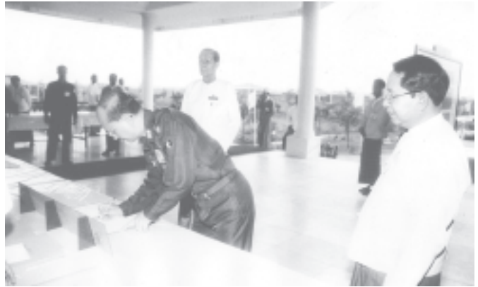
National Convention Convening Commission Chairman State Peace and Development Council Secretary-2 Lt-Gen Thein Sein signs the attendance register.