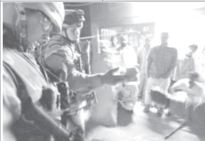
Iraqis wait while US Army soldiers check their identification cards during a raid in Abu Ghraib, on the outskirts of Baghdad, Iraq on 26 June, 2004. The US Army expects an increase in guerilla attacks ahead of the handover of Iraqi sovereignty on 30 June.